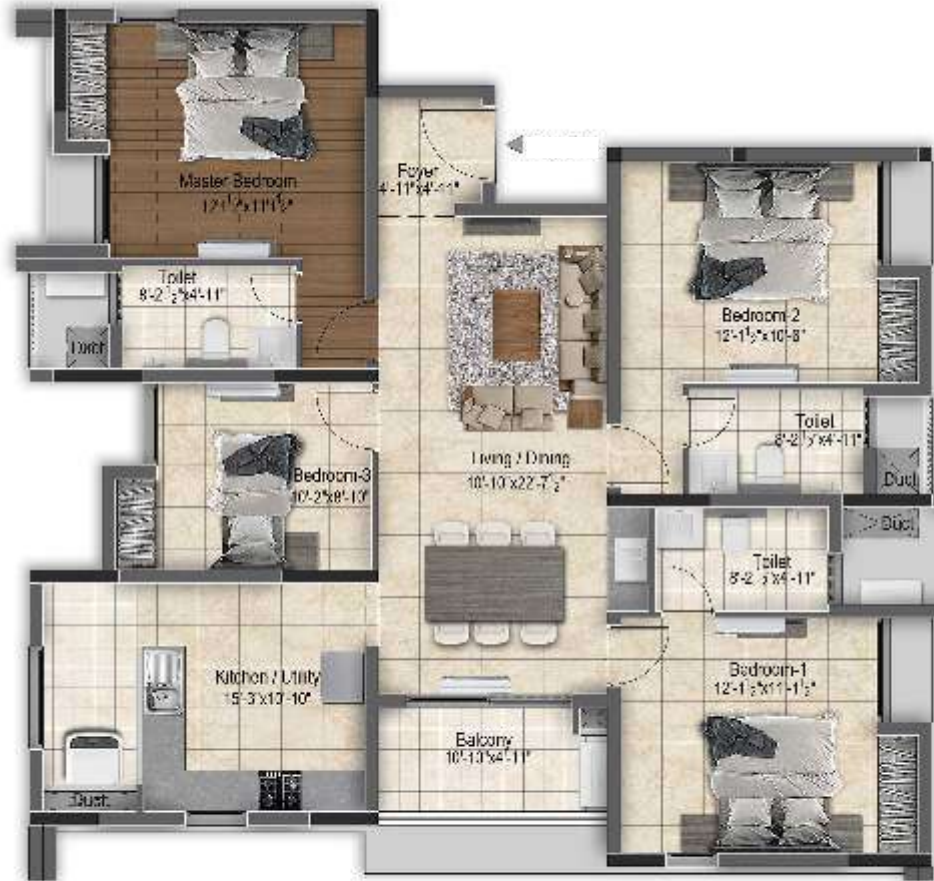
Key -> a