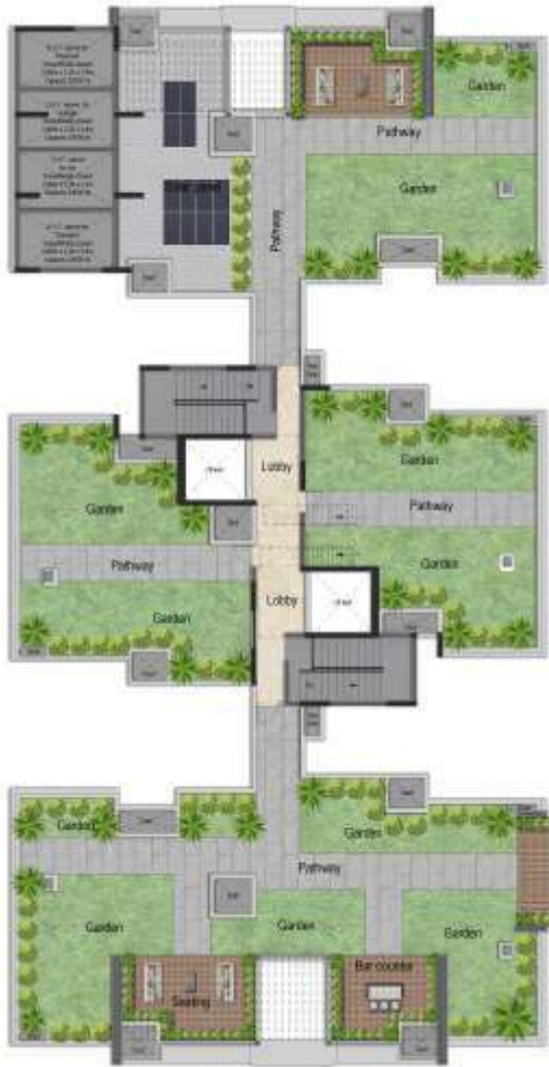
BLOCK - B1