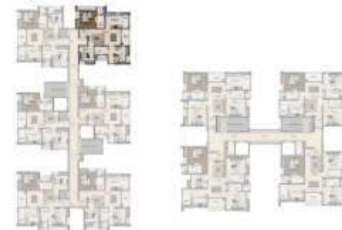
UNIT PLAN : 3BHK+2T - East Facing (Block - B1)

Saleable Area - 1391 Sq.ft. | Carpet Area - 841 Sq.ft. | UDS Area : 430 Sq.ft. | Unit Nos. : B1 404 - B1 1304