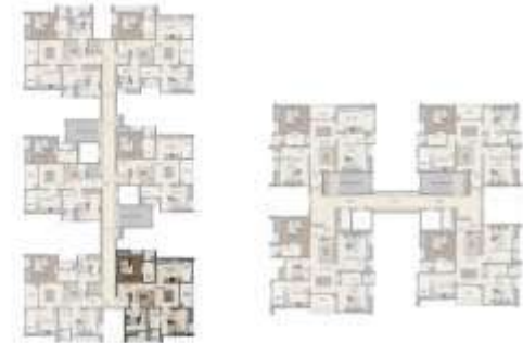
UNIT PLAN : 3BHK+2T - East Facing (Block - B1)

Saleable Area - 1382 Sq.ft. | Carpet Area - 840 Sq.ft. | UDS Area : 428 Sq.ft. | Unit Nos. : B1 406 - B1 1306