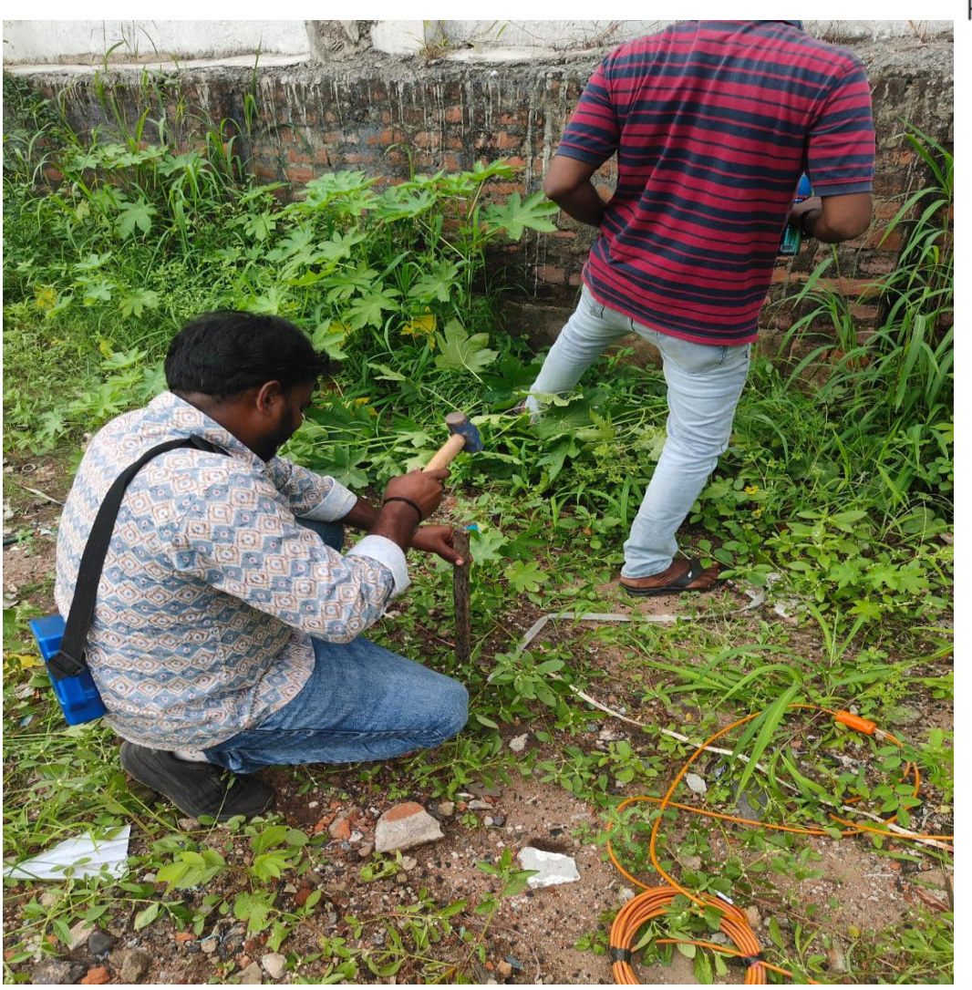
Divining work for borewell completed