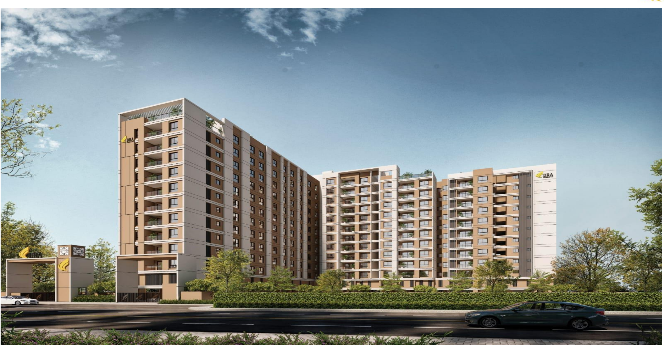
DRA ASTRA Construction update photos – December 2024