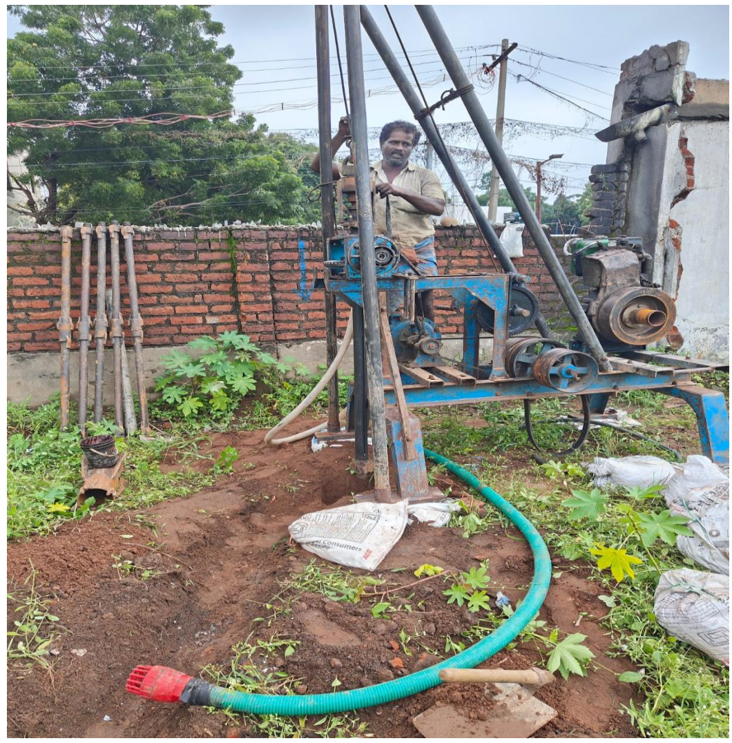
Bore well work completed(260 Ft)