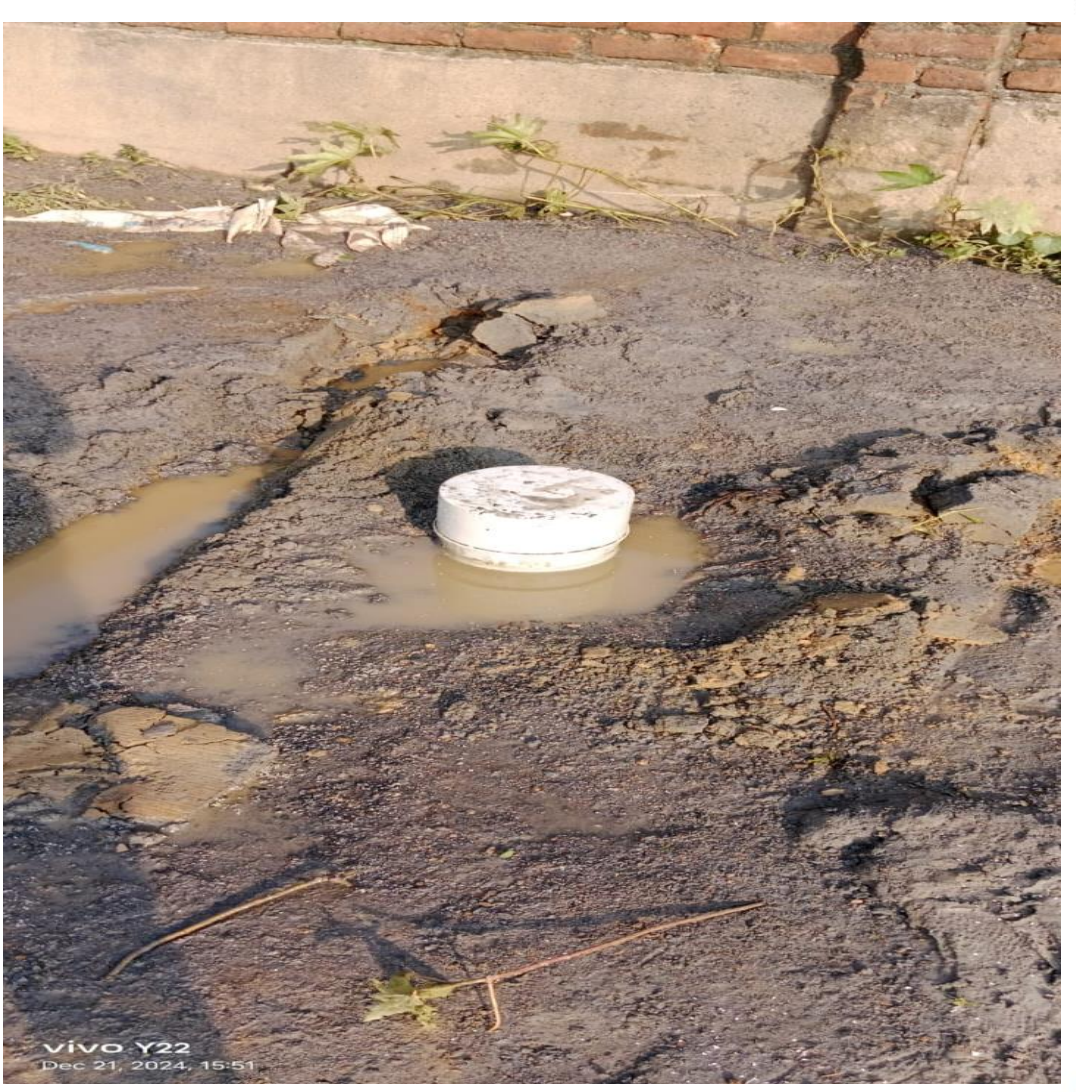
Bore well work completed (260 Ft)