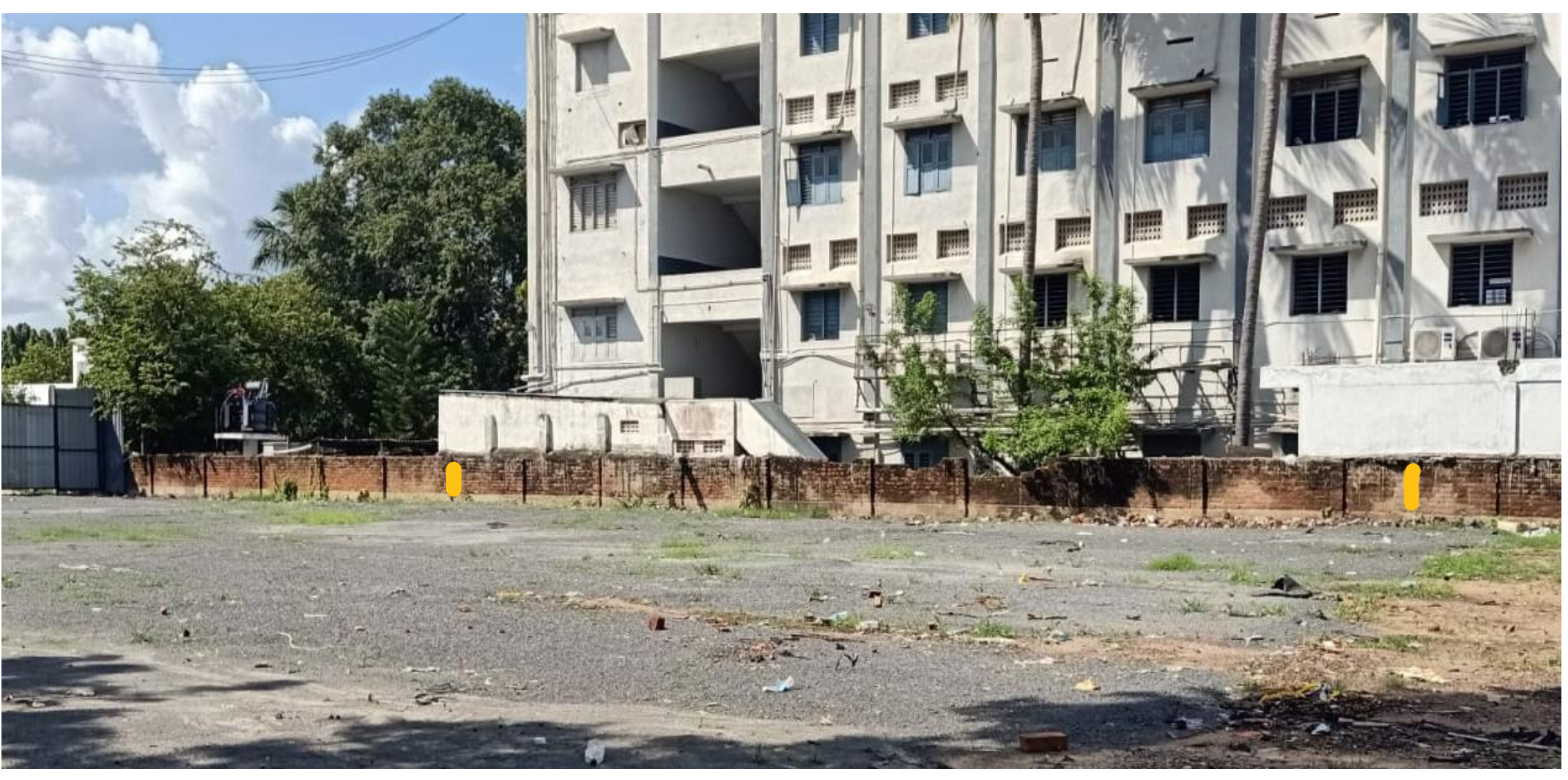
Plot boundary line checked with government surveyor