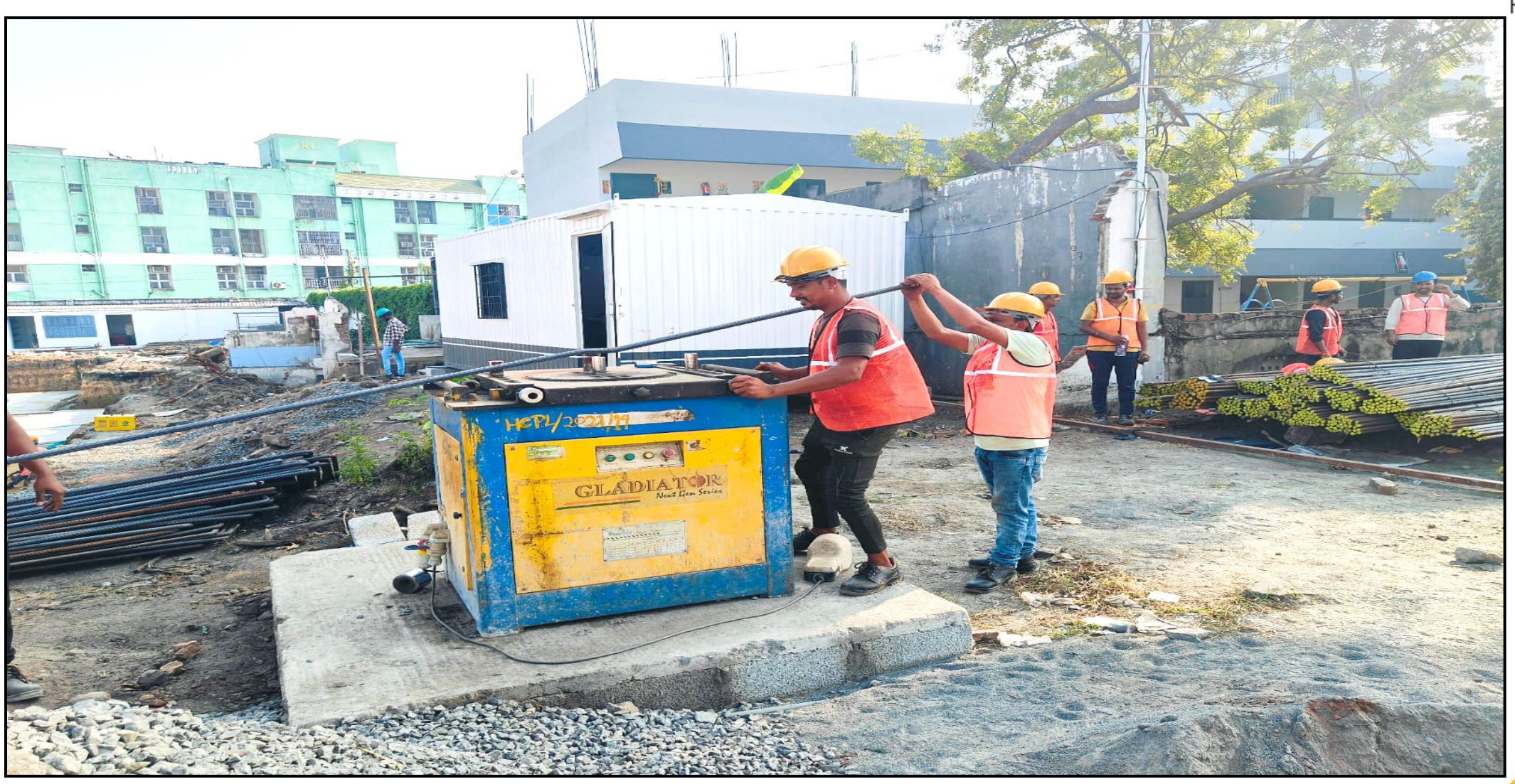
Steel cutting & bending work in progress for raft foundation work