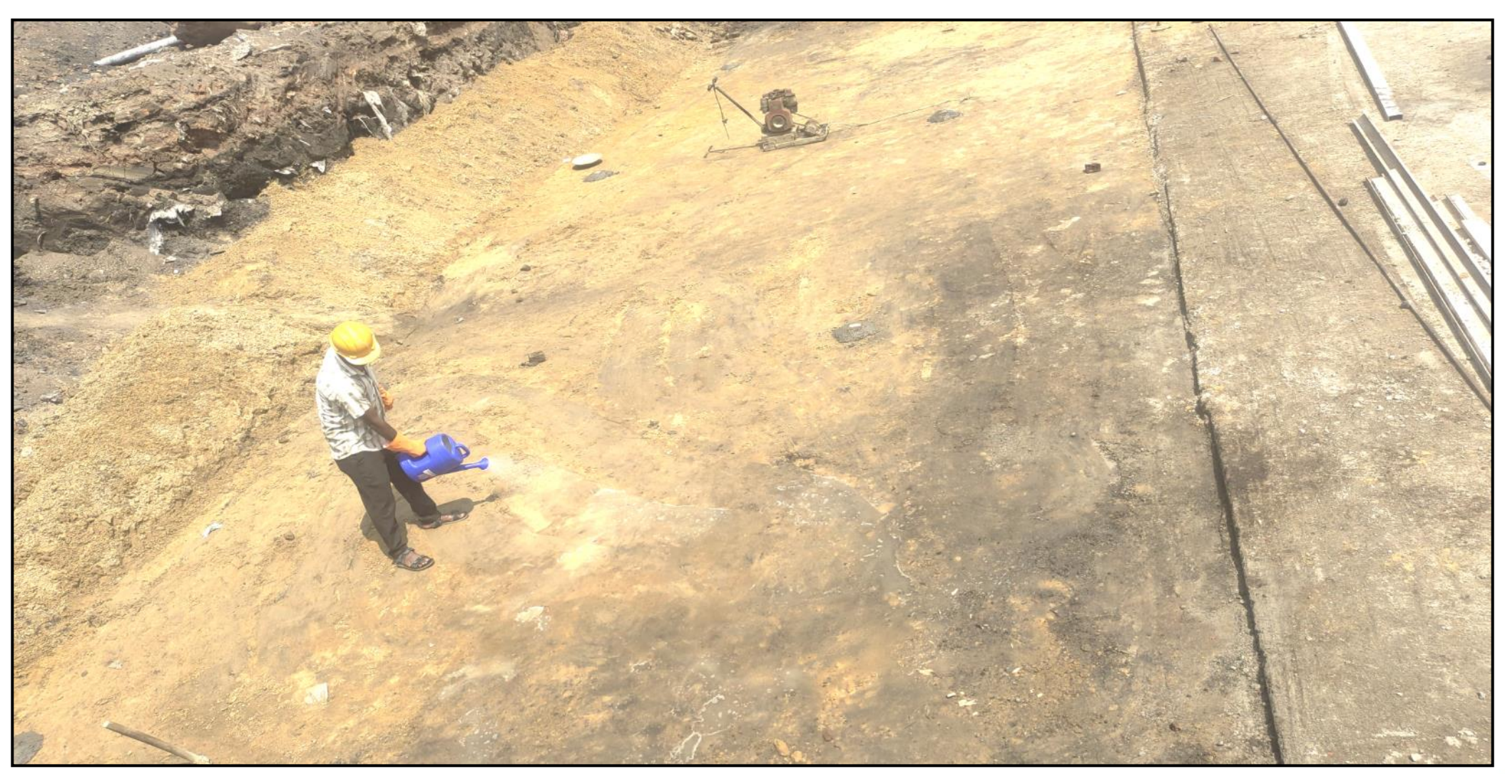
Main building – ATT work in progress (1689/2659 sqm)