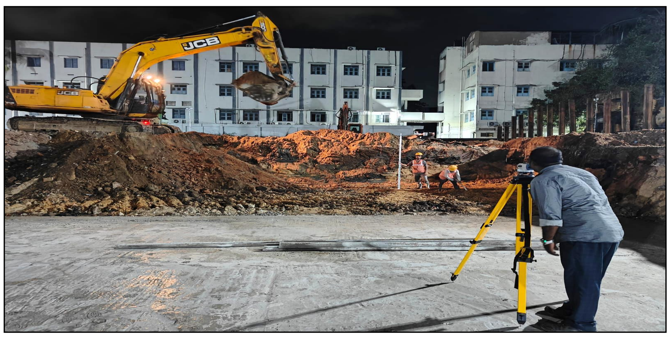
Main building – Raft excavation work in progress (3834/7838 cum)