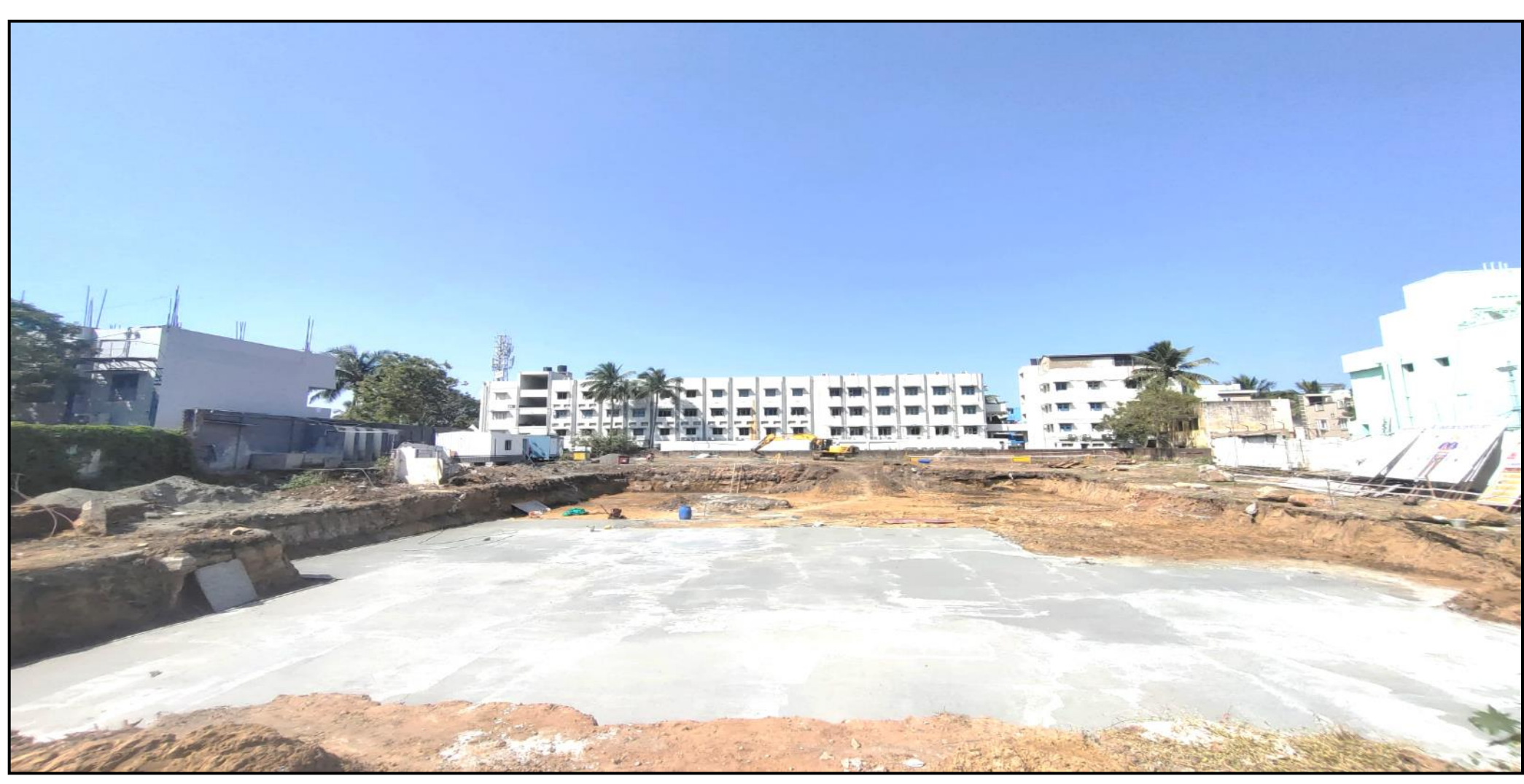
Main building – Raft PCC work in progress (81/123 cum completed)