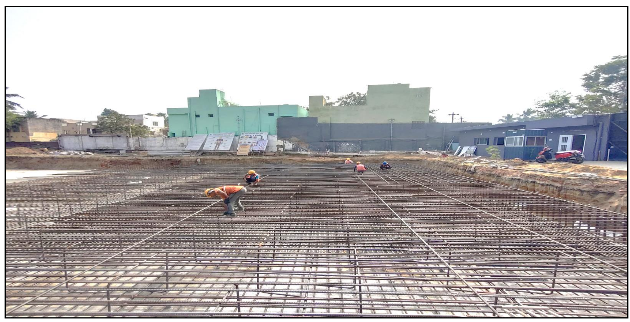
Main building – Raft reinforcement work in progress