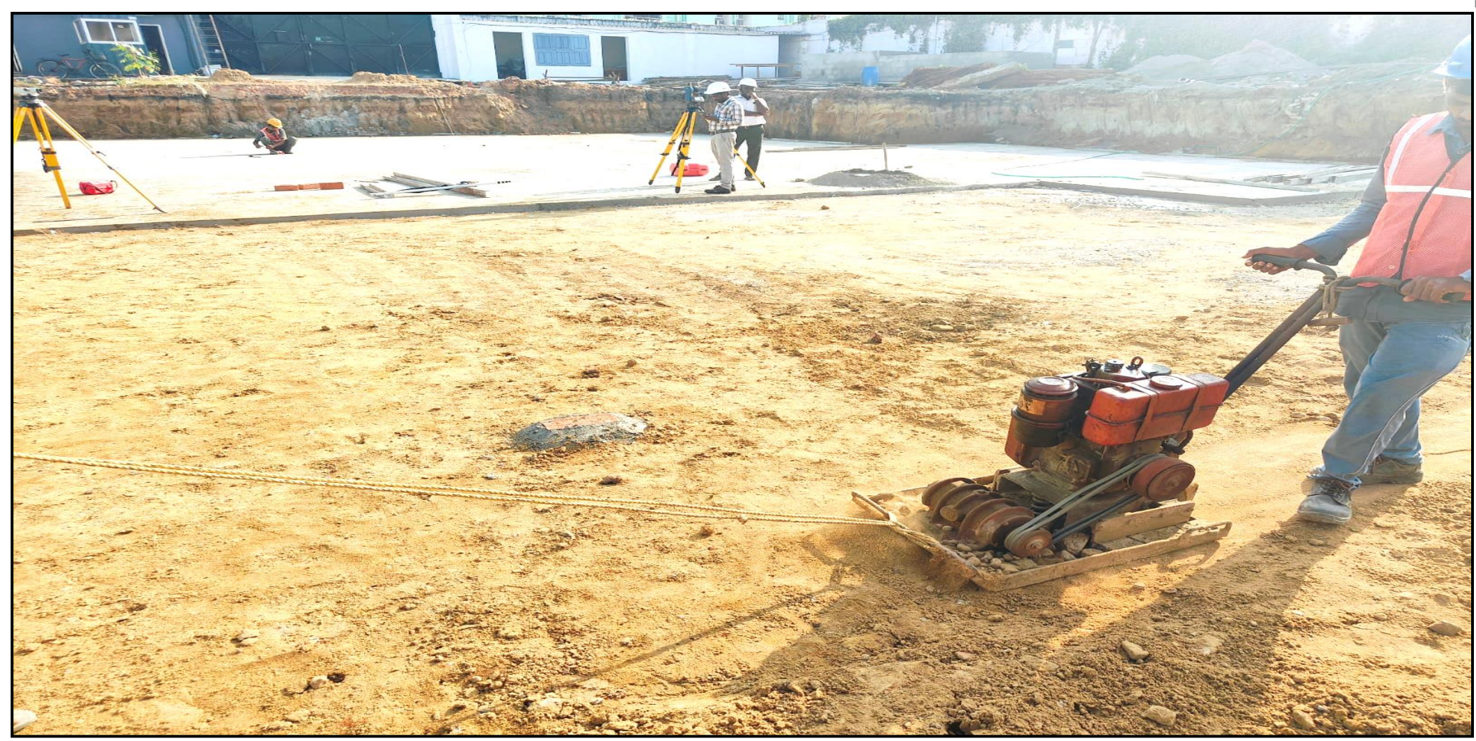
Main building – Base preparation work for raft PCC