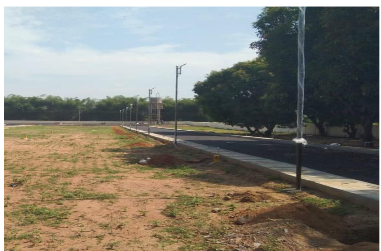
STREET LAMP POST FIXING WORK IN PROGRESS