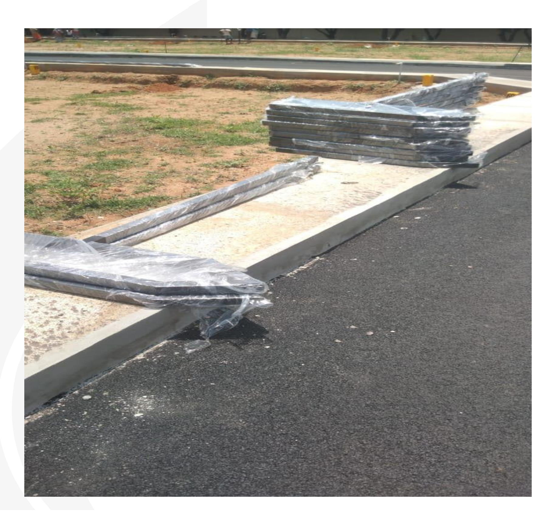
STREET NAME BOARD