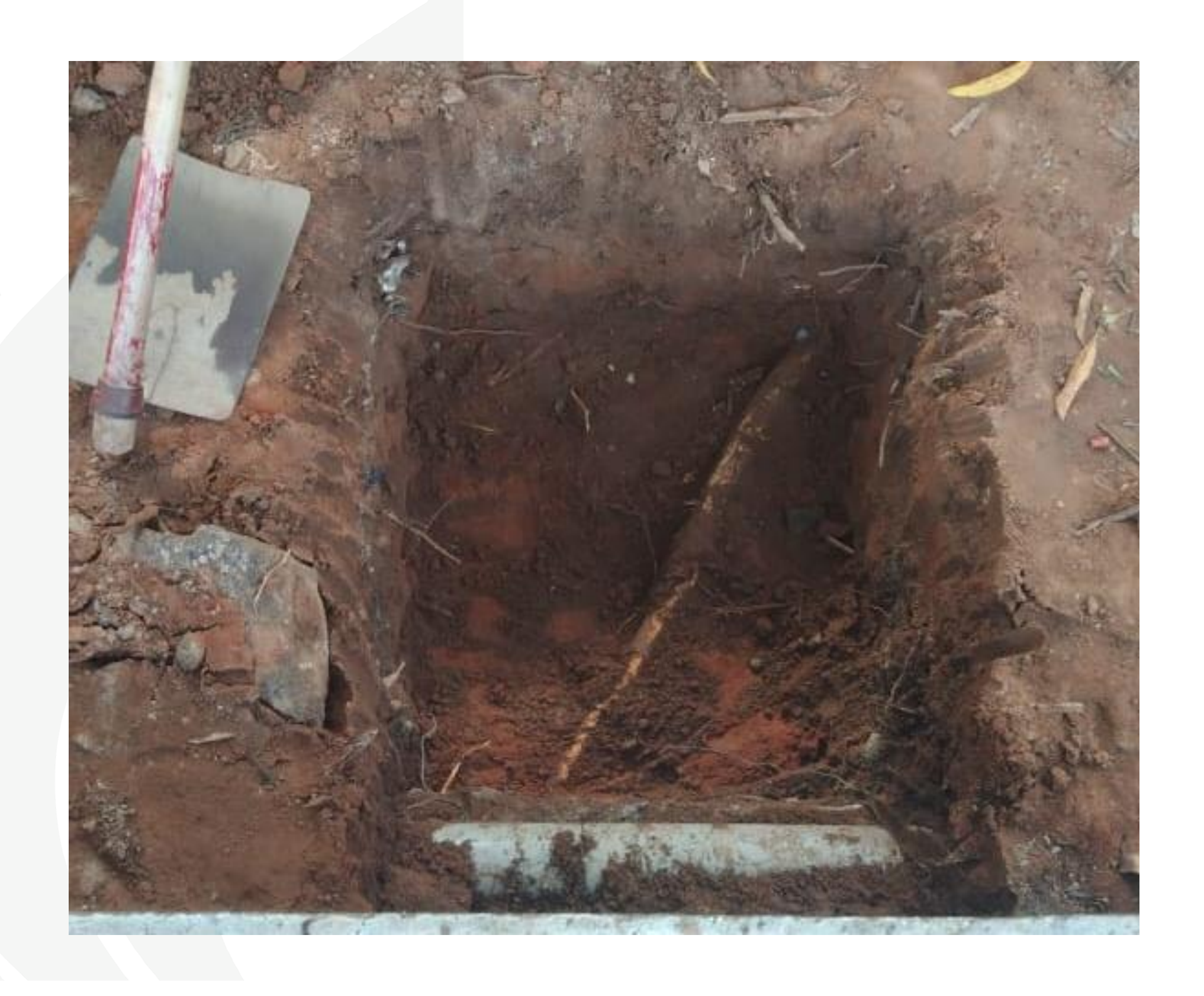
AVENUE TREE EARTH WORK