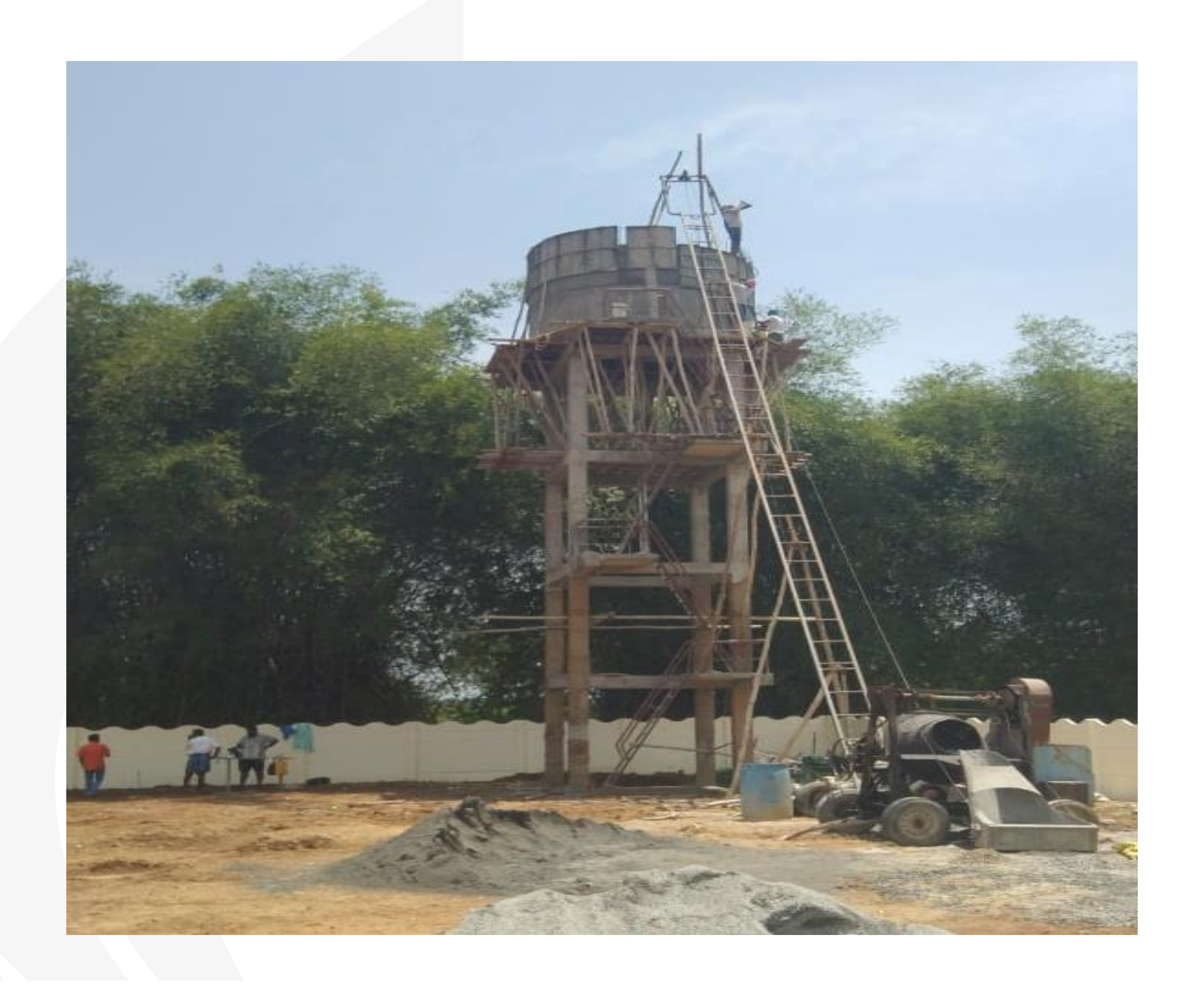
OVER HEAD TANK ROOF SLAB WORK