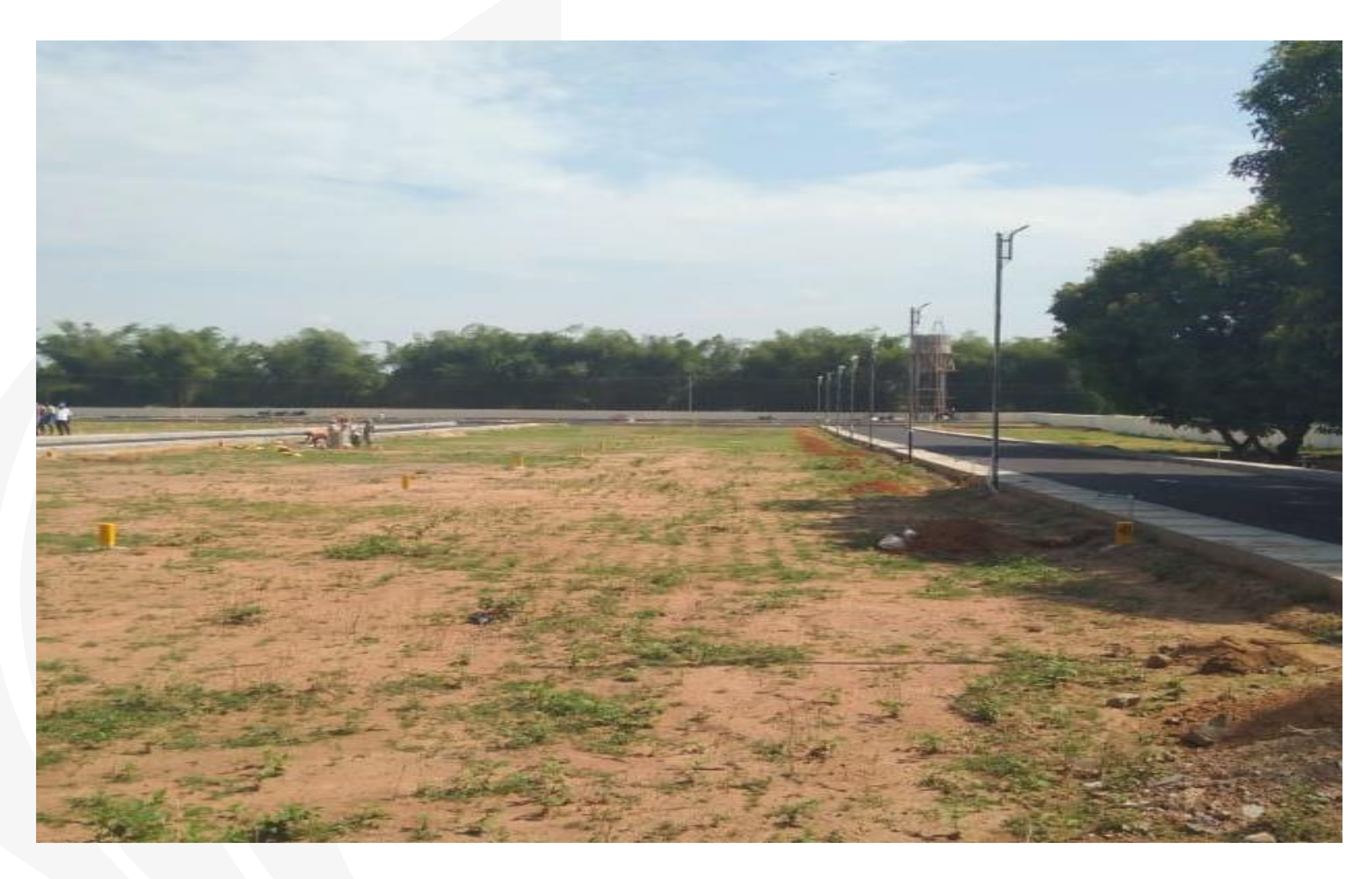
PLOT SEPARATION STONE PAINTING WORK