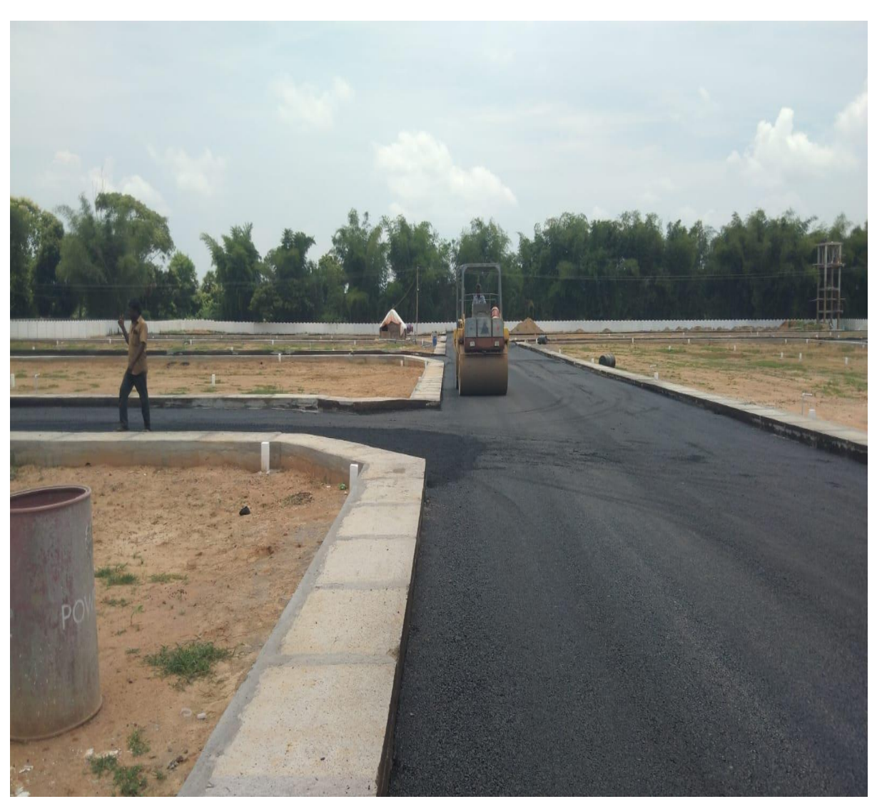
BITUMEN ROAD 2<sup>nd</sup> LAYER LAYING WORK 90% COMPLETED