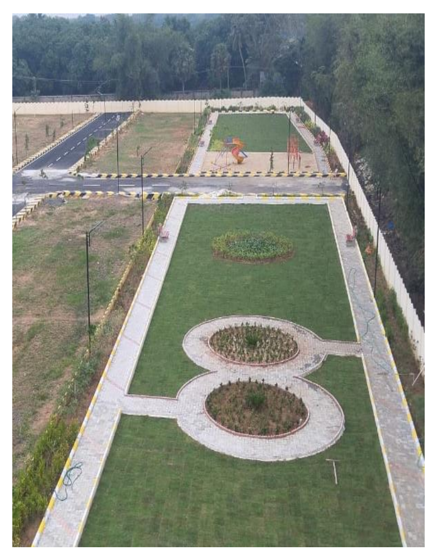
Park Top View