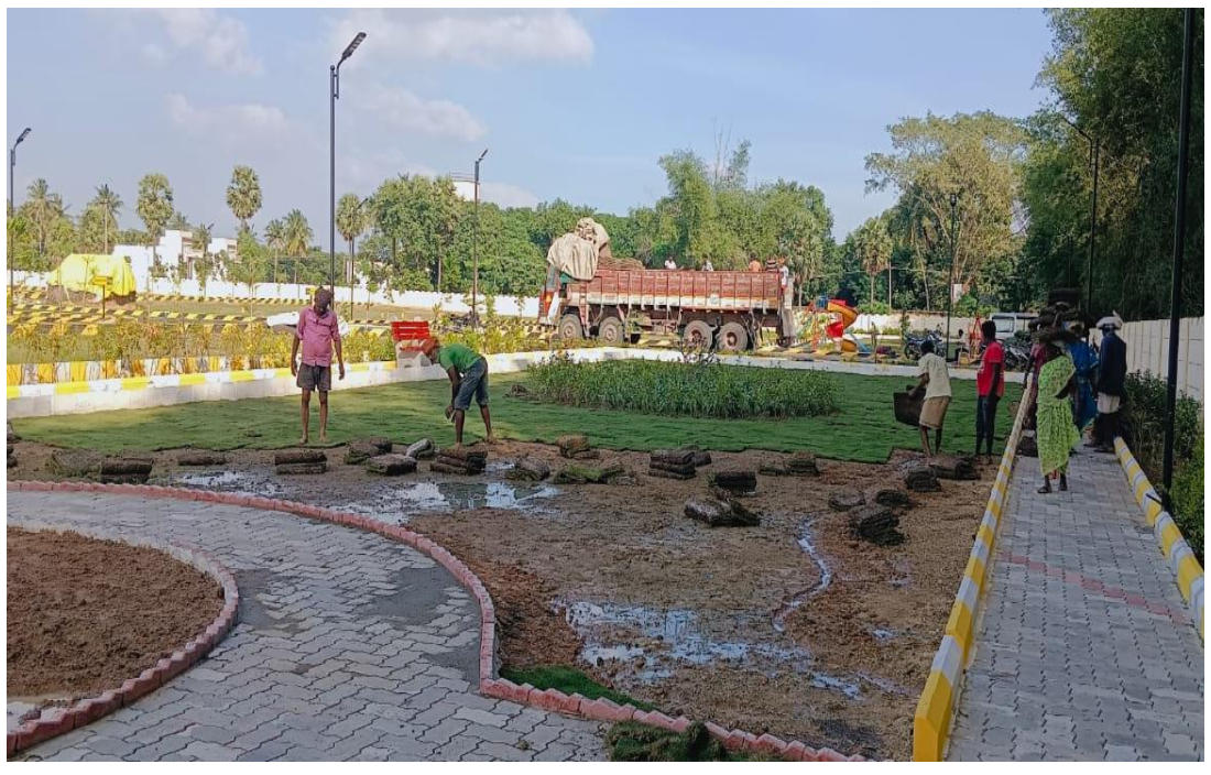
Park Landscape Work Completed