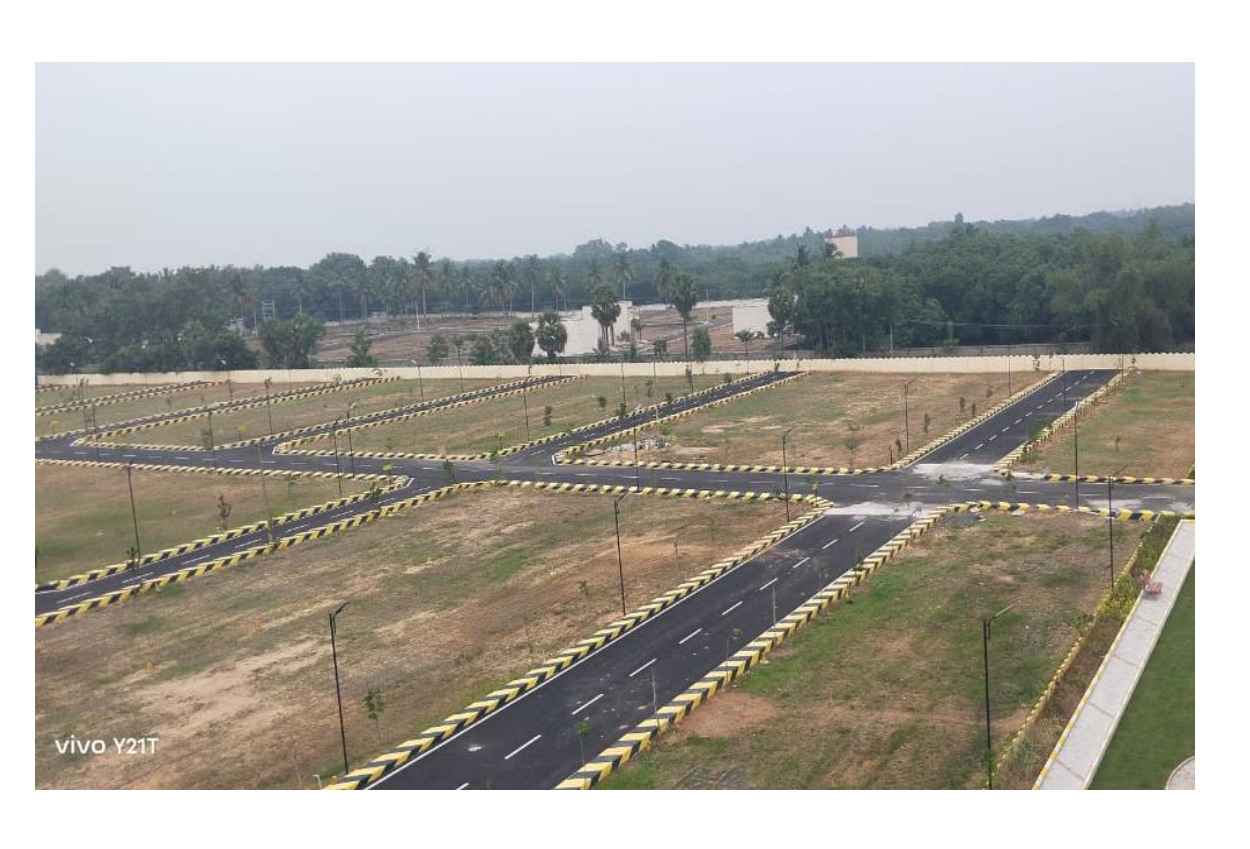
Plot Top View