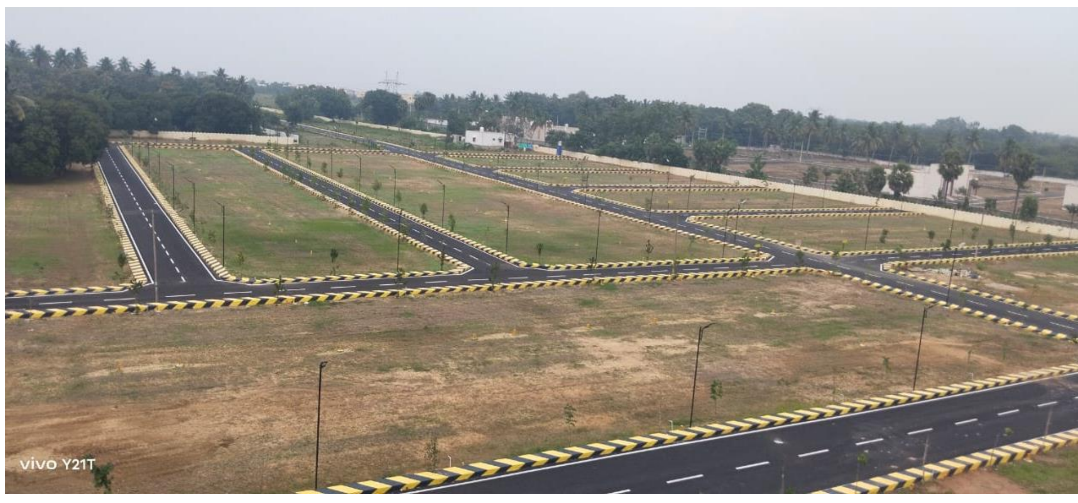
Plot Top View