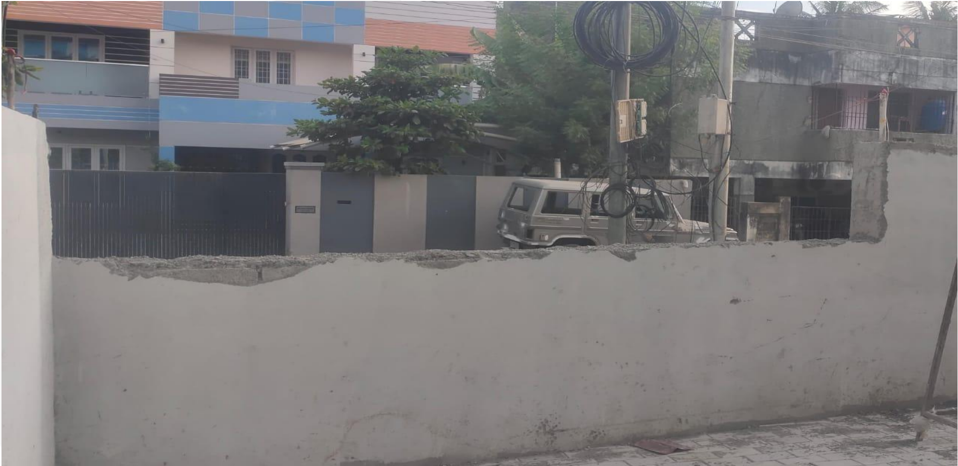
After CC works compound wall demolition & compound wall MS work in progress