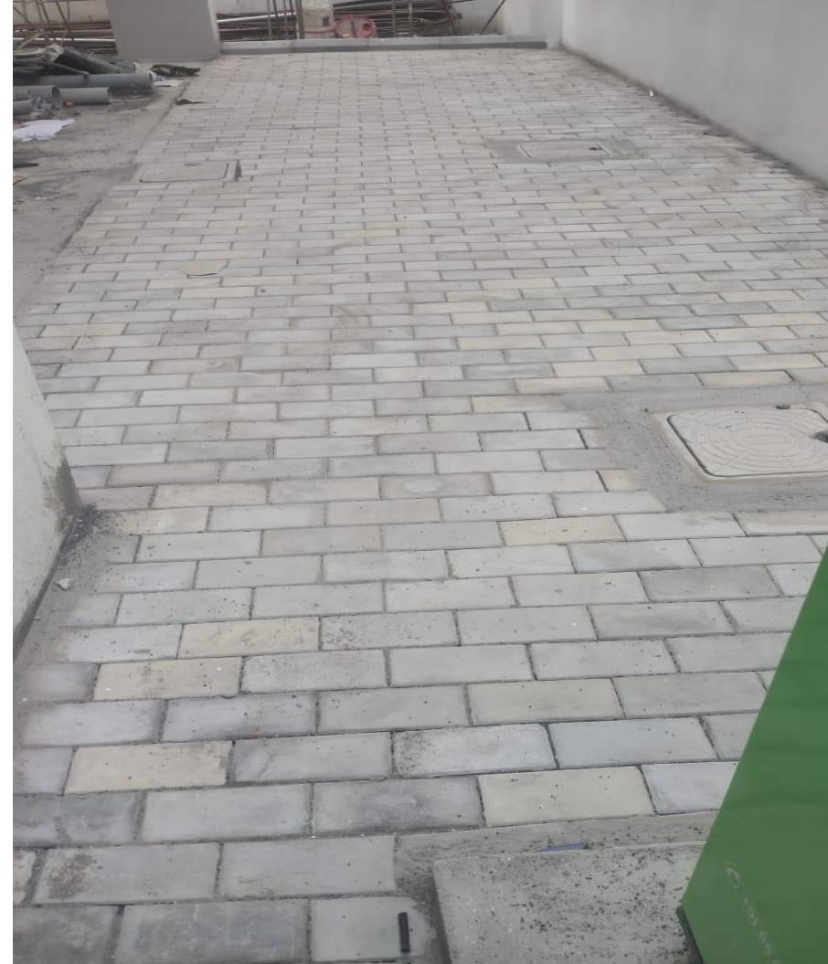
Stilt floor paver work completed