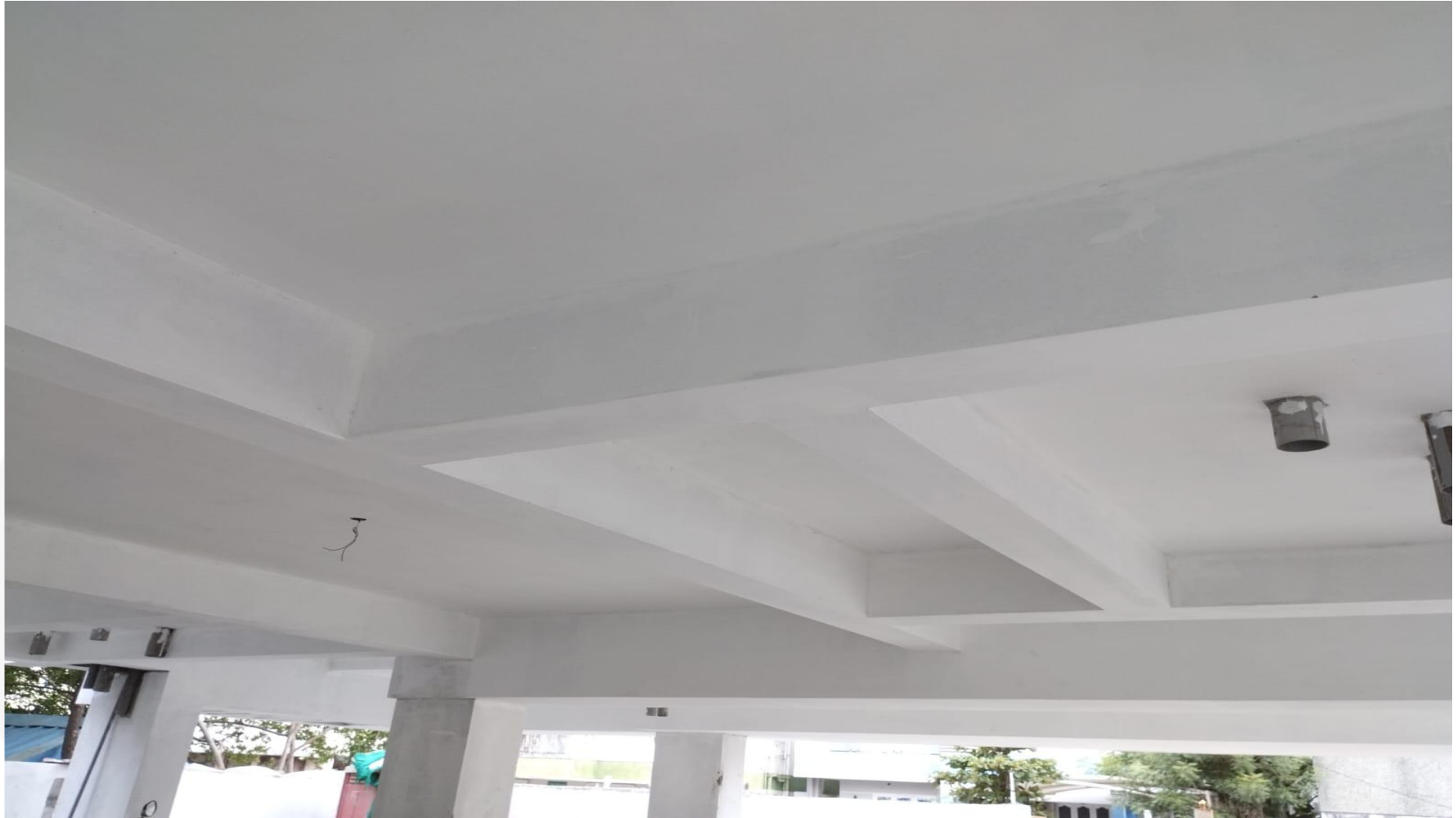
Stilt floor carparking painting work completed