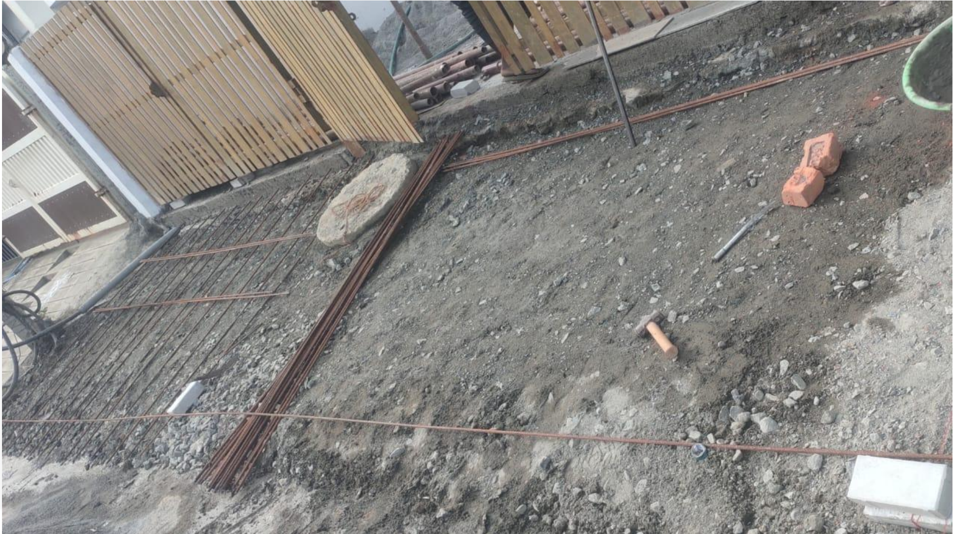
Stilt floor entrance ramp work in progress