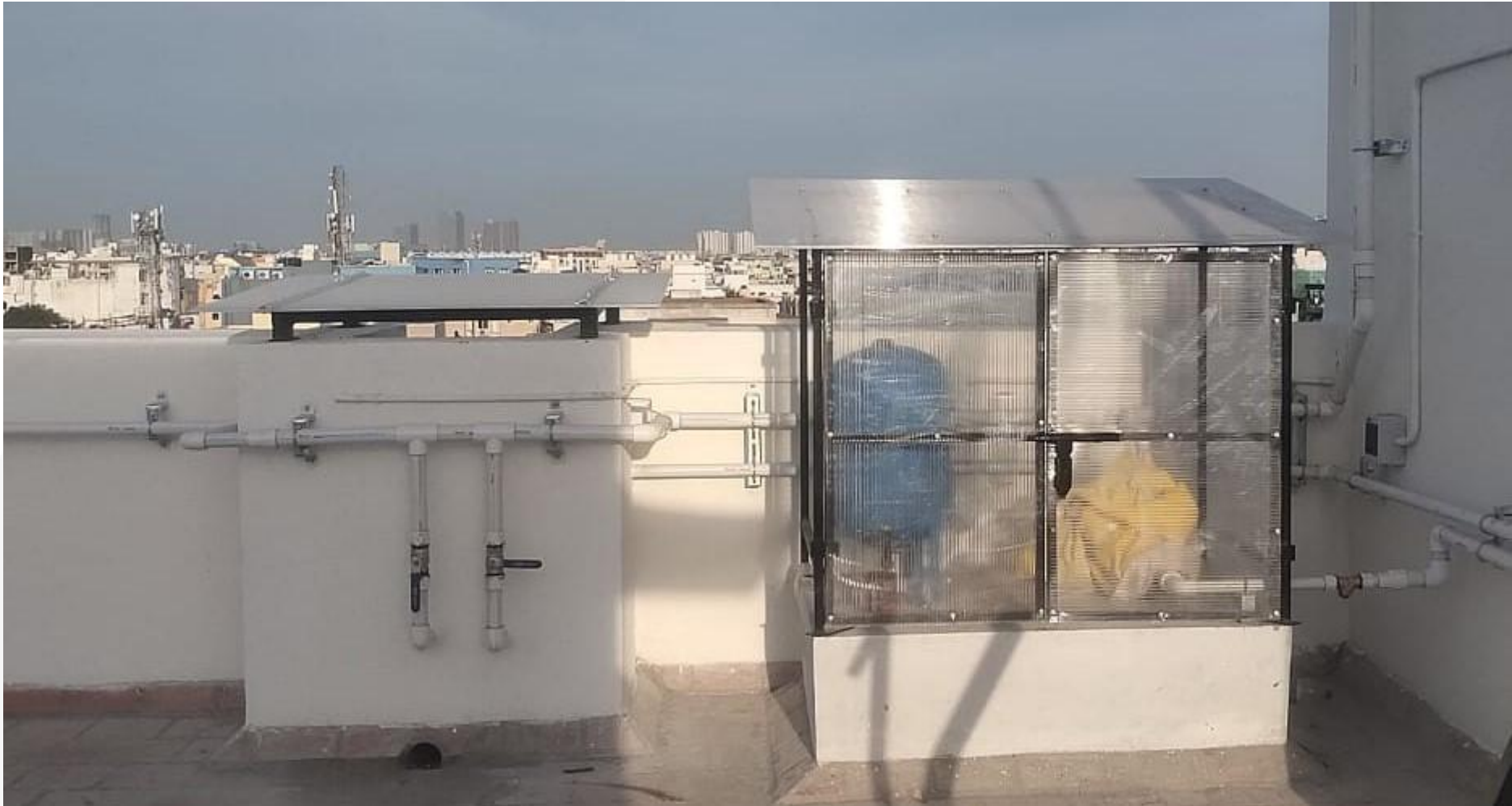
Terrace booster pump & OTS covering work completed