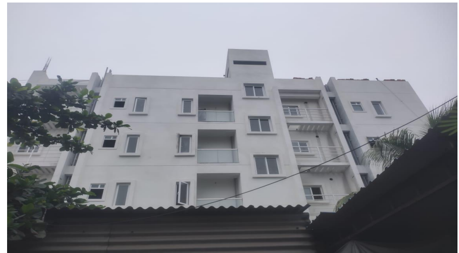
External painting work in progress