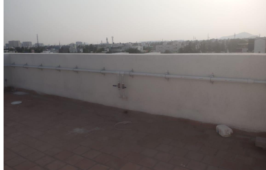
Terrace plumbing pipe line work completed