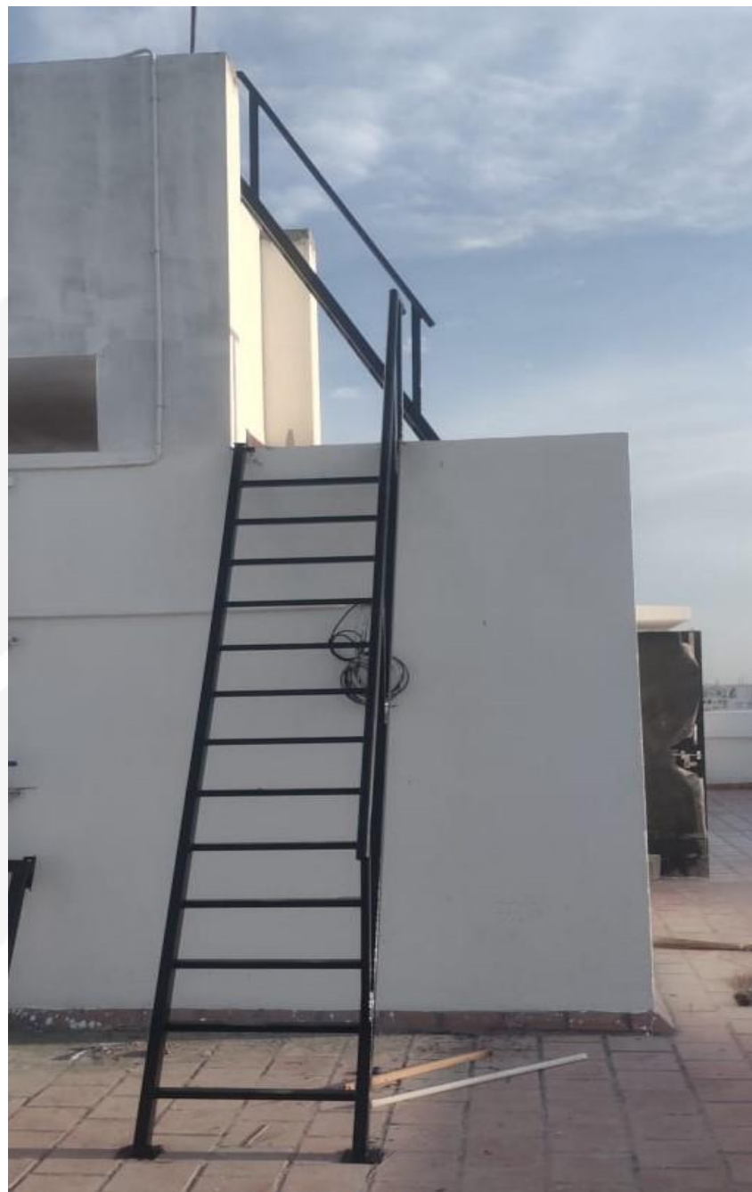
Terrace OHT tank ladder work completed