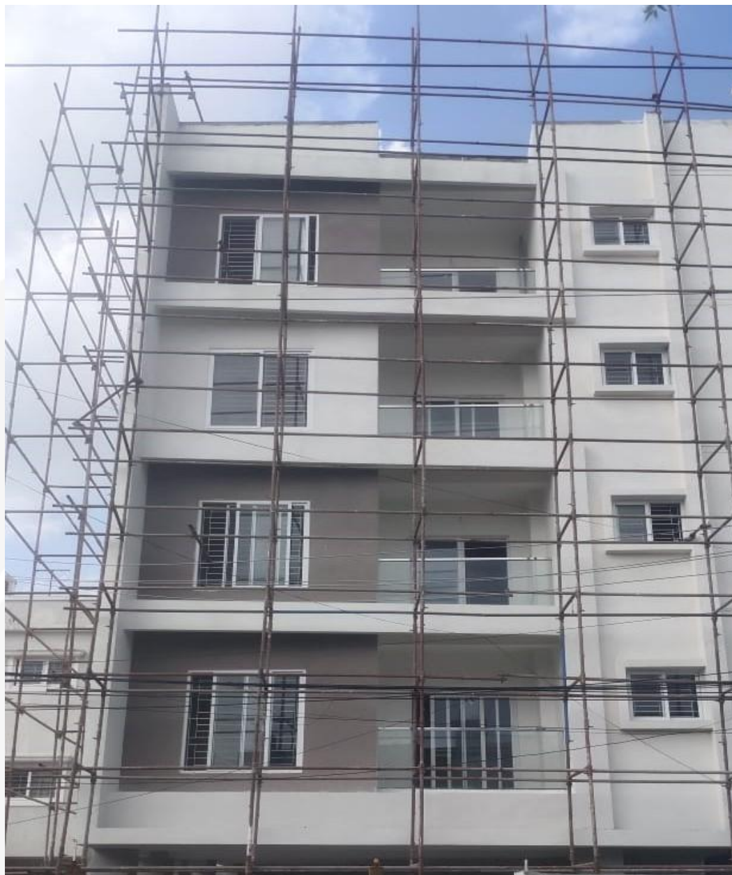
Terrace pergola MS work & Terrace Elevation slab scaffolding work in progress