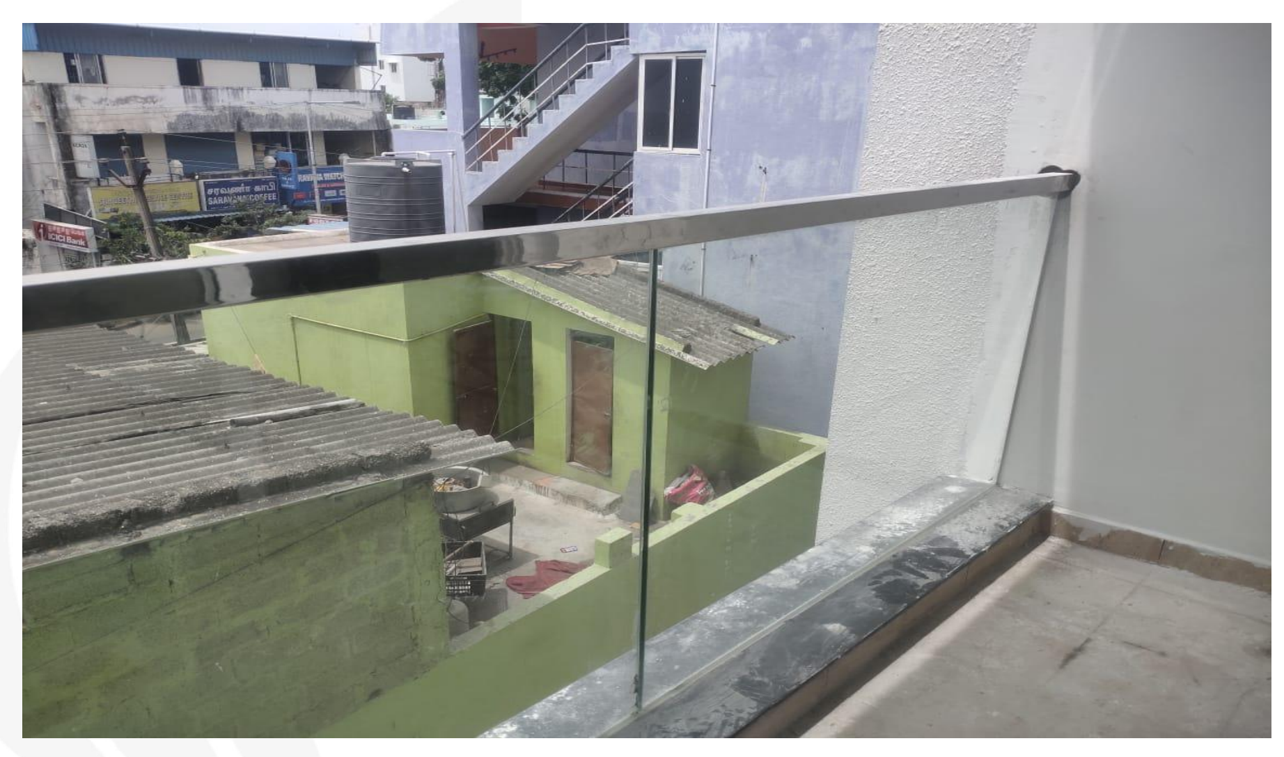
Balcony Hand rail work completed