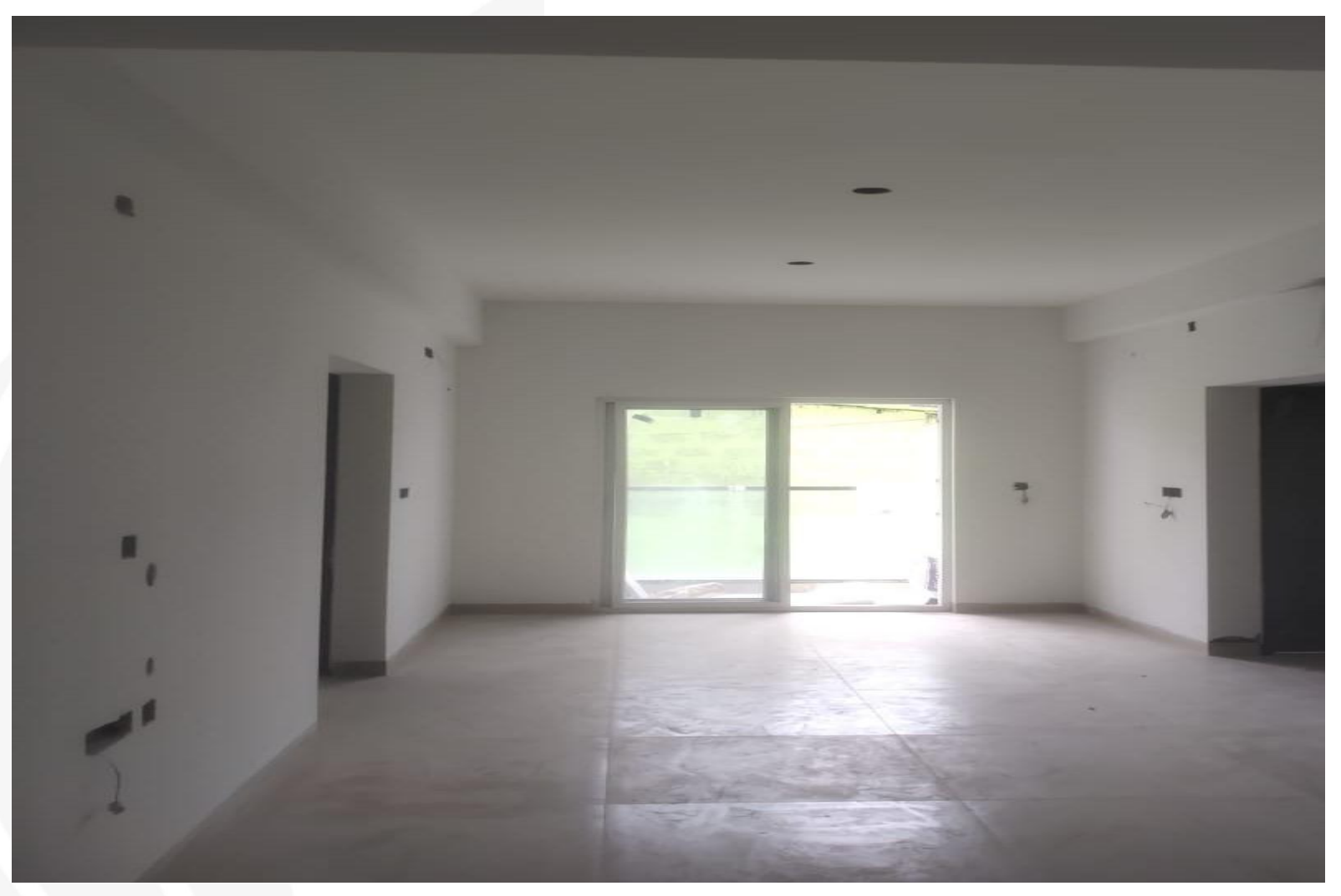
Flats Internal primer work completed