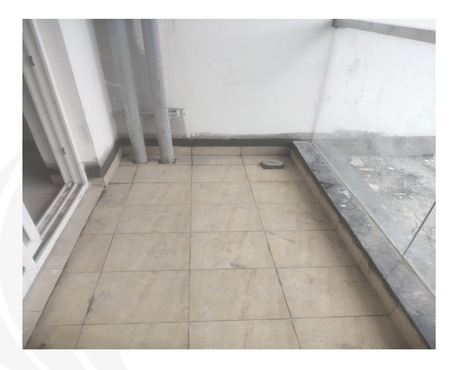
Balcony flooring Tiling Work Completed