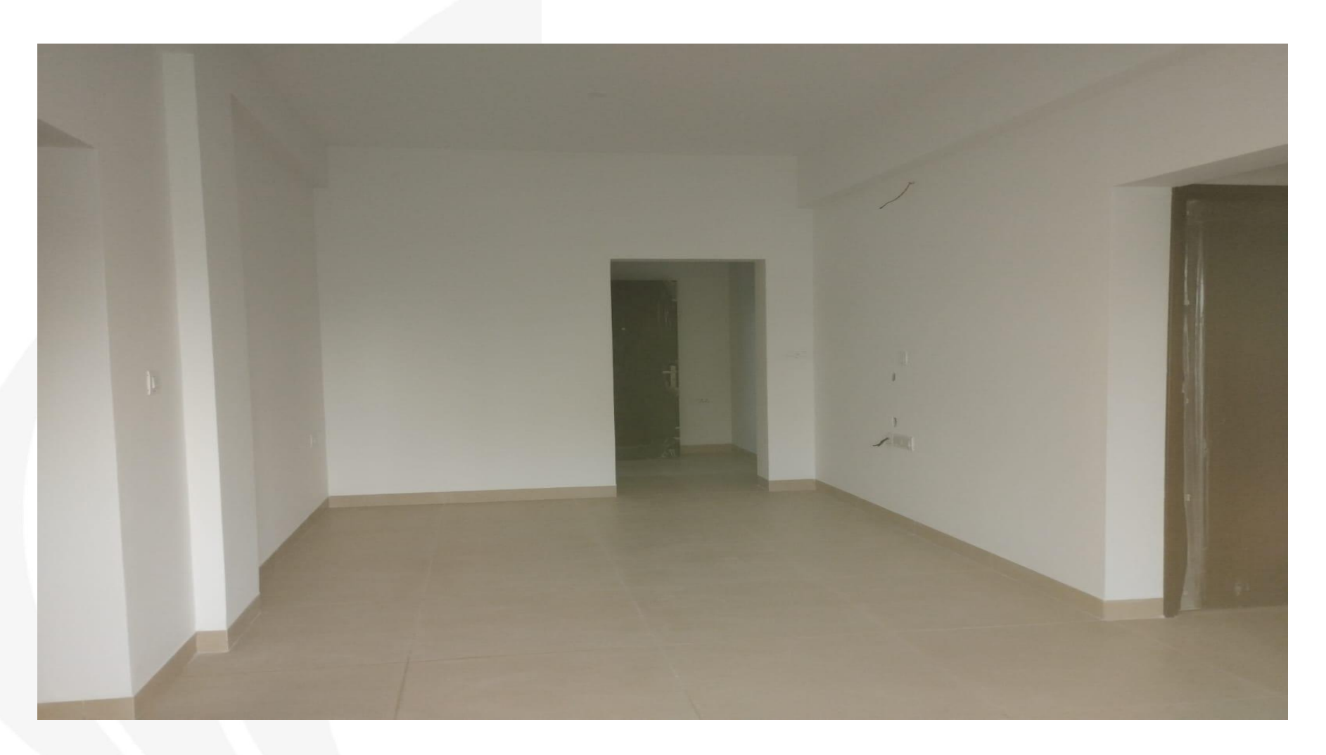
Unit 201,202,301,302,401 flats 1<sup>st</sup> coat internal painting work completed