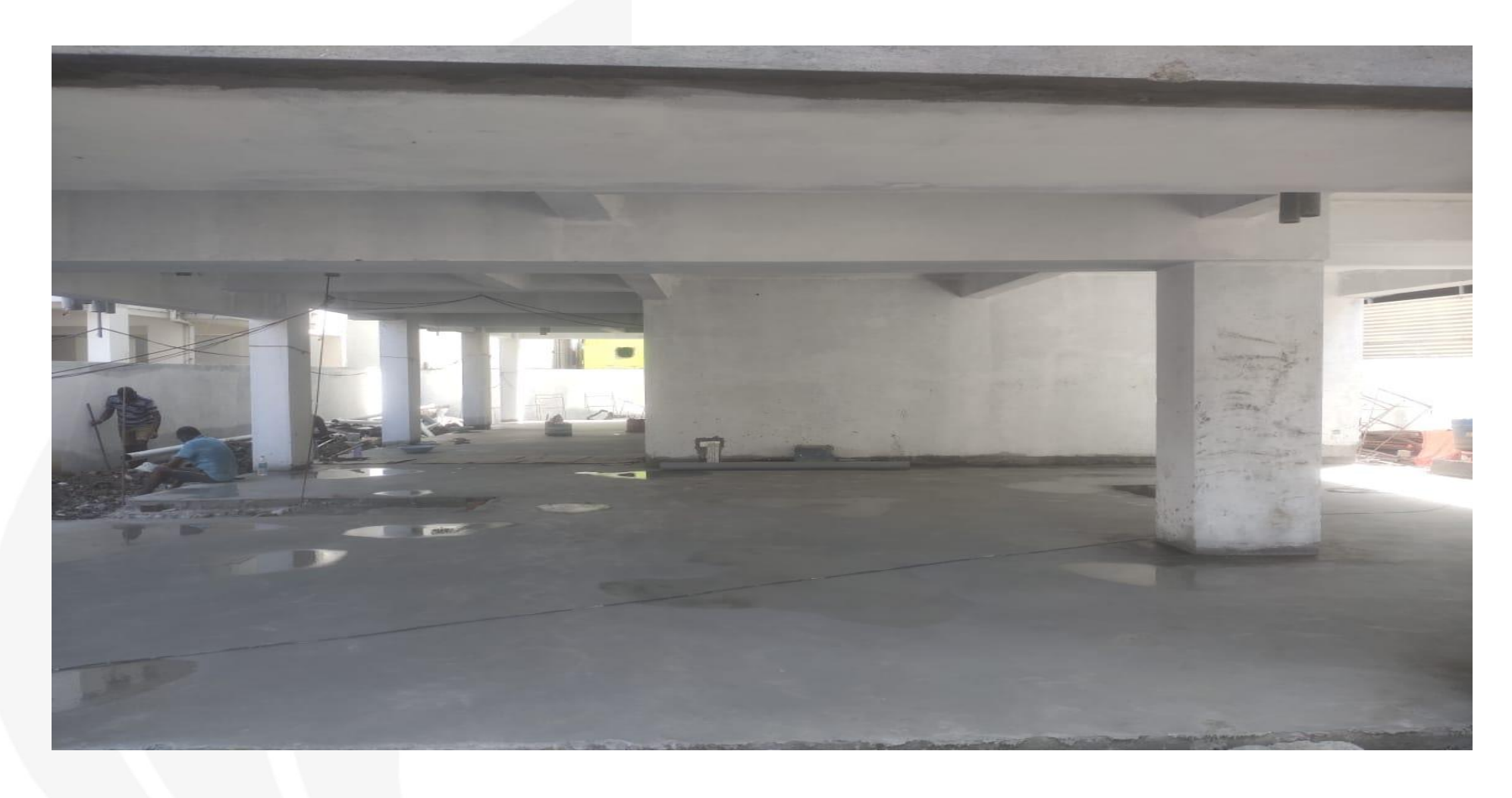
Stilt floor carparking concrete work completed