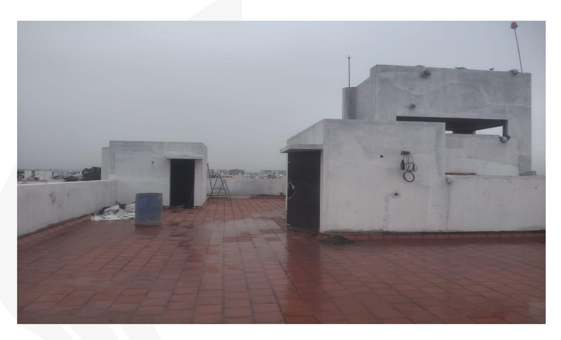
Terrace clay tiles work completed