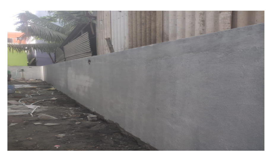
Compound wall four side work completed