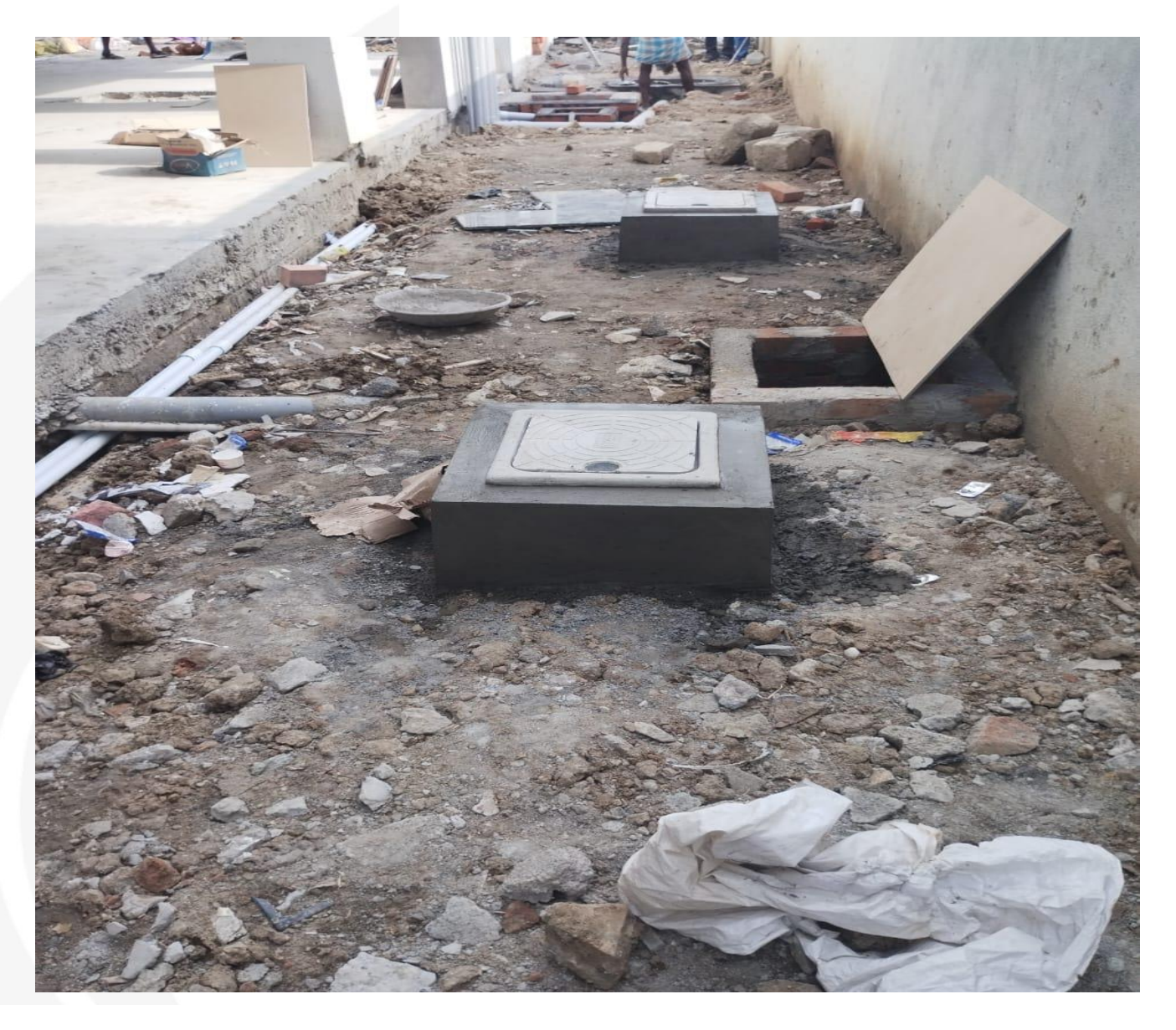
External stilt floor Electrical earth pit chamber work in progress