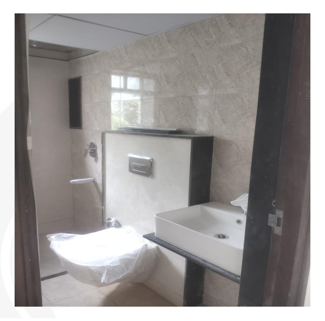
Toilet CP fittings fixing Work in progress