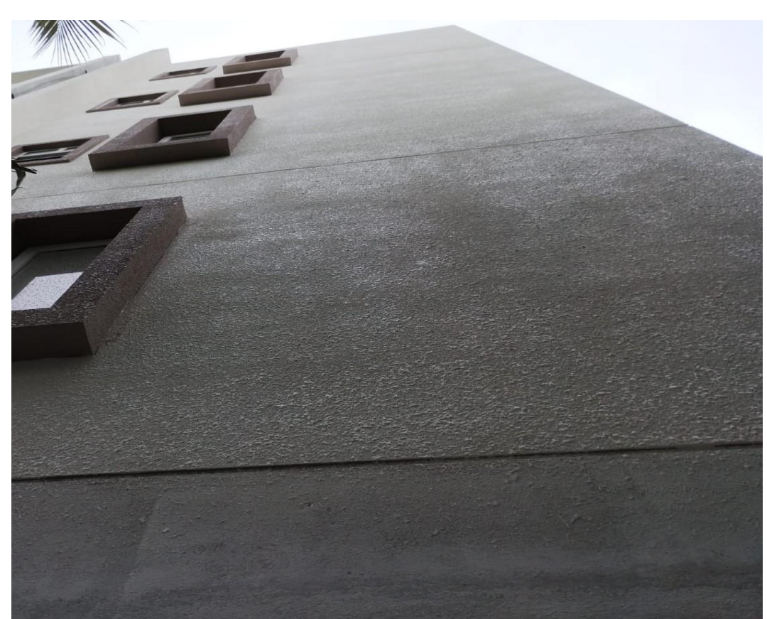
External painting 1<sup>st</sup> coat east & west side work in progress