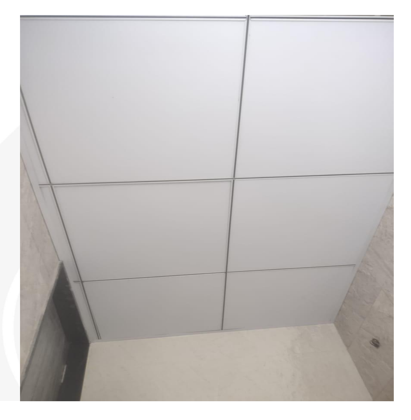
Toilet inner false ceiling Work in progress