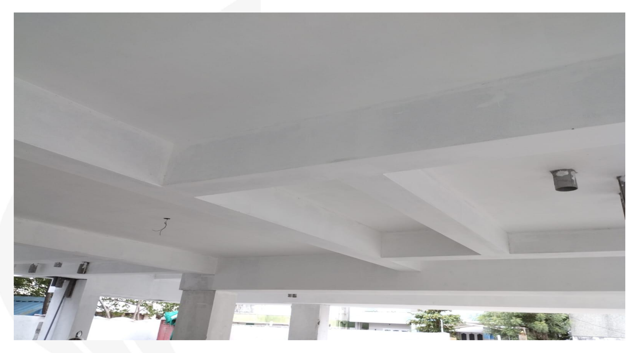
Stilt floor ceiling 1st coat painting completed