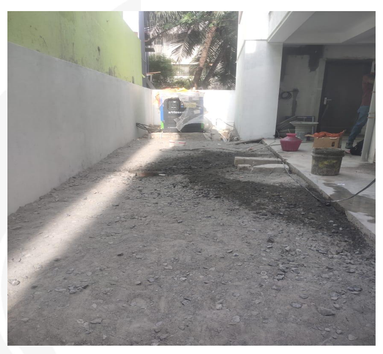
Stilt floor paver area WMM filling work in progress