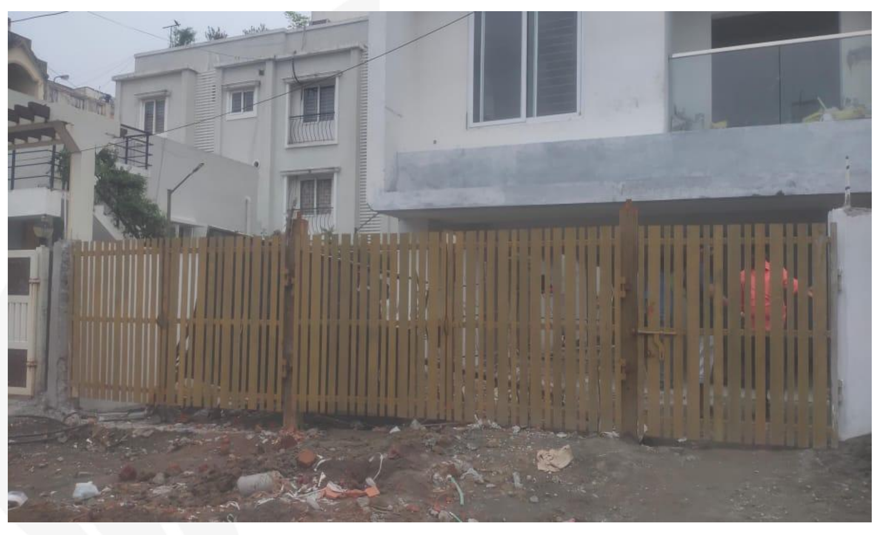
Entrance gate work completed