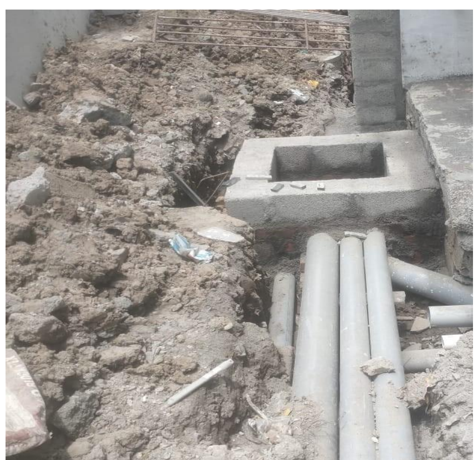
East side External plumbing Shaft plumbing pipe line work & chamber work in progress