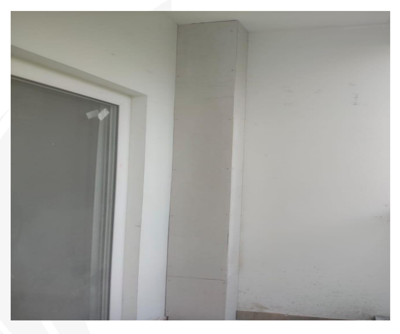
Balcony plumbing pipe covering Work completed