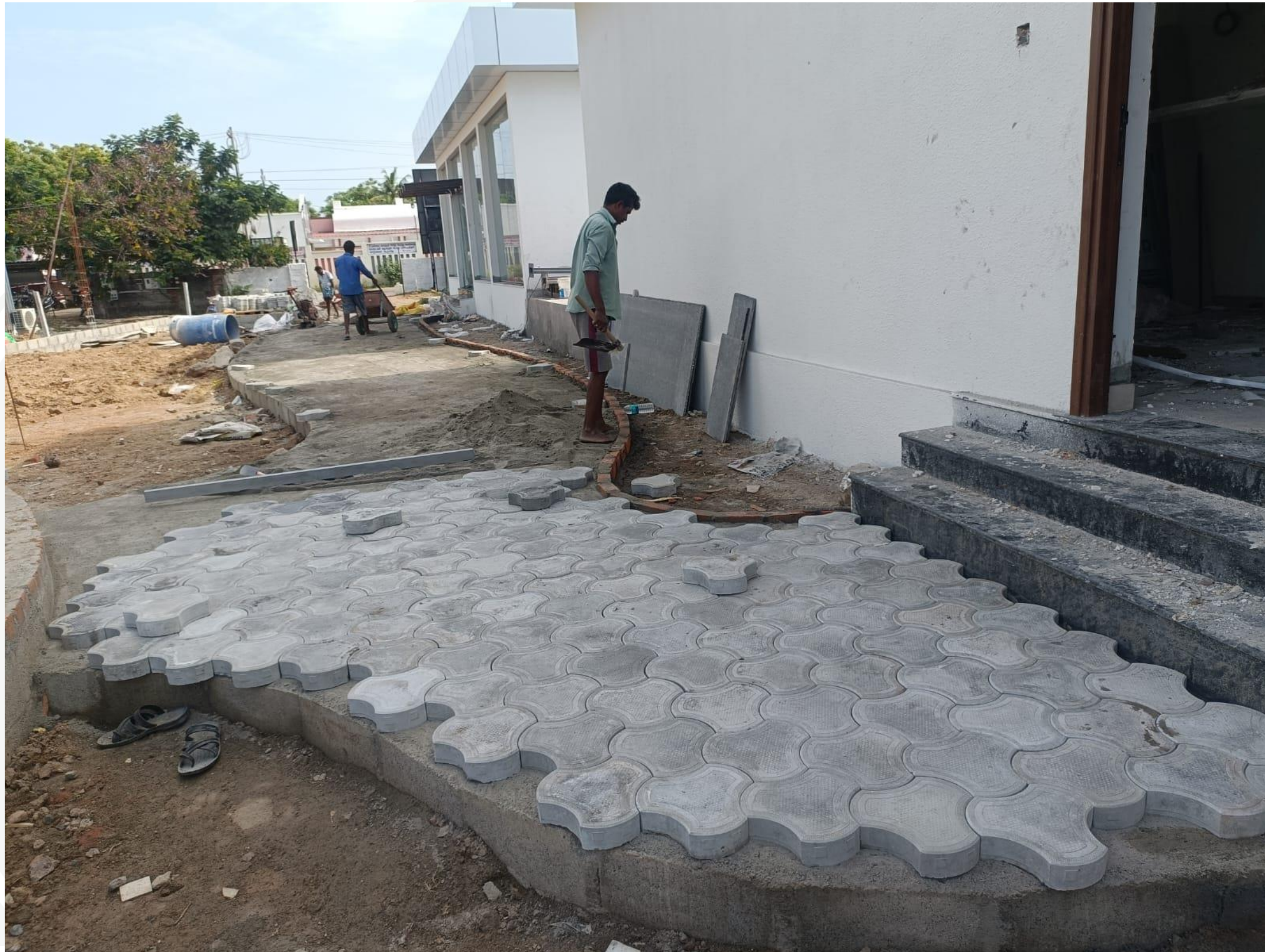
PATHWAY PAVER BLOCK LAYING WORK IN PROGRESS