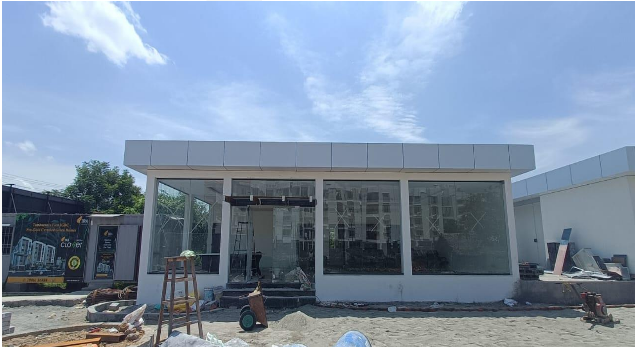
SALES OFFICE FRONT VIEW