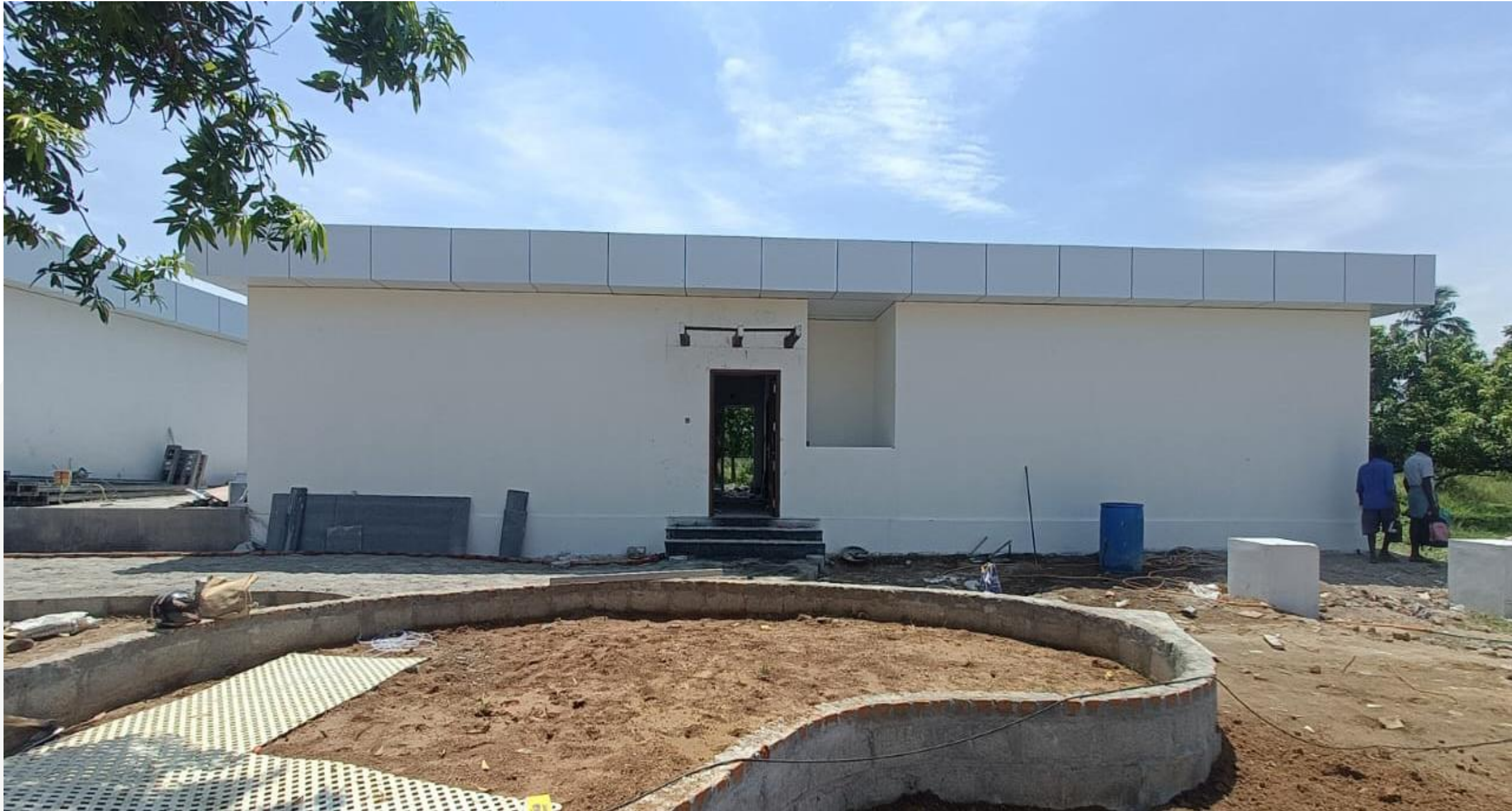
MODEL FLAT FRONT VIEW