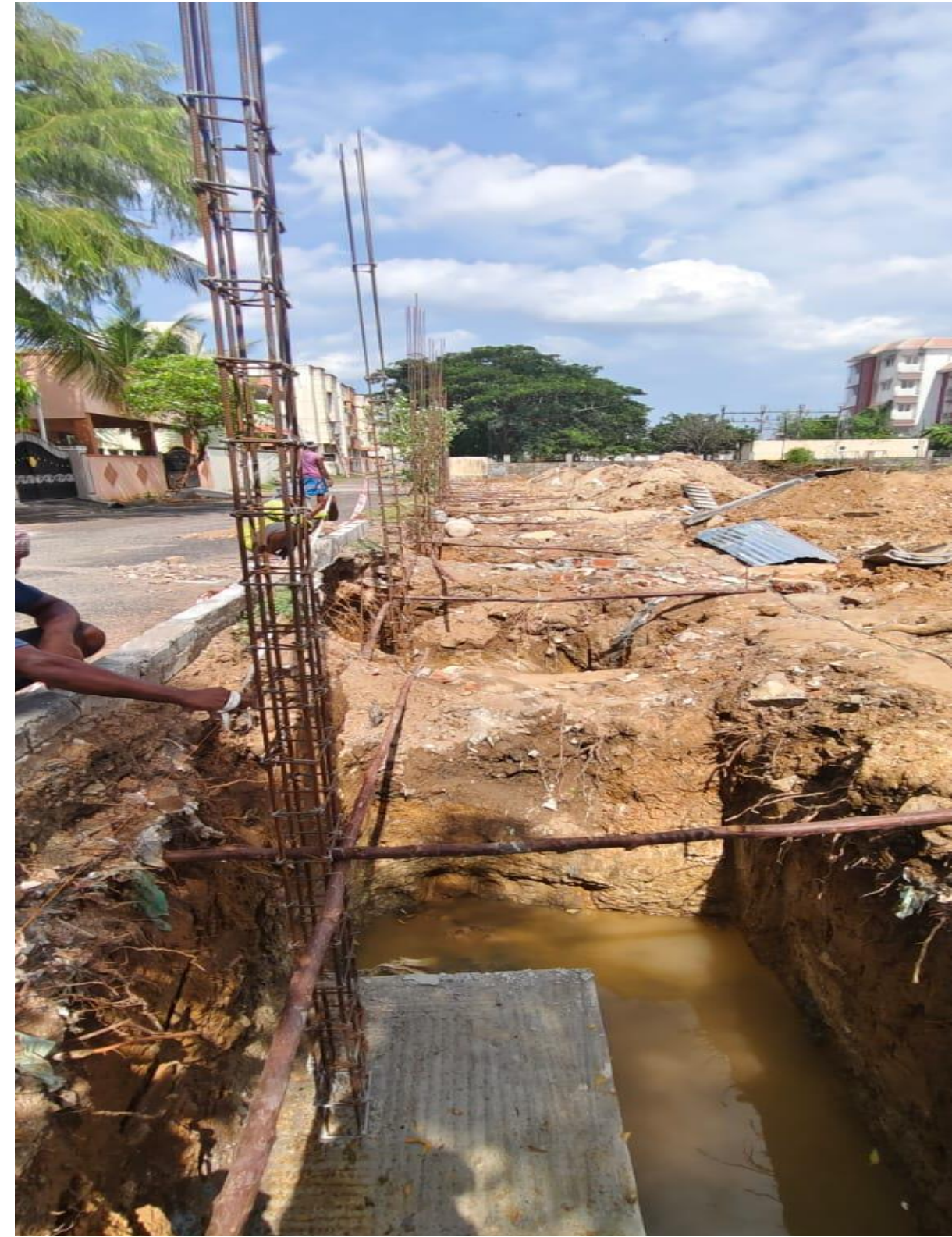
NORTH SIDE COMPOUND WALL FOOTING CONCRETE WORK IN PROGRESS