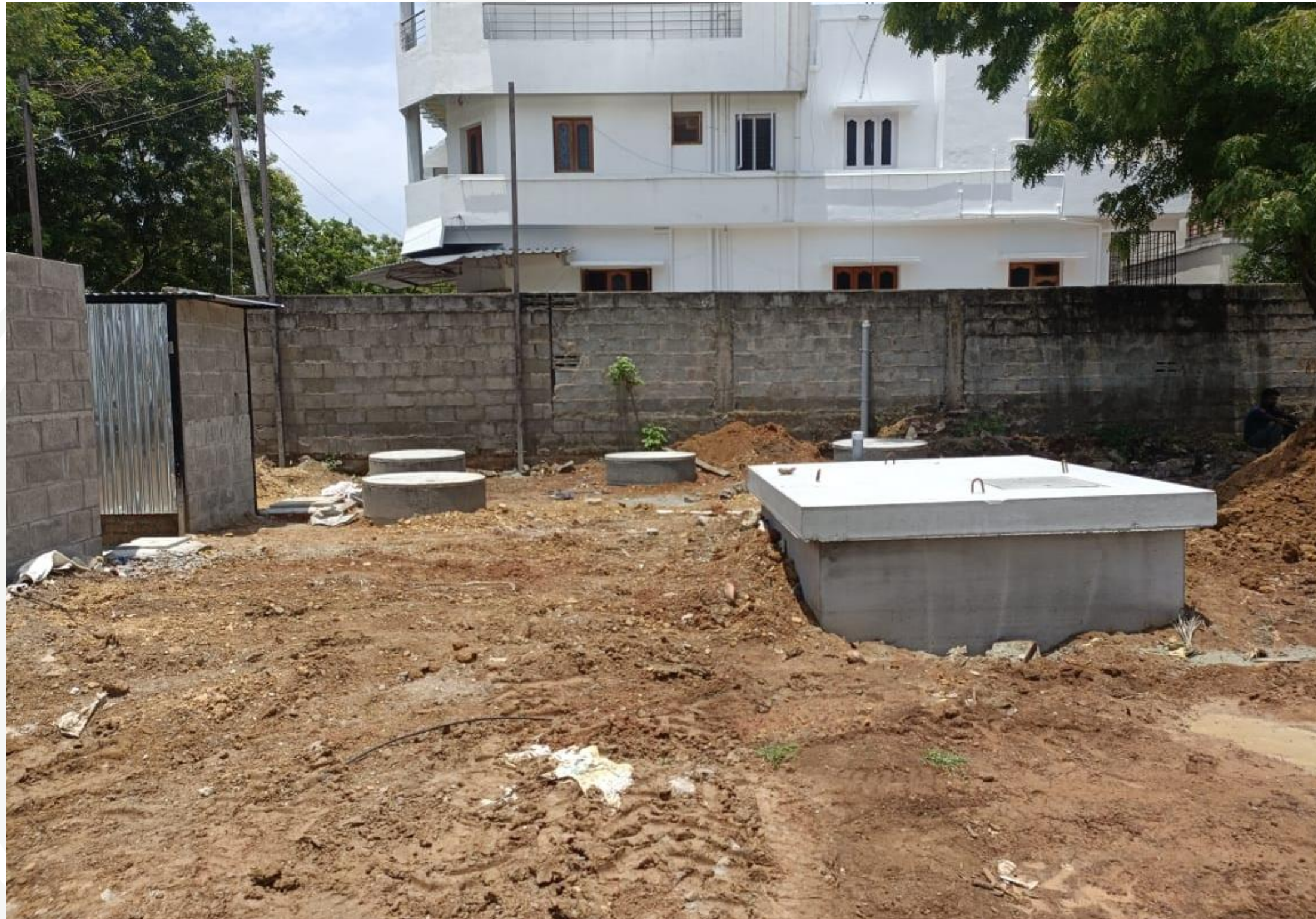
LABOUR SHED PLUMBING WORK COMPLETED