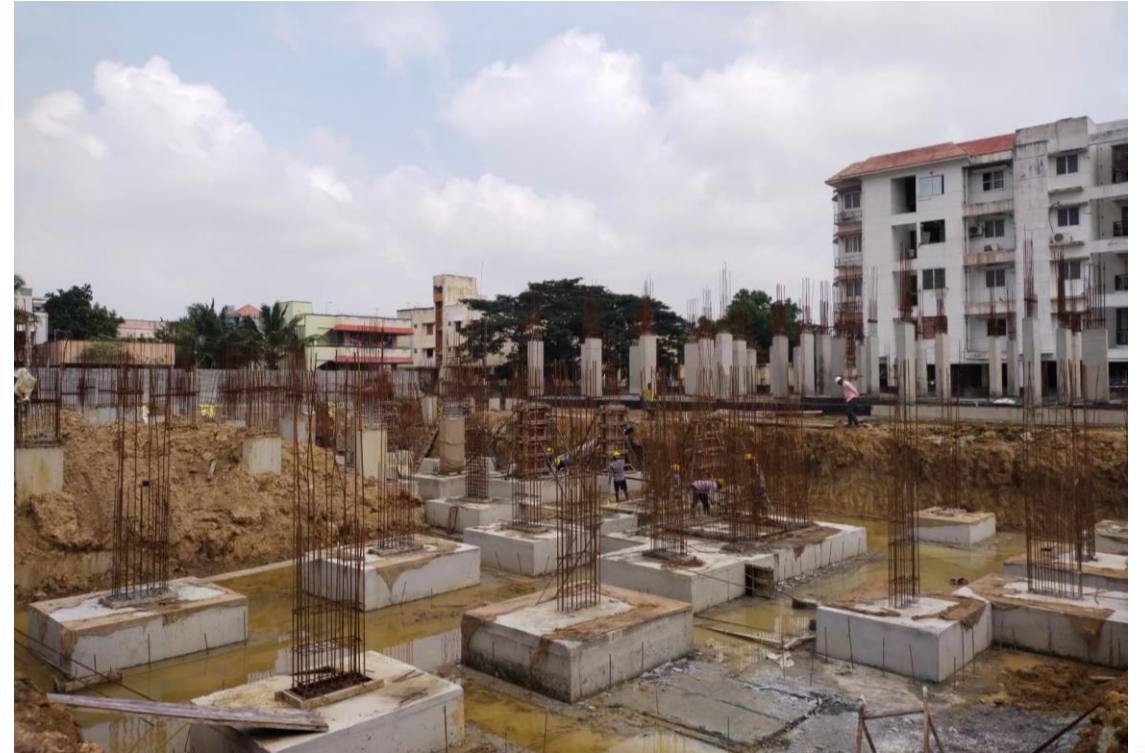
Block-2 – Footing & Column Concrete work in progress