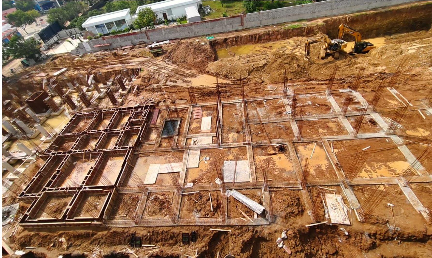
Block-4- Top View