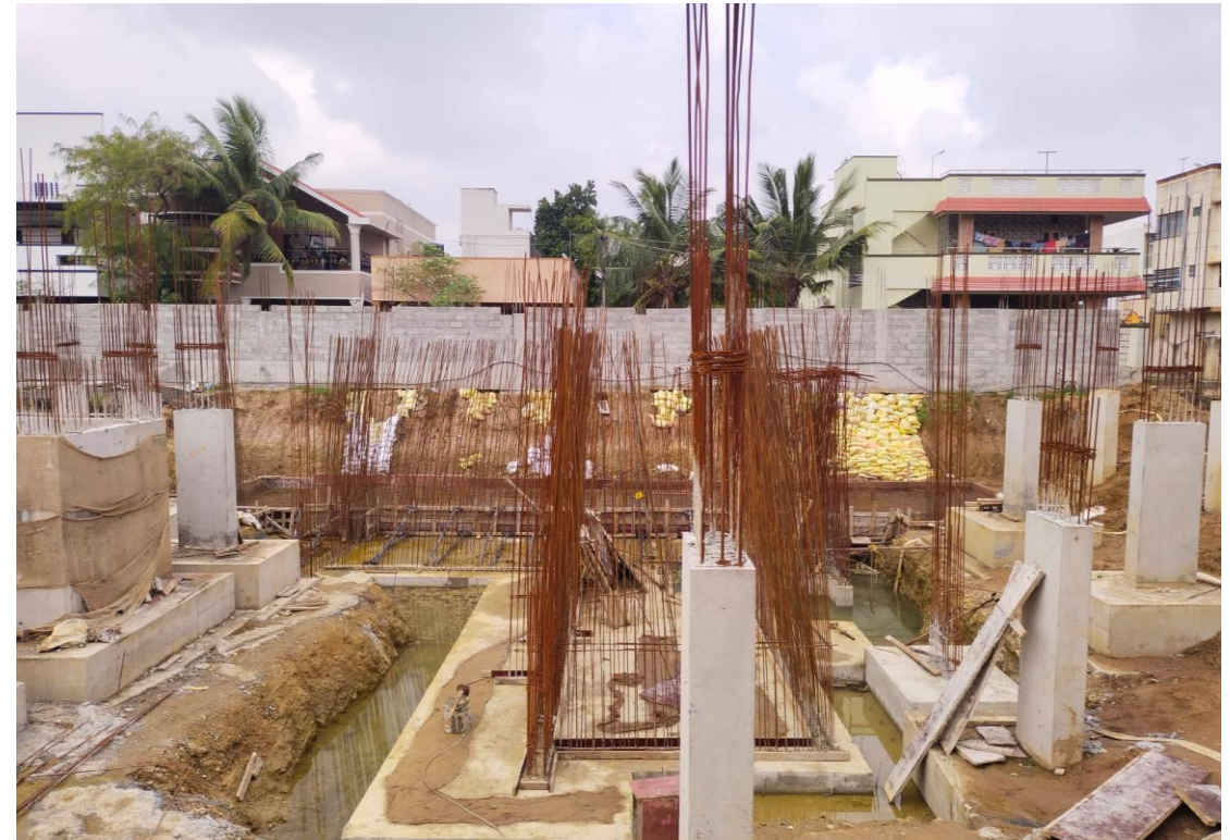
UG Sump- Raft Reinforcement & Shuttering & Concrete Work in Progress