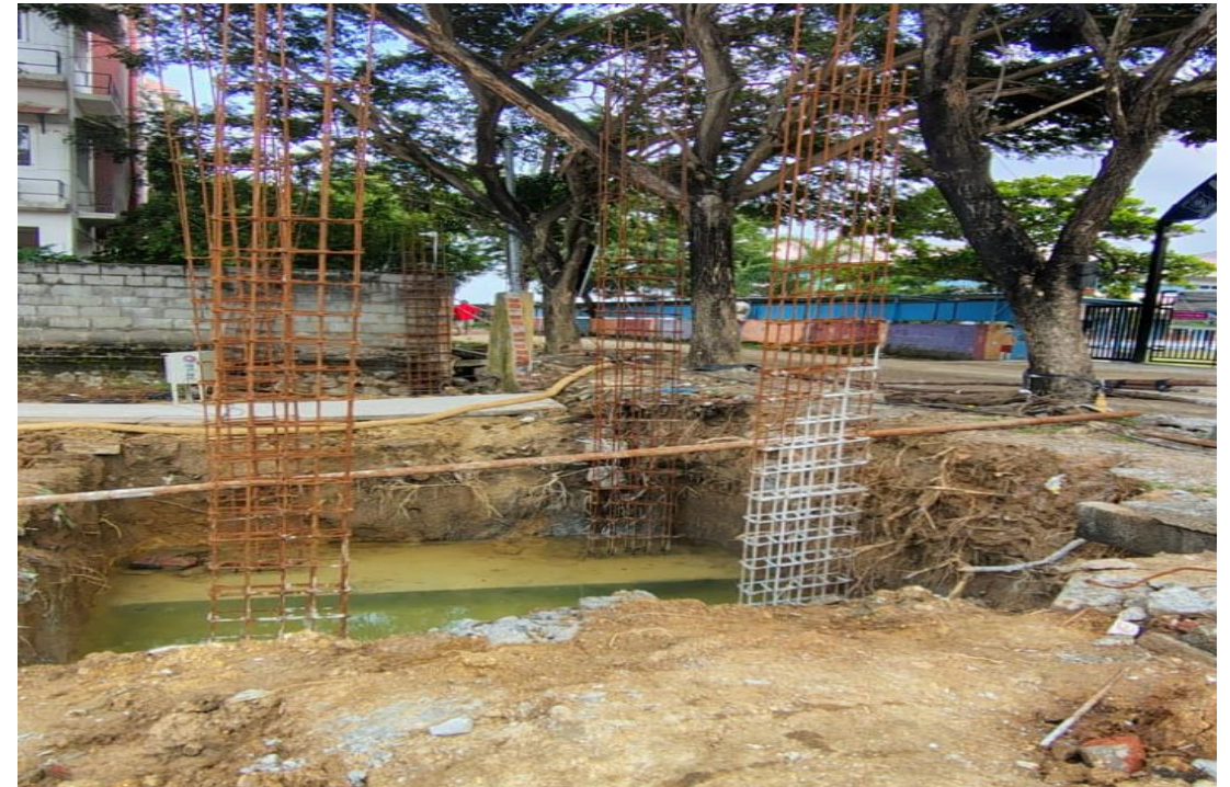
Entrance Arch Footing Concrete Work Completed