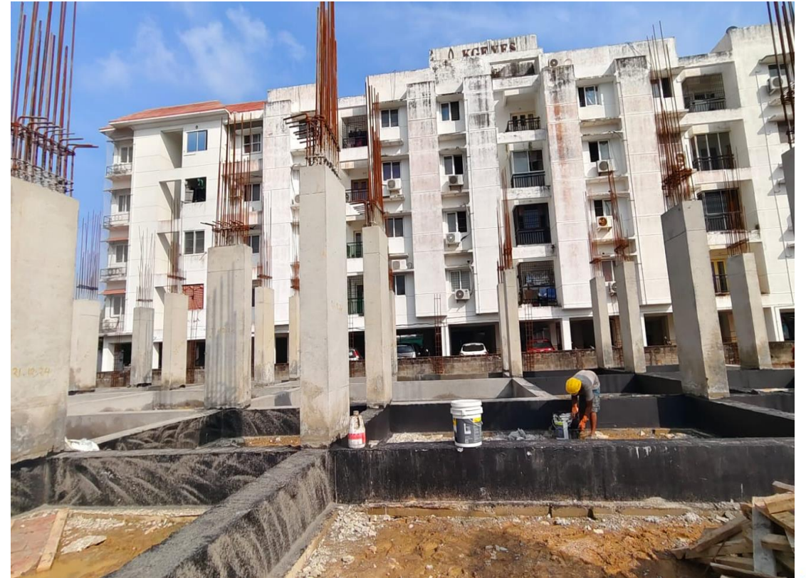
Block-3- Plinth Beam DPC & Protective Plastering Work in Progress