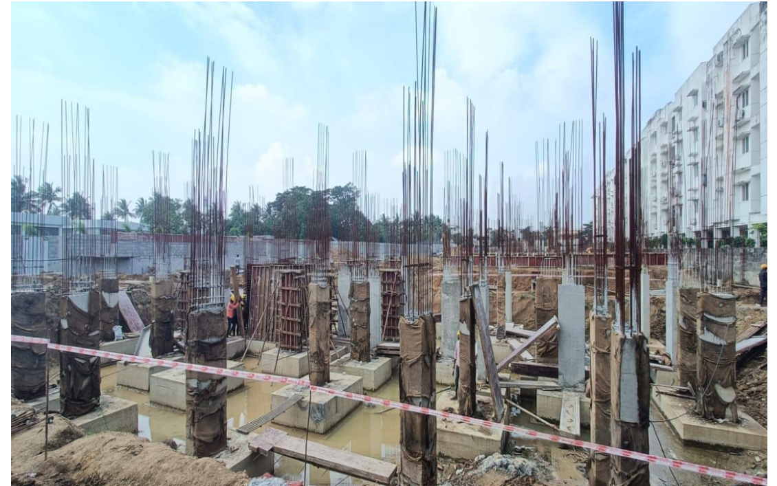
Block-1 Column Shuttering & Concrete Work in Progress