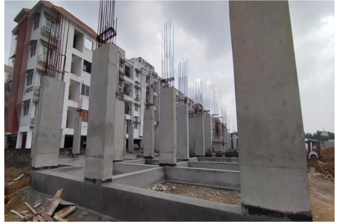
Block-3- Stilt Floor Column Reinforcement & Concrete Work in Progress