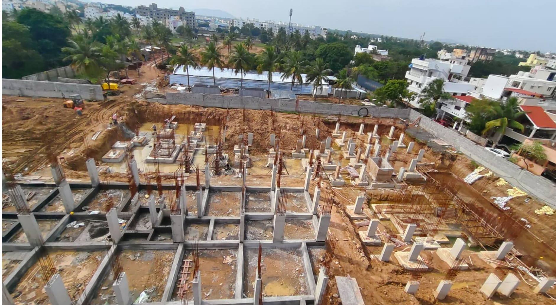
Block-2- Top View