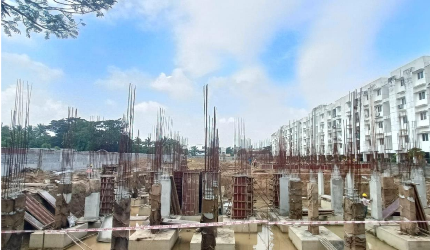
Site Front View