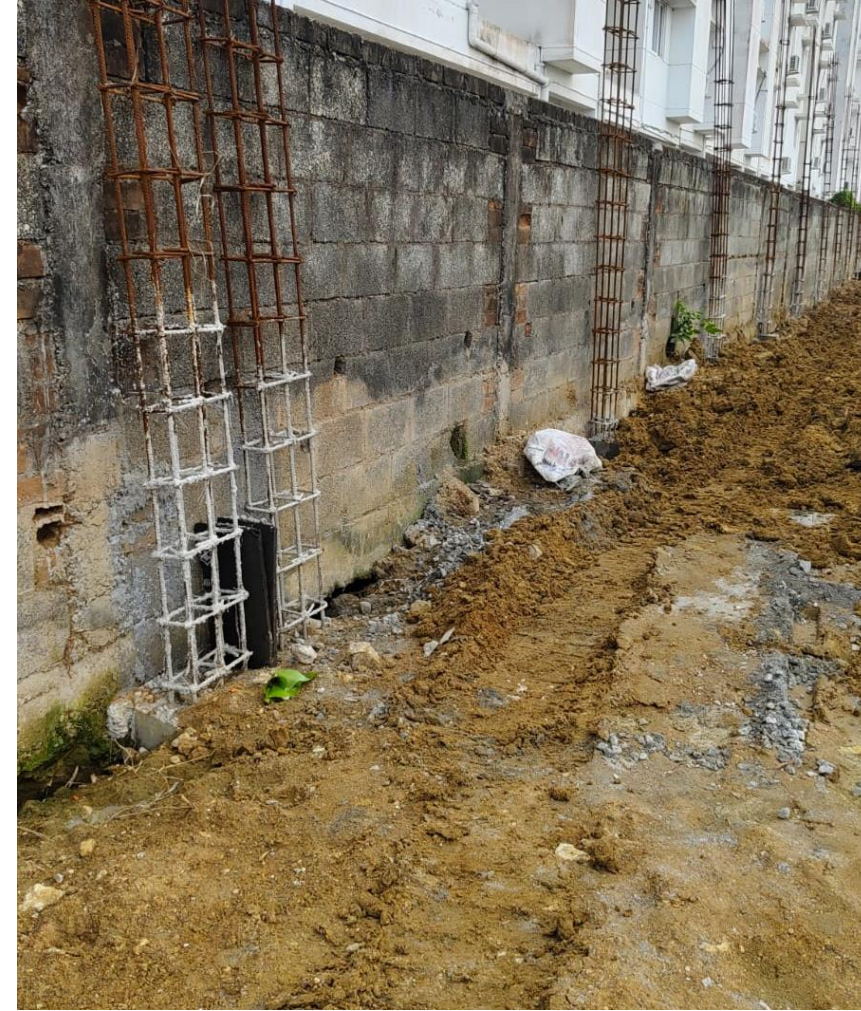
East Side Compound Wall Footing & Column Concrete Work in Progress