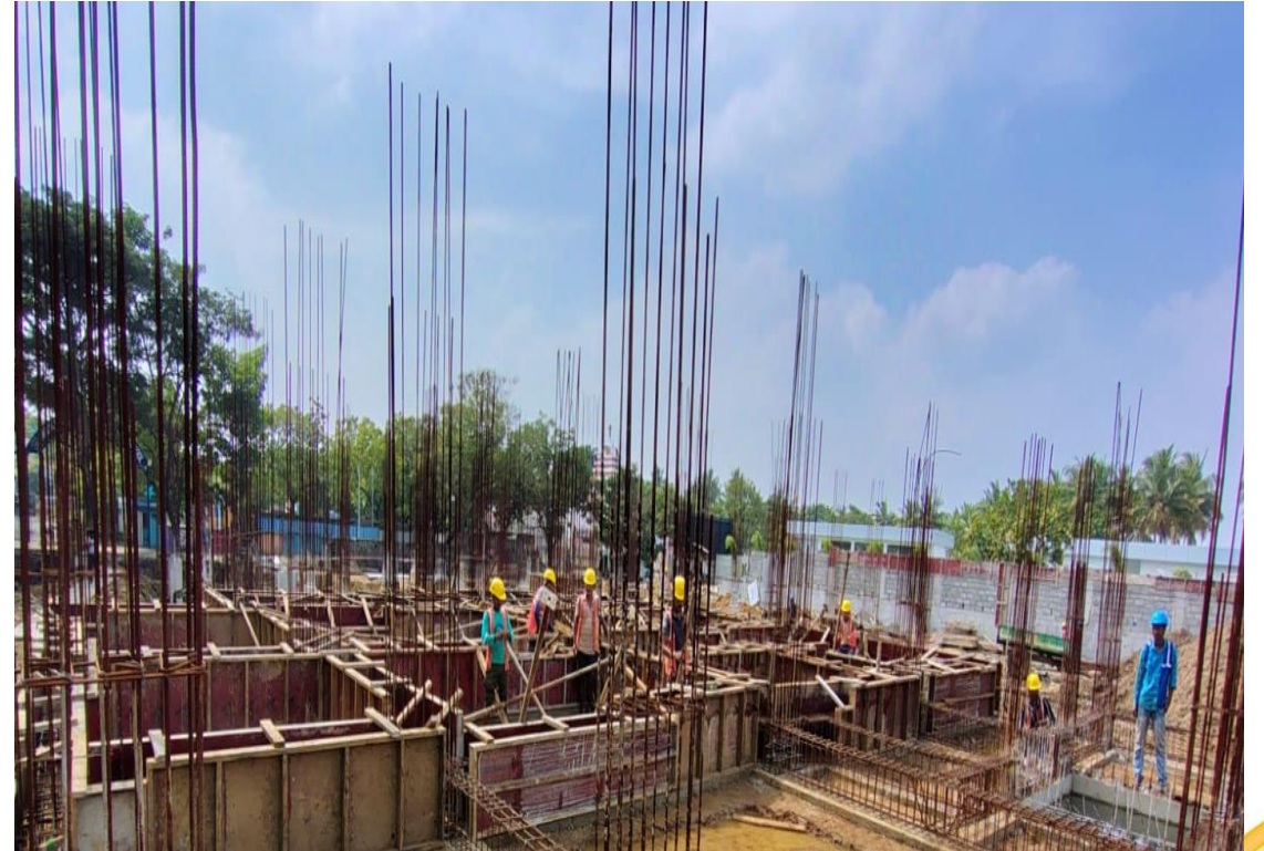
Block-4- Plinth Beam PCC & Shuttering work in Progress