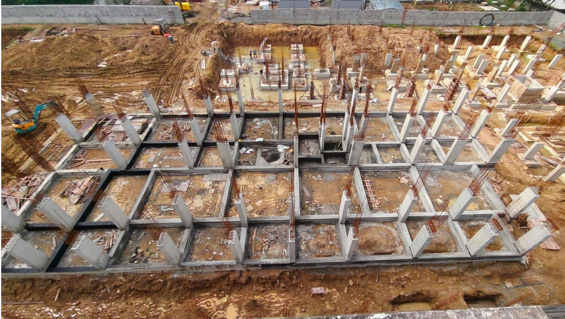
Block-3- Top View