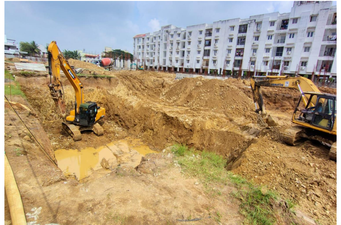
Block-1-STP Excavation Work in Progress