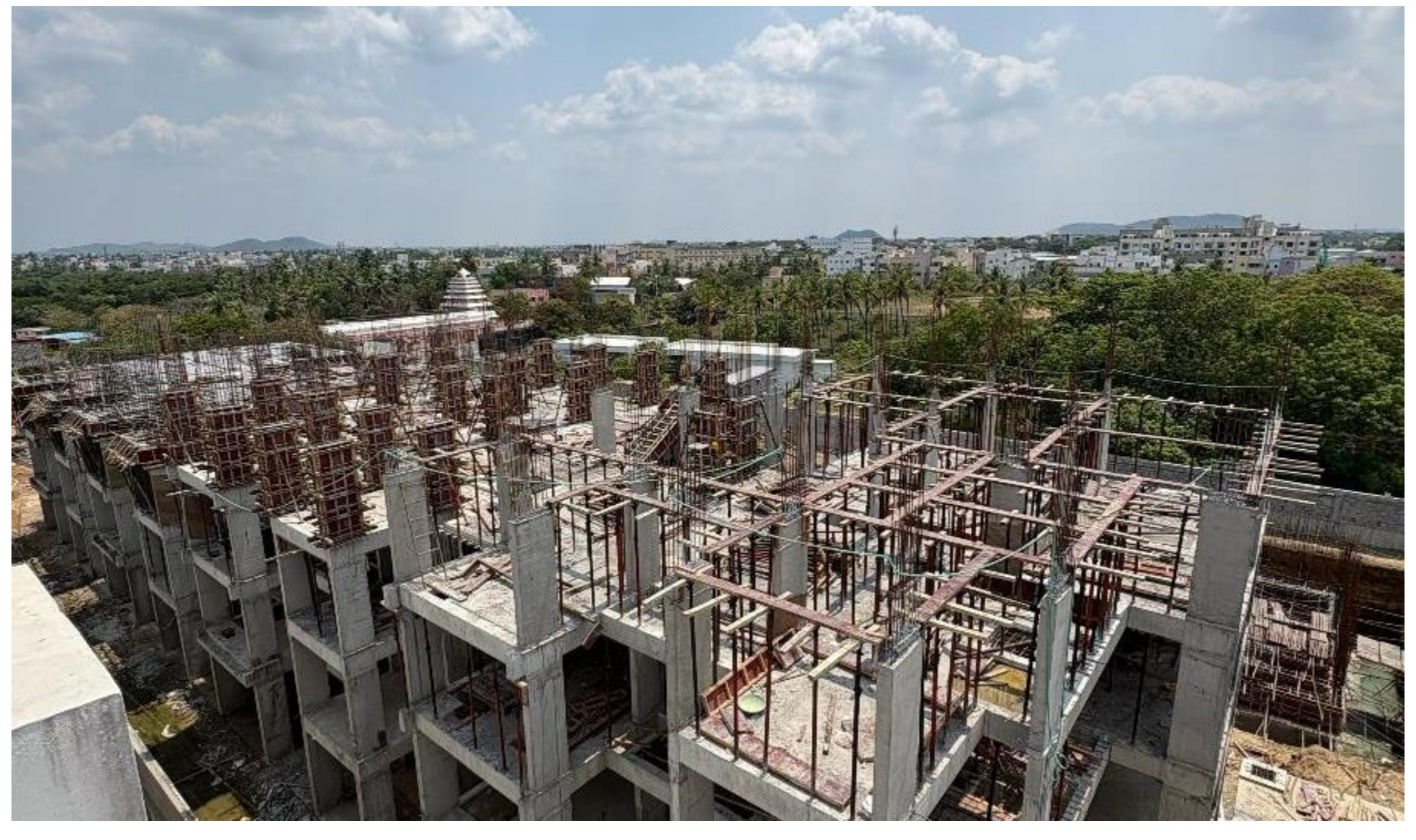
Block-4- Top View