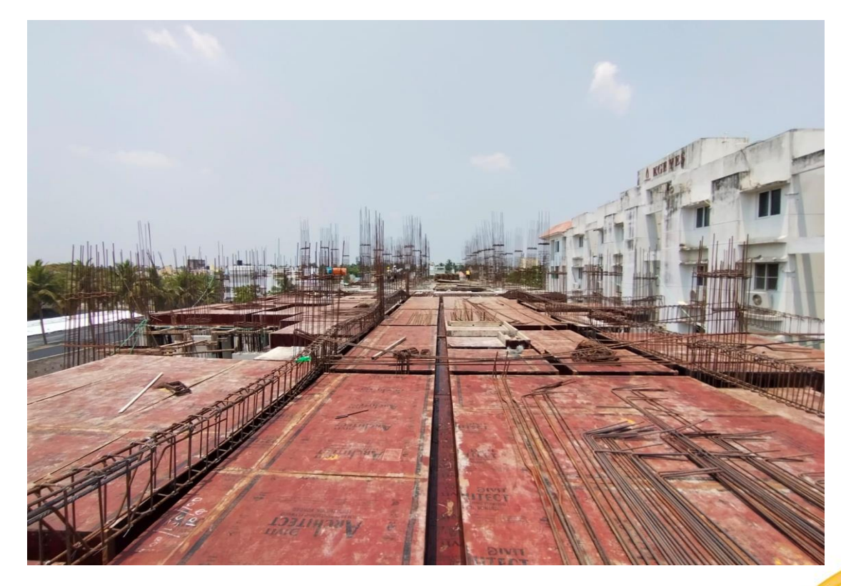
Block-3-Pour 2- Fourth Floor Beam Reinforcement Work in Progress