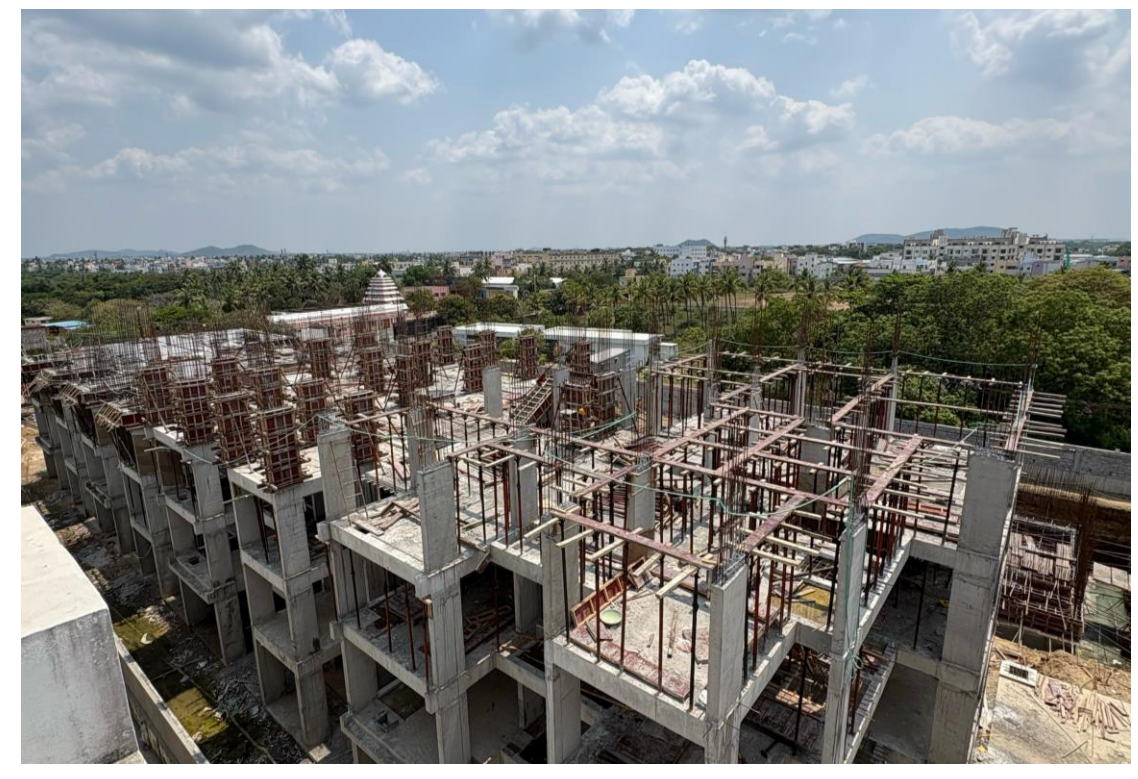
Block-4- Pour 1- Fourth Floor Slab Shuttering Work in Progress