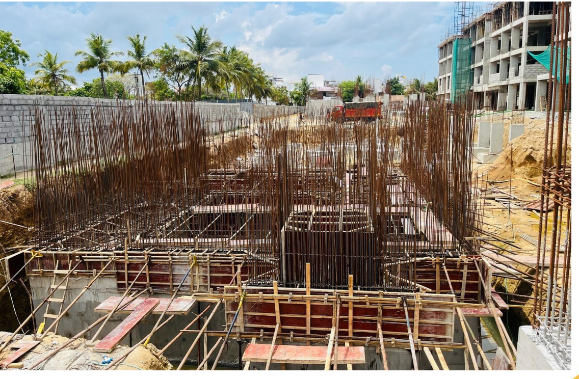
Block-1-STP Wall Concrete Work in progress