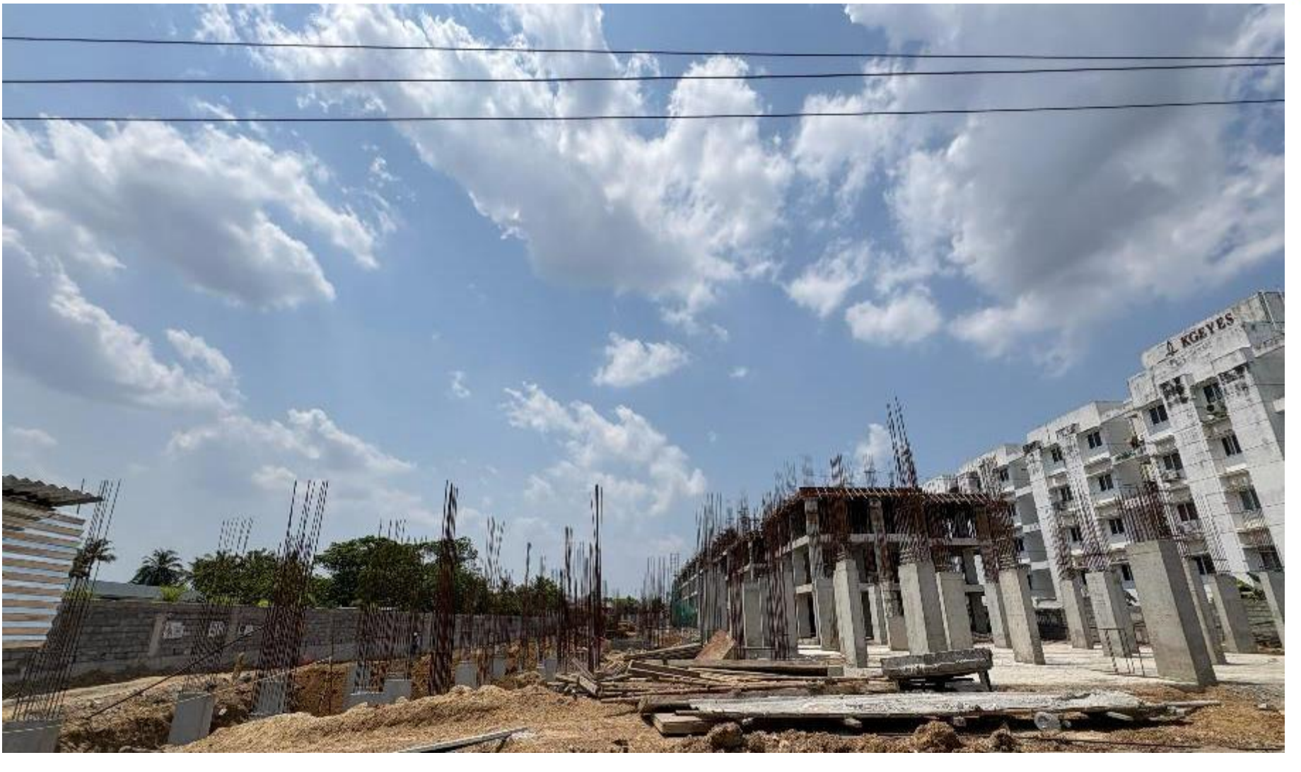
Site Front View