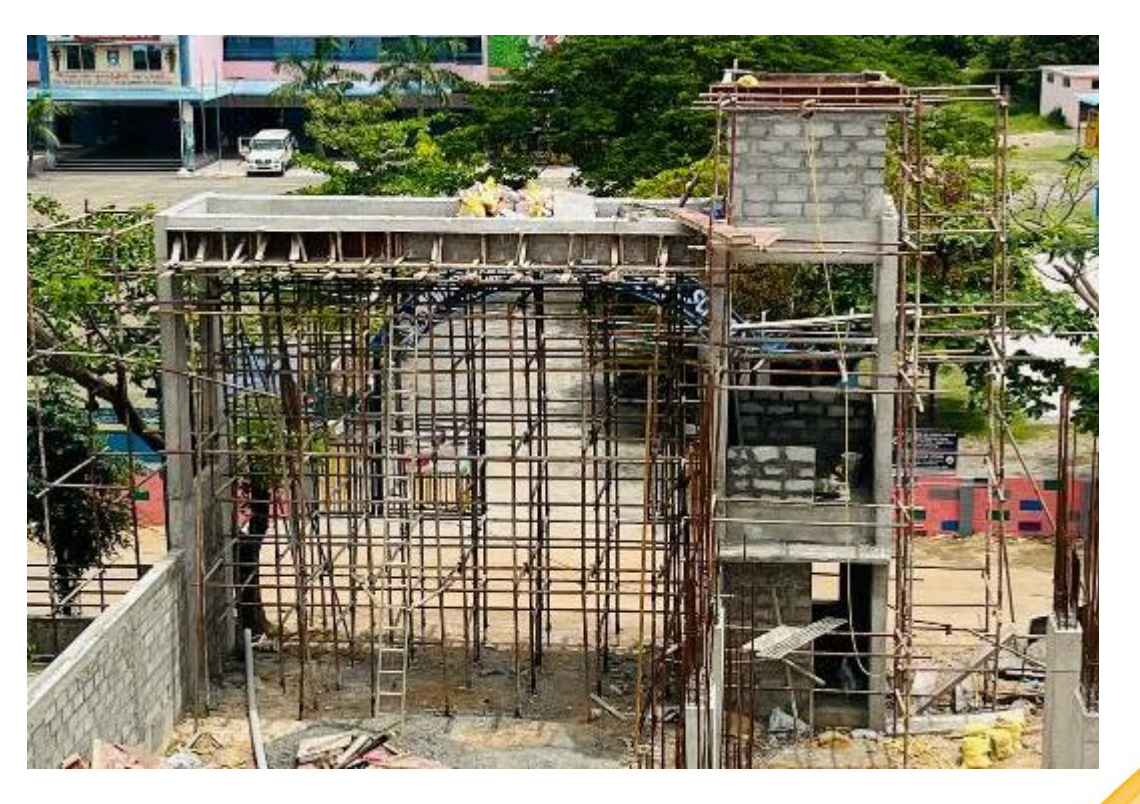
Exit Arch Block Work in Progress