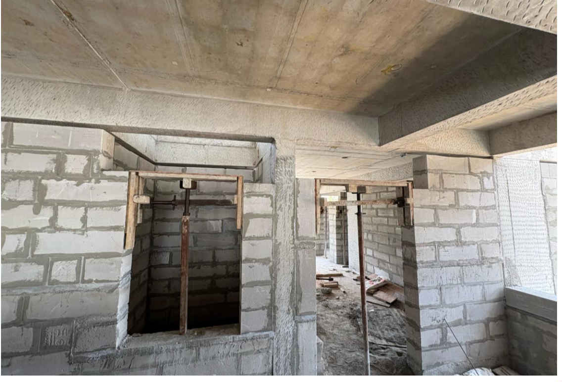
Block-3- First Floor Block work in Progress