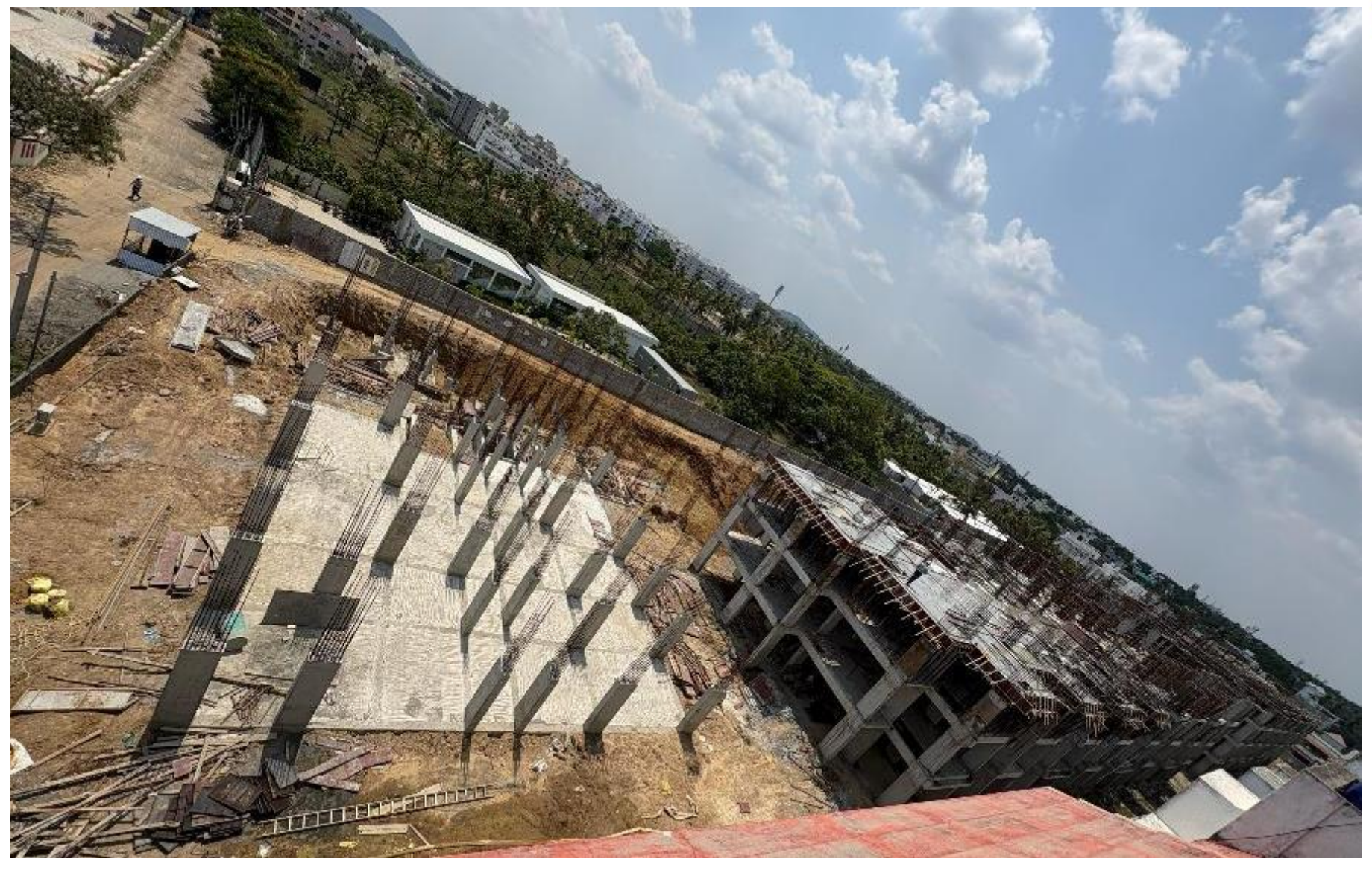
Site Top View