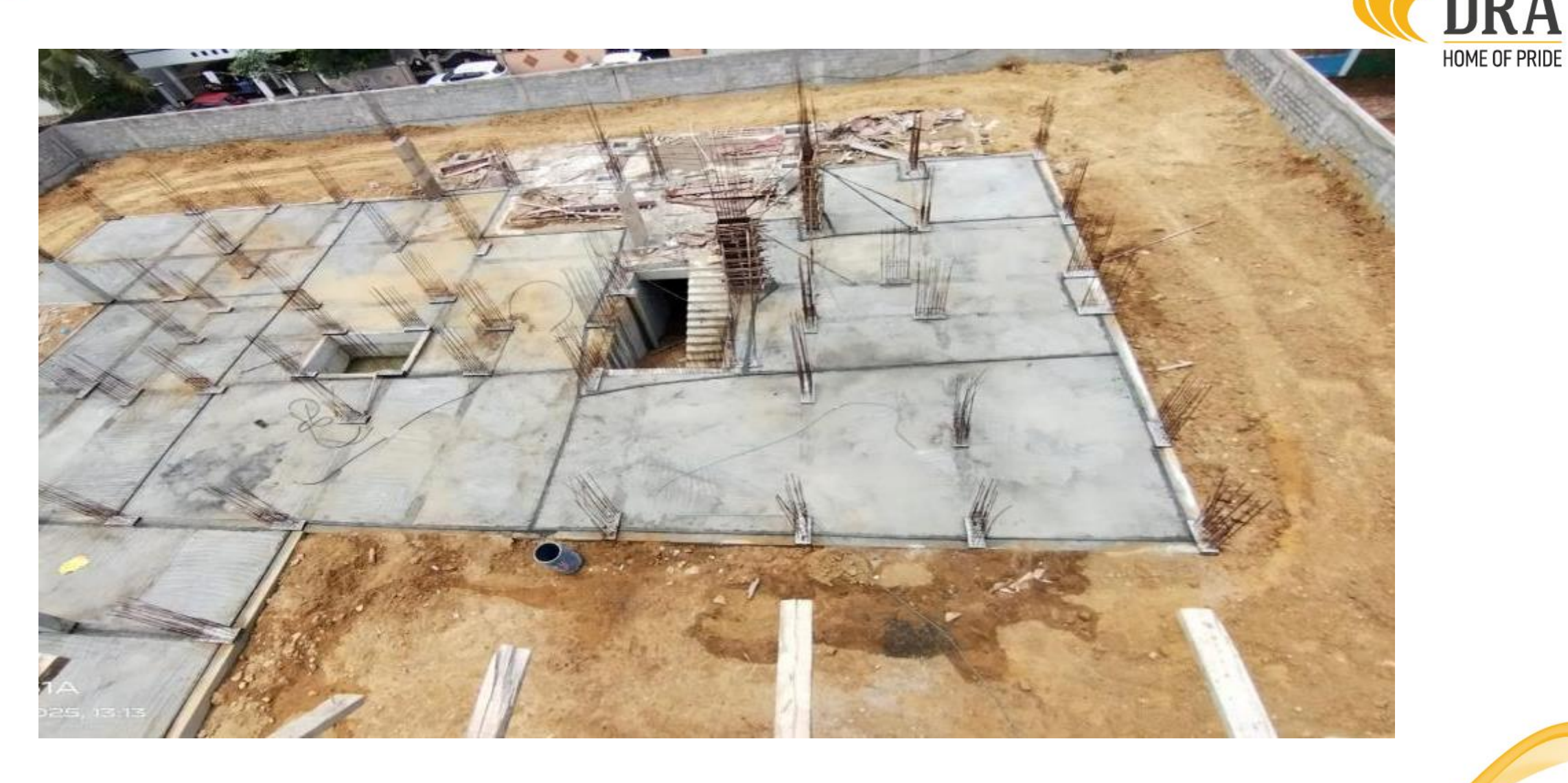
Block-2- Pour 1 - Stilt Floor Pcc Work Completed