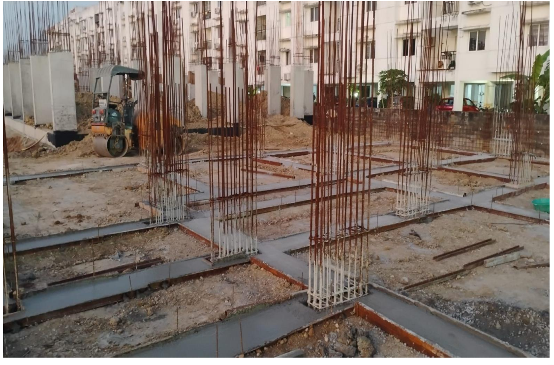
Block-1-Pour 1 Plinth beam Pcc Work in Progress