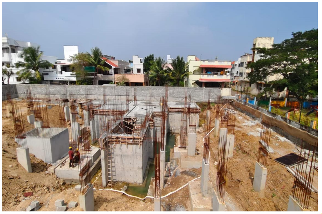
UG Sump- Cover slab concrete completed & Outer waterproofing Work in Progress