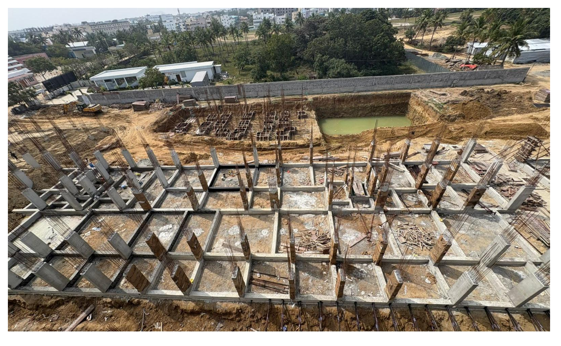
Block-4- Top View