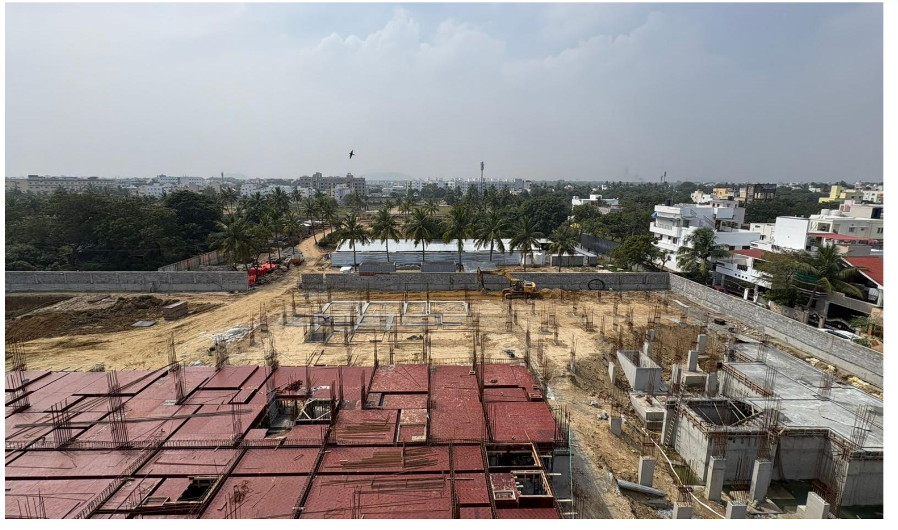
Block-2- Top View