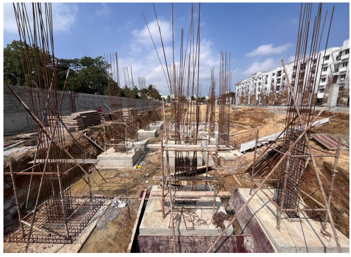
Block-1-Pour 2 Footing Concrete Work in Progress