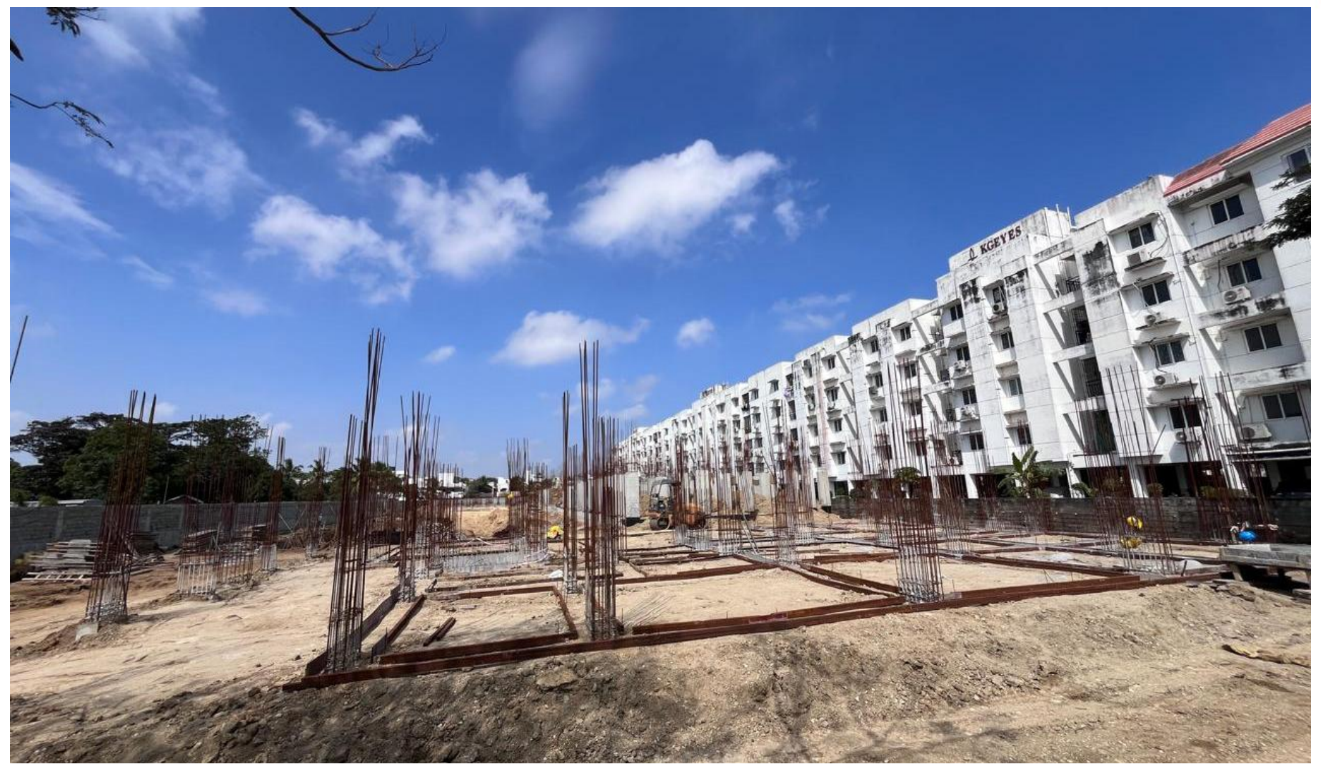
Site Front View