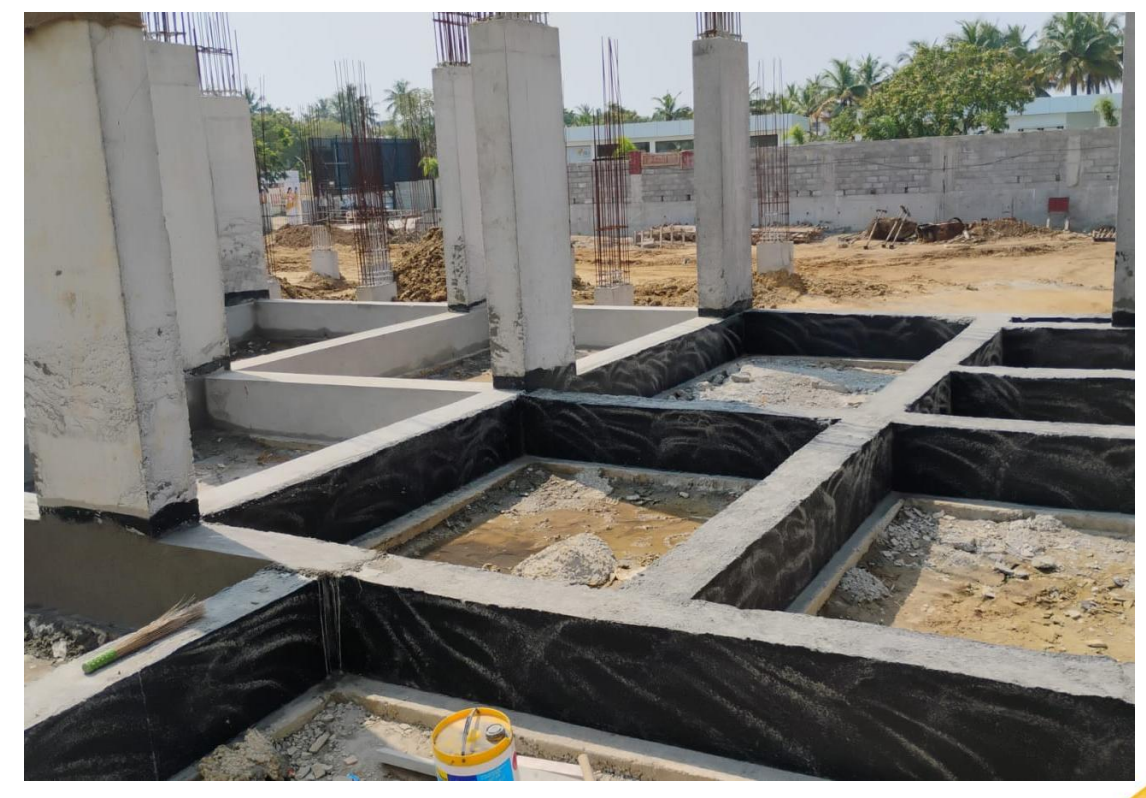
Block-4- Stilt floor column concrete Work completed & DPC work in Progress