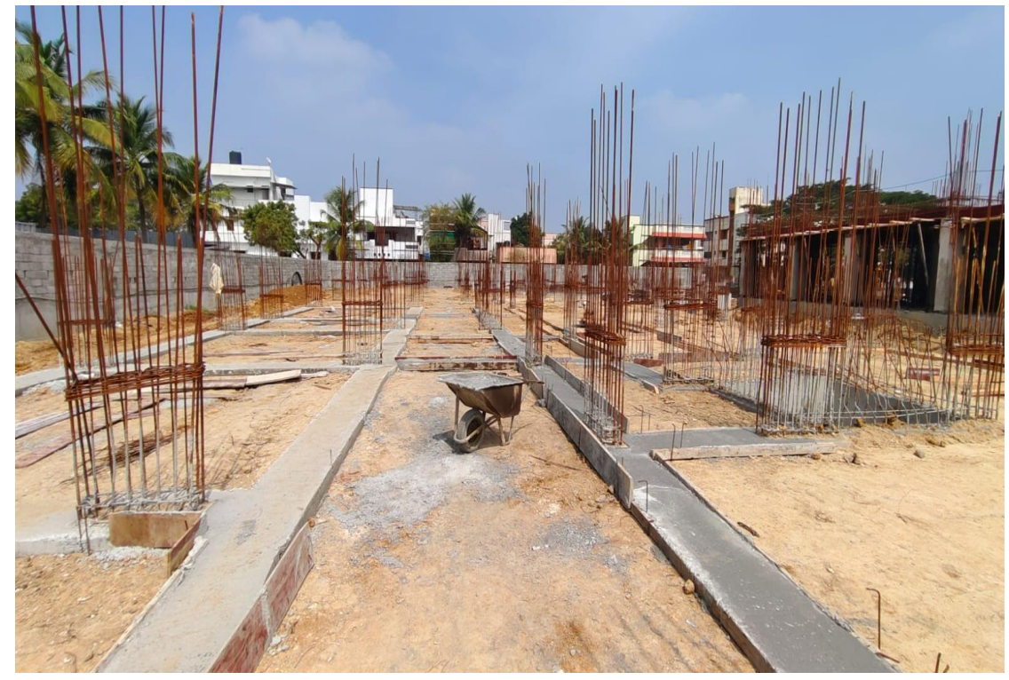
Block-2-Pour 1&2- Backfilling & Plinth beam pcc work in progress