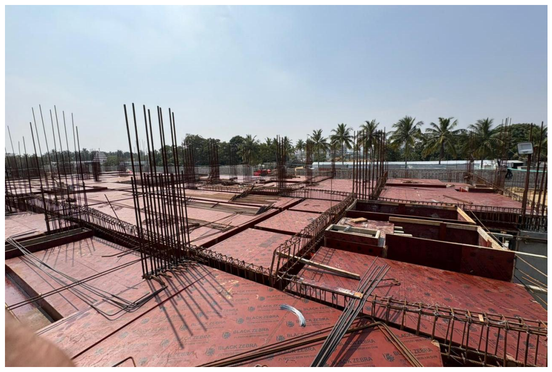
Block-3-Pour 1-Stilt Floor Roof Slab Shuttering & Reinforcement Work in Progress