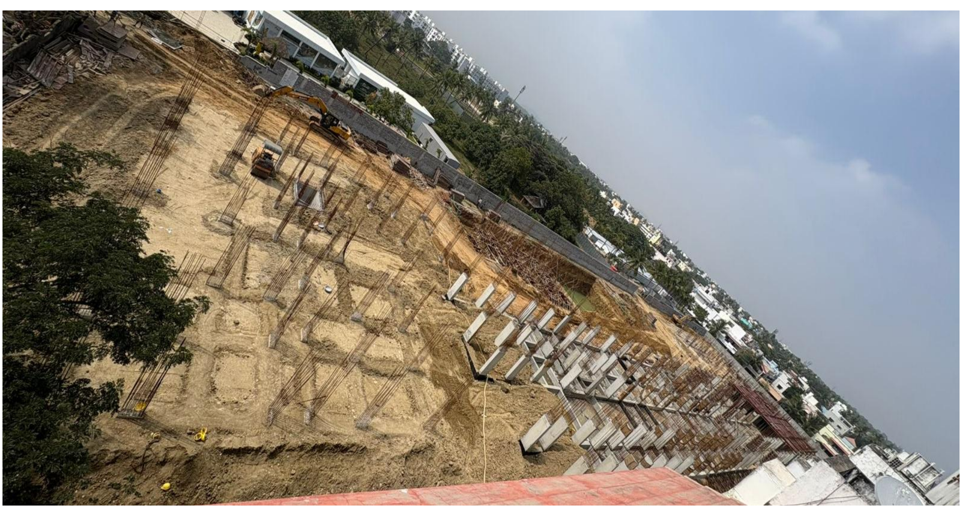
Site Full Top View