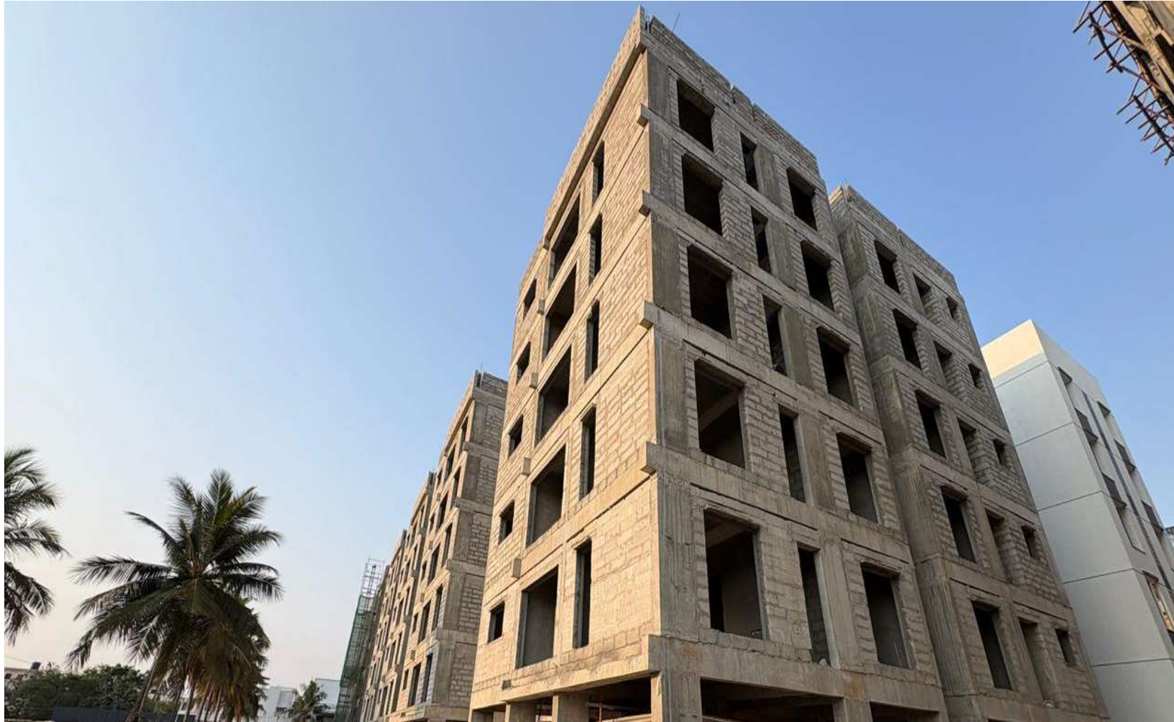
Block-02 – Elevation View