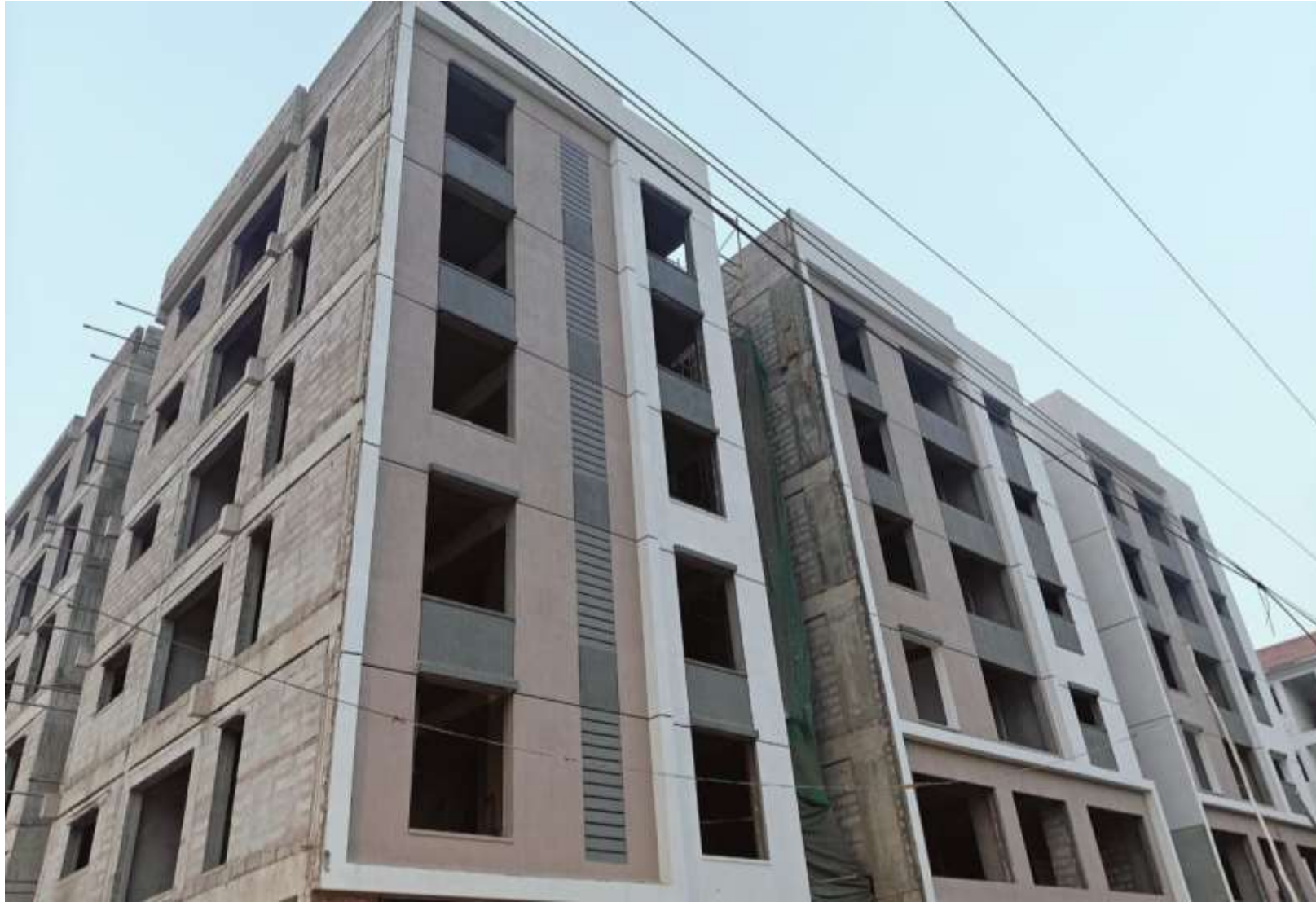
Block-01 – Elevation View