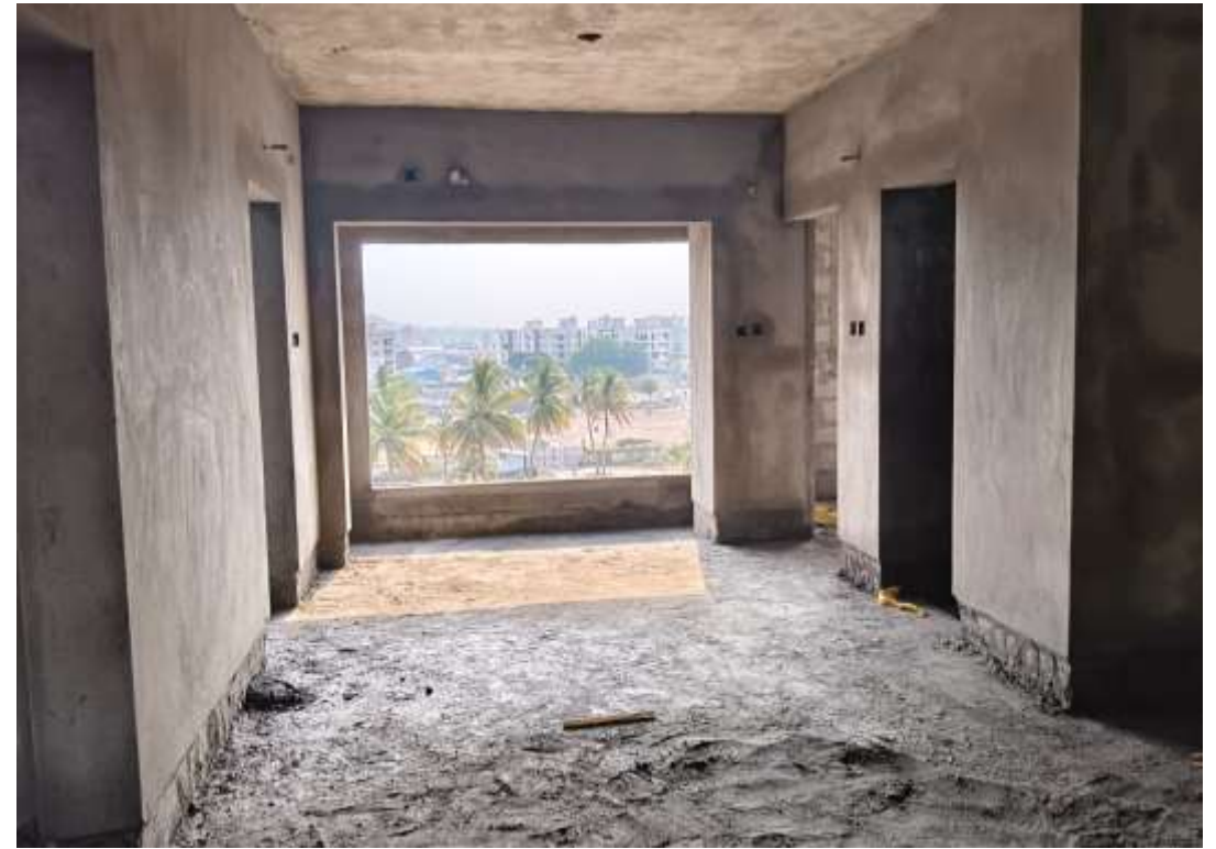
Block-02 – Pour-2 – 5 th Floor Plastering work in progress