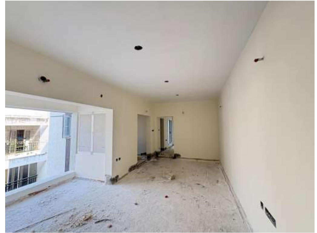
Block-03 – 5 th Floor Sanding Work in Progress