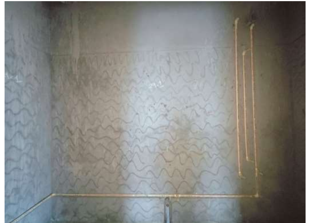
Block-01 – Pour-1 – 3 rd Floor Concealed Line work in Progress