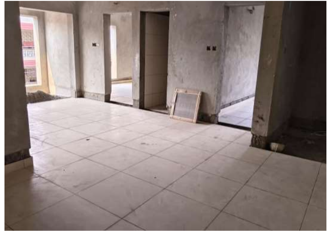
Block-02 – Pour-1 – 1 st Floor Tile Laying Work.