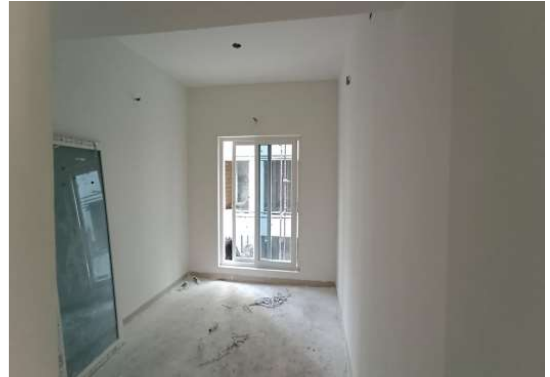
Block-04 – 3 rd Floor UPVC Window Fixing Work in Progress