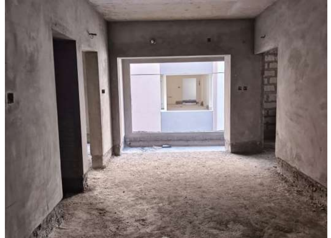
Block-02 – Pour-2 – 4 th Floor Plastering Work in Progress