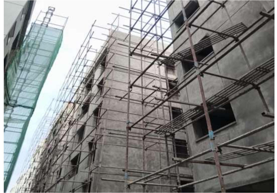
Block-02 – Pour-2 – External Plastering work in progress