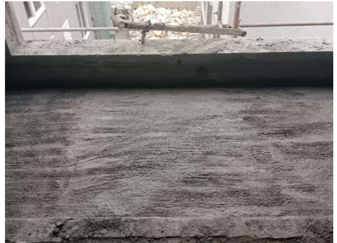
Block-01 – Pour-1 – 1 st to 4 th Floor Sunken Filling work in Progress