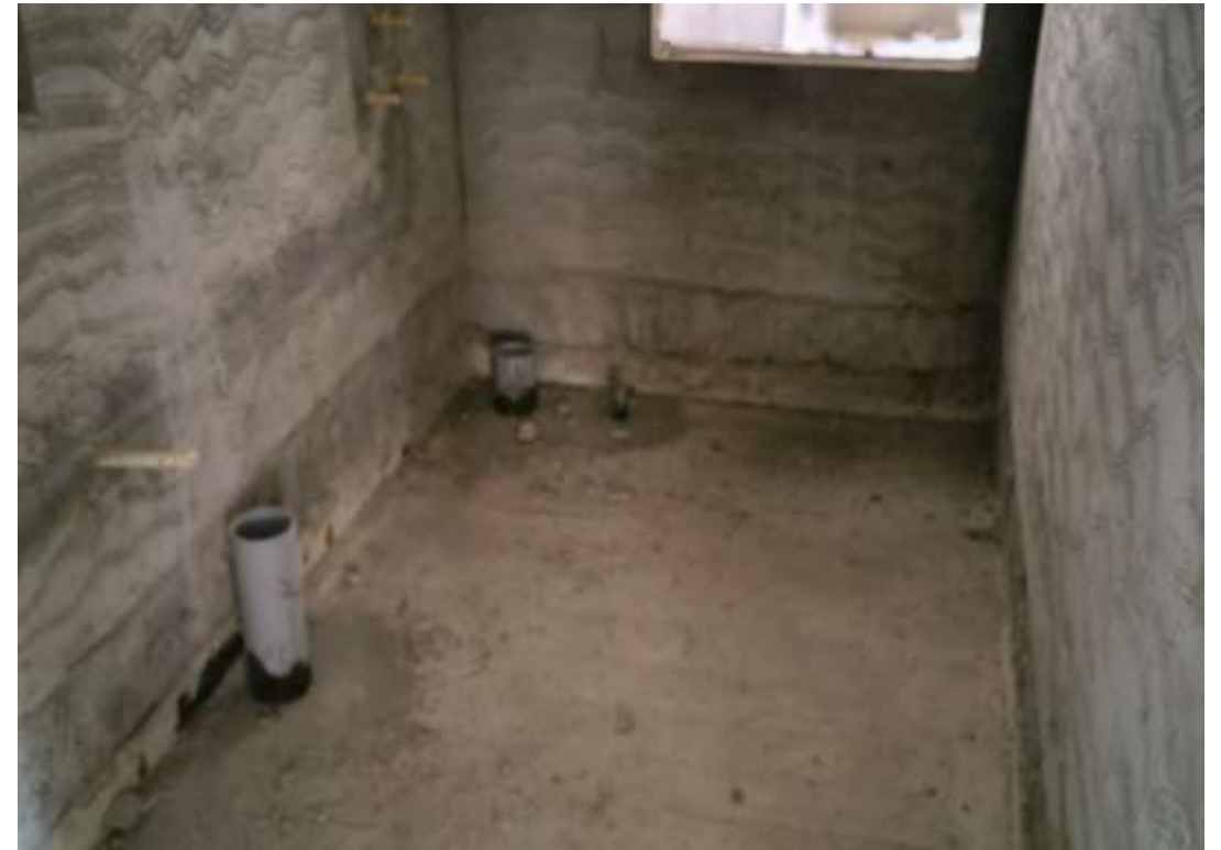
Block-02 – Pour-2 – 1 st to 3 rd Floor Water proofing Work in Progress.