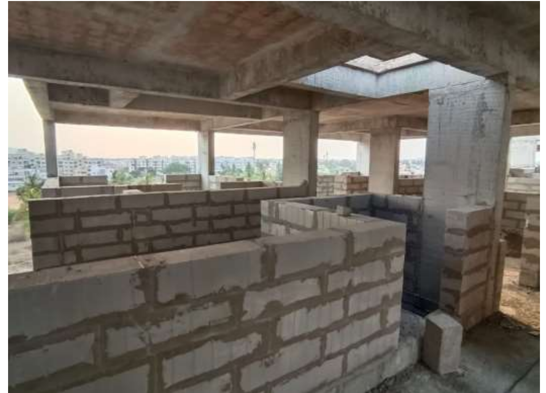
Block-01 – Pour-2 – 5 th Floor Block Work in Progress