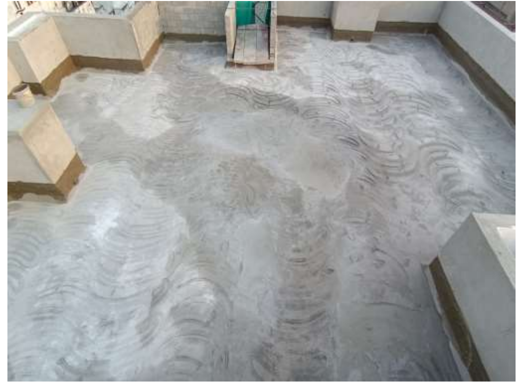
Block-04 – Terrace Floor Protective Plastering Work Completed