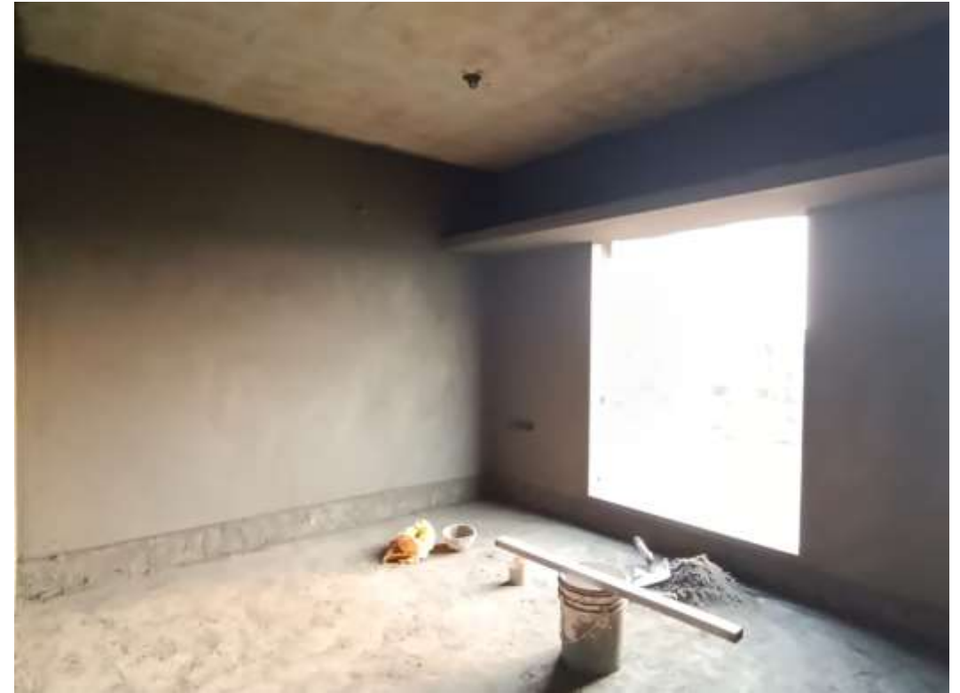
Block-01 – Pour-2 – 3 rd Floor Plastering Work in Progress