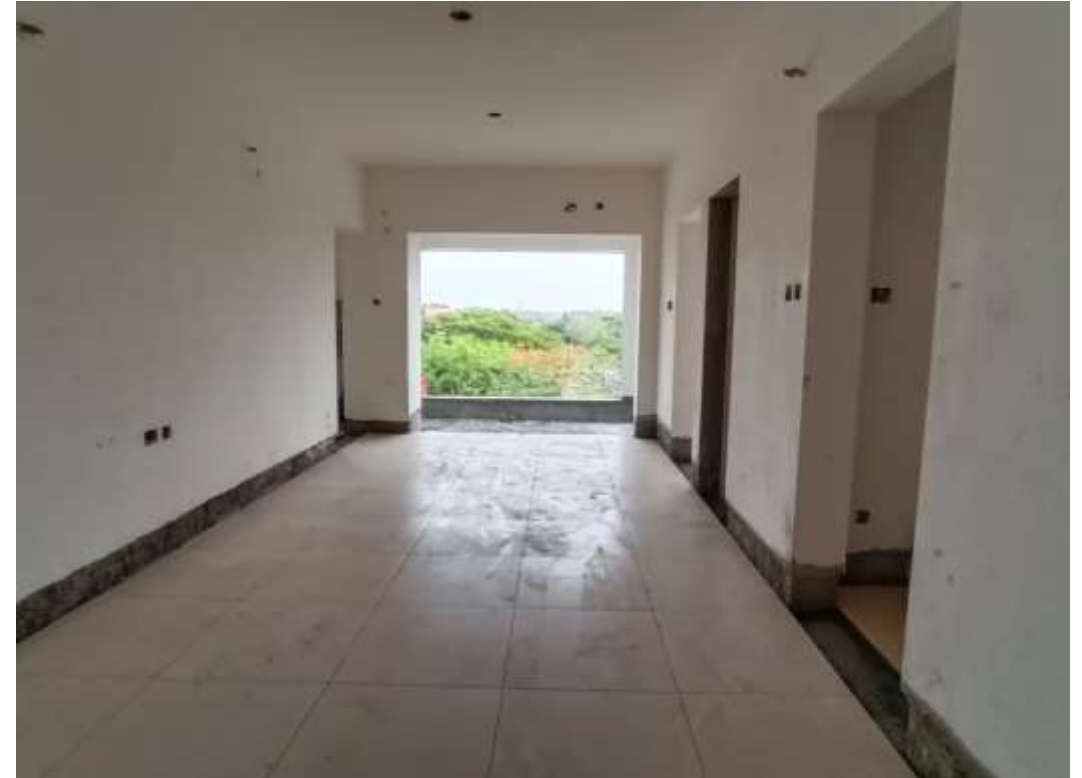
Block-01 – Mock up Flat work in Progress