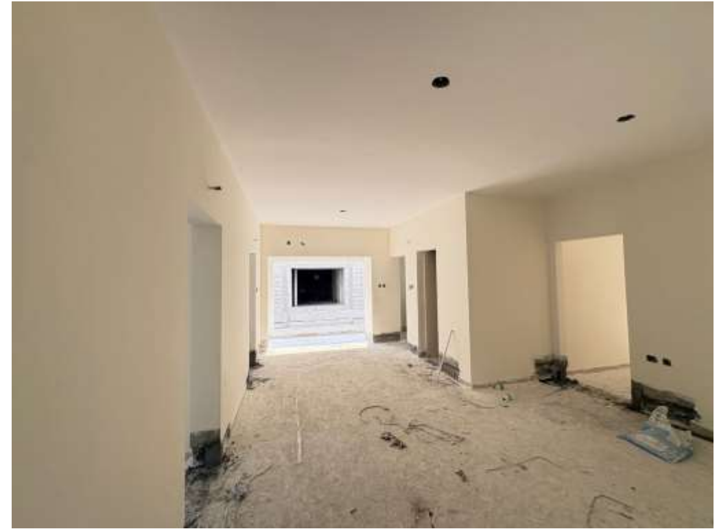
Block-03 – 4 th Floor 1 st Coat Painting Work Completed