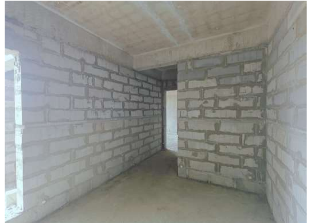
Block-01 – Pour-2 – 4 th Floor Block Work in Progress