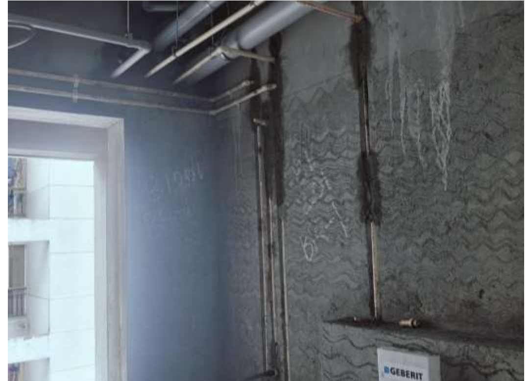
Block-01 – Pour-1 – 1 st Floor Suspended Pipe Line work in Progress