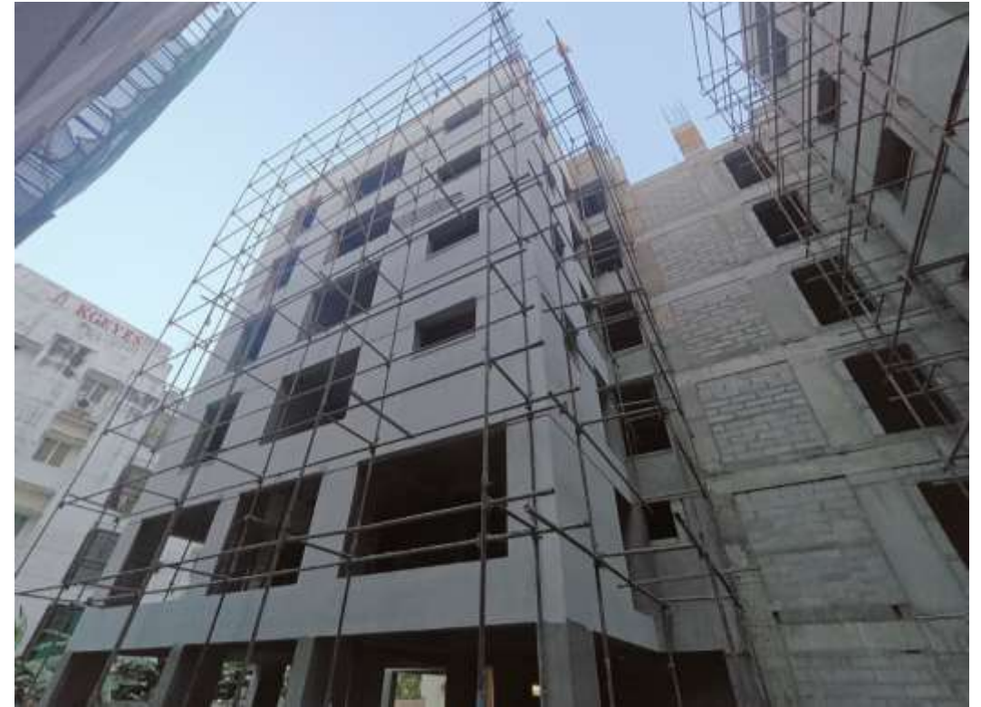
Block-01 – Pour-1 – External Texture Work in Progress