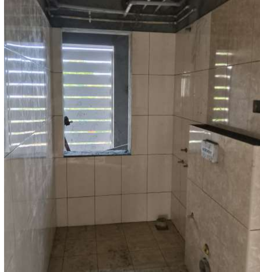
Block-02 – Pour-1 – 2 nd Floor Tile Laying Work.