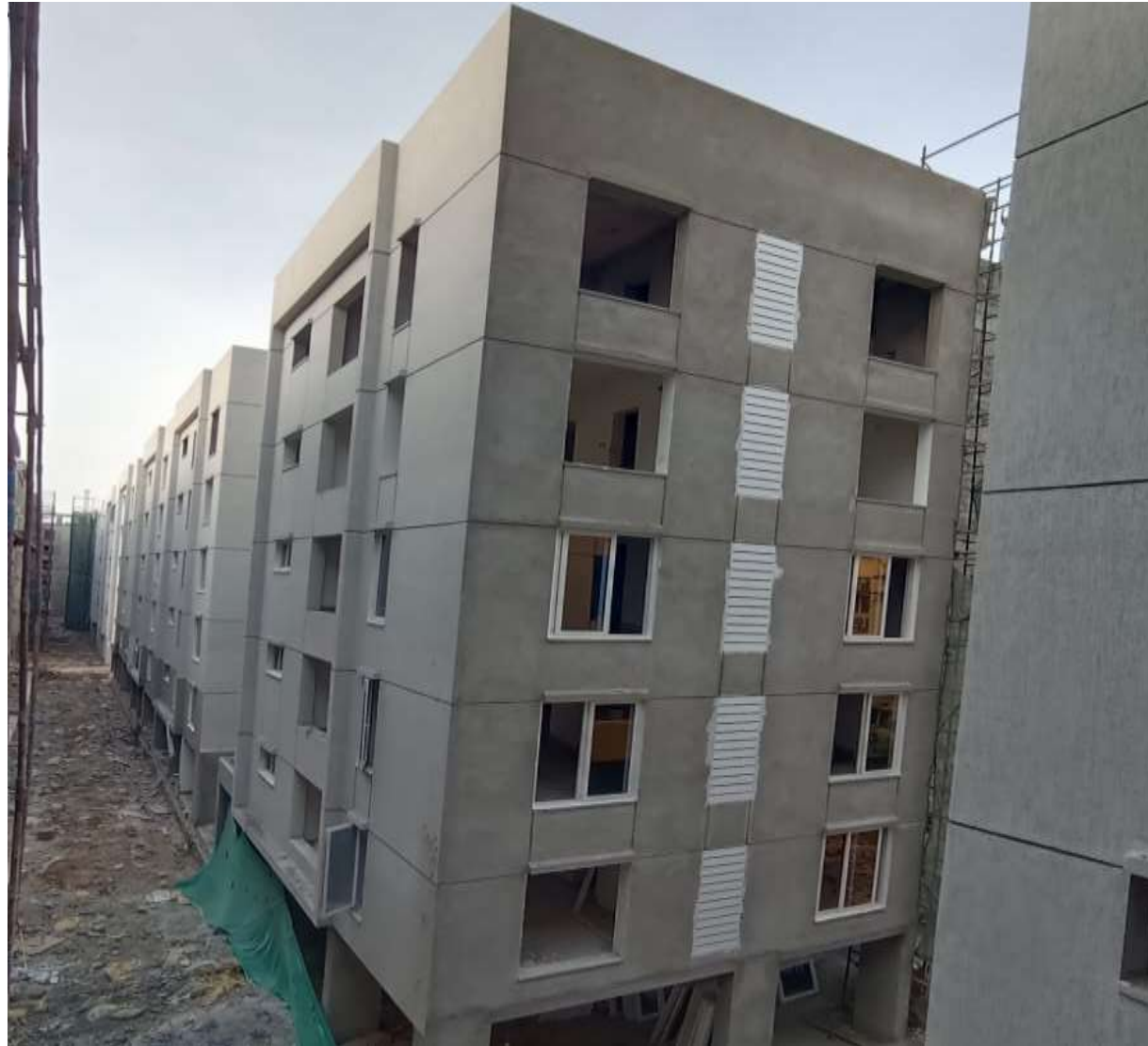
Block-04 – Elevation View