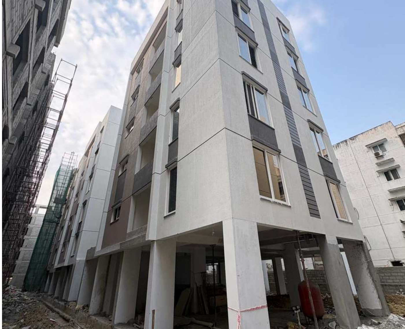
Block-03 – Elevation View