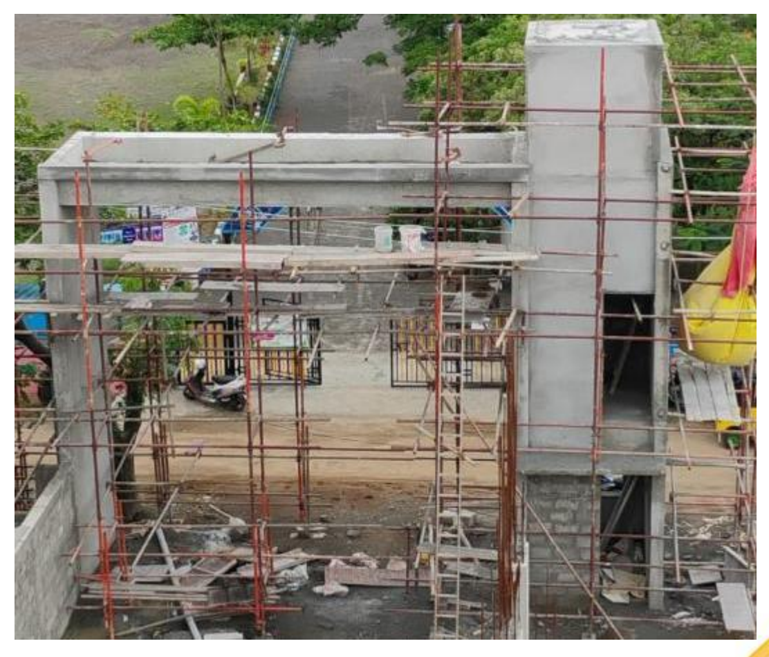
Exit Arch Outer Plastering work in Progress