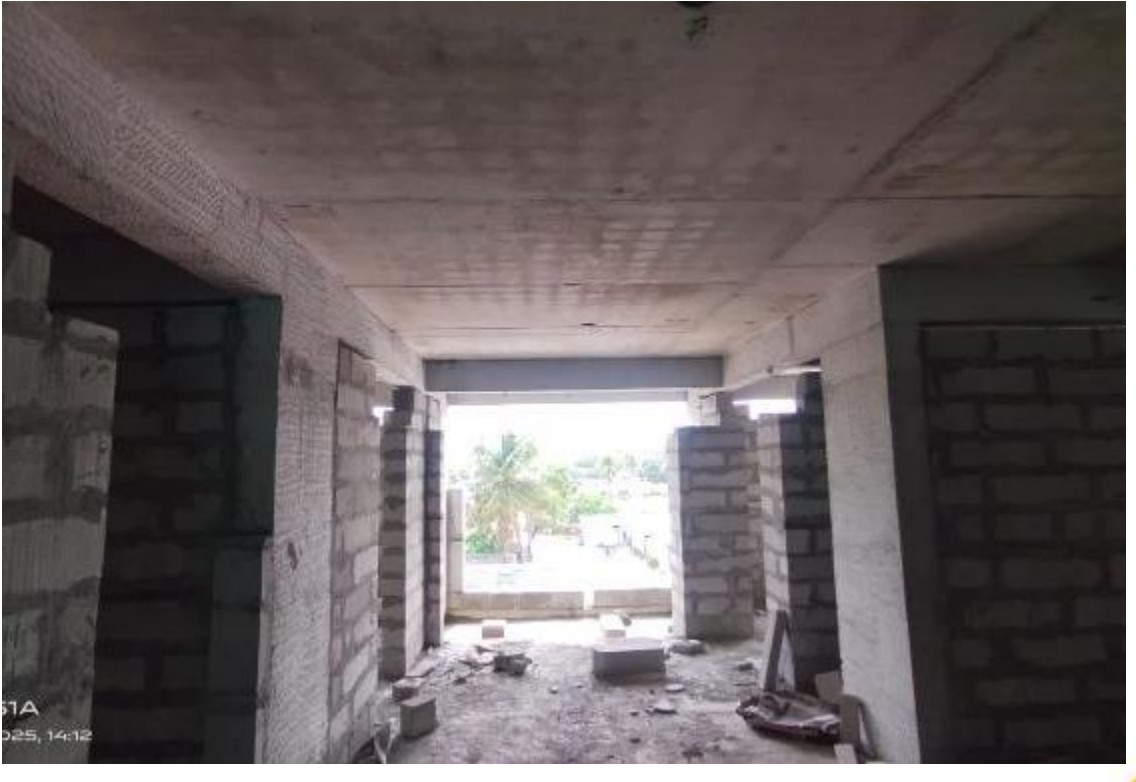
Block-3- First Floor Block work in Progress