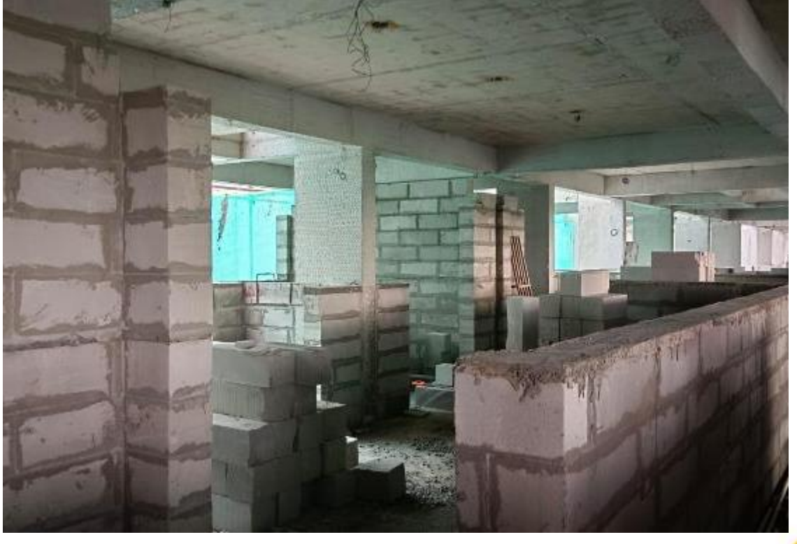
Block-3- Second Floor Block work in Progress