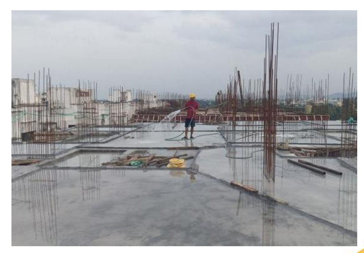
Block-3-Pour 2- Fifth Floor Slab Concrete Completed