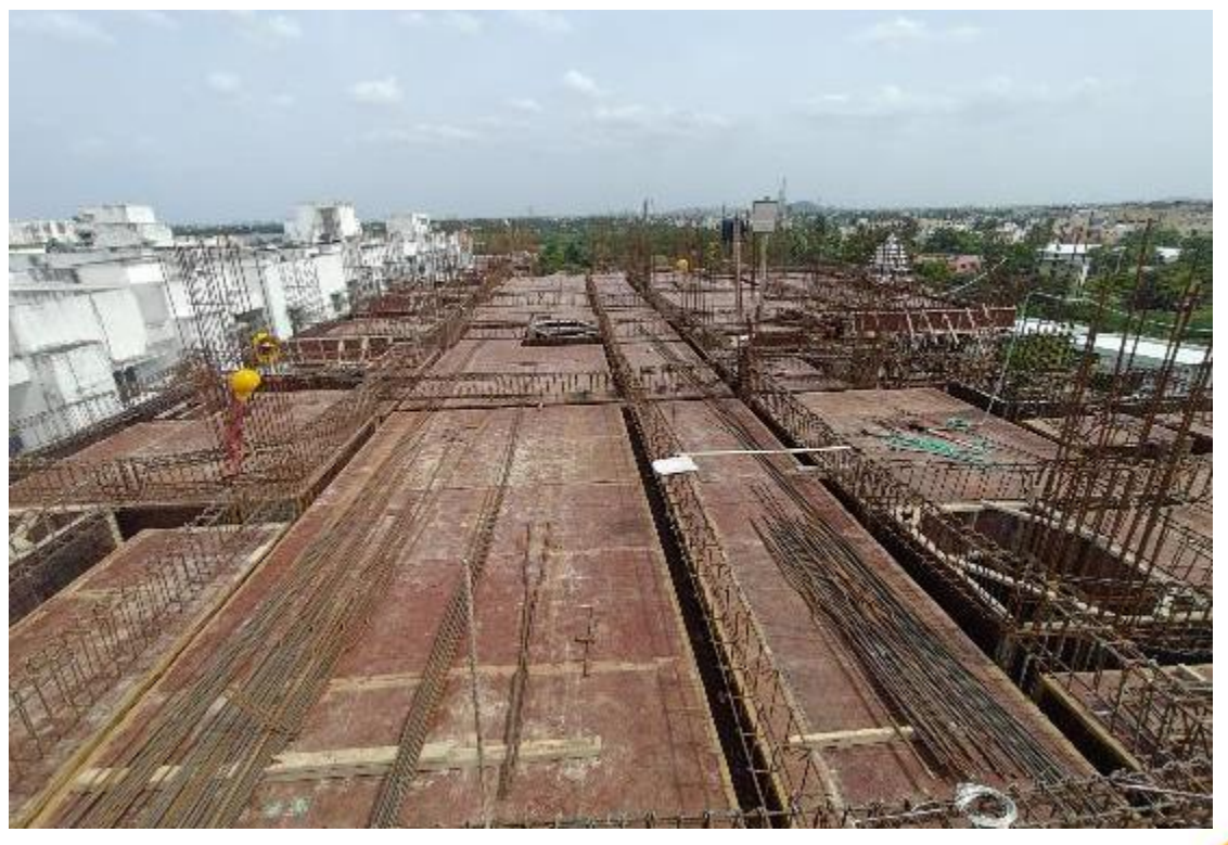
Block-4- Pour 1- Fifth Floor Beam Reinforcement Work in Progress