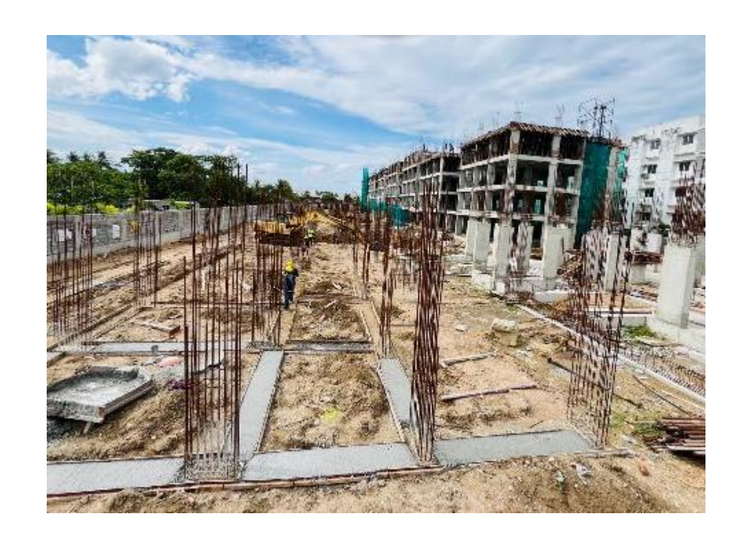
Block-1- Pour-1-Plinth Beam PCC & Sub Structure Column Concrete Work in Progress