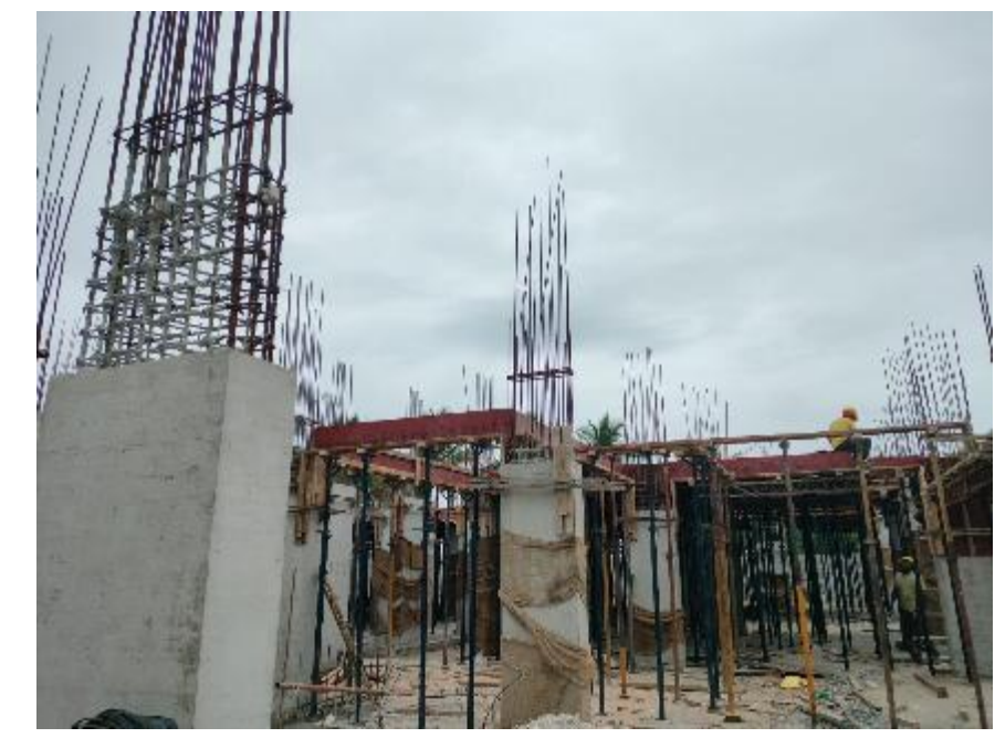
Block-2- Pour 1 - Stilt Floor Column Concrete Work Completed