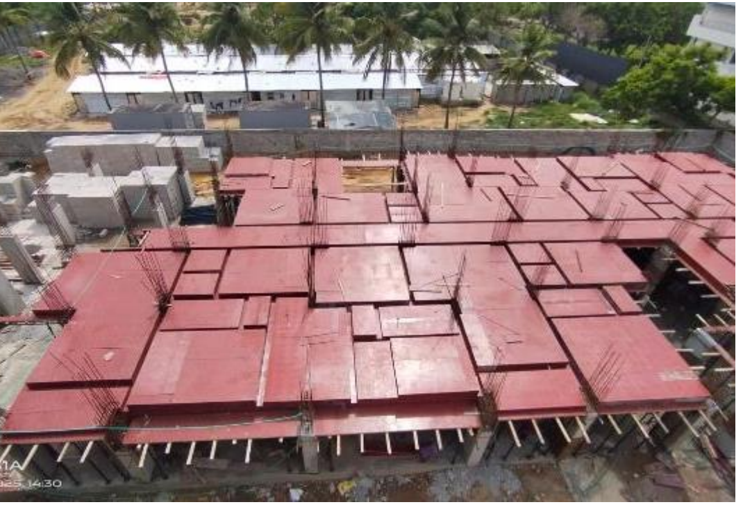
Block-2-Pour 1- First Floor Slab Work in Progress