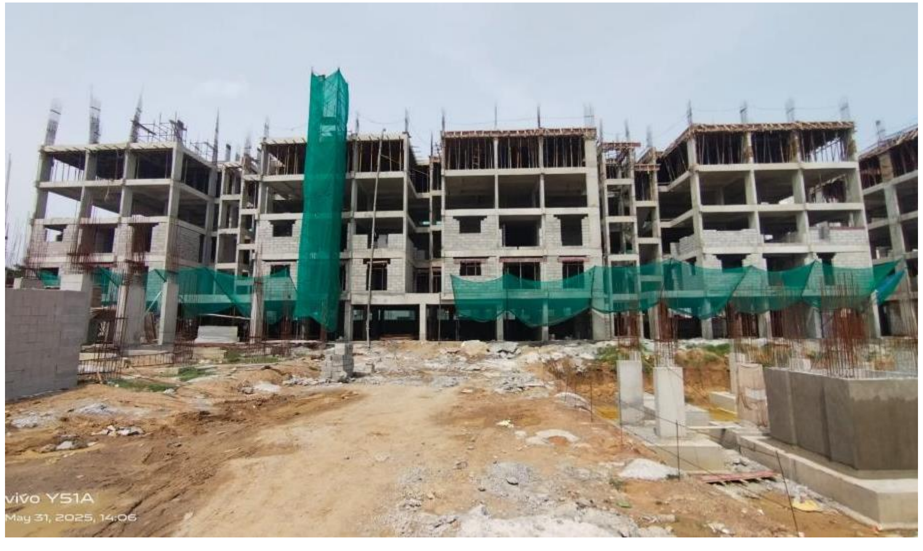
Block-3- Elevation View