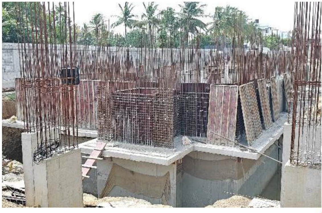
Block-1-STP Third Lift Wall Concrete Work in progress