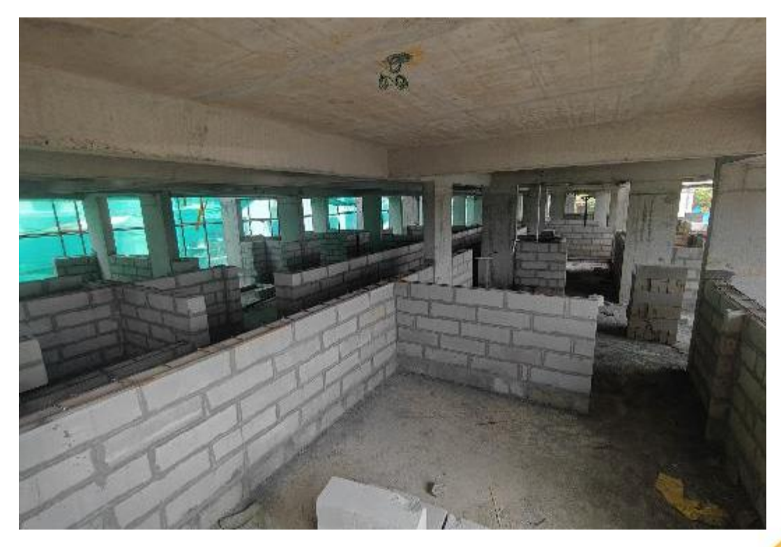
Block-4- First Floor Block Work in Progress