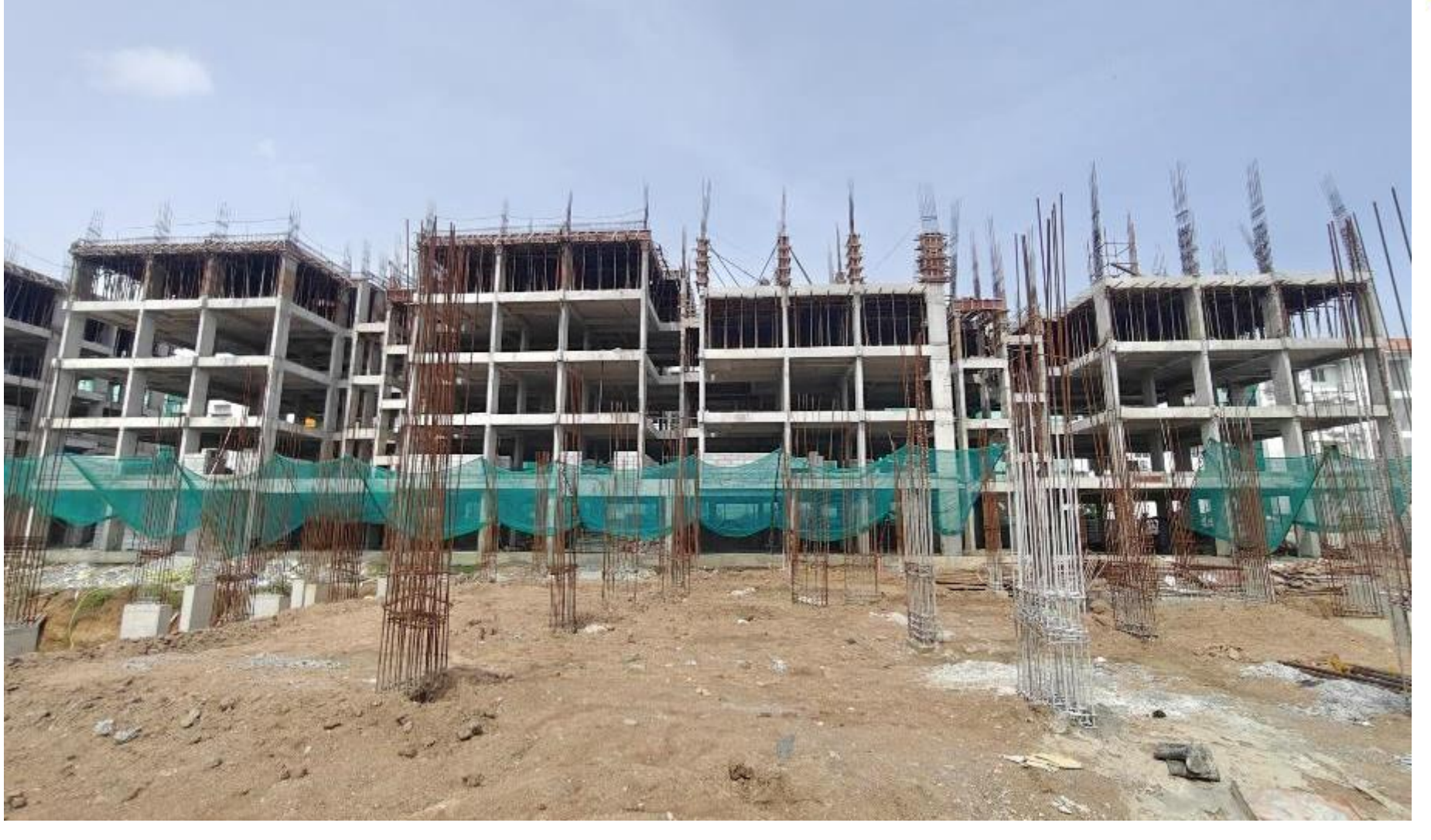
Block-4- Elevation View