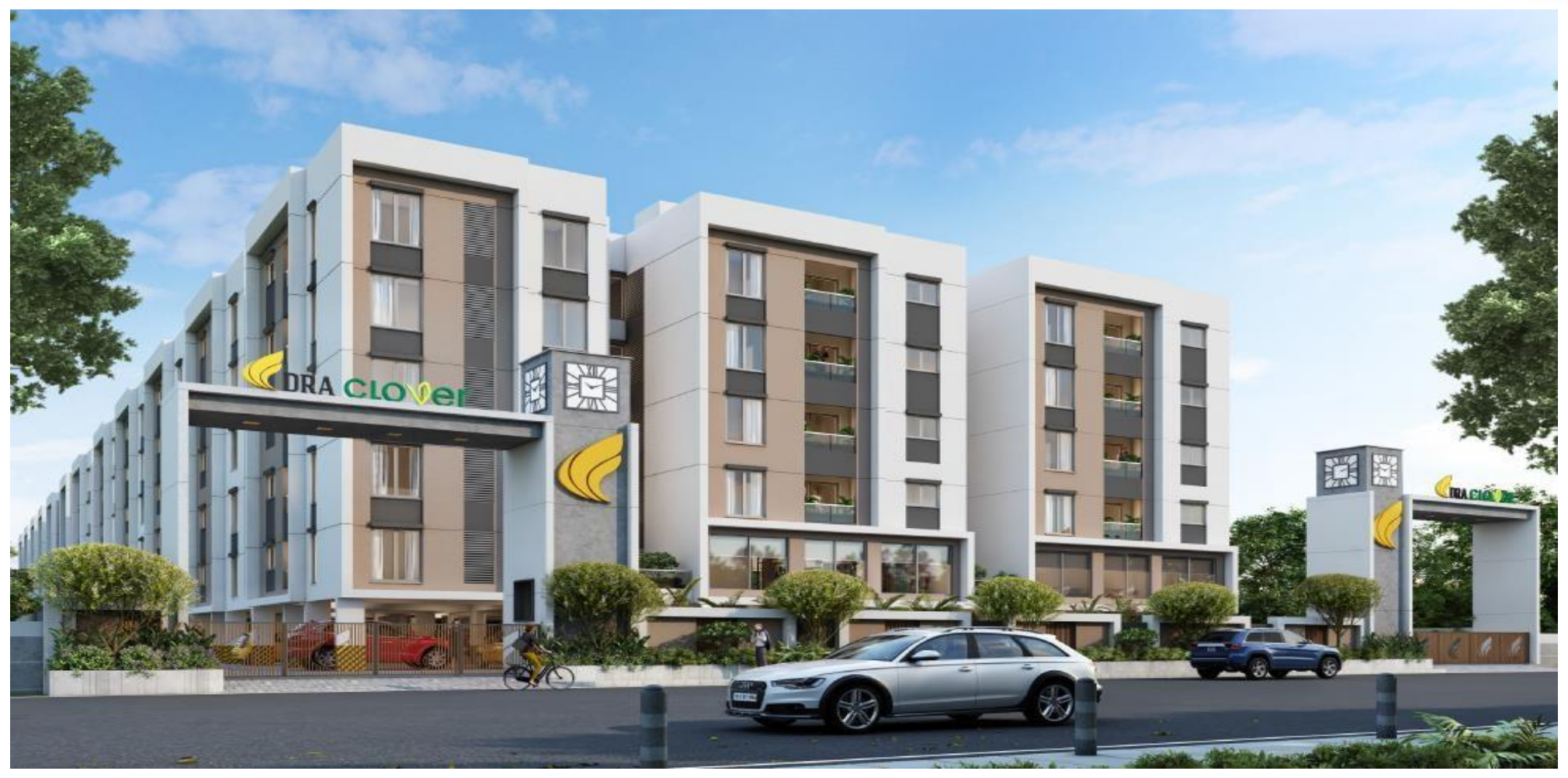
BEENA CLOVER Monthly Construction Updates – May 2025