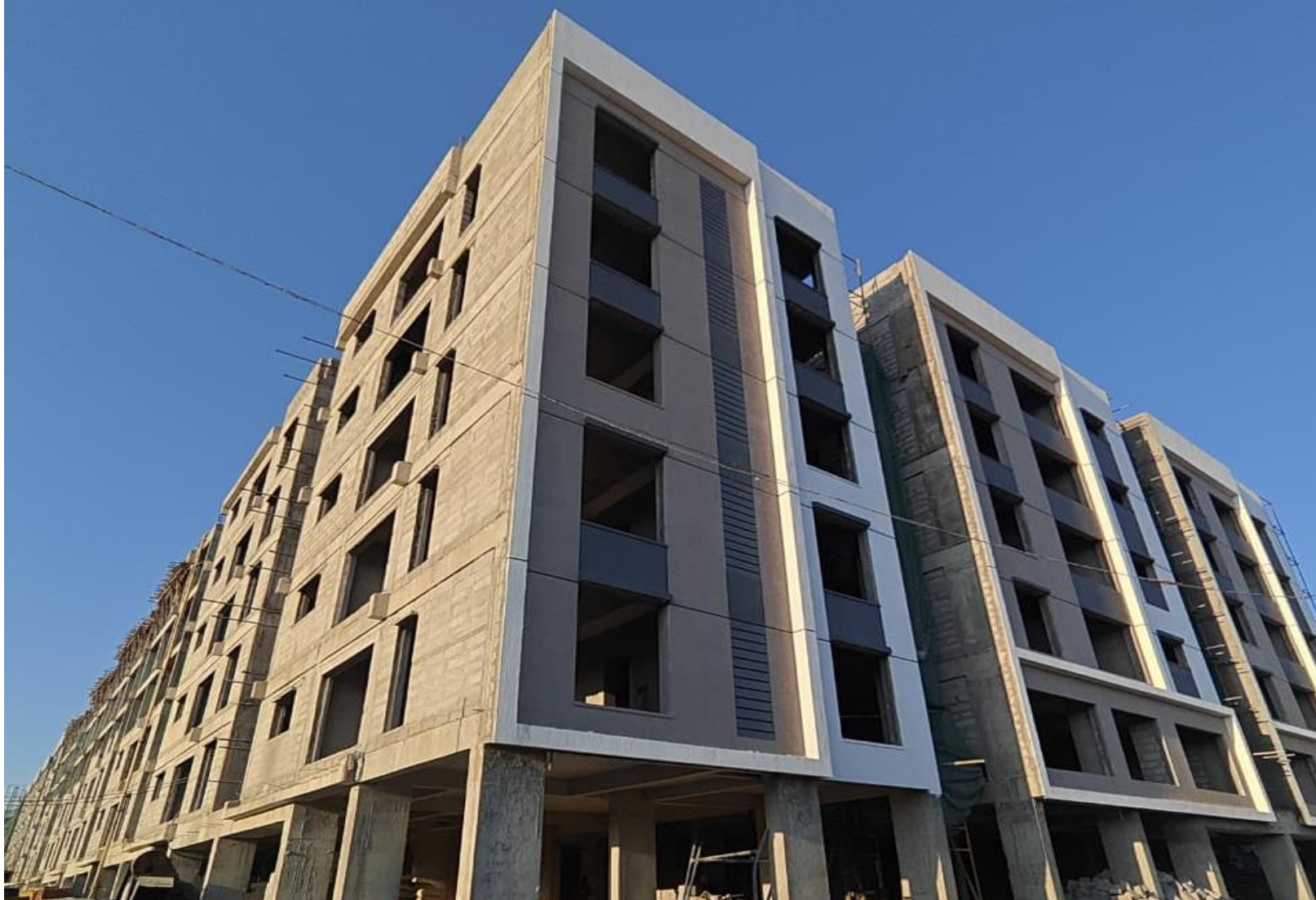
Block-01 – Elevation View