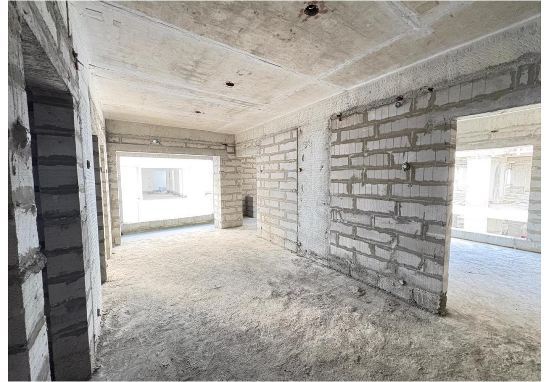
Block-02 – Pour-2 – Fourth Floor Block Work Completed.