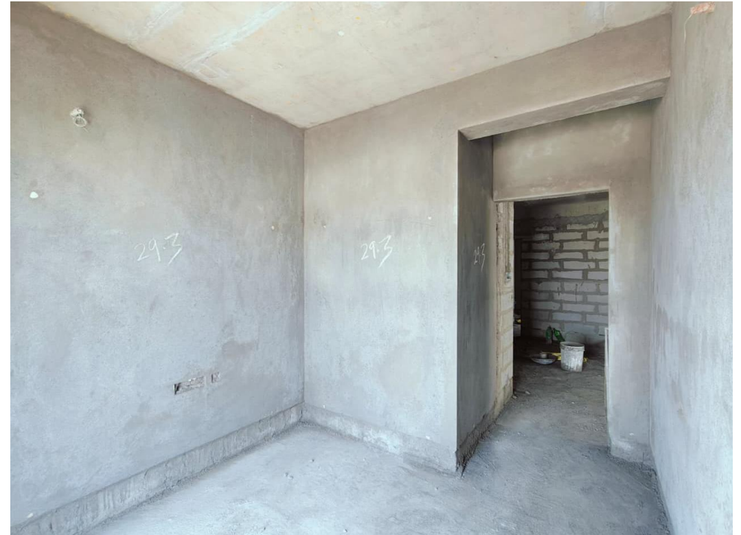
Block-01 – Pour-1 – Fifth Floor Plastering work in Progress