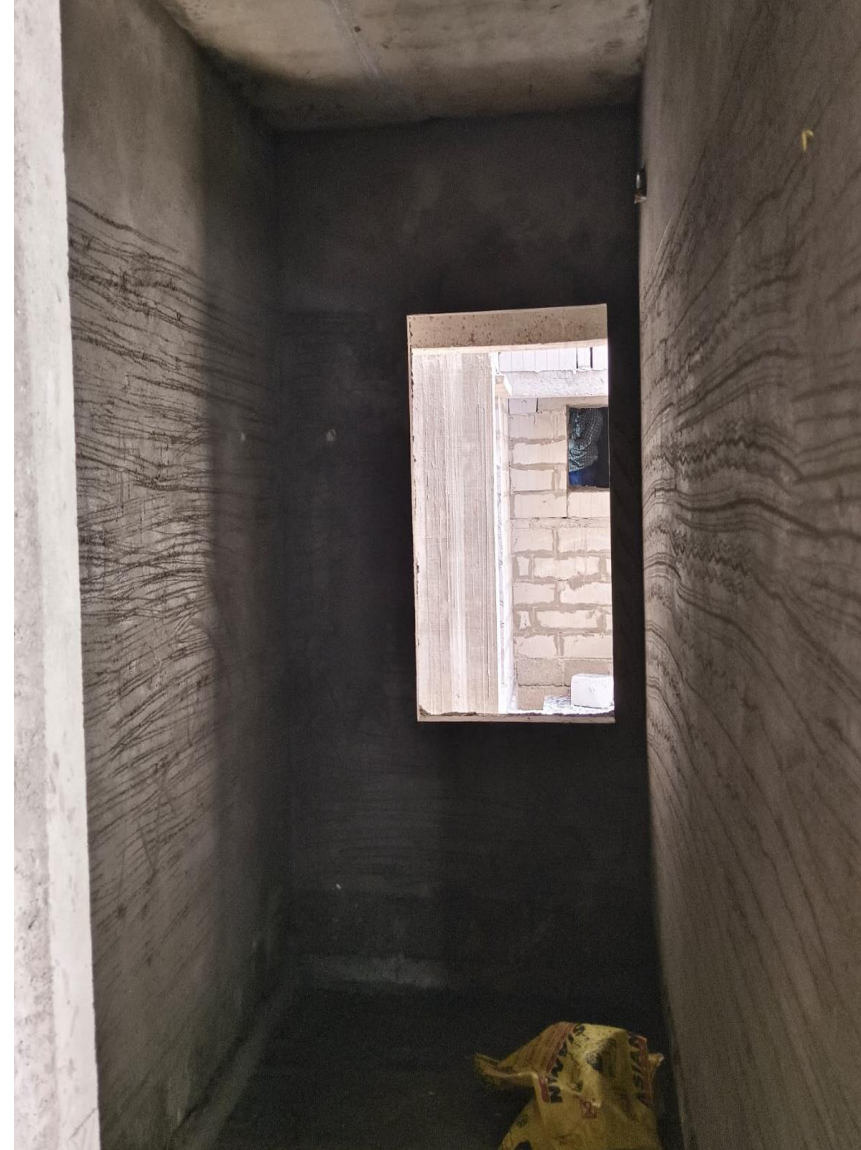
Block-02 – Pour-2 – Third Floor Toilet Plastering work in progress