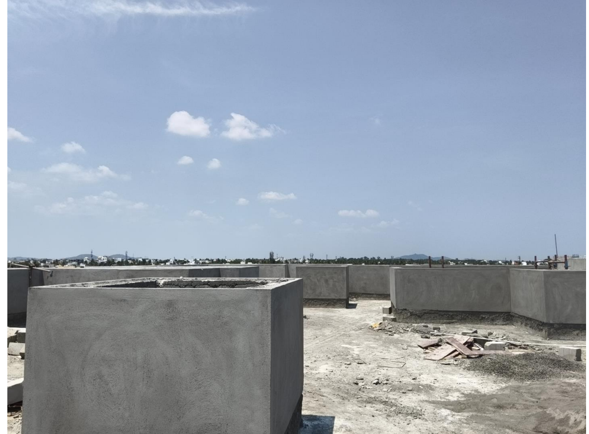
Block-02 – Above Terrace Work in Progress