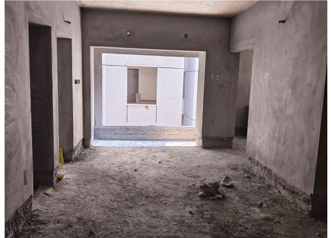
Block-02 – Pour-2 – Second Floor Plastering Work Completed