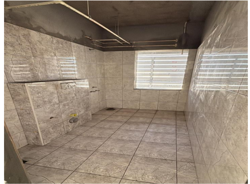
Block-03 – Fifth Floor Flooring Tile Laying work in Progress