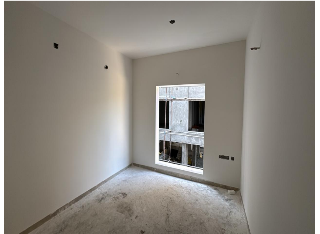
Block-03 – First Floor 2 nd Coat Putty work in progress