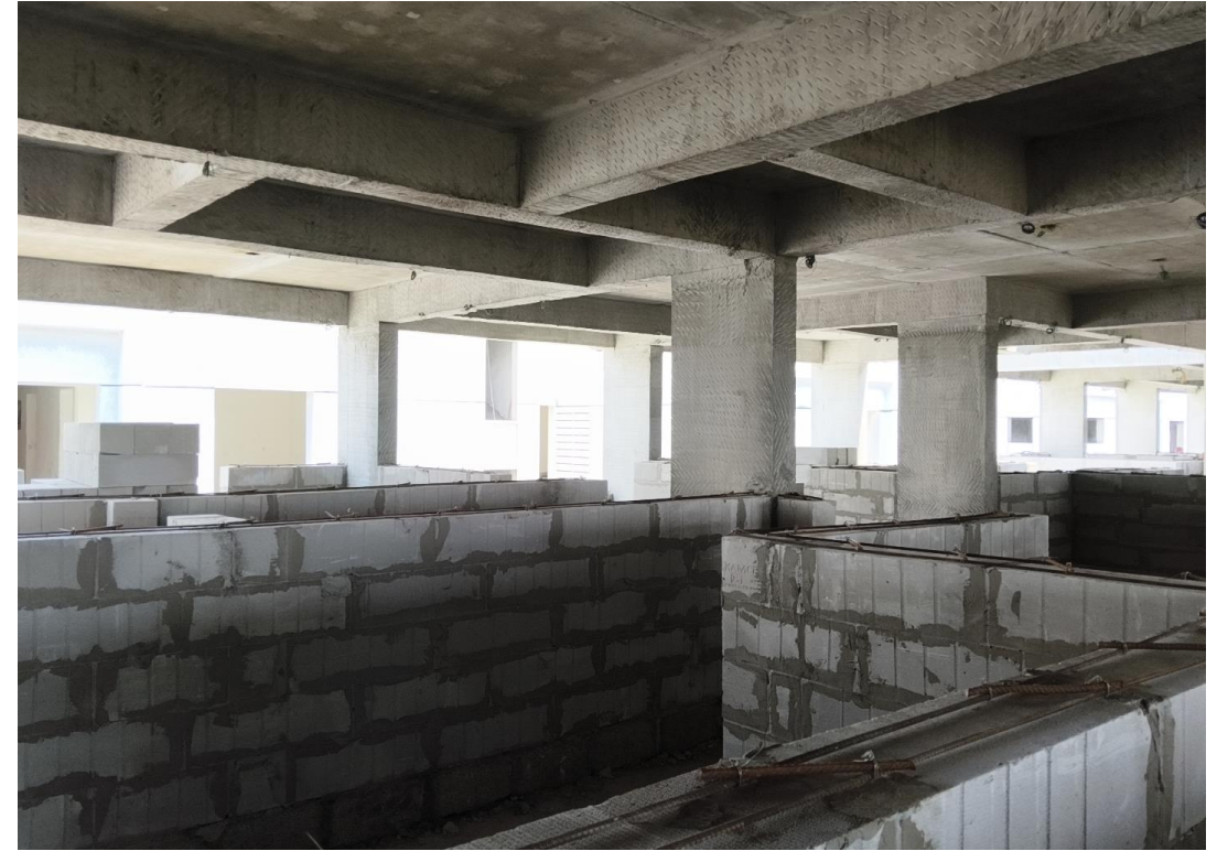
Block-02 – Pour-2 – Fifth Floor Block work in progress