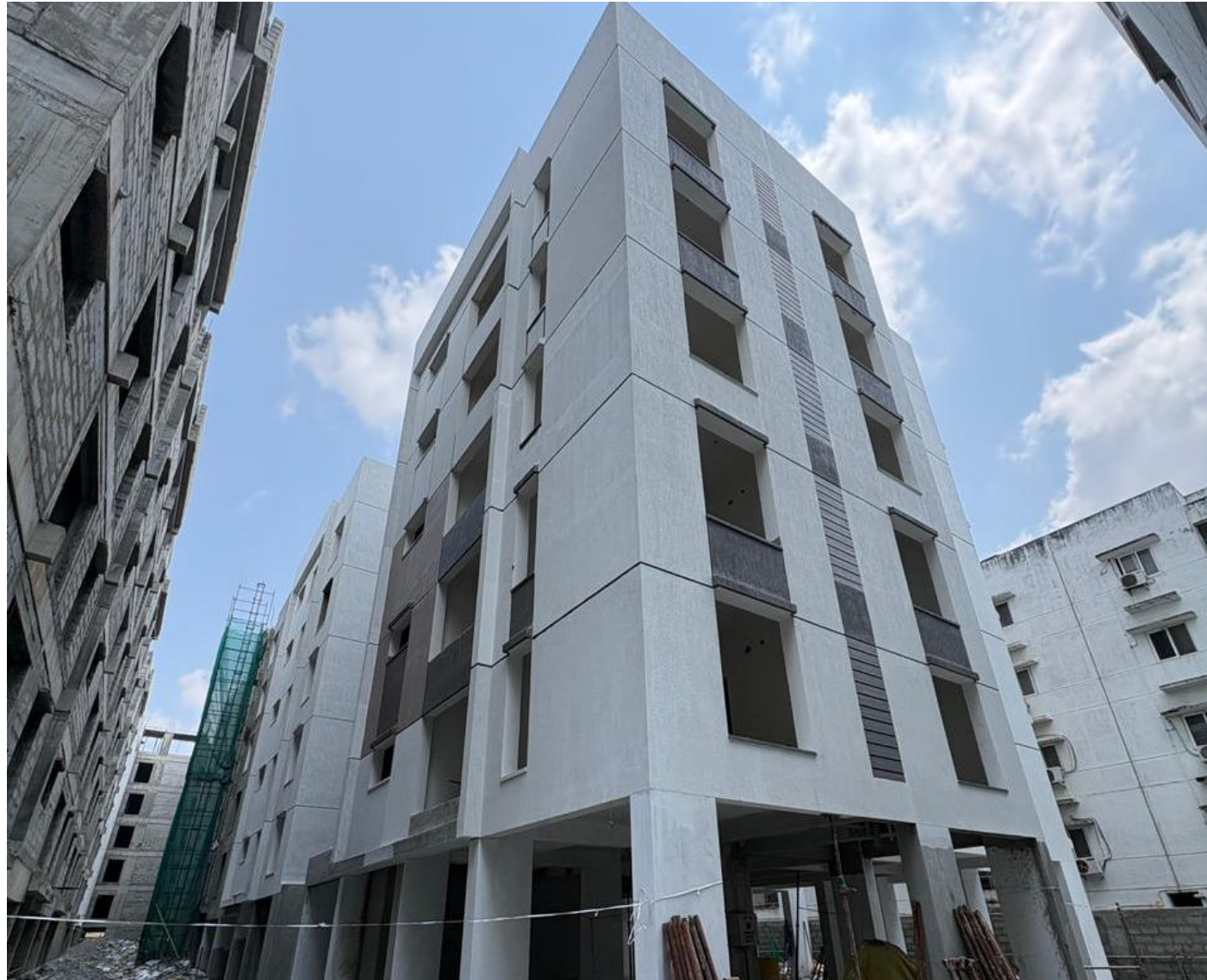
Block-03 – Elevation View