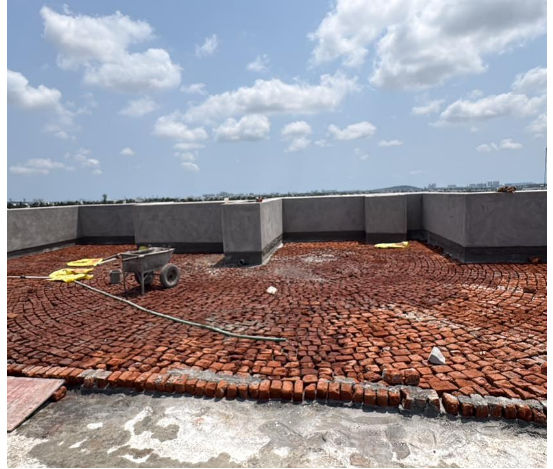
Block-03 – Terrace Waterproofing work in Progress