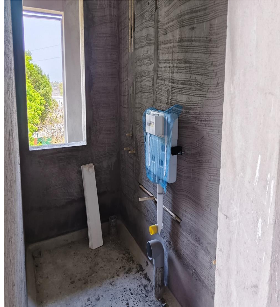
Block-02 – Pour-1 – First Floor Concealed Tank & Ledge Wall Brick Work in Progress.