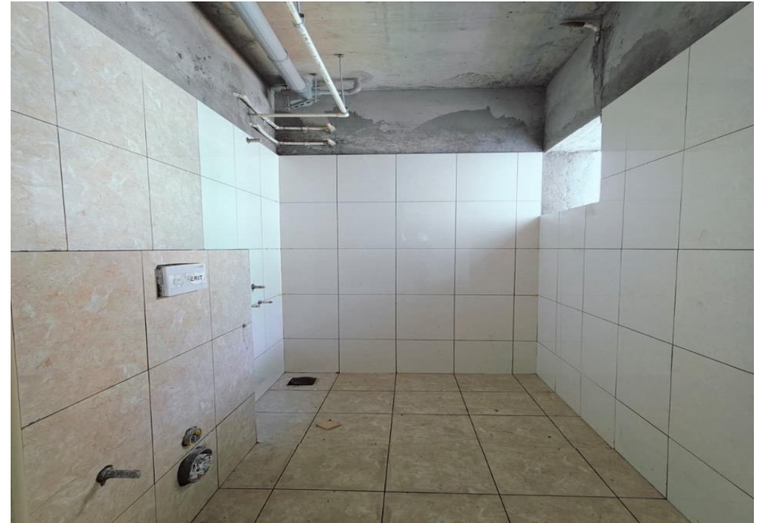
Block-04 – Second Floor Toilet Tile Laying work in Progress