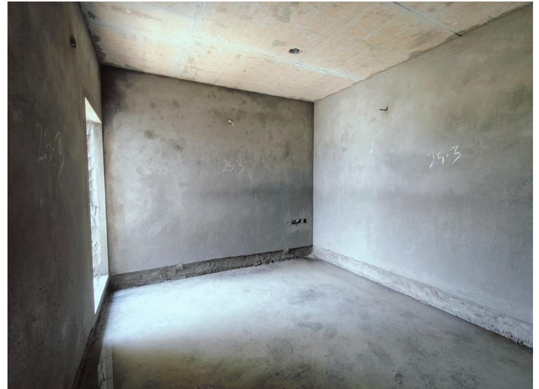
Block-01 – Pour-1 – Fourth Floor Plastering work in Progress