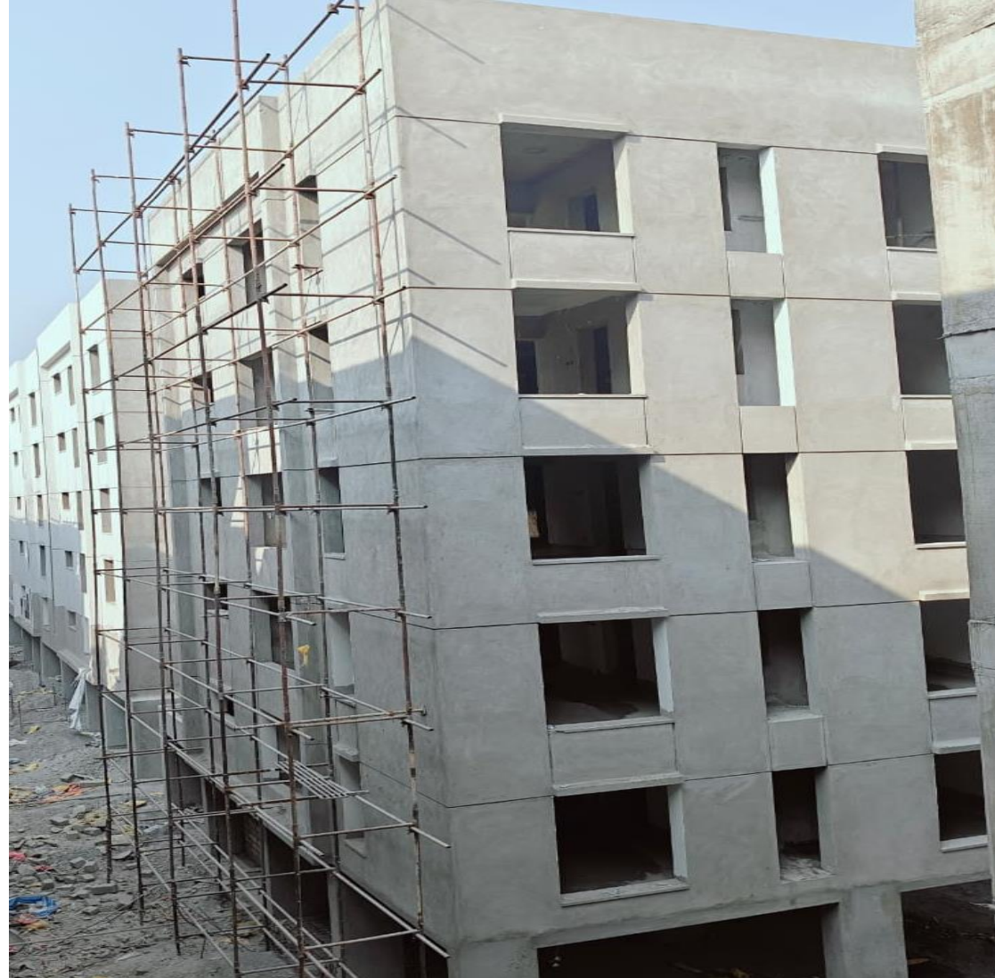
Block-04 – Elevation View