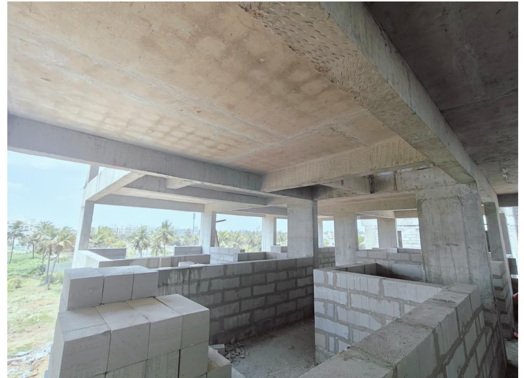
Block-01 – Pour-2 – Third Floor Block work in Progress