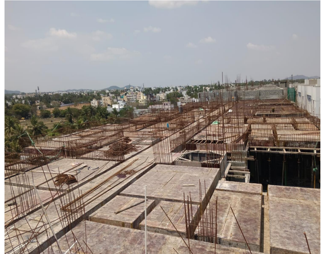
Block-01 – Pour-2 – Terrace Floor Slab Shuttering & Reinforcement Work Nearing Completion