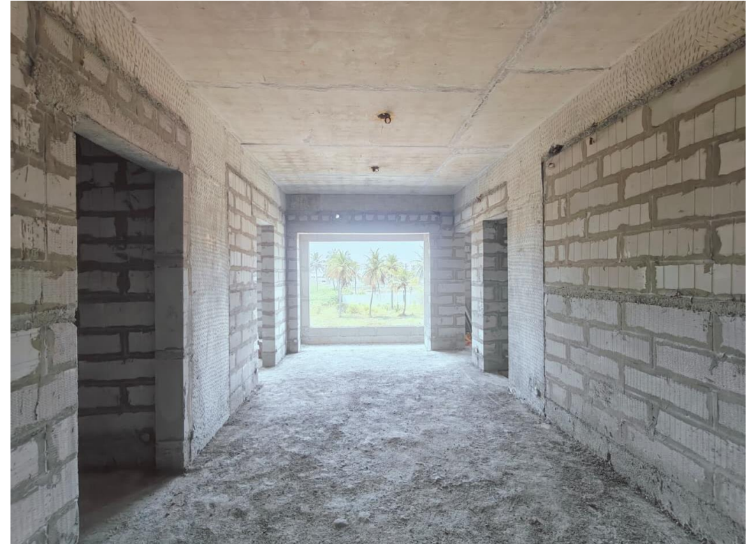
Block-01 – Pour-2 – Second Floor Block Work Completed