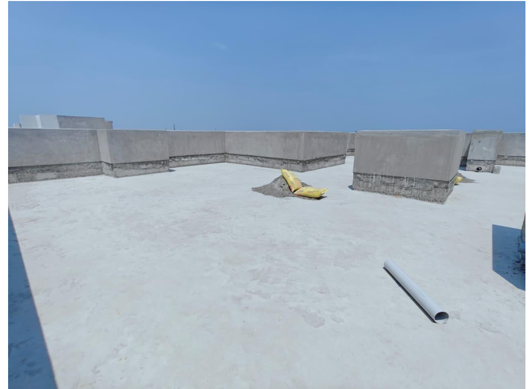
Block-04 – Terrace Floor Waterproofing Preparation work in Progress