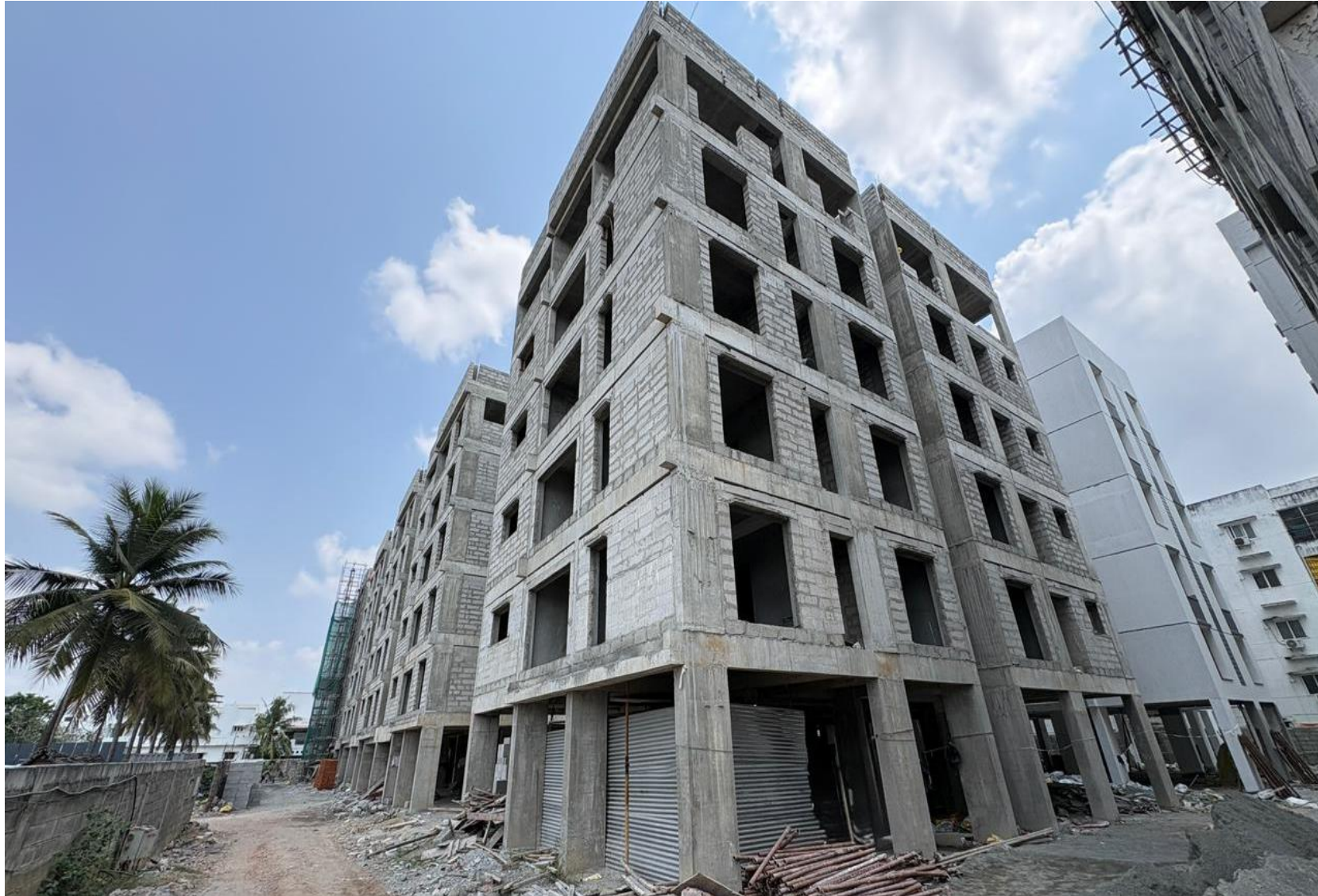
Block-02 – Elevation View