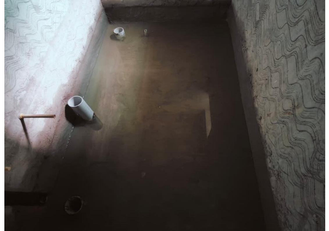
Block-4- Second Floor Waterproofing Work in Progress