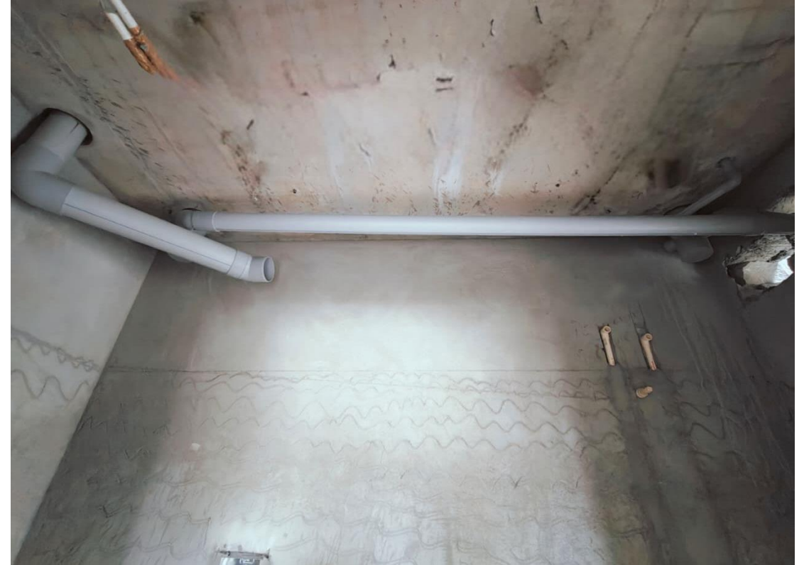
Block-4- First Floor Suspended Pipeline Work in Progress