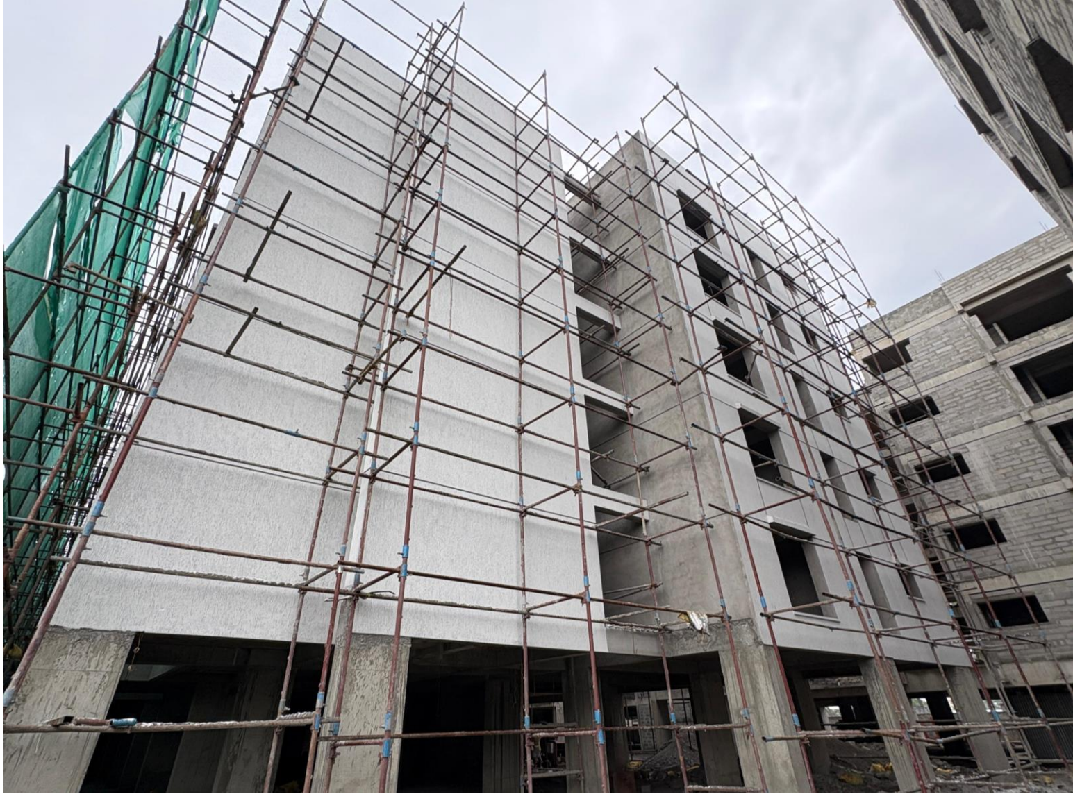
Block-3- External-North Side Texture work in Progress