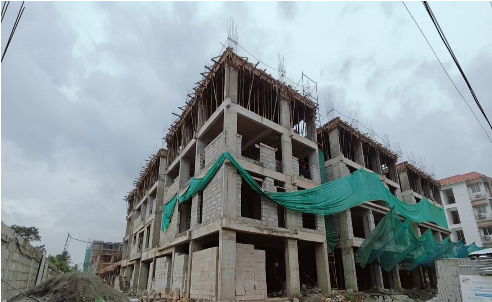
Block-1- Elevation View