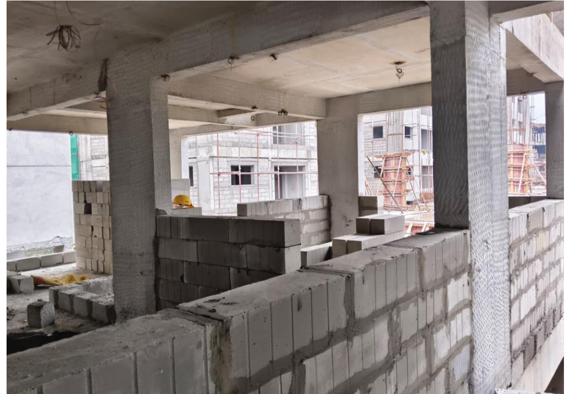
Block-2- Pour 2 –First Floor Block Work in Progress