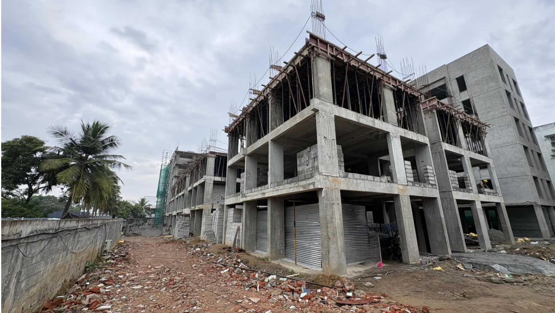
Block-2- Elevation View