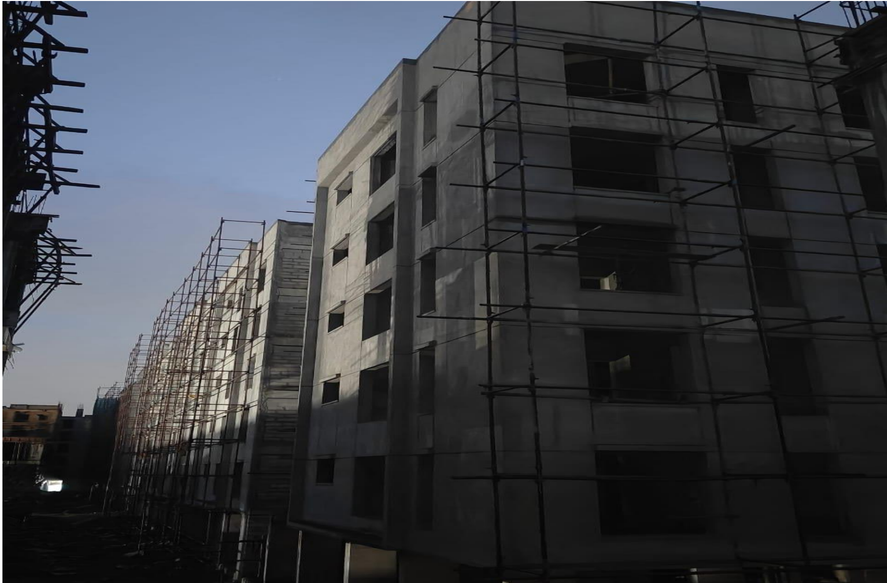
Block-4- Elevation View