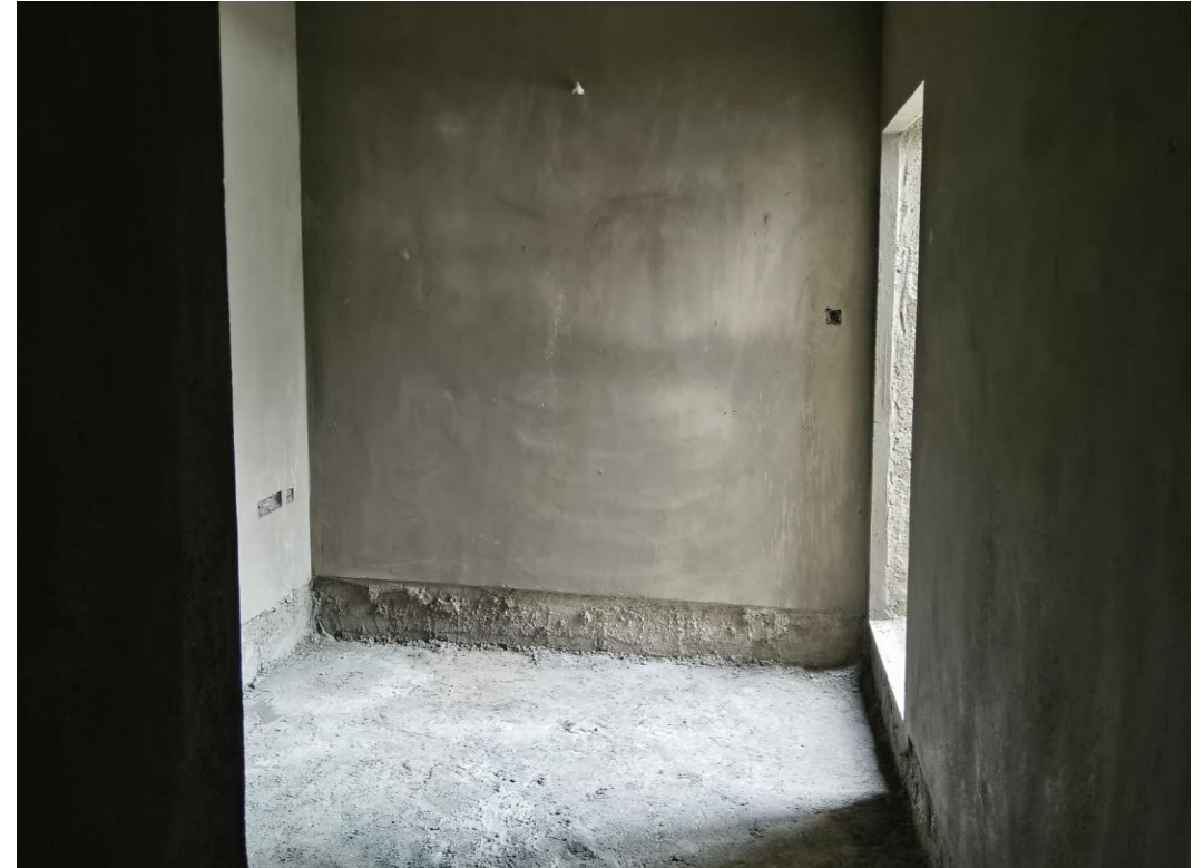
Block-2-Pour 1- First Floor Plastering Work in Progress