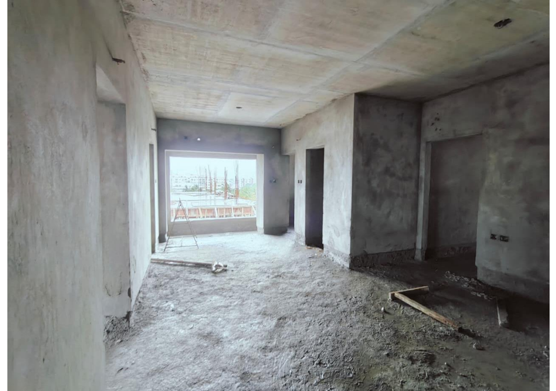
Block-4- Fourth Floor Plastering work Completed