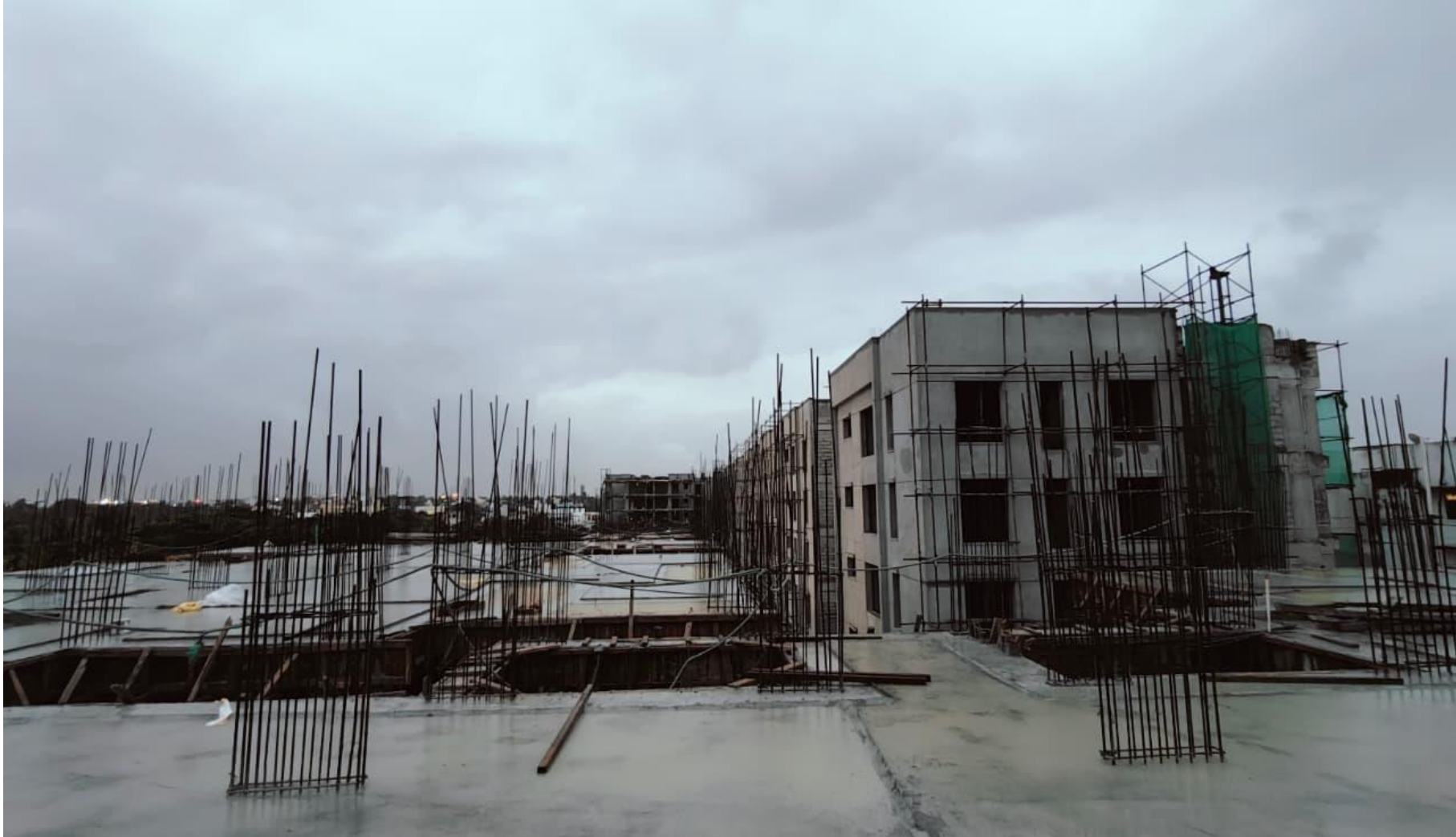
Site Front View