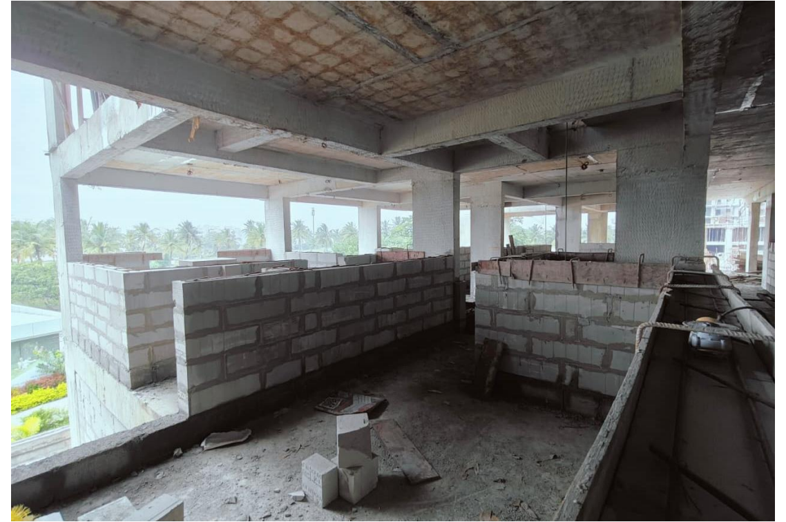
Block-1- Pour 1-Second Floor Block Work In progress