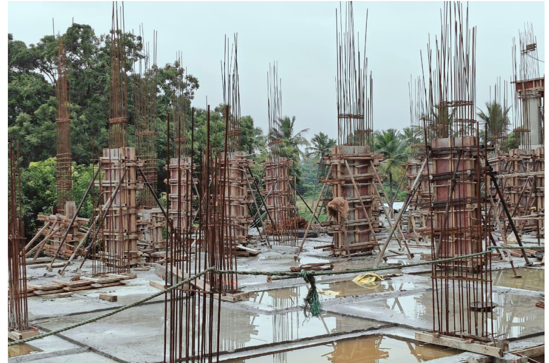
Block-1- Pour-2-First Floor Column Concrete Work In Progress