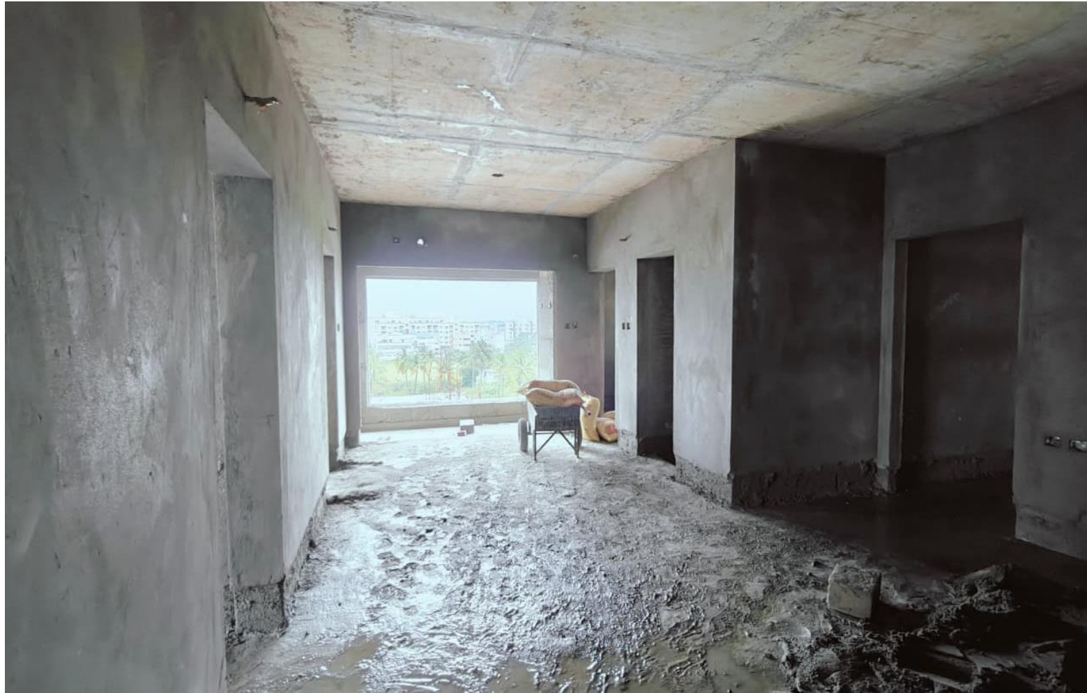
Block-4 Fifth Floor Plastering Work in Progress