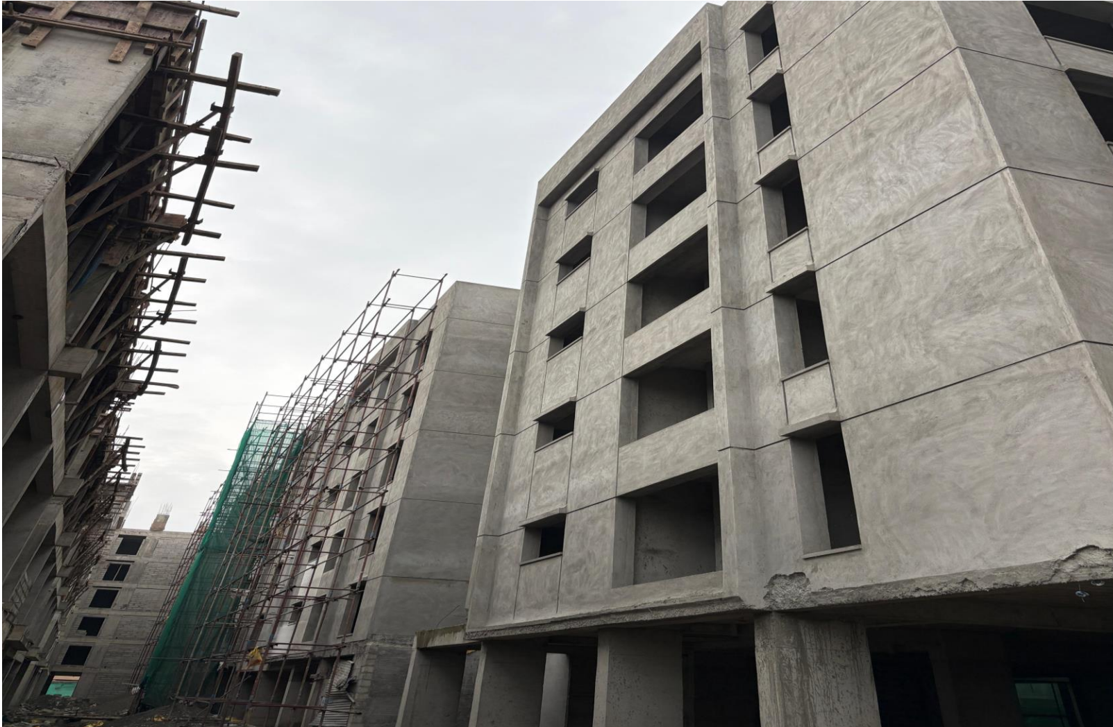
Block-3 – Elevation View