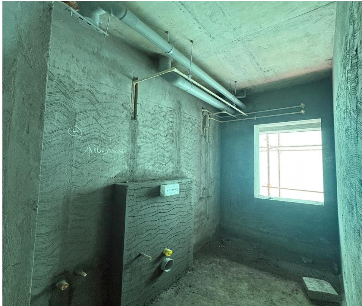
Block-3 Third floor Toilet Concealed Tank Brick Work in Progress