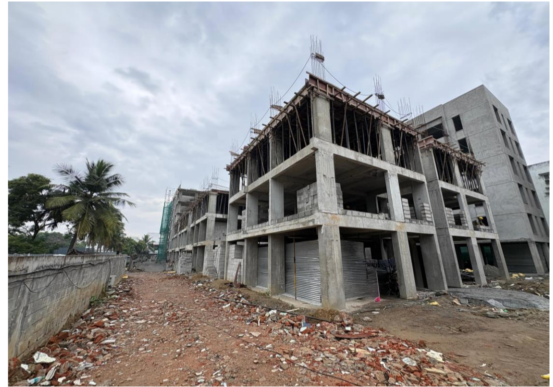
Block-2-Pour 2- Third Floor Slab Reinforcement Work in progress