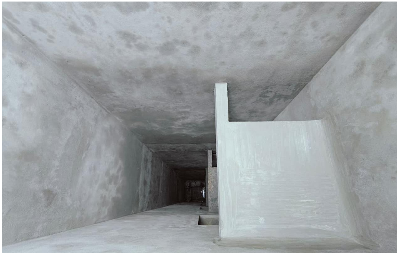
Block-4 Duct Plastering Work in Progress