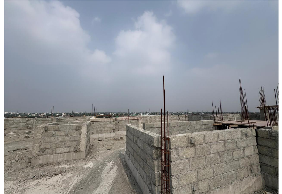
Block-02 – Pour-1 –Terrace Work Activities in Progress