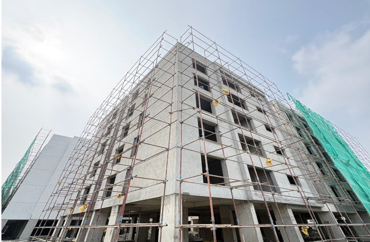
Block-02 – Pour-1 – External East & North Side Plastering Work in Progress