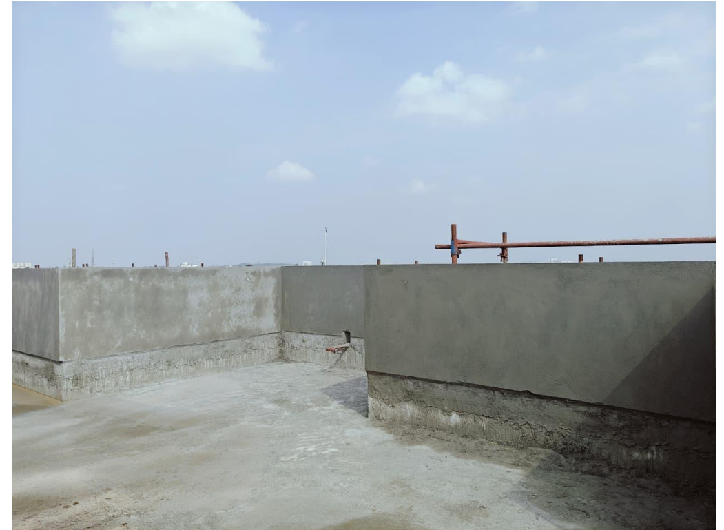
Block-04 –Terrace floor Parapet wall Plastering Work in Progress