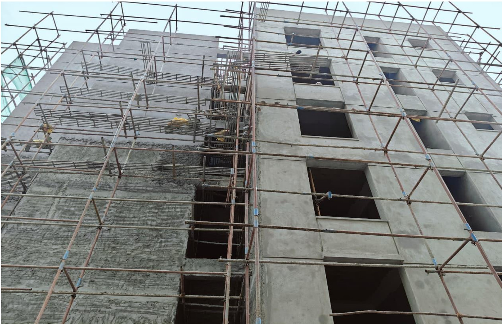
Block-04 – External Plastering Work in Progress