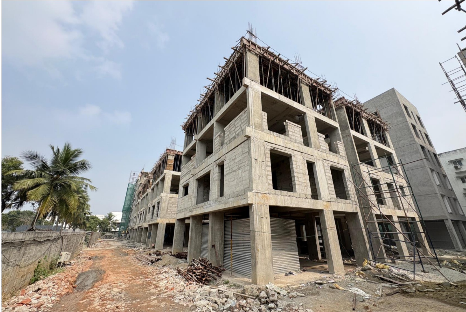
Block-02 – Elevation View