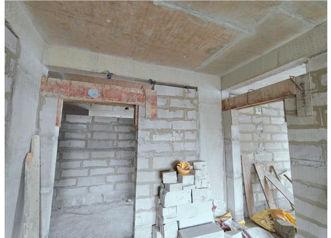
Block-01 – Pour-1 –Third Floor Block work Lintel Shuttering & Concrete work in Progress