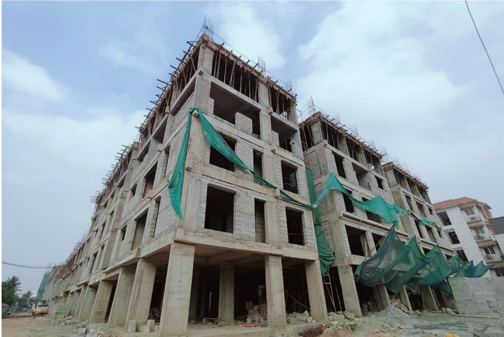
Block-01 – Elevation View