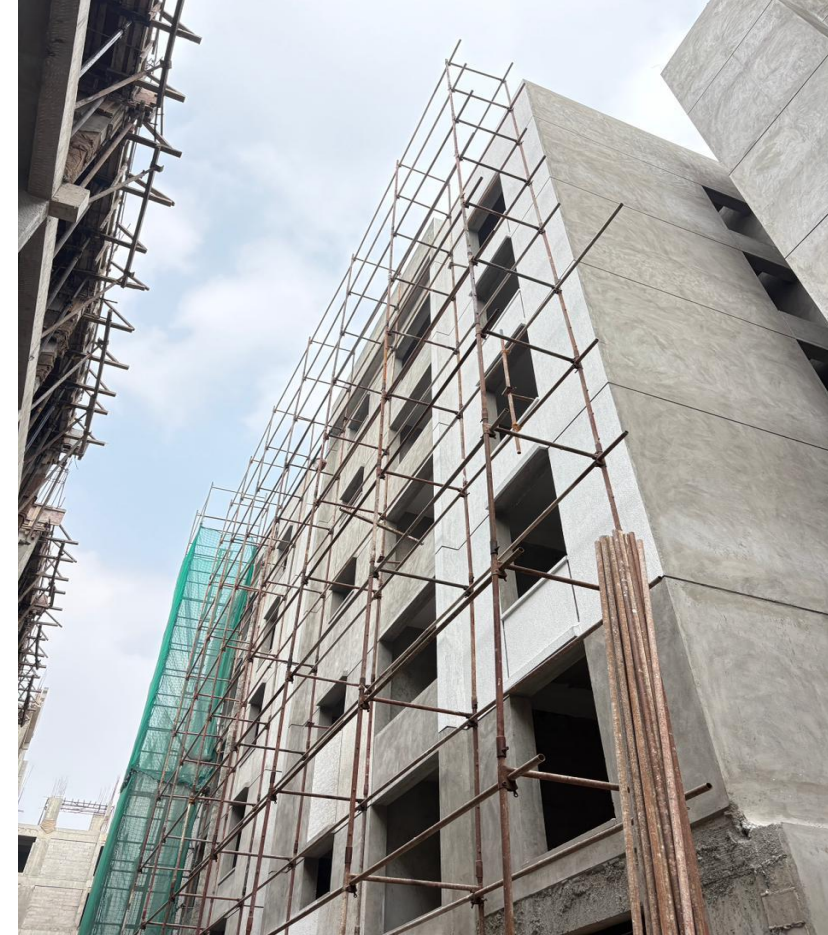
Block-03 –External Wall Texture Work in Progress