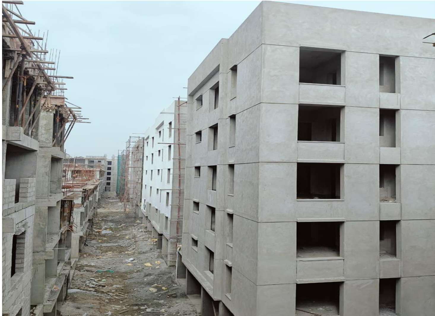
Block-04 – Elevation View