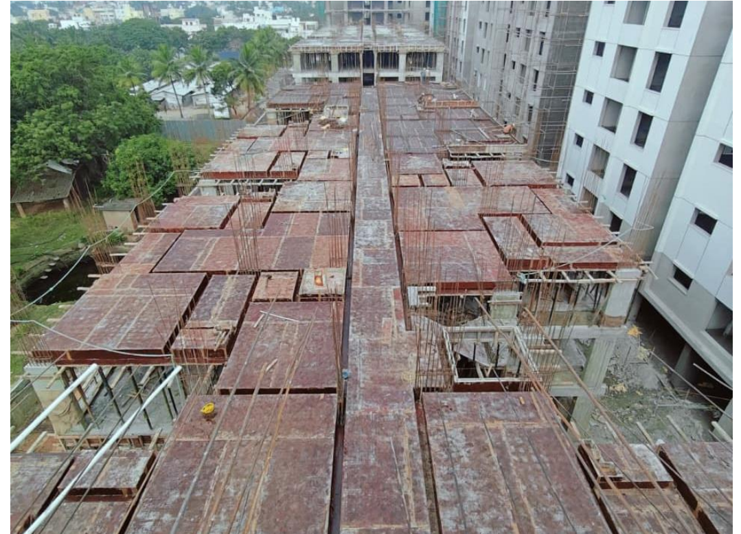
Block-01 – Pour-2 –Third Floor Slab Shuttering work in Progress