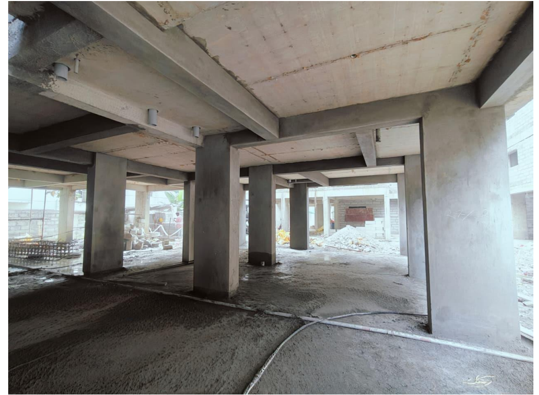
Block-01 –Stilt floor plastering work in Progress