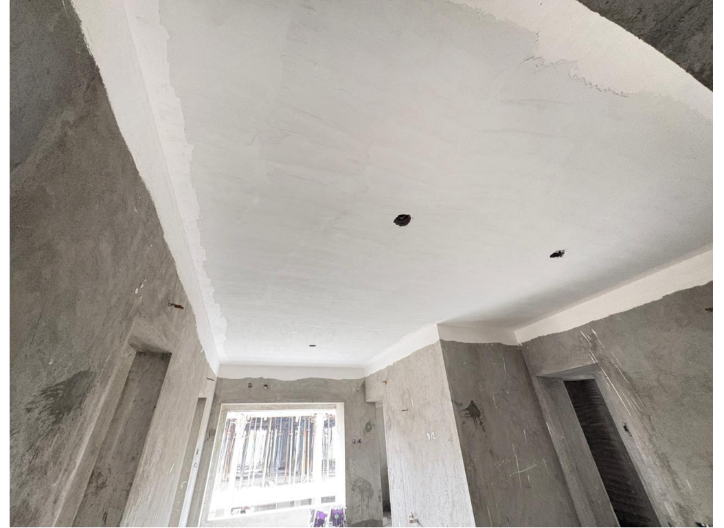
Block-03 –Fourth Floor Ceiling Putty Work in Progress