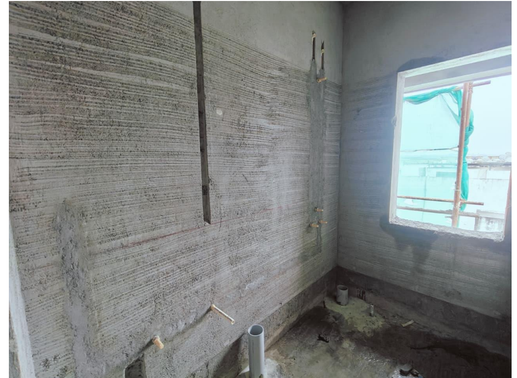
Block-04 – Fifth floor concealed pipeline work completed