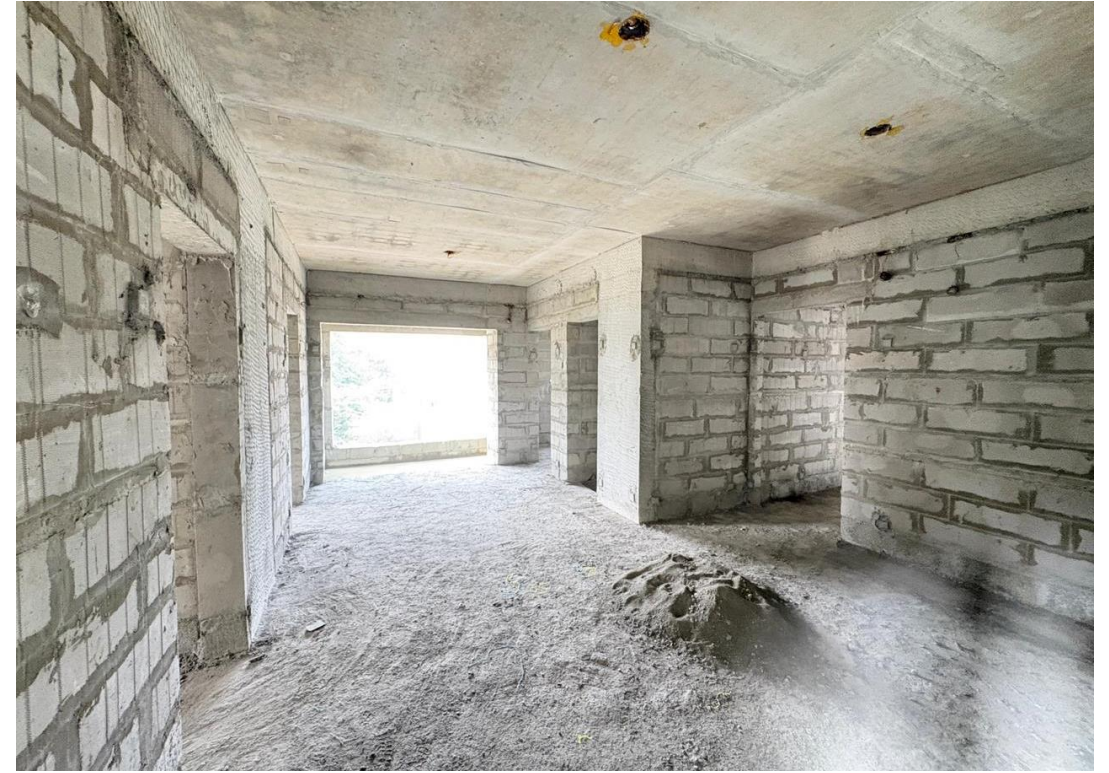
Block-02 – Pour-2 –First Floor Block work Nearing Completion