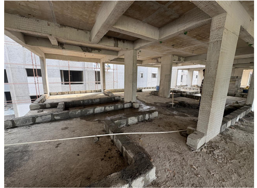
Block-02 – Pour-2 –Second Floor Block Work in Progress