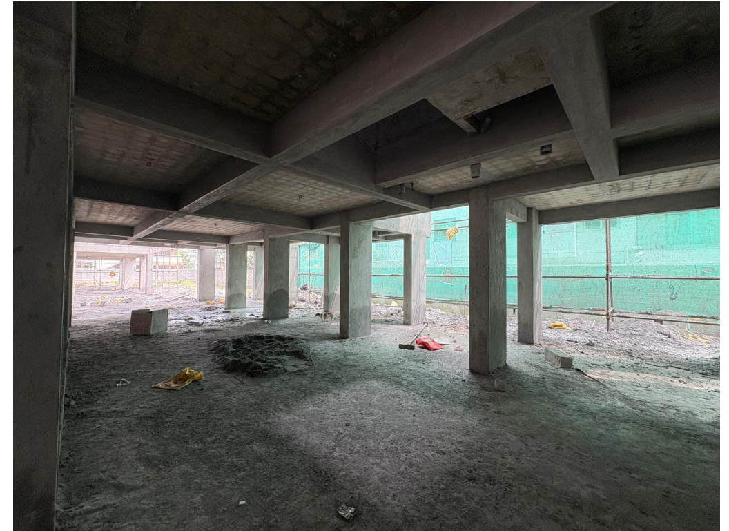
Block-03 –Stilt Floor Column Beam Plastering Work in Progress