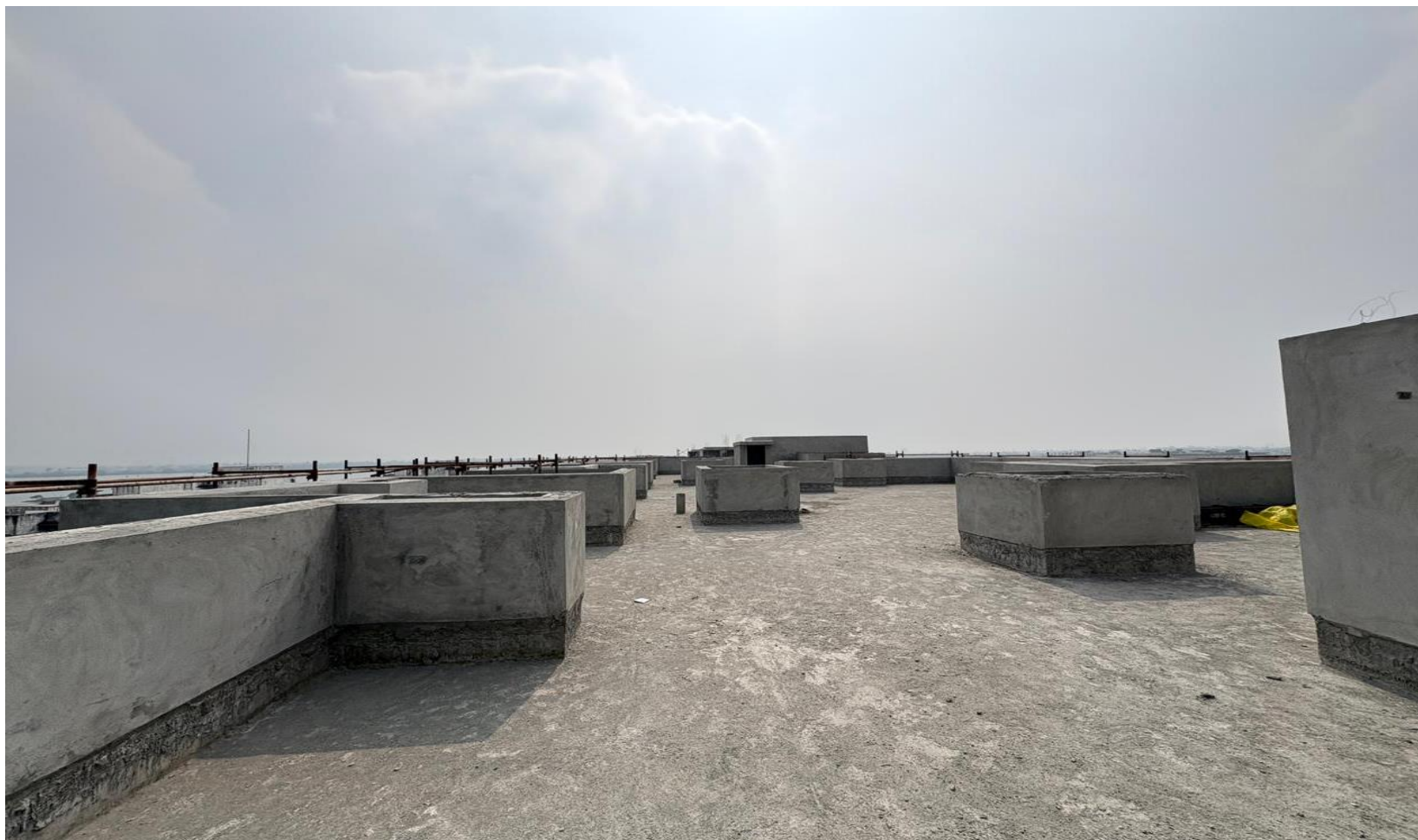
Block-03 – Terrace Parapet & Headroom Wall Plastering Work Completed