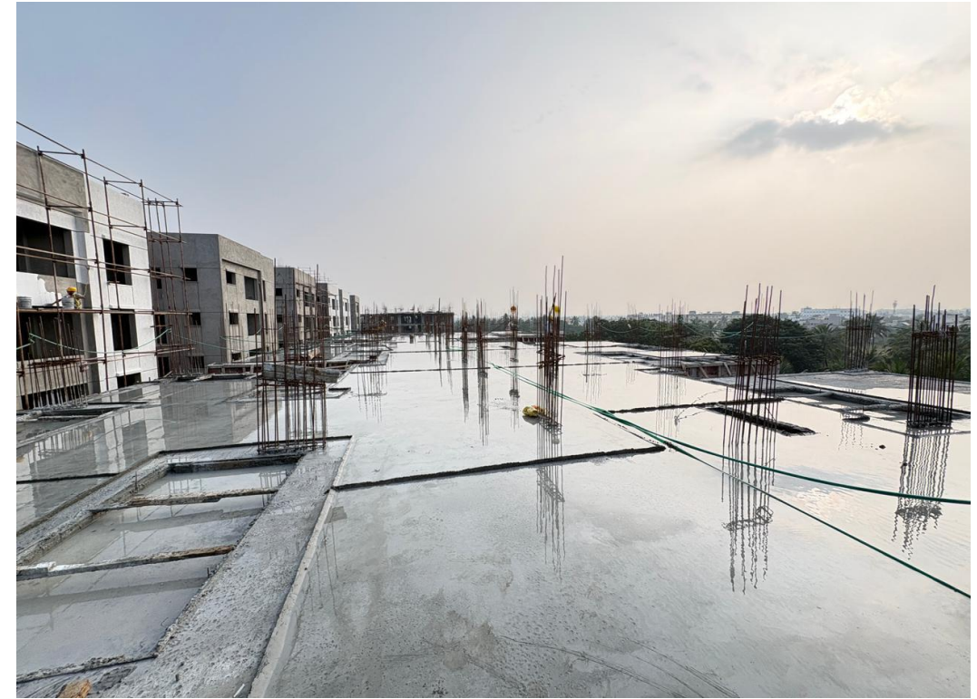
Block-02 – Pour-2 –Fourth Floor Slab Concrete Work Completed