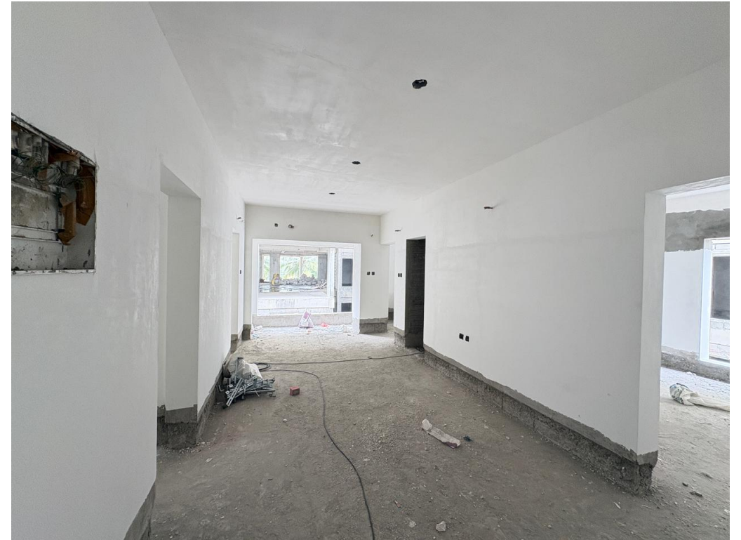
Block-03 –Third Floor Wall Putty Work in Progress