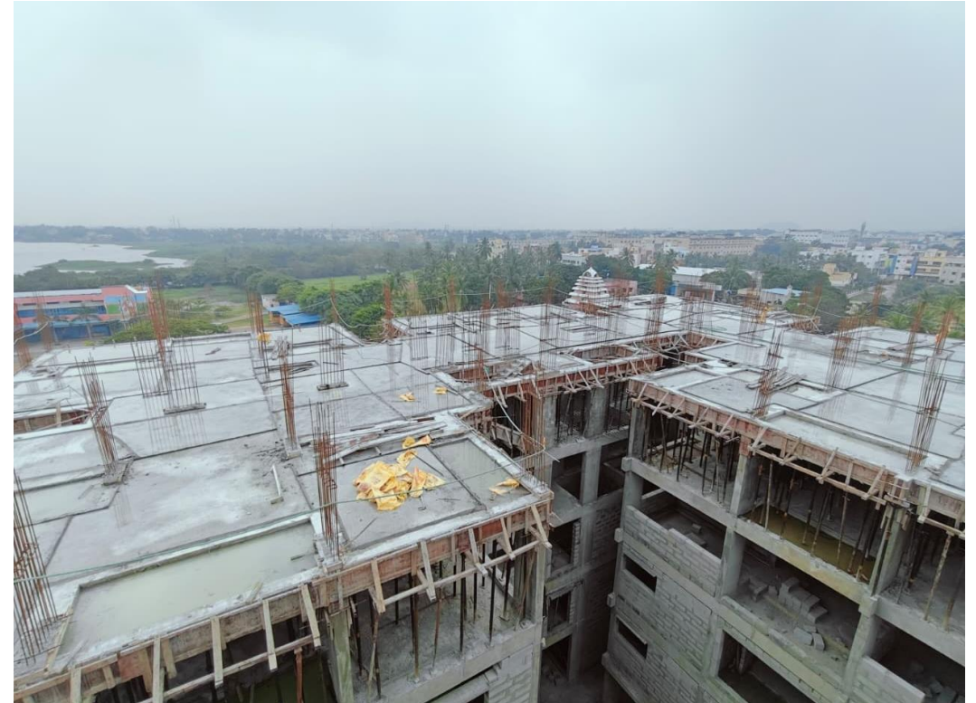
Block-01 – Pour-1 –Fifth Floor Slab Concrete work Completed