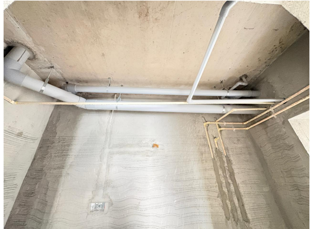
Block-03 – Toilet Plumbing Concealed & Suspended Pipeline Work Completed Up to 5 th Floor