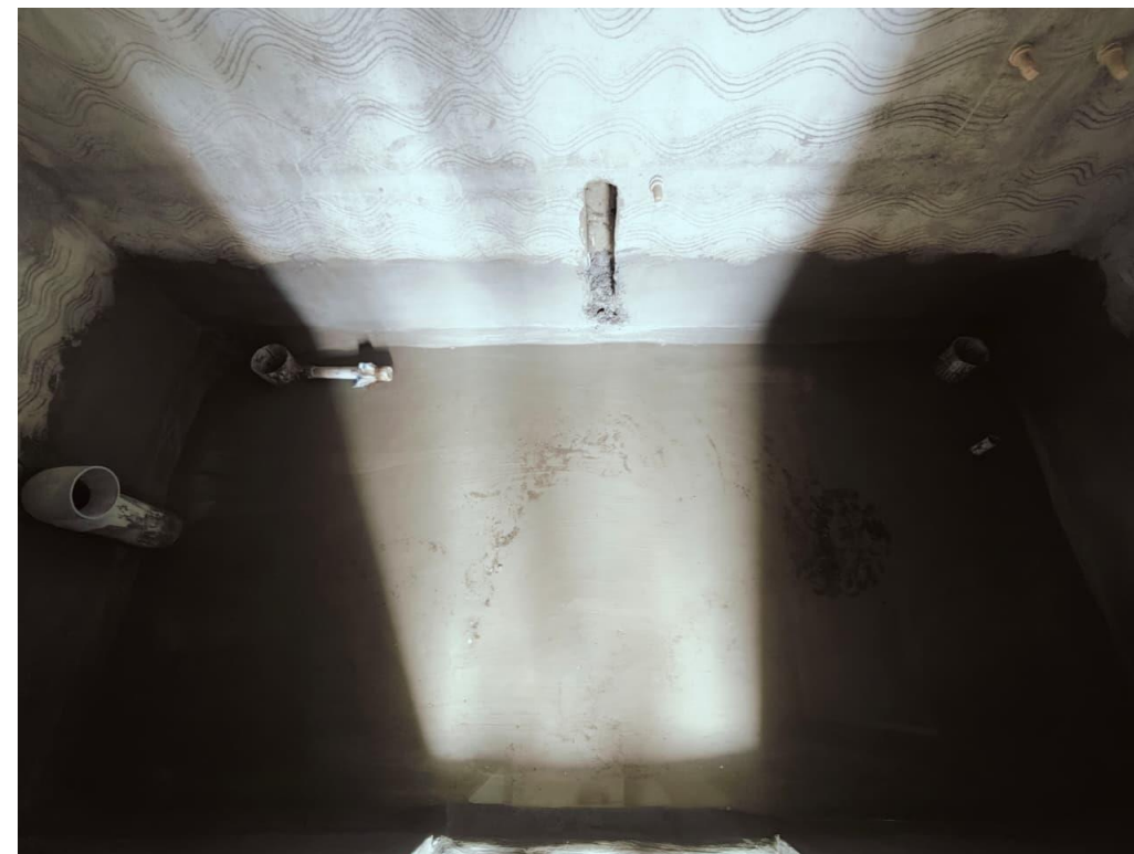
Block-04 – Second floor toilet protective plastering Work in Progress