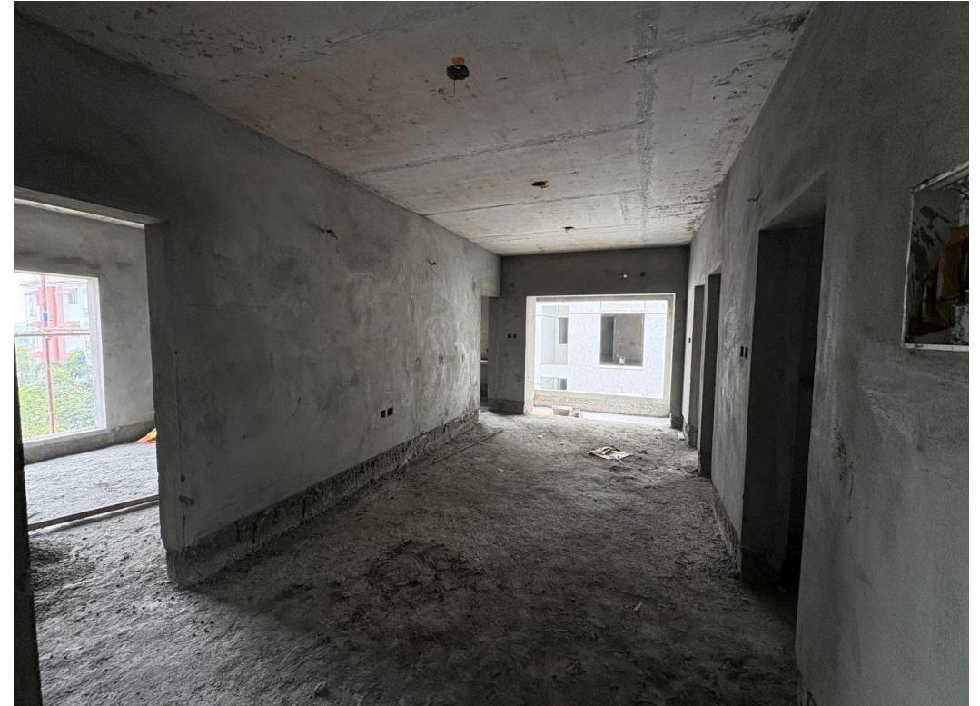
Block-02 – Pour-1 –Fourth Floor Plastering Work Nearing Completion