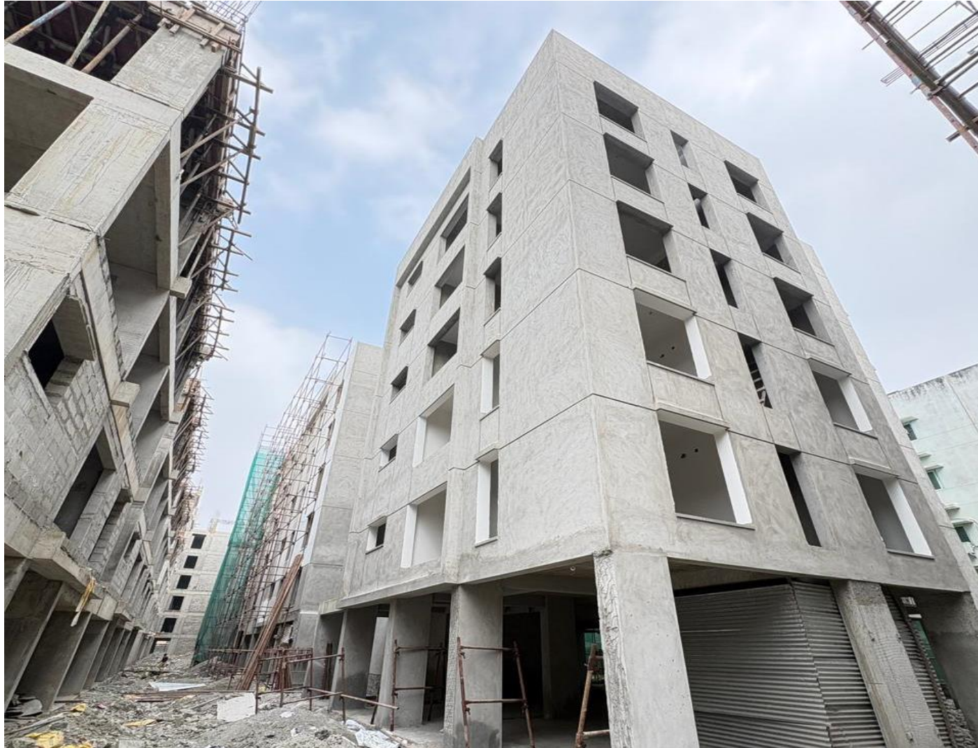
Block-03 – Elevation View