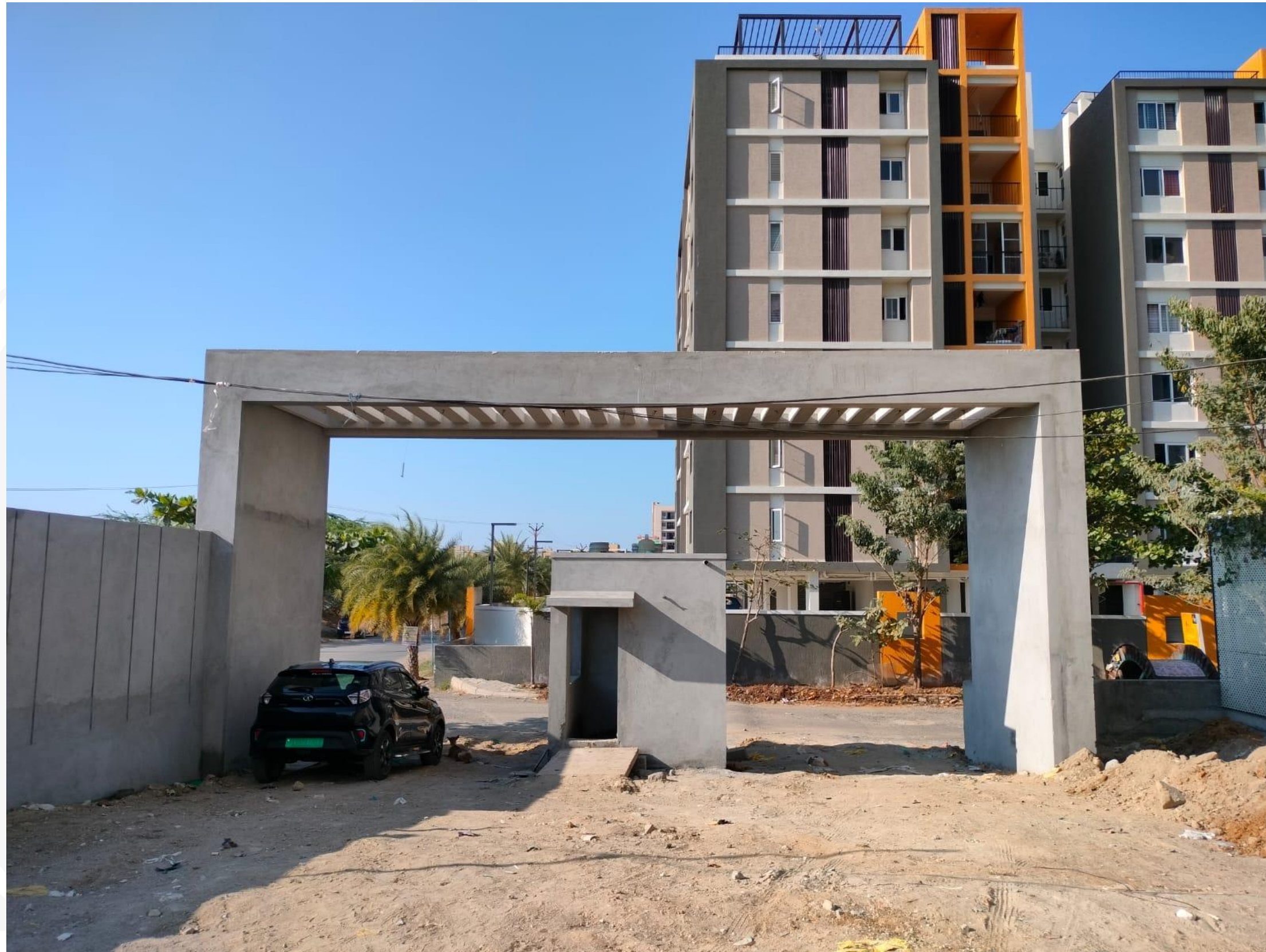
Entrance Arch - Plastering Work Completed