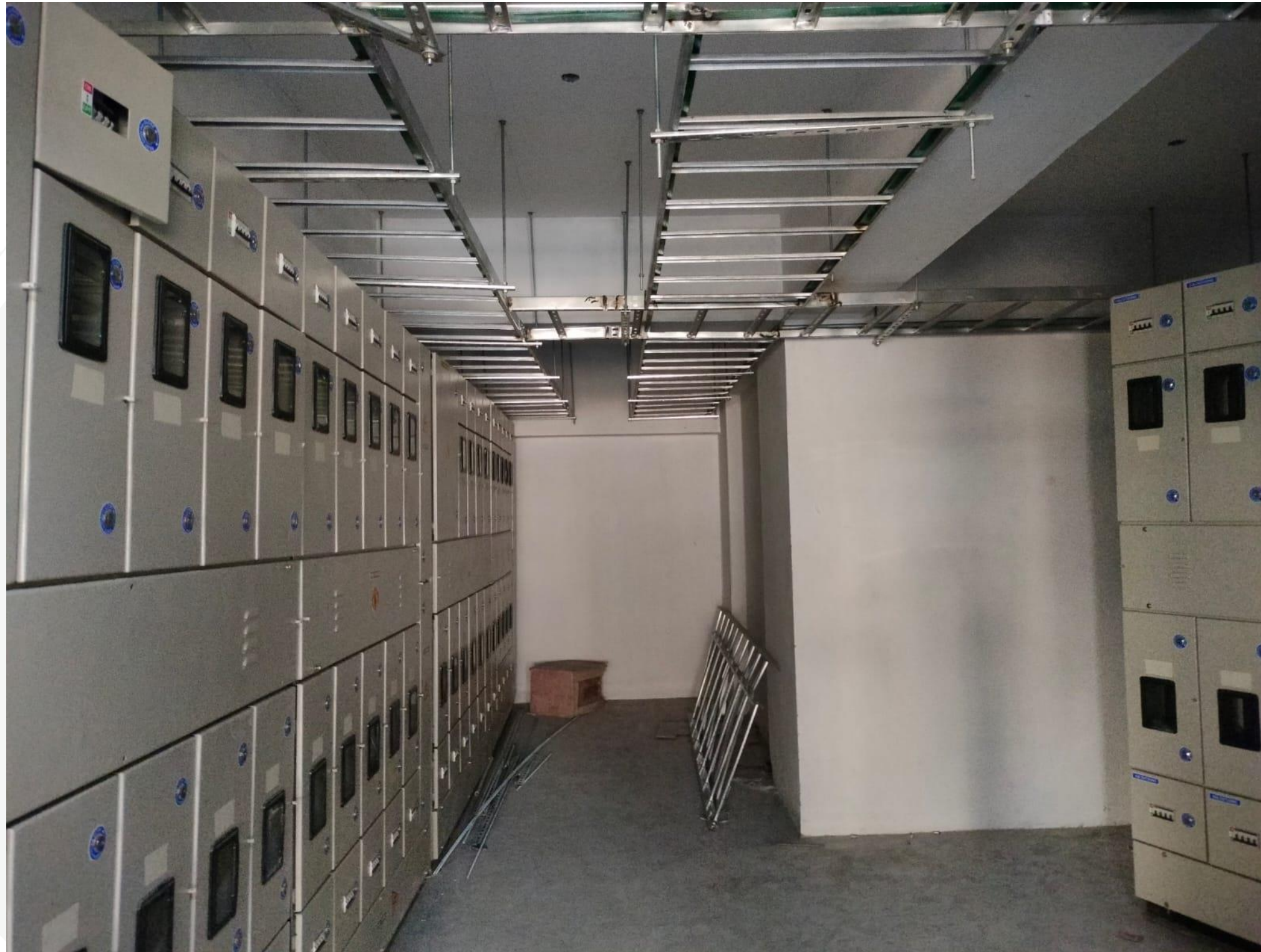
Electrical Room-1&2 Panel Fixing Work in Progress