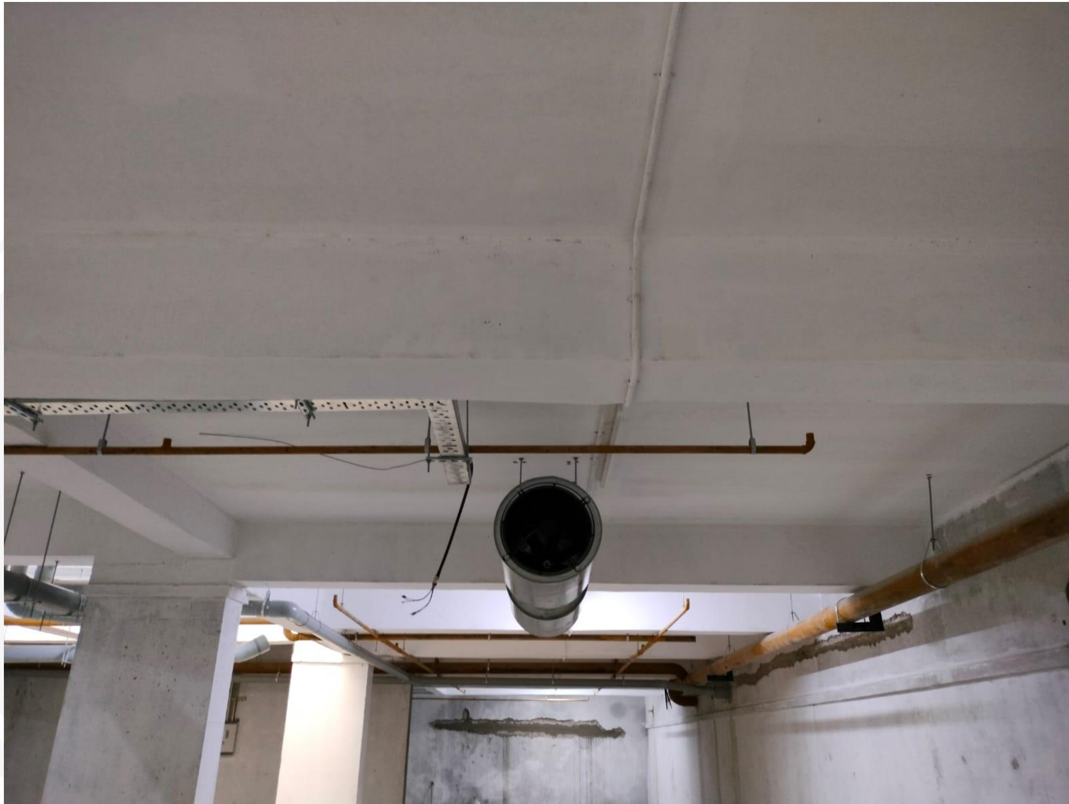
Basement Mechanical Ventilation Work In Progress