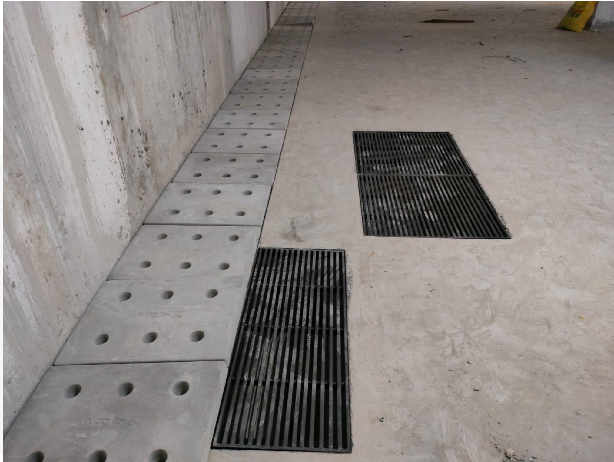
Basement Trench Cover Slab Fixing Work In Progress