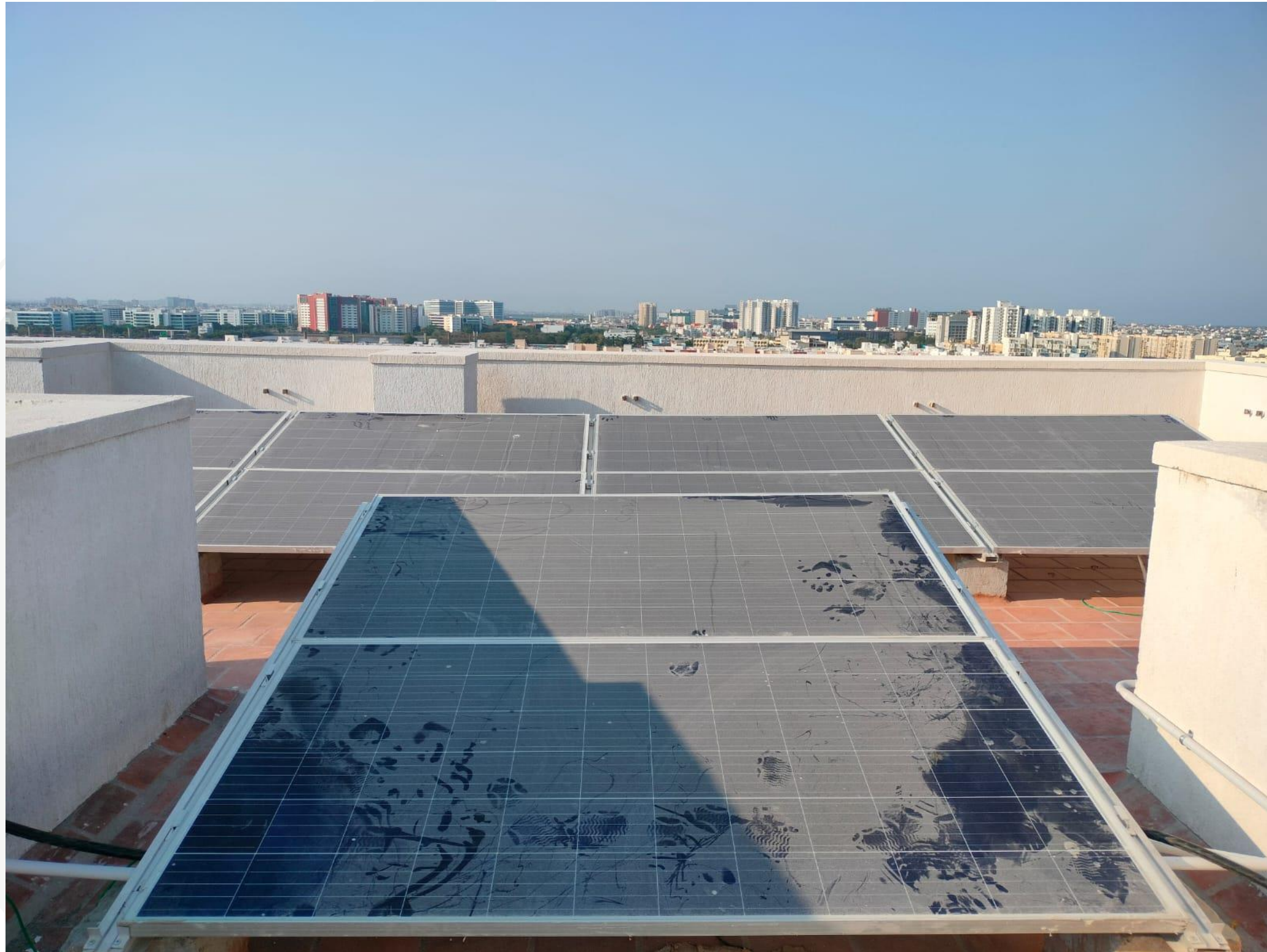
Terrace Solar Panel Fixing Work Completed