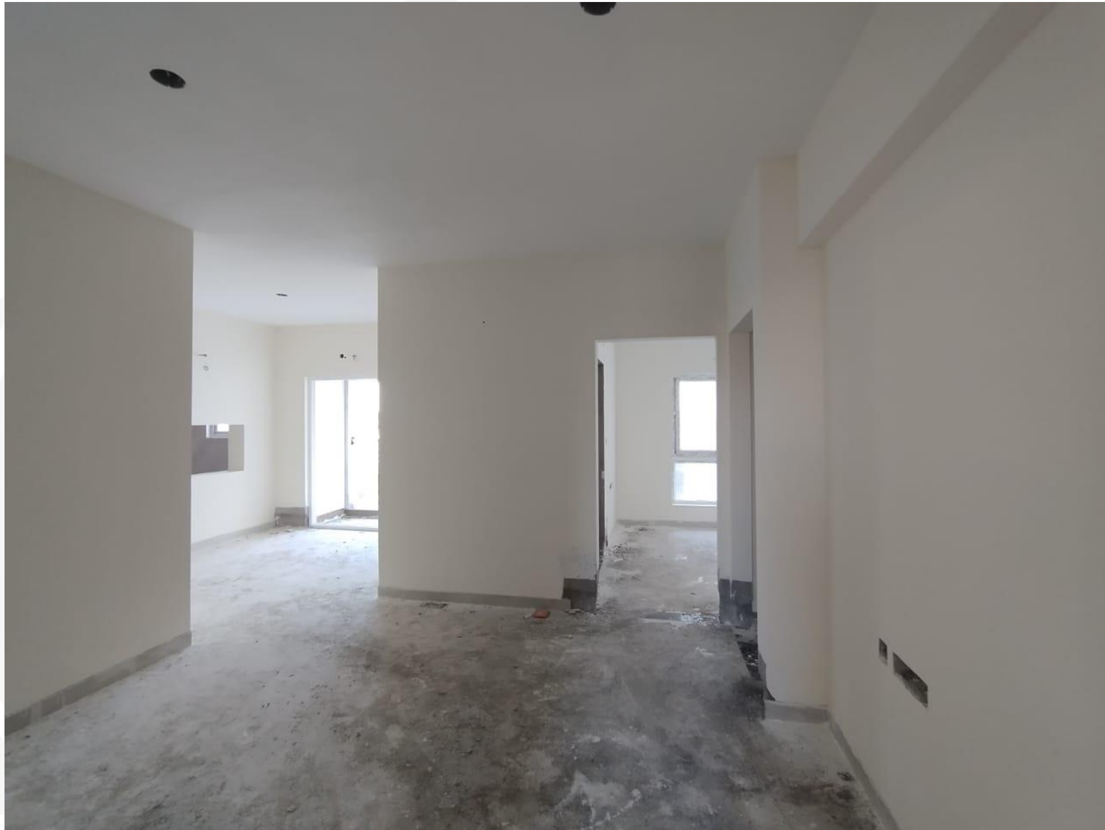
Internal Painting Work In Progress