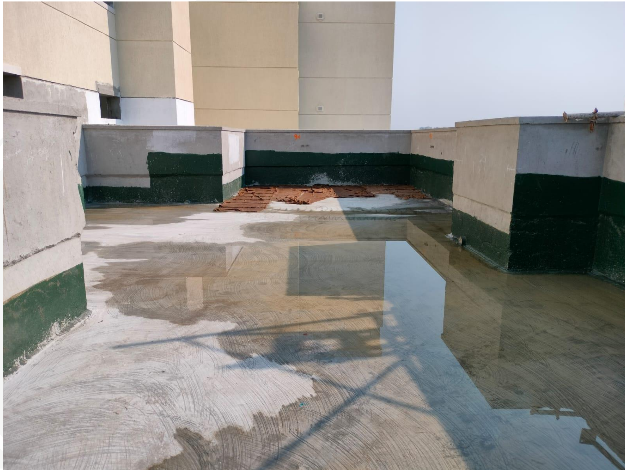
10 th Floor Level Low Terrace Waterproofing Work Completed