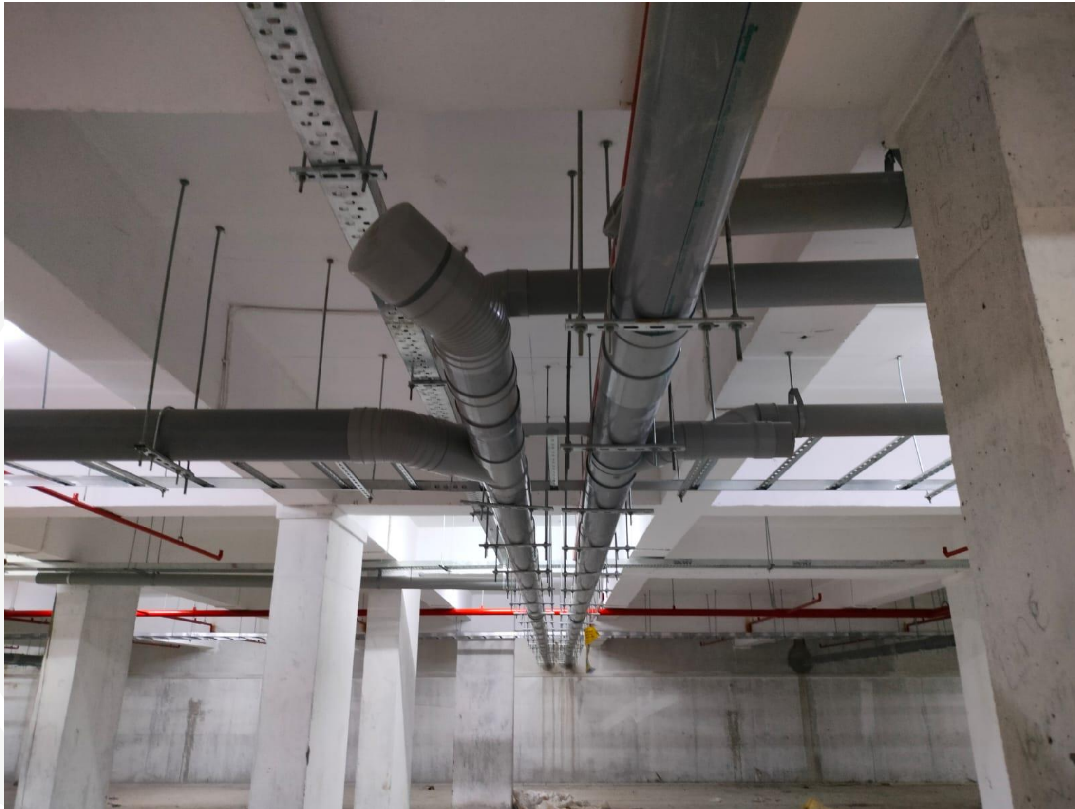
Basement Plumbing Work In Progress