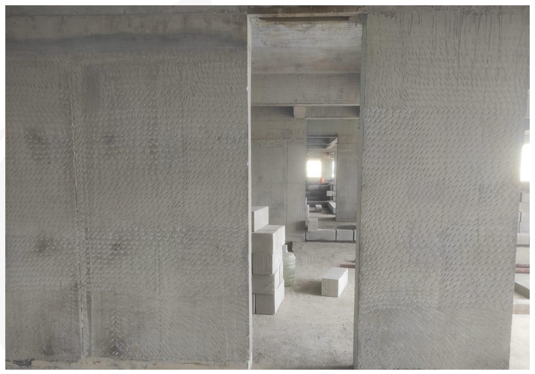
Main Building – Sixth Floor Hacking & Surface Grinding Work In Progress.