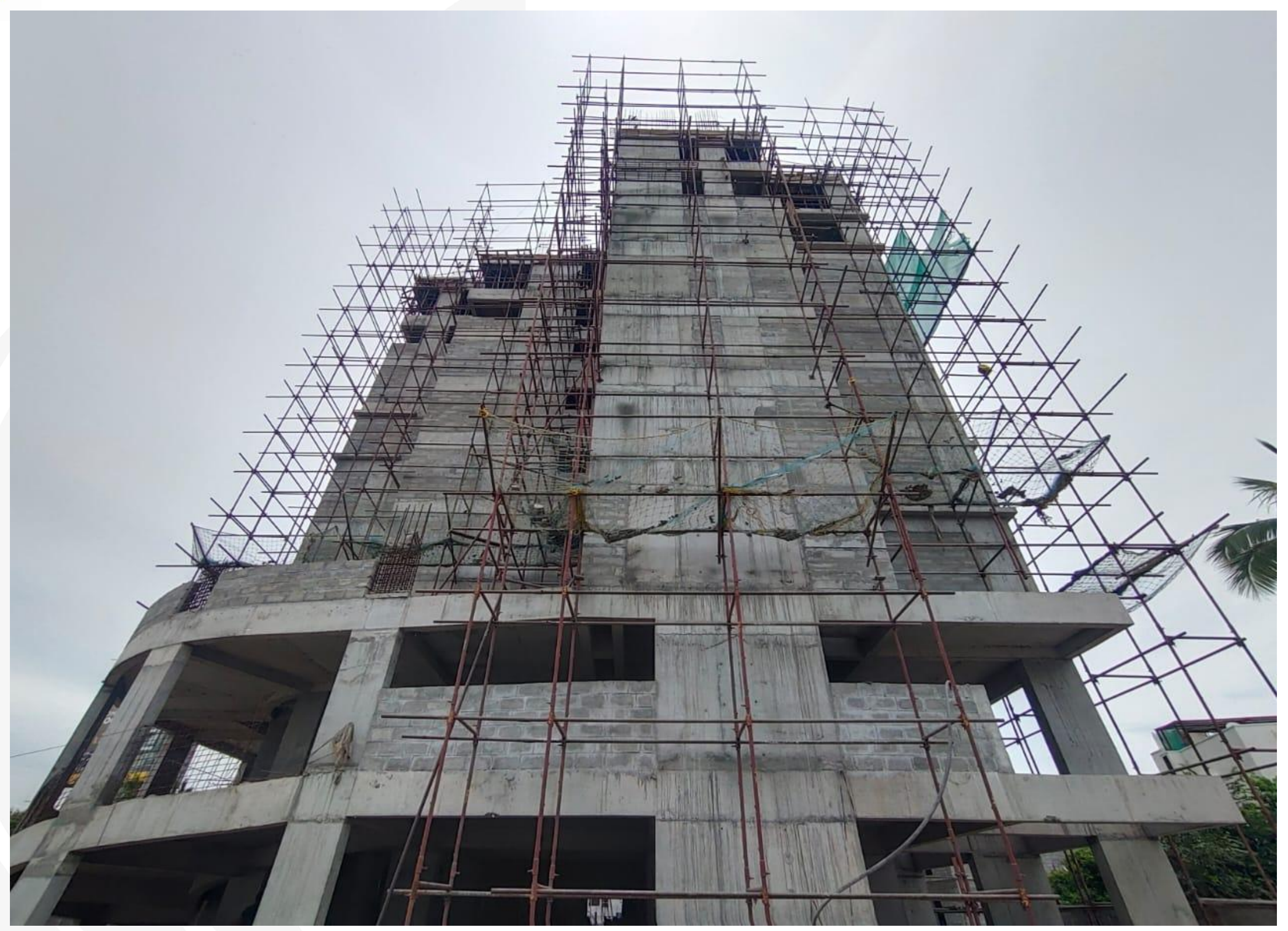
Main Building –East Side View.