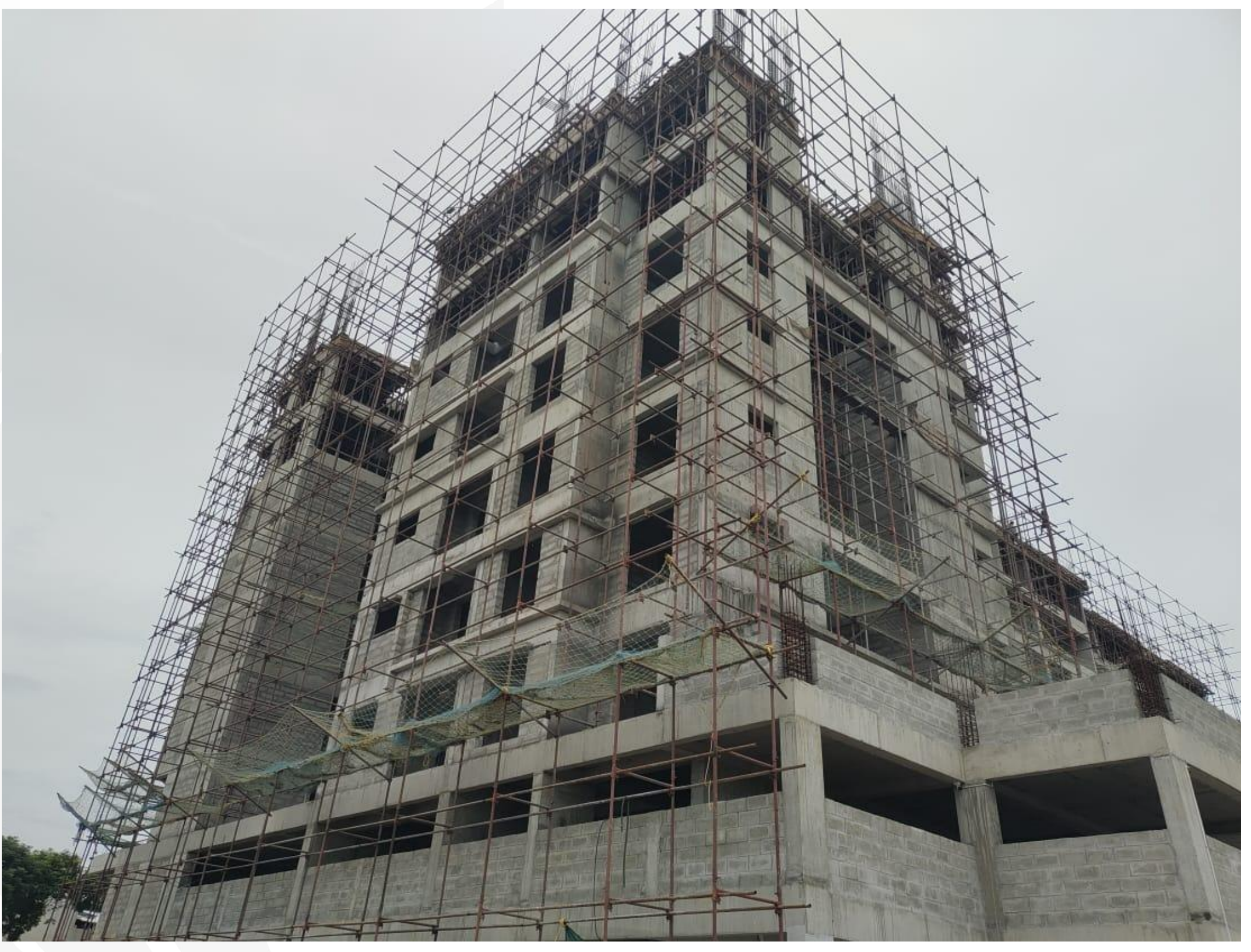
Main Building –West Side View.