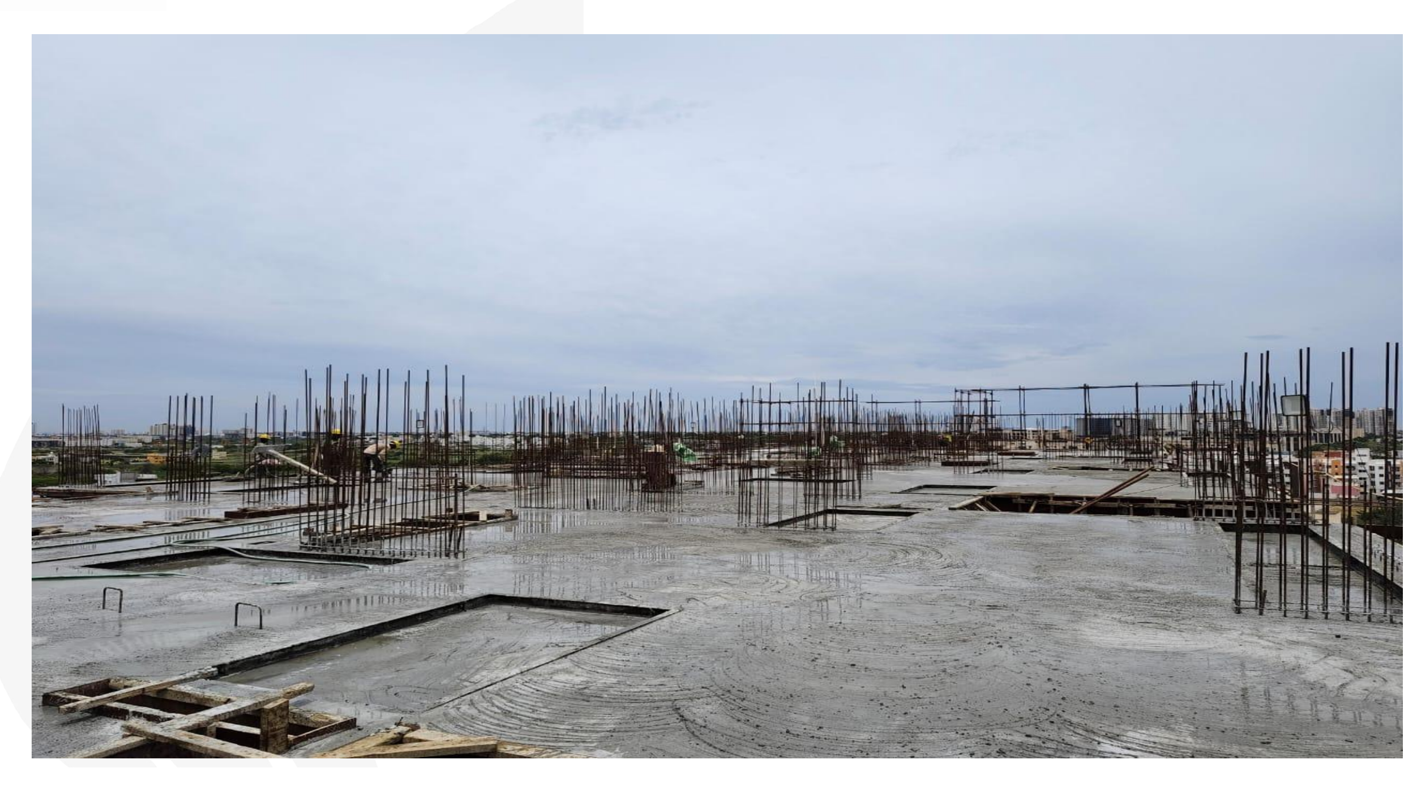
Main Building – Eighth Floor Slab Concrete Work Completed.