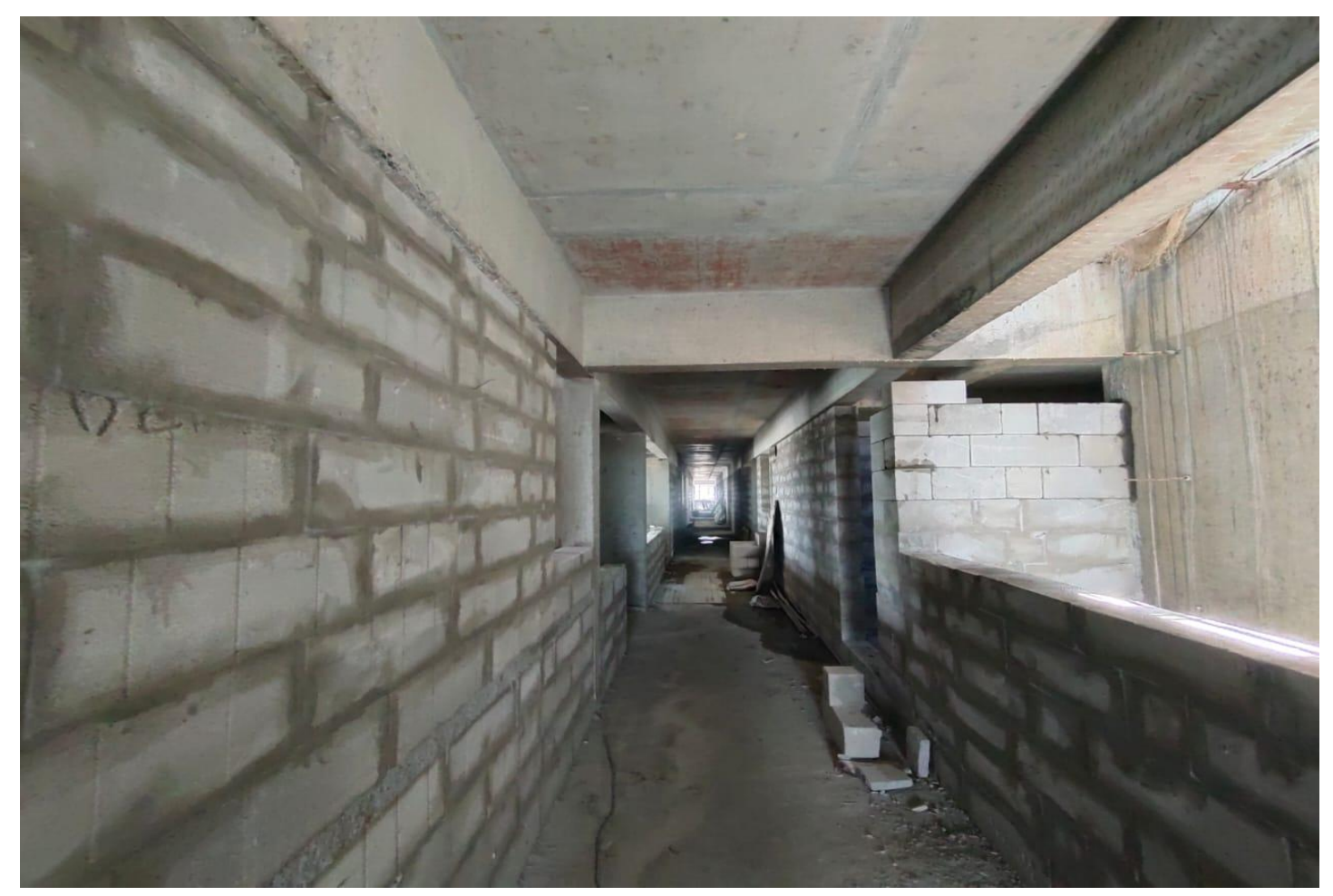
Main Building –Fifth Floor Block Work In progress.