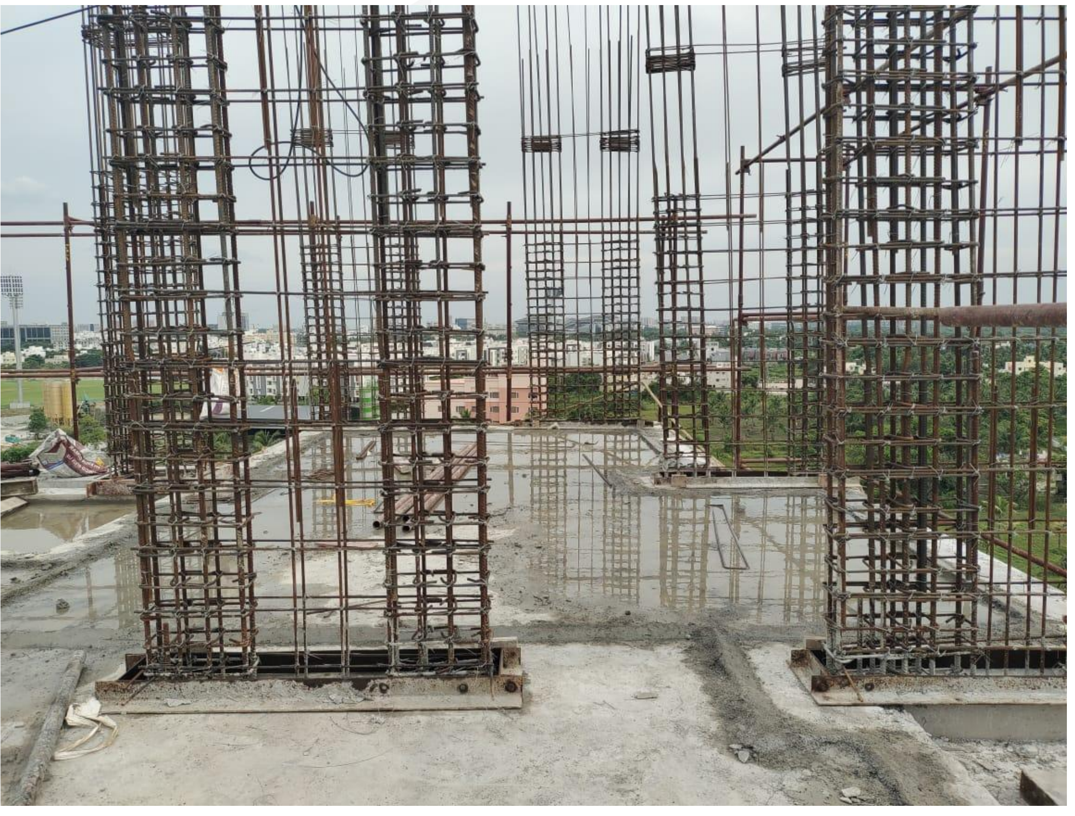
Main Building – Eighth Floor Column Starter & Reinforcement Work In Progress.