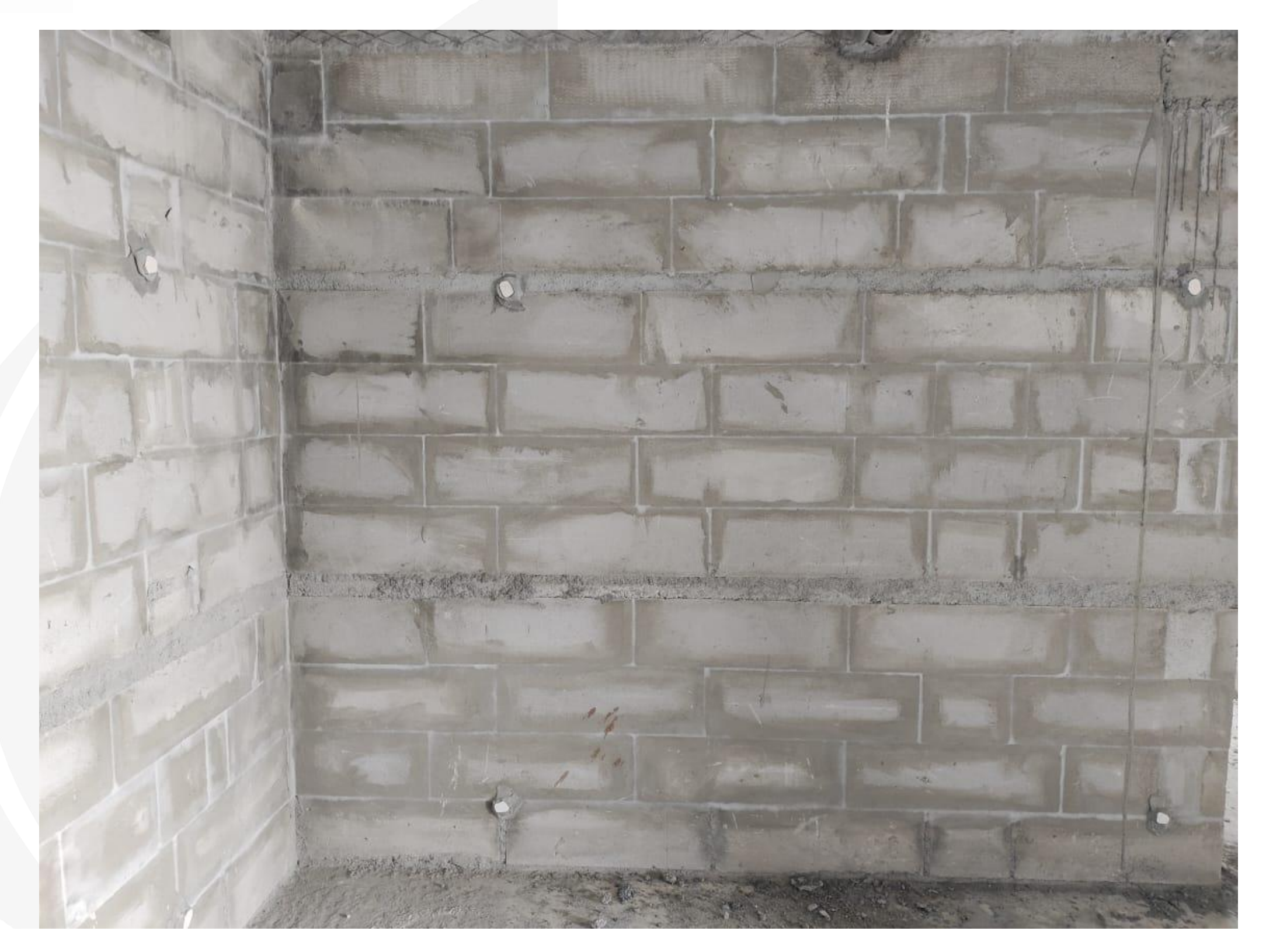
Main Building – Fourth Floor Button Marking Work In Progress.