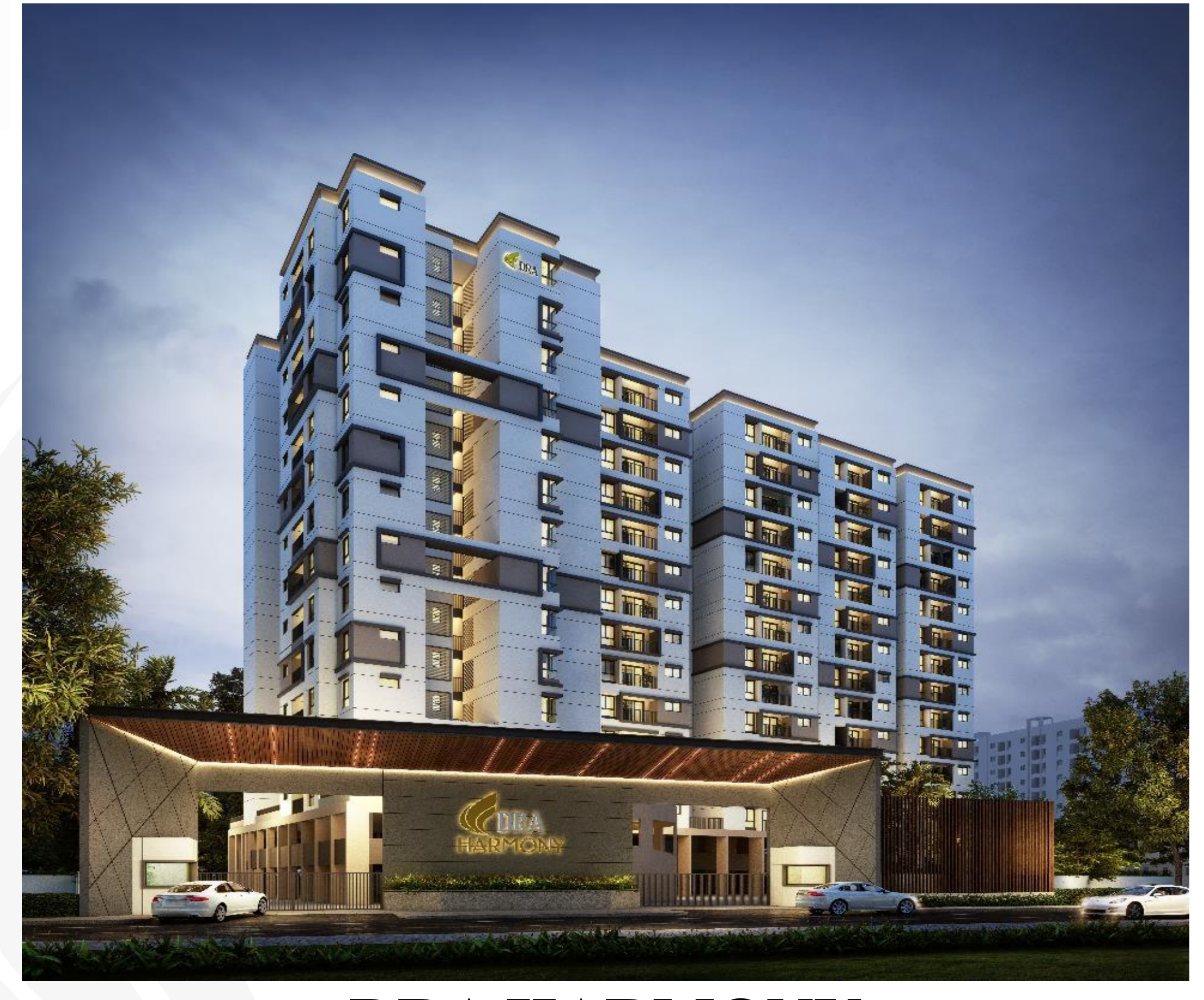
DRA HARMONY CONSTRUCTION UPDATES – AUGUST 2024