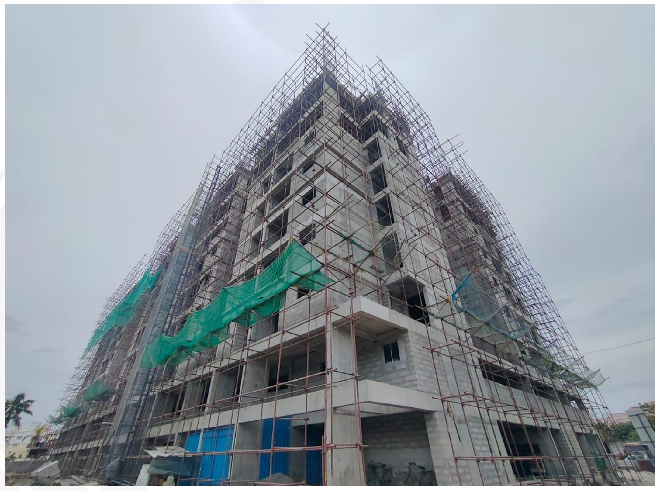
Main Building – West & North Side View.