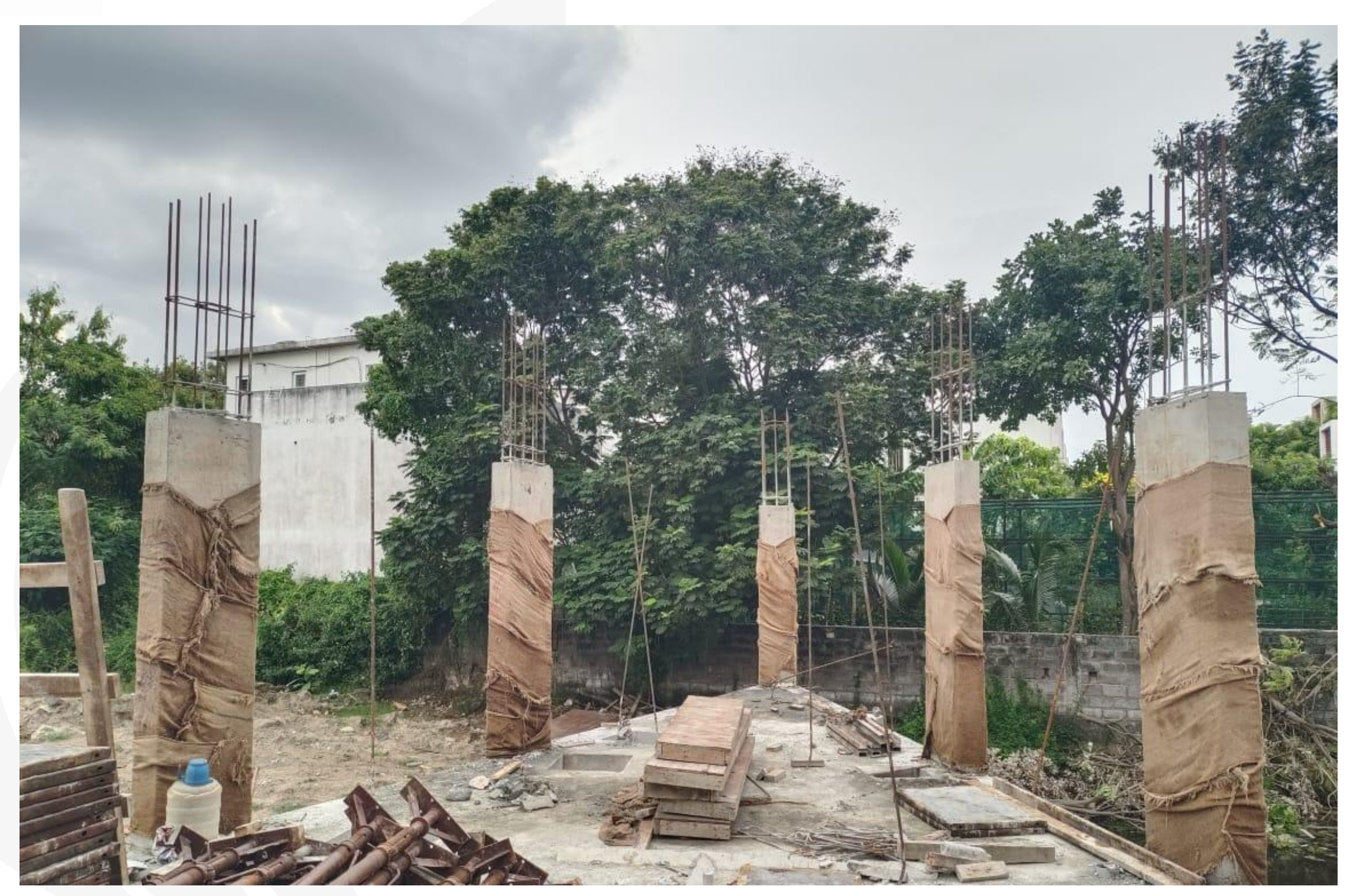
STP – Head Room Column Concrete Work Completed.