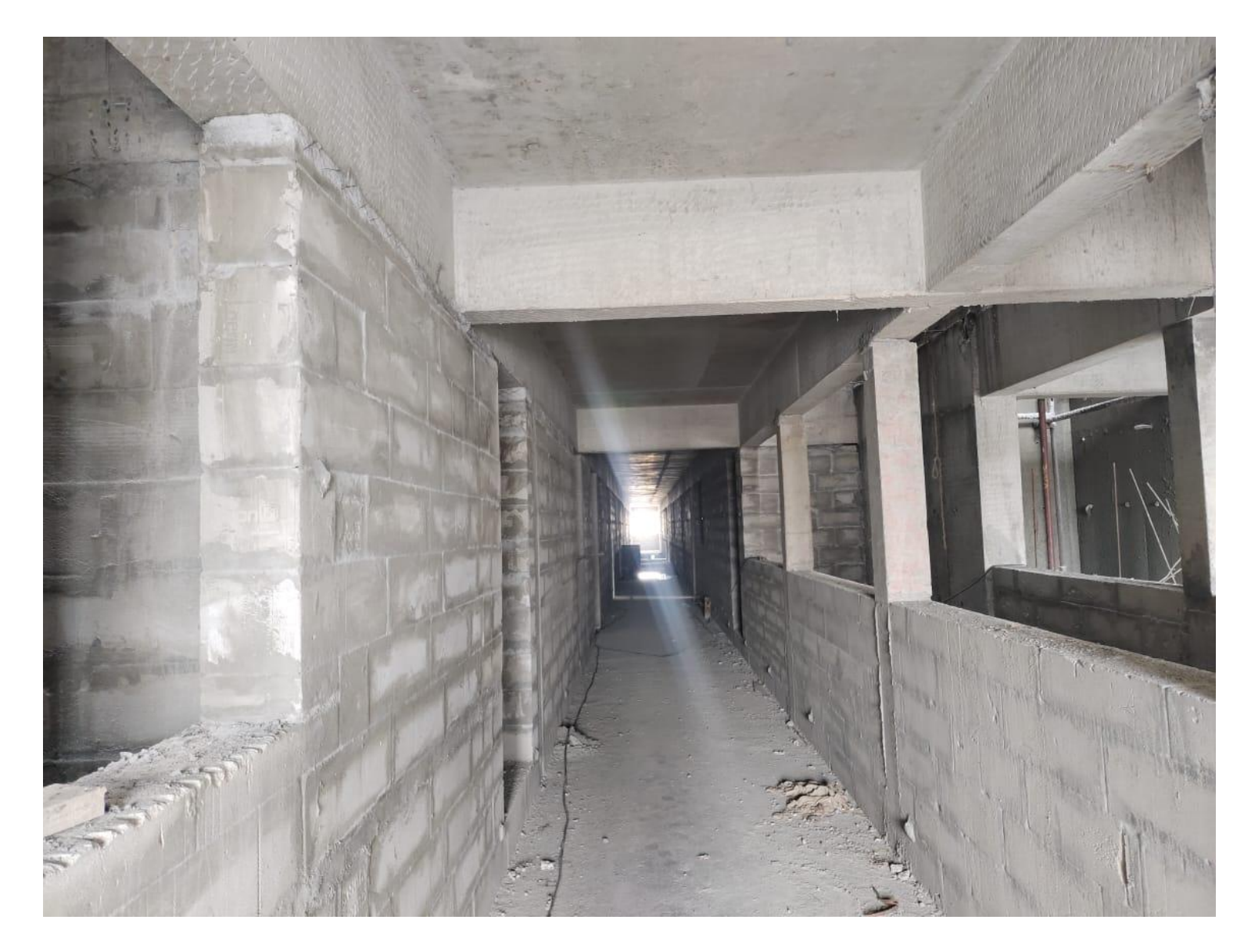
Main Building – Fourth Floor Block Work Completed.