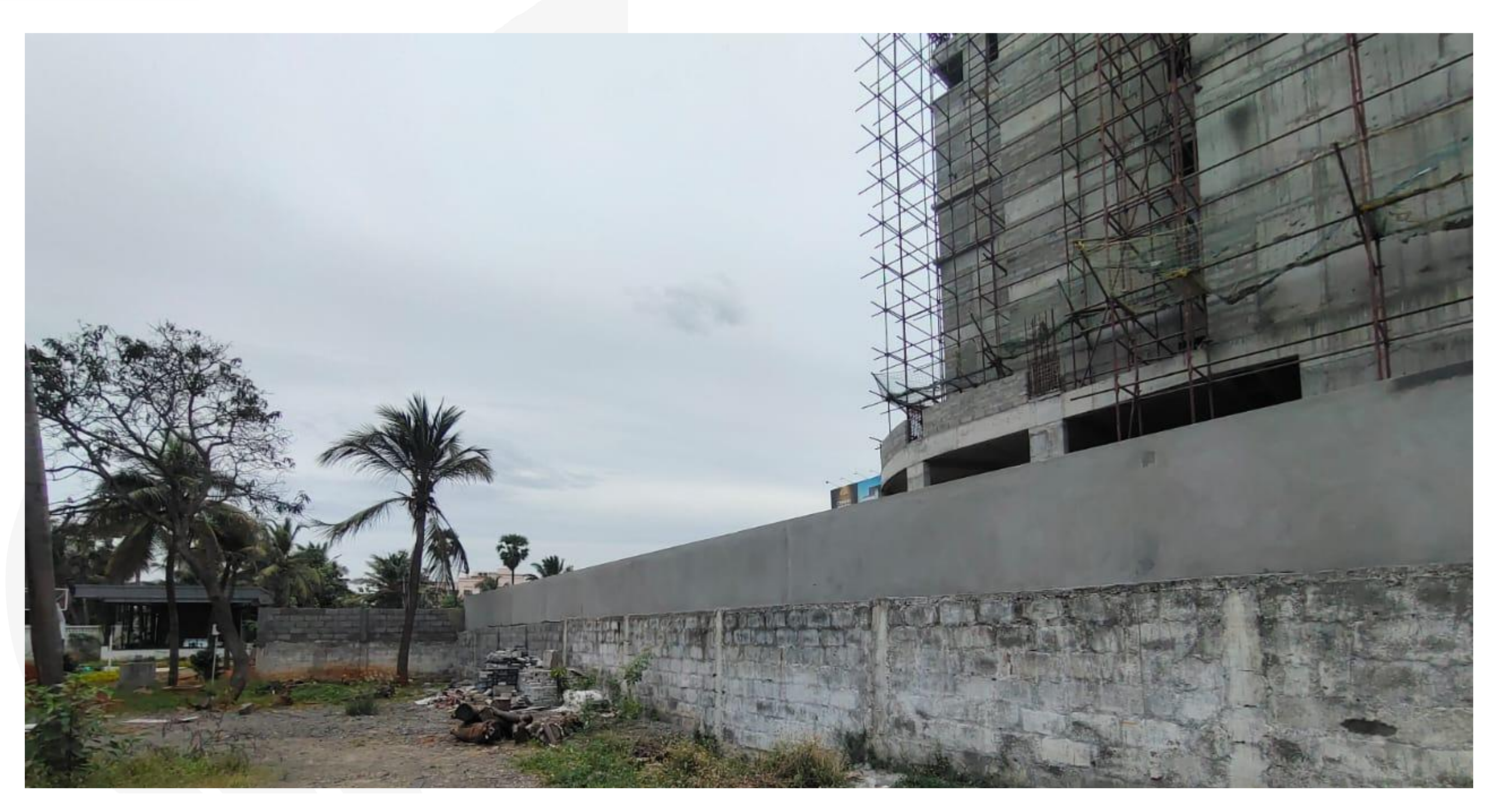
External Compound Wall Plastering – East side Plastering Work In Progress.