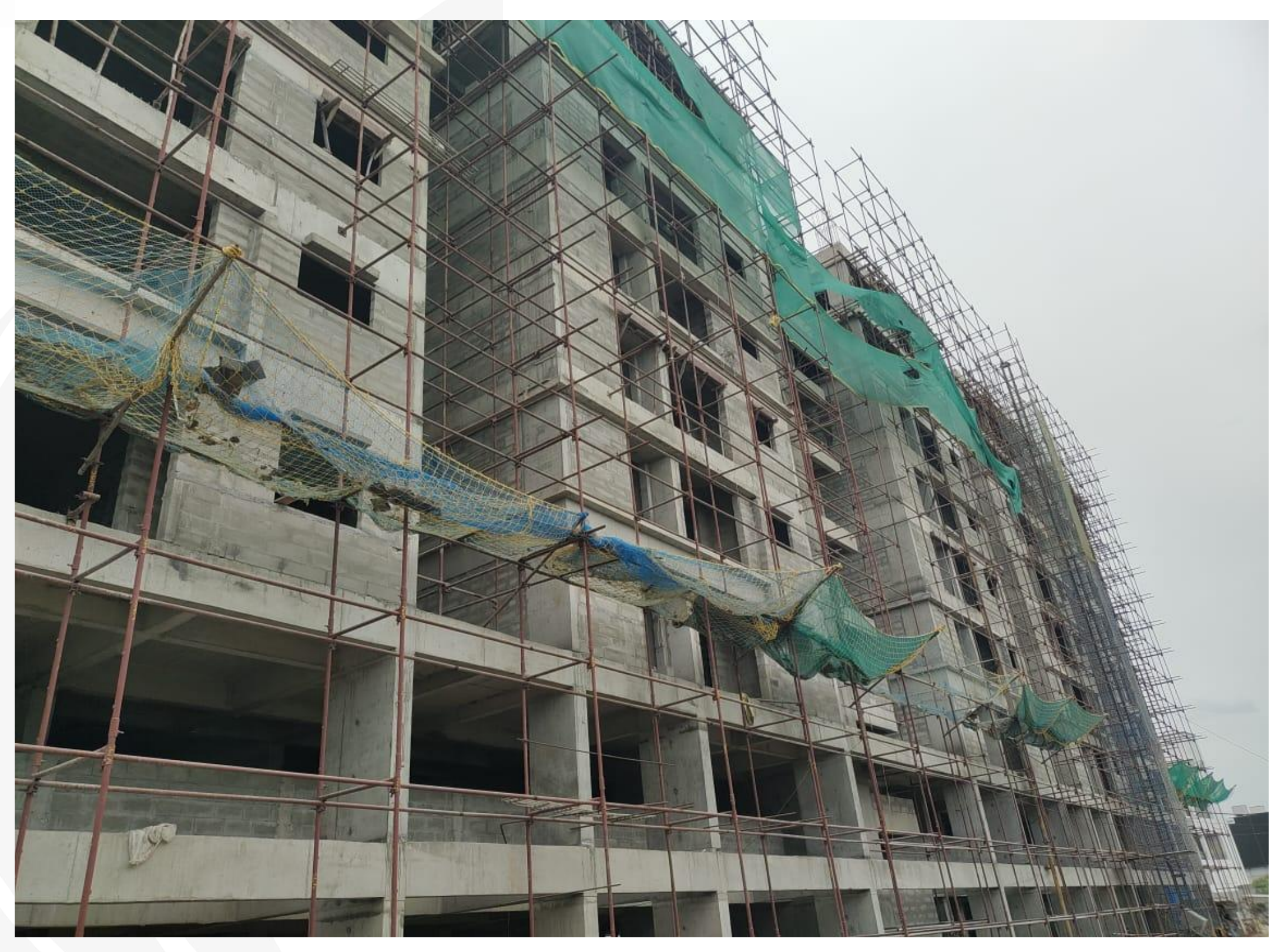
Main Building - North Side View