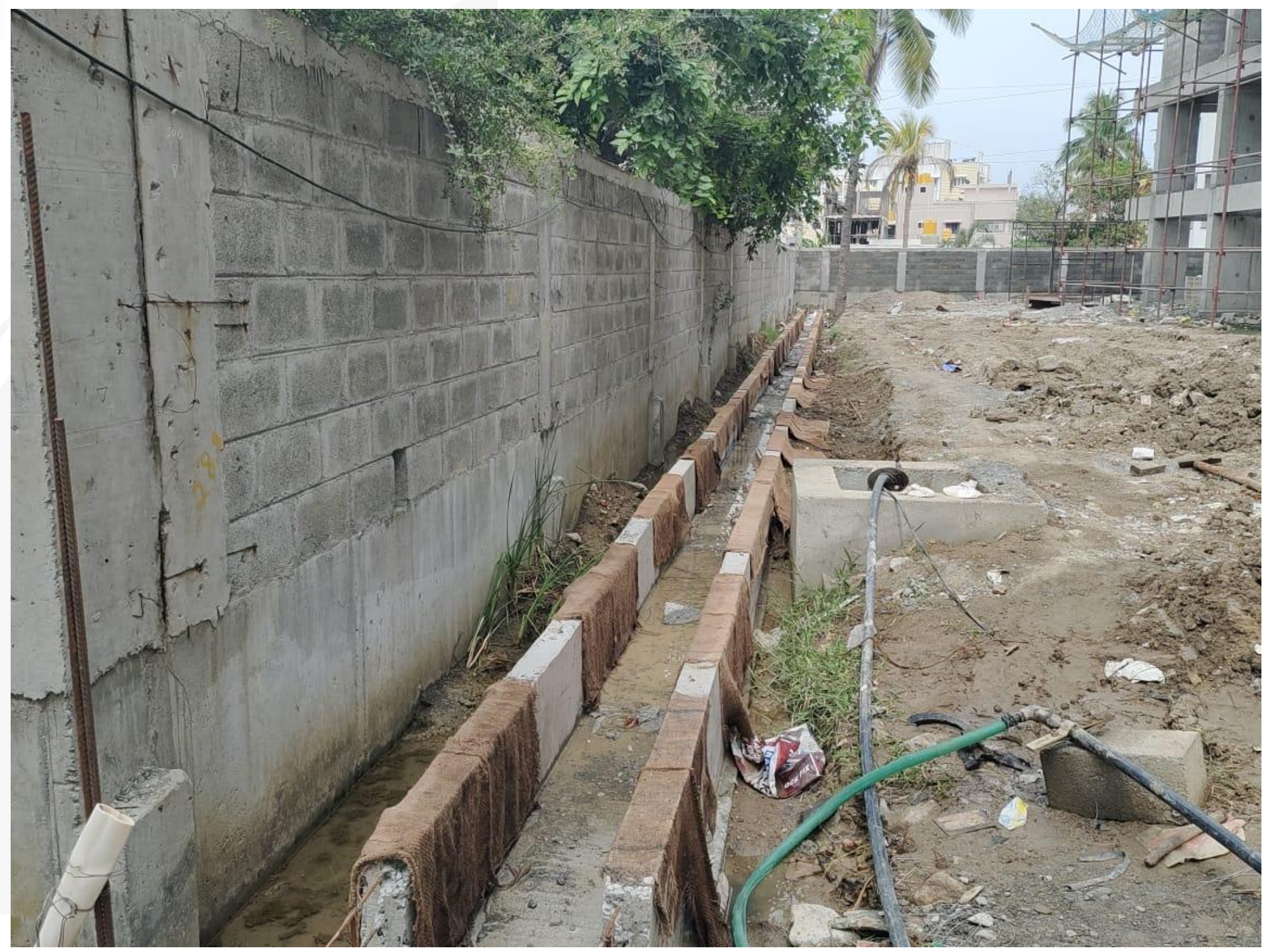
Storm Water Trench – North Side Trench Raft concrete work Completed & Wall Concrete Work In Progress.