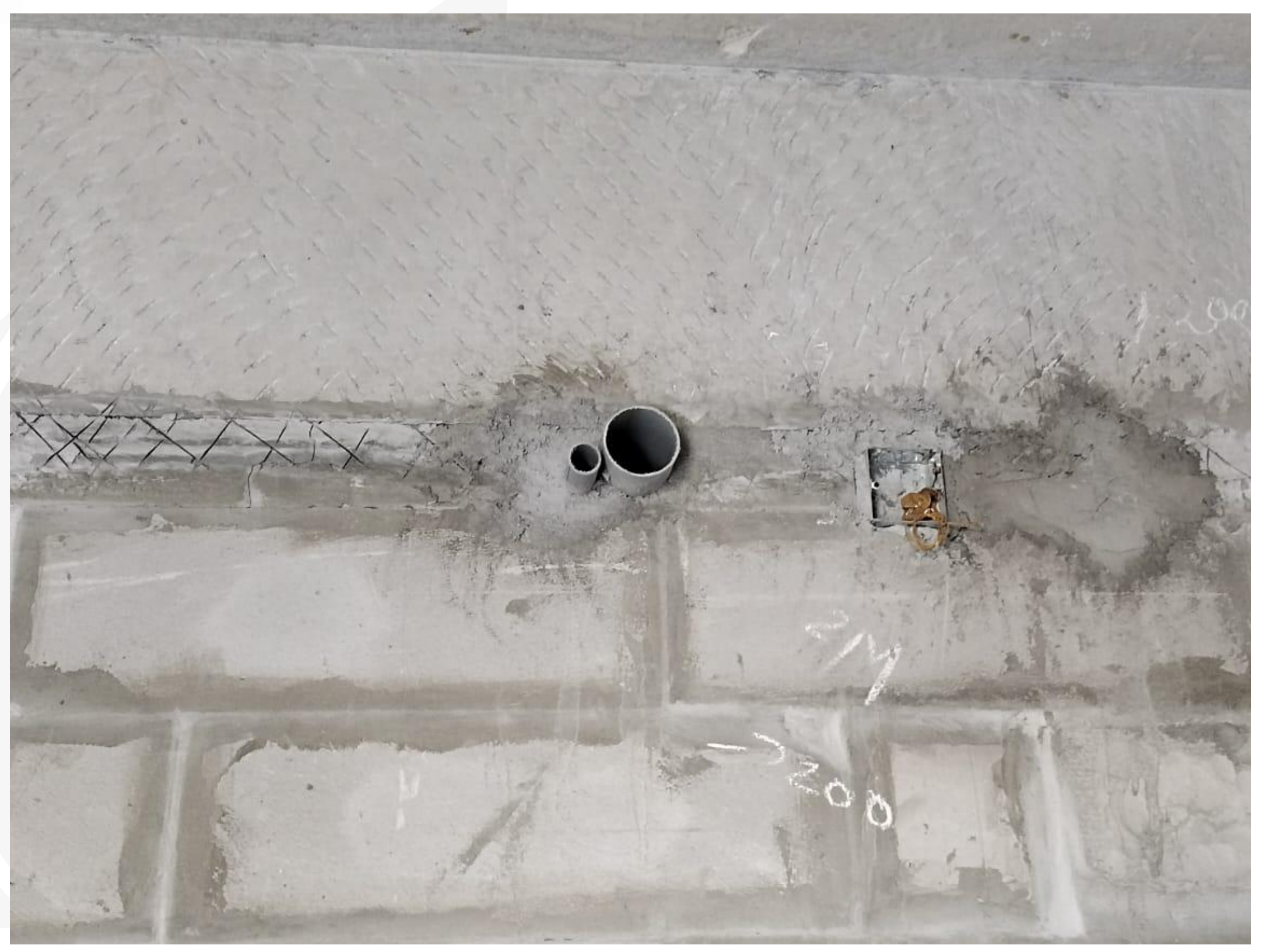
Main Building Plumbing – Third Floor AC Sleeve Fixing Work In Progress.