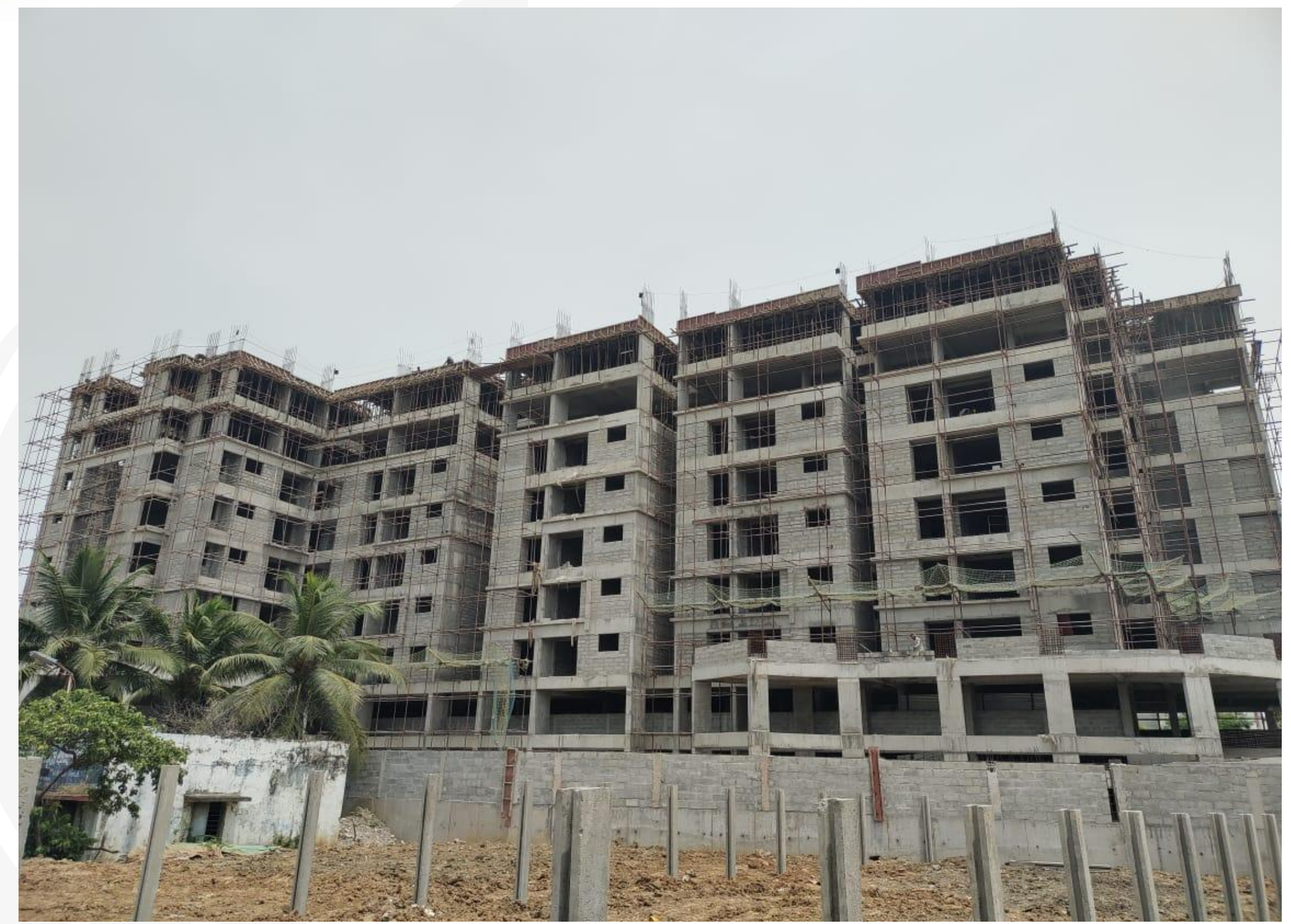
Main Building - South Side View.