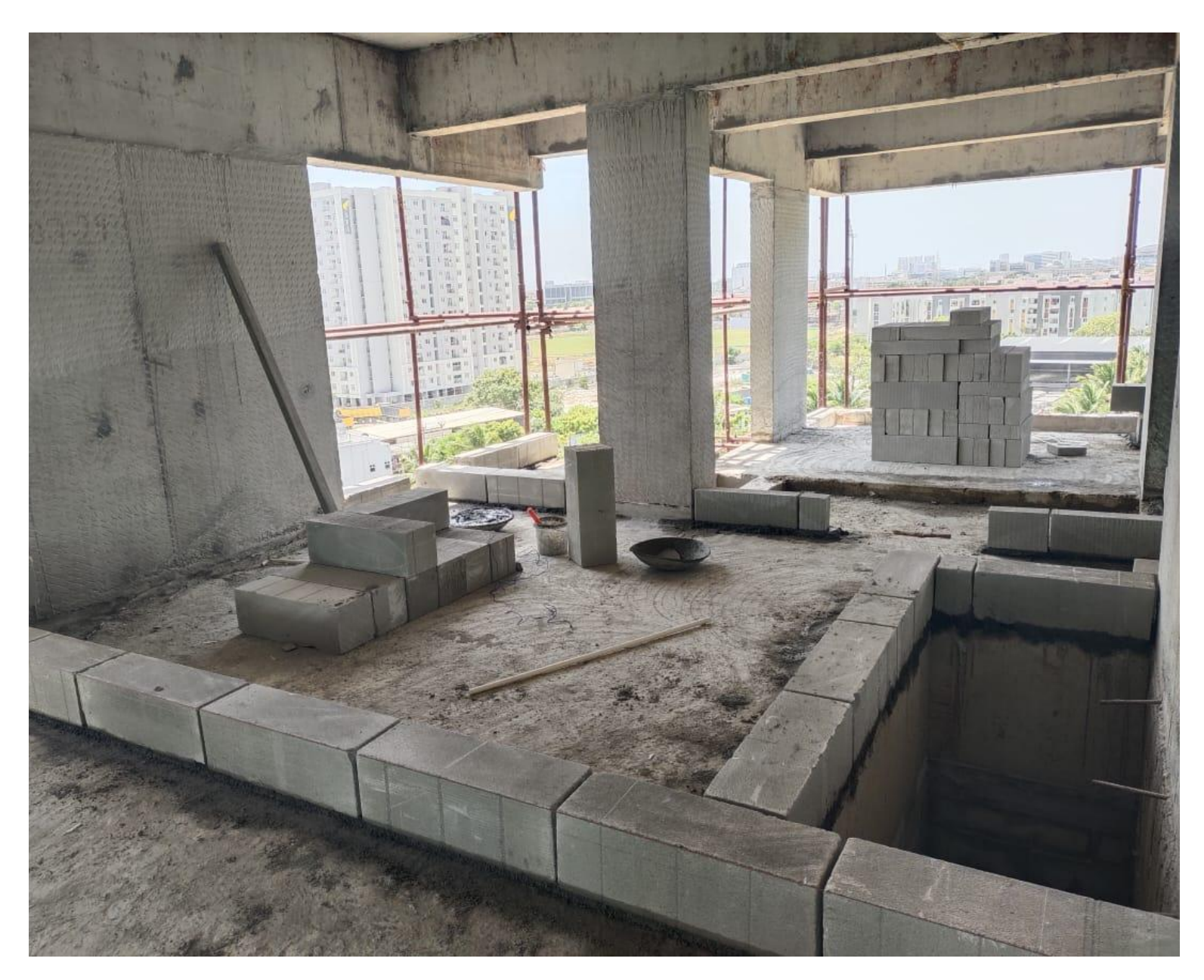
Main Building – Sixth Floor Block Work In Progress.