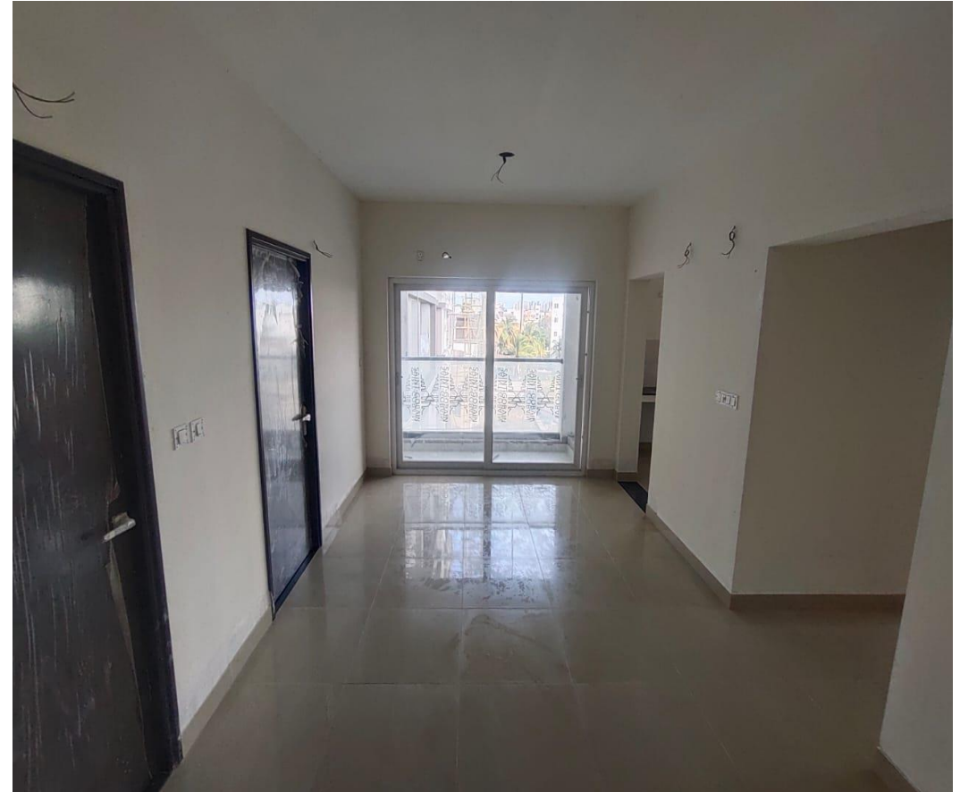
2 ND FLOOR SOAP WASH WORK IN PROGRESS