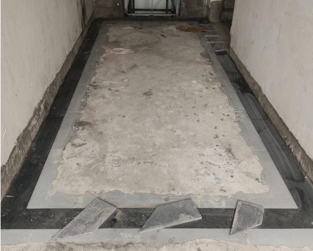
LIFT CORRIDOR GRANITE WORK IN PROGRESS