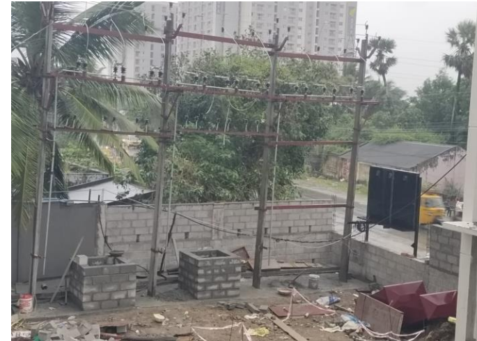
EXTERNAL - TRANSFORMER YARD WORK IN PROGRESS