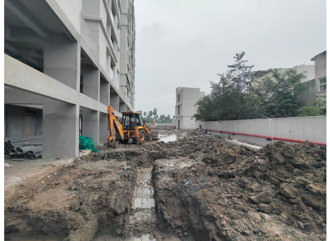
PLUMBING CHAMBER – EXCAVATION WORK IN PROGRESS