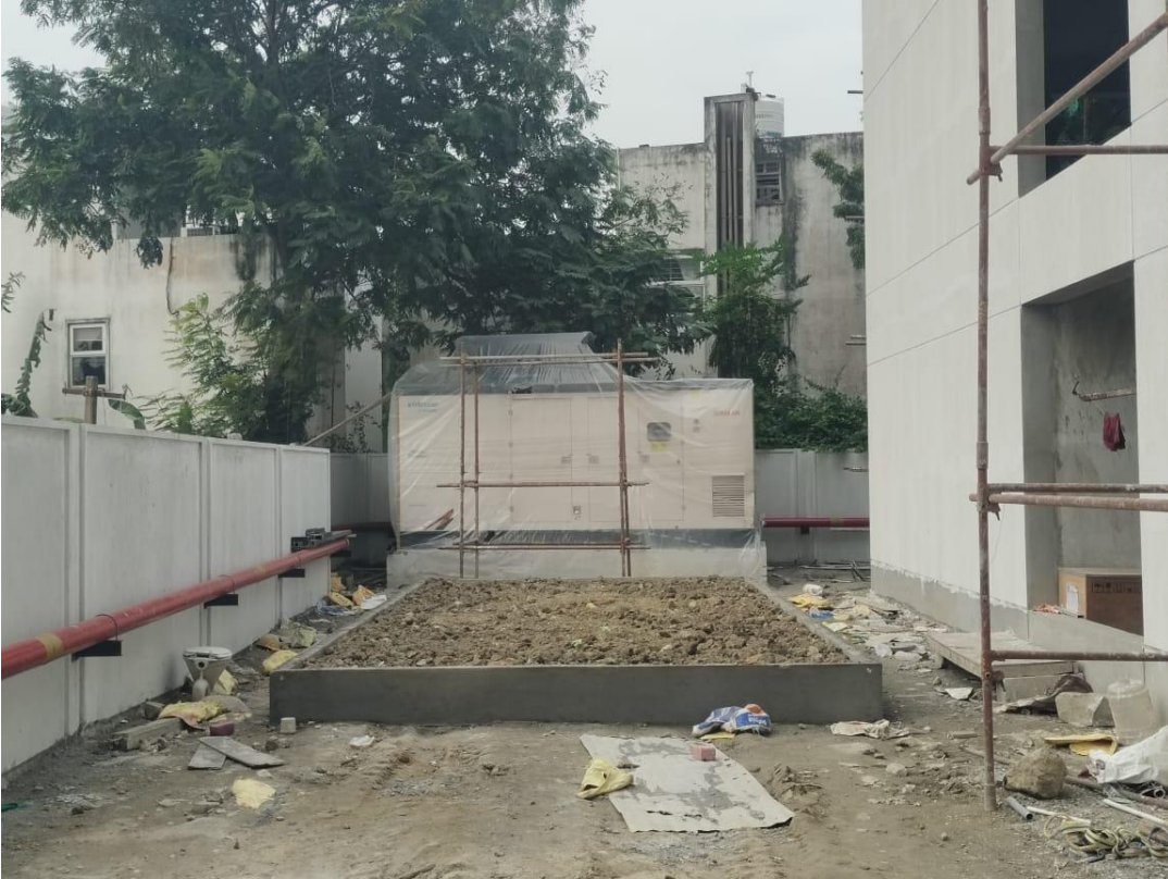
BADMINTON COURT- FILLING WORK IN PROGRESS