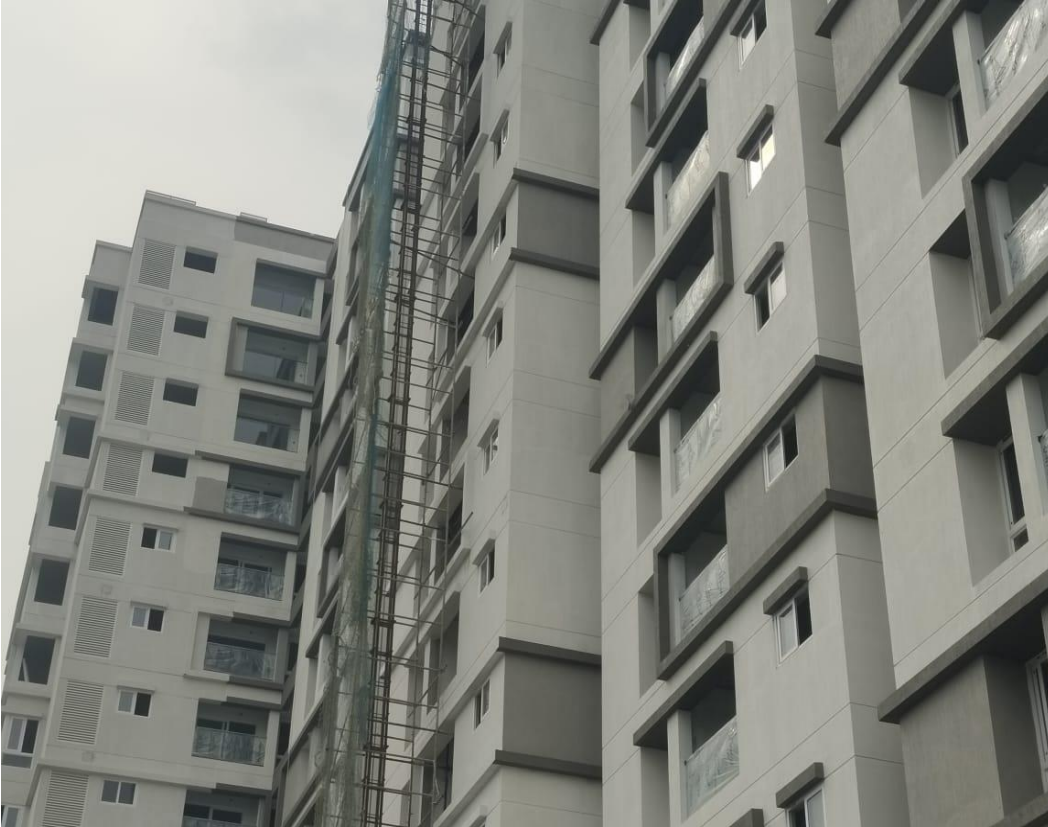
EXTERNAL – SOUTHSIDE 1 ST COAT PAINTING WORK IN PROGRESS