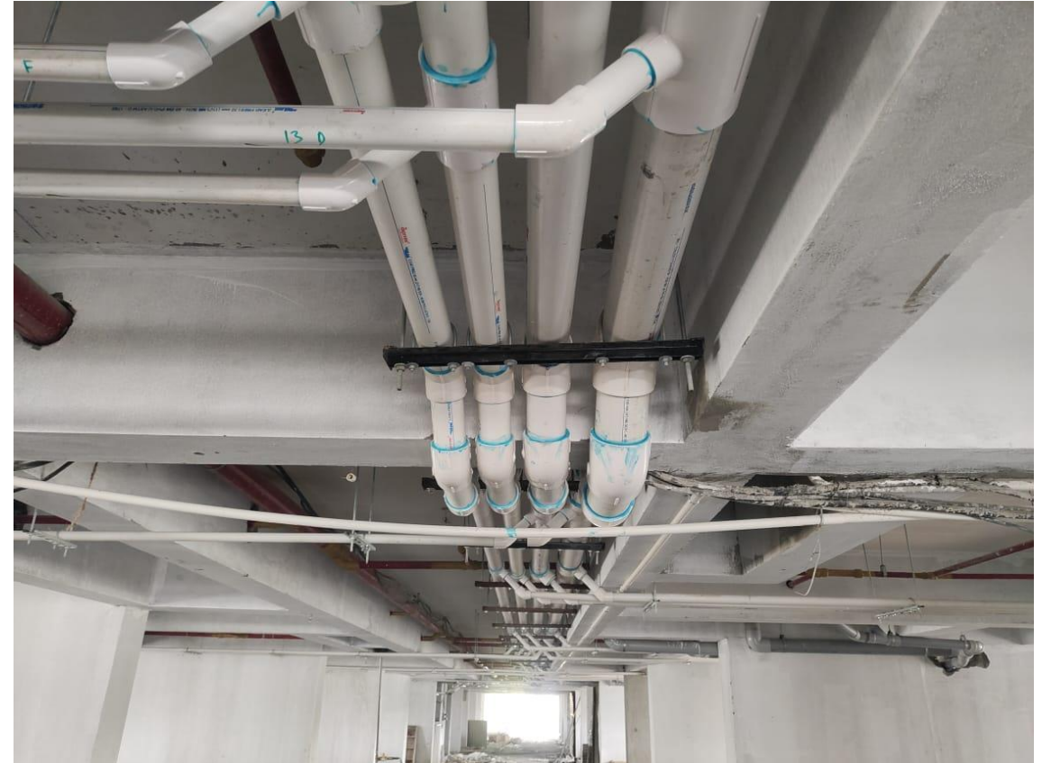
PLUMBING - UPPER STILT RING MAIN LINE WORK IN PROGRESS