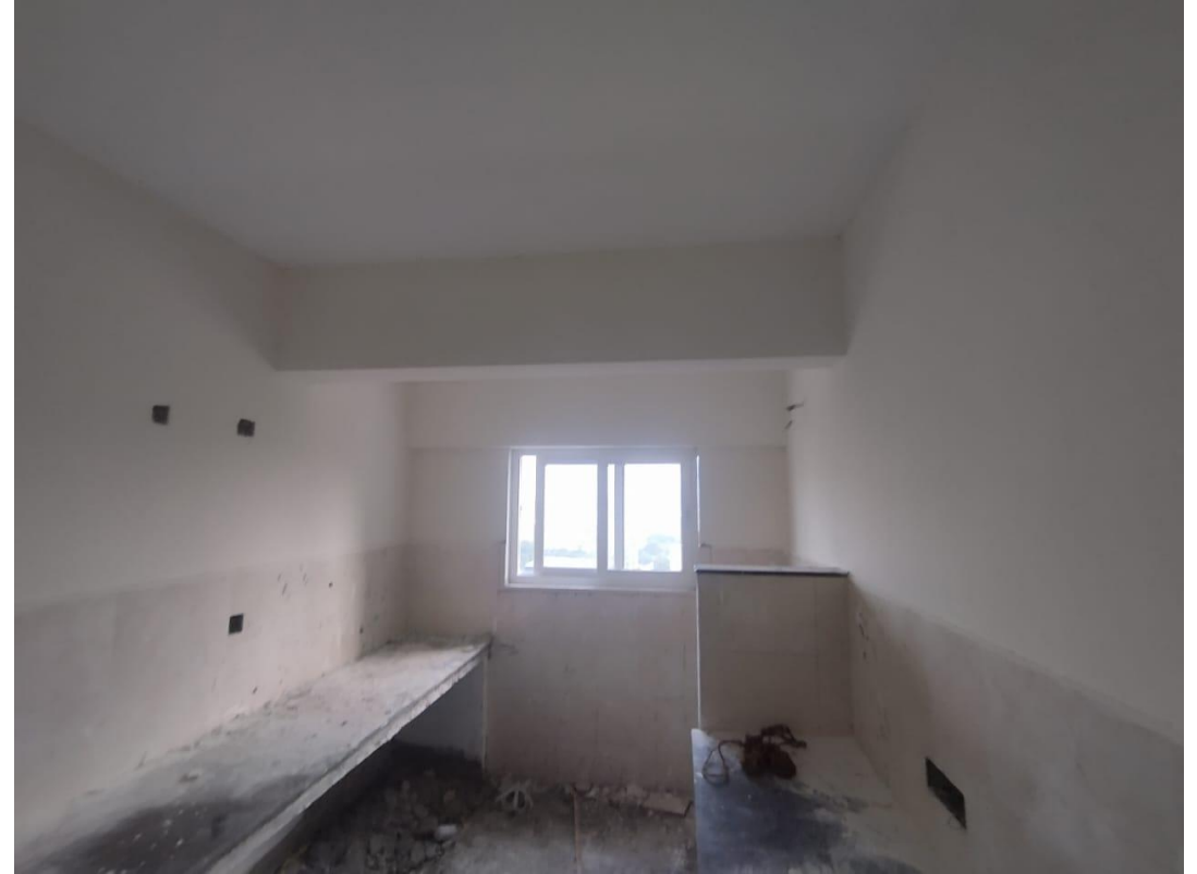
UPVC 11 th FLOOR FIXING Work IN PROGRESS