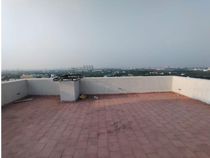
PARAPET TEXTURE WORK IN PROGRESS