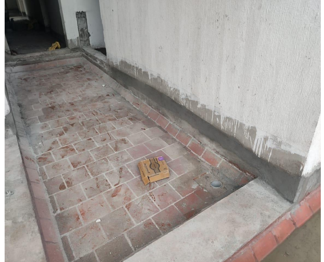
COMMON TERRACE – PRESS TILES LAYING COMPLETED