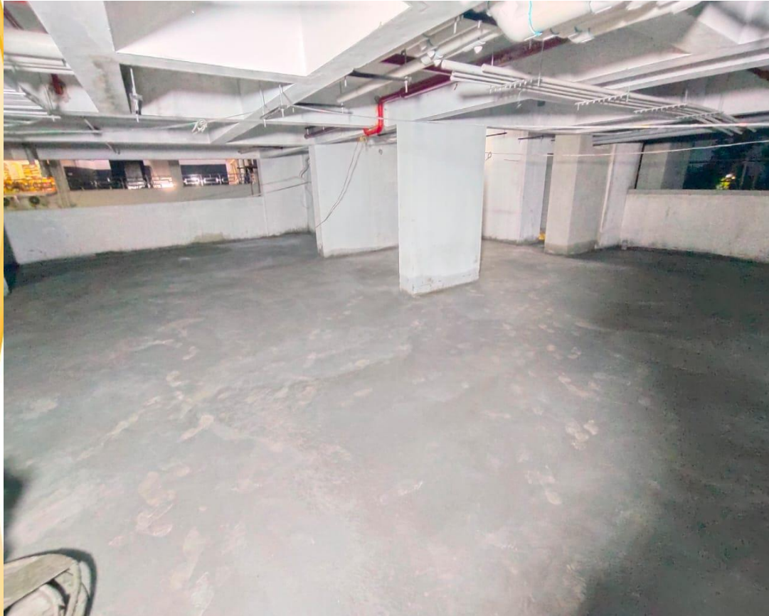
UPPER STILT 1 ST PART SCREED CONCRETE WORK COMPLETED