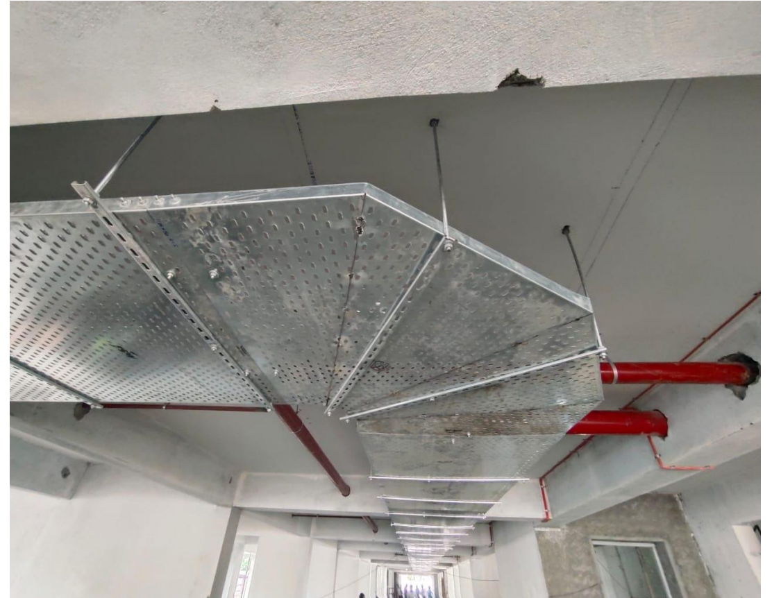
STILT & UPPER STILT TRAY FIXING WORK IN PROGRESS