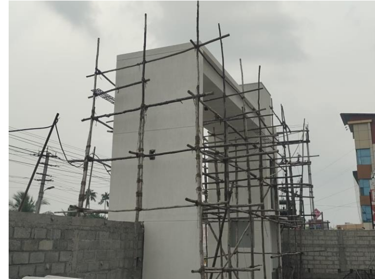
ENTRANCE ARCH 1 ST COAT PAINTING WORK IN PROGRESS