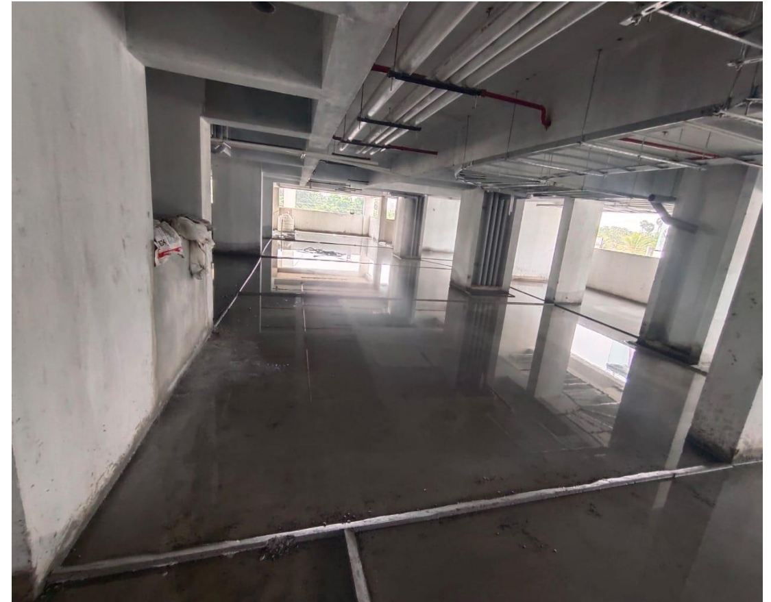
UPPER STILT SCREED CURING WORK IN PROGRESS