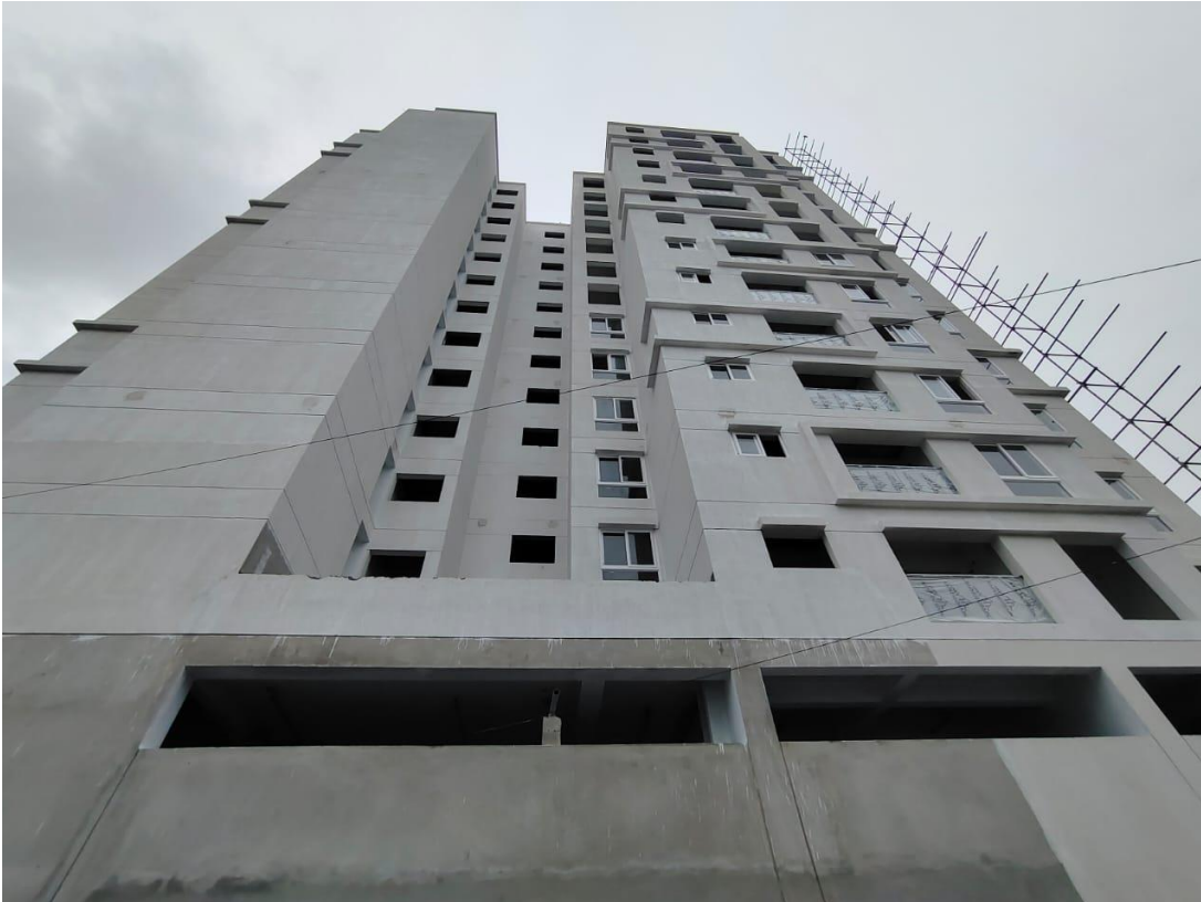
WEST ELEVATION - PREVIOUS MONTH