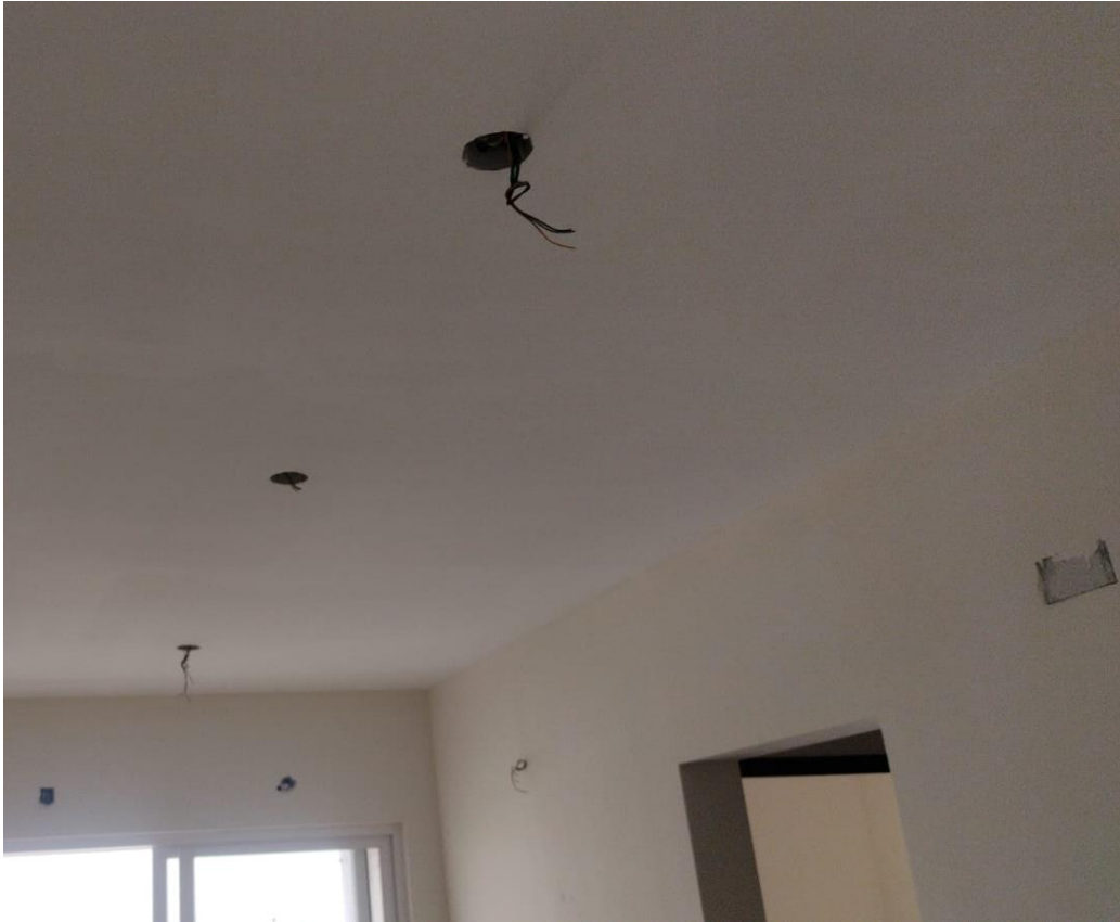
7 TH FLOOR WIRING WORK COMPLETED