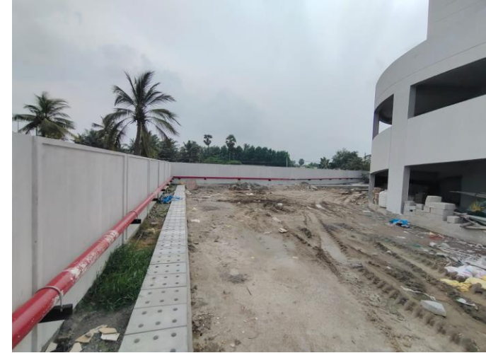
EXTERNAL – SOUTH&EAST SIDE TRENCH PRECAST SLAB LAYING COMPLETED