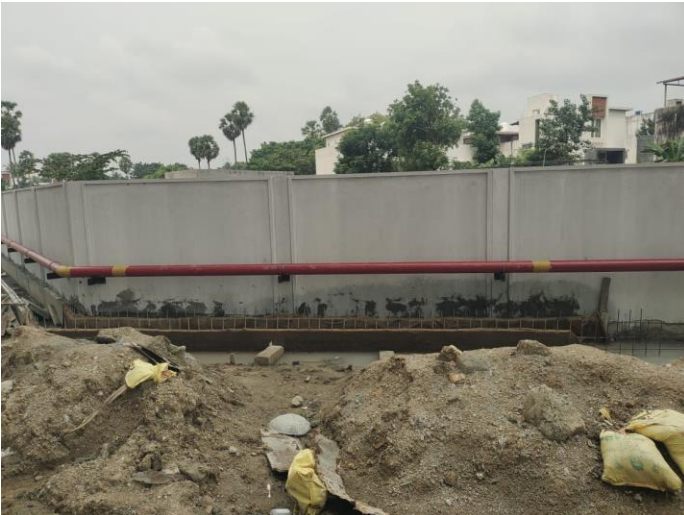
EXTERNAL – COMPOUNDWALL HYDRANT LINE FIXING WORK IN PROGRESS