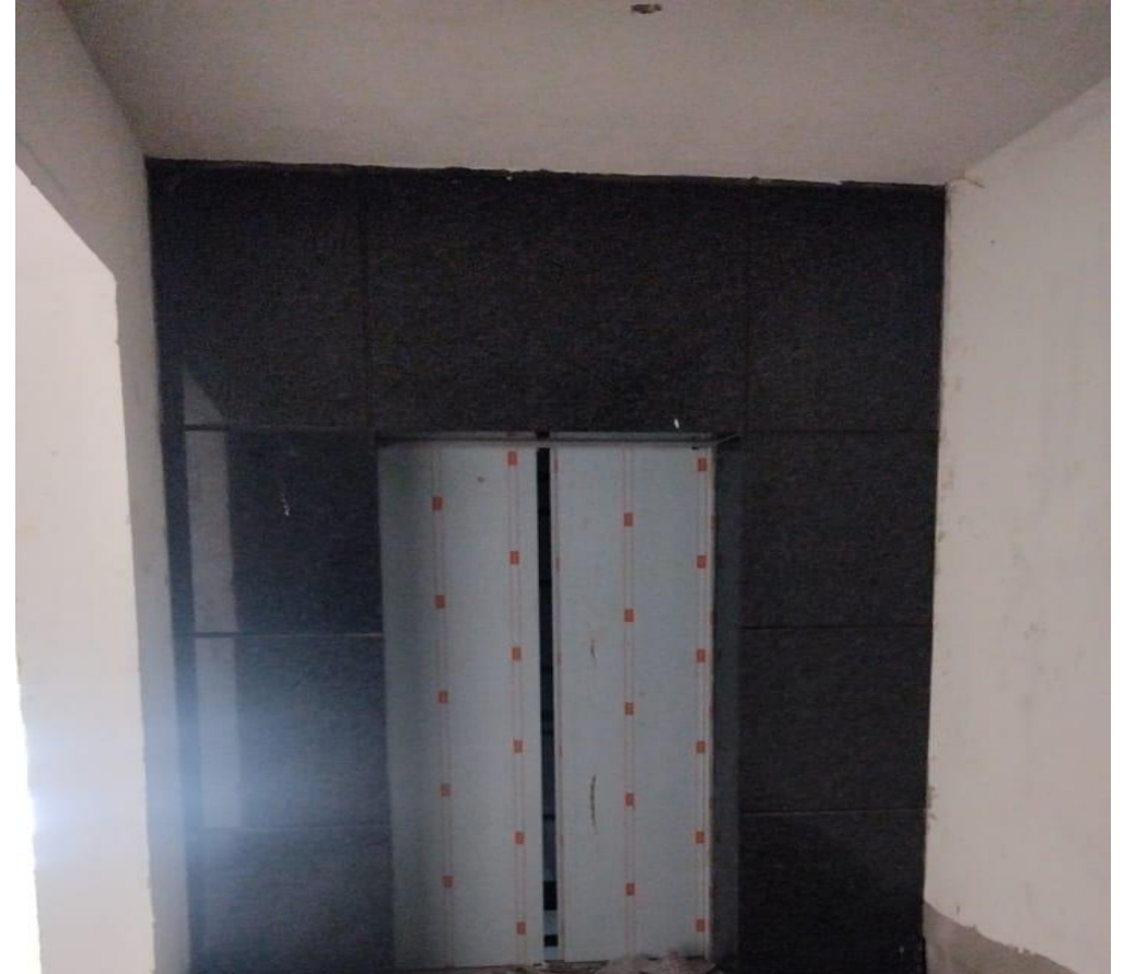
LIFT GRANITE WORK IN PROGRESS