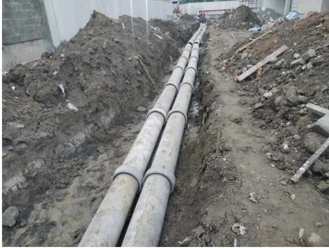
EXTERNAL – ELECTRICAL CHAMBER WORK IN PROGRESS