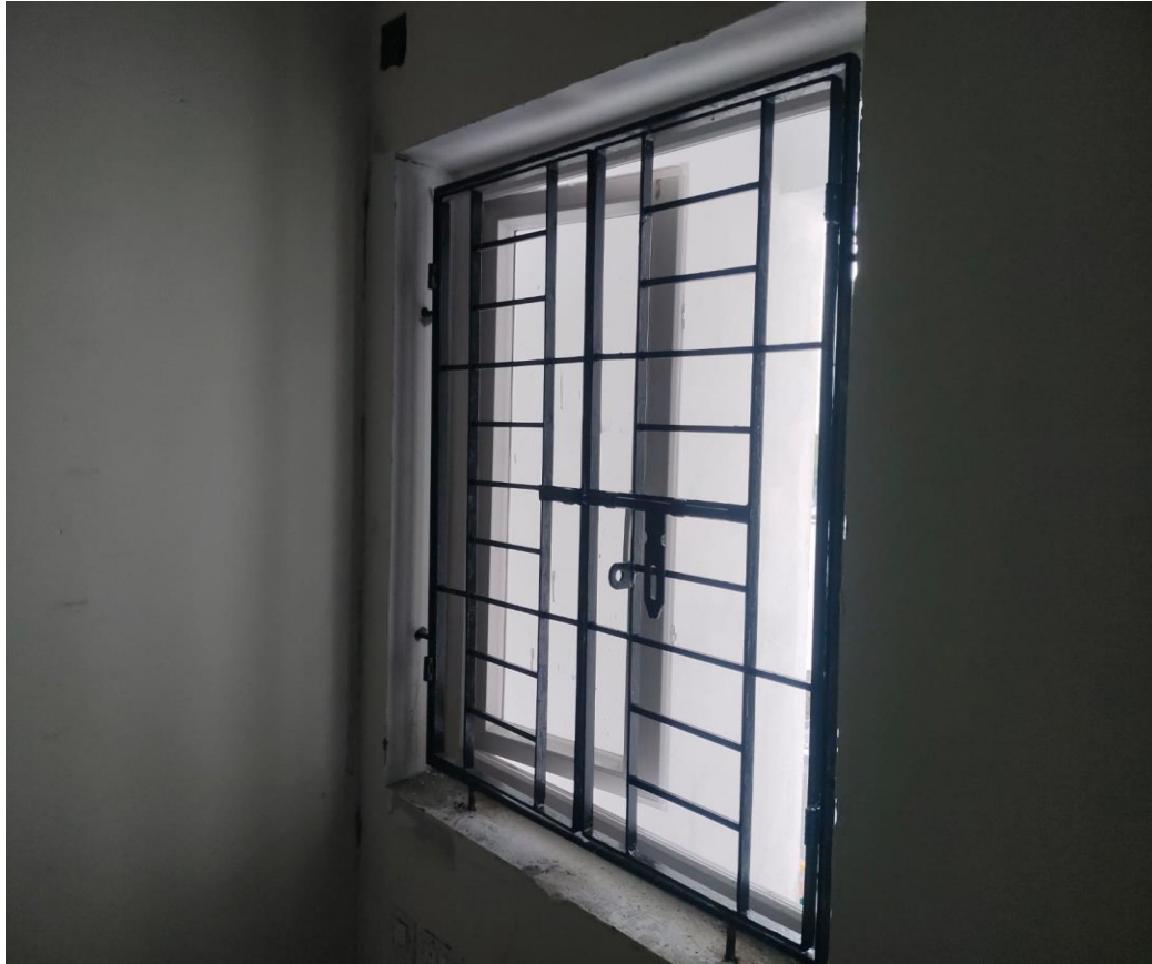
6 TH FLOOR GRILL FIXING WORK COMPLETED