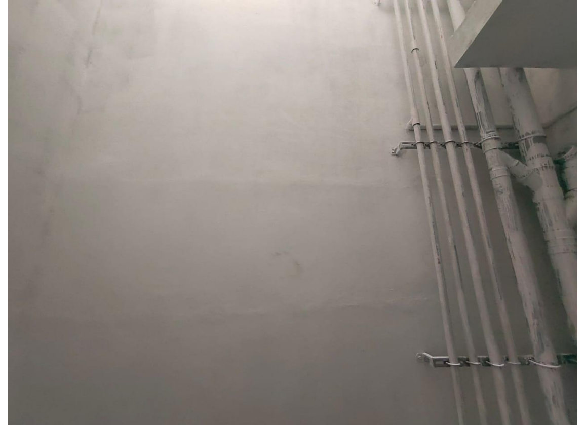
OTS&SHAFT – 1 ST COAT PAINTING IN PROGRESS