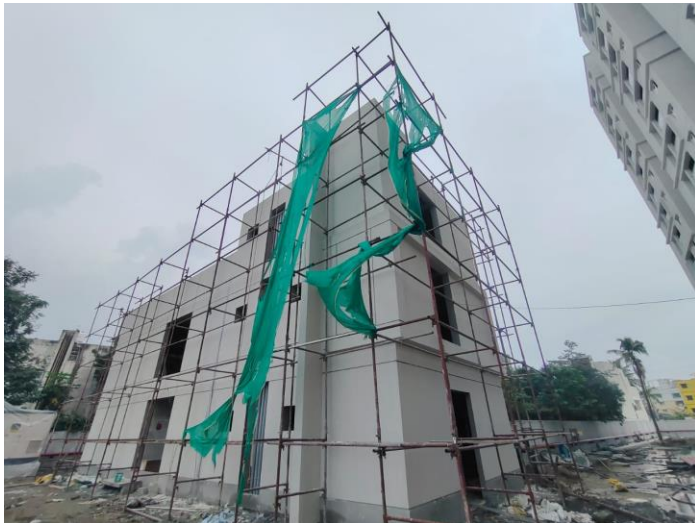
AMENITY BLOCK TEXTURE WORK COMPLETED