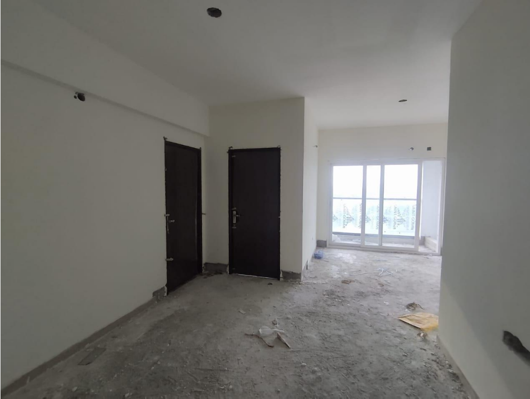
9 th FLOOR DOOR FIXING WORK IN PROGRESS