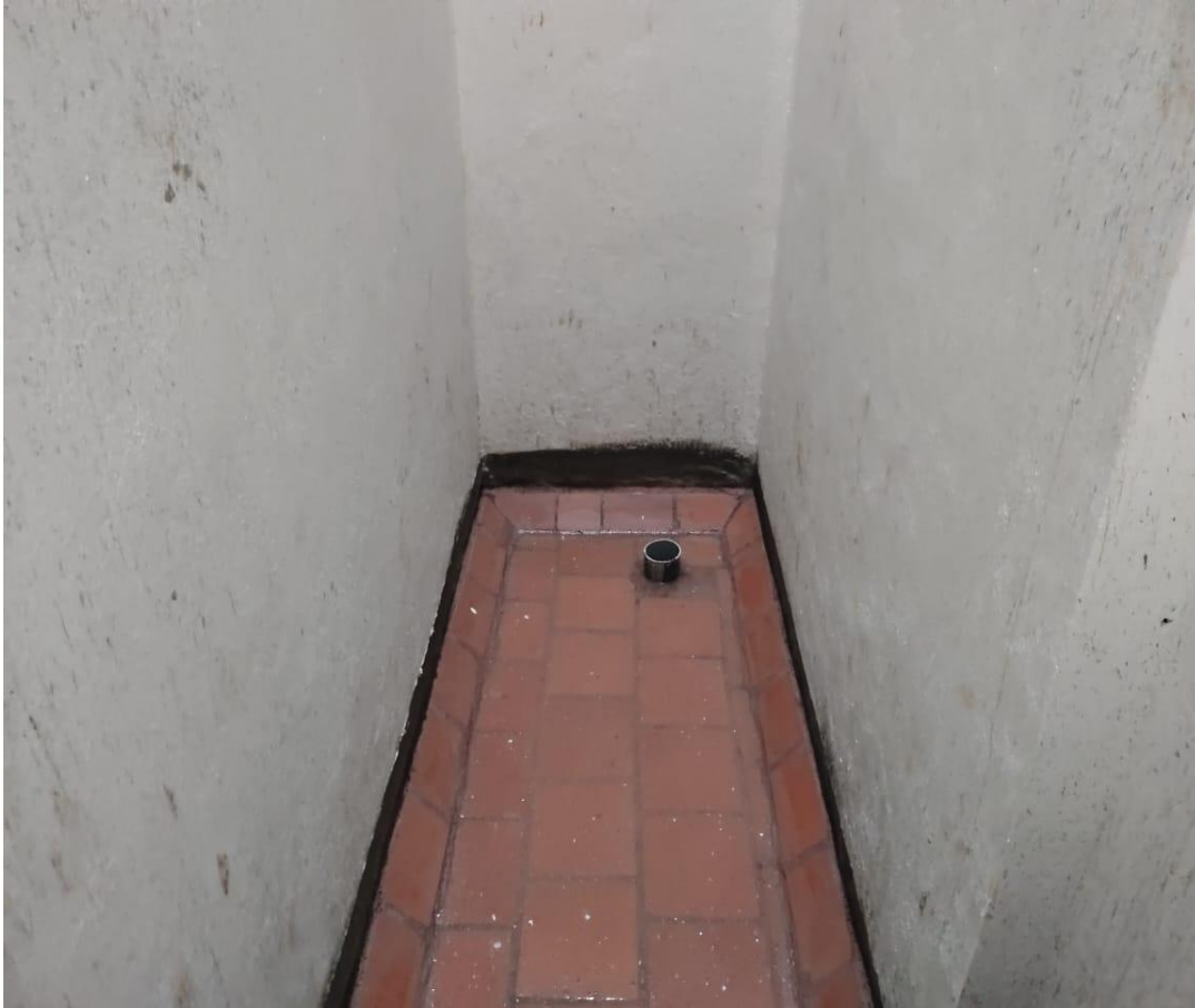
OTS – PRESS TILES LAYING WORK COMPLETED