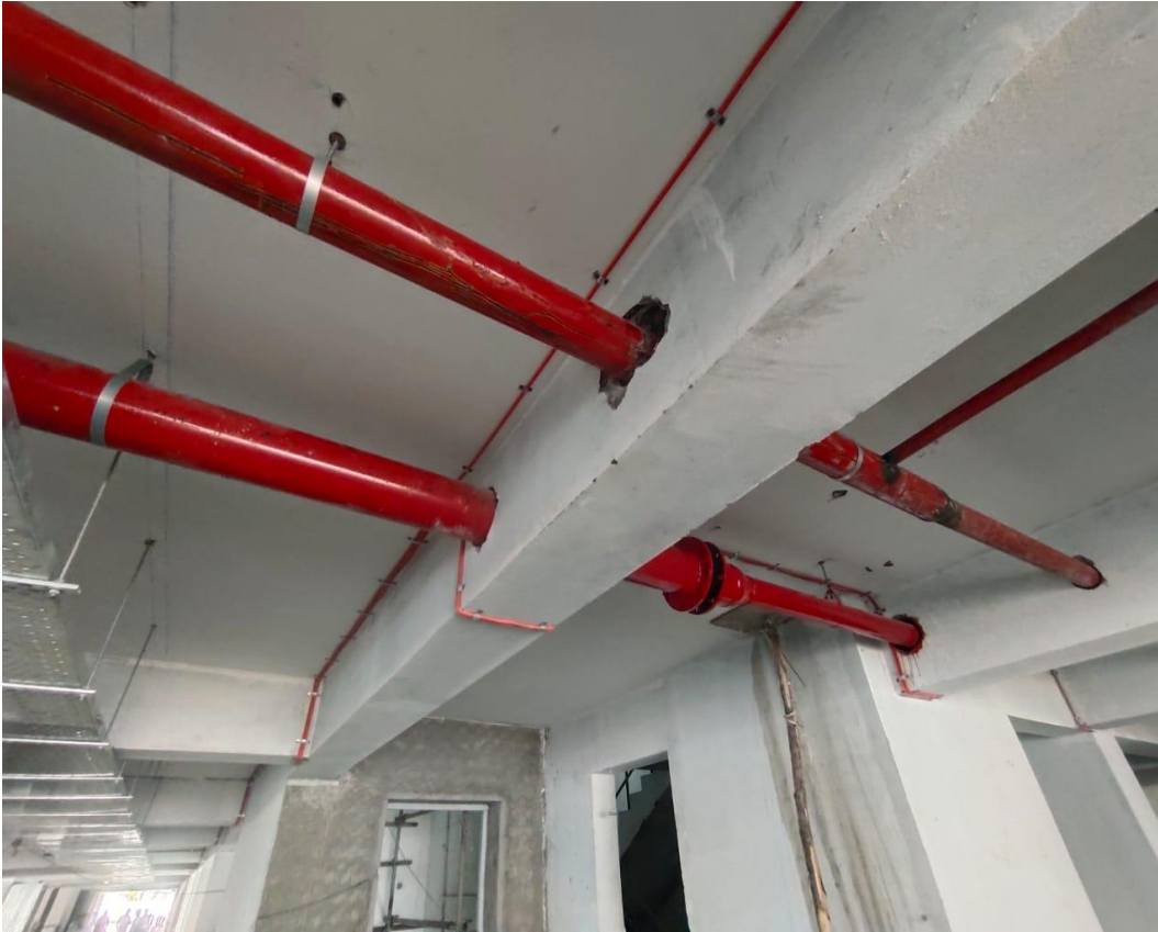
FIRE FIGHTING - STILT FLOOR WORK IN PROGRESS