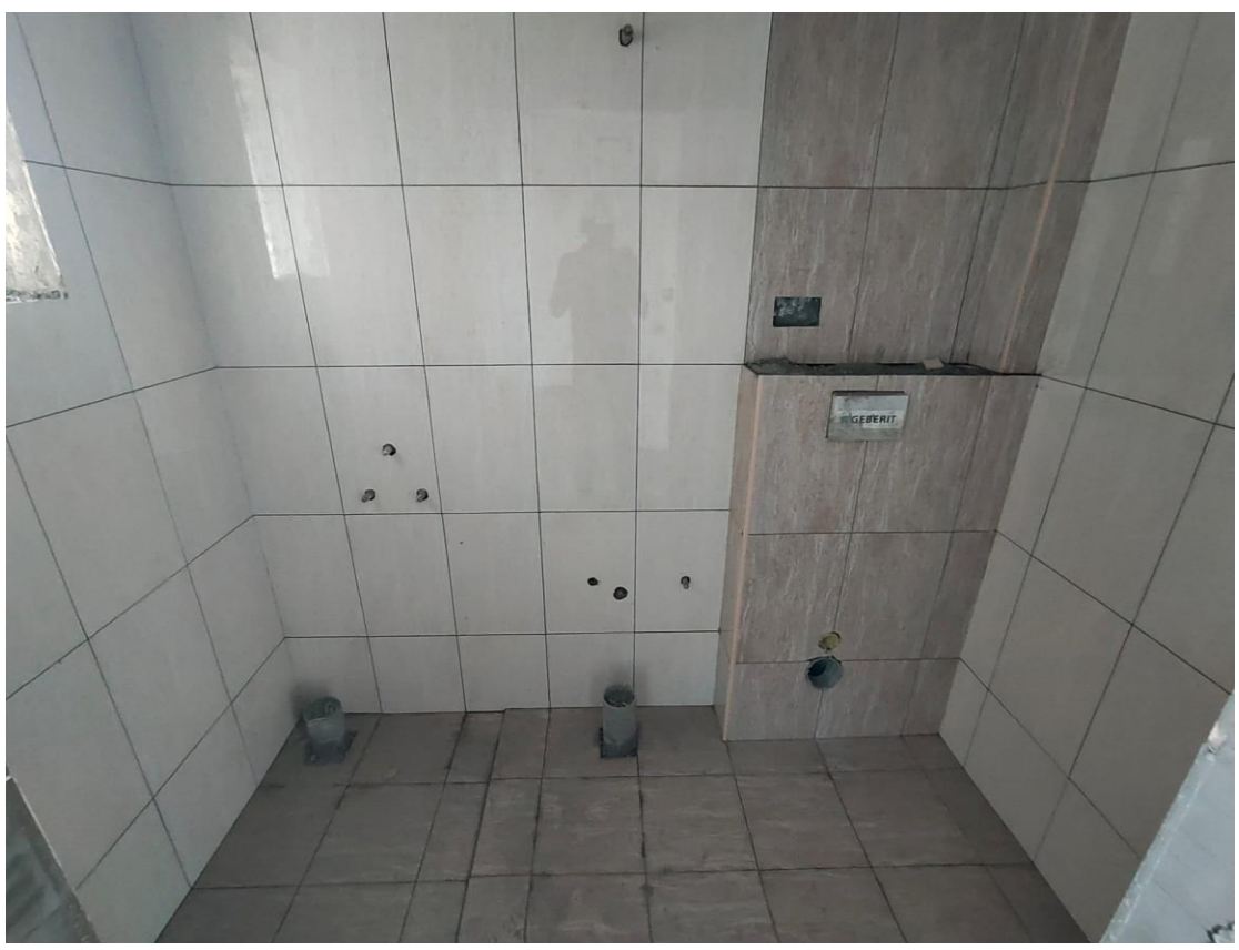
Ninth Floor Wall Tile Laying Work In Progress