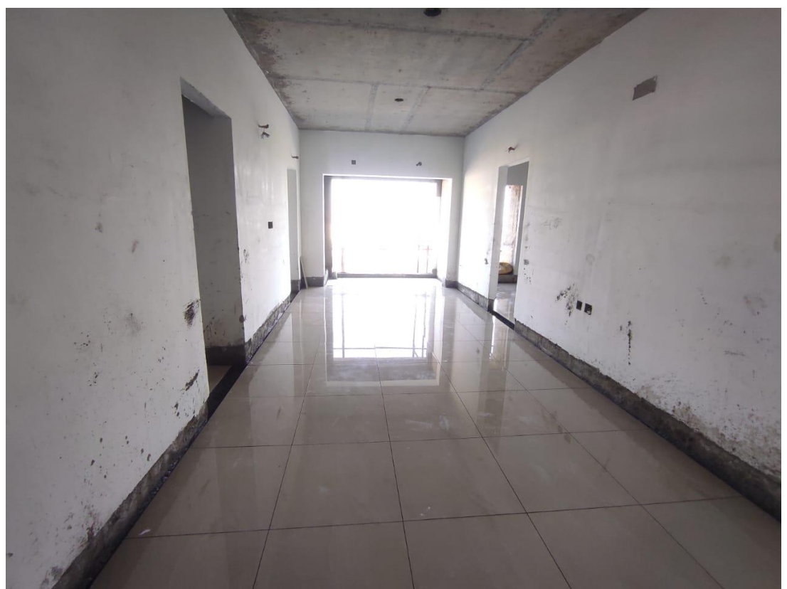
Floor Tile - Eighth Floor Tile Laying Work In Progress