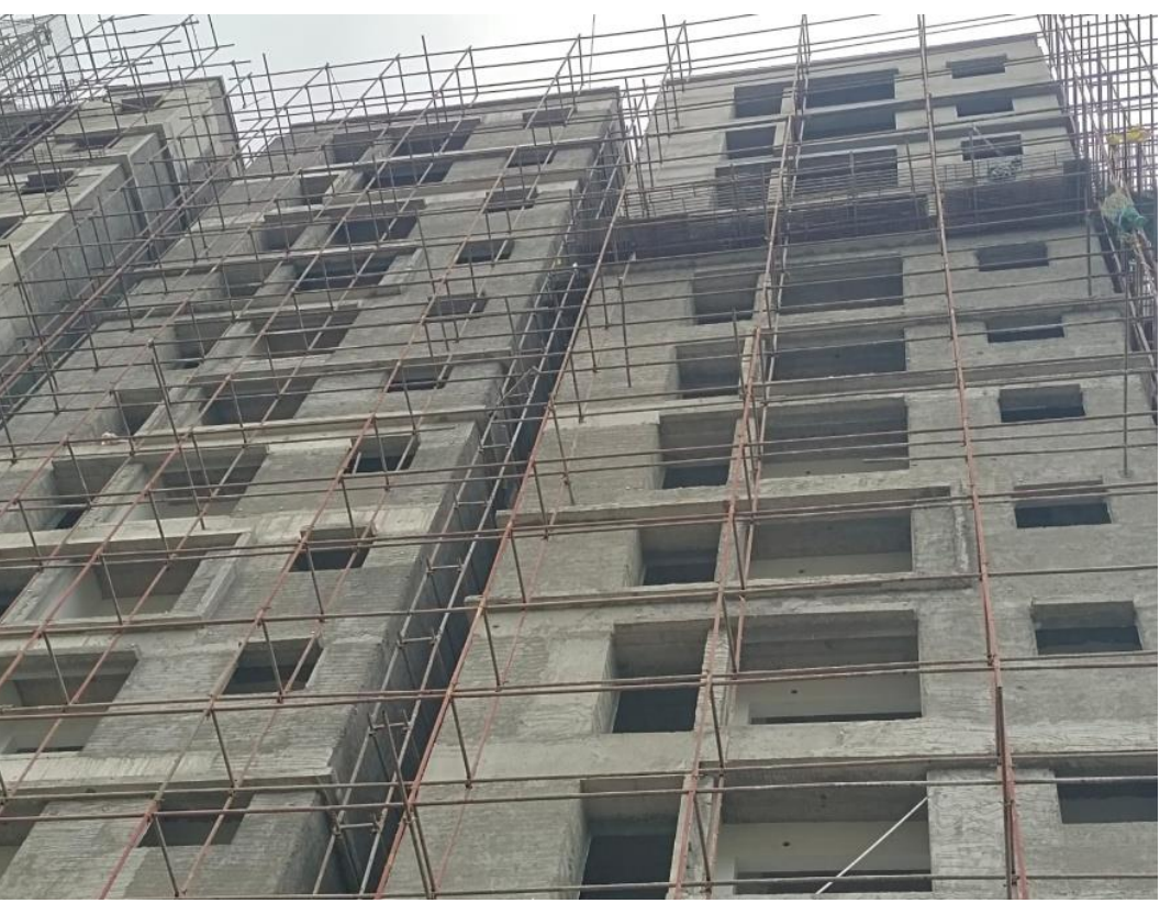
External Plastering –North & South Side Rough & Final Coat Work In Progress