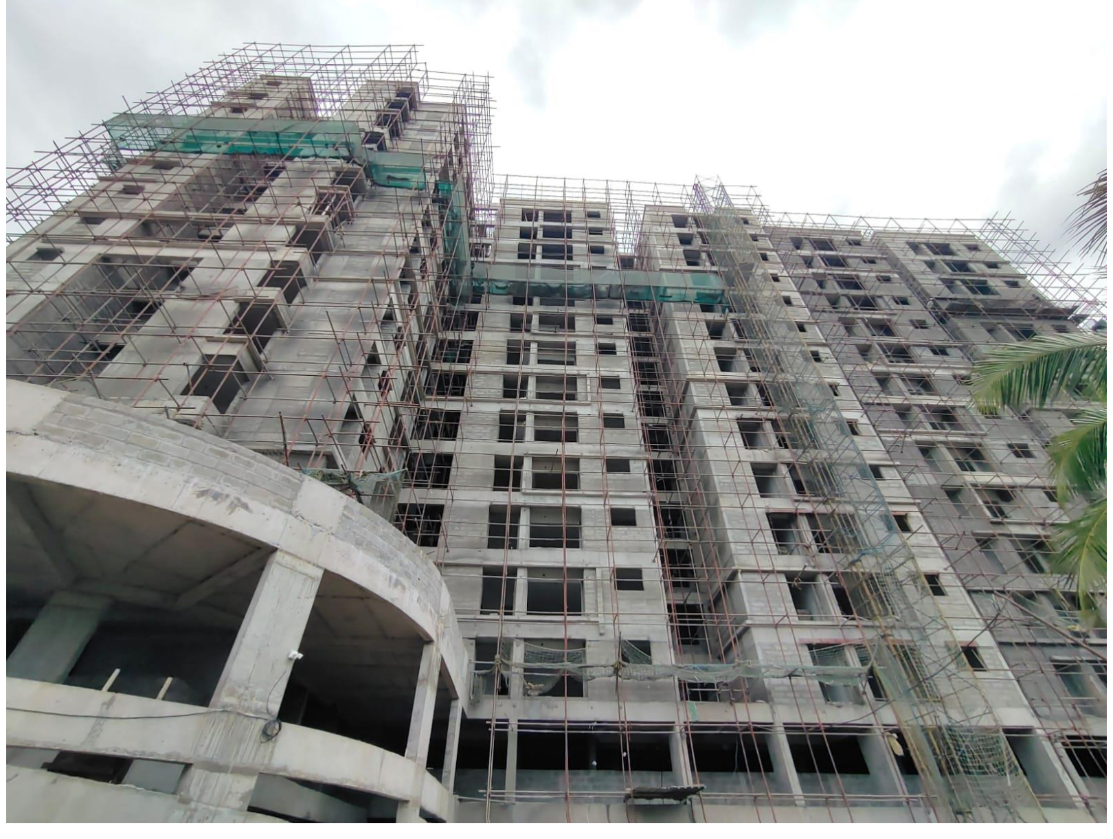
South Side Elevation