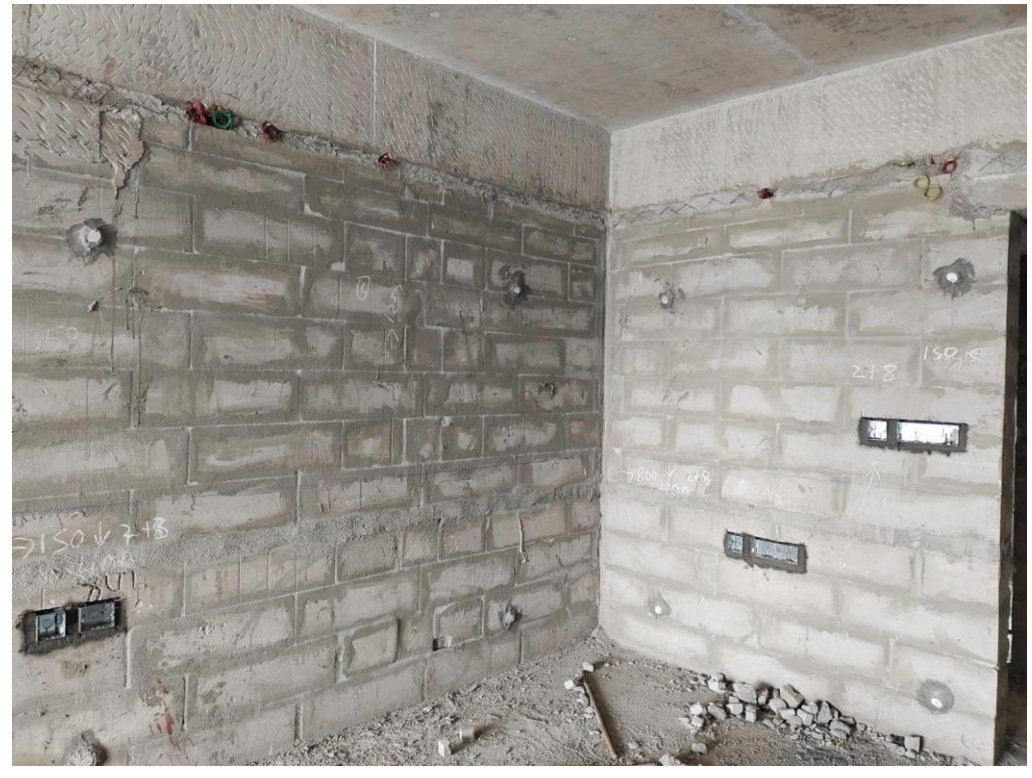
Electrical —Thirteenth Floor Electrical Wall Chasing Work In Progress