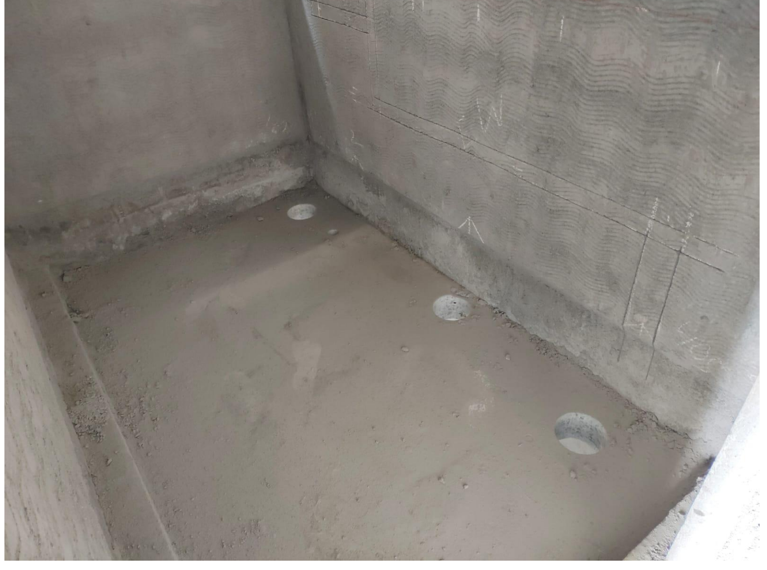
Plumbing – Thirteenth Floor Core Cutting Work Completed