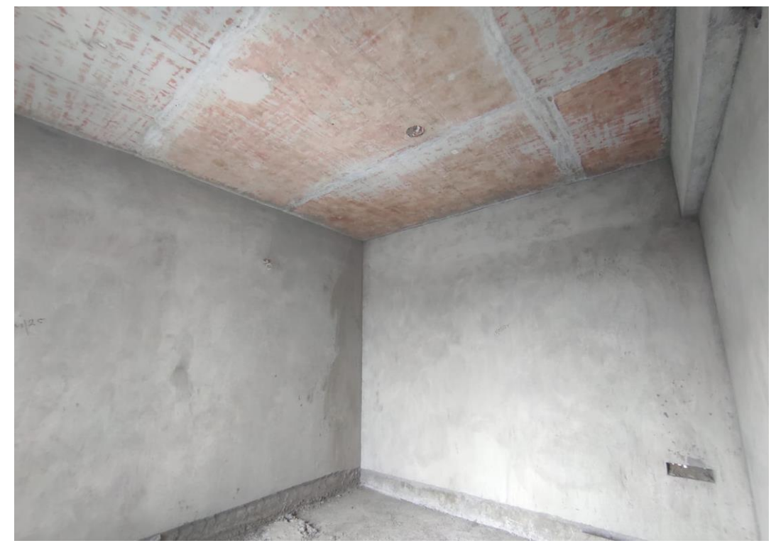
Twelfth Floor Plastering Work Completed