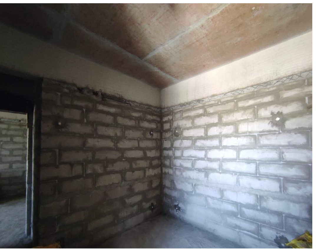
Thirteenth Floor Block Work Completed