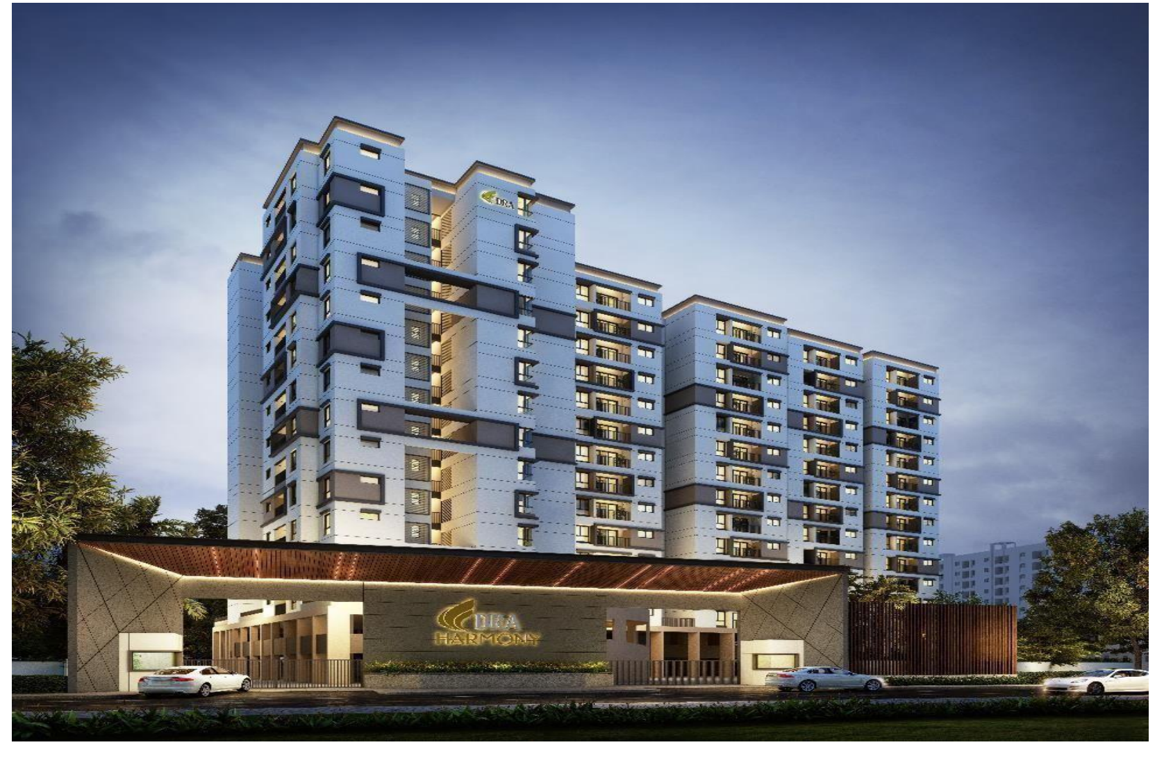
DRA HARMONY CONSTRUCTION UPDATES – MAY-2025