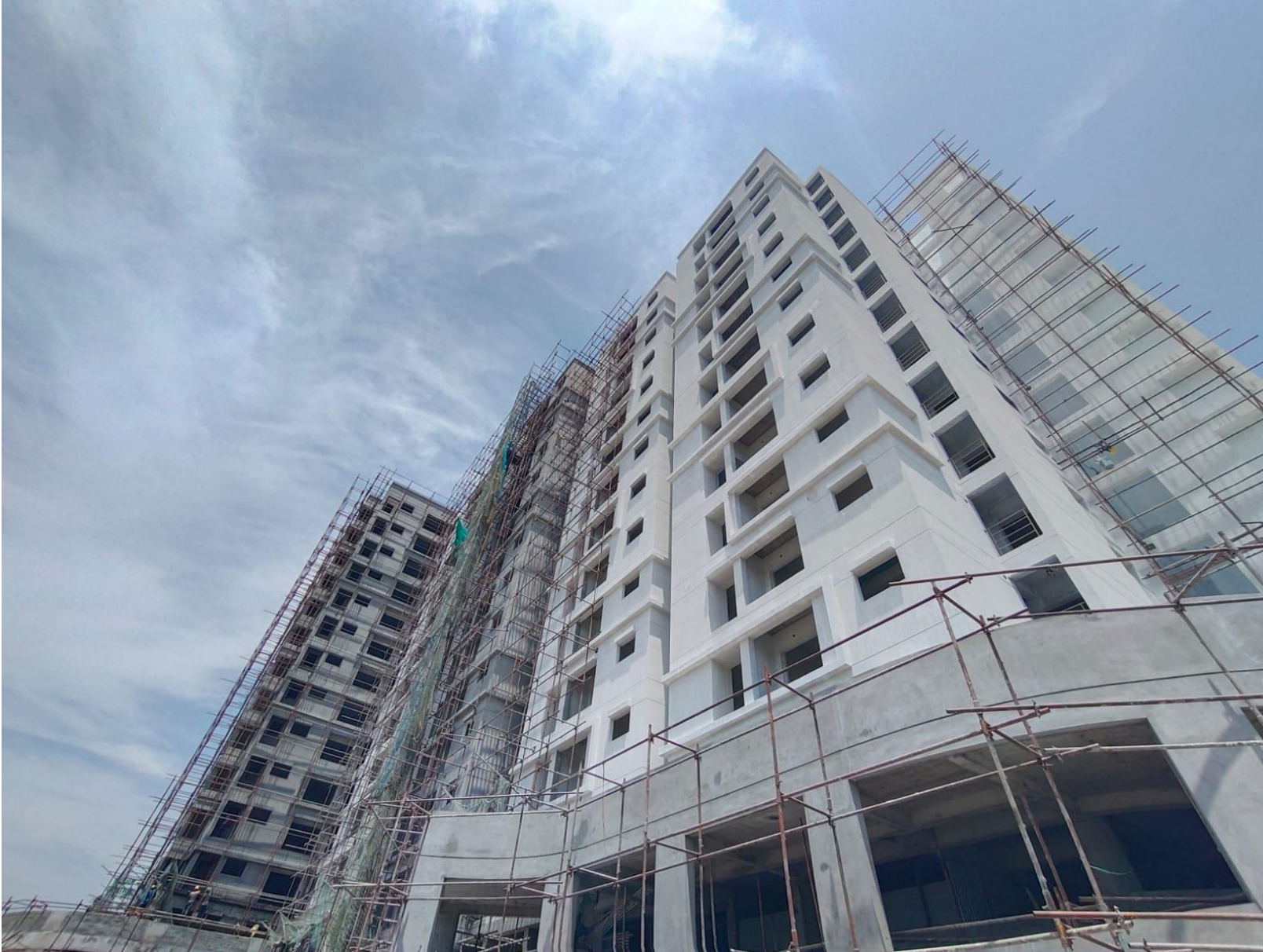
South Side Elevation