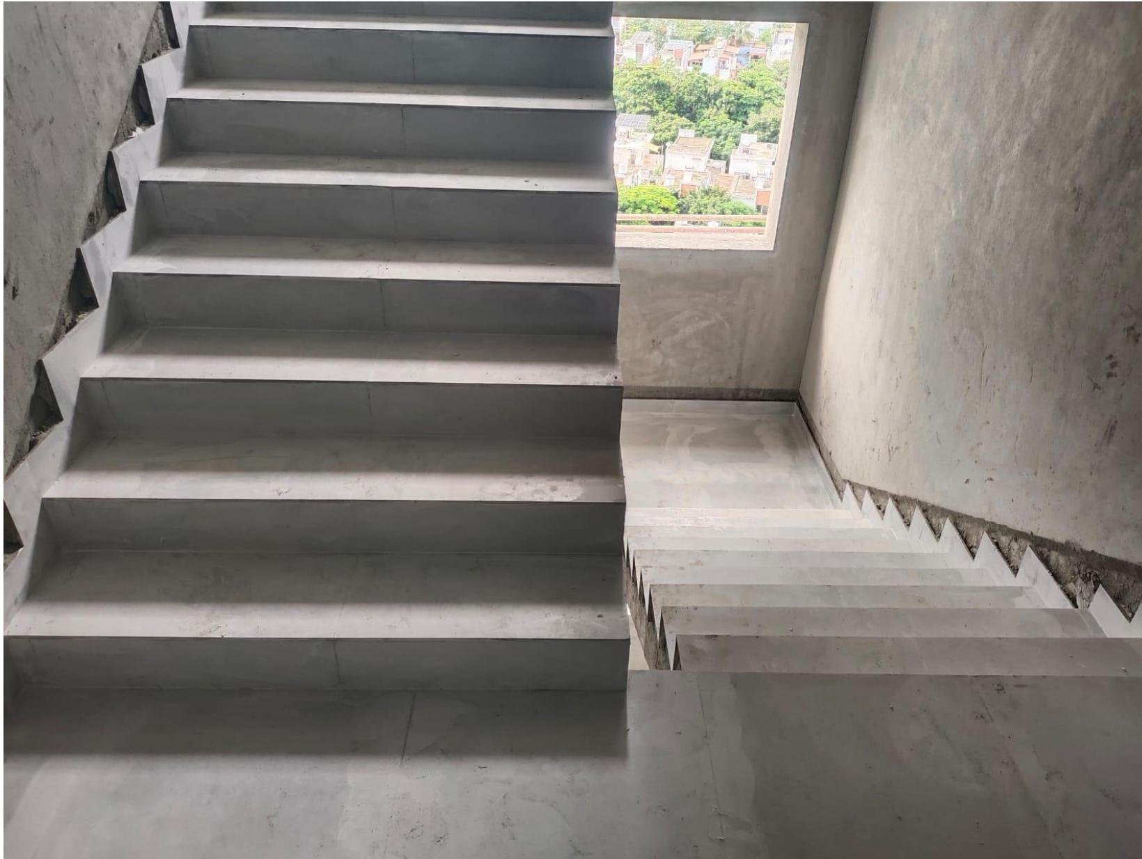
Staircase Tiles Work In Progress