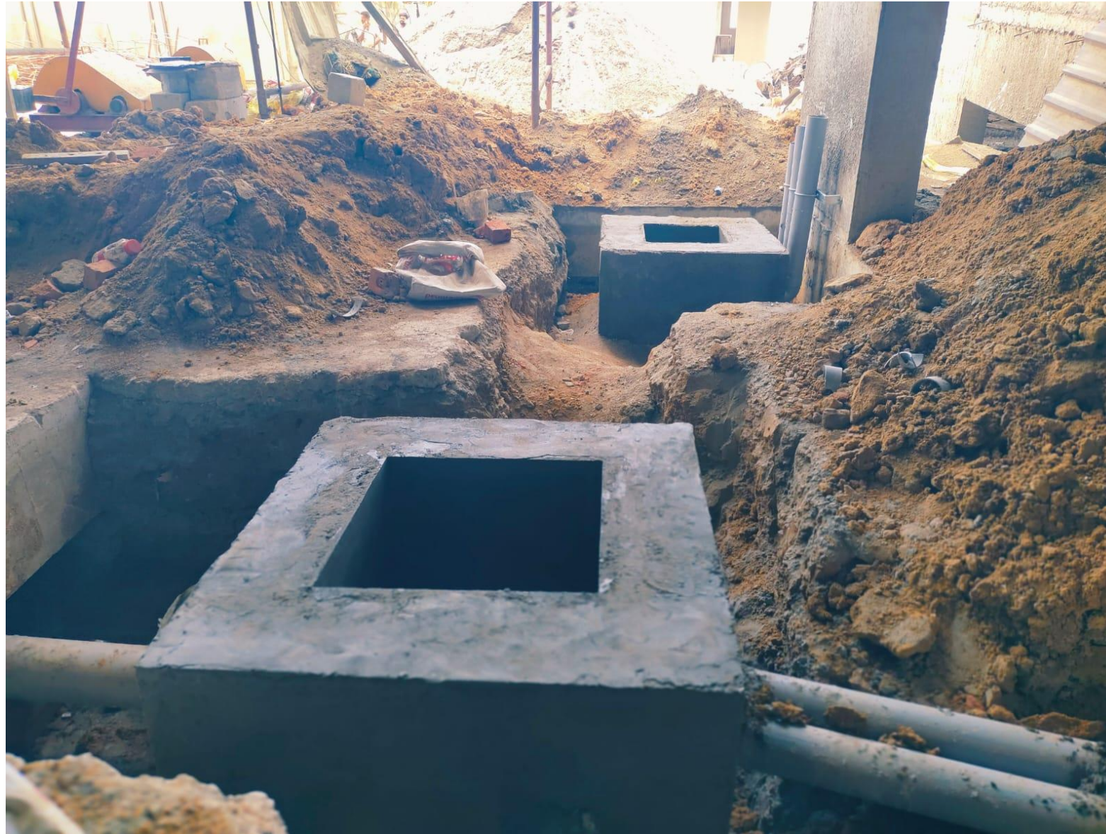
Plumbing – Stilt Floor Chamber Work In Progress