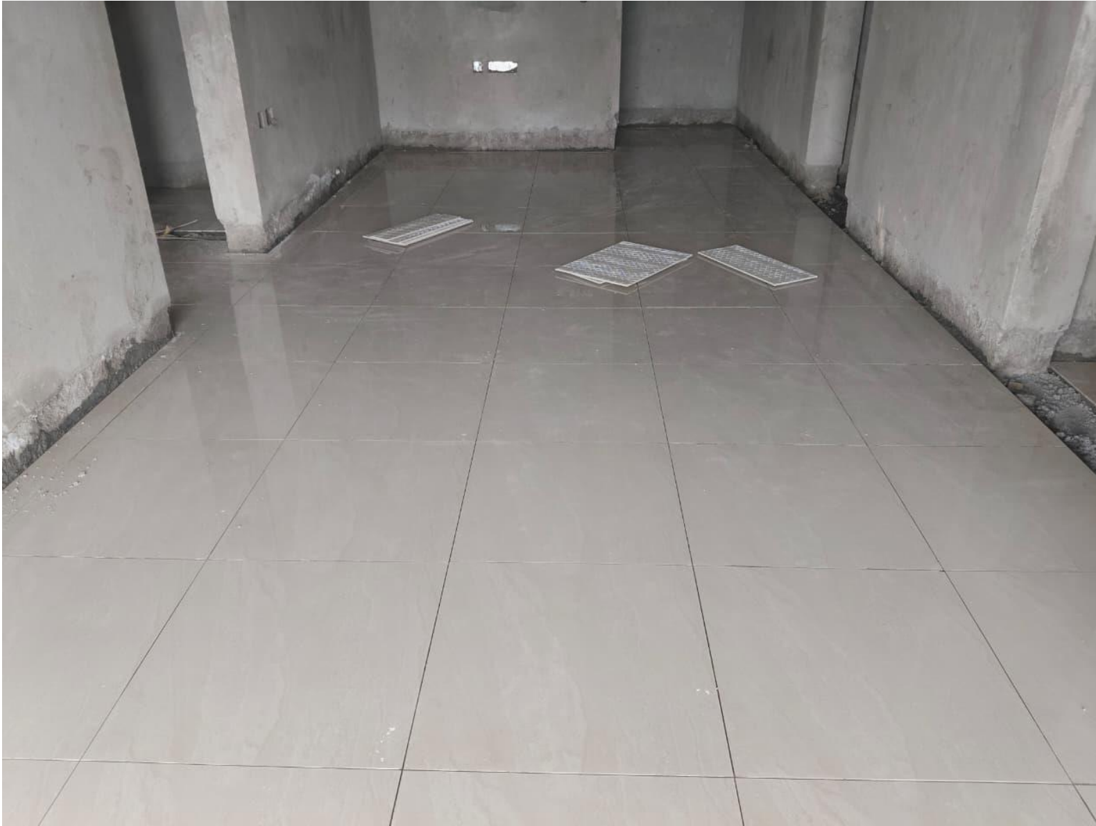
Eleventh Floor - Flooring Tiles Work In Progress