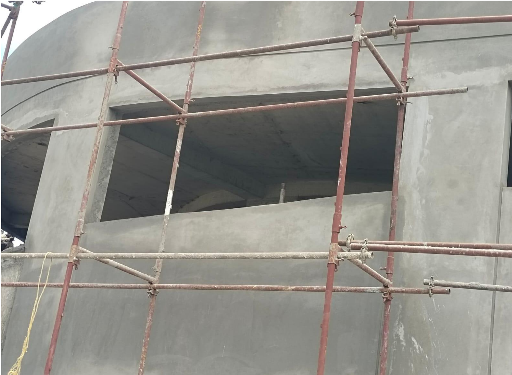
Ramp Plastering – Exit Ramp Work In Progress