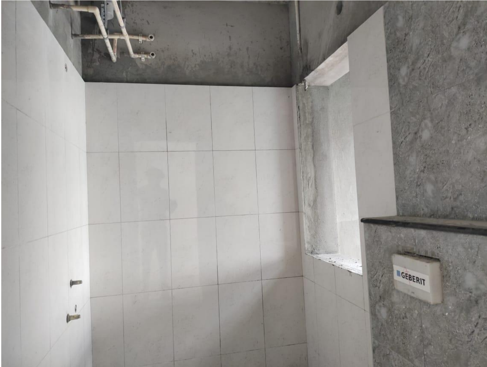
Twelfth Floor – Wall Tiles Work Completed