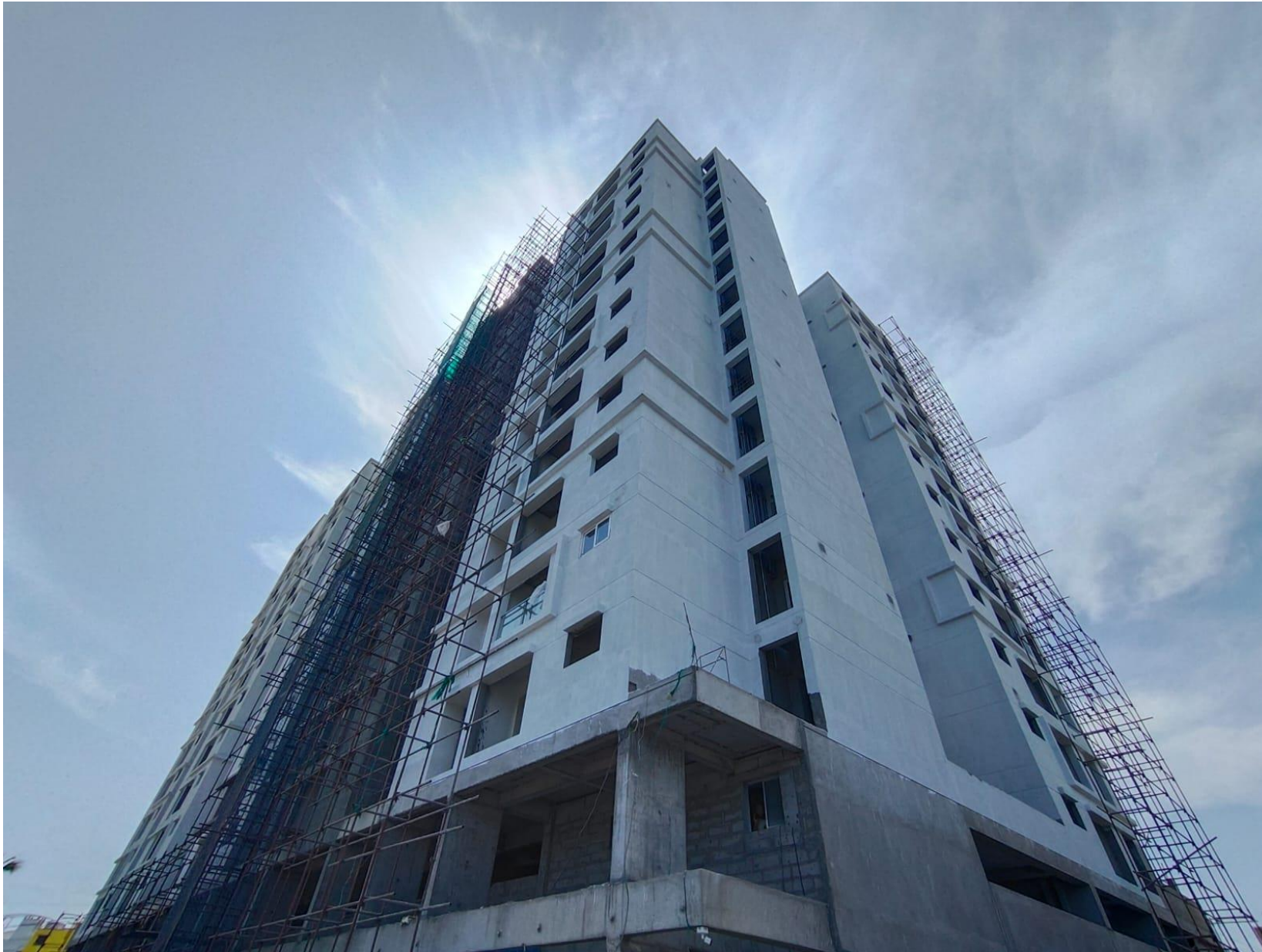
West side Elevation