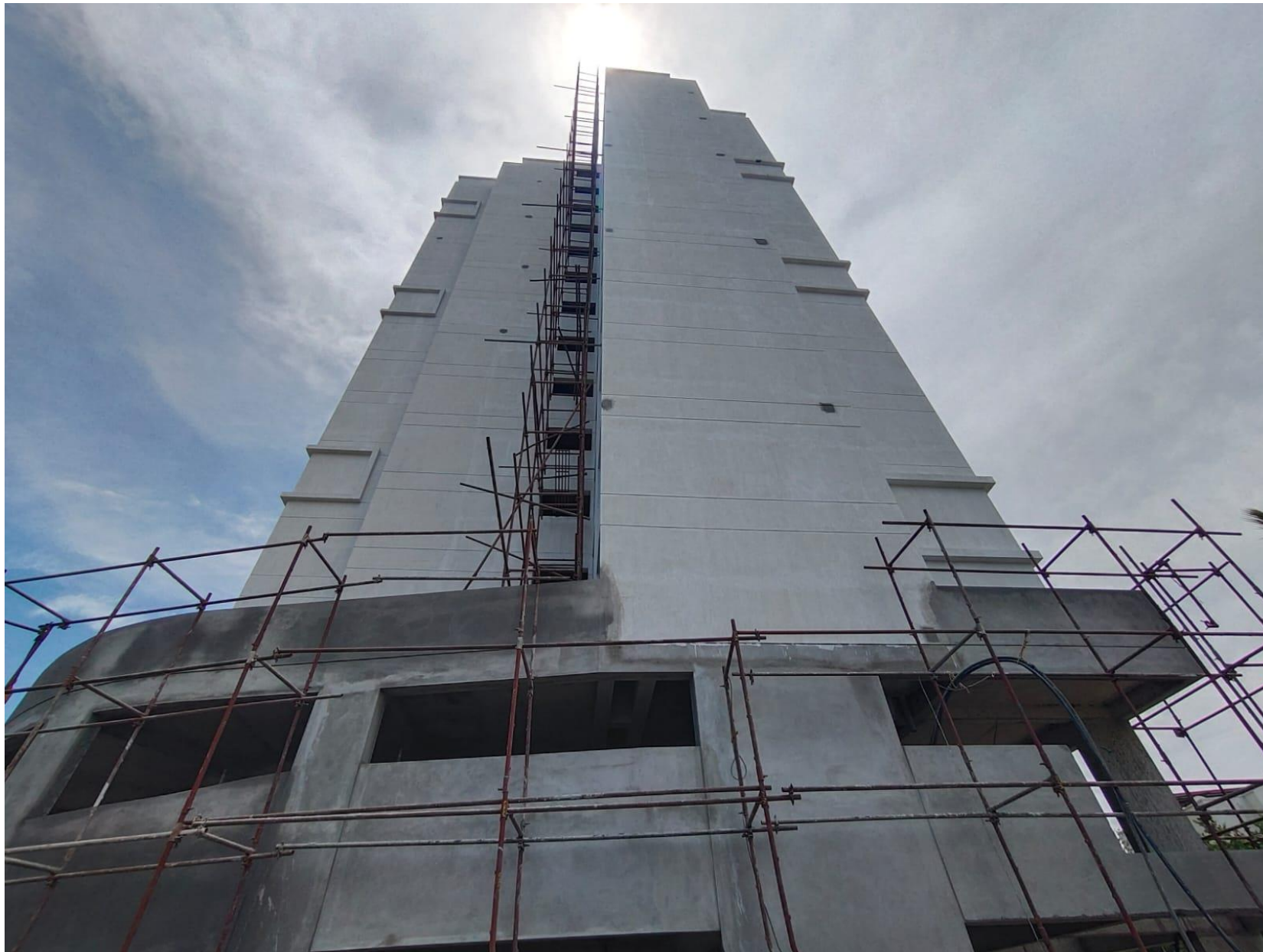
East Side Elevation