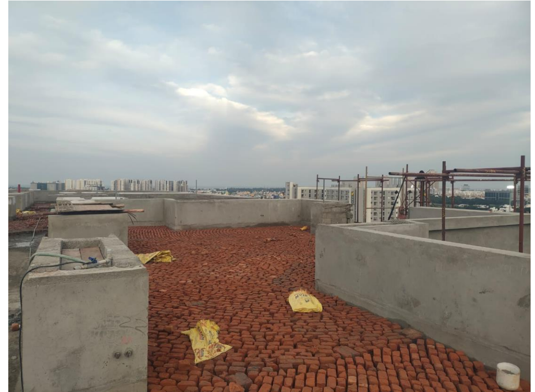
Terrace – Brick Bat Coba Work In Progress