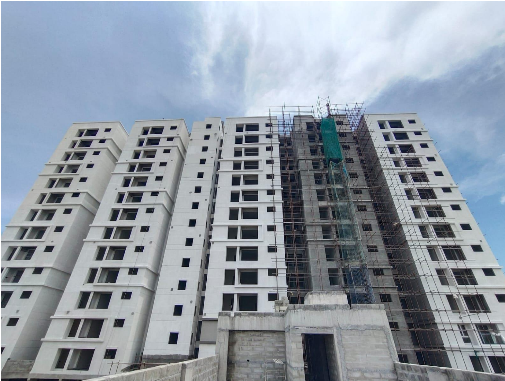
North Side Elevation