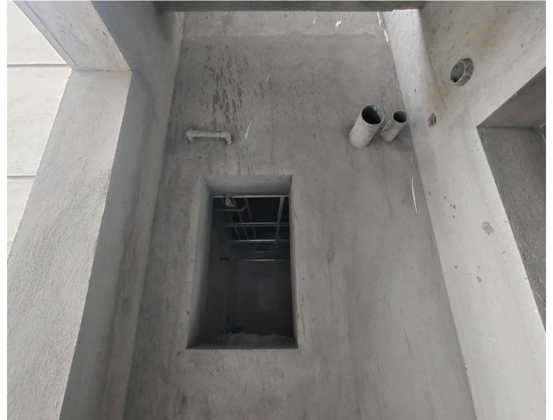
OTS & Shaft Plastering Work In Progress