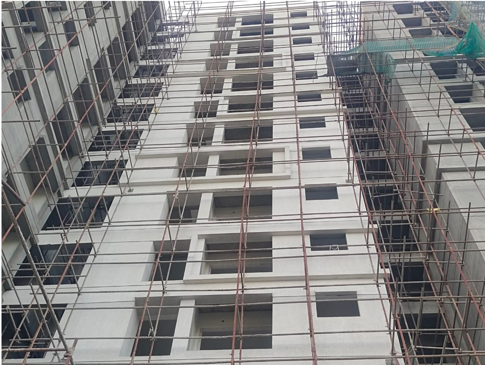
External Texture – South Side Work In Progress