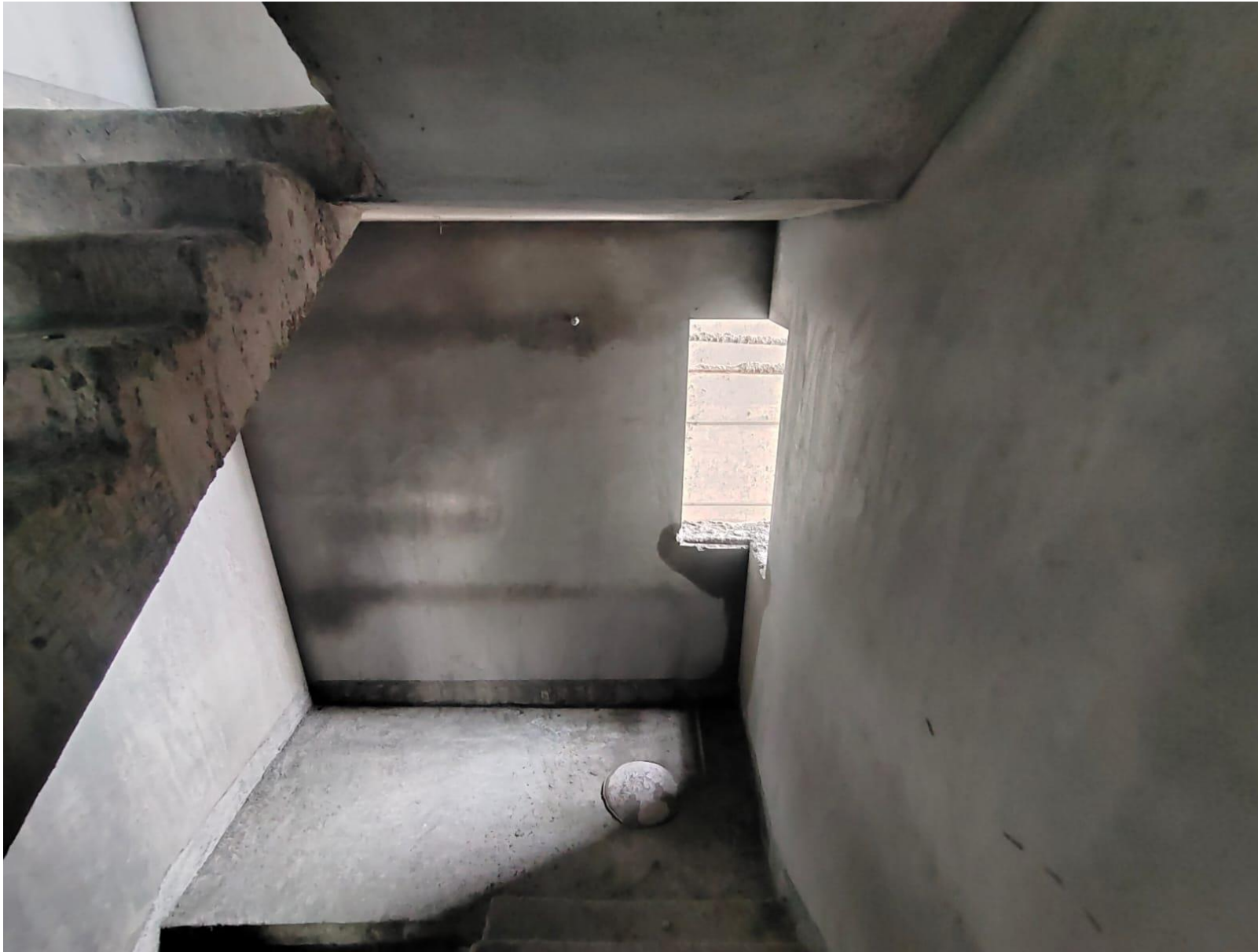
Staircase Plastering Work Completed