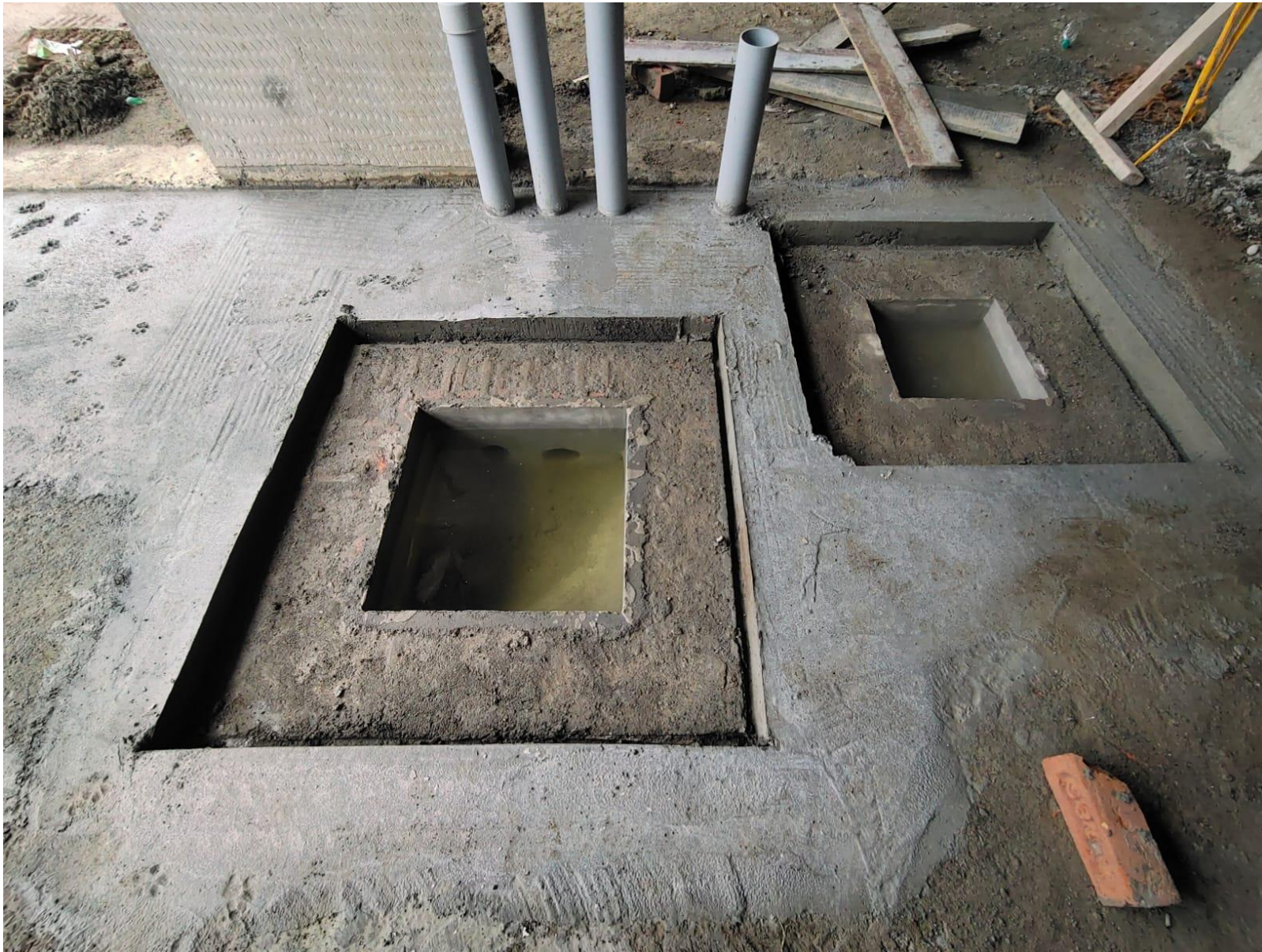
Stilt Floor – Chamber Area PCC Filling Work In Progress