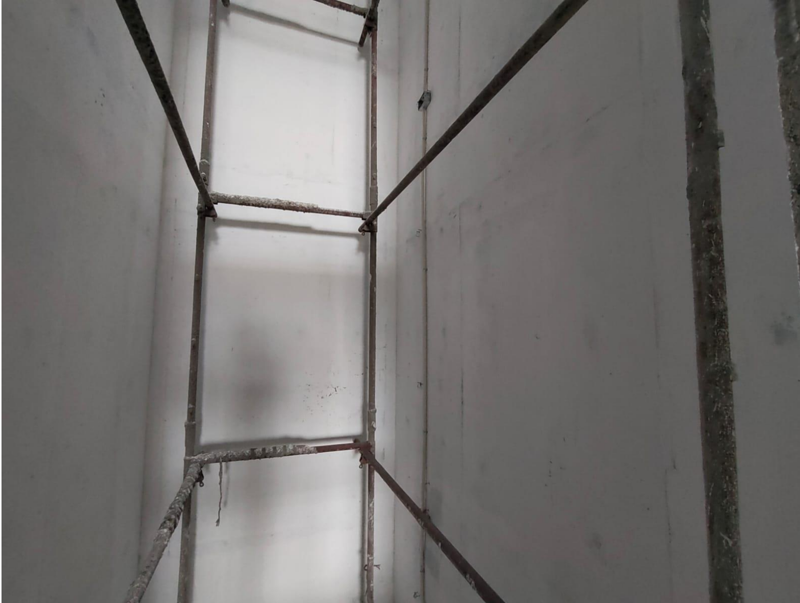
Electrical – Lift Conduit Line Completed