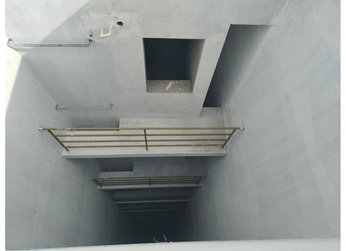
OTS & Shaft – Primer Work In Progress