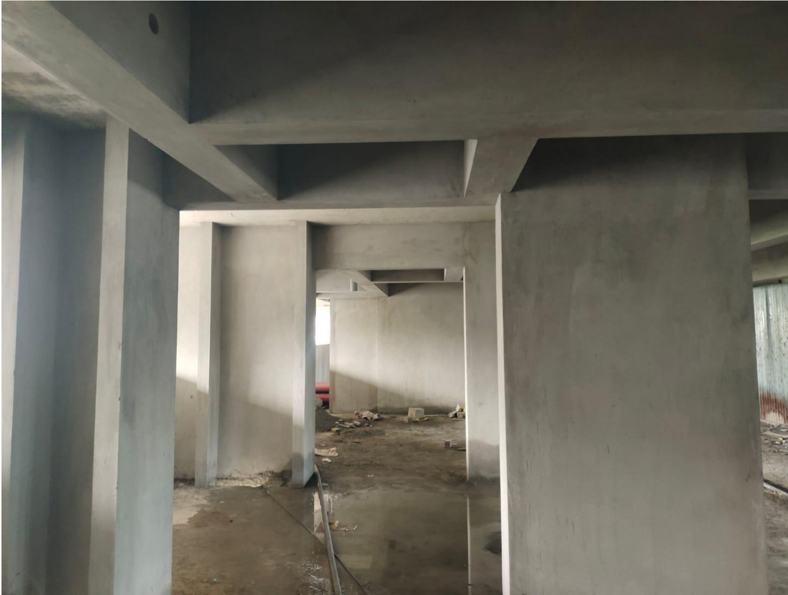
Upper Stilt -Plastering Work In Progress