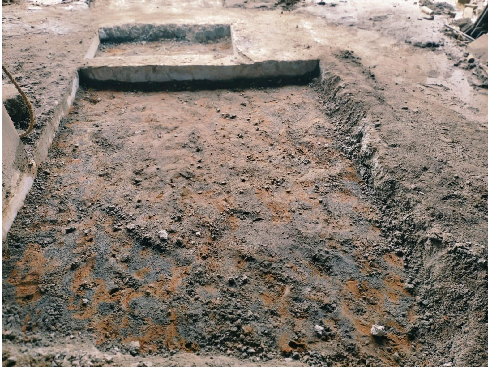
Stilt Floor – PCC Cutting Work In Progress