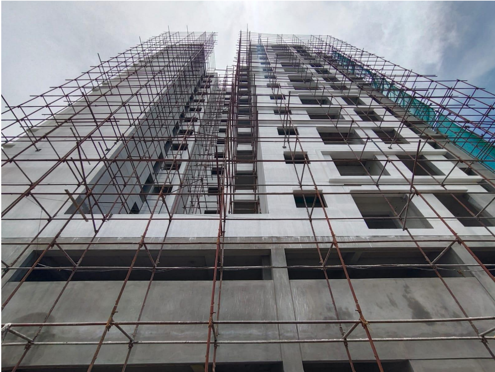
External Texture – South Side Primer Work Completed