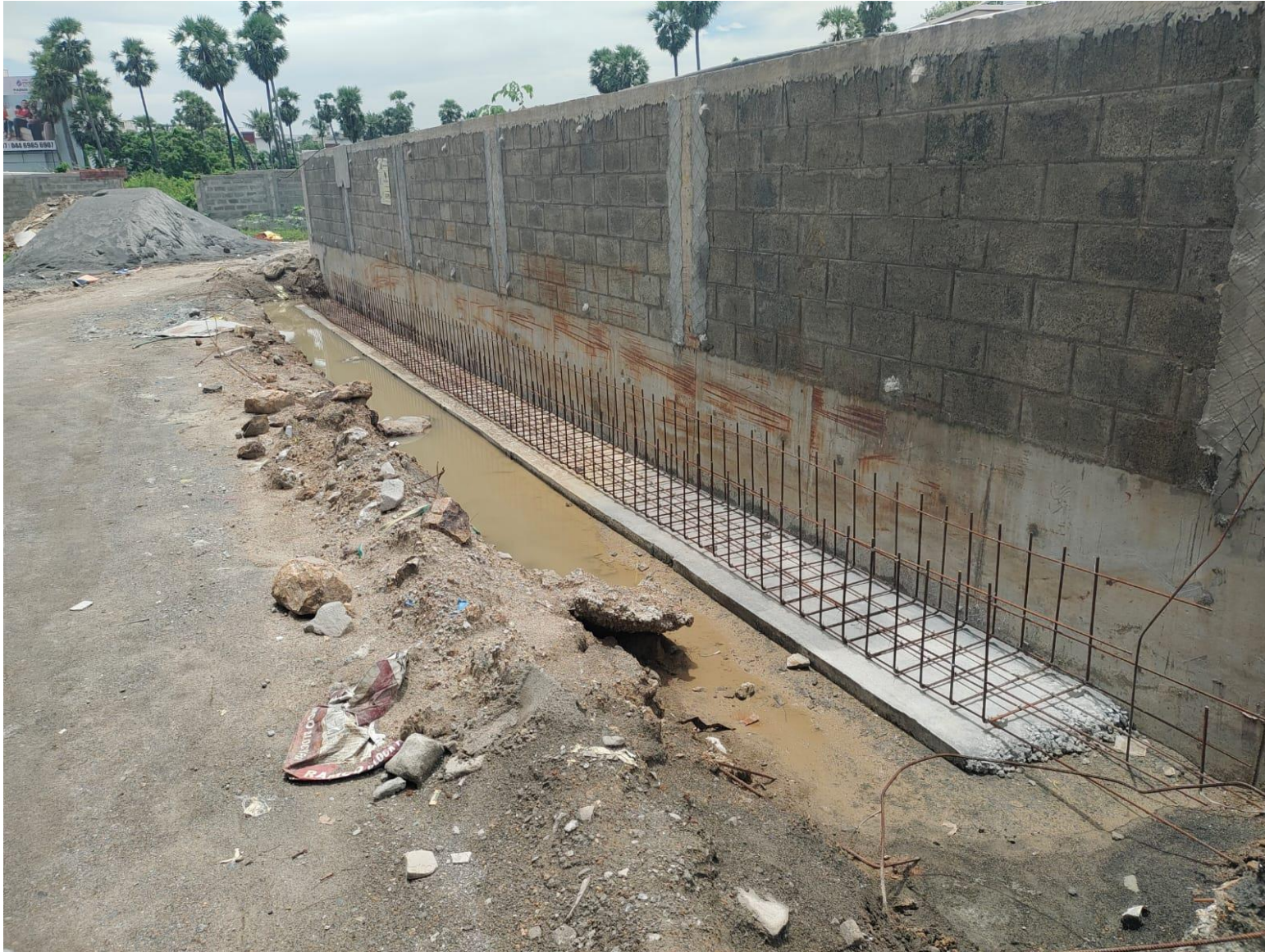
Storm Water Trench – North & West Side Work In Progress