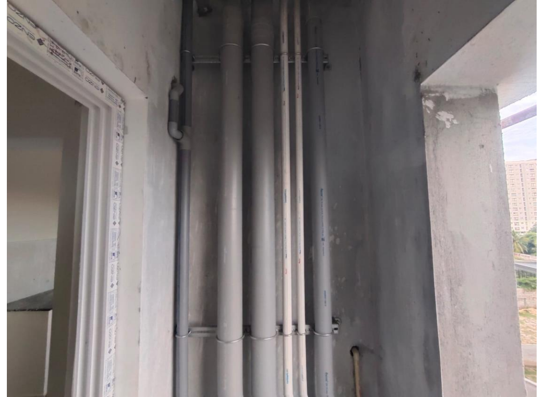
Plumbing – External Vertical Shaft Pipeline Work In Progress