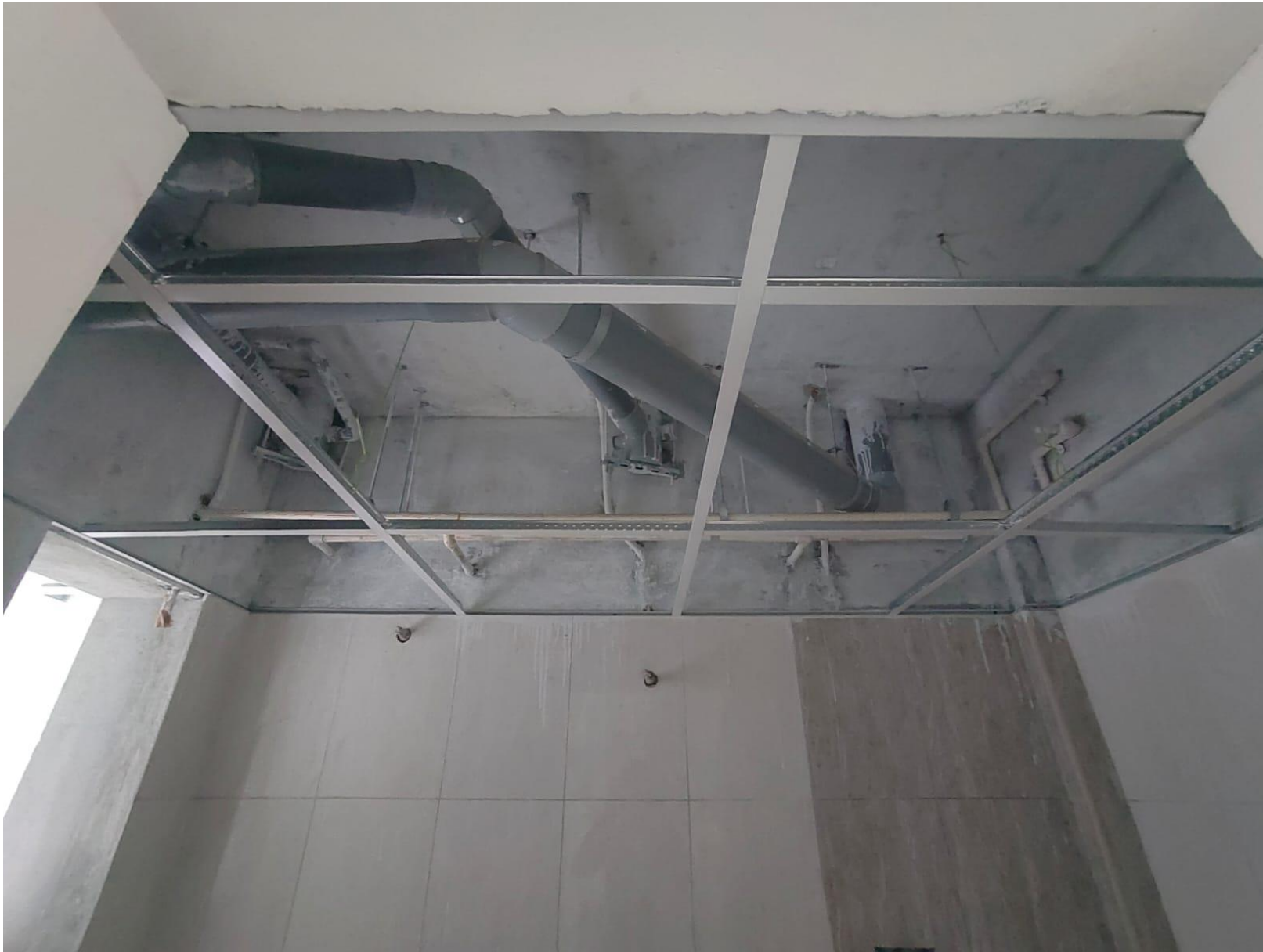
False Ceiling – 2 nd & 3 rd Floor Work In Progress