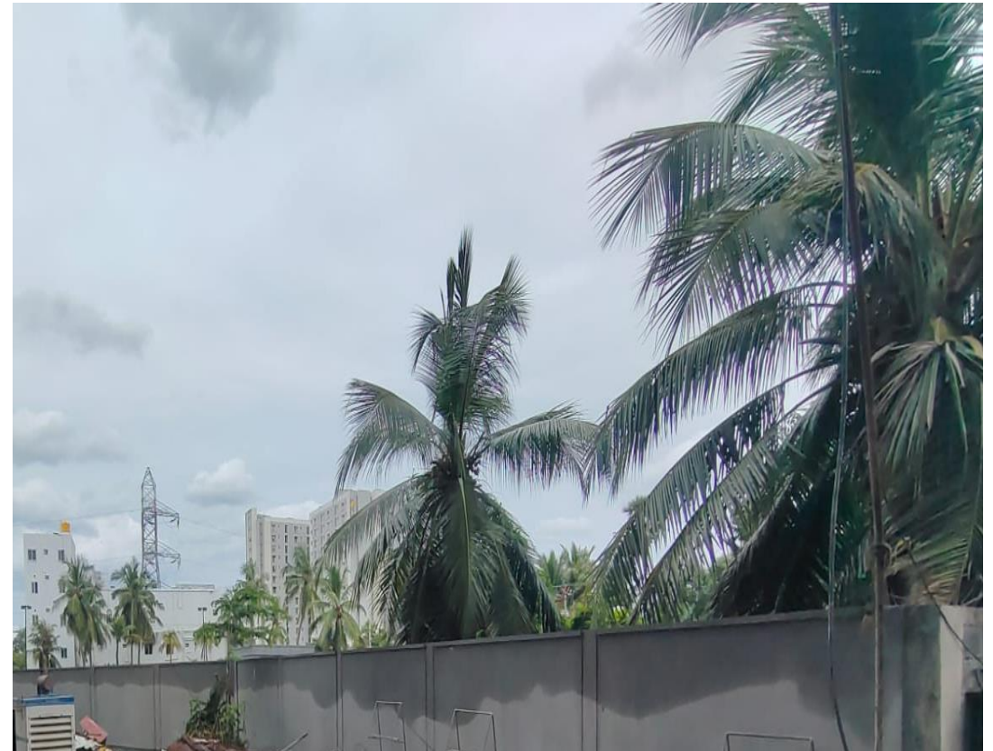
Compound wall Plastering – North Side Work In Progress