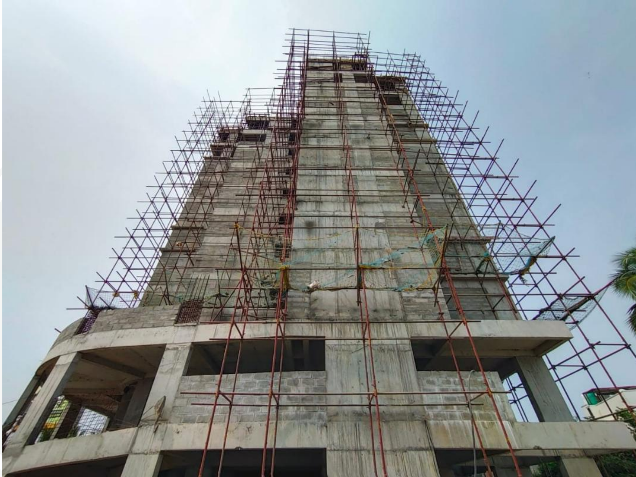
Main Building –East Side View