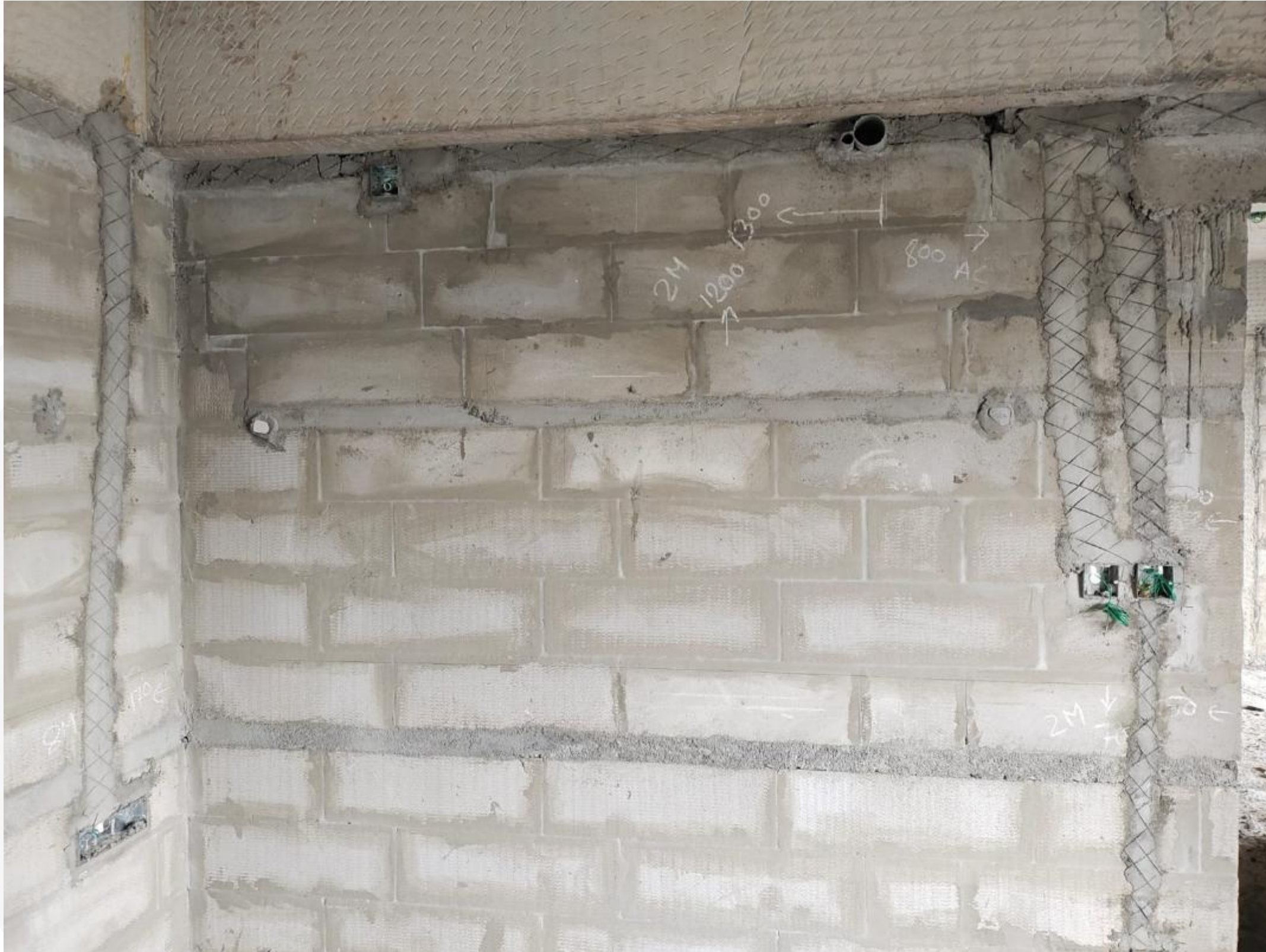
Electrical – Fourth Floor Wall Chasing Completed