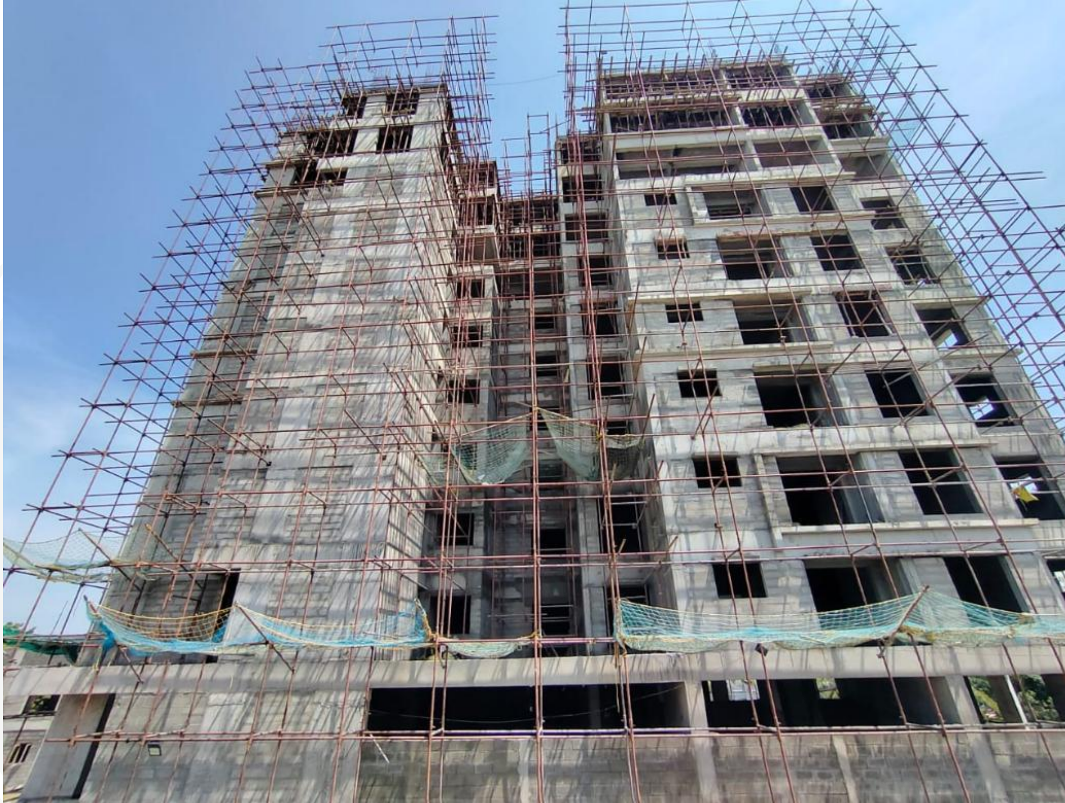
Main Building – West Side View