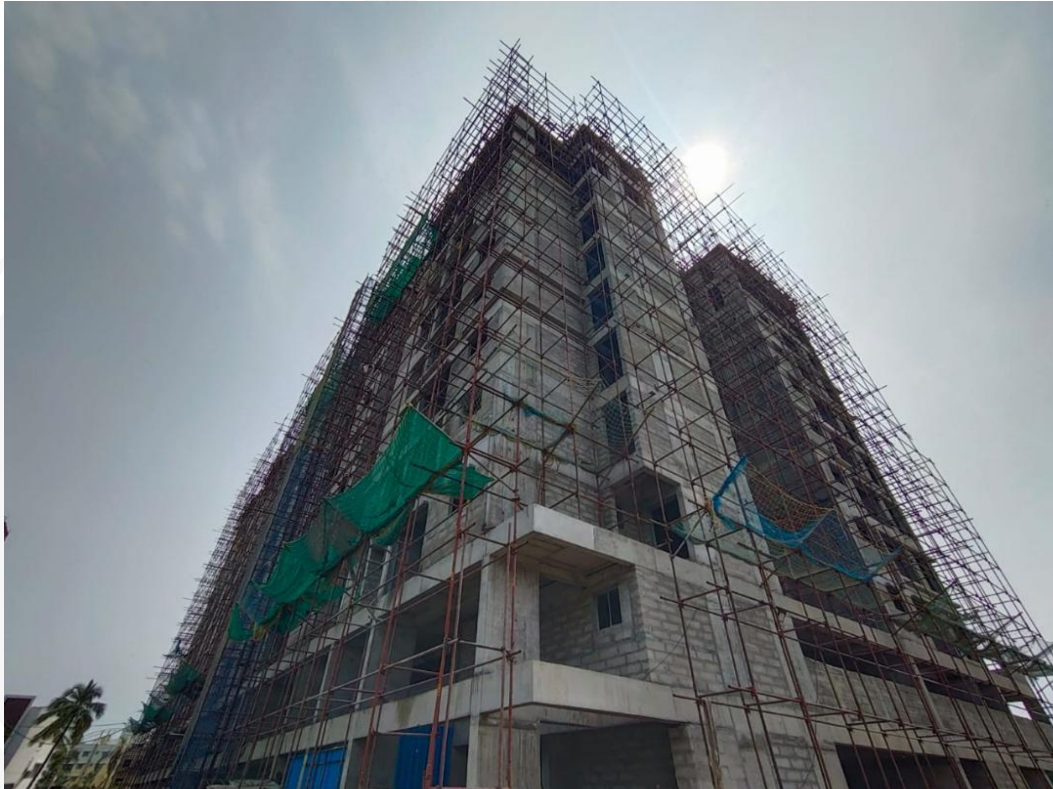
Main Building –Northwest Side View