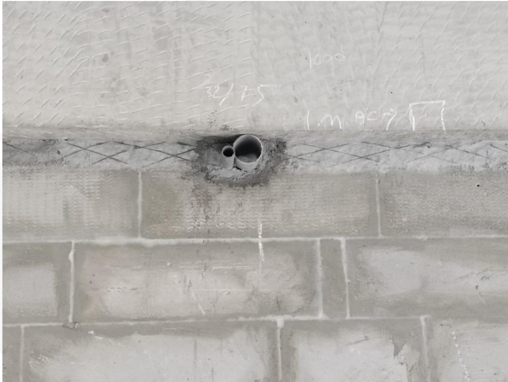
Plumbing – Sixth Floor AC Sleeve Fixing Work Completed