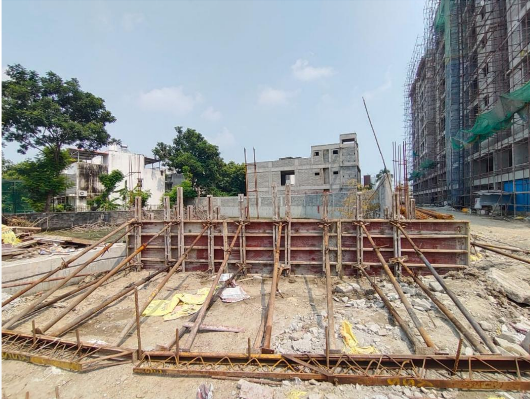
Compound wall – Type-6 2 nd Lift Concrete Completed