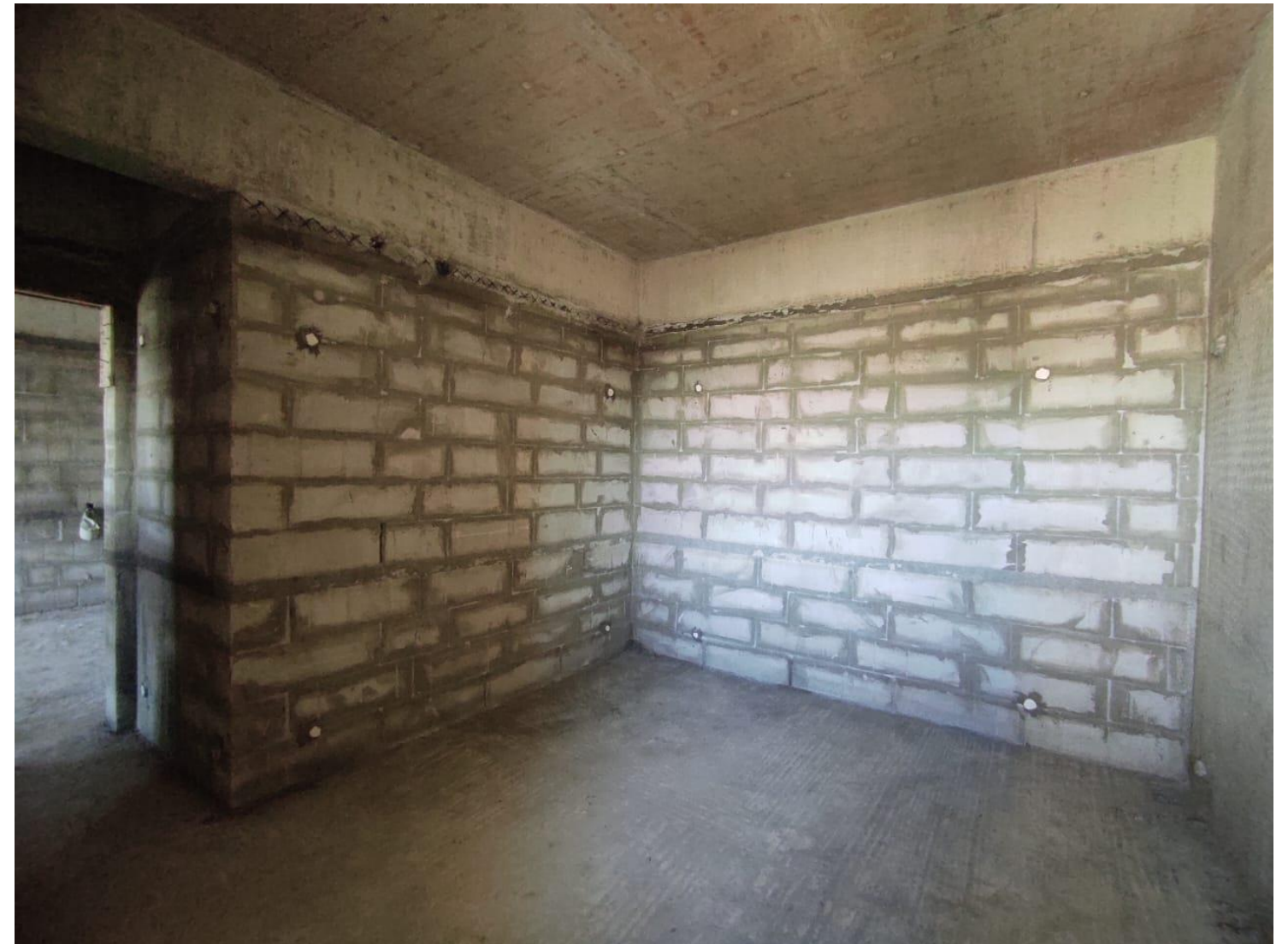
Main Building – Seventh Floor Block Work Completed