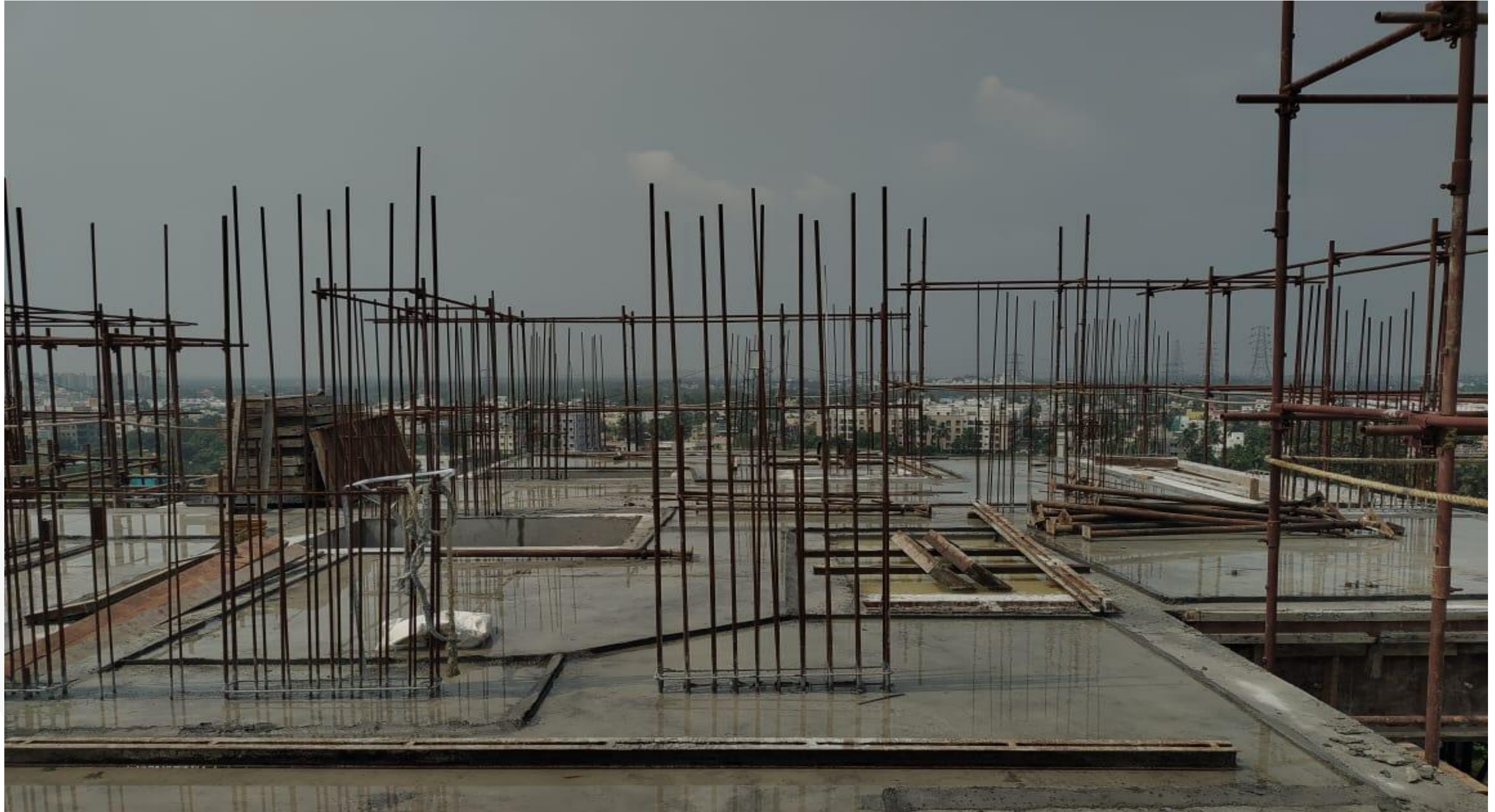
Main Building – Tenth Floor Slab Curing Work In Progress