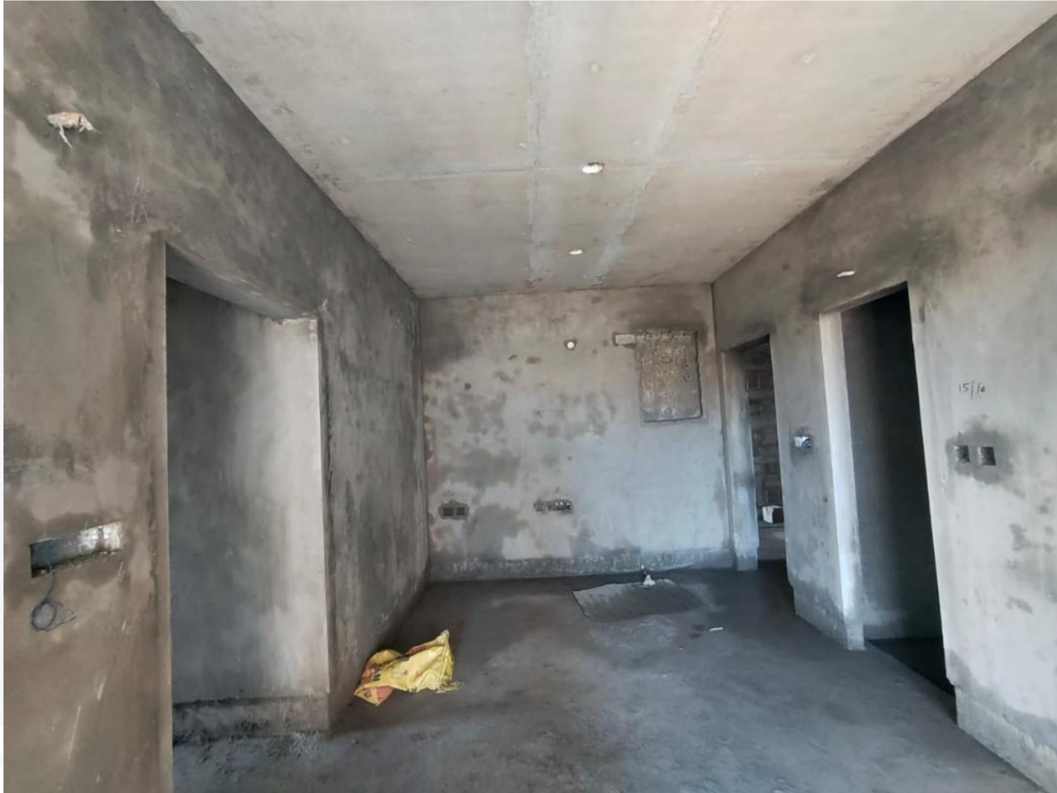
Main Building – Third Floor Internal Wall Plastering Work In progress