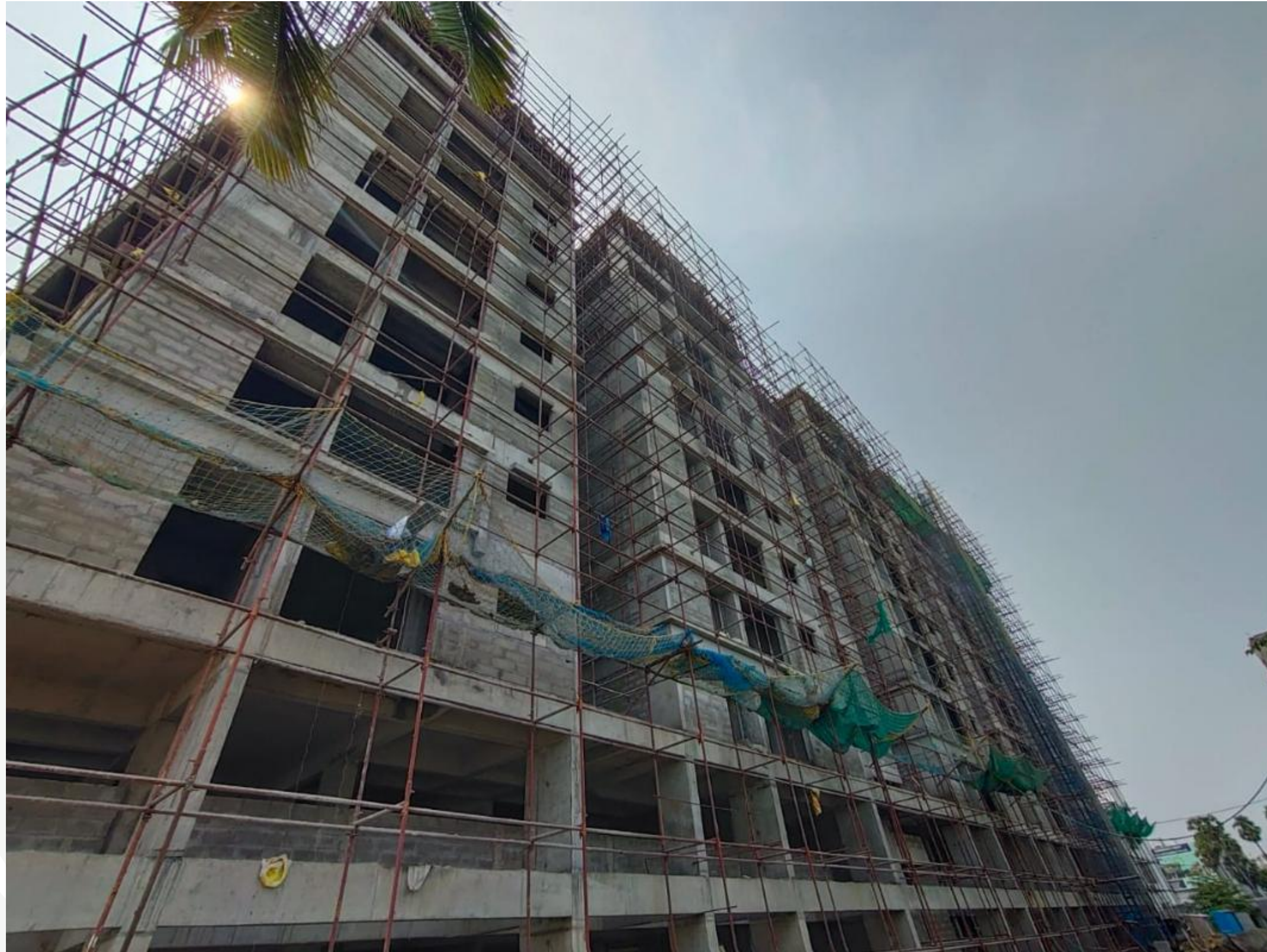
Main Building - North Side View