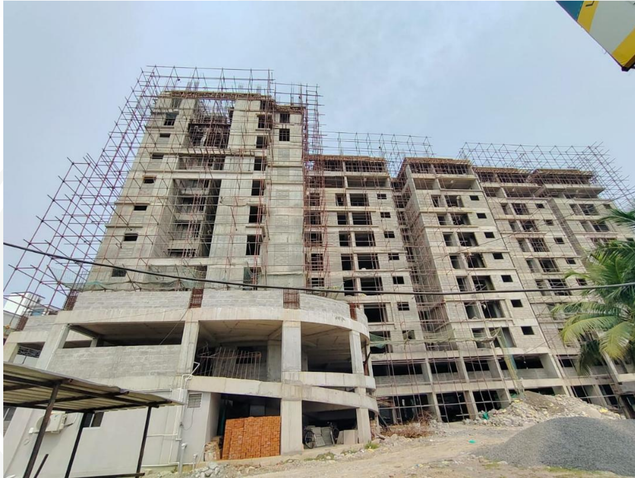
Main Building - South Side View