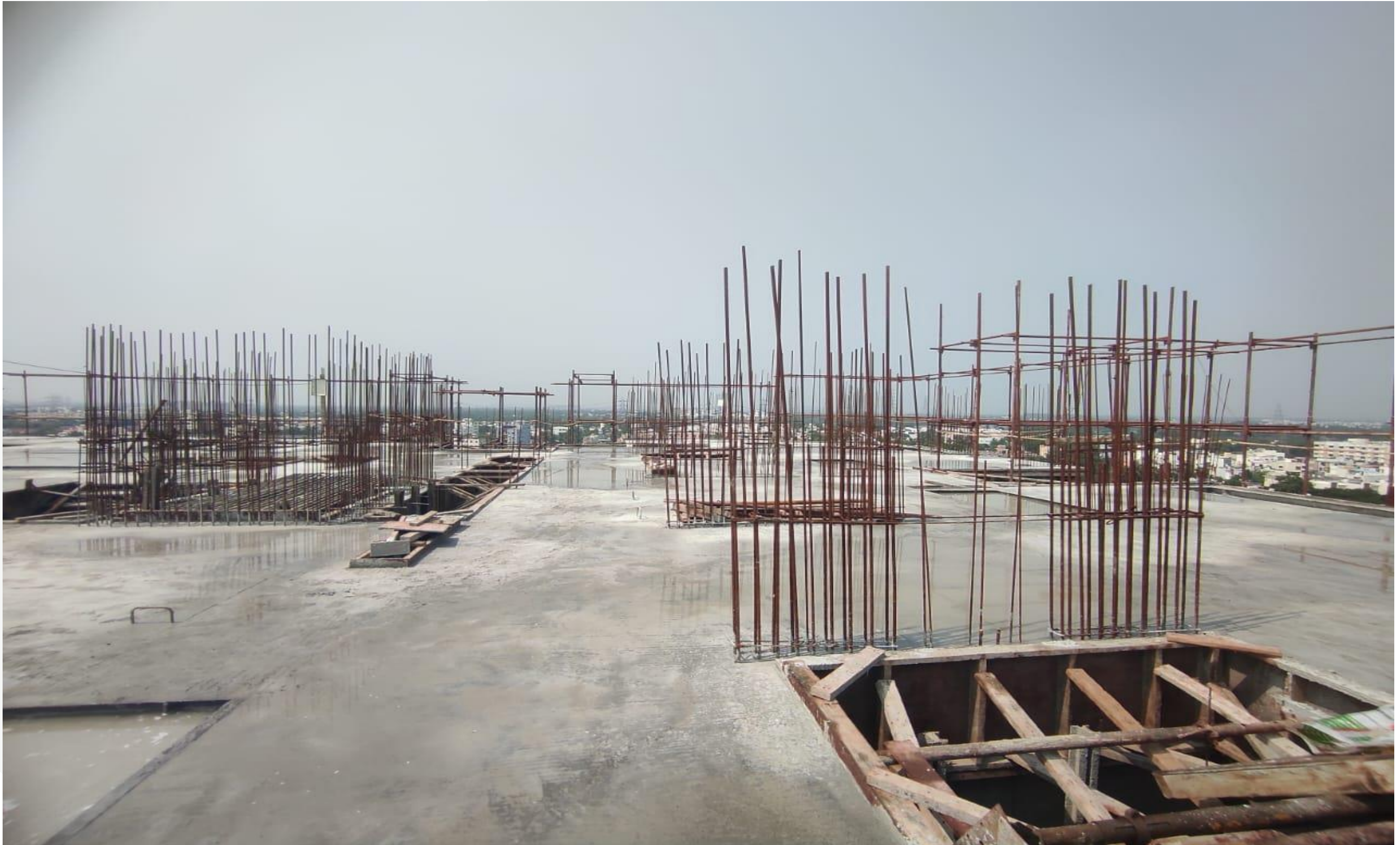
Main Building – Tenth Floor Slab Concrete Work Completed