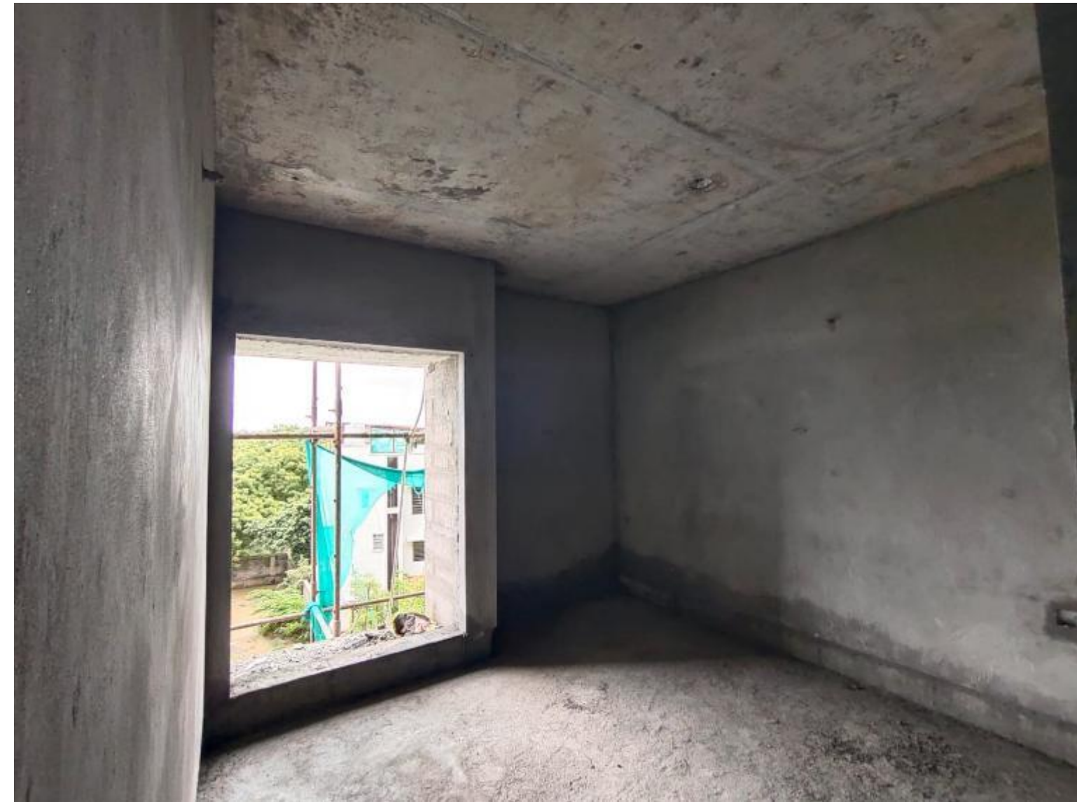
Main Building – First Floor Internal Wall Plastering Work Completed