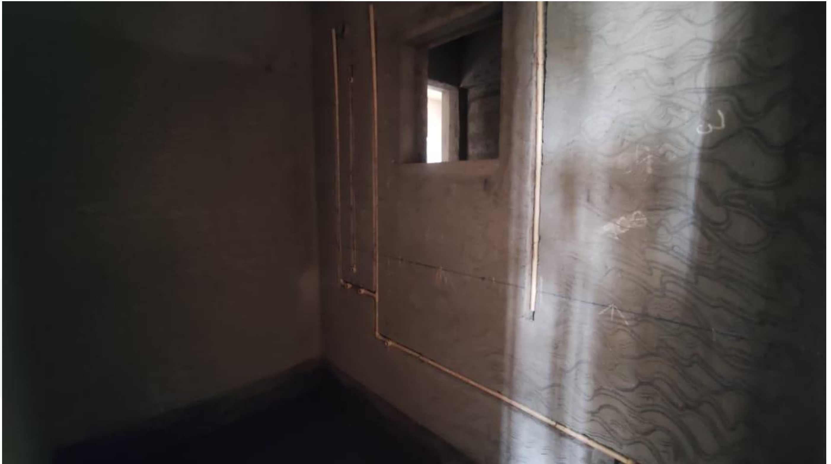
Plumbing – First Floor Toilet Wall Chasing Work In Progress