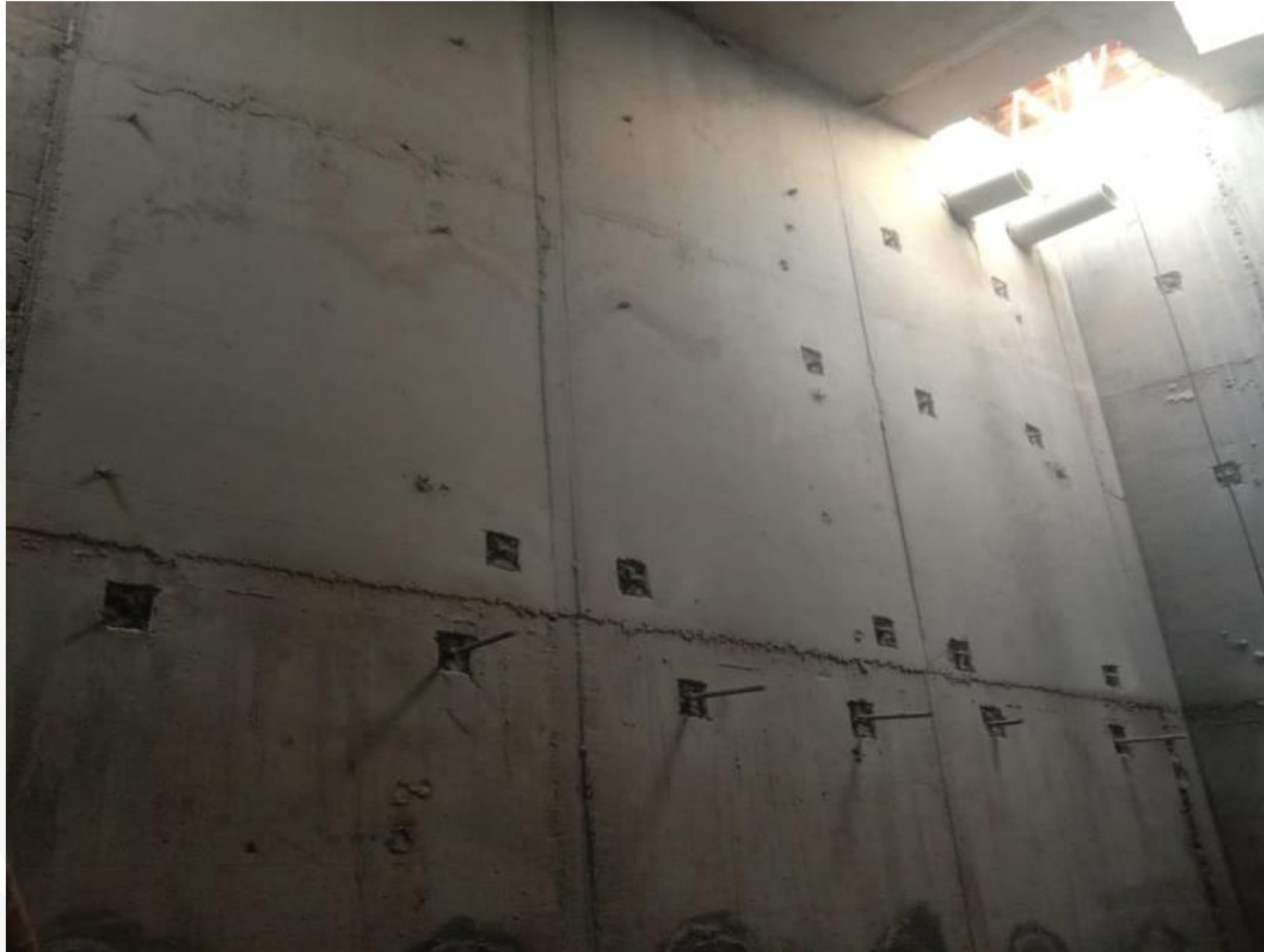
STP – Inner Tank Waterproofing Work In Progress