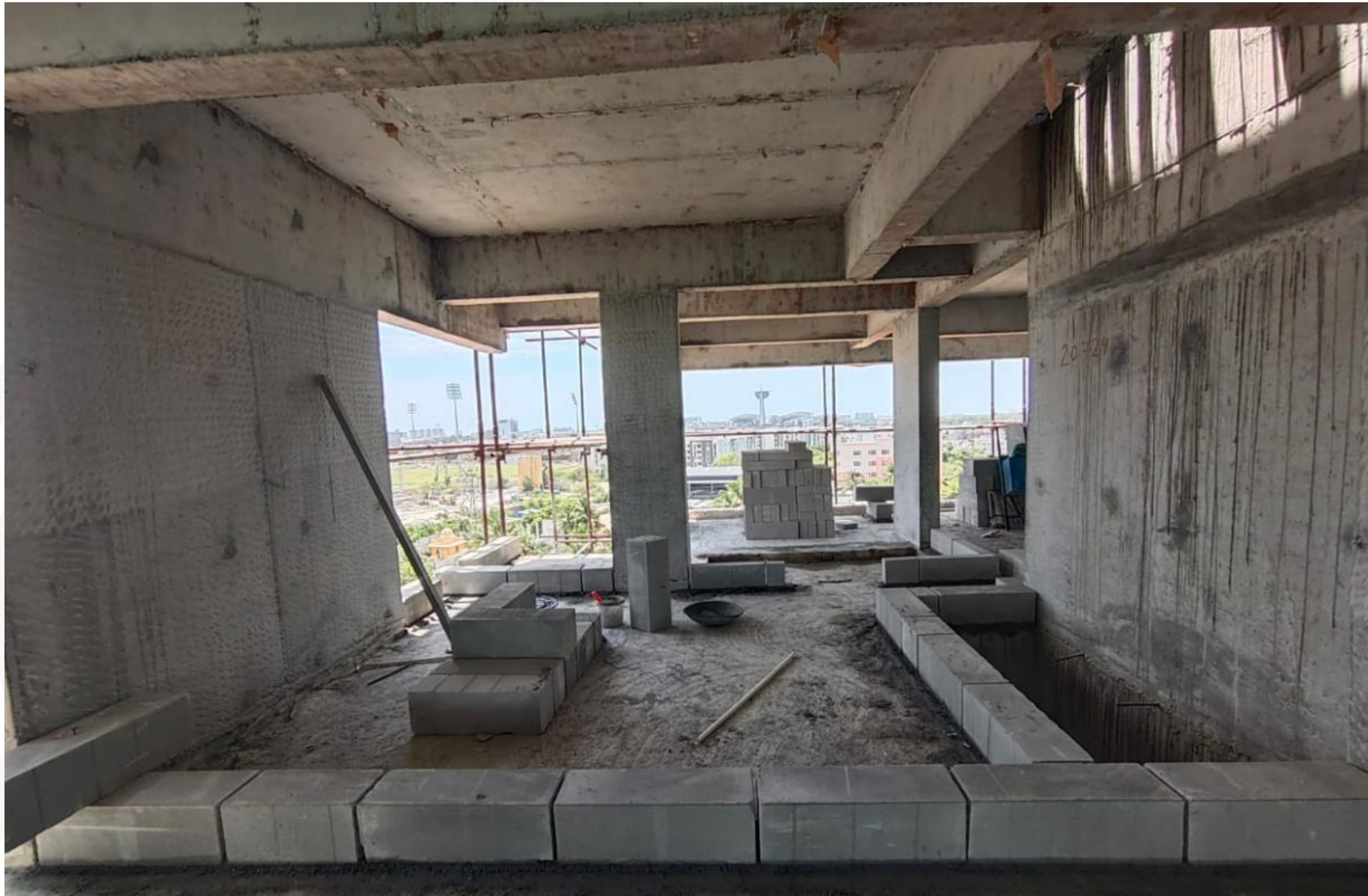
Main Building – Eighth Floor Block Work In Progress