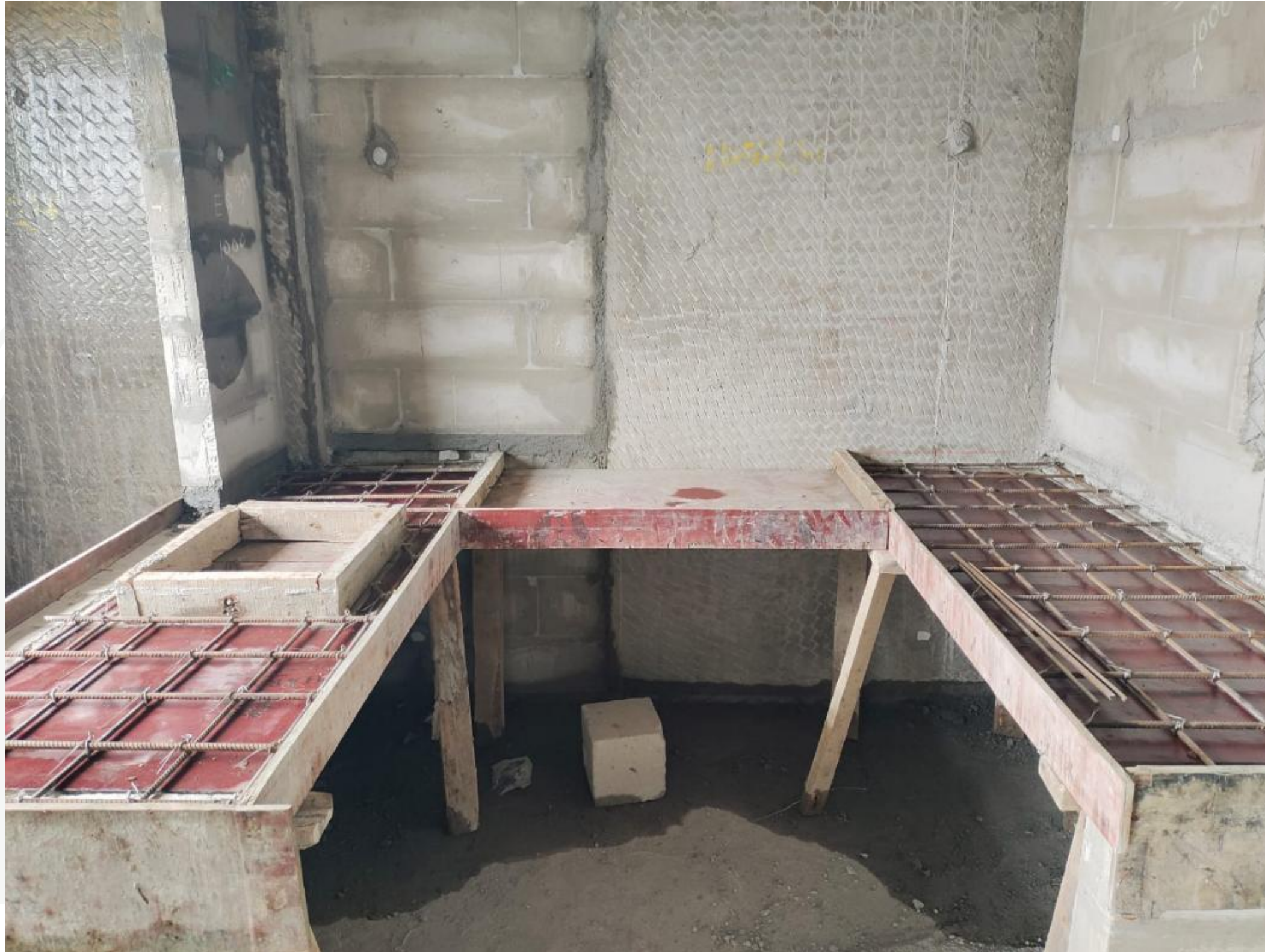
Main Building –Fourth Floor Kitchen Counter Slab Work In Progress