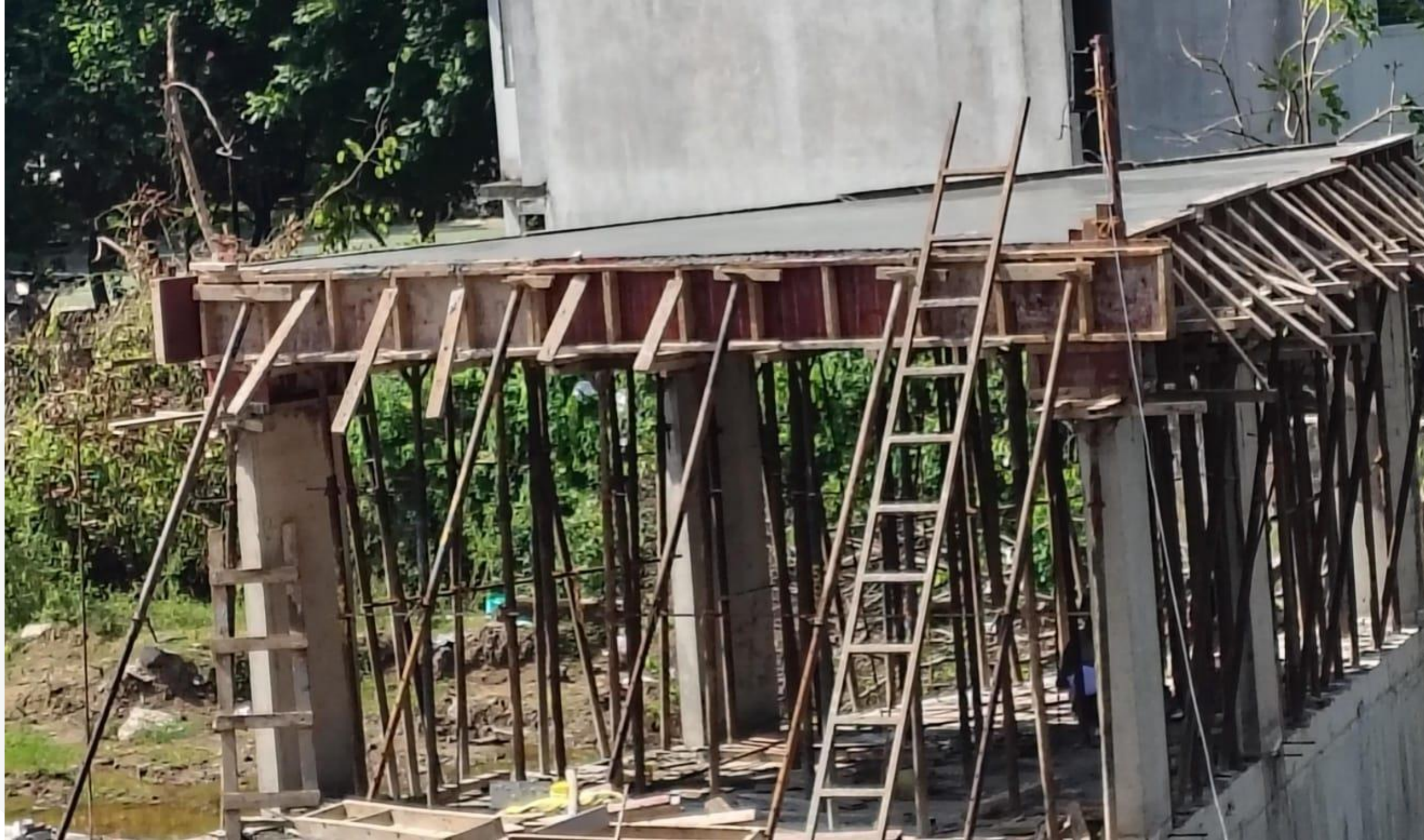
STP – Pump Room Slab Concrete Work Completed.