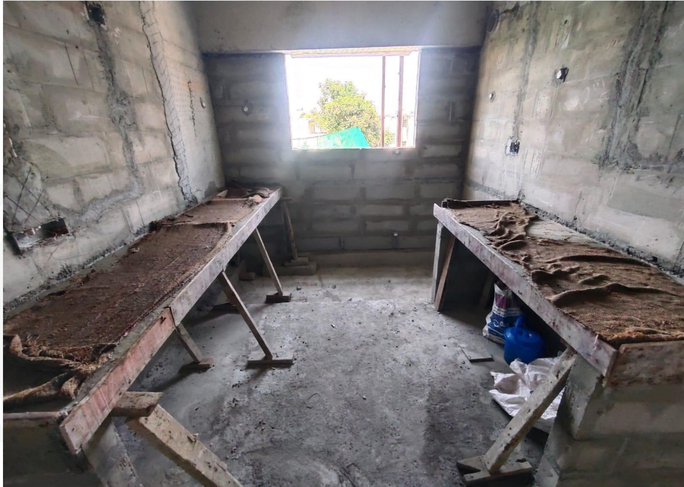
Main Building – First Floor Kitchen Counter Slab Work Completed