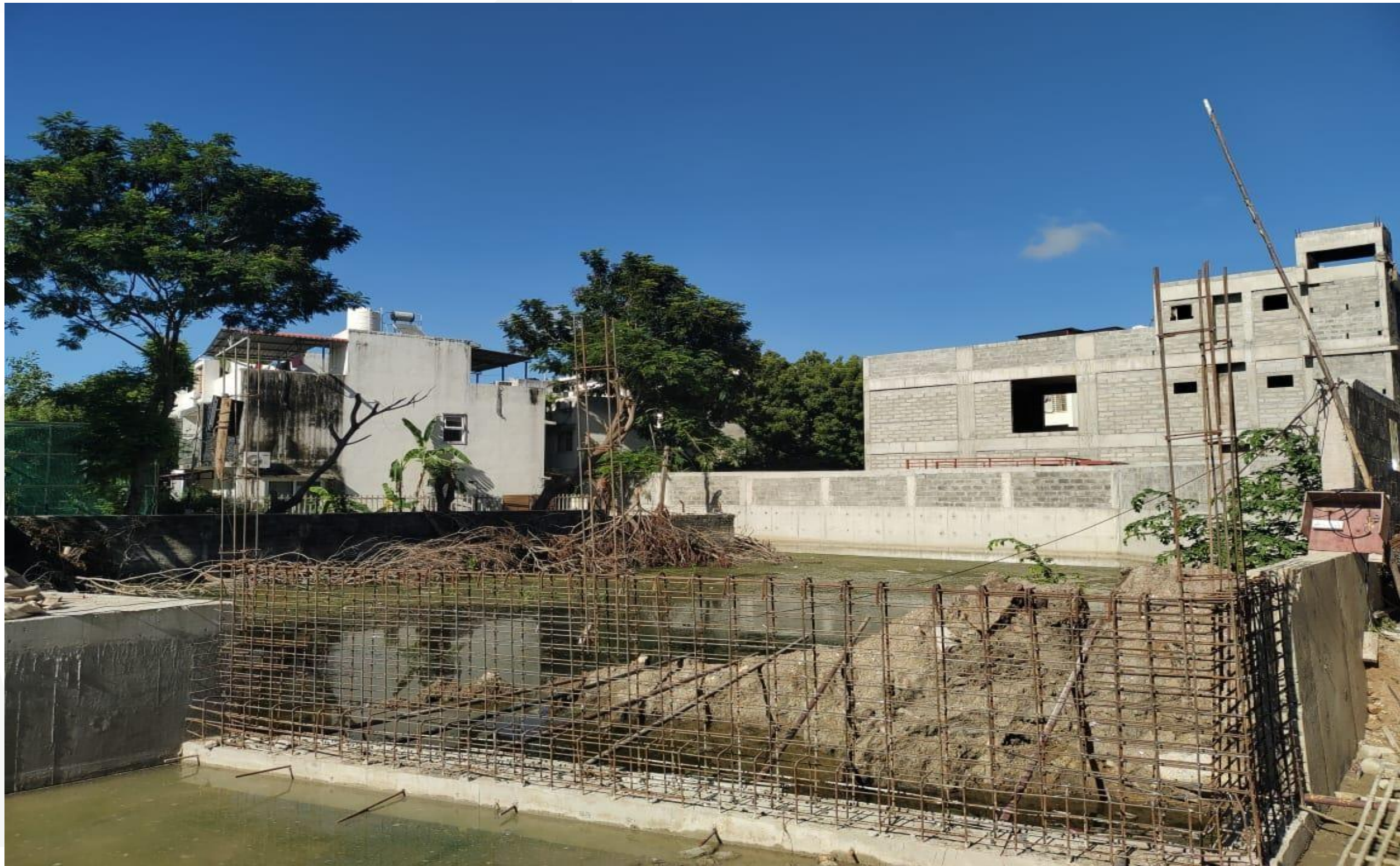
Compound wall – Type-6 RC Wall Erection Work In Progress