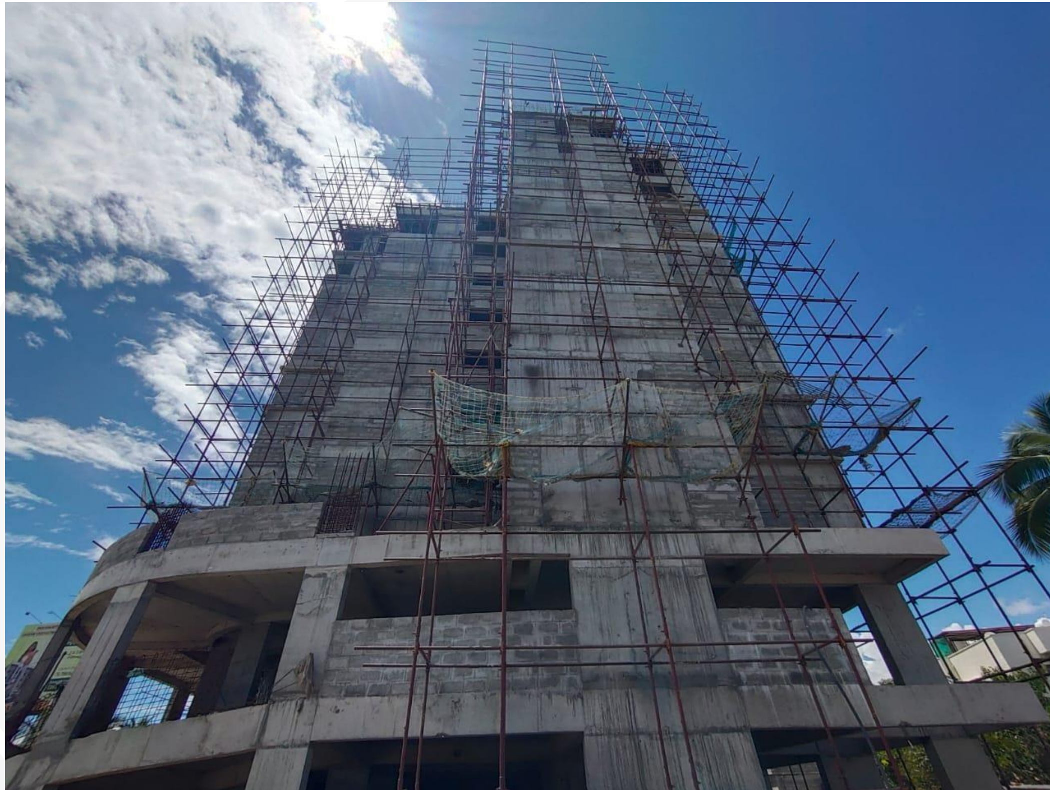
Main Building –East Side View.