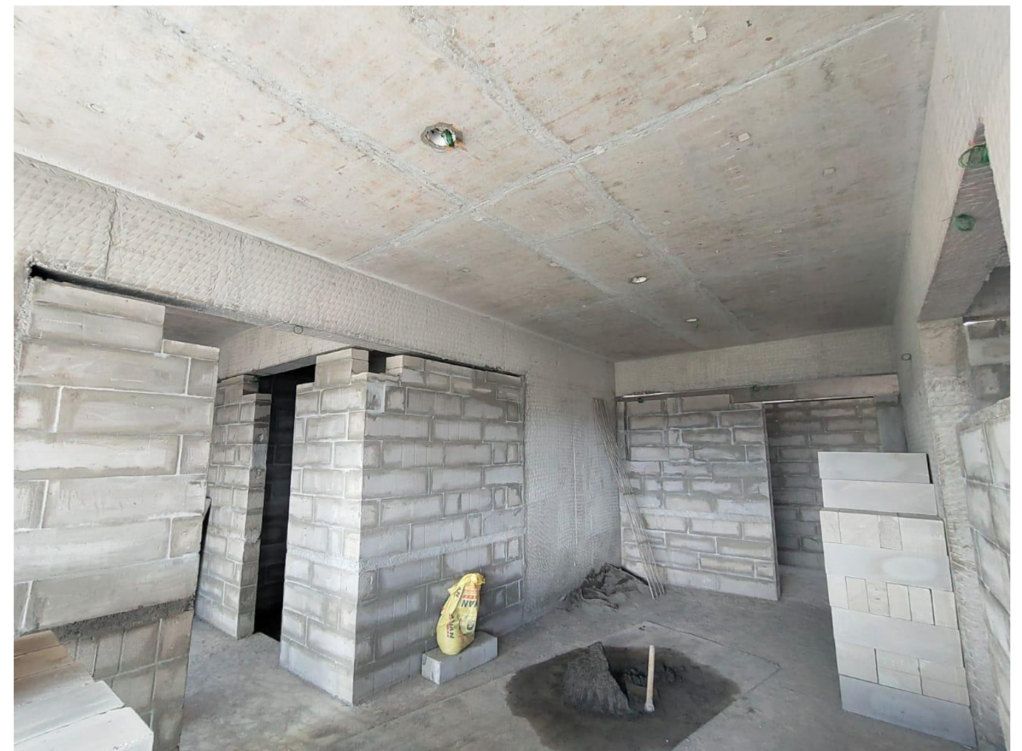
Main Building –Seventh Floor Block Work In Progress