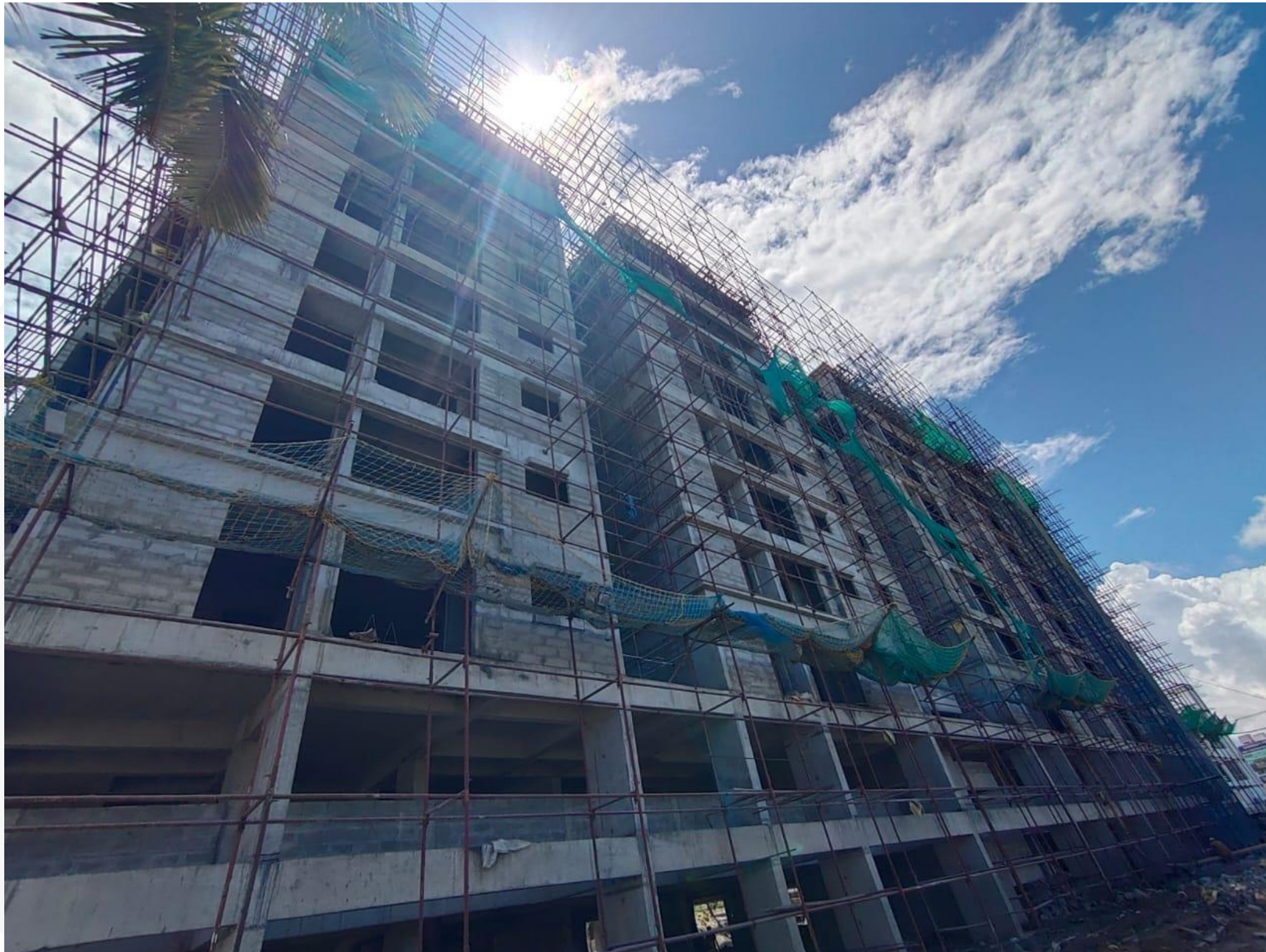
Main Building - North Side View