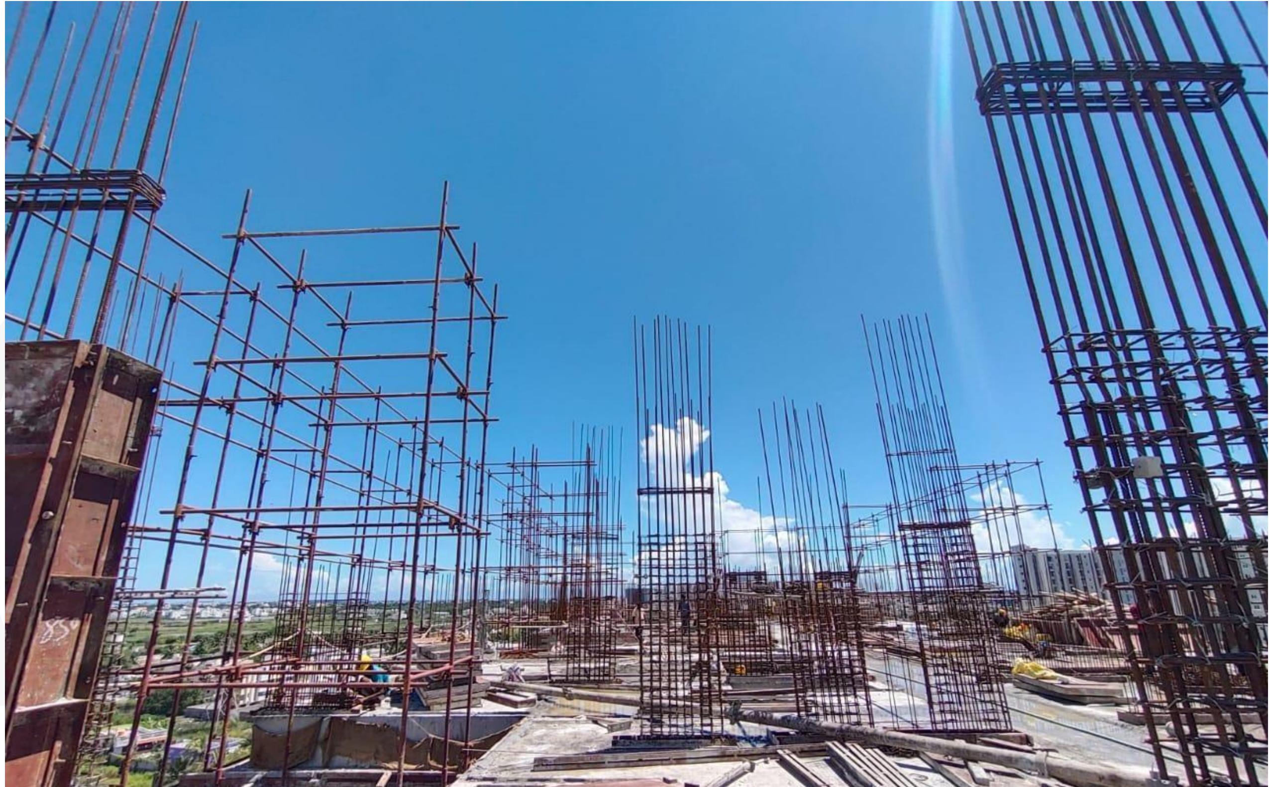
Main Building – Ninth Floor Column Reinforcement Work In Progress