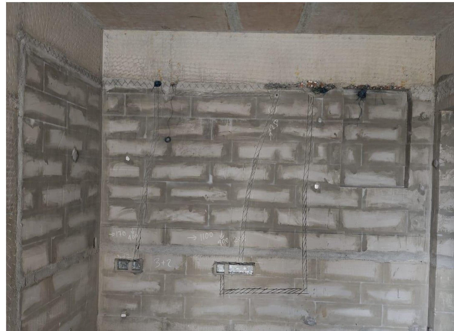
Fourth Floor - Electrical Wall Chasing Work In Progress