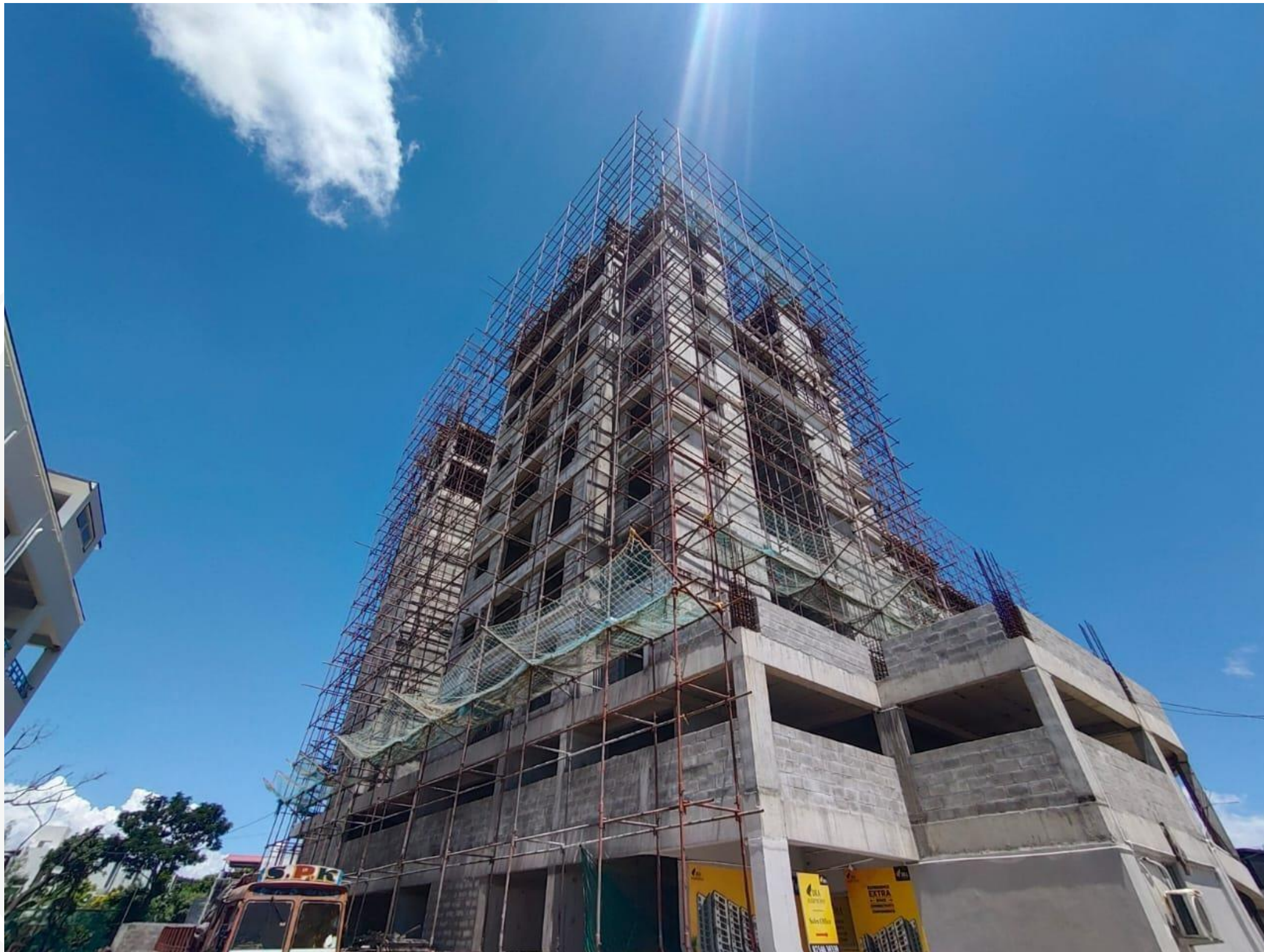
Main Building – West Side View.