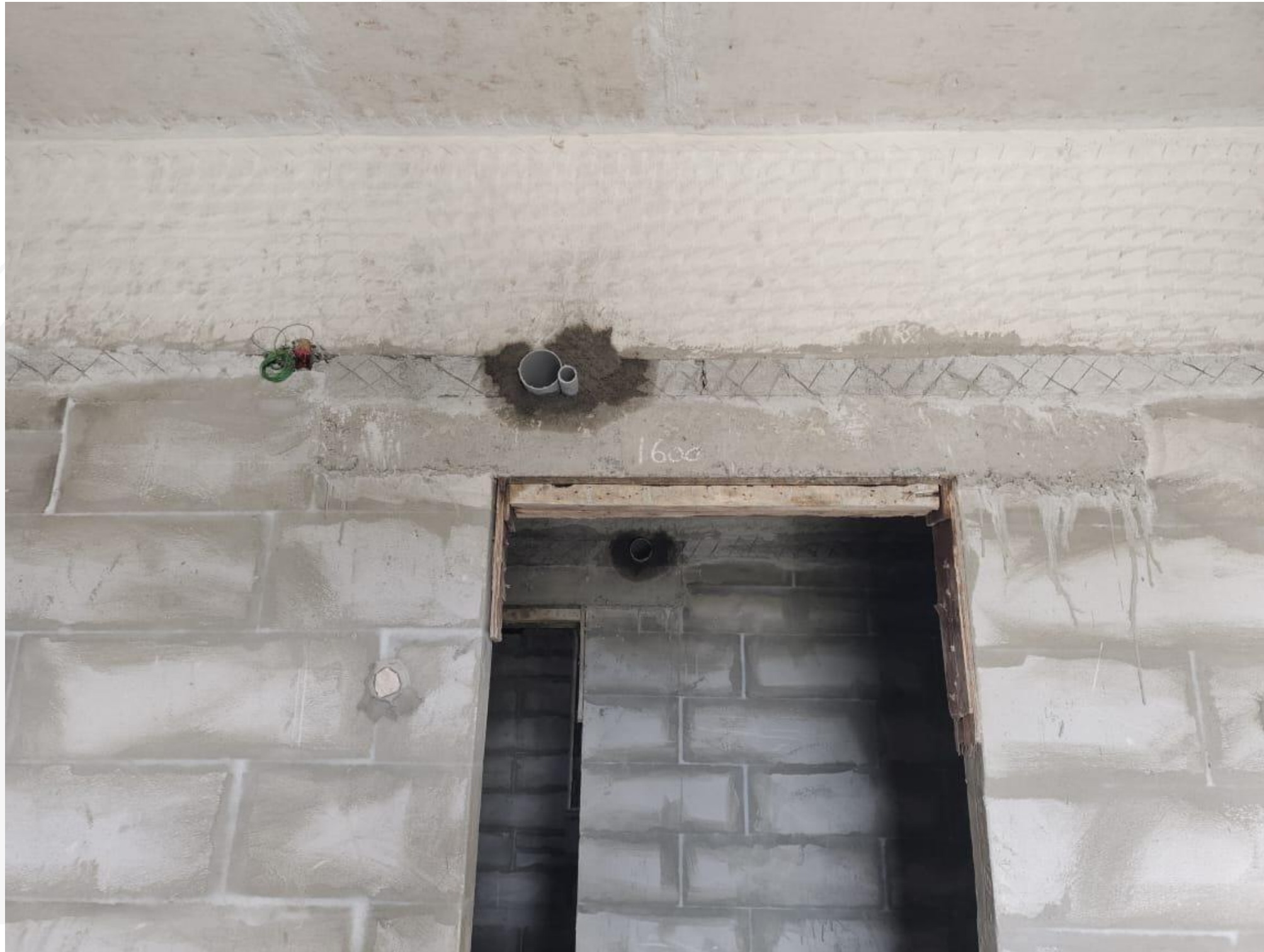
Sixth Floor - AC Sleeve Fixing Work In Progress