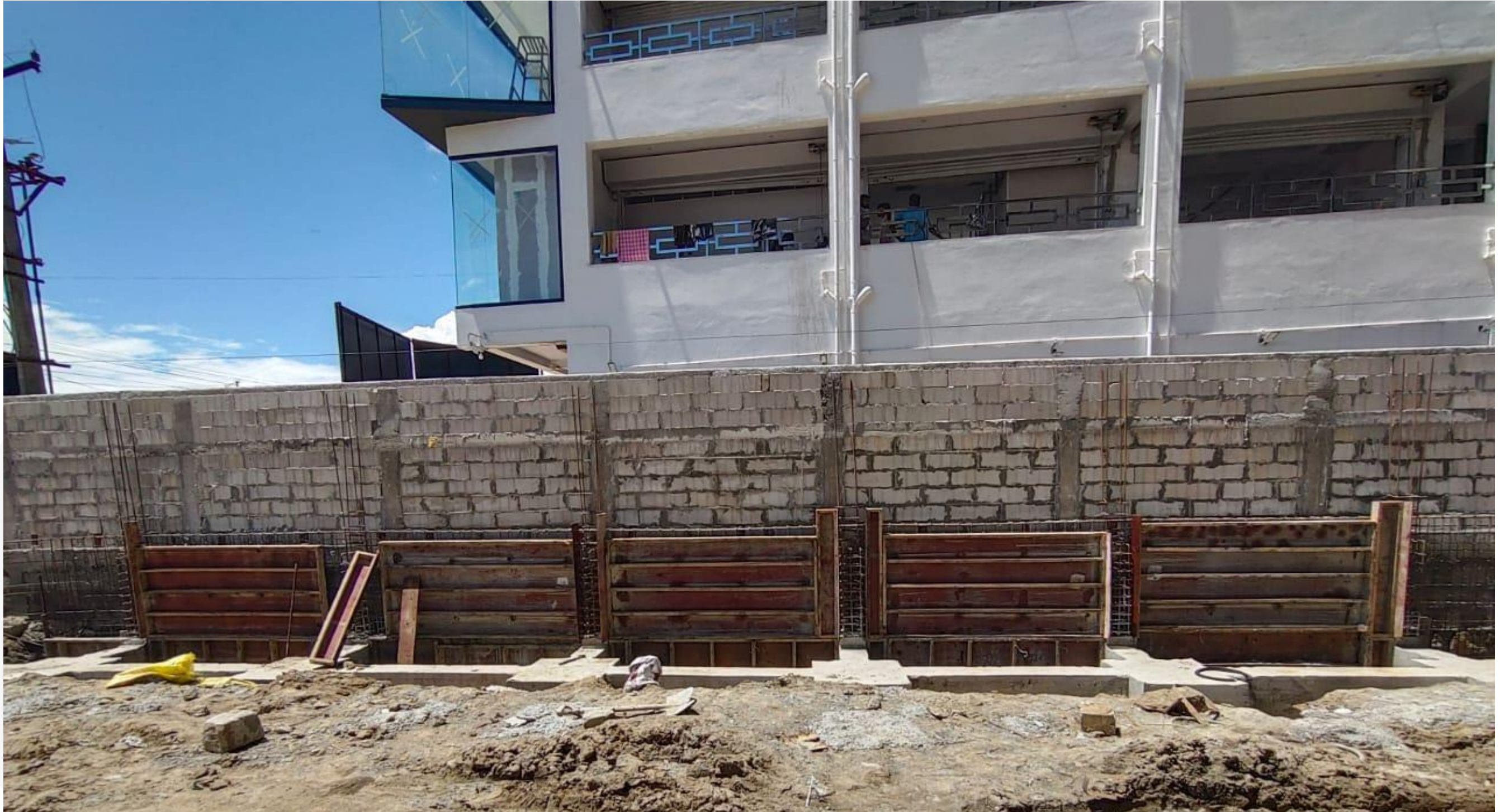
Compound wall Type-1 Pardi Wall Shuttering Work In Progress