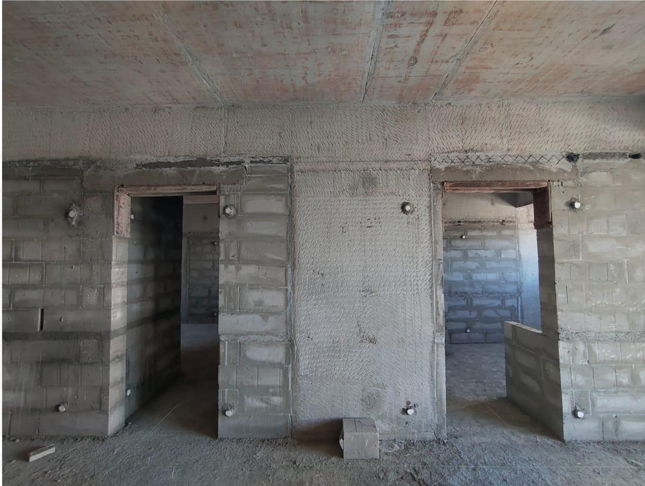
Main Building – Sixth Floor Button Marking Work In Progress.