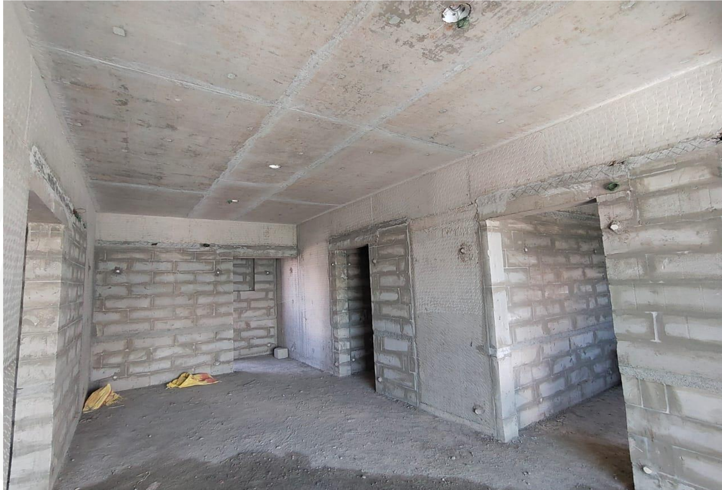
Main Building –Sixth Floor Block Work Completed