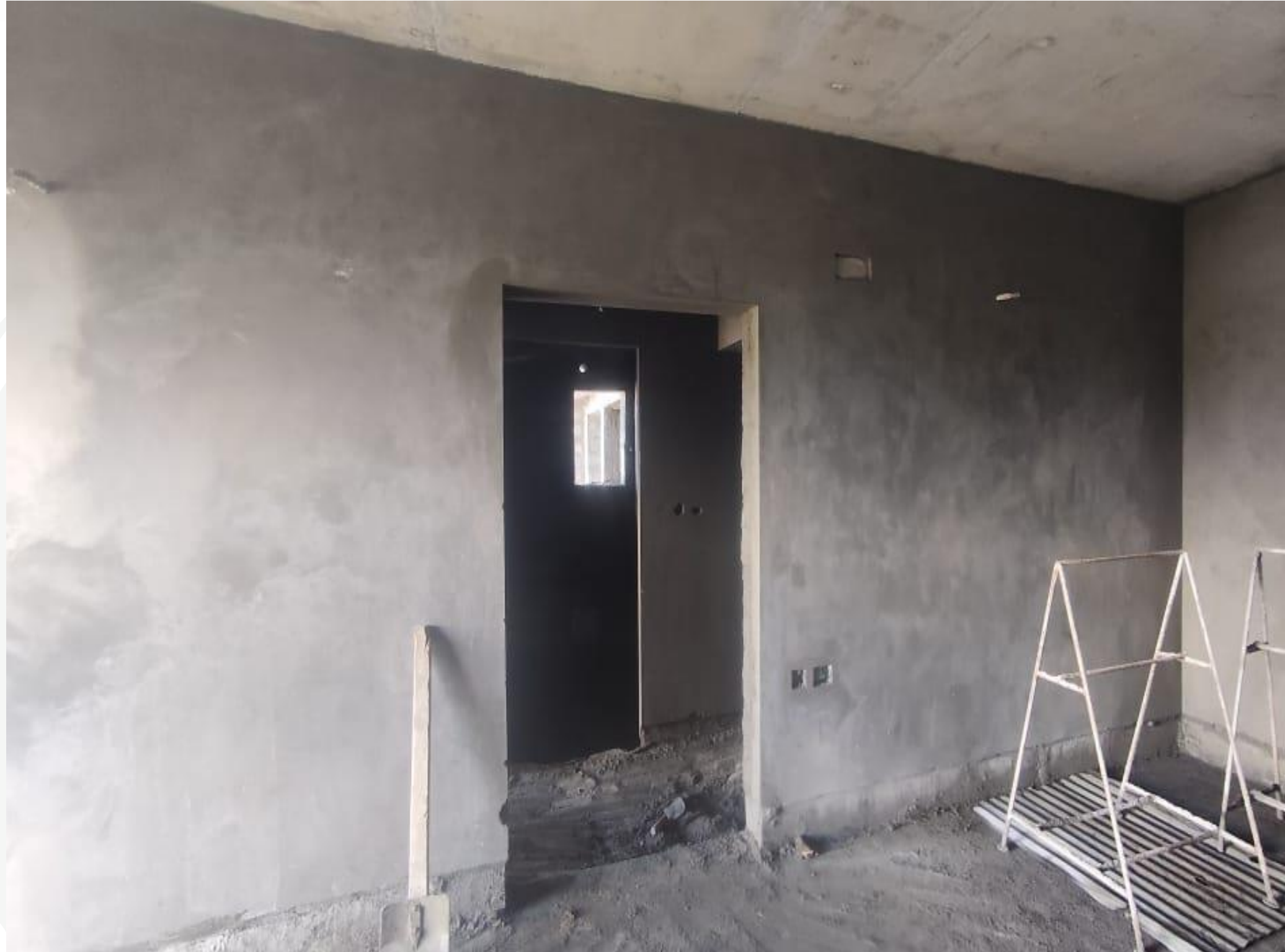
Main Building – Second Floor Internal Wall Plastering Work In Progress