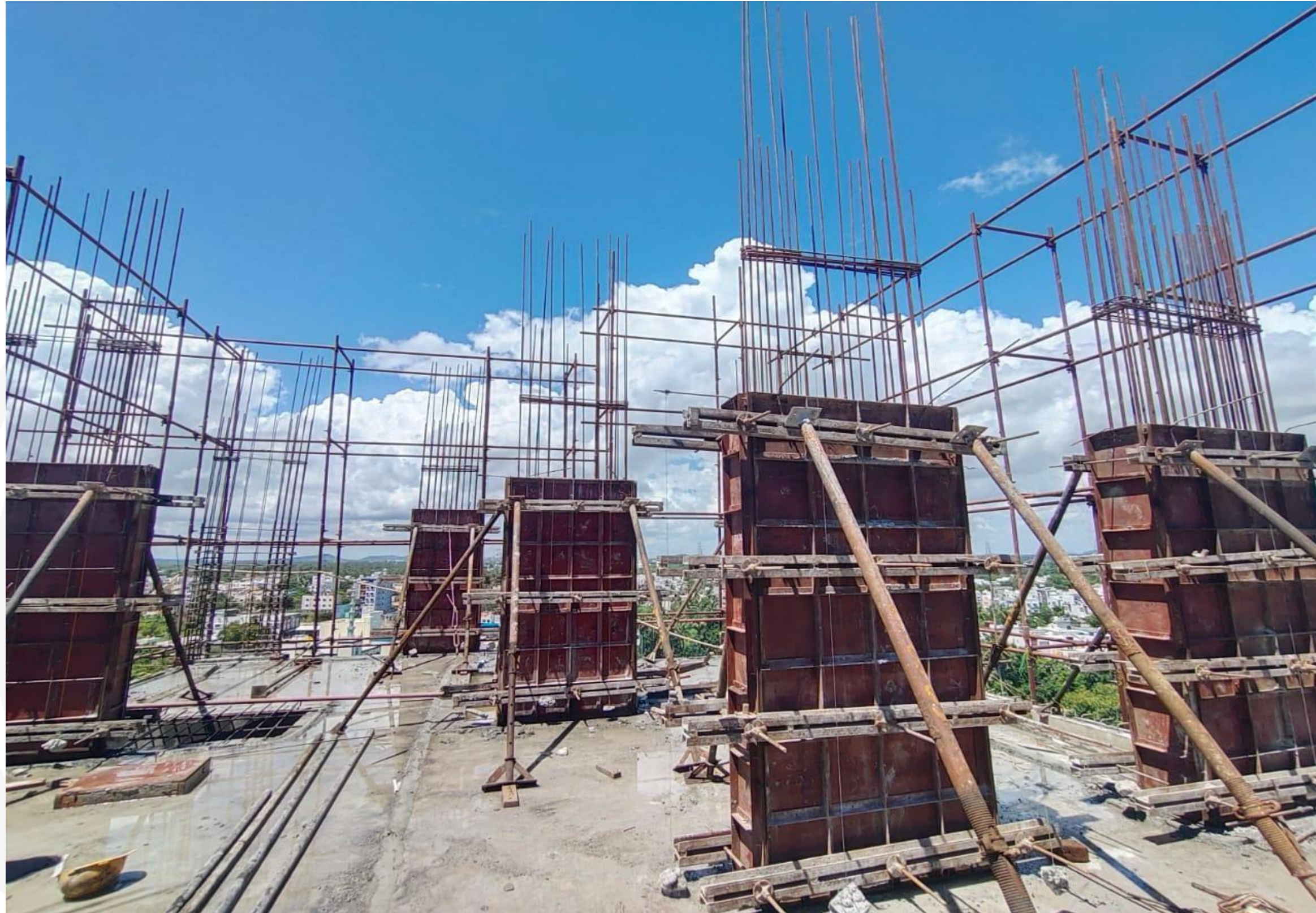
Main Building – Ninth Floor Column Shuttering Work In Progress