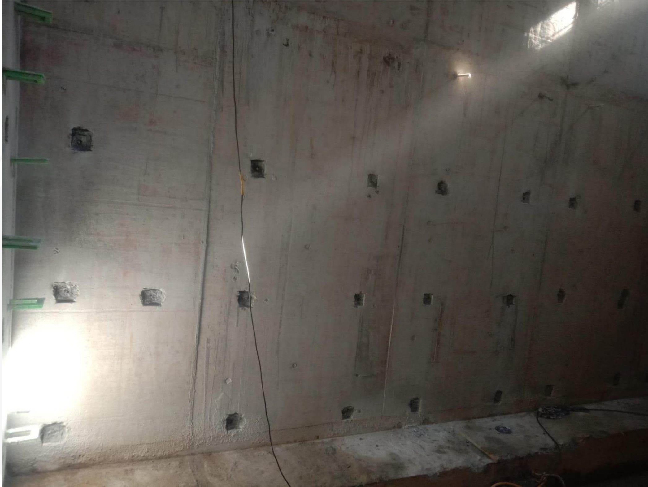
STP – Inner Waterproofing Work In Progress.