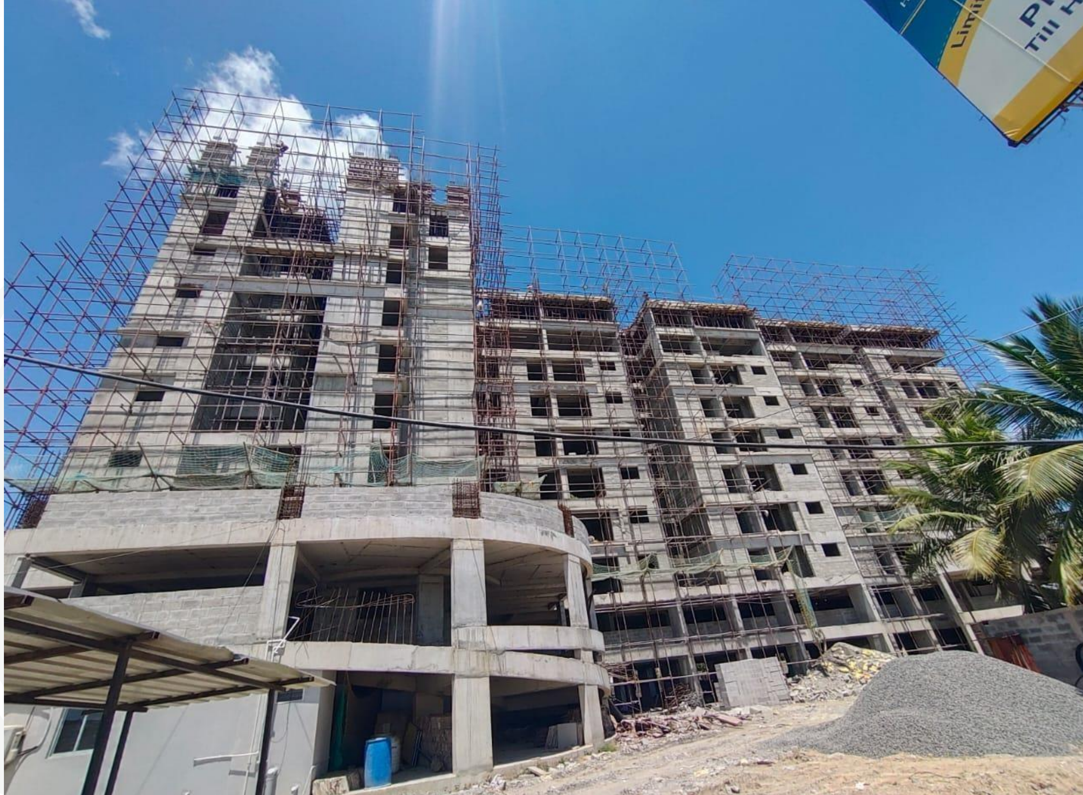
Main Building - South Side View.