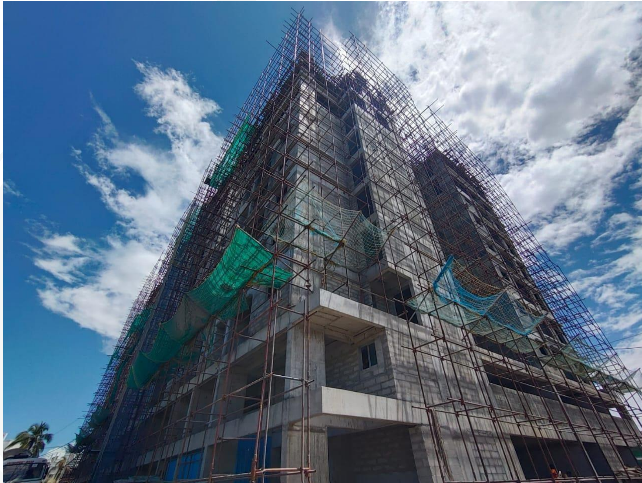
Main Building – West & North Side View.