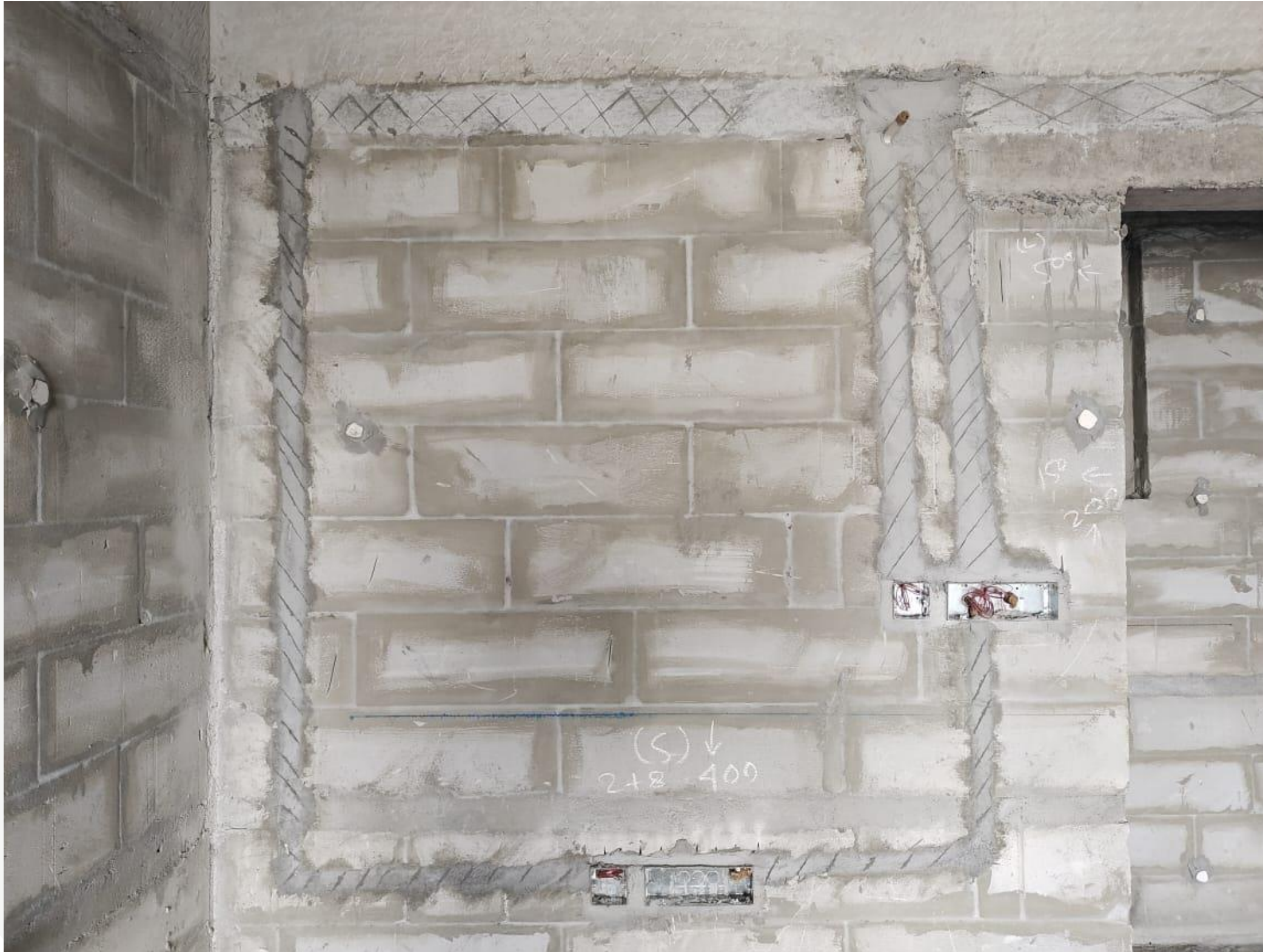
Third Floor - Electrical Wall Chasing Work Completed