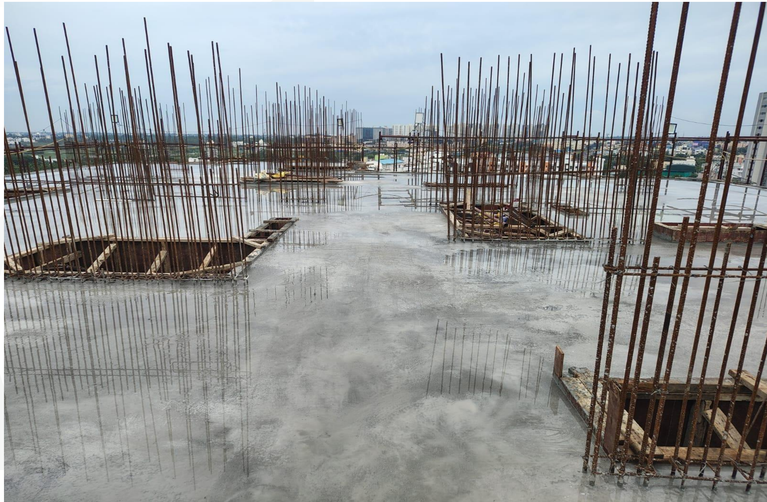
Main Building – Eighth Floor Roof Slab Concrete Work Completed