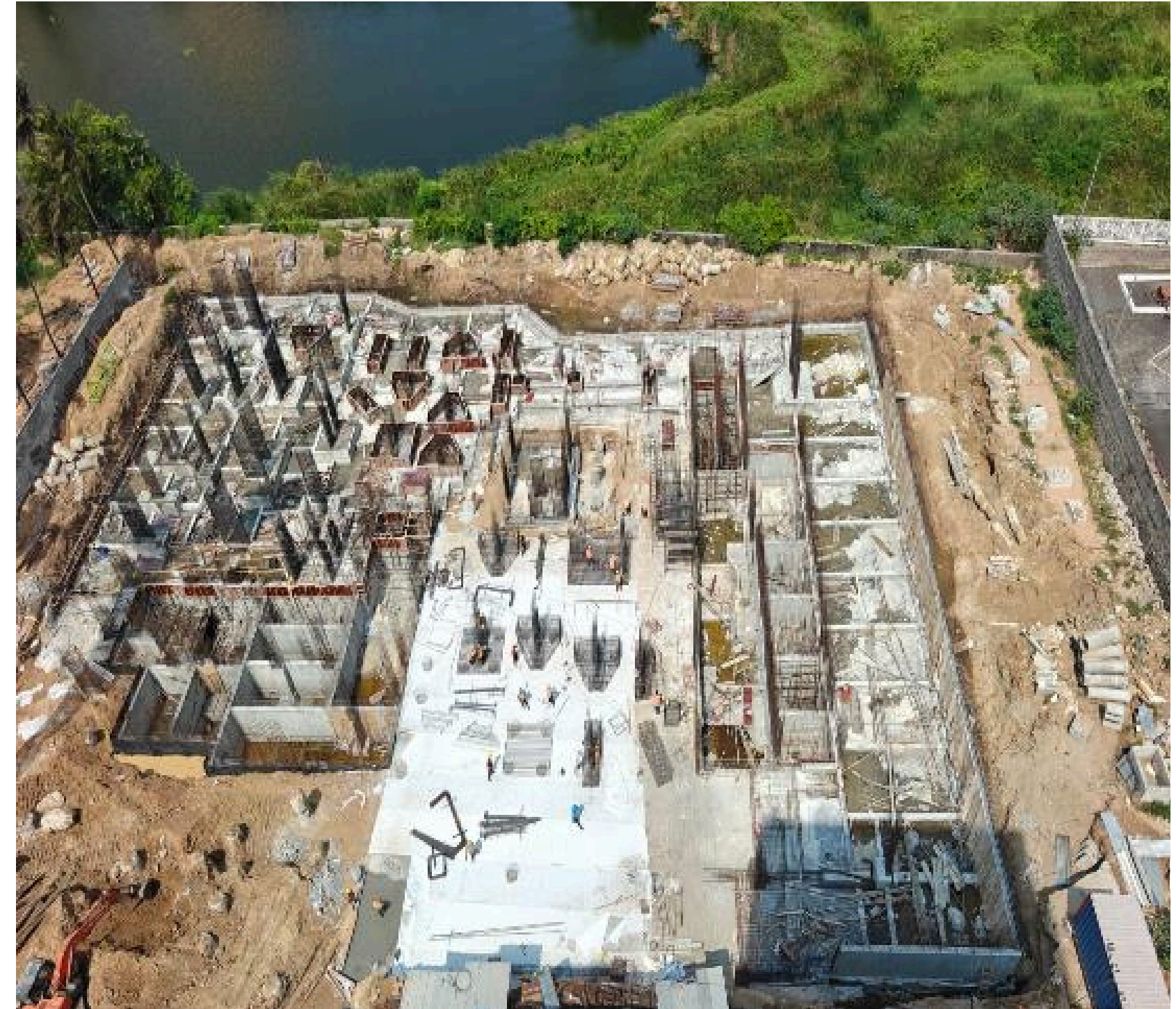
DRA iHeart – Wing 2 Pile Cap Shuttering and Water Proofing Work