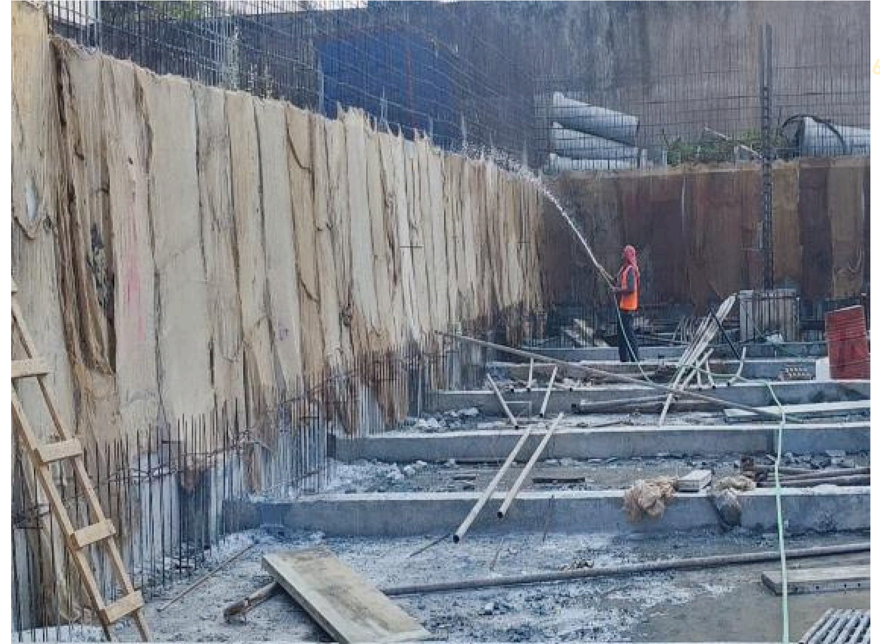
iHeart – Wing 2 Wall Curing Work