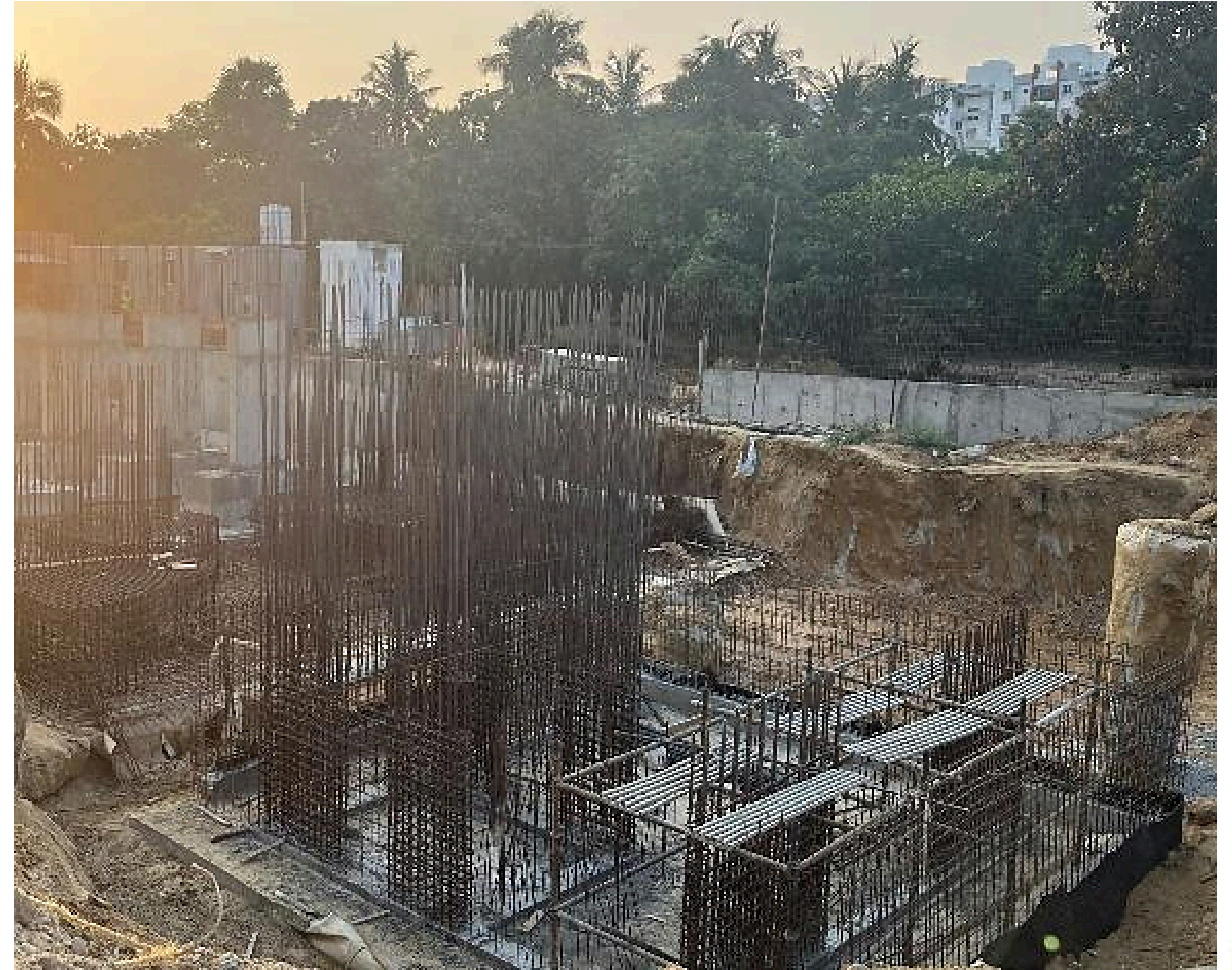
iHeart – Wing 1 PCC & Lift Pit Wall Reinforcement Work