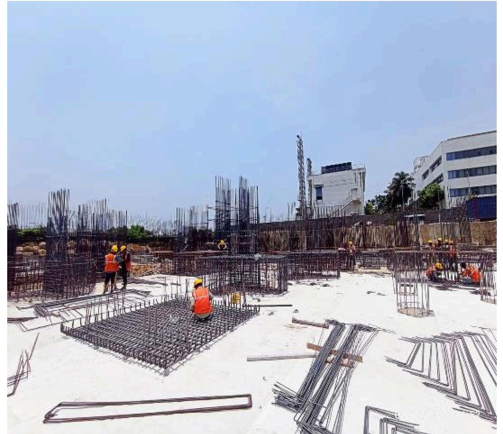
iHeart – Wing 2 Waterproofing and Pile Cap Reinforcement Work