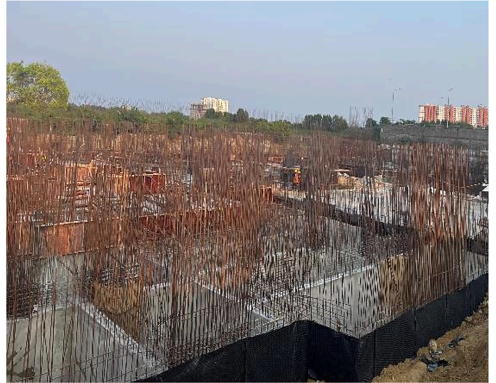
iHeart – STP Reinforcement Work