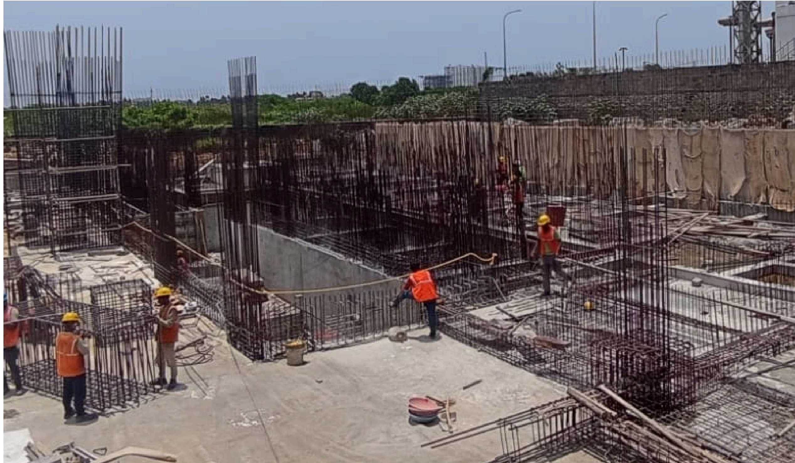
iHeart – UG Sump Area