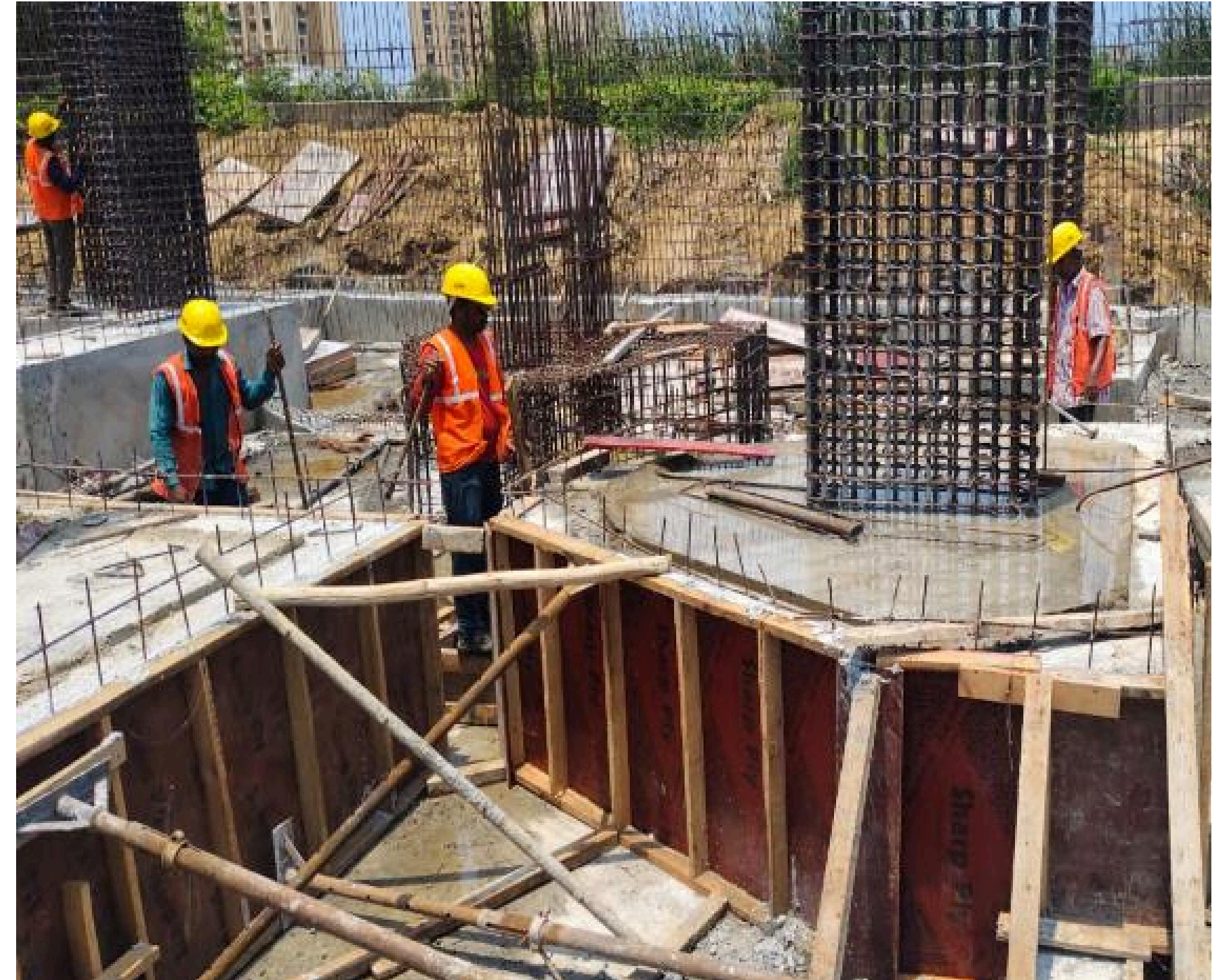
iHeart – Wing 2 Pile cap Reinforcement, Shuttering and Concreting Work