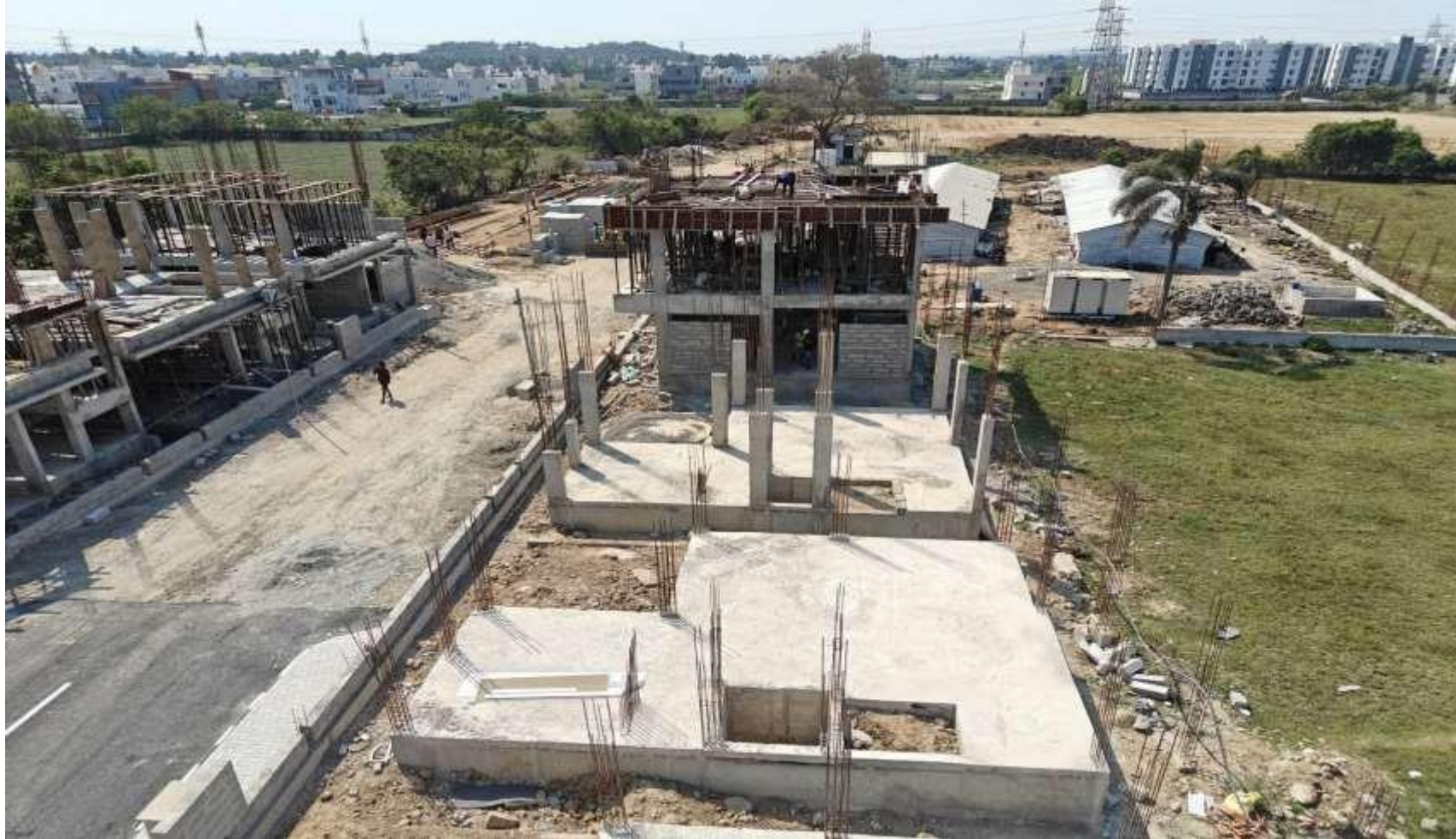
Villa no 12,13,14 Top View