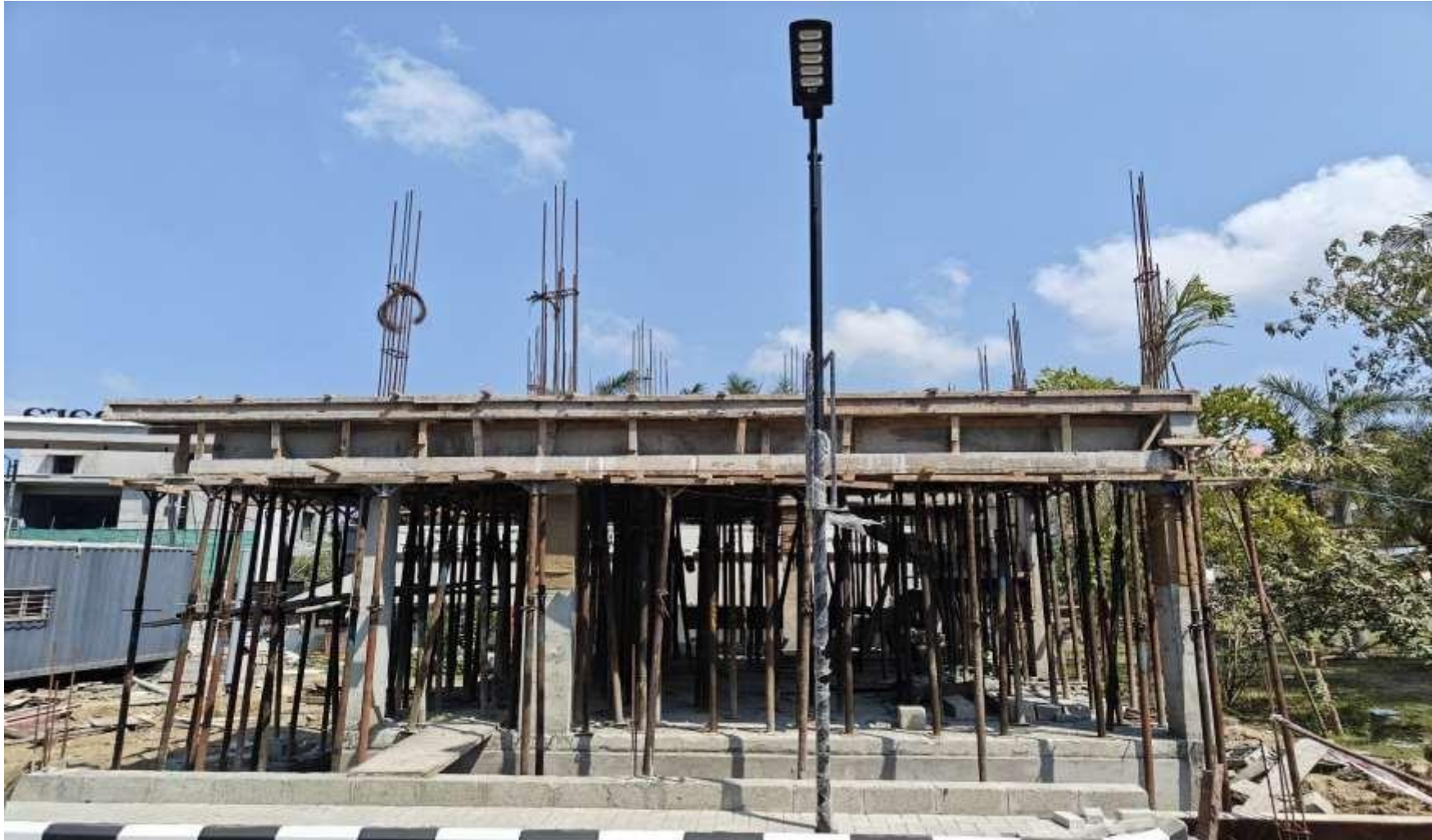
Villa No 3 – GF Roof Slab concrete work completed