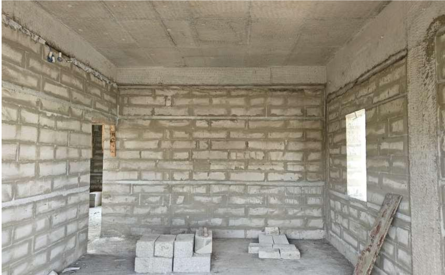
VillaNo 4 – FF Bedroom Area Block work completed