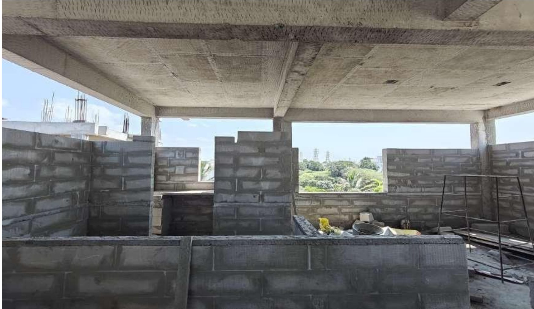
Villa No 06 – SF Bedroom Blockwork in progress