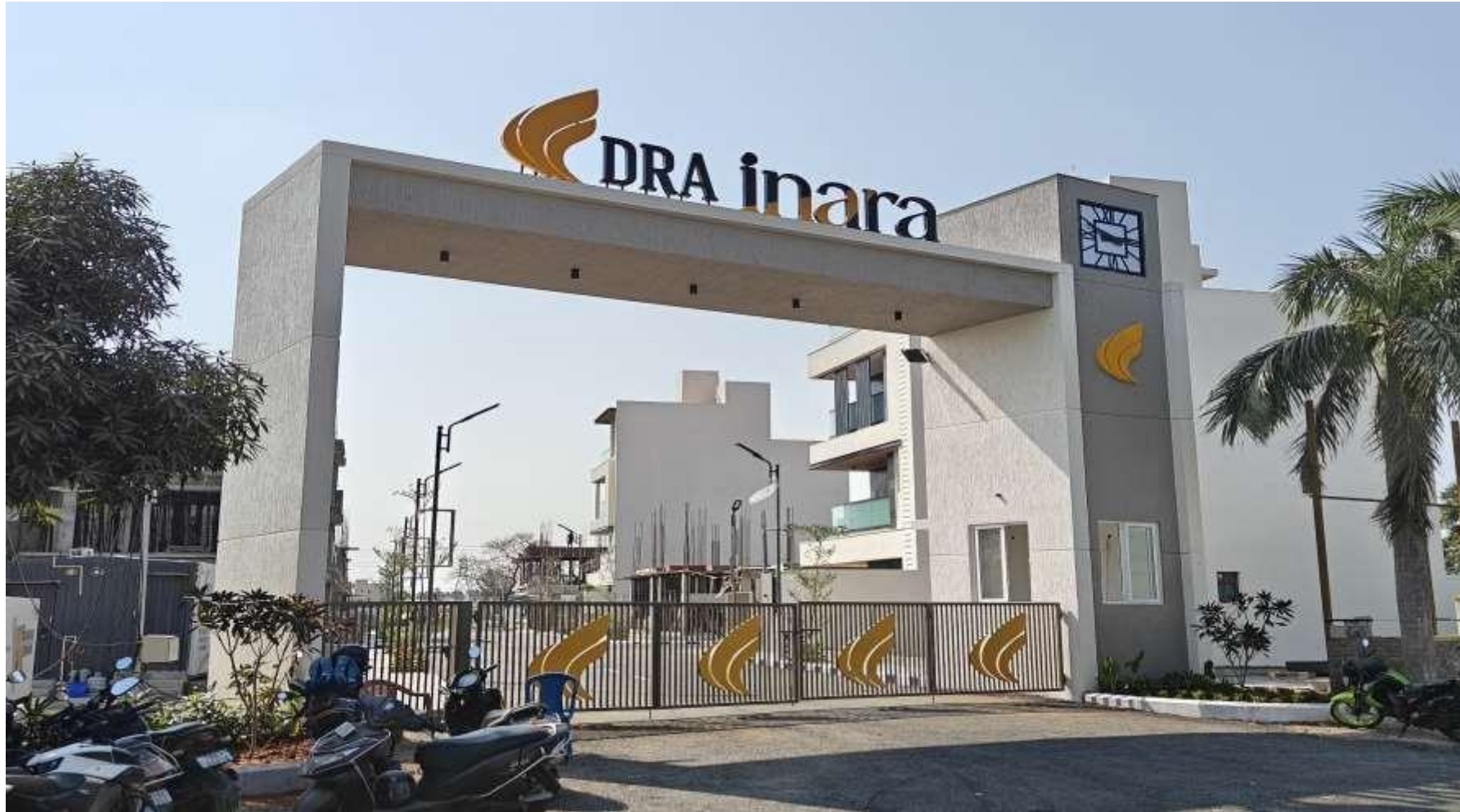
Entrance Arch Front View