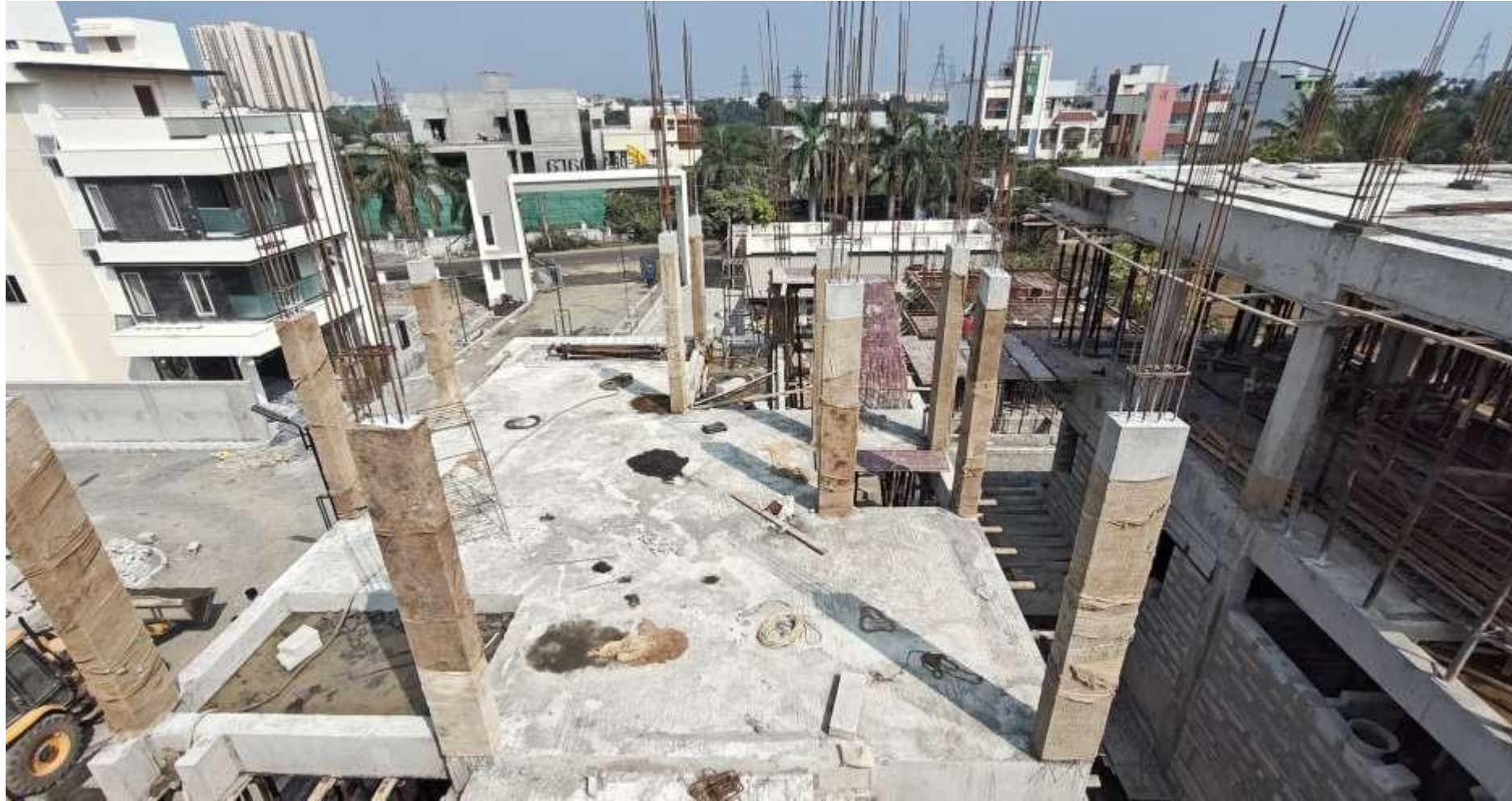
VillaNo 5 – Second Floor Column concreting work completed