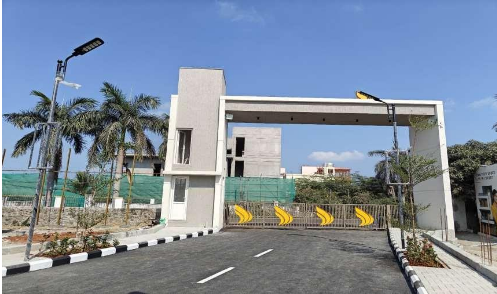
Entrance Arch In Side