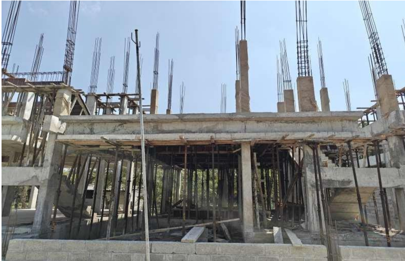
Villa No 10 – First floor column concrete work completed