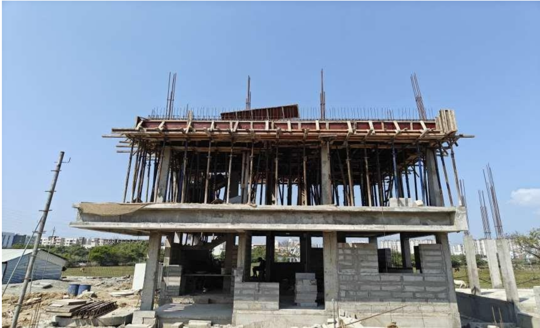
Villa No 12 – First Floor Roof Slab Reinforcement work in progress