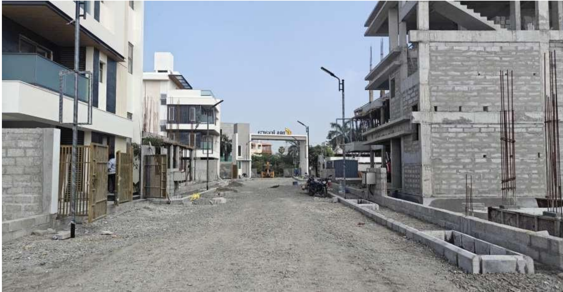
Internal Road Kerb Wall Fixing work in progress