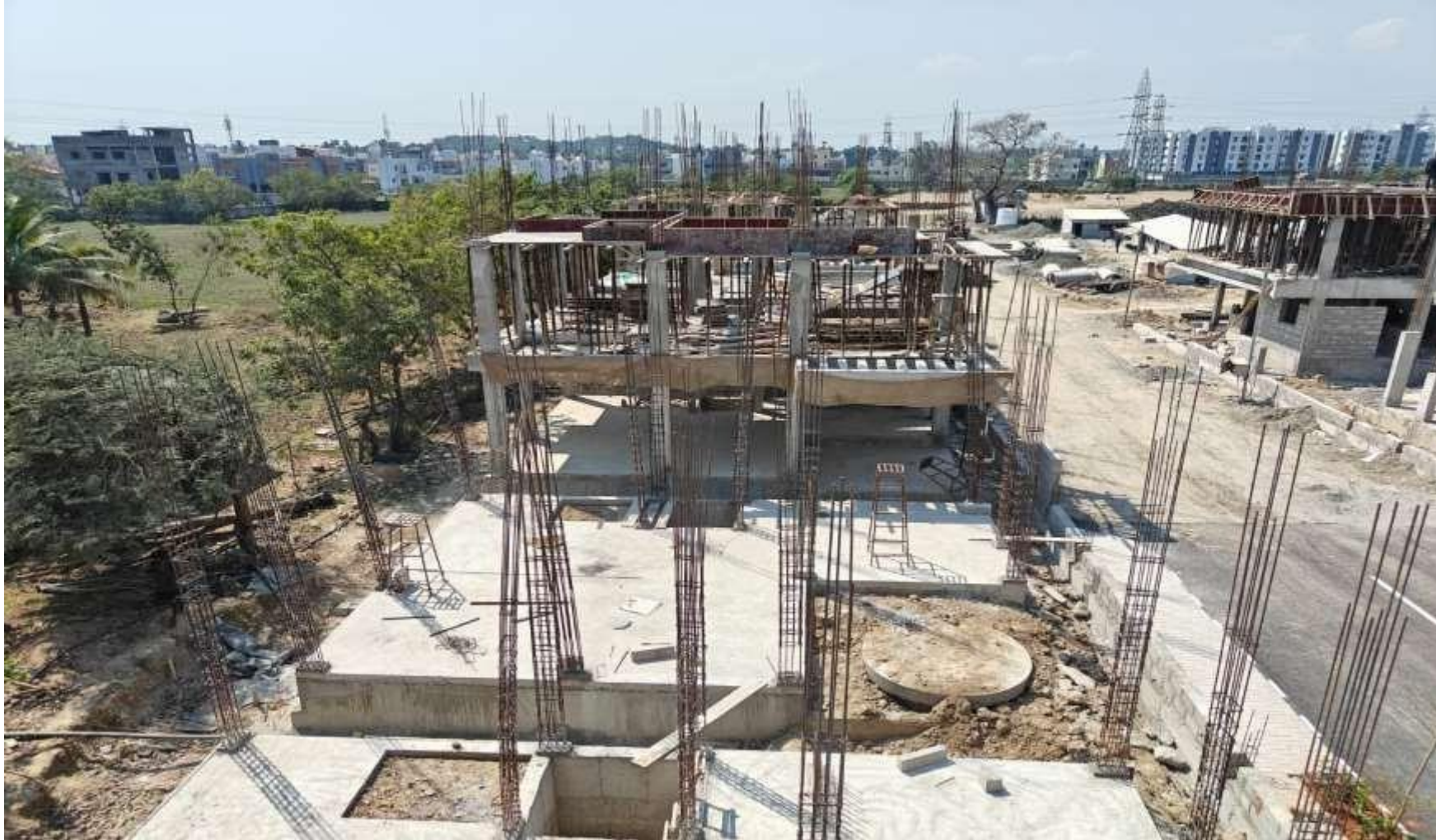
Villa no 9,10,11 Top View