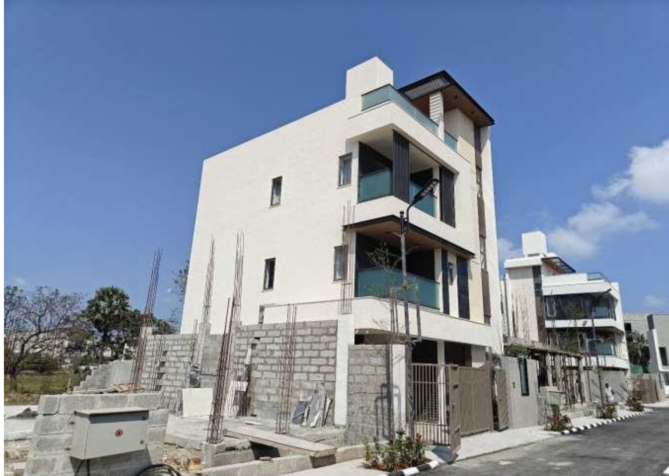
Villa no 16 – Southwest Corner View