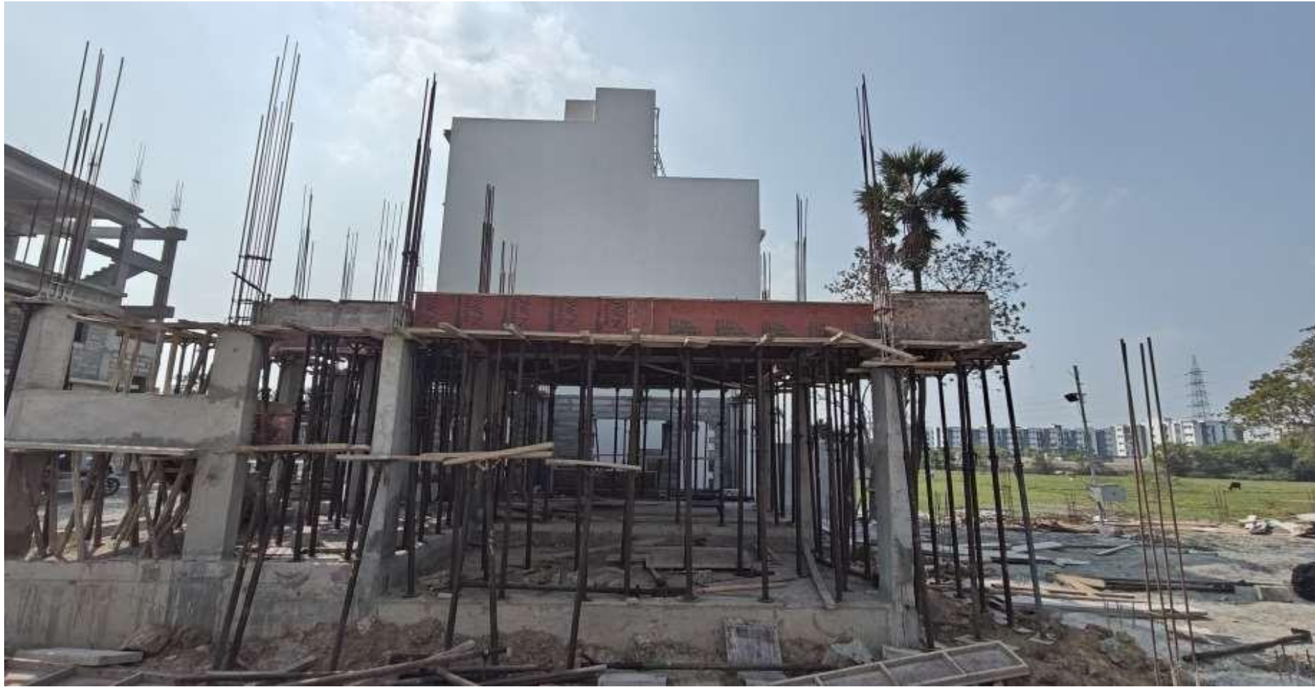
Villa 17 - Ground Floor Slab Shuttering work in progress