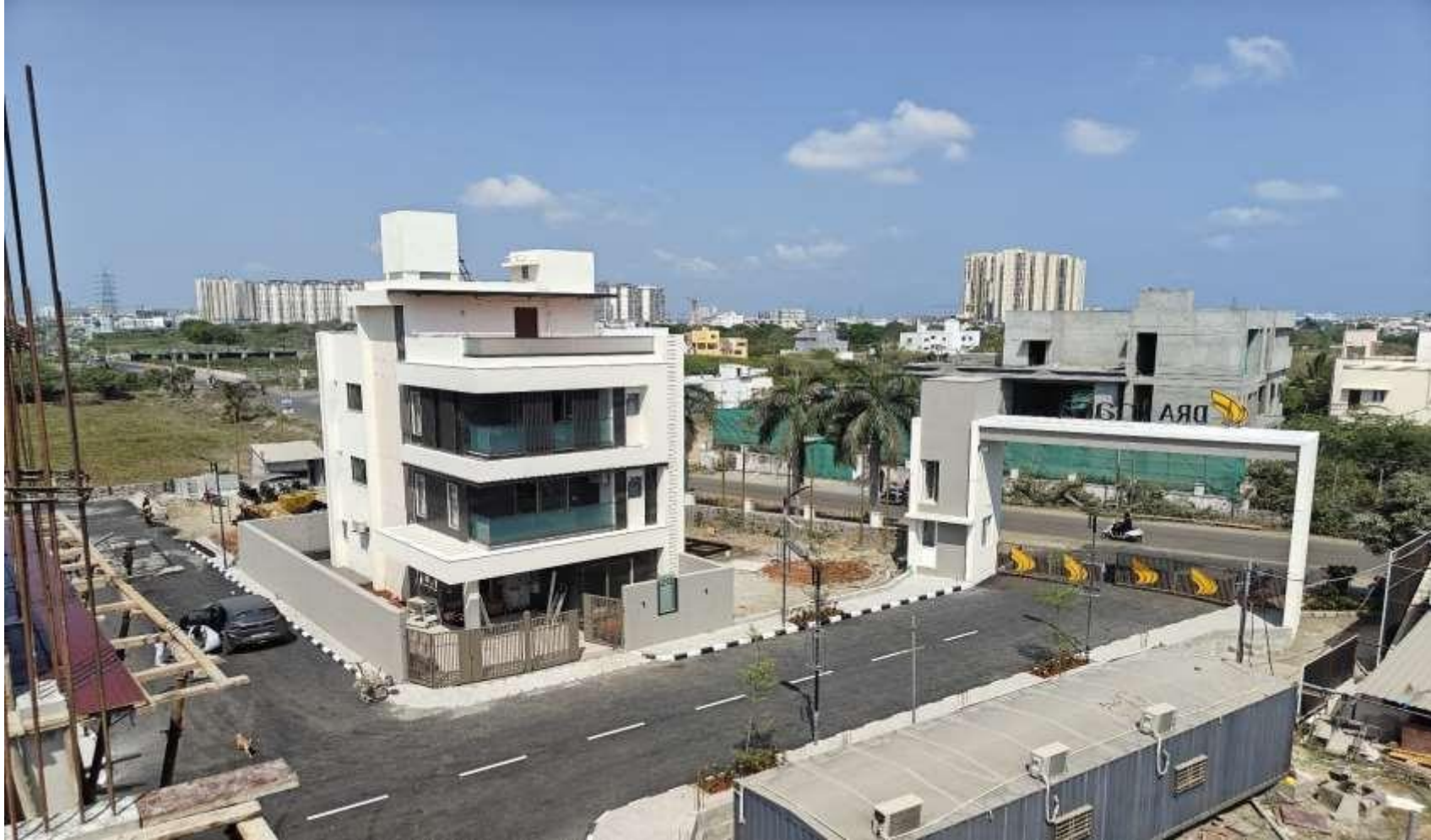
Villa no 16 – Southwest Corner View