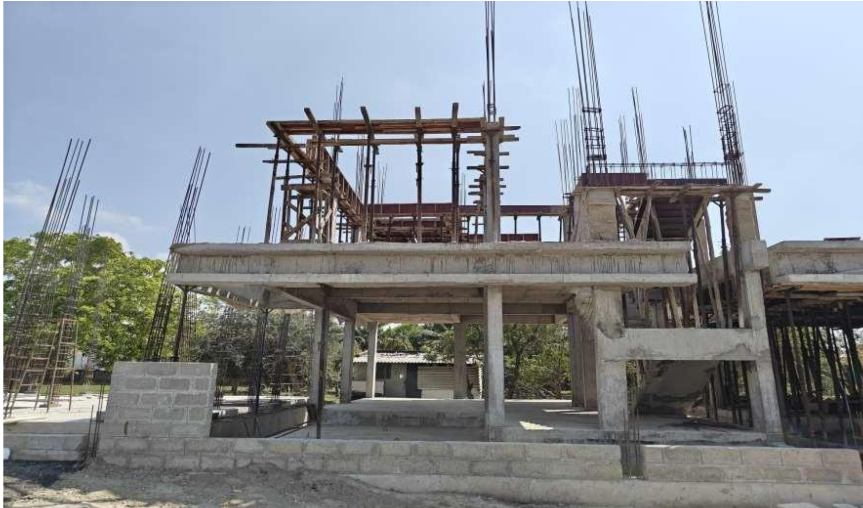
Villa No 09 – FirstFloor Roof Beam Shuttering work in progress