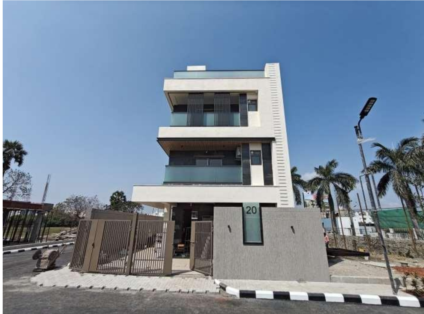
Villa no 20 – South side Elevation