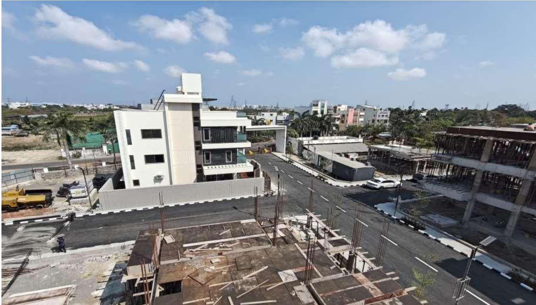
Internal Road Top view