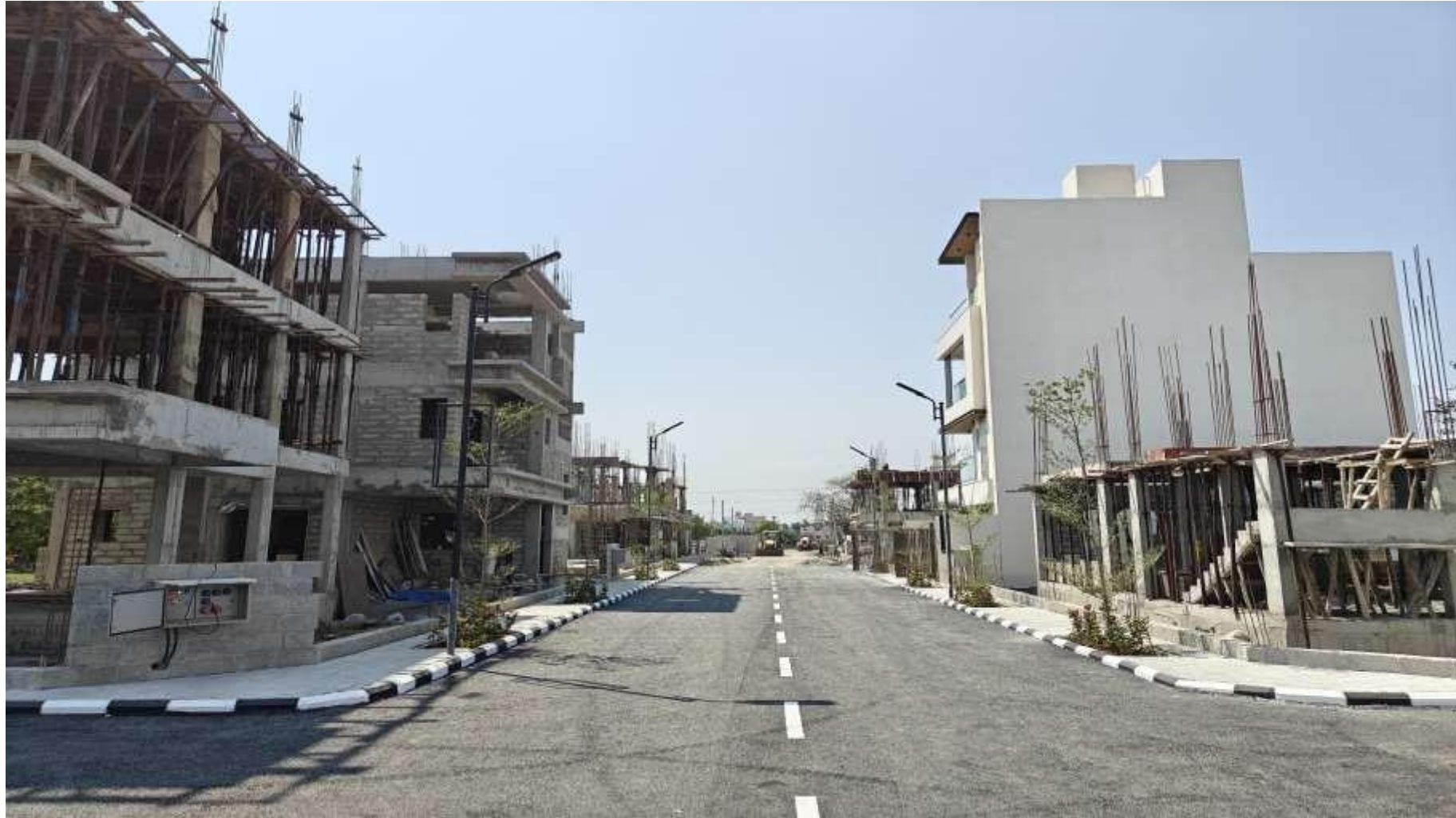
Internal Road DBM course Laying work completed