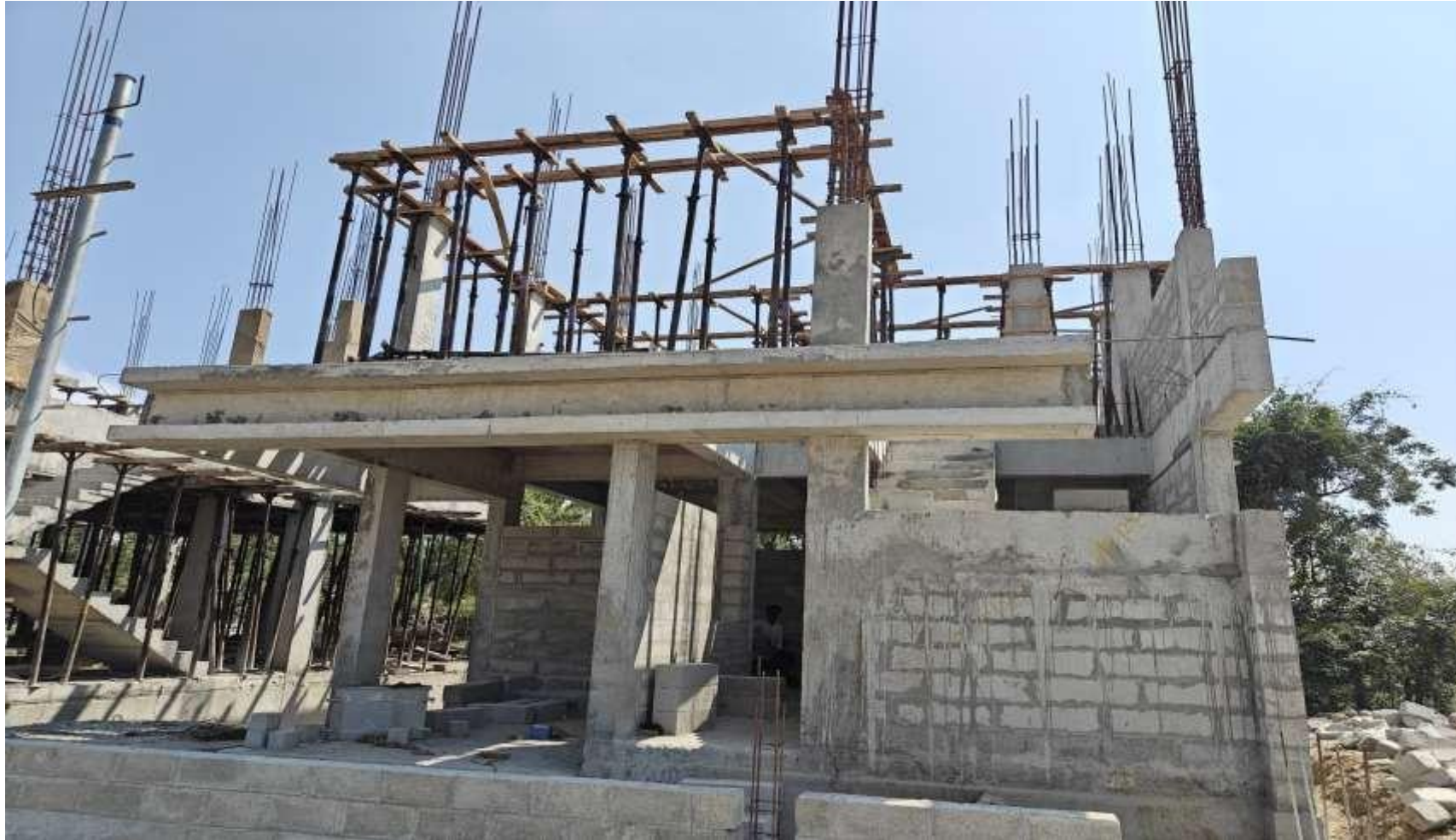
Villa No 11 – FF Roof Beam shuttering Work in progress