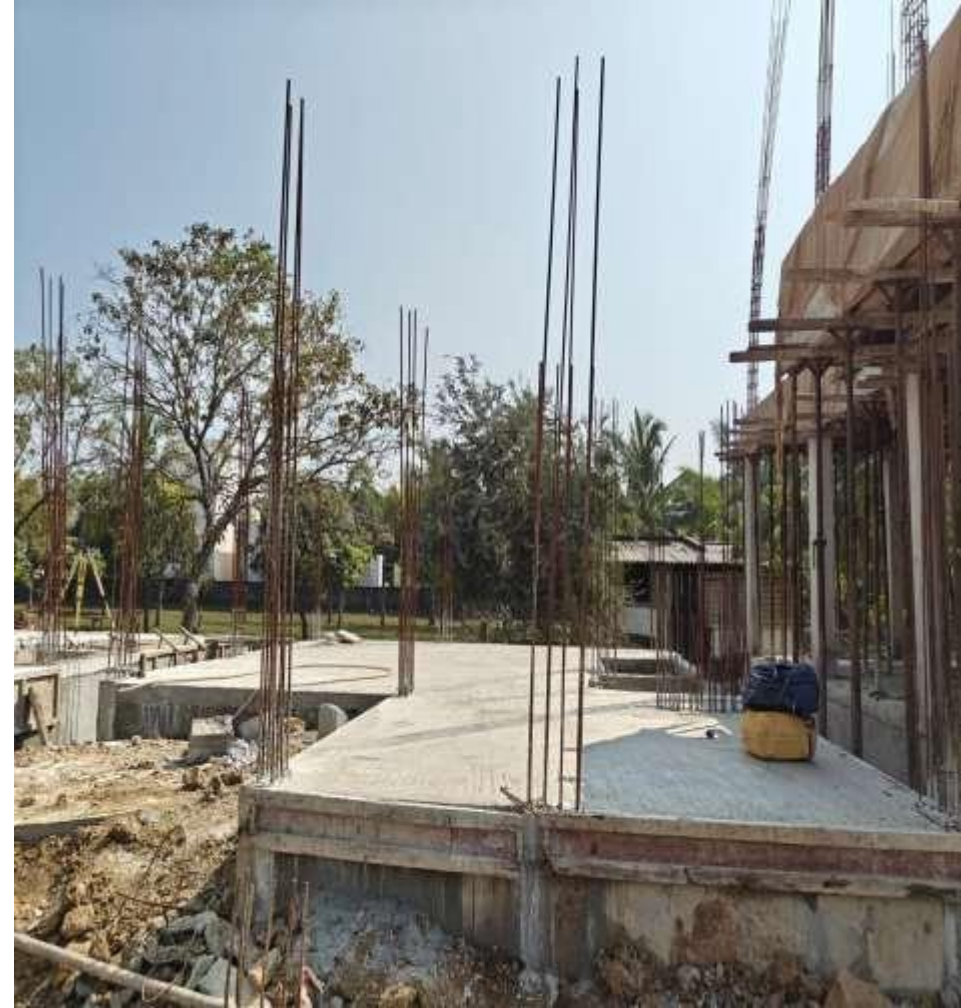
Villa No 7, 8 – GF Flooring PCC Pouring work completed