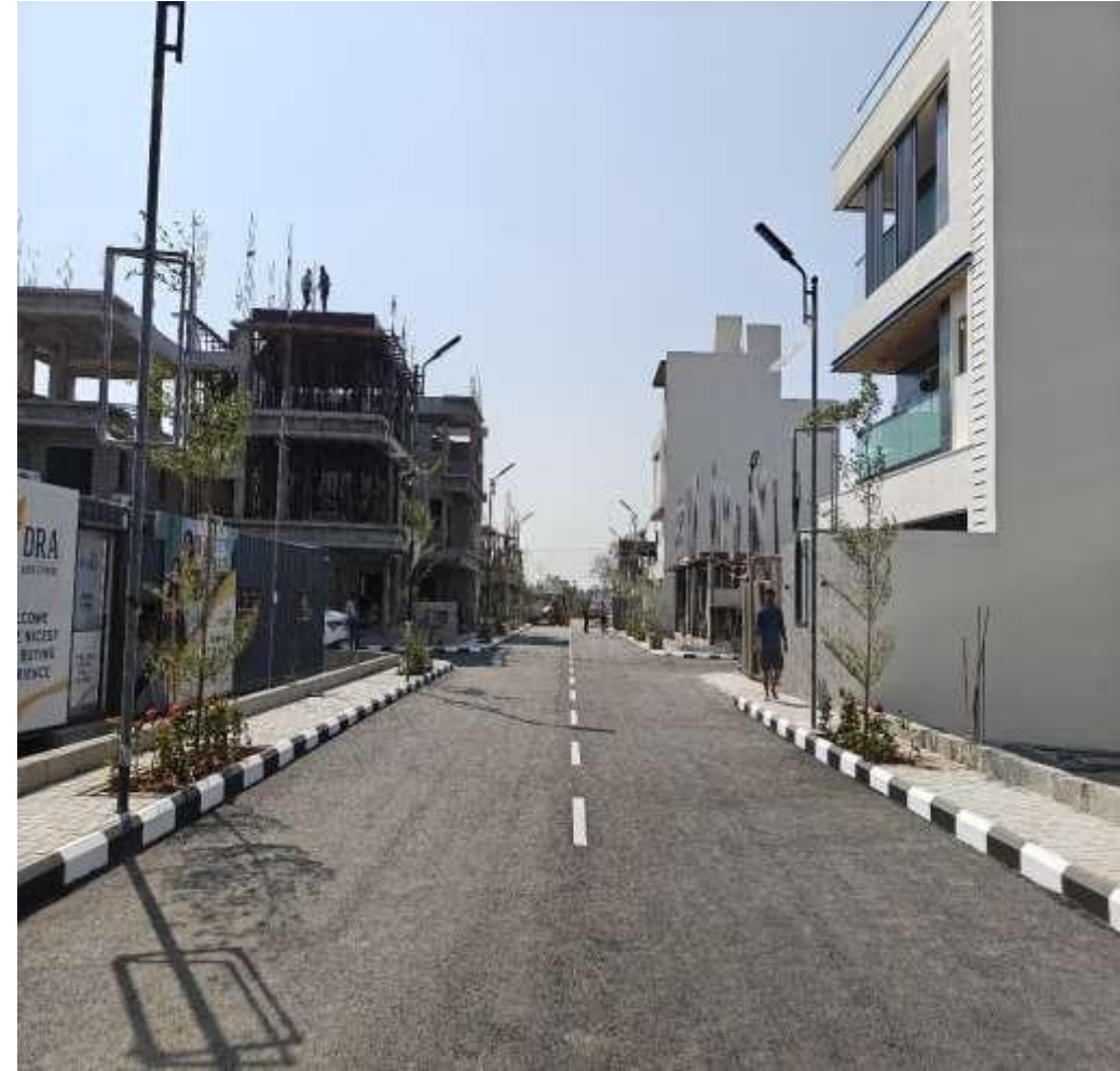
Internal Road DBM course Laying work completed