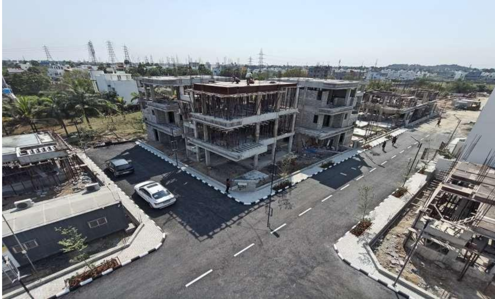
Internal Road Top view