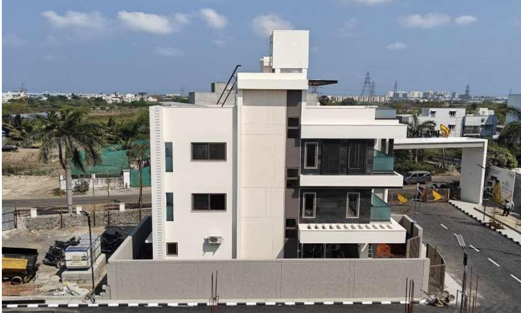
Villa no 20 – West Side Elevation