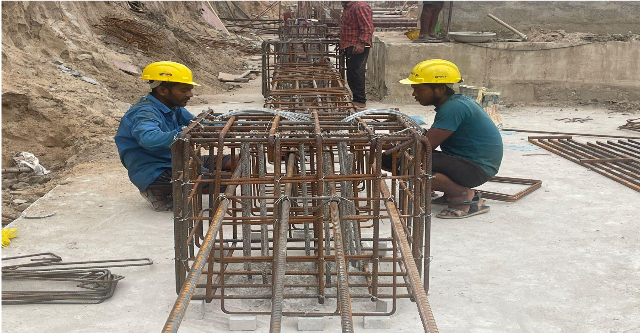
Basement P-02 Pile cap & beam reinforcement work in progress.