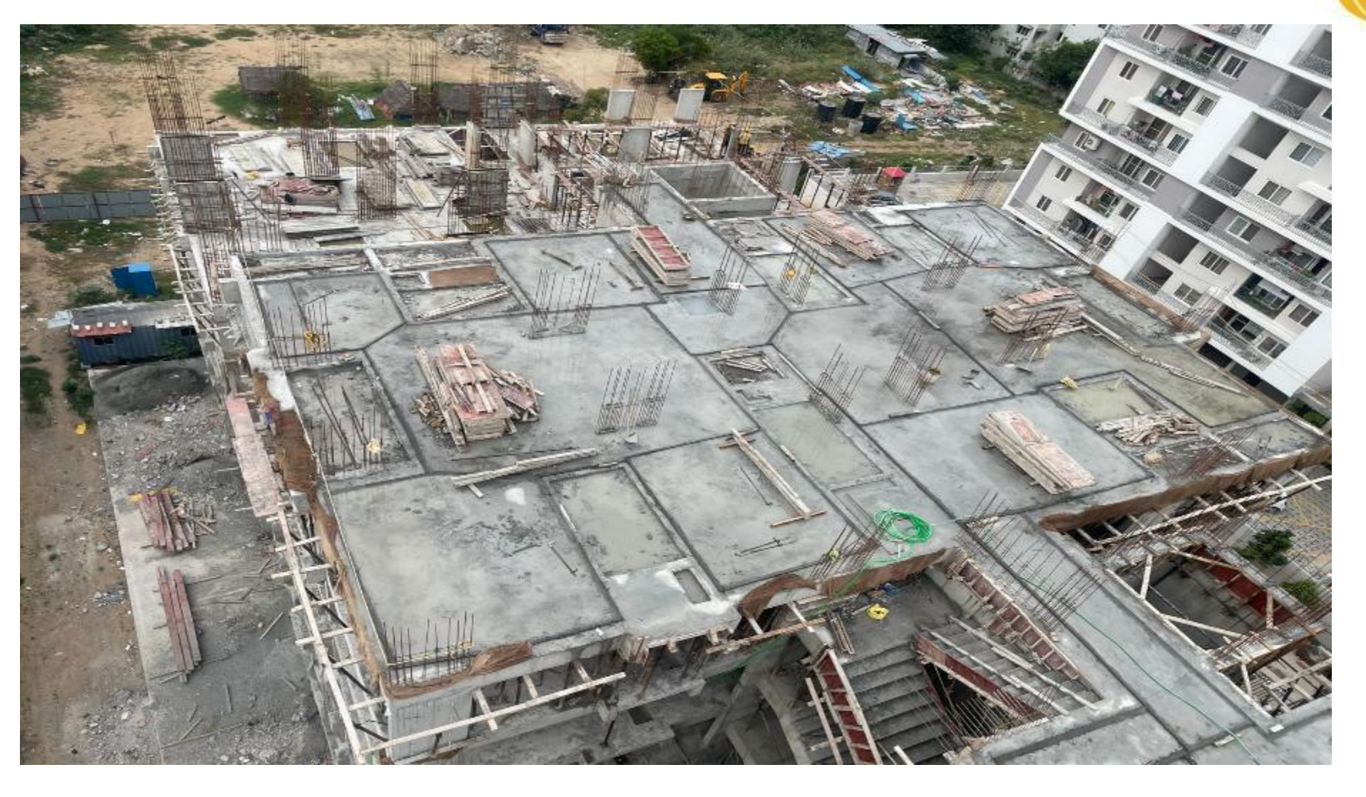
North Side View