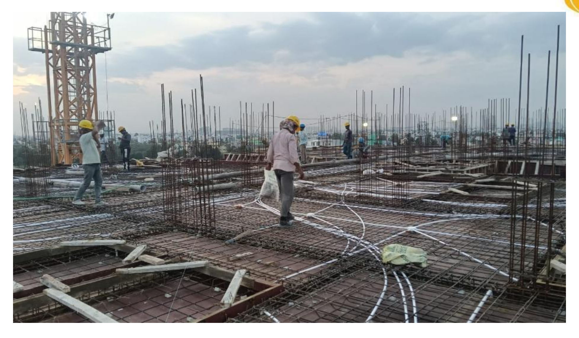
Pour 1-6^{th} Floor roof reinforcement work completed.