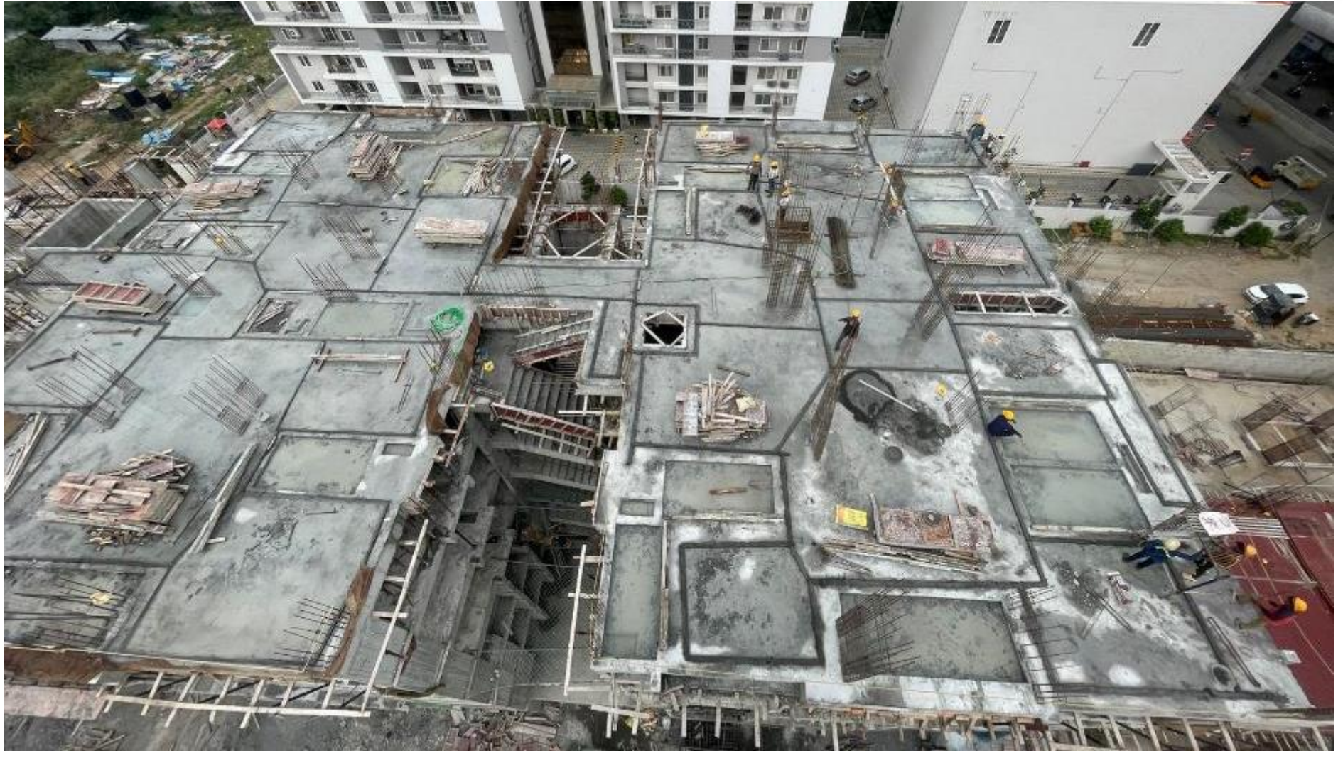
East Side View.