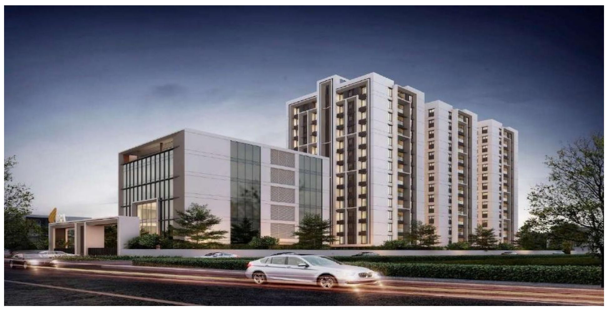
DRA INFINIQUE CONSTRUCTION UPDATES JUNE-25