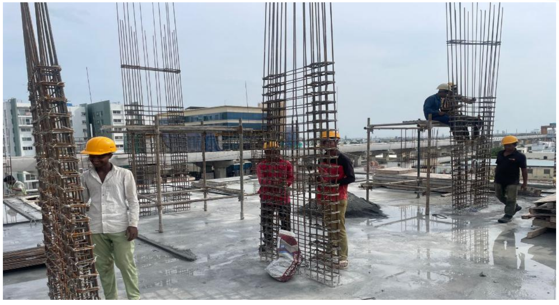
Pour 1-7^{th} Floor column reinforcement work in progress.