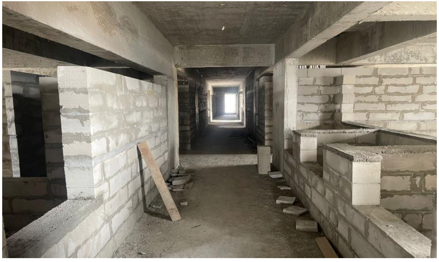
Second floor block work completed – 90% .