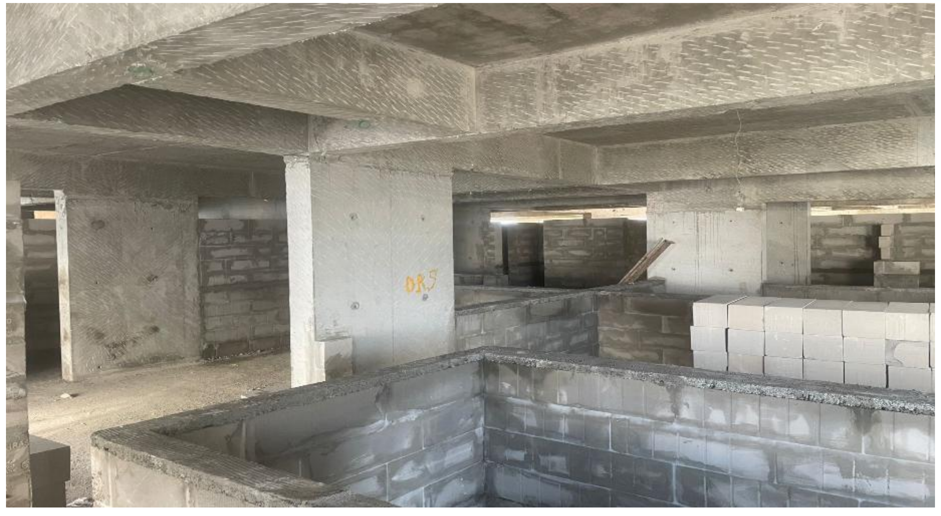
Third floor block work completed -70%.