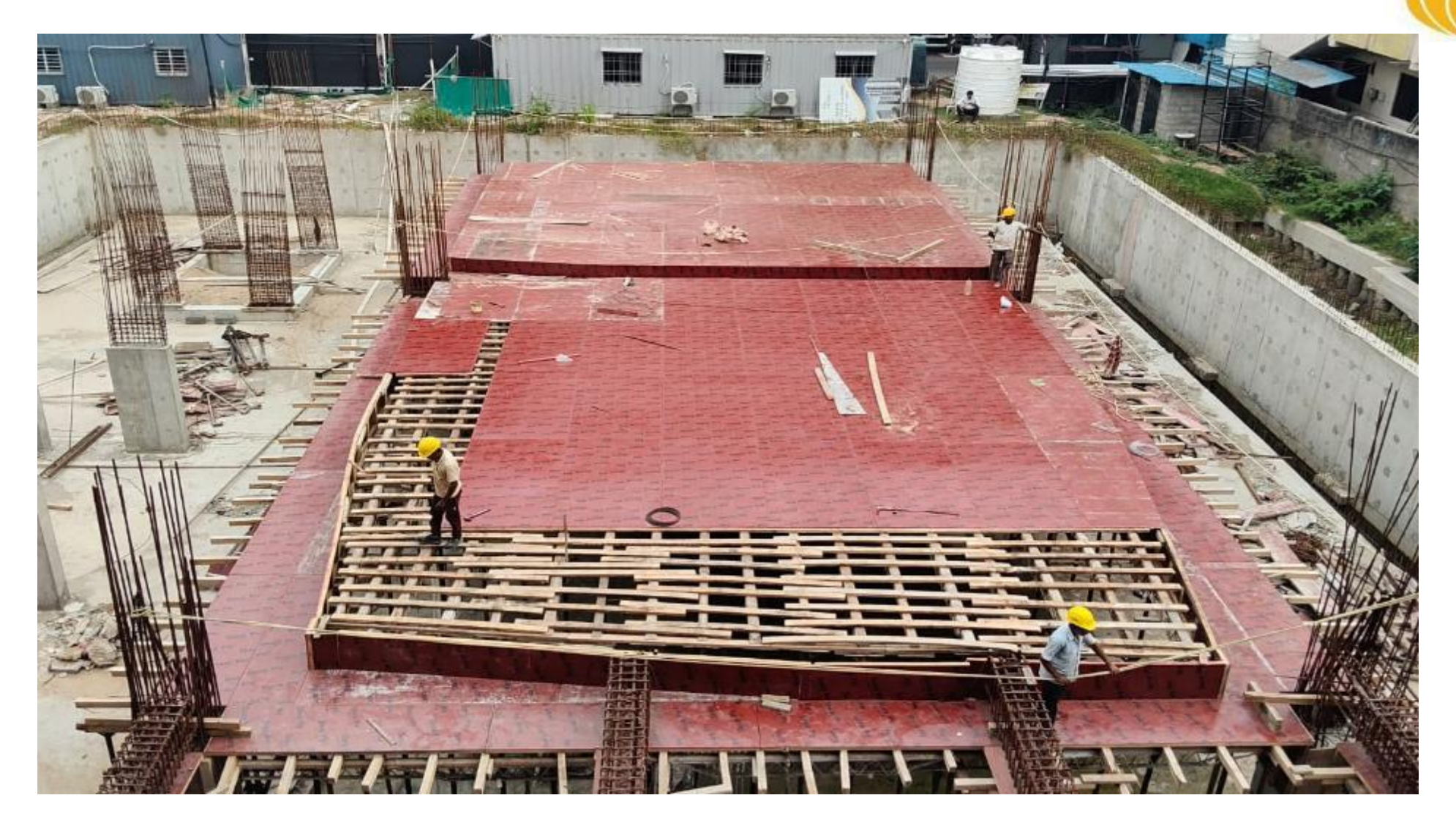
Tower 2 – Commercial basement roof shuttering work in progress.