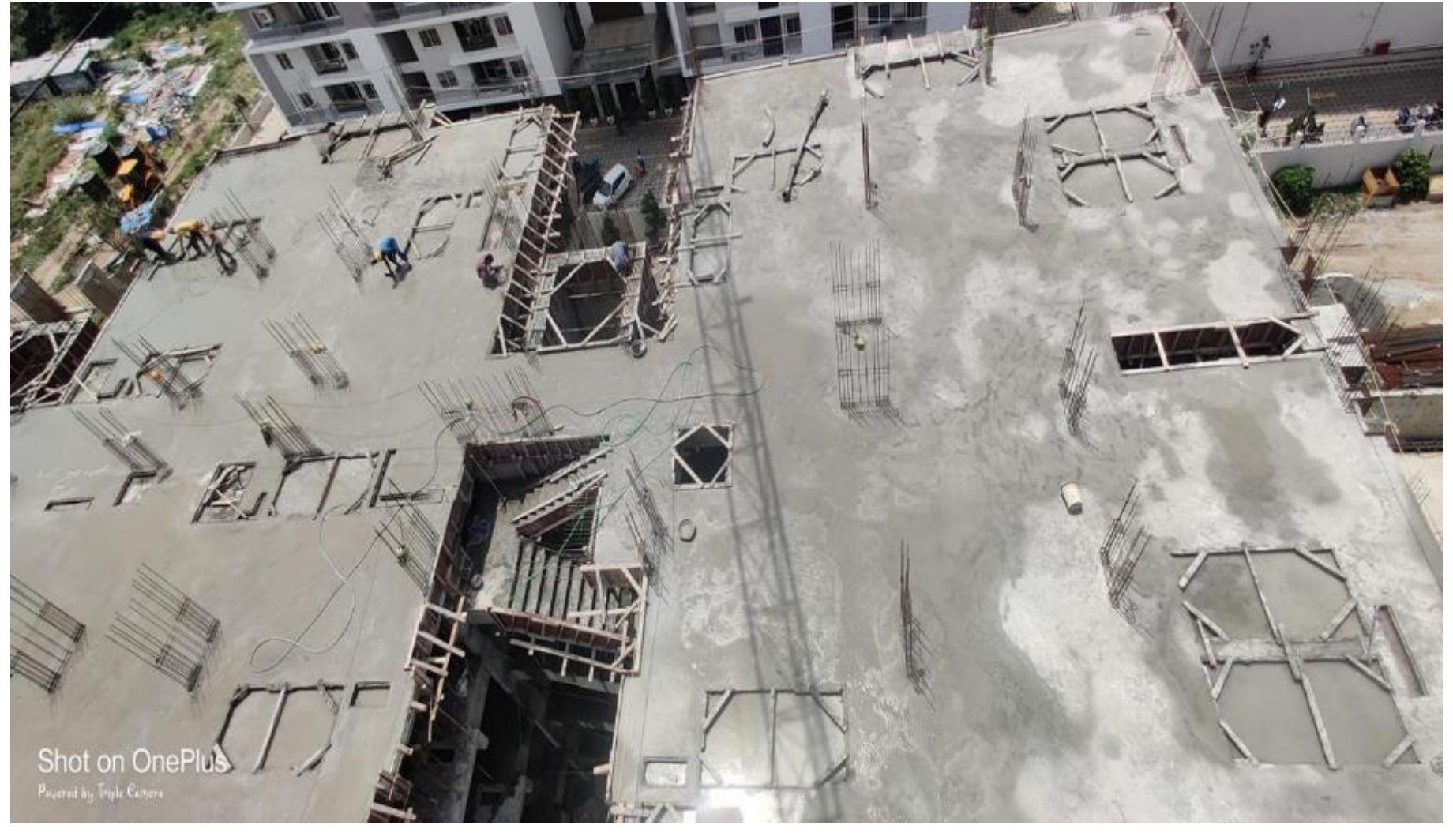
Pour 1-6^{th} Floor roof slab concrete work completed.