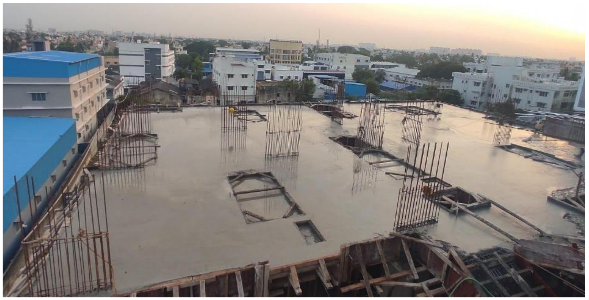
Pour 2-4^{th} floor roof slab concrete work completed.