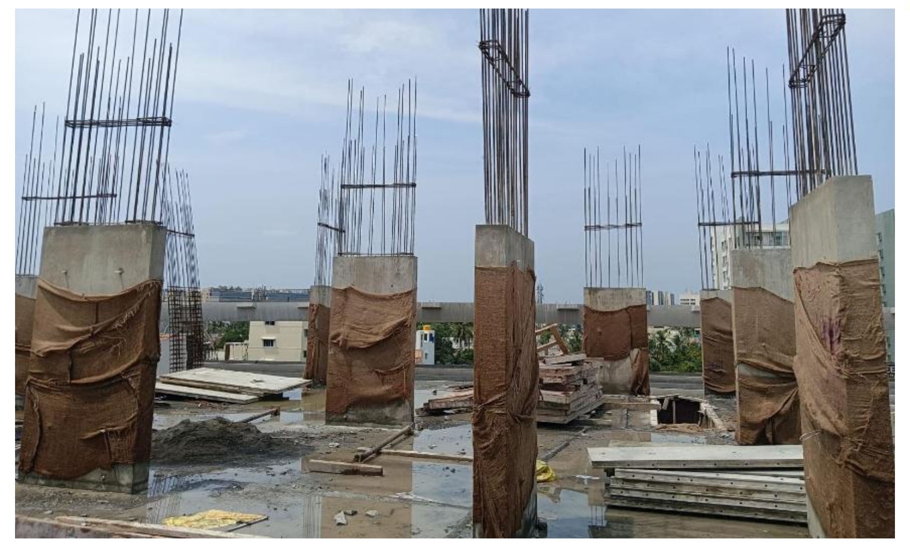
Pour 1-6^{th} floor column concrete work completed