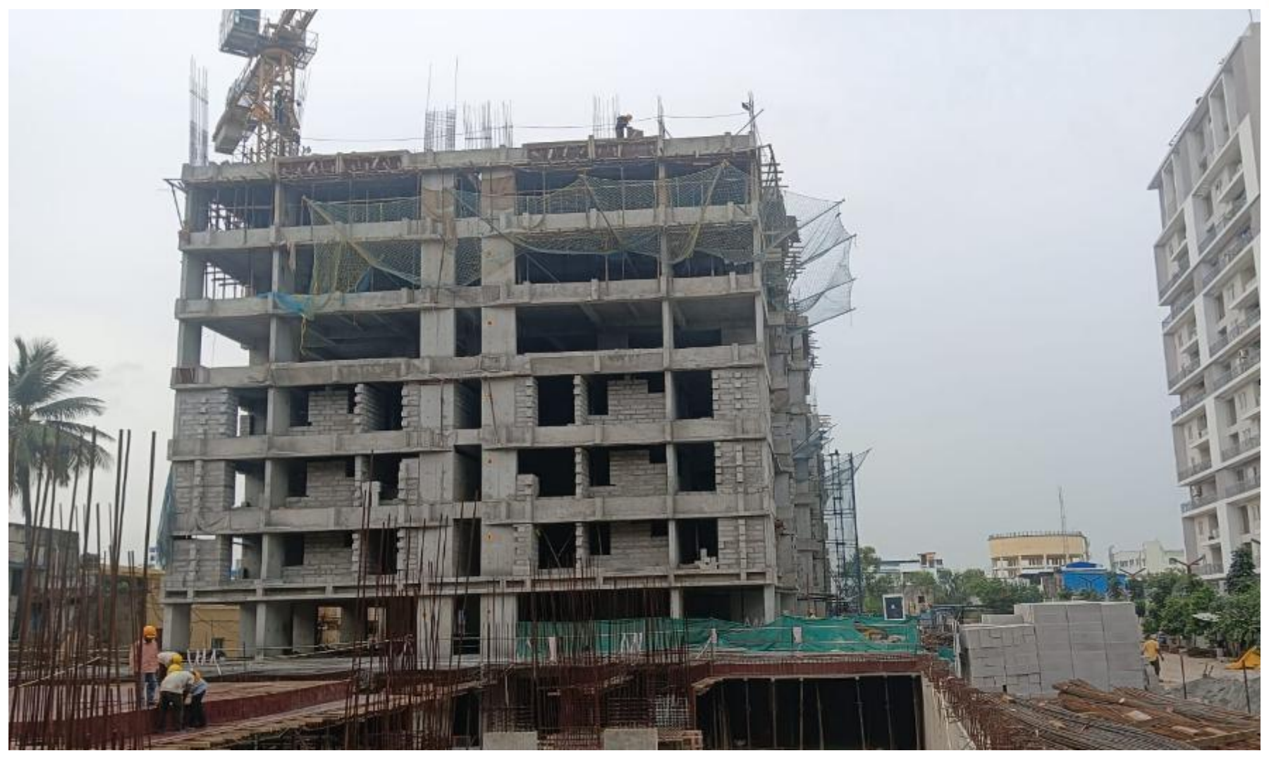
South east corner view.