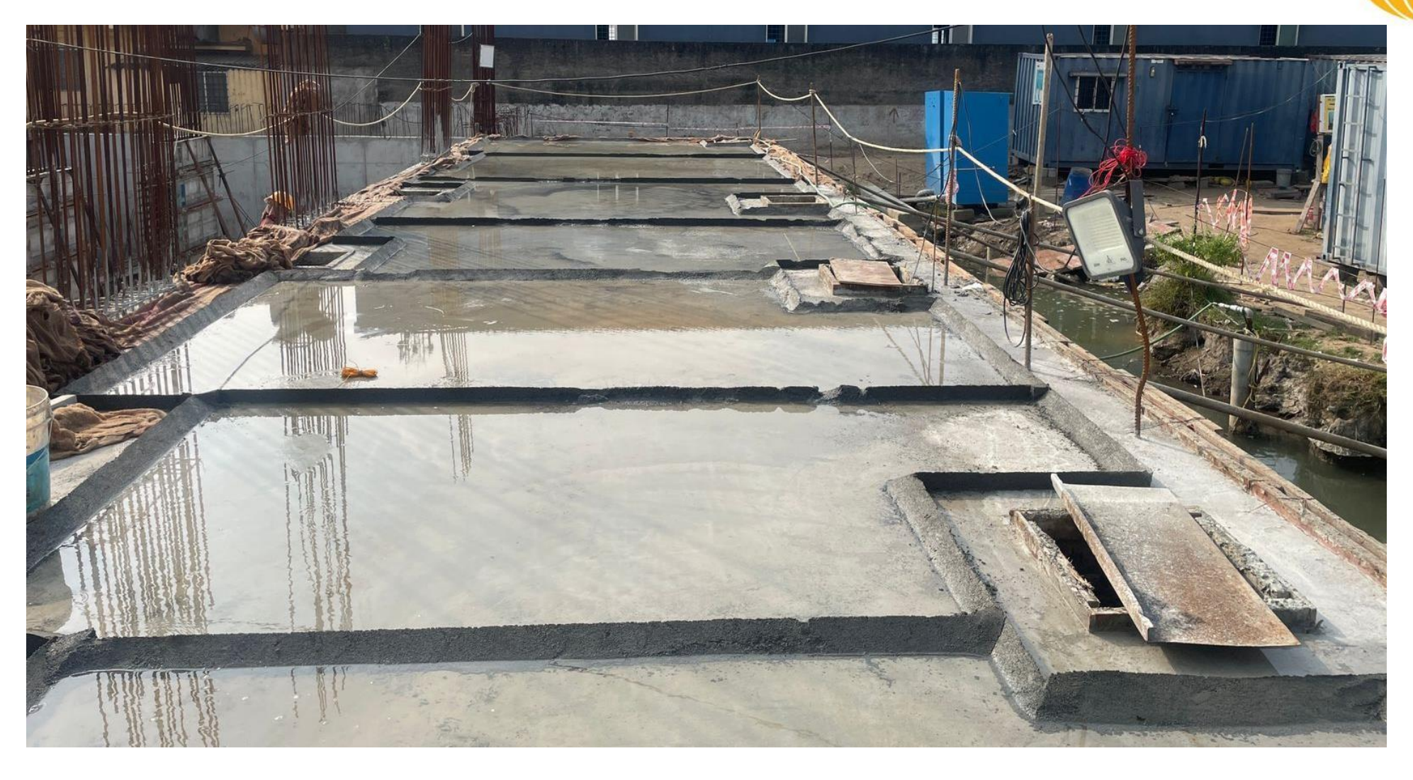
UG sump cover slab curing work in progress.