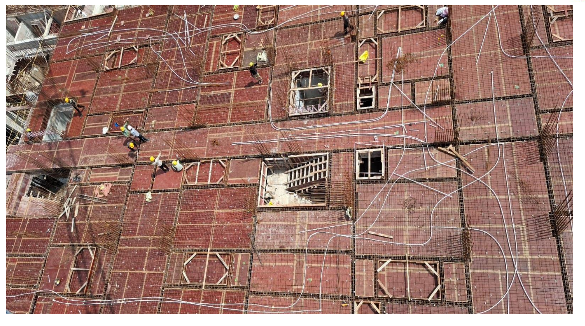
Pour-01 stilt floor roof electrical conduit pipe laying work completed.