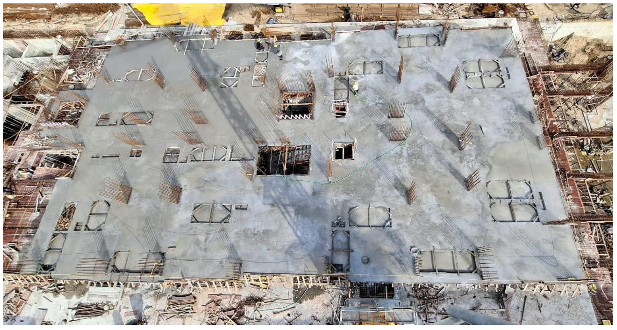
Pour-2 stilt floor roof slab concrete work completed.