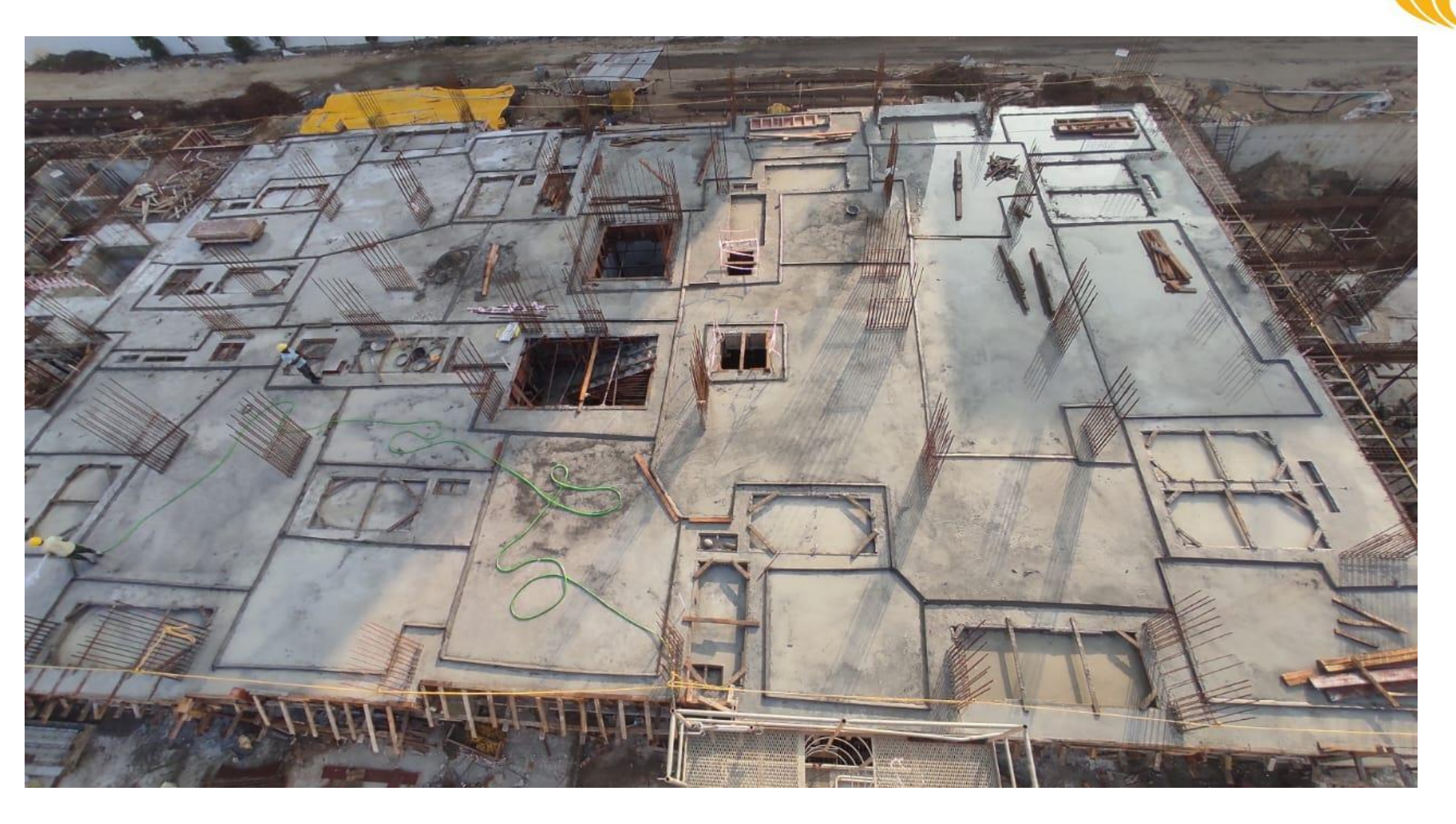
East Side View.