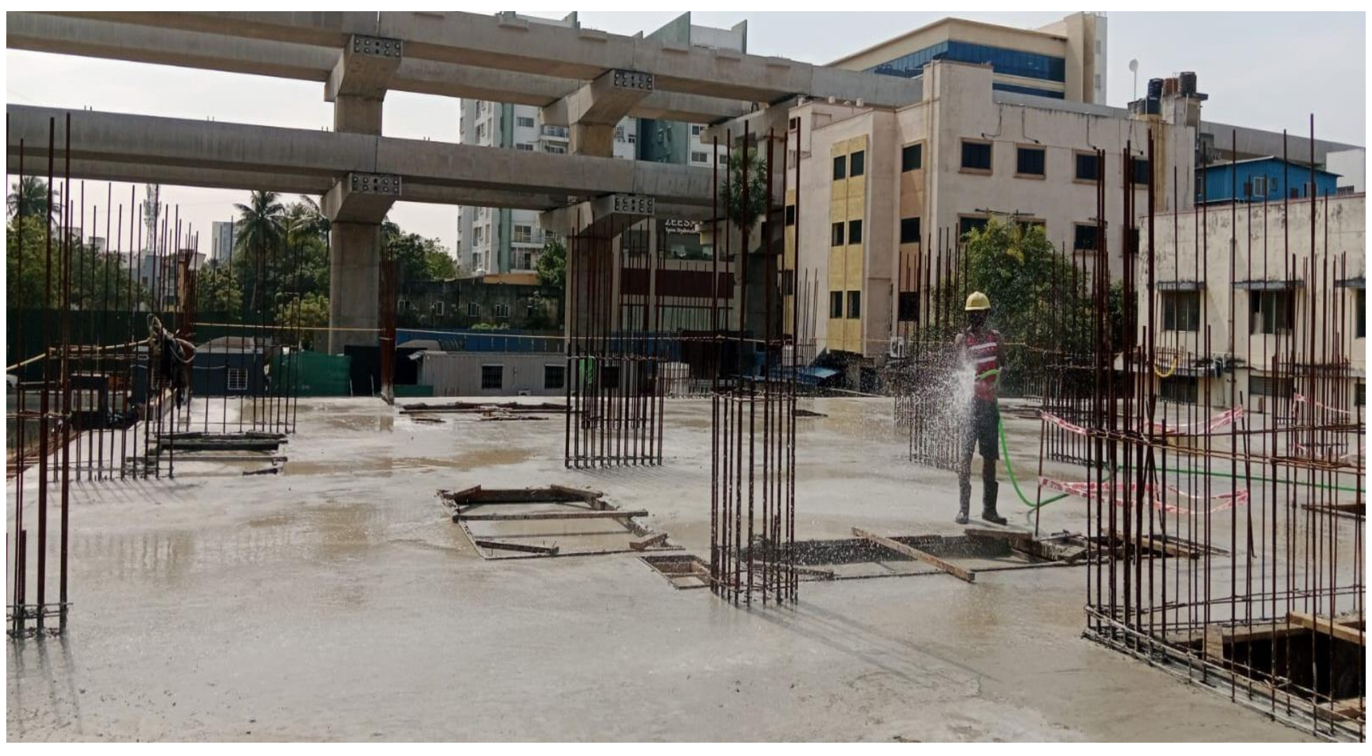
Stilt floor Pour-01 roof slab initial curing work completed.