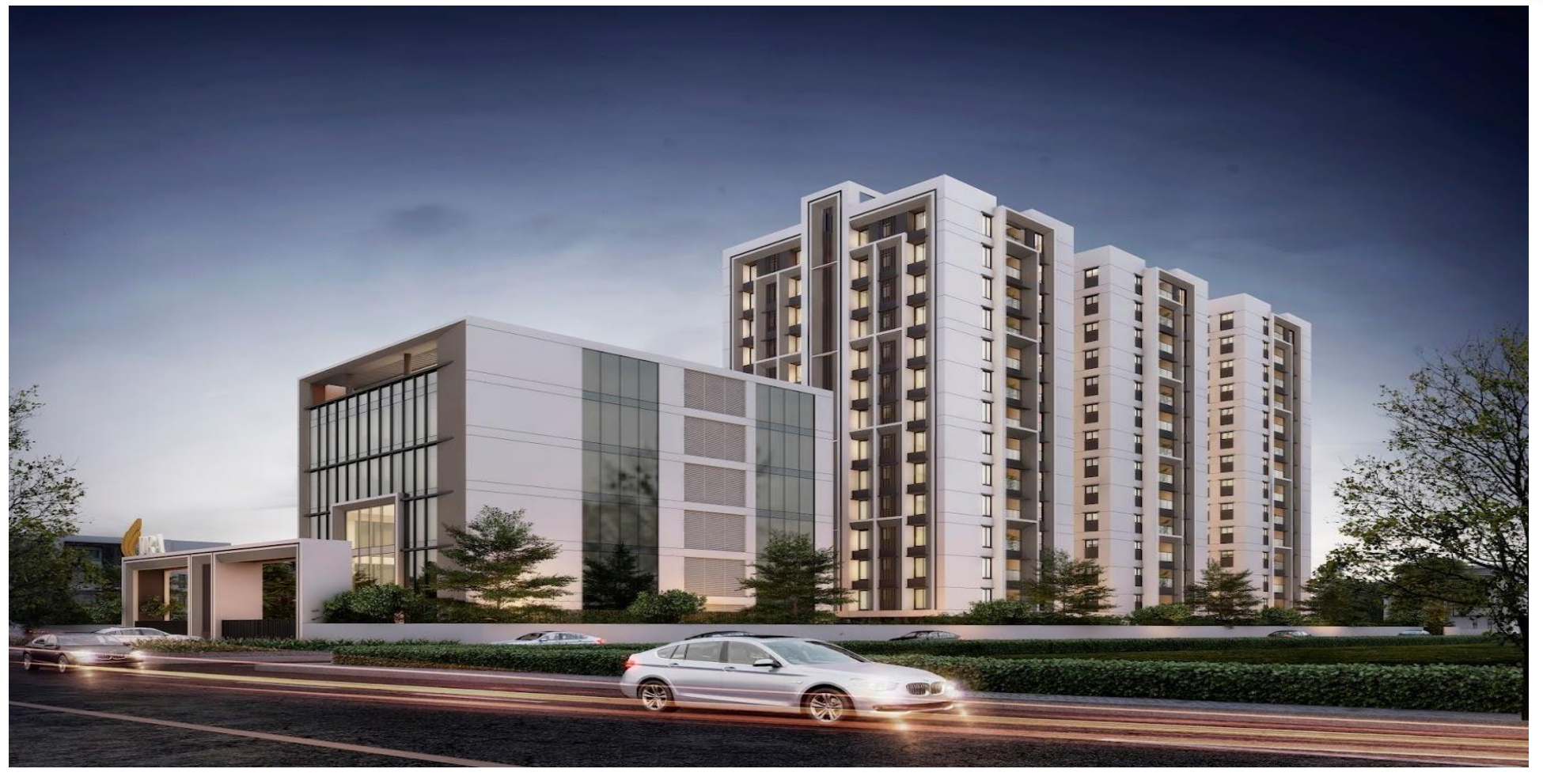
DRA INFINIQUE CONSTRUCTION UPDATES JANUARY-25