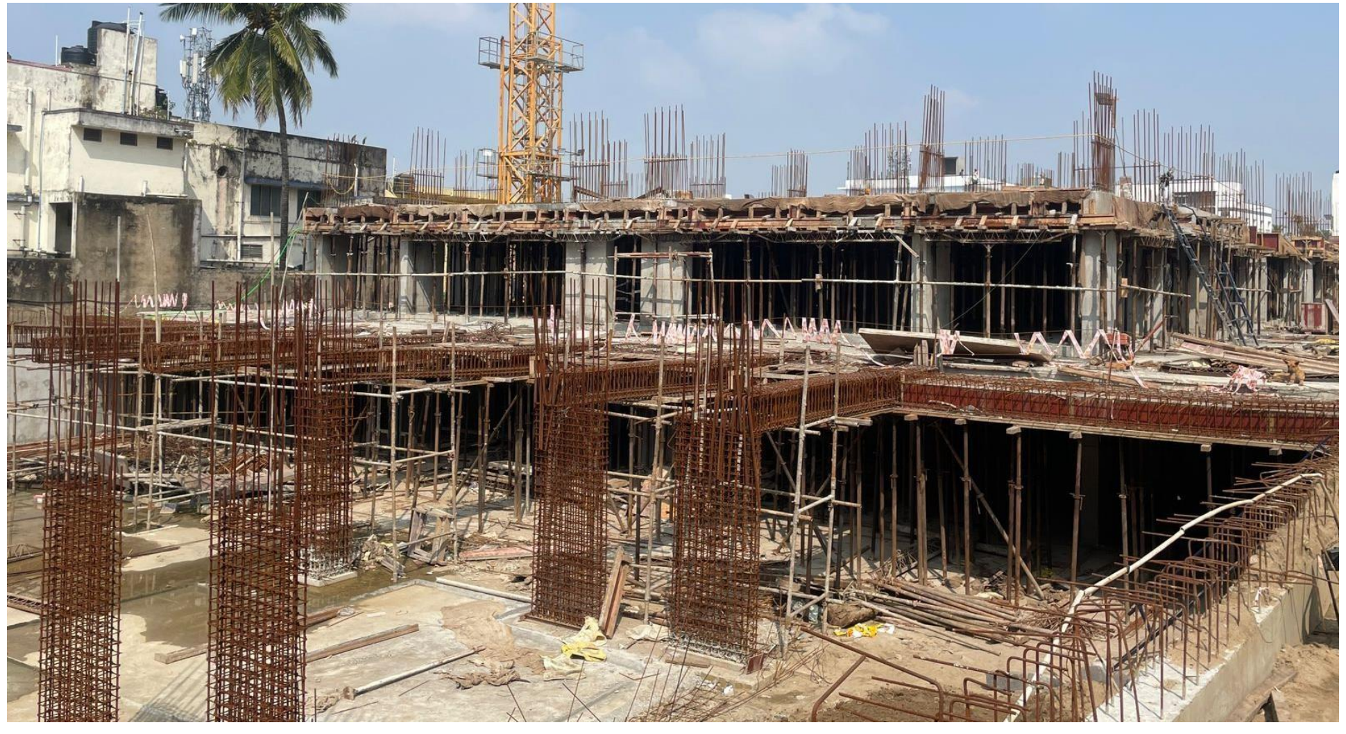
North east corner view.