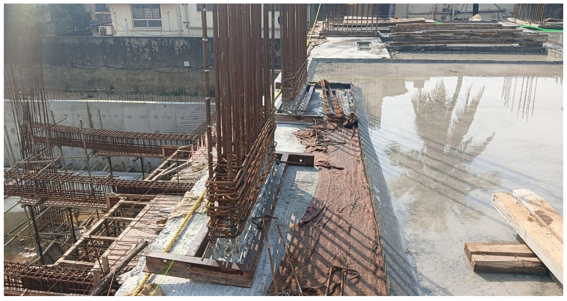
Pour-3 first floor column starter fixing work in progress.