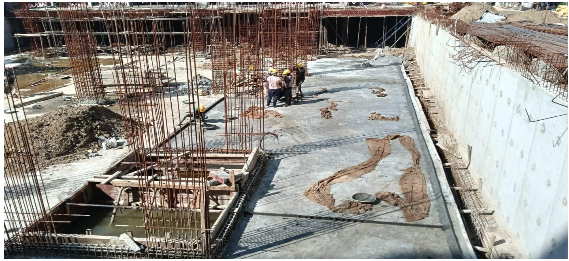
T-2 Pour-03 commercial area grade concrete work completed.