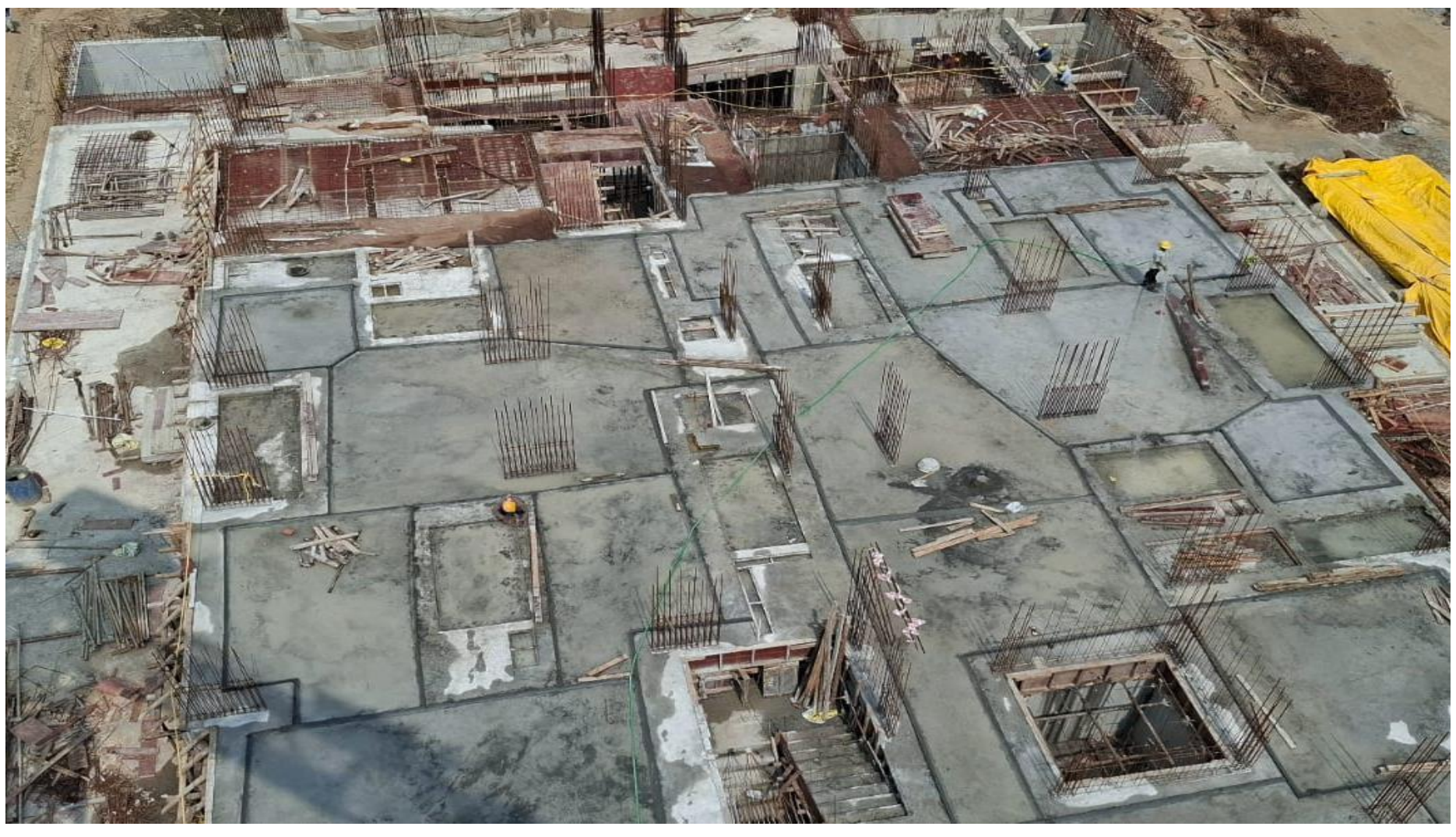
North Side View