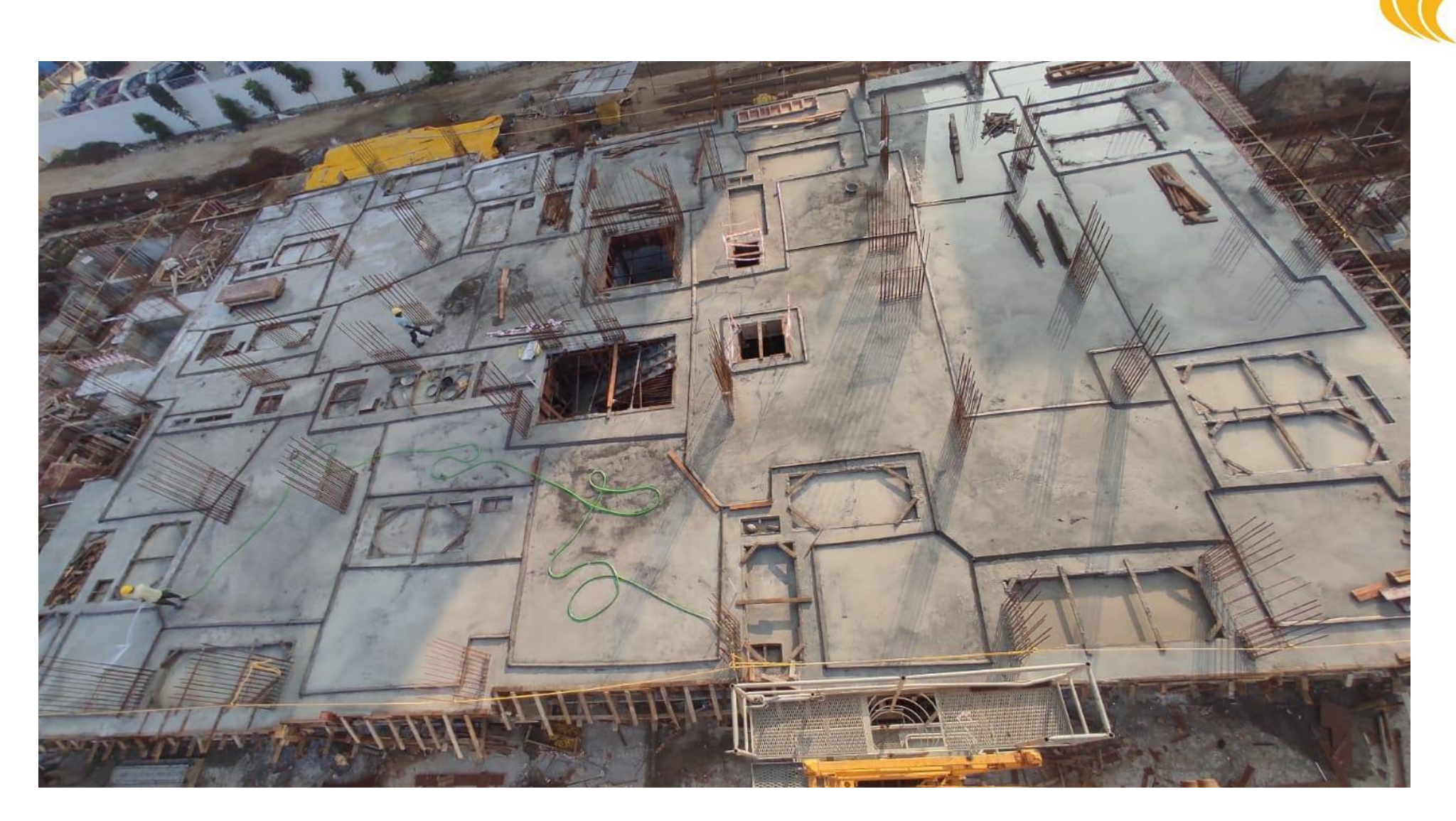
Pour-1 stilt floor roof slab curing work in progress.