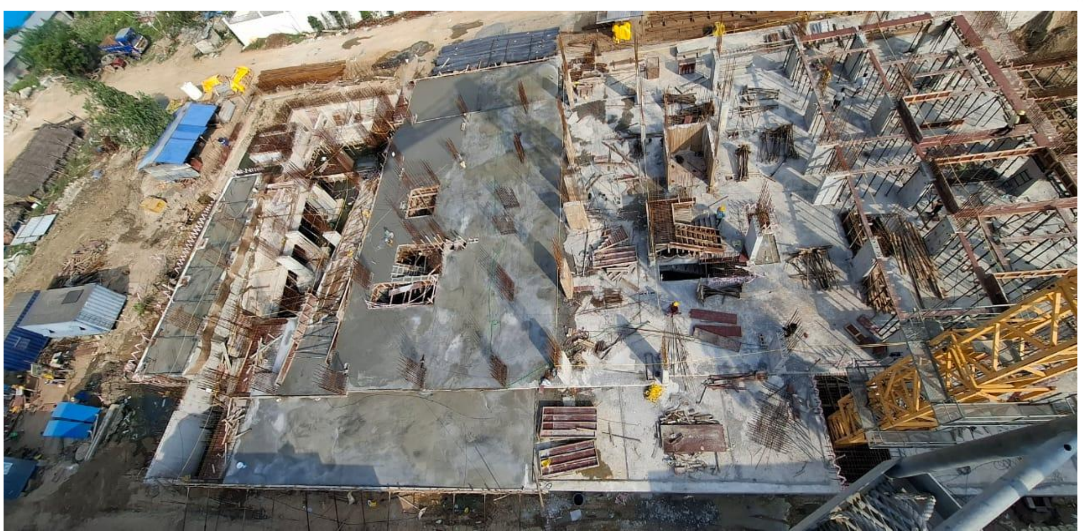
Pour-2 basement roof slab concrete work completed.