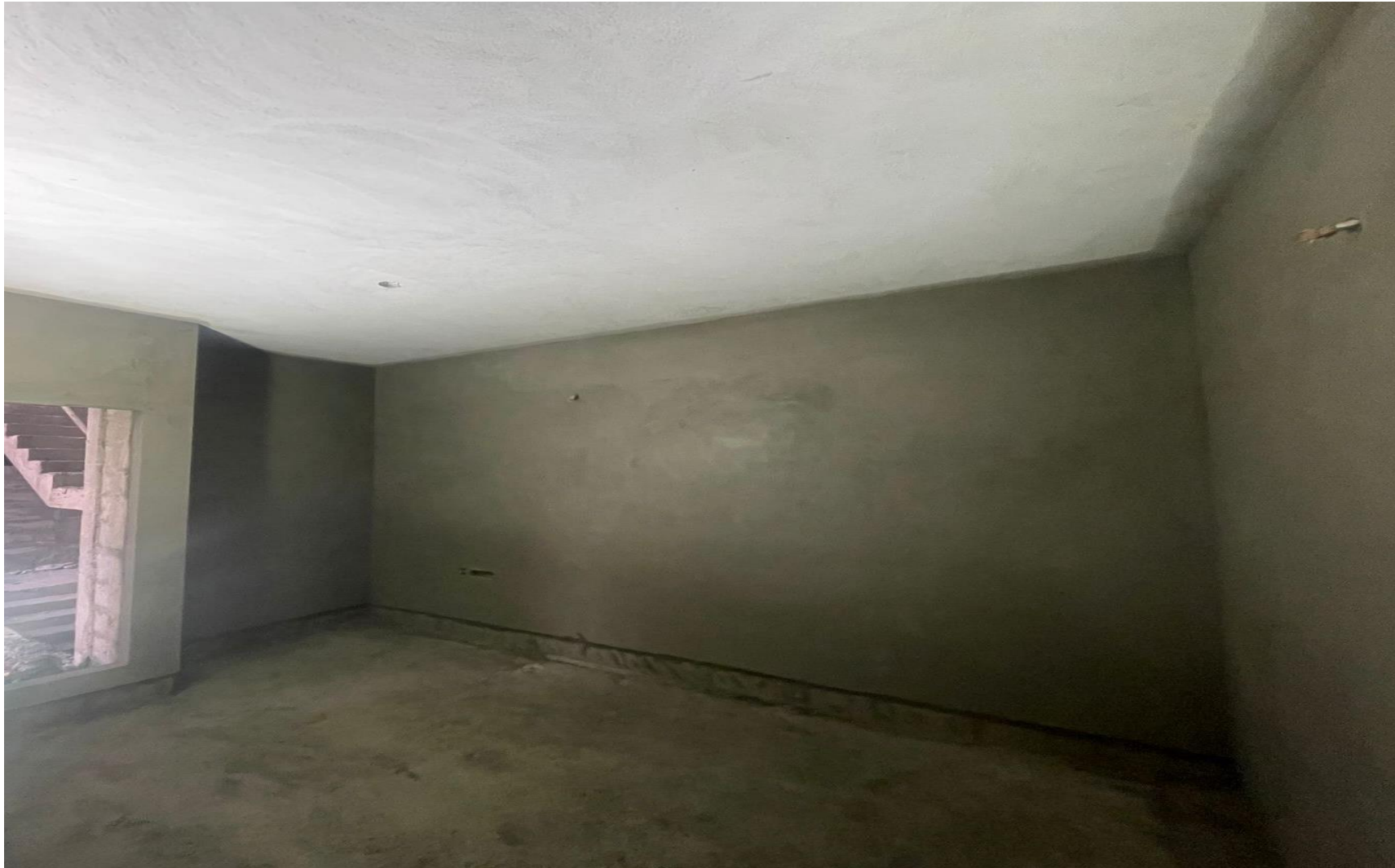
First floor inner wall plastering work completed.