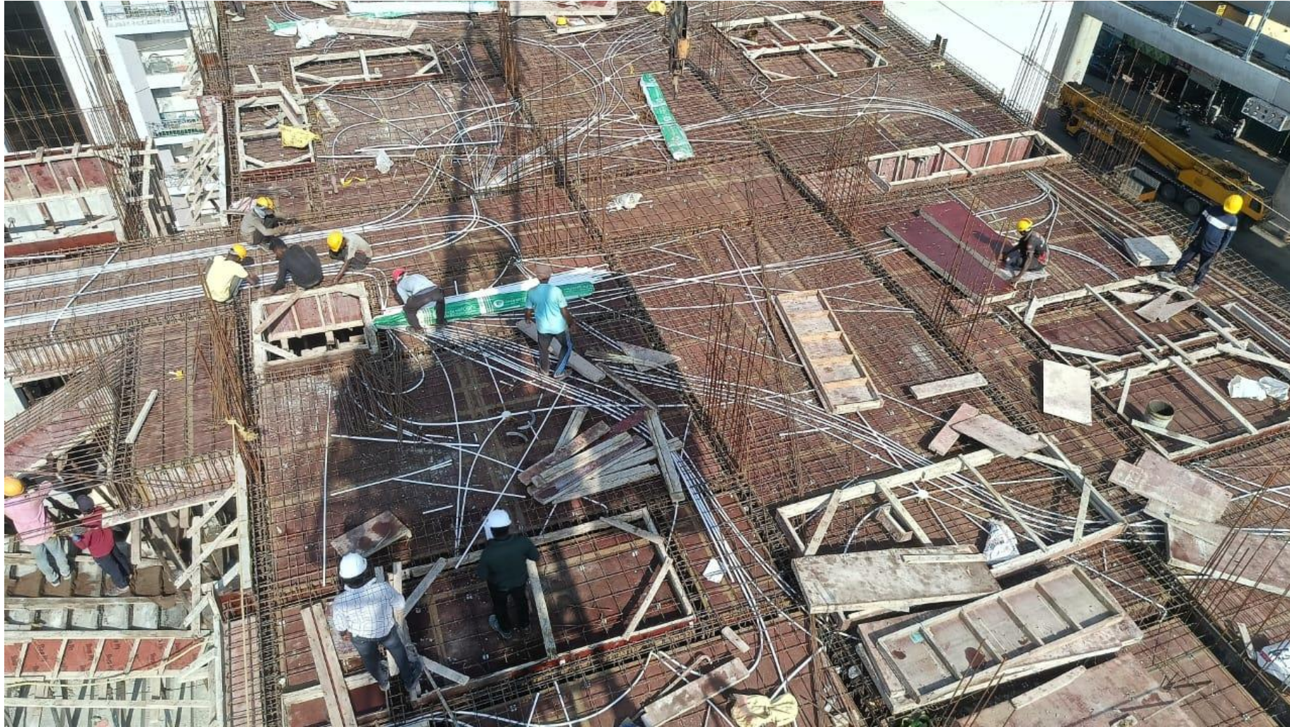
Pour 1 – 9 th Floor roof electrical conduit laying work in progress.