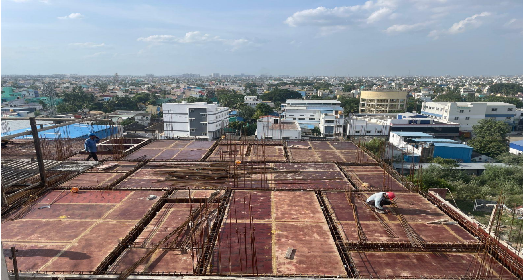
Pour 2 – 7 th Floor roof shuttering work completed.