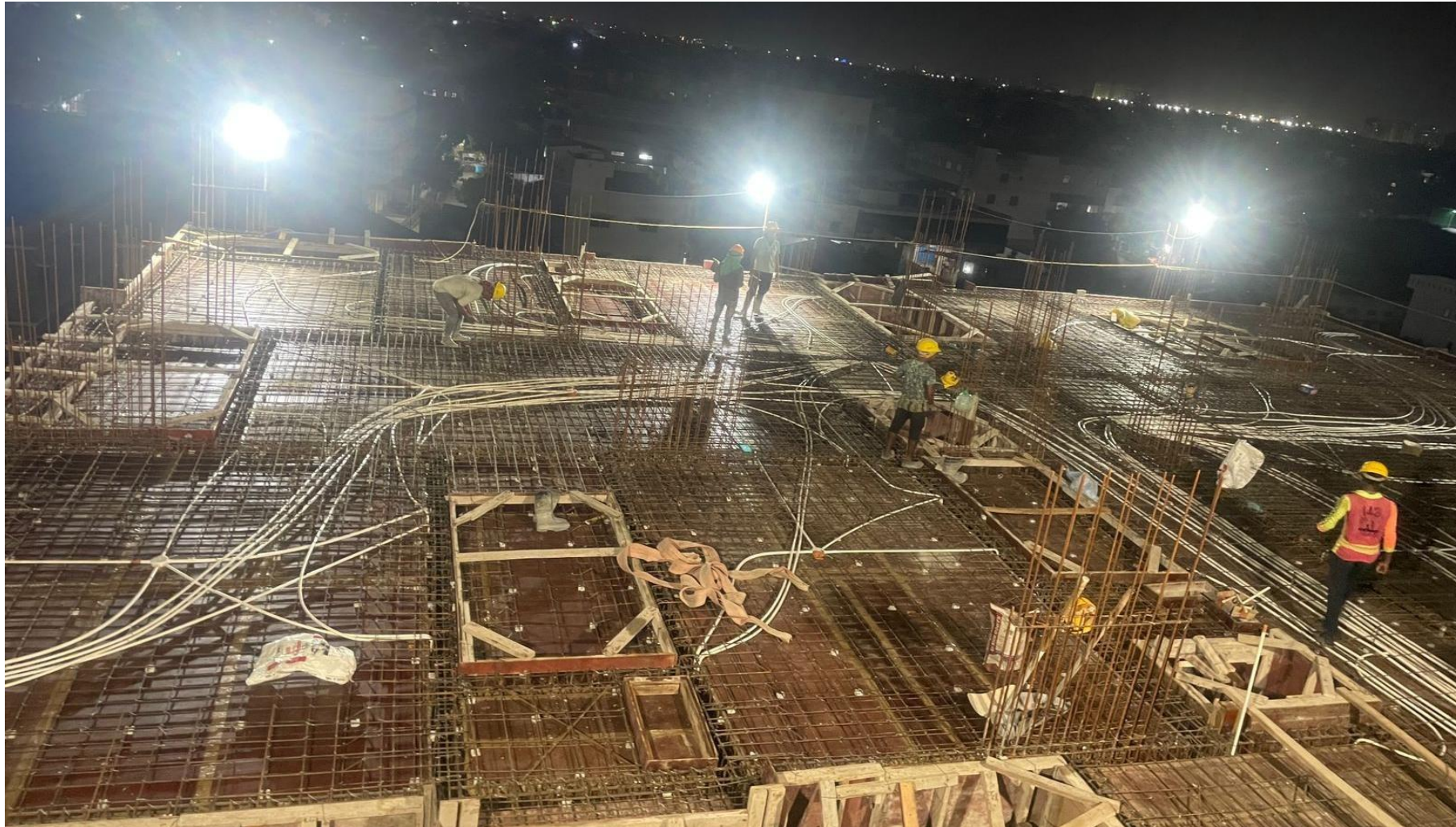
Pour 2 – 6 th Floor roof electrical conduit work completed.