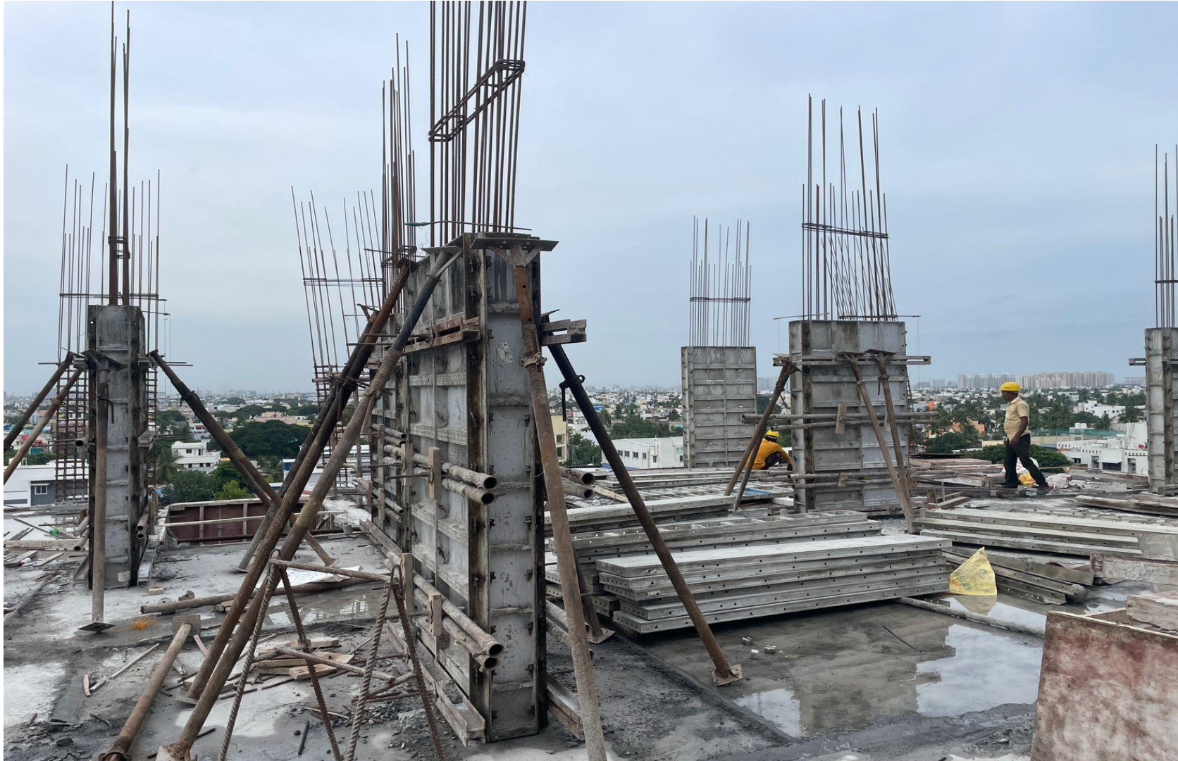
Pour 2 – 8 th Floor column concrete work completed.