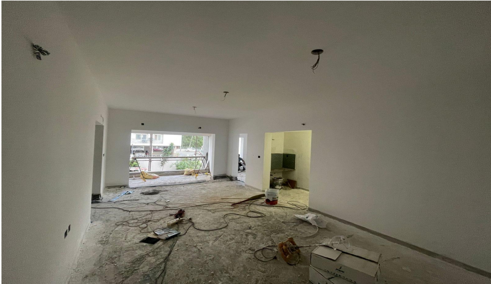
101 Muck up flat final painting work in progress.