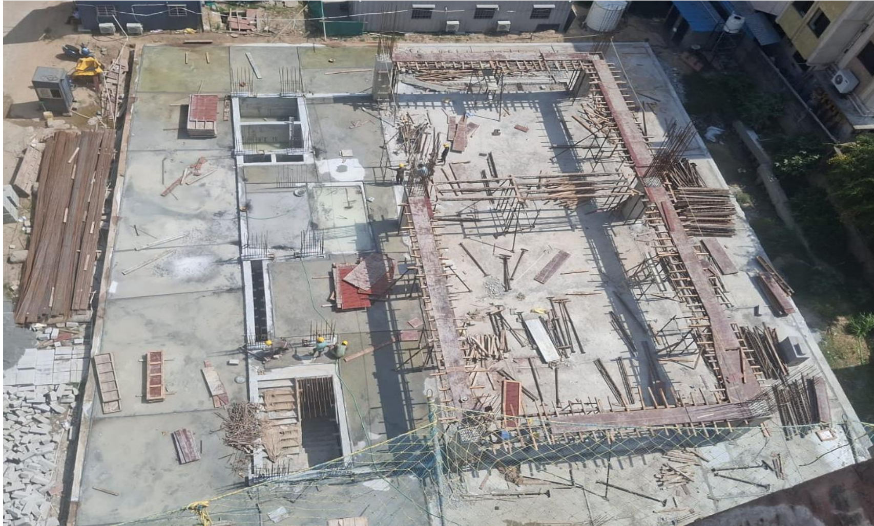
South Side View.