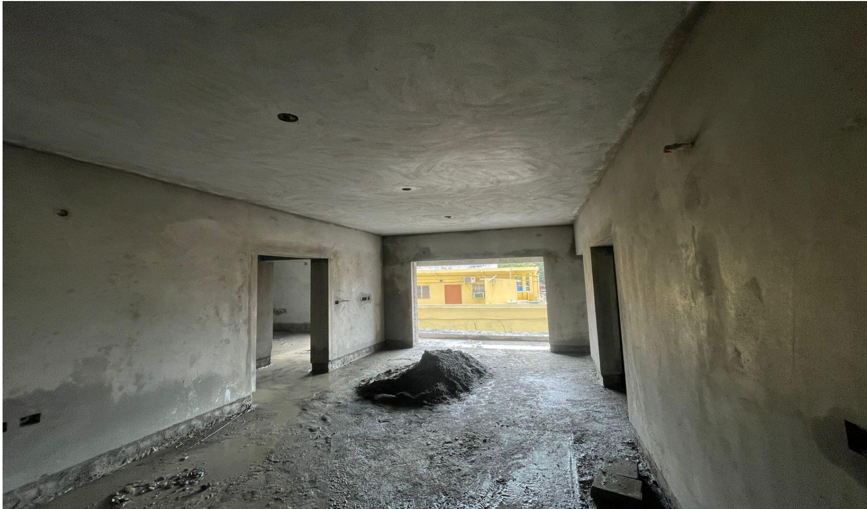
2 nd Floor plastering work in progress.