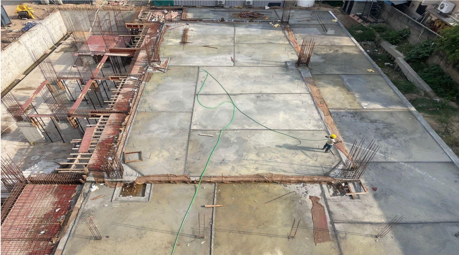
Tower -2 Commercial block basement roof slab curing work completed.