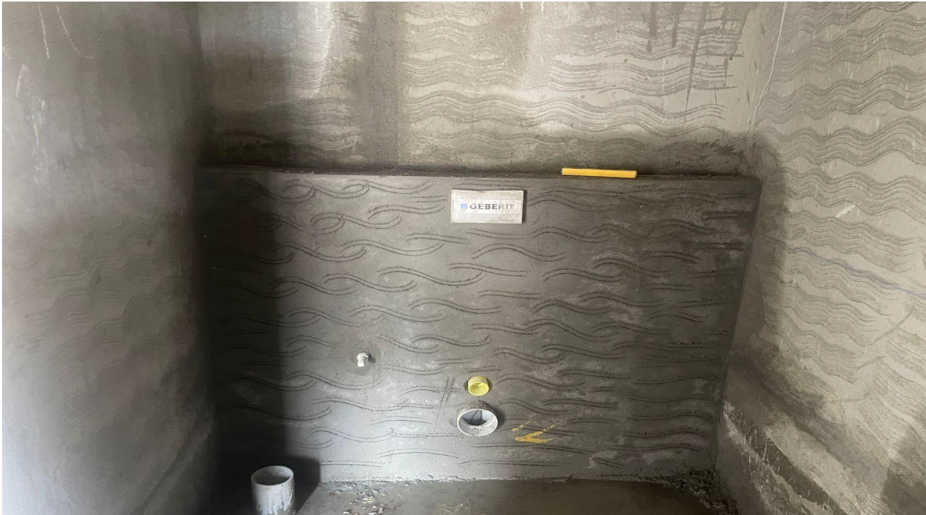
101 Mock up flat toilet ledge wall construction completed.