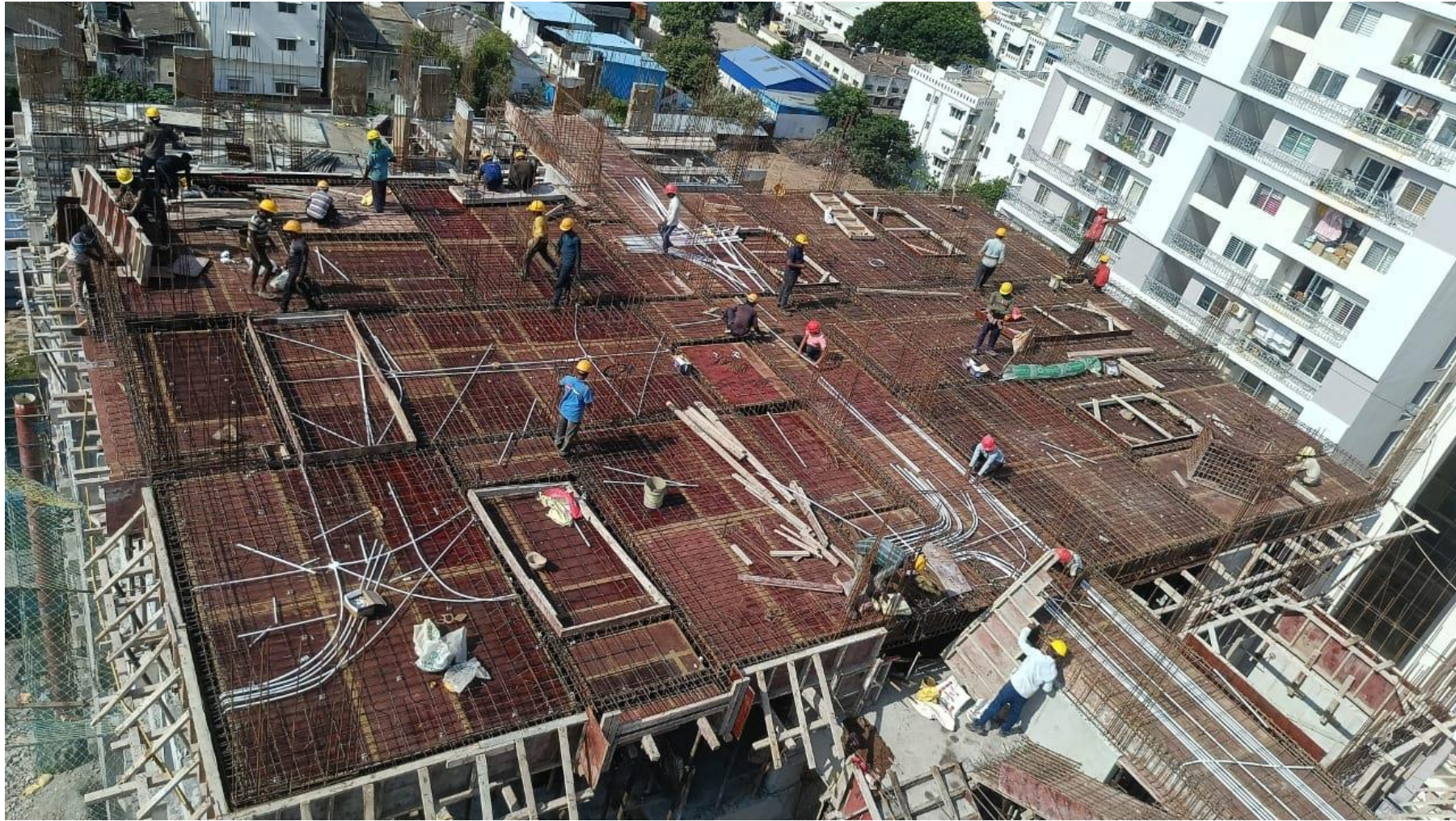
Pour 1 – 9 th Floor roof reinforcement work completed.