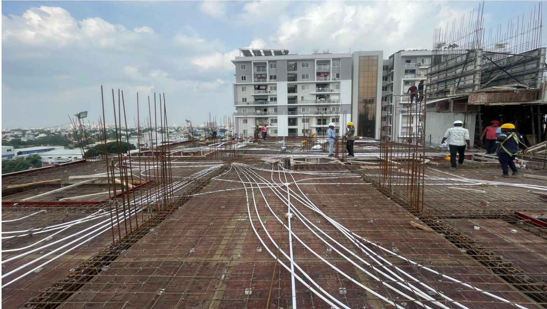
Pour 2 – 7 th Floor roof electrical conduit laying work completed.