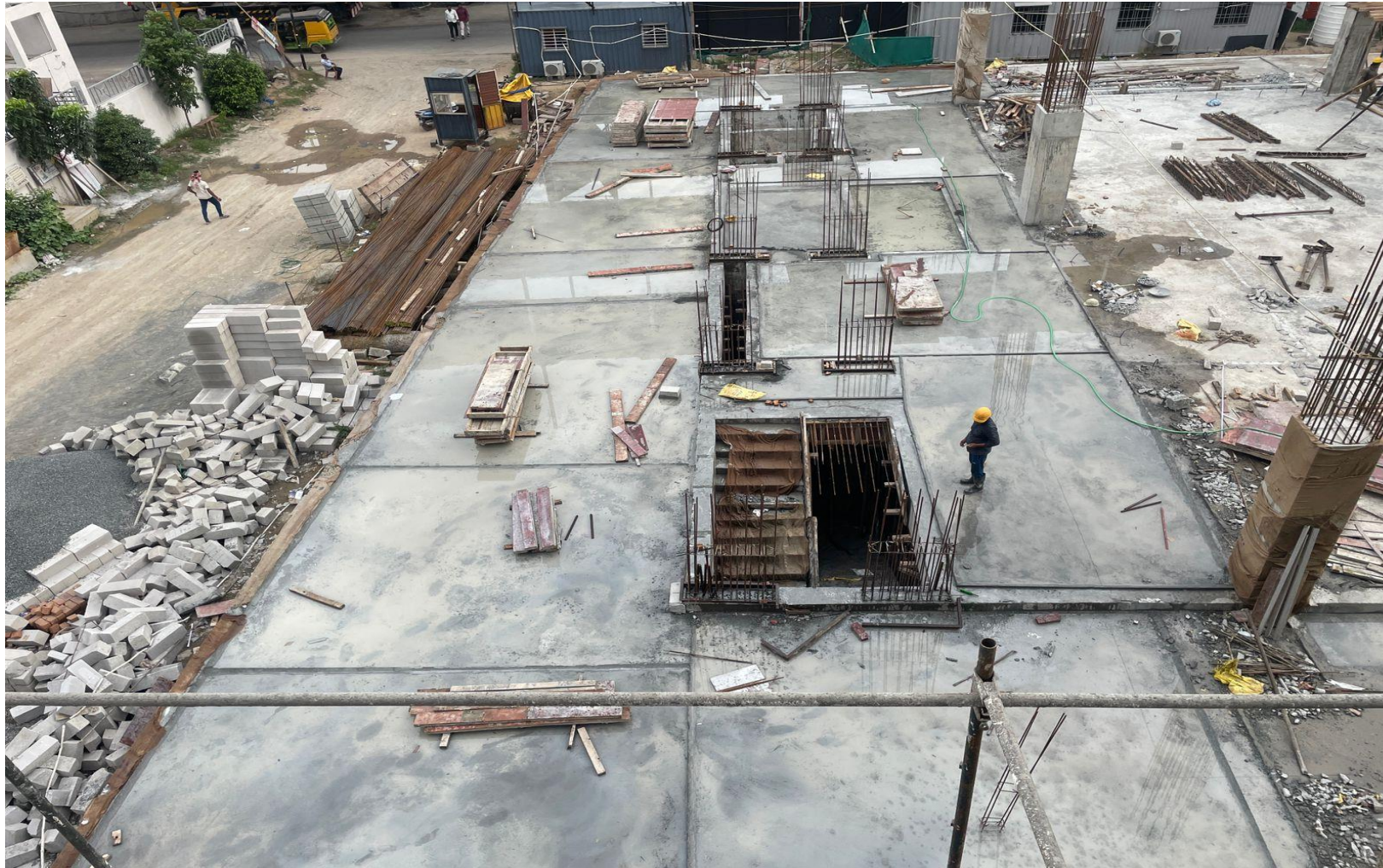
Tower -2 P2 Basement roof curing work in progress .