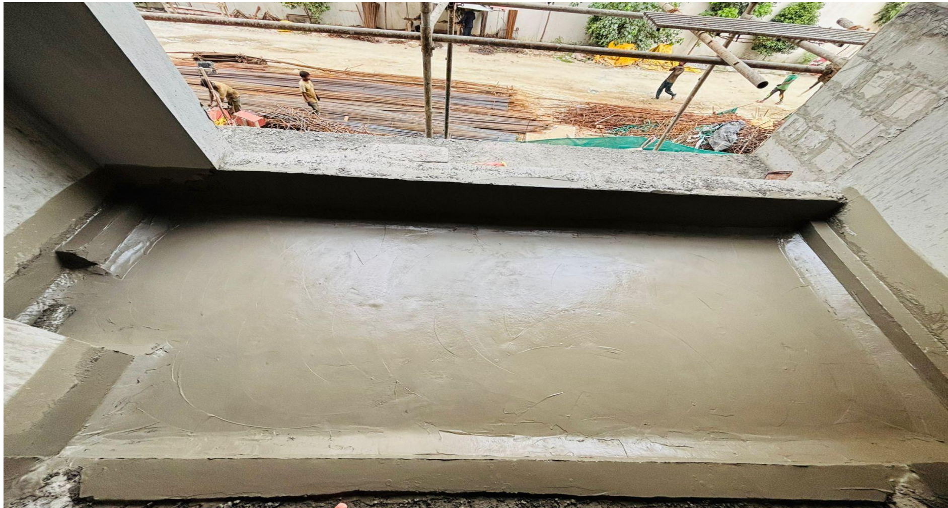
101 Mock up flat waterproofing work completed.