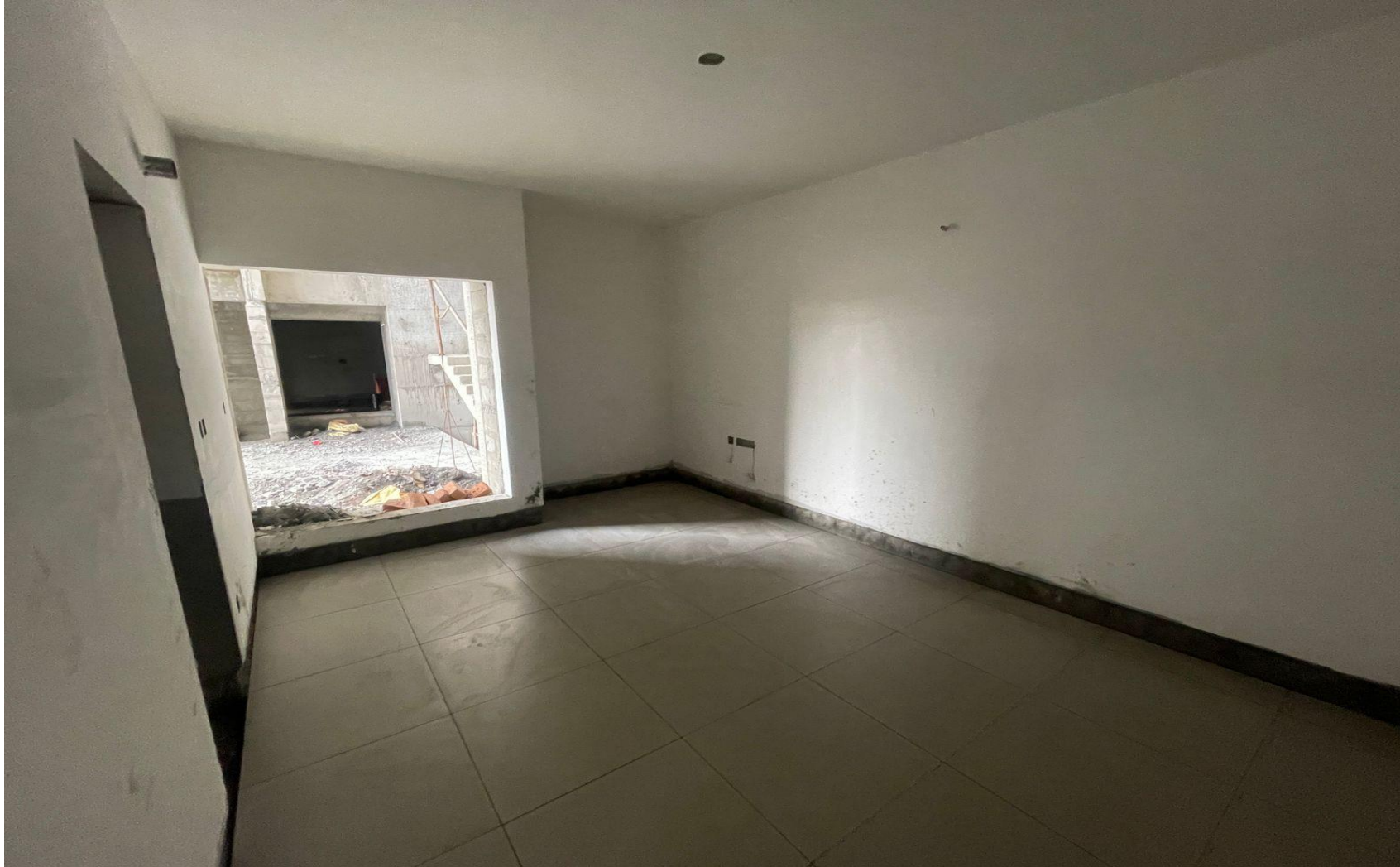
101 Sales Office flat tile laying work in progress.