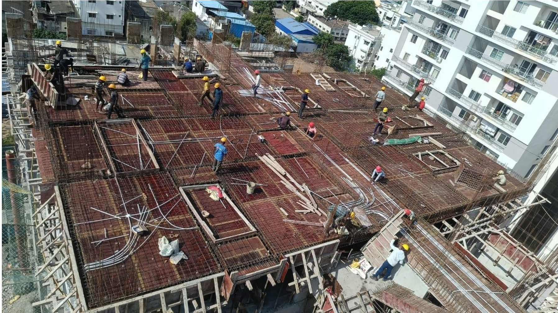
North Side View