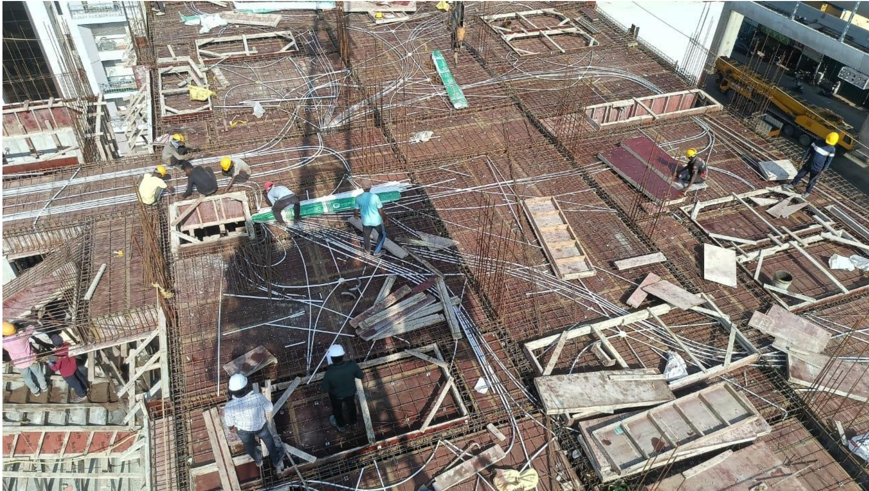
East Side View.