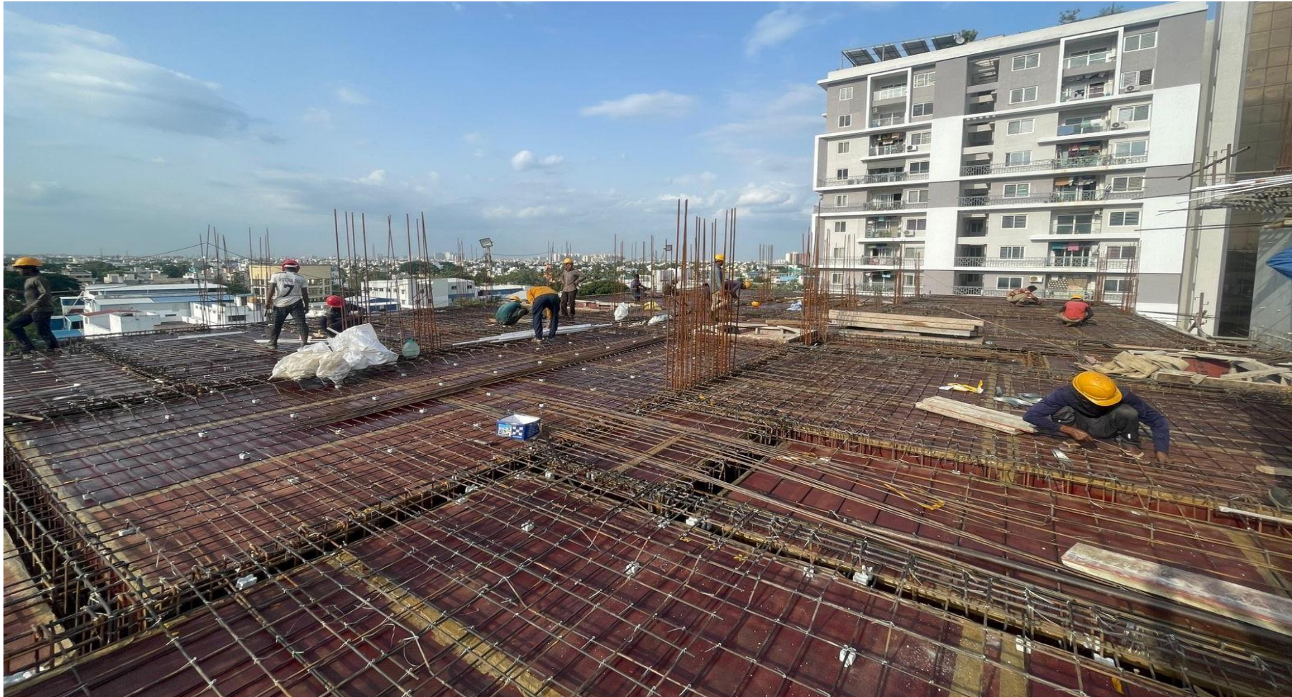
Pour 2 – 6 th Floor roof reinforcement work completed.