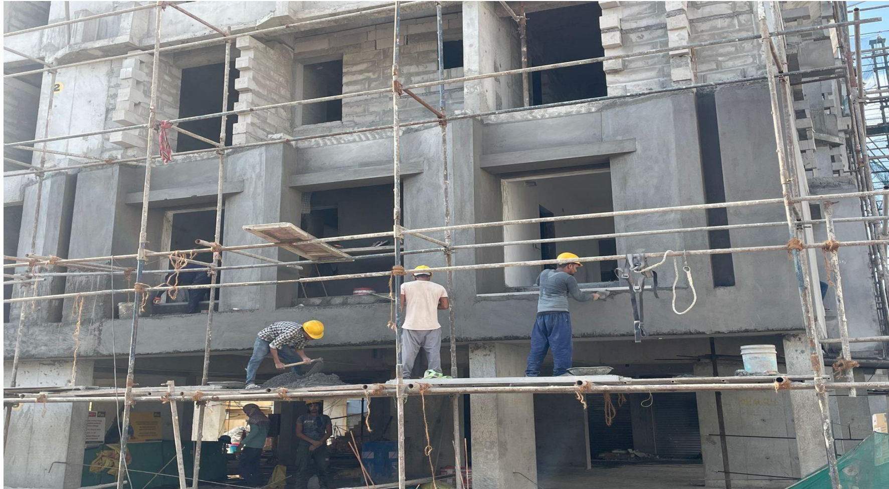
First floor outer plastering work in progress.