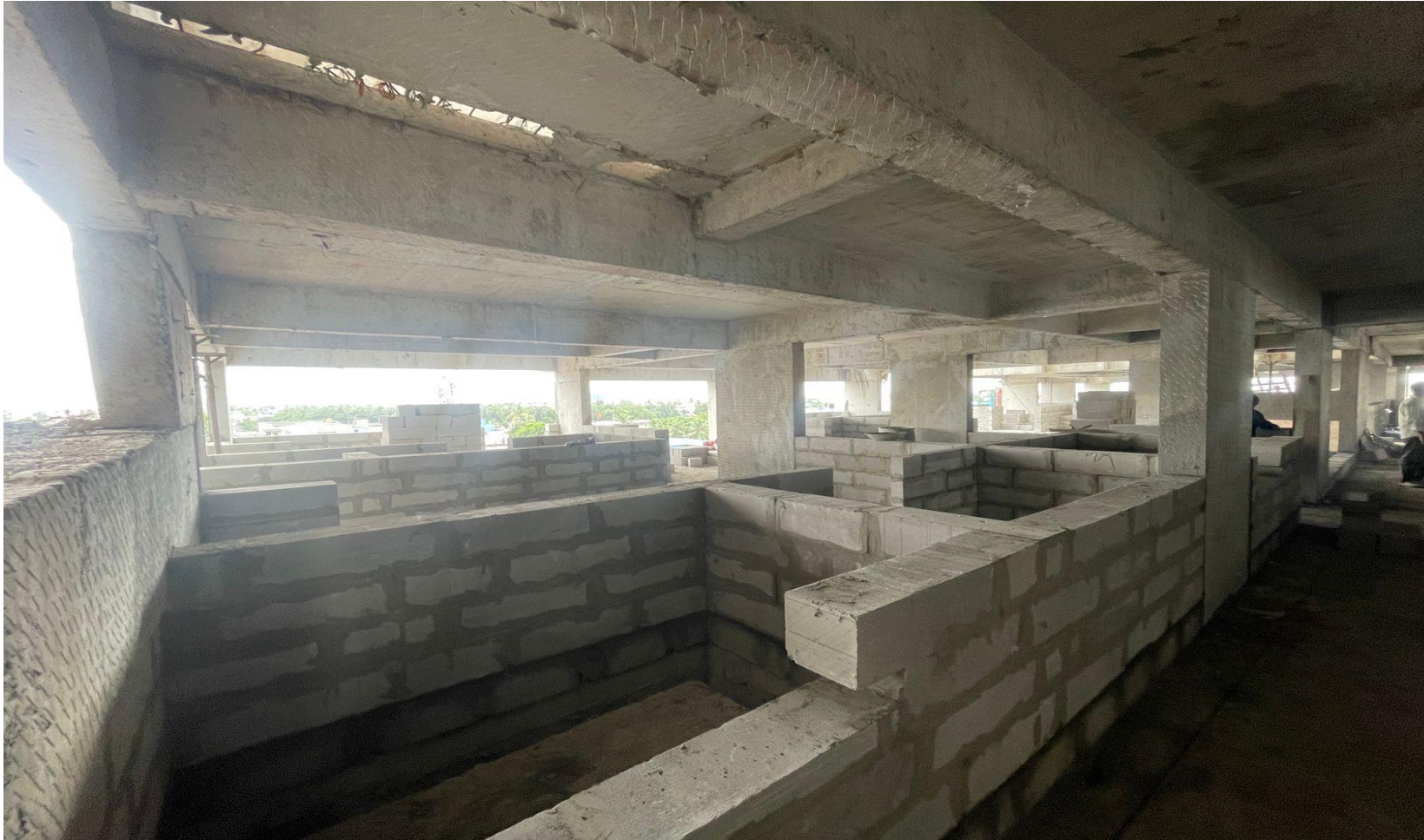
5th Floor block work in progress.