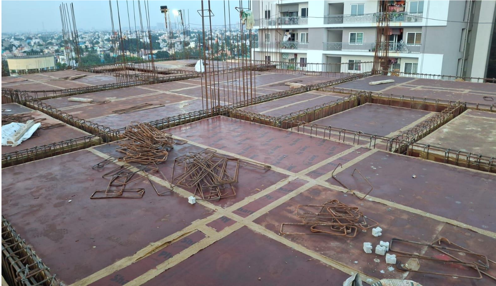
Pour 1 – 9 th Floor roof shuttering work completed.