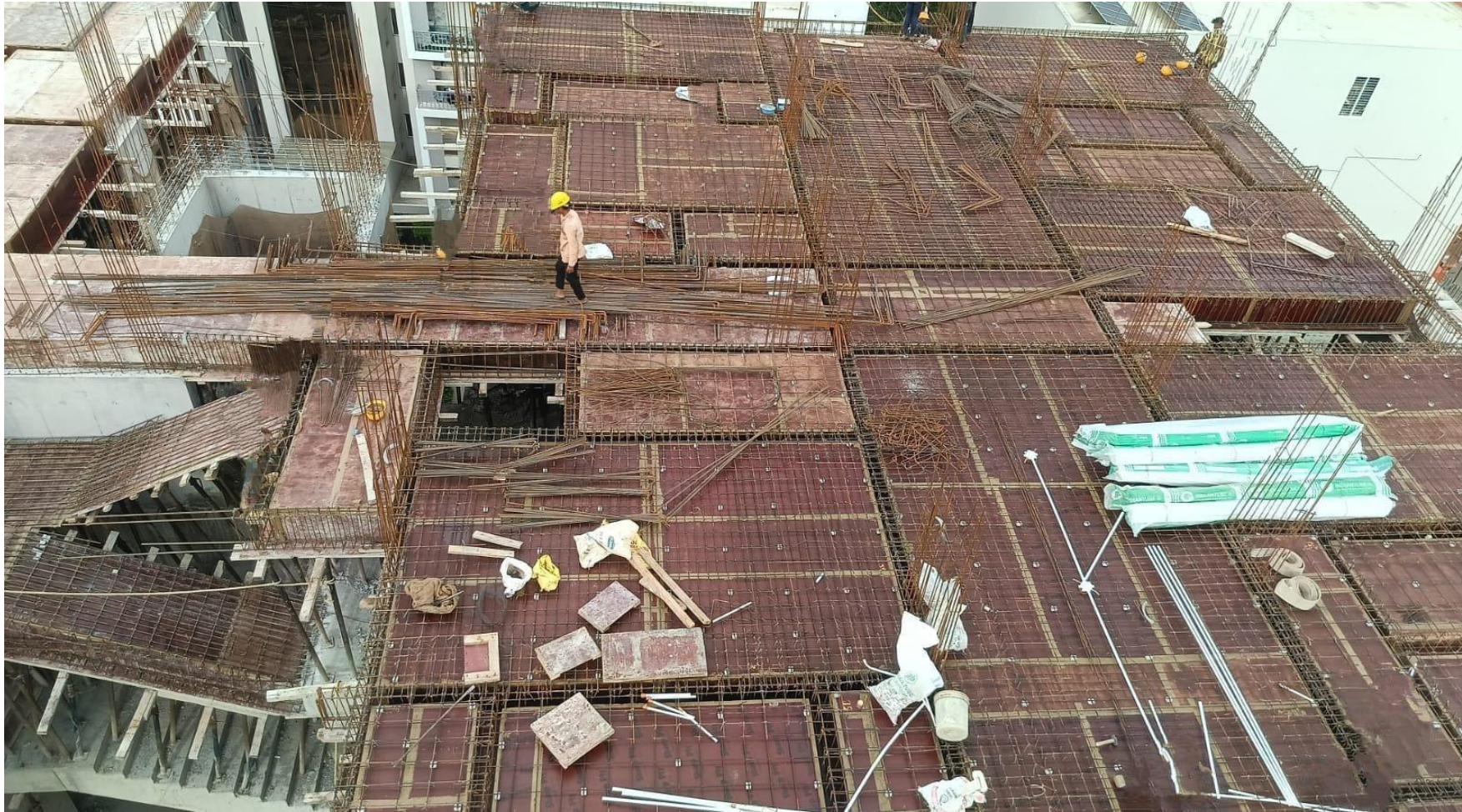
Pour 1 – 8 th Floor roof reinforcement work completed.