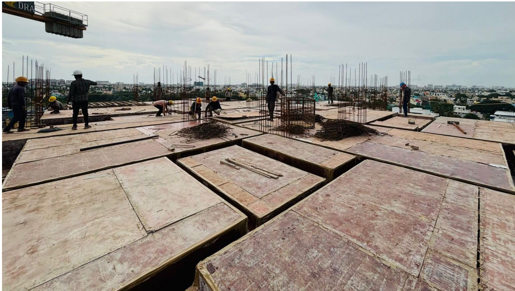
Pour 1 – 8 th Floor roof shuttering work completed.