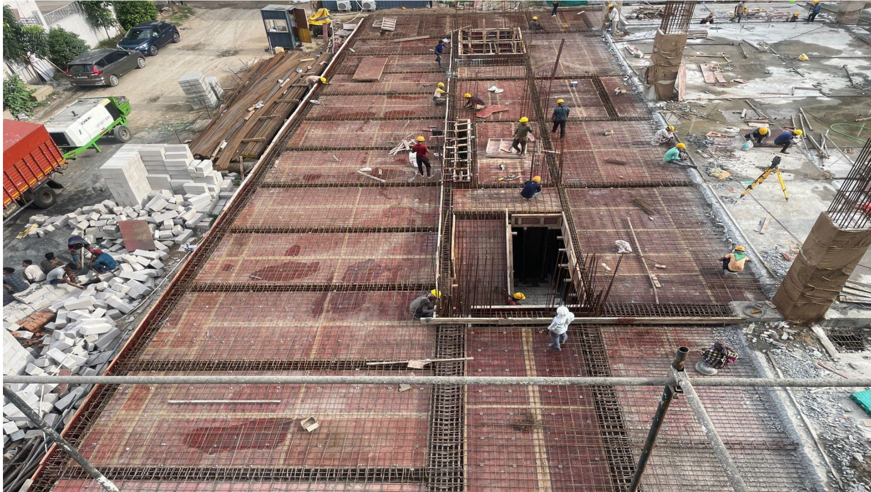
Tower -2 P2 Basement roof reinforcement work completed .