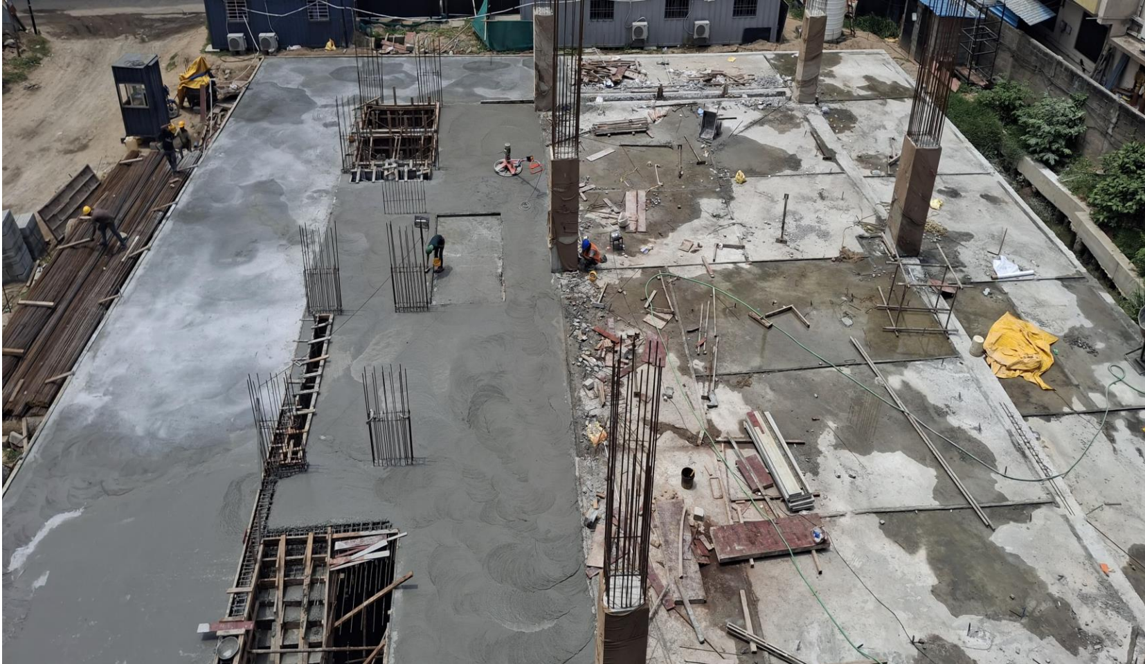
Tower -2 P2 Basement roof concrete work completed .