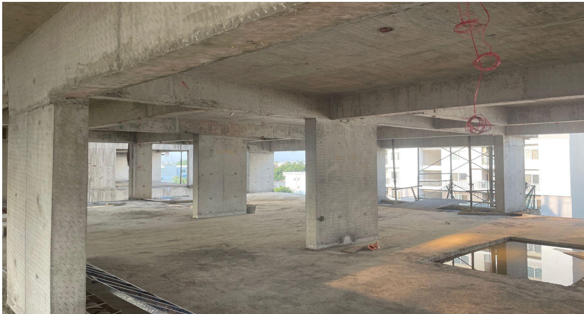
5th Floor cleaning work completed.