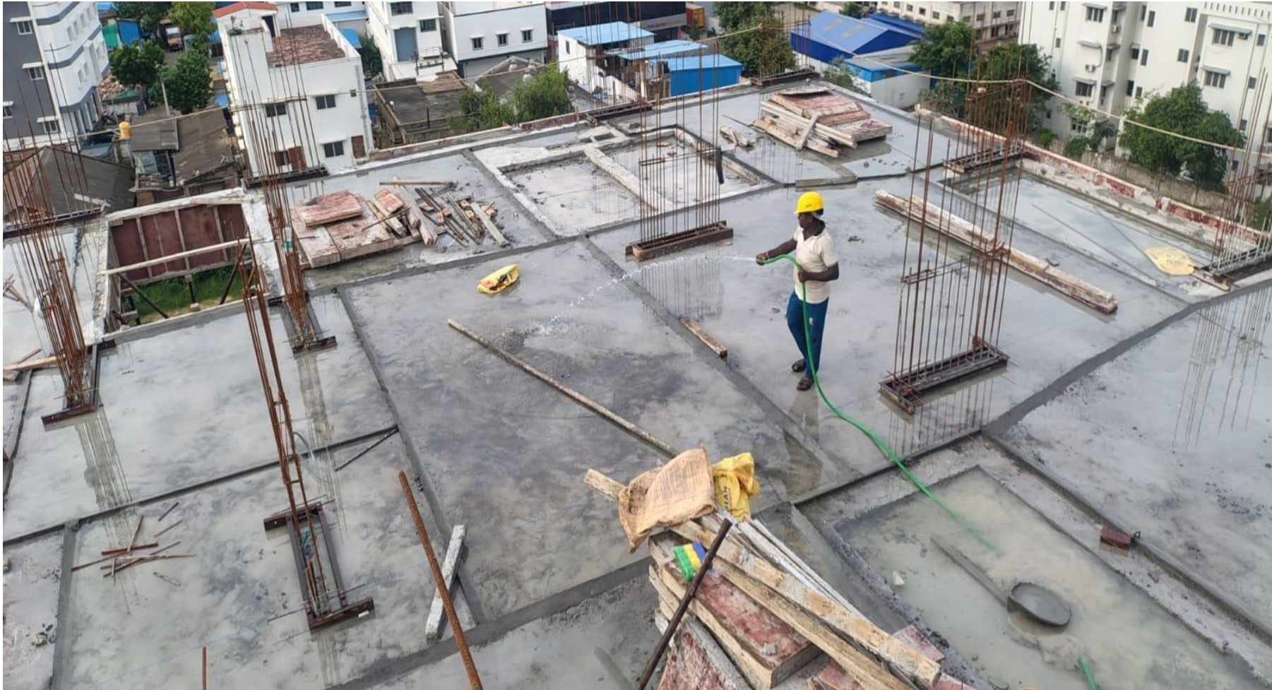
Pour 2 – 7 th Floor roof concrete curing work.