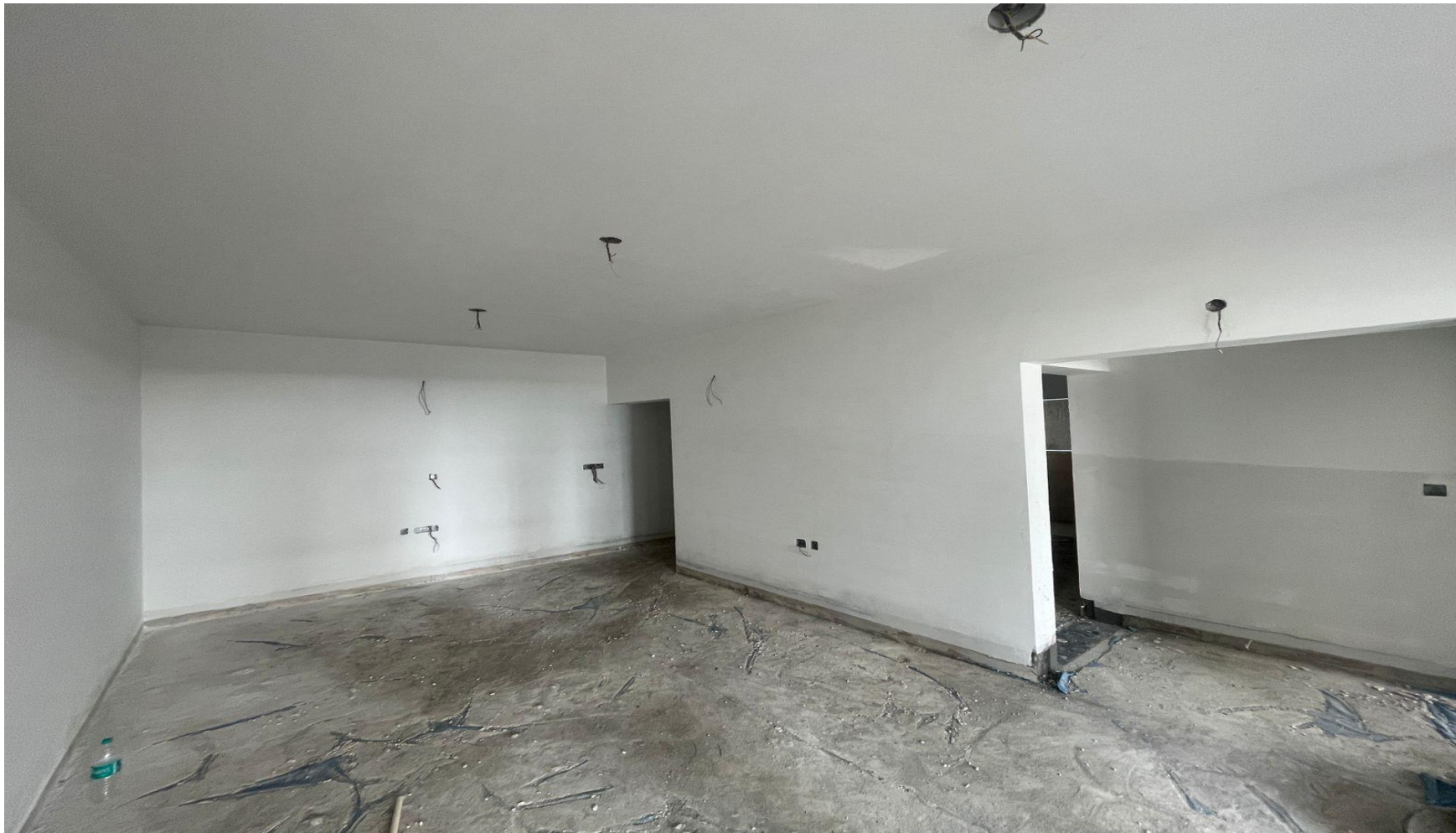
101 Mock up flat Flooring and POP Laying work completed.