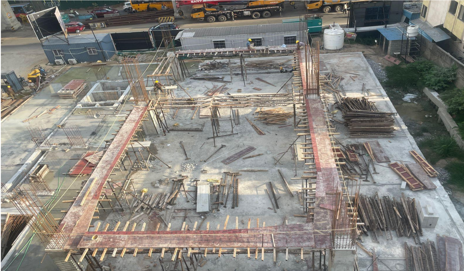
Tower -2 Stilt floor P1 PT Beam soffit shuttering work in progress .