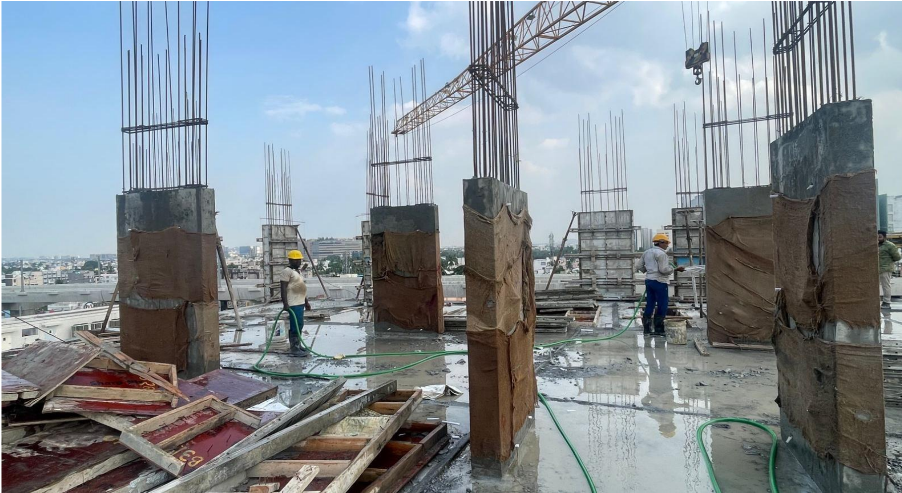
Pour 1 – 8 th Floor column curing work completed.