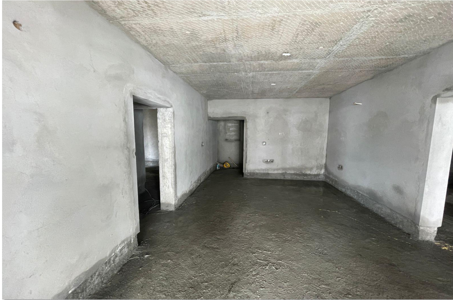
5 th floor inner wall plastering work completed