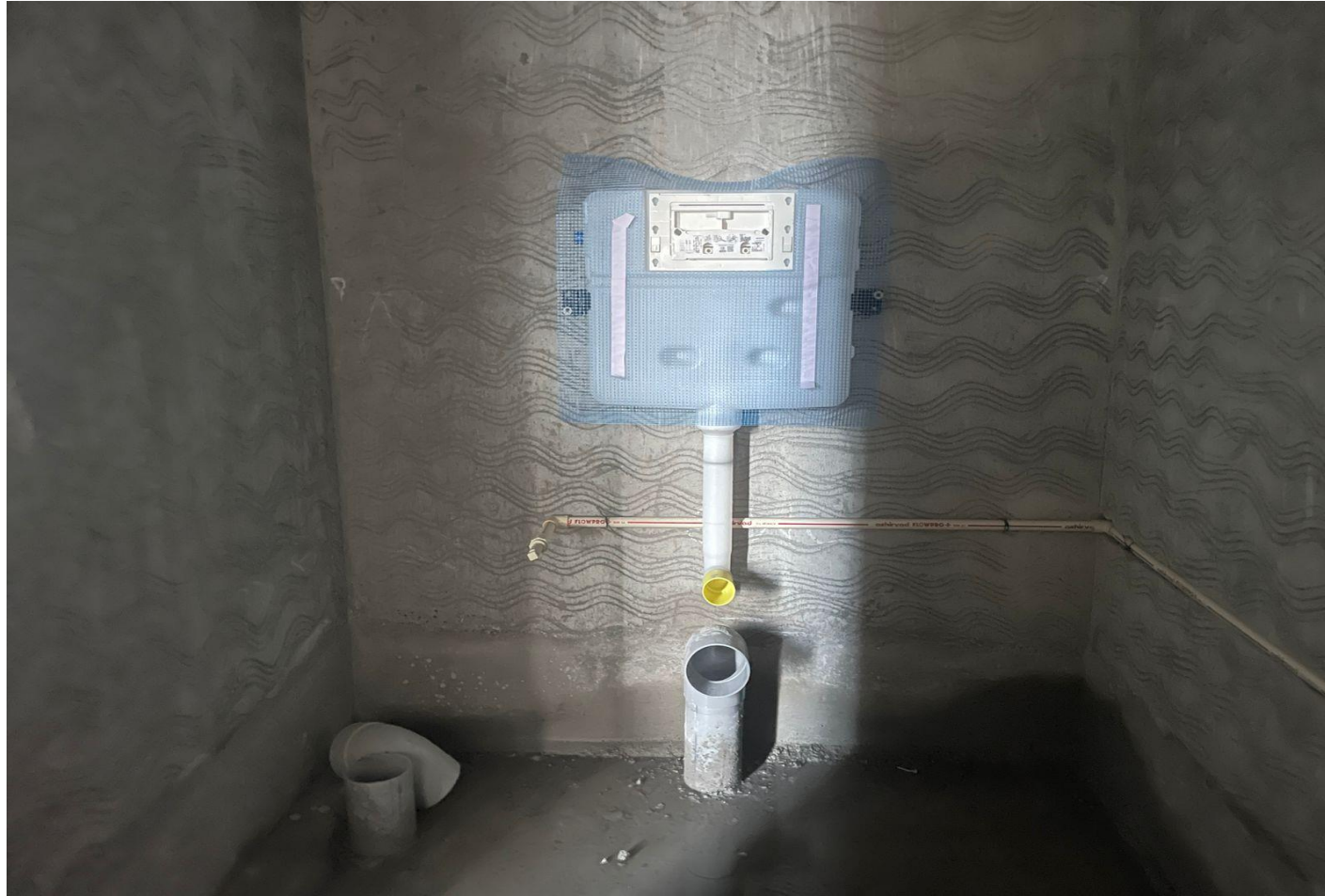
1 st floor toilet concealed tank fixing work in progress