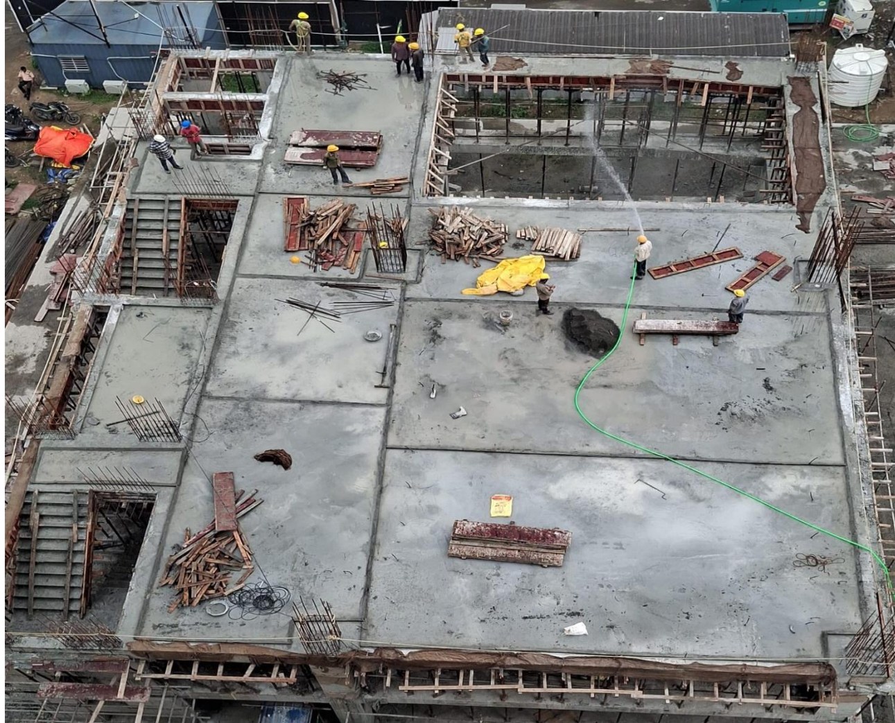
Tower 2 1 st floor roof slab curing work completed.