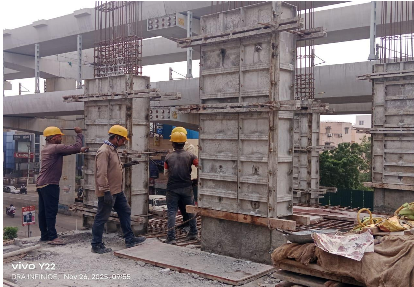
Tower - 2 2 nd floor column concrete work in progress.