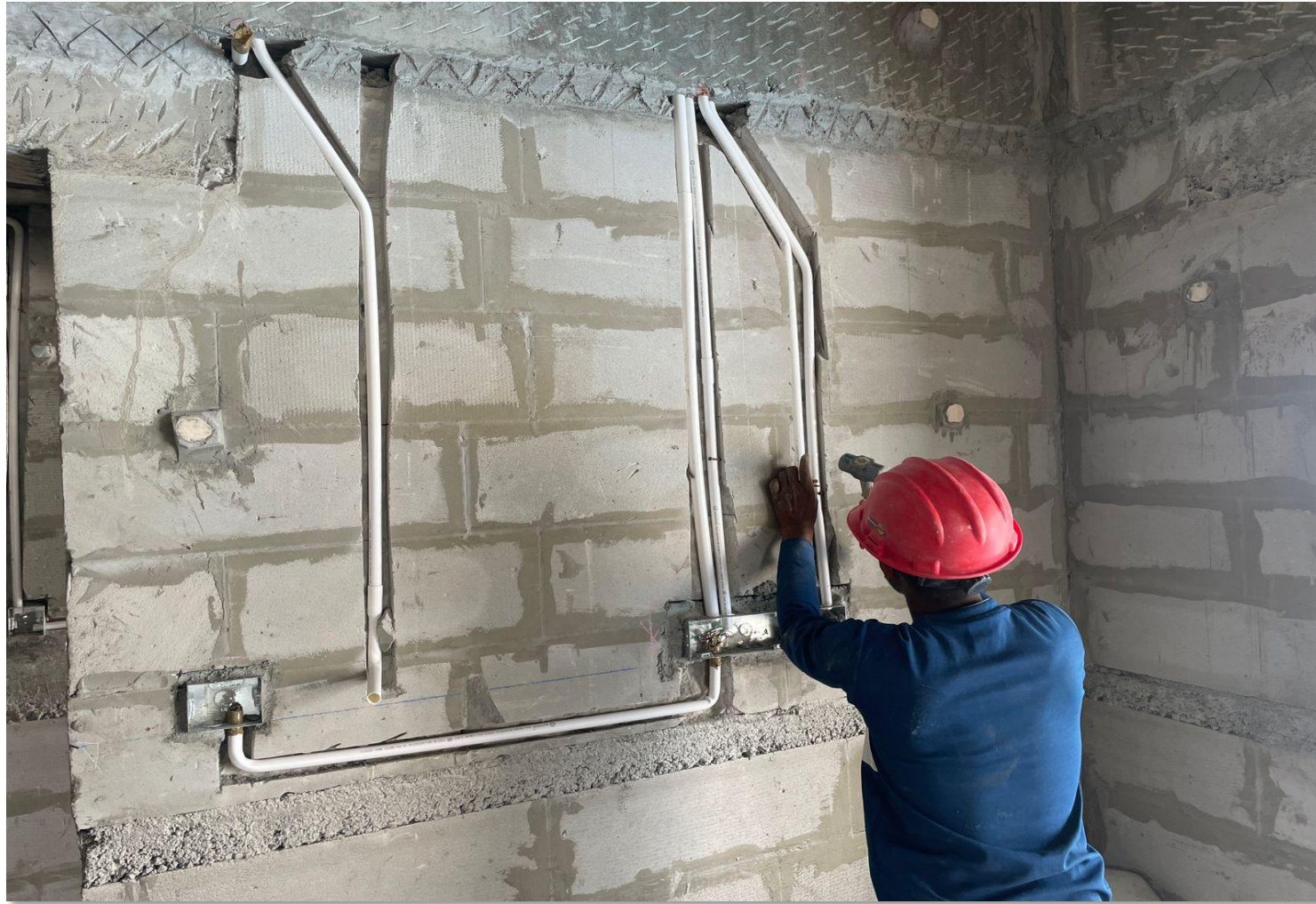
7 th floor inner wall electrical pipe laying work completed