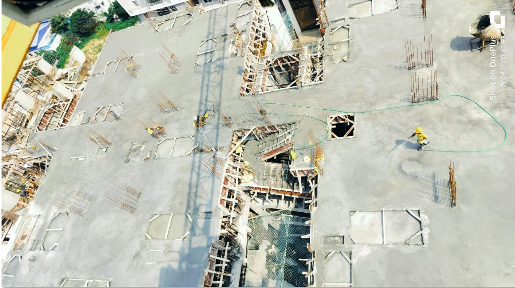
Pour 1 12 th floor roof slab concrete work completed