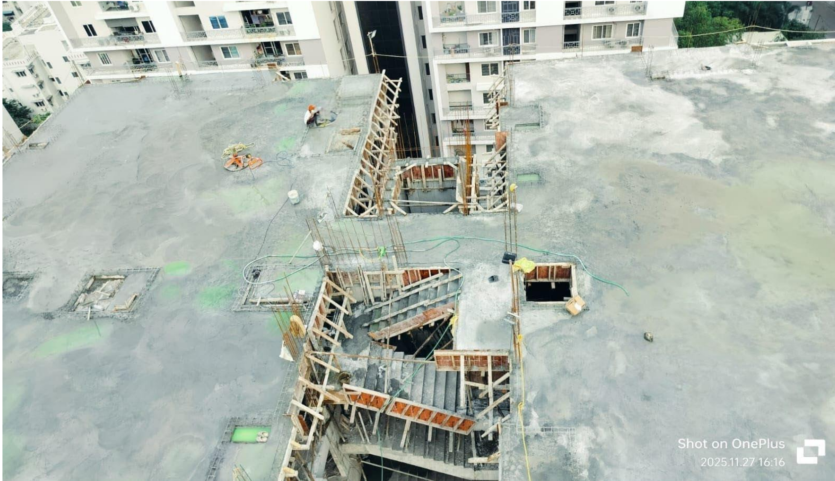
East Side View.