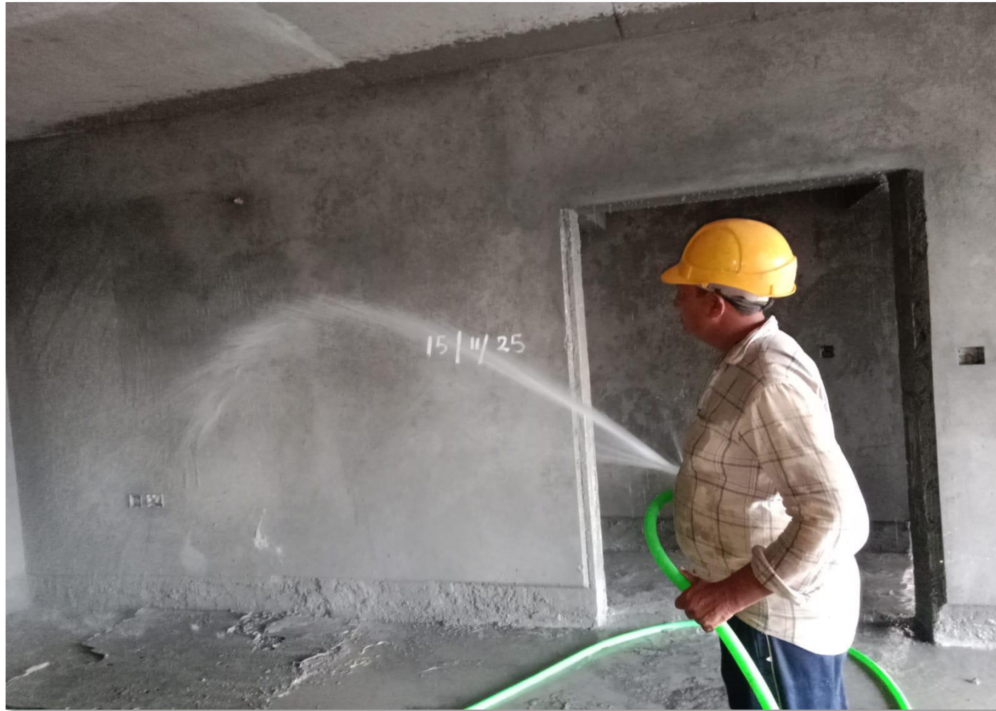
6th & 7th floor plastering curing works in progress.