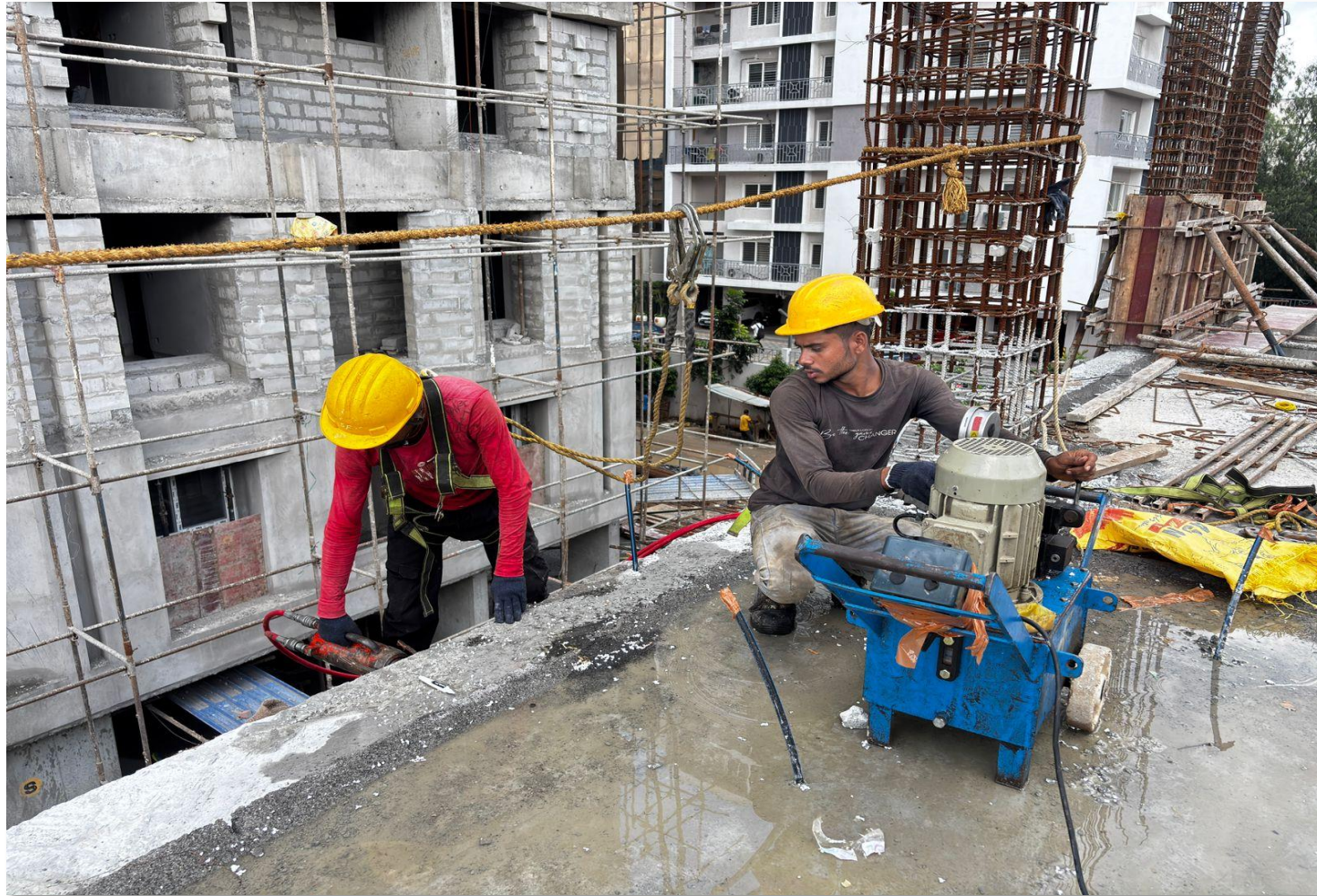
Tower 2 1 st floor roof PT Stressing work completed.