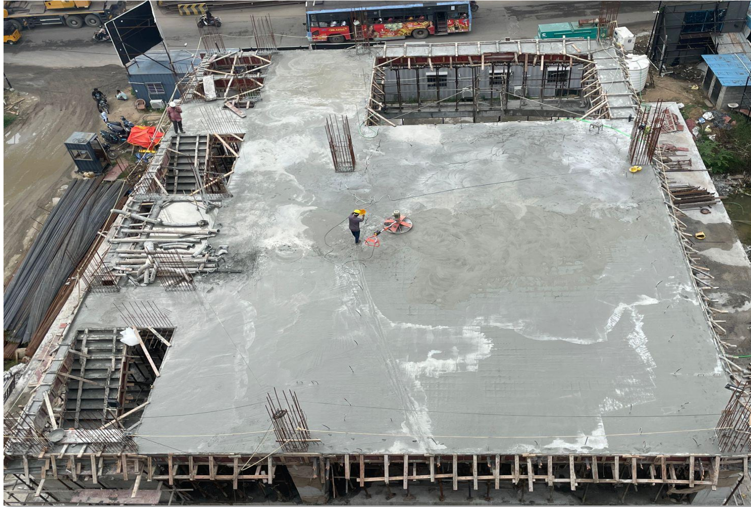
Tower 2 1 st floor roof slab concrete work completed