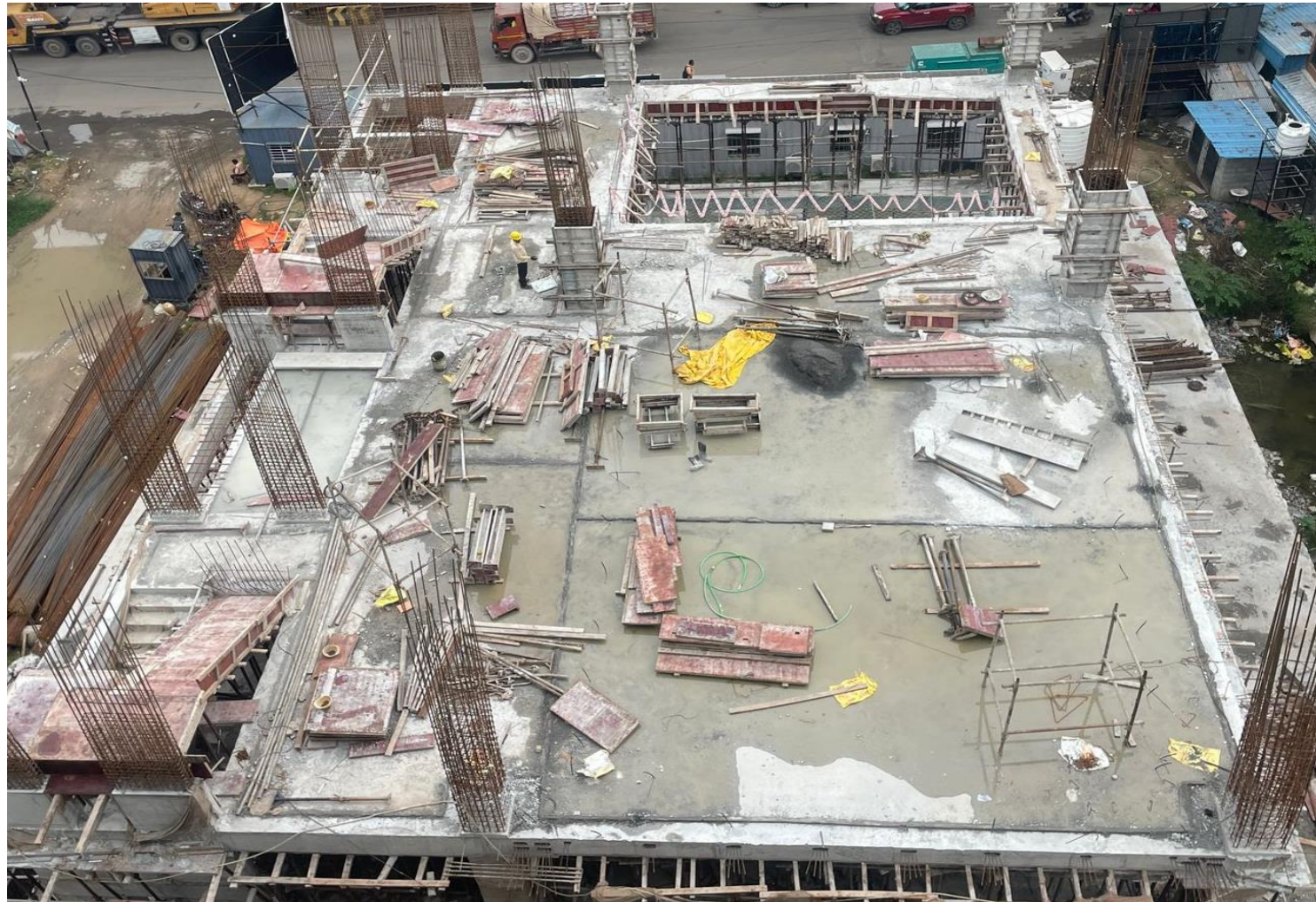
South Side View.