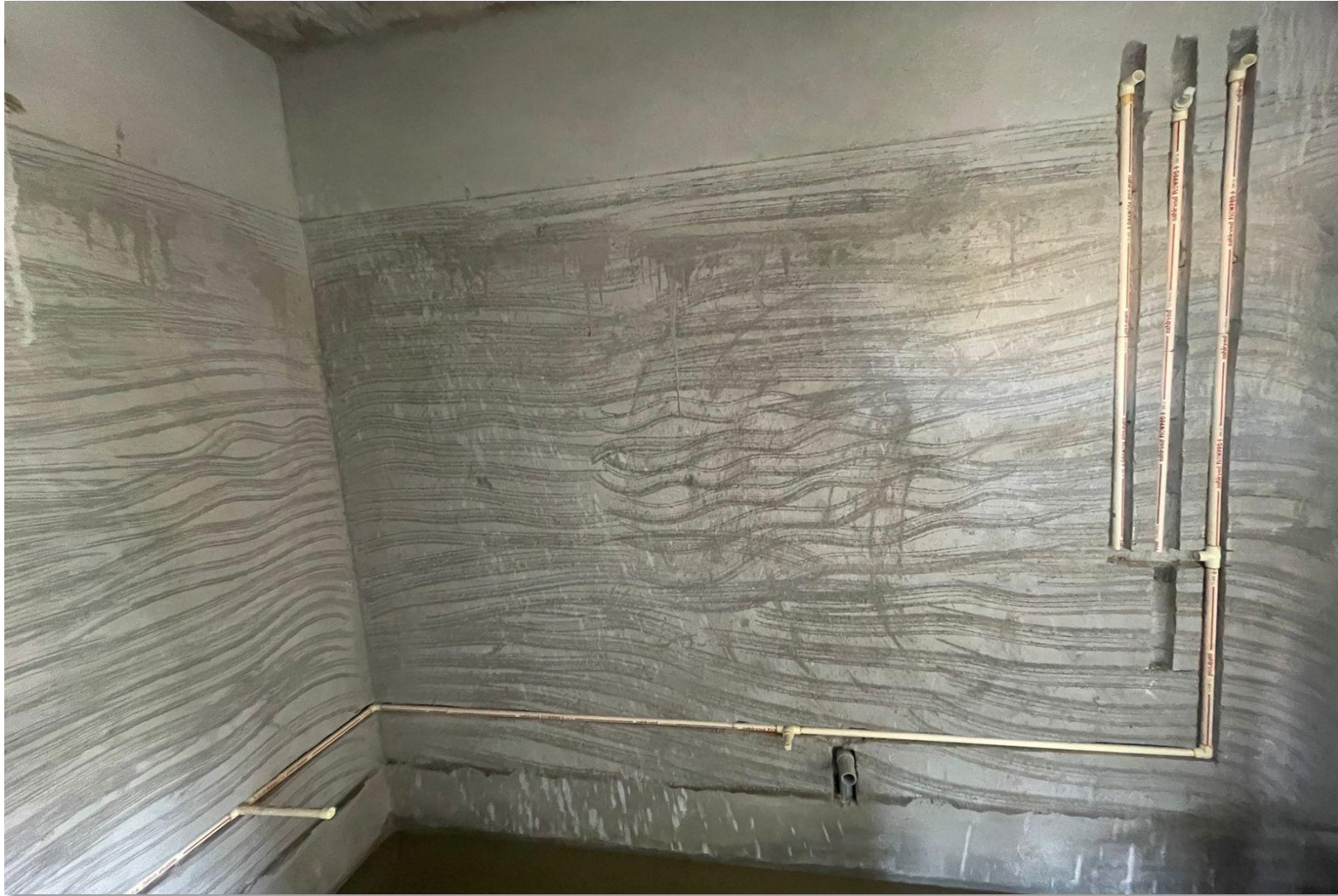
3 rd floor bathroom water line work in progress