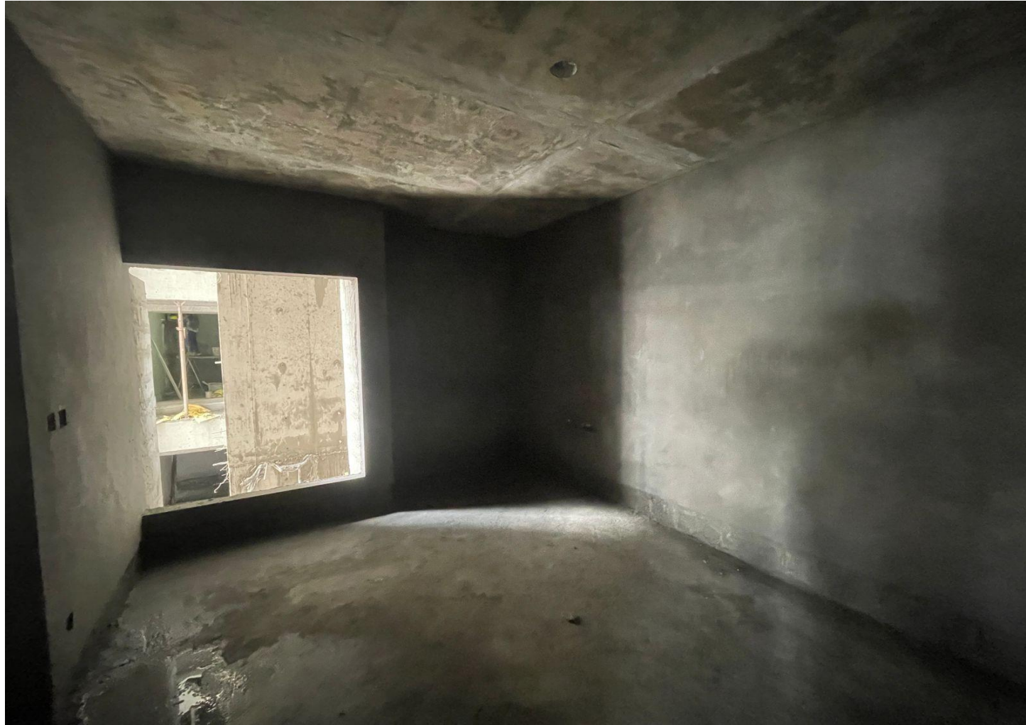
7 th floor inner wall plastering work in progress.