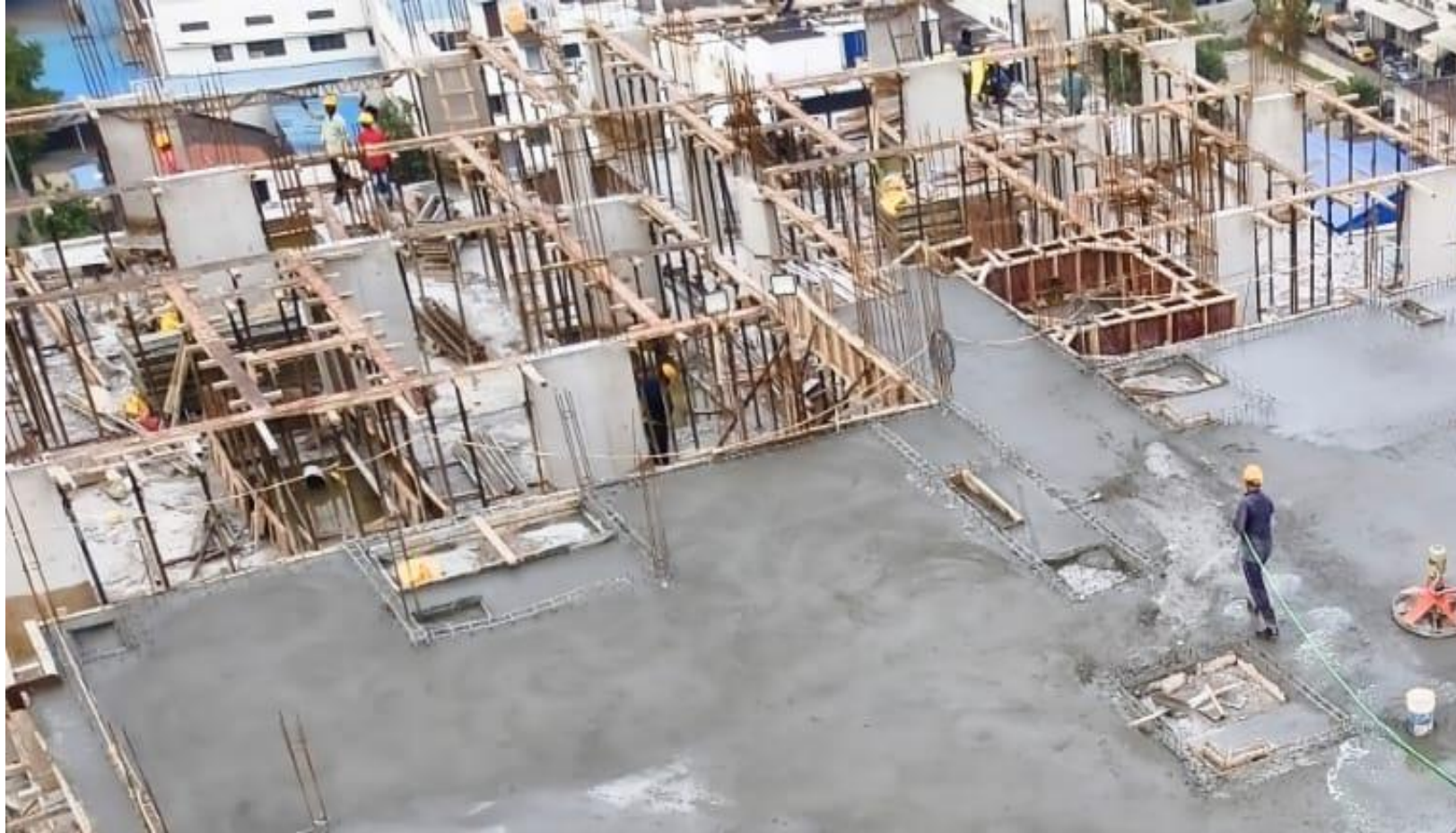
North Side View