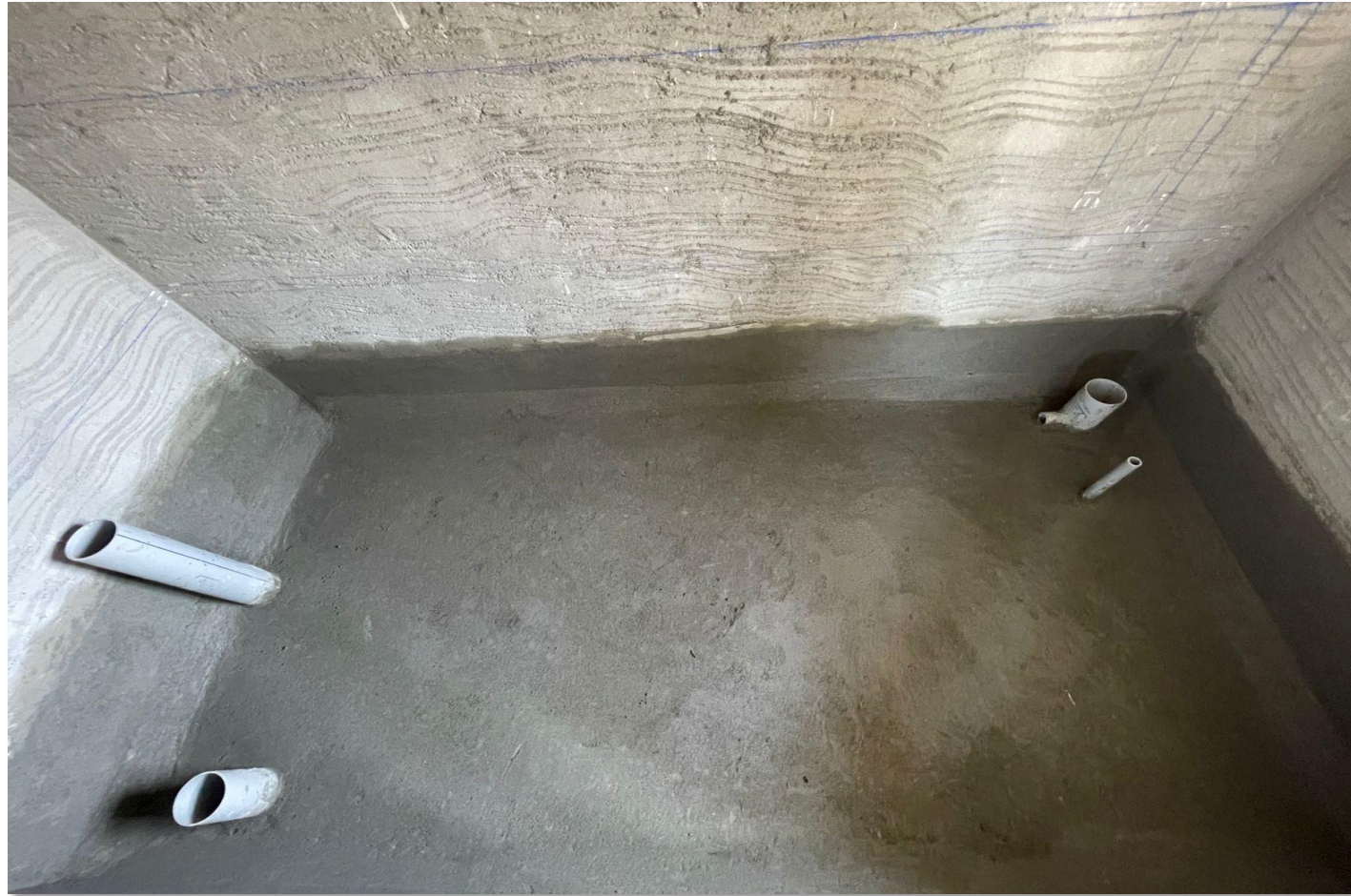
4 th & 5 th floor toilet water proofing work in progress