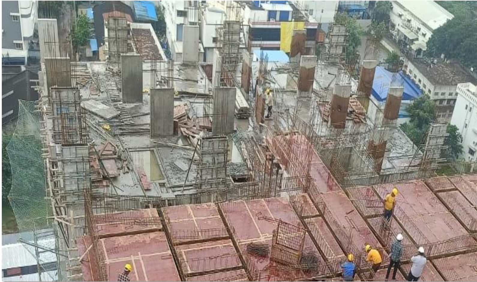
Pour 2 13 th floor column concrete work completed.