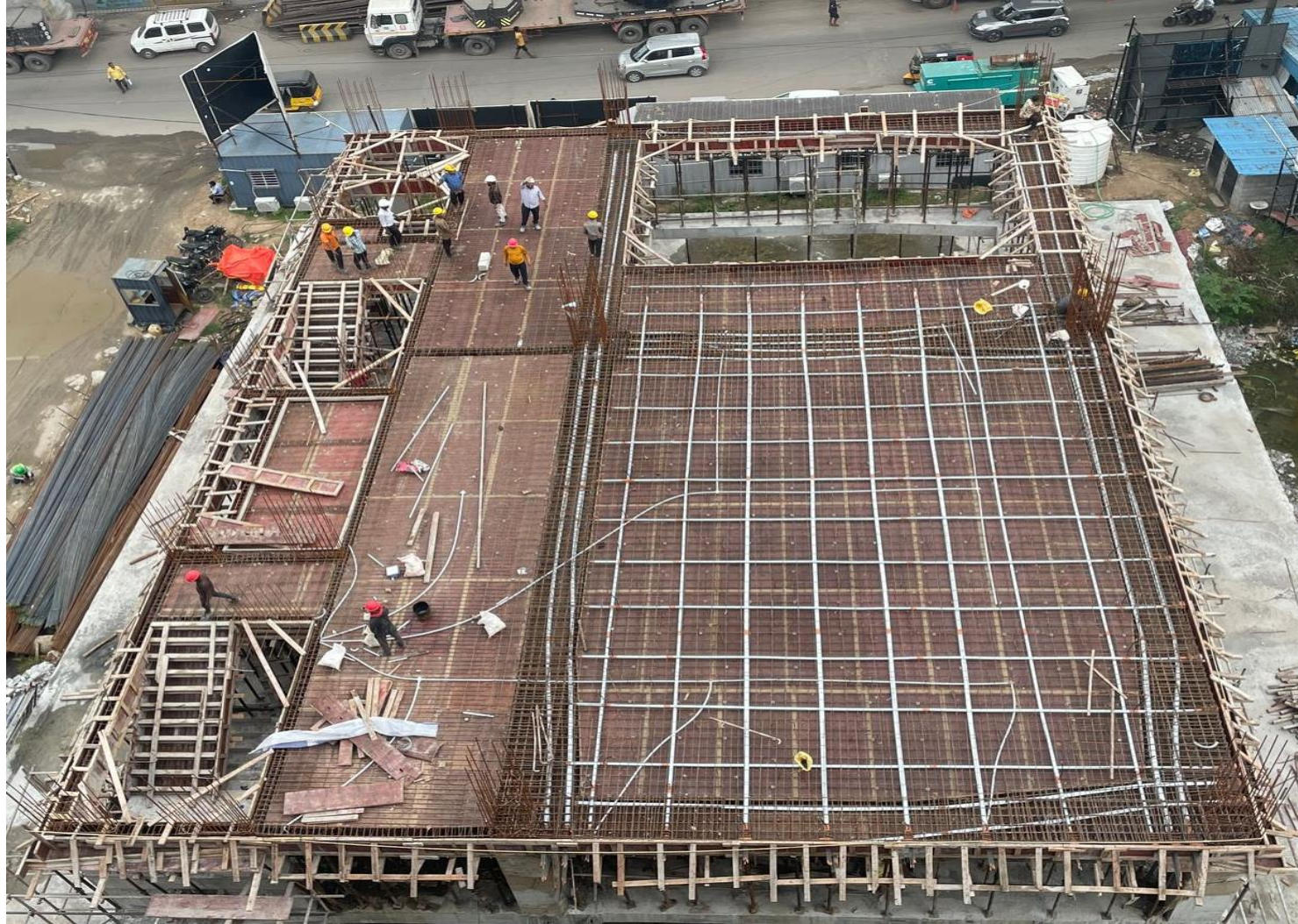
Tower 2 1 st floor roof slab reinforcement work completed