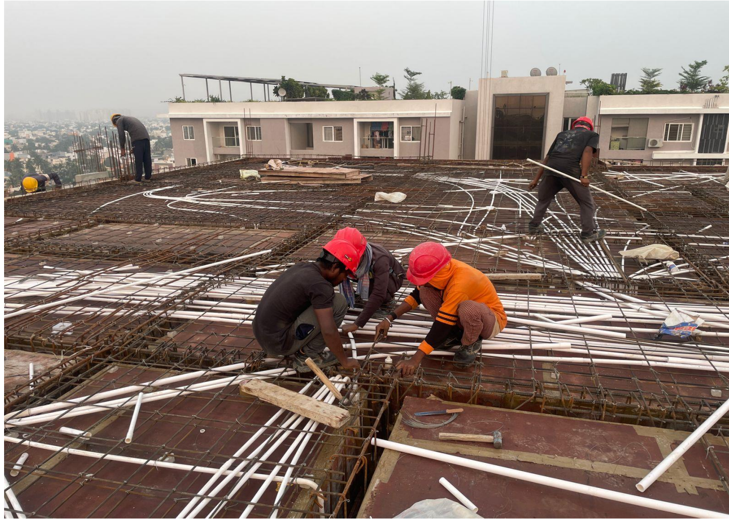
Pour 1 13 th floor roof electrical work completed.