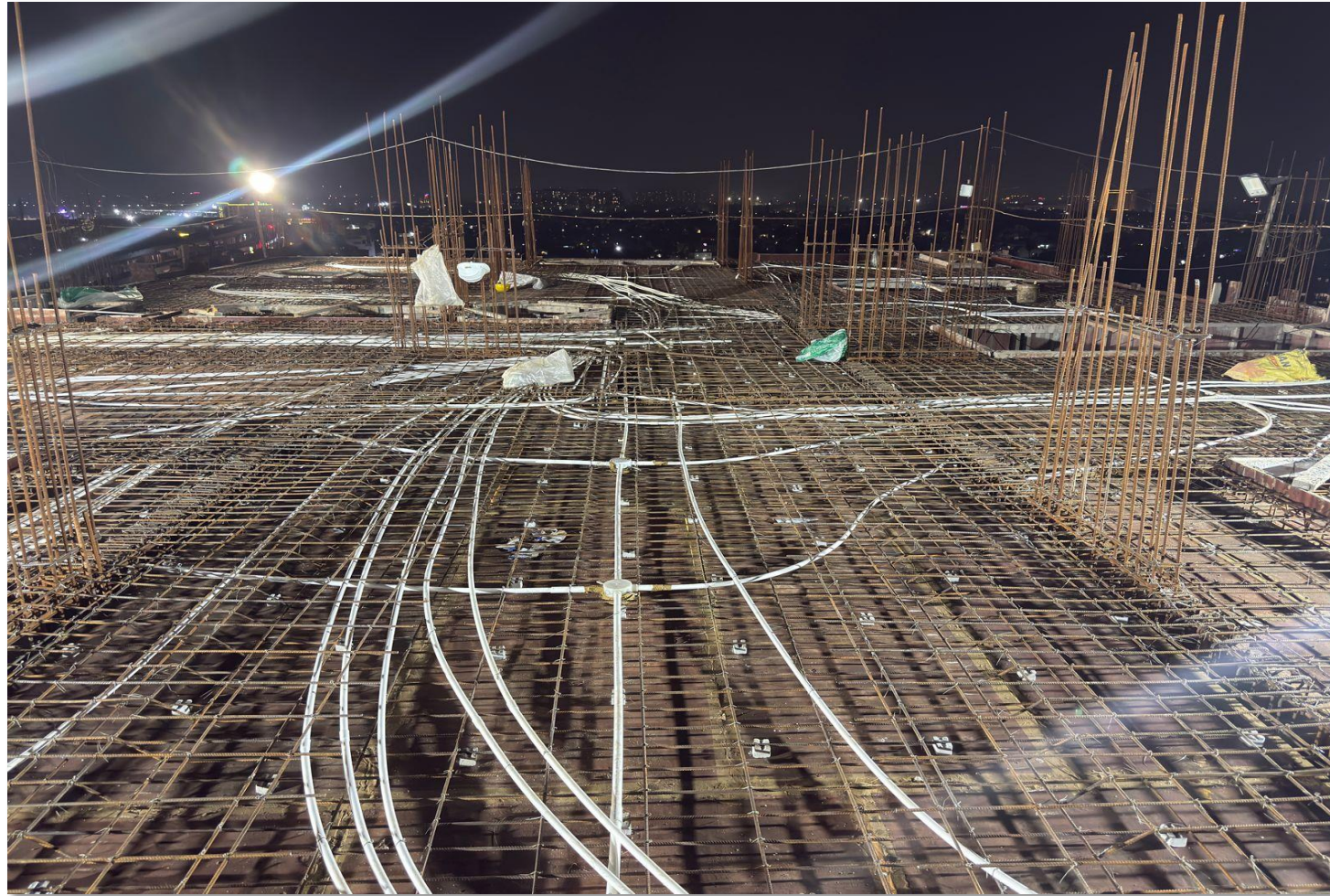
Pour 2 12 th floor roof slab electric conduit work completed.