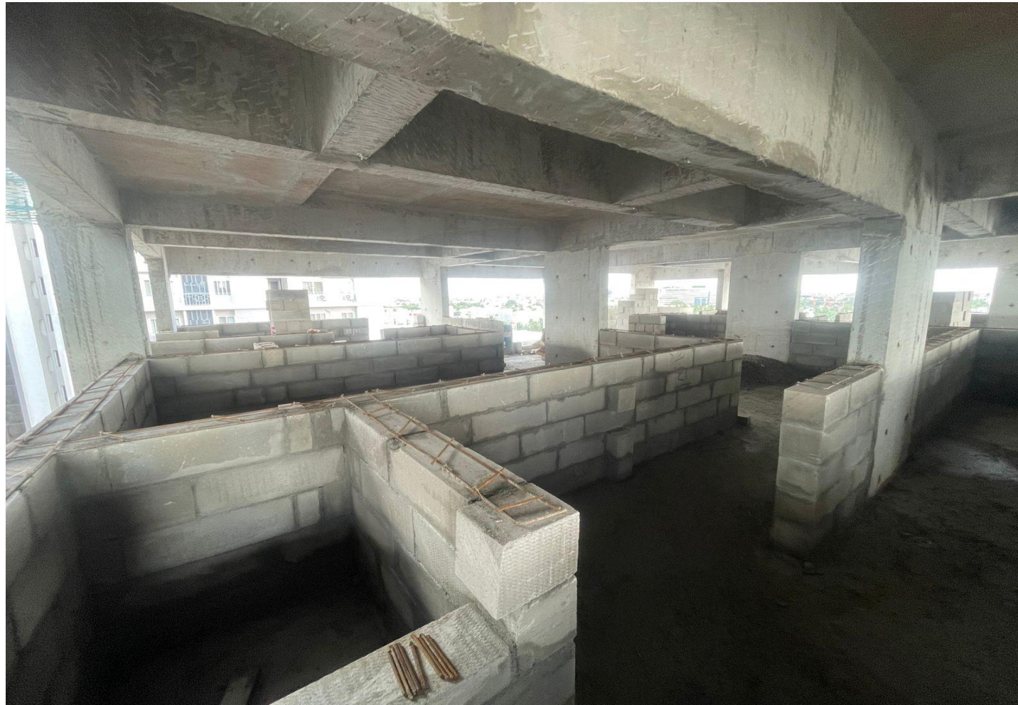
10 th Floor block work in progress.