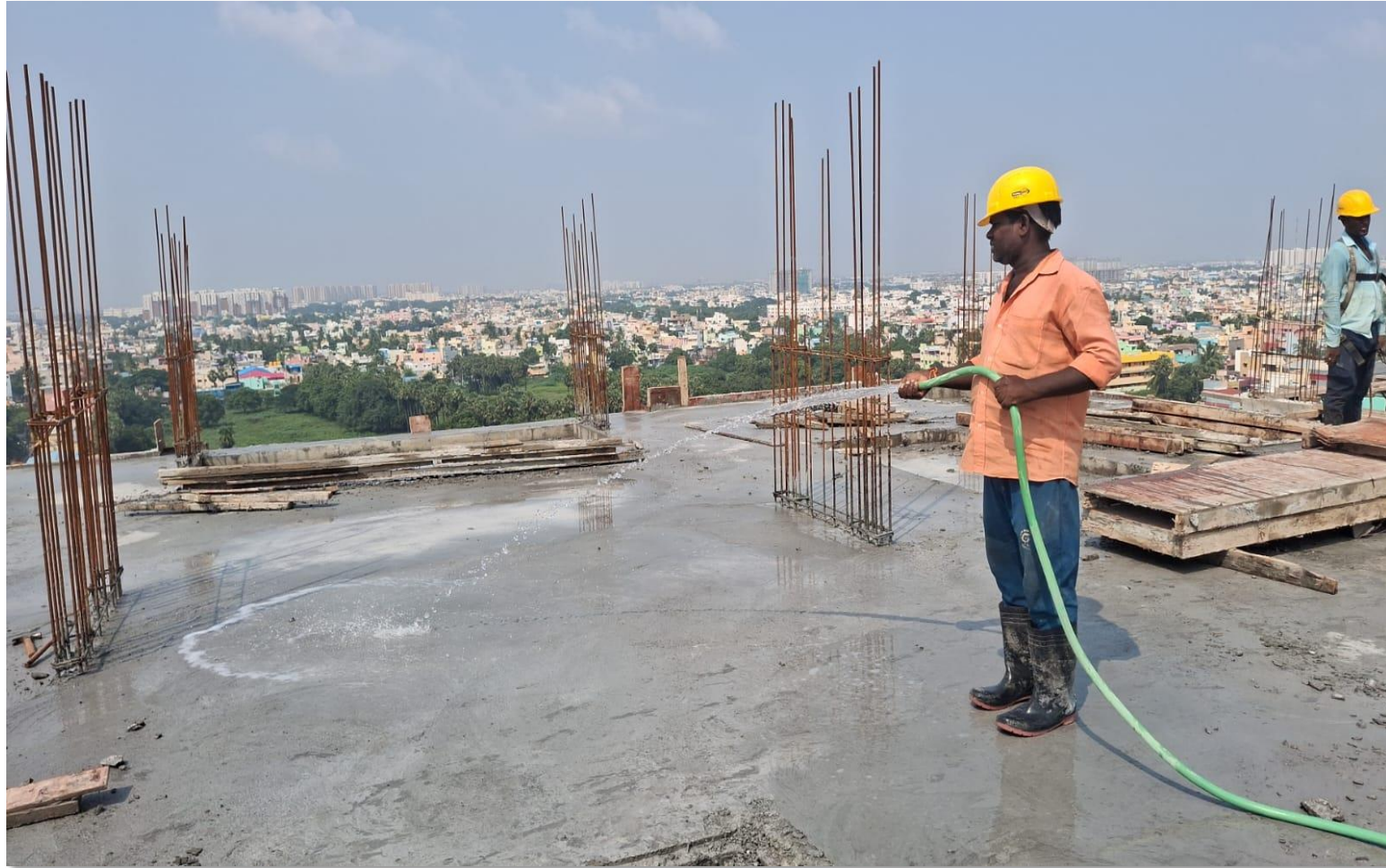
Pour 1 12 th floor roof slab curing work