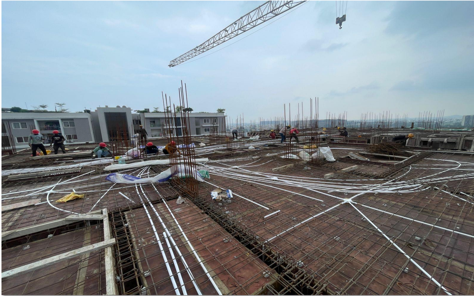
Pour 1 12 th floor roof slab electrical pipe laying work completed