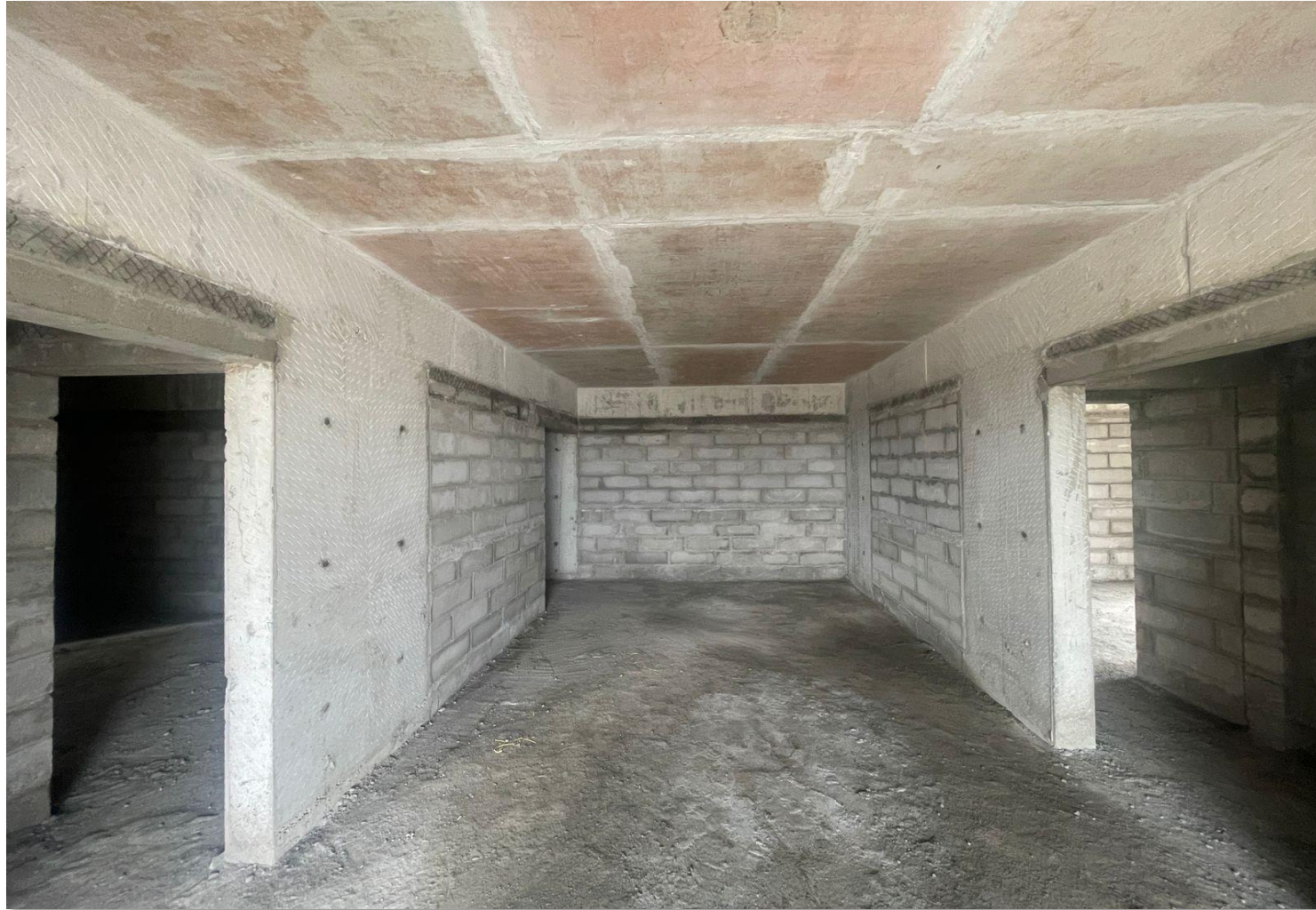
9 th Floor block work completed.