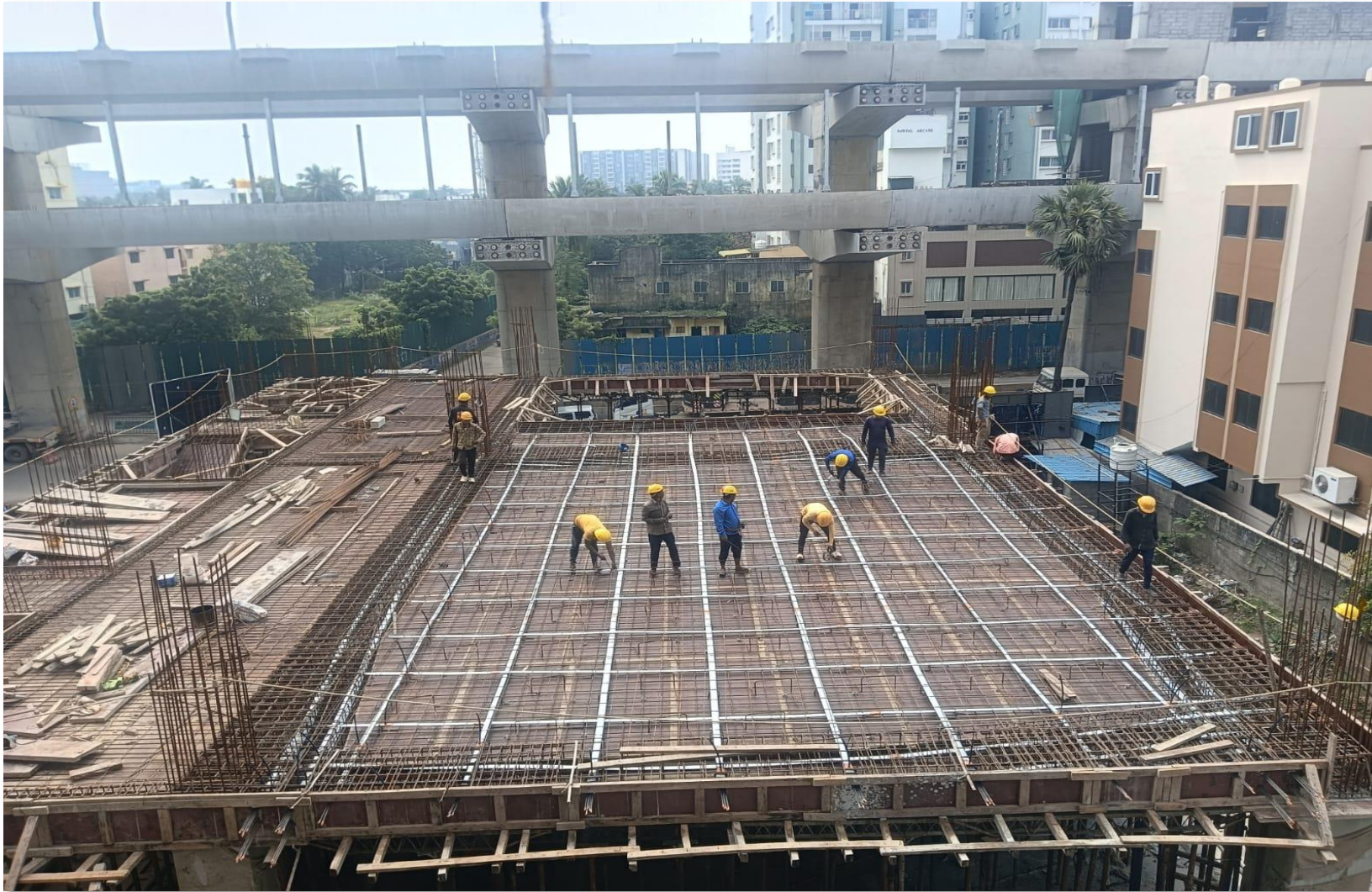
Tower 2 1 st floor PT work completed