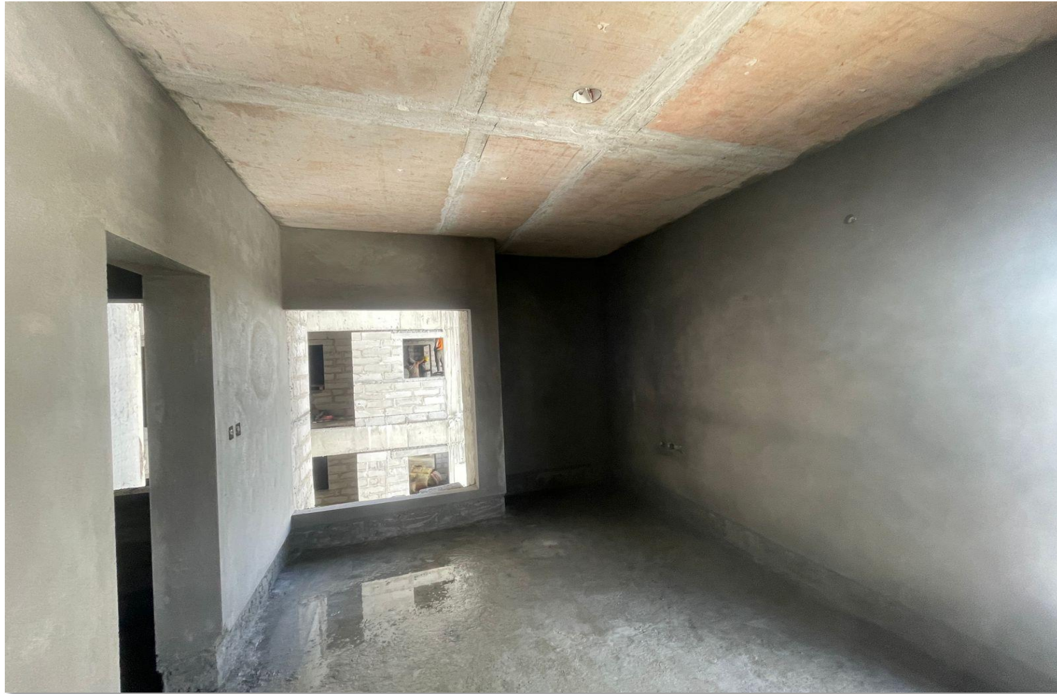
6 th floor inner wall plastering work completed