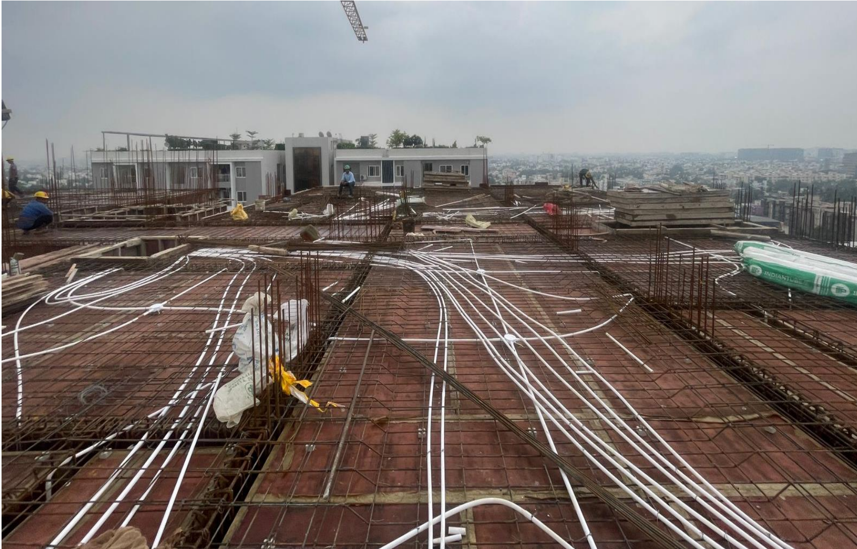
Pour 1 13 th floor roof reinforcement work completed.