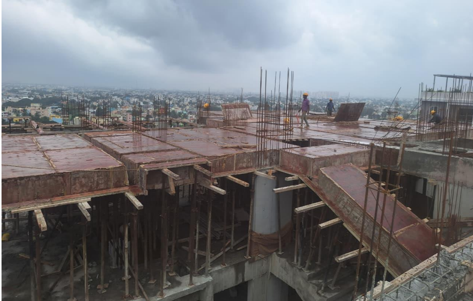
Pour 2 13 th floor roof shuttering work in progress.