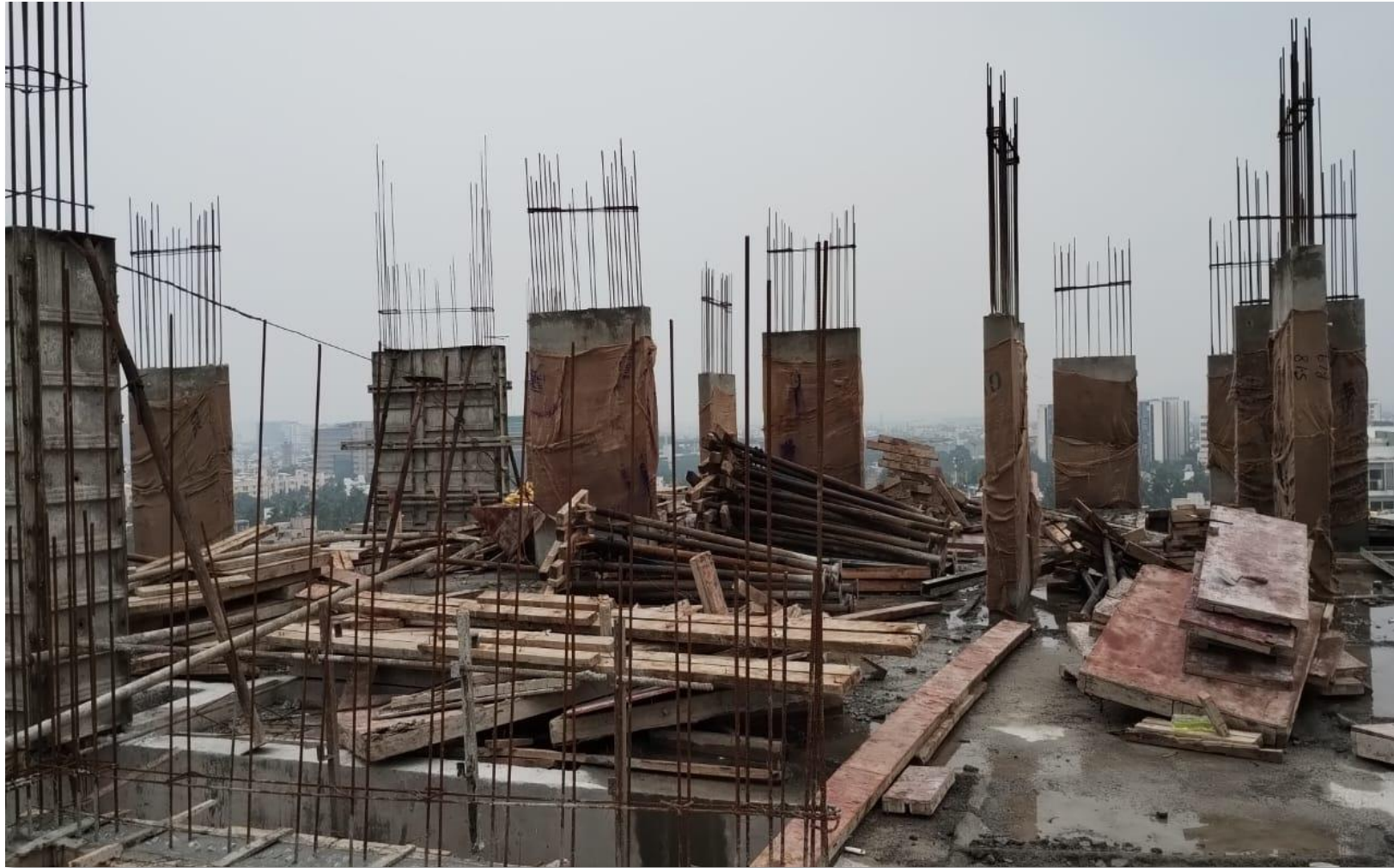
Pour 1 13 th floor column concrete work completed.