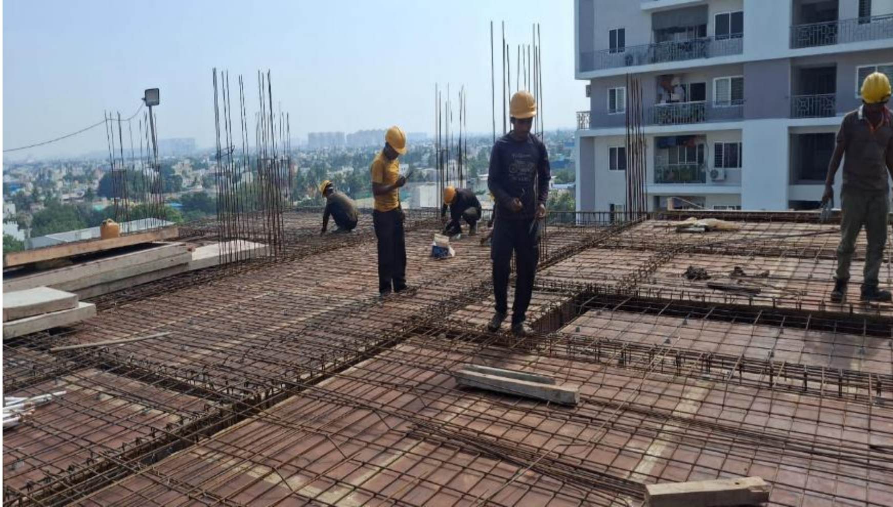
8 h Floor roof slab reinforcement work completed.