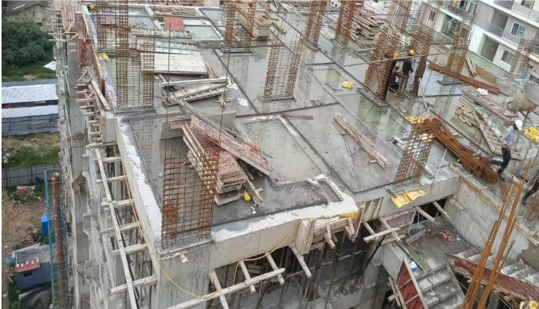
North Side View