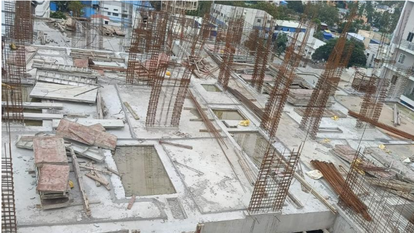
11 th floor column reinforcement work in progress.