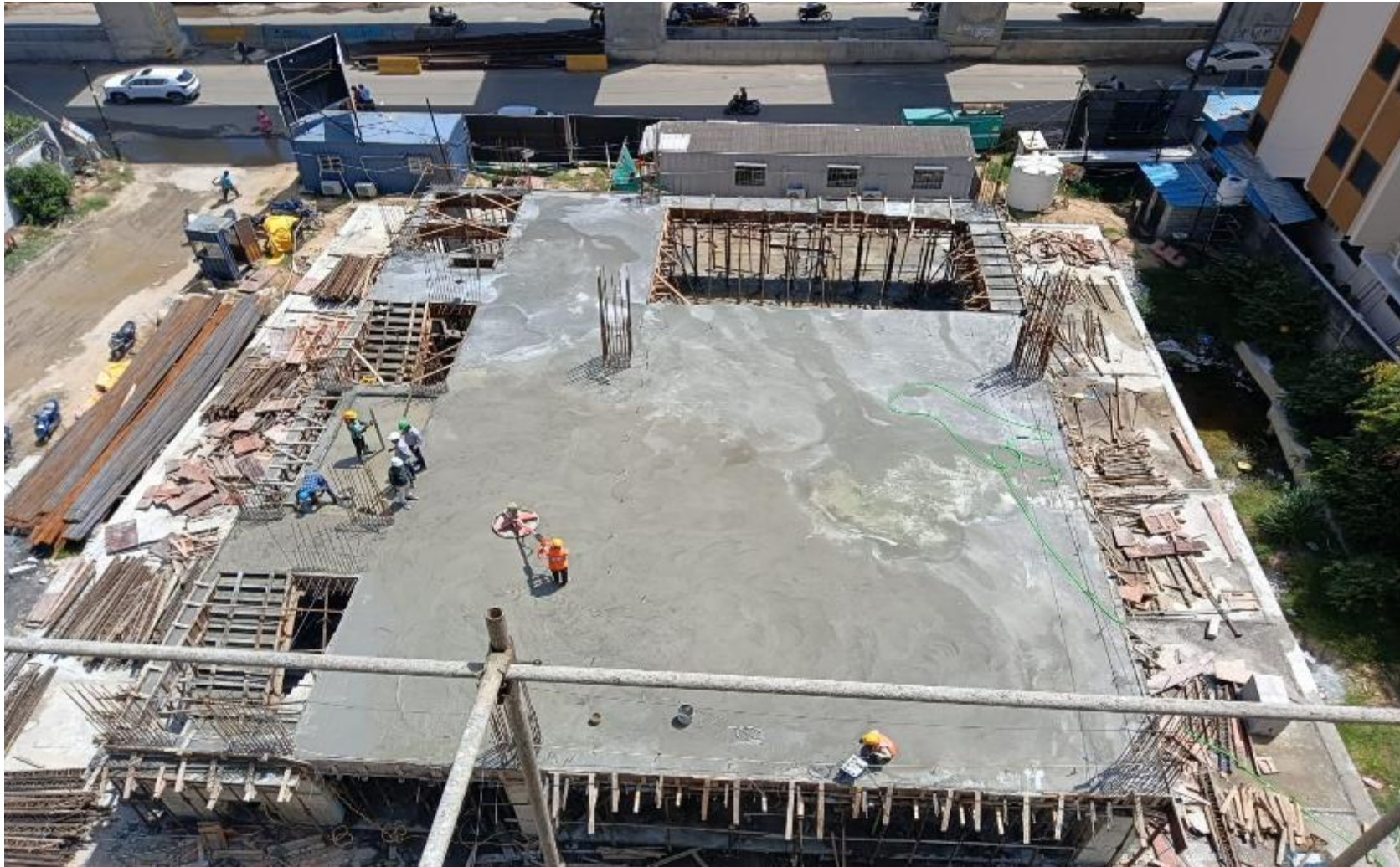
Tower -2 stilt floor roof slab concrete work completed .