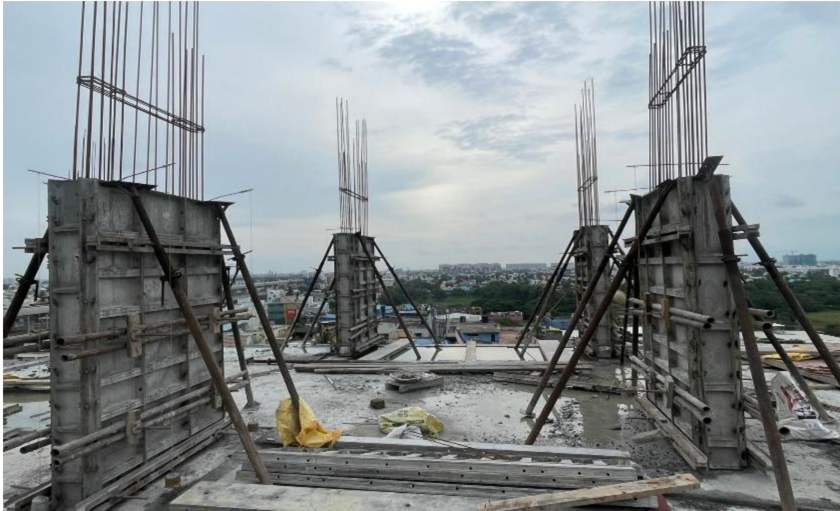
9 h Floor column concrete work completed.