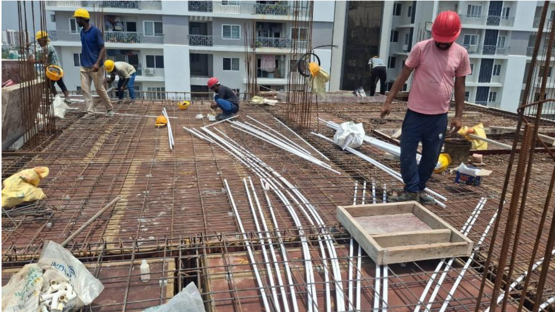
8 th Floor roof slab electrical conduit laying work completed.