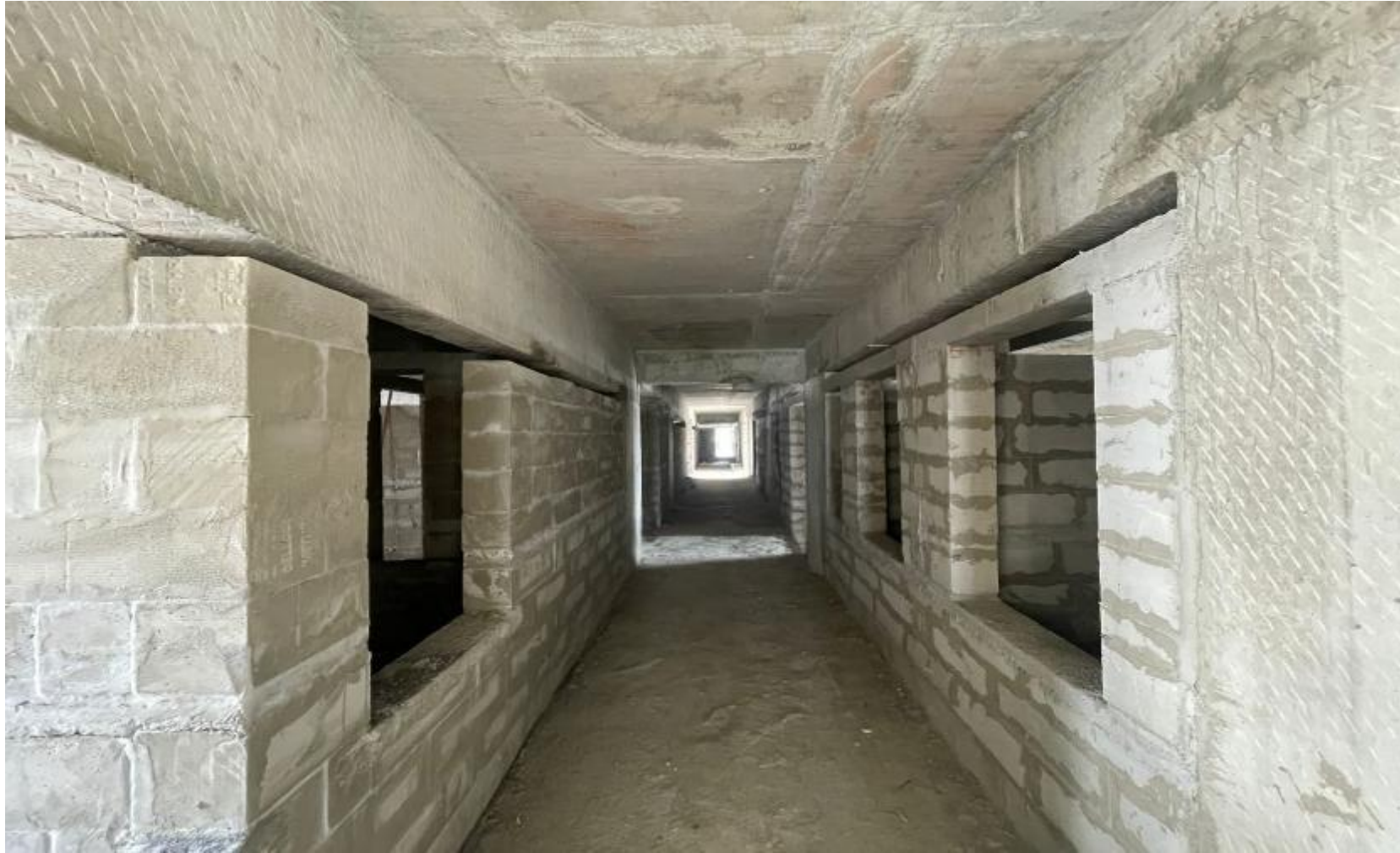
6th Floor block work in progress..