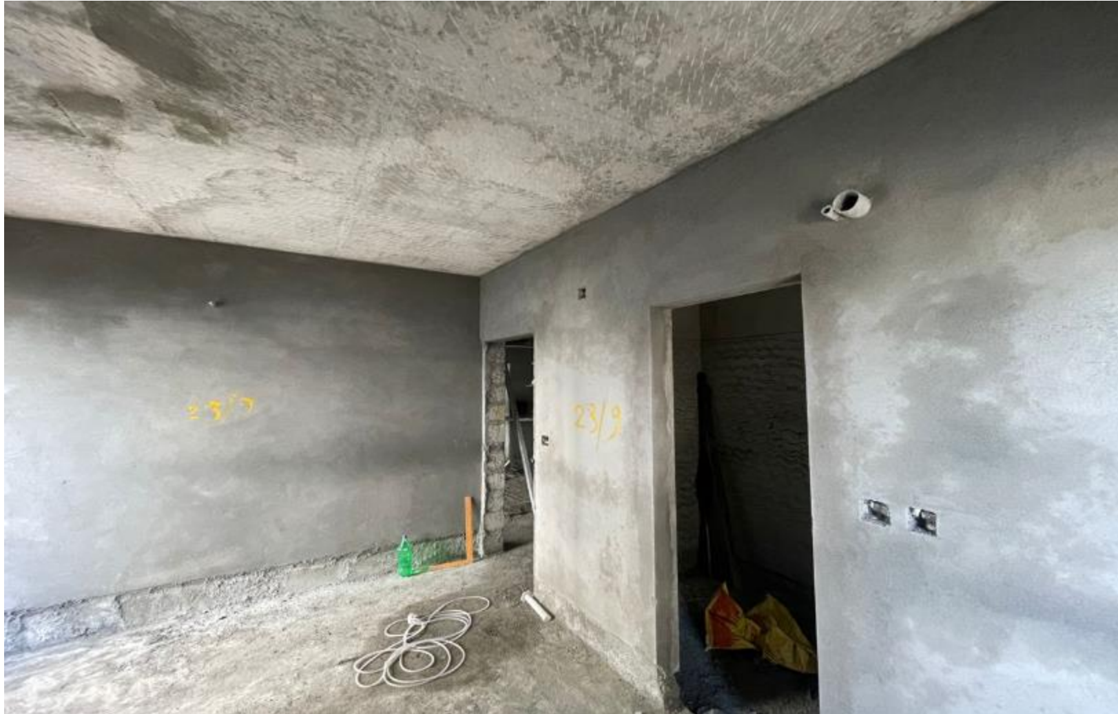
Third floor inner wall plastering work in progress.