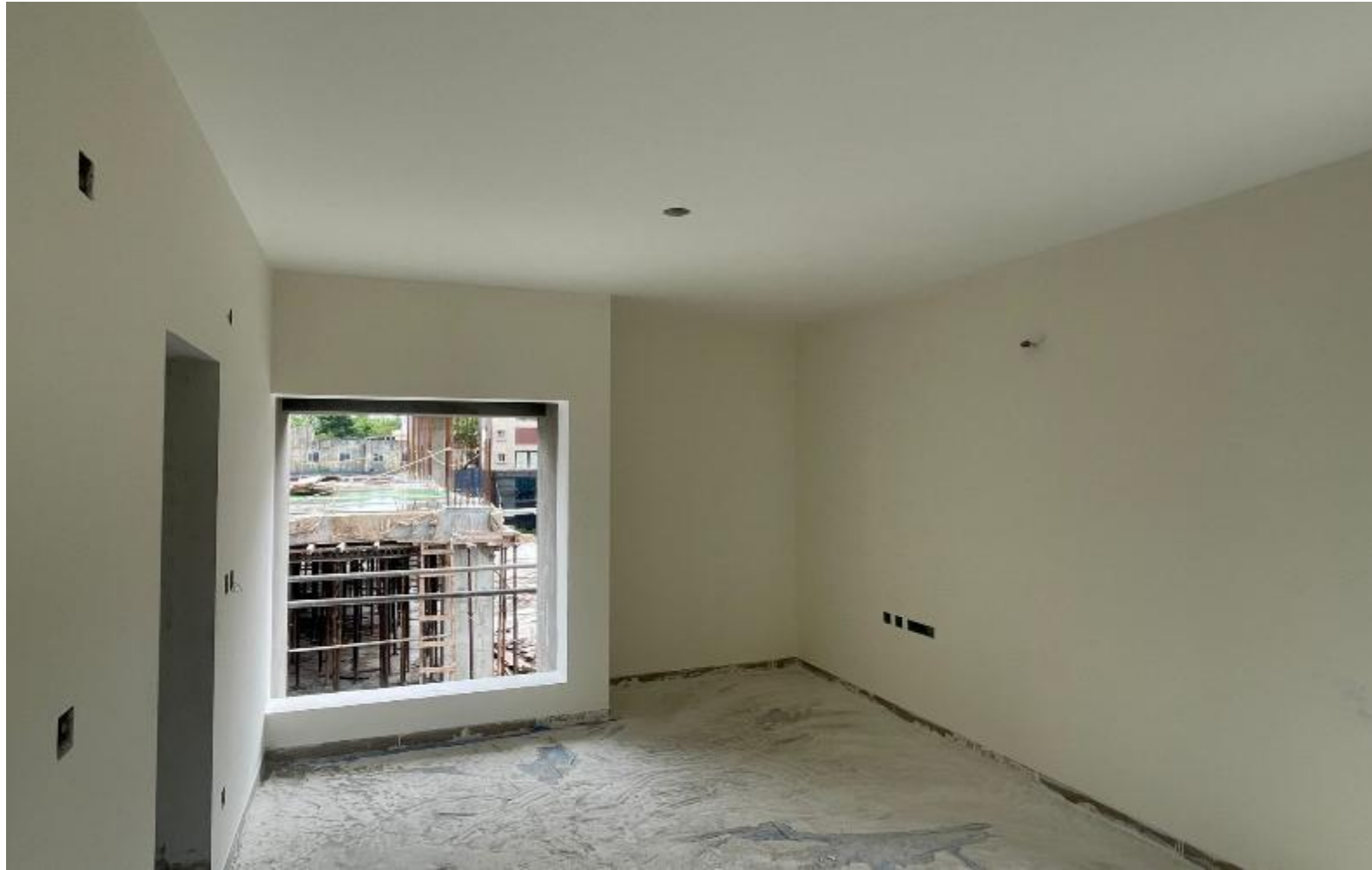
102 Sales Office flat finishing work in progress.