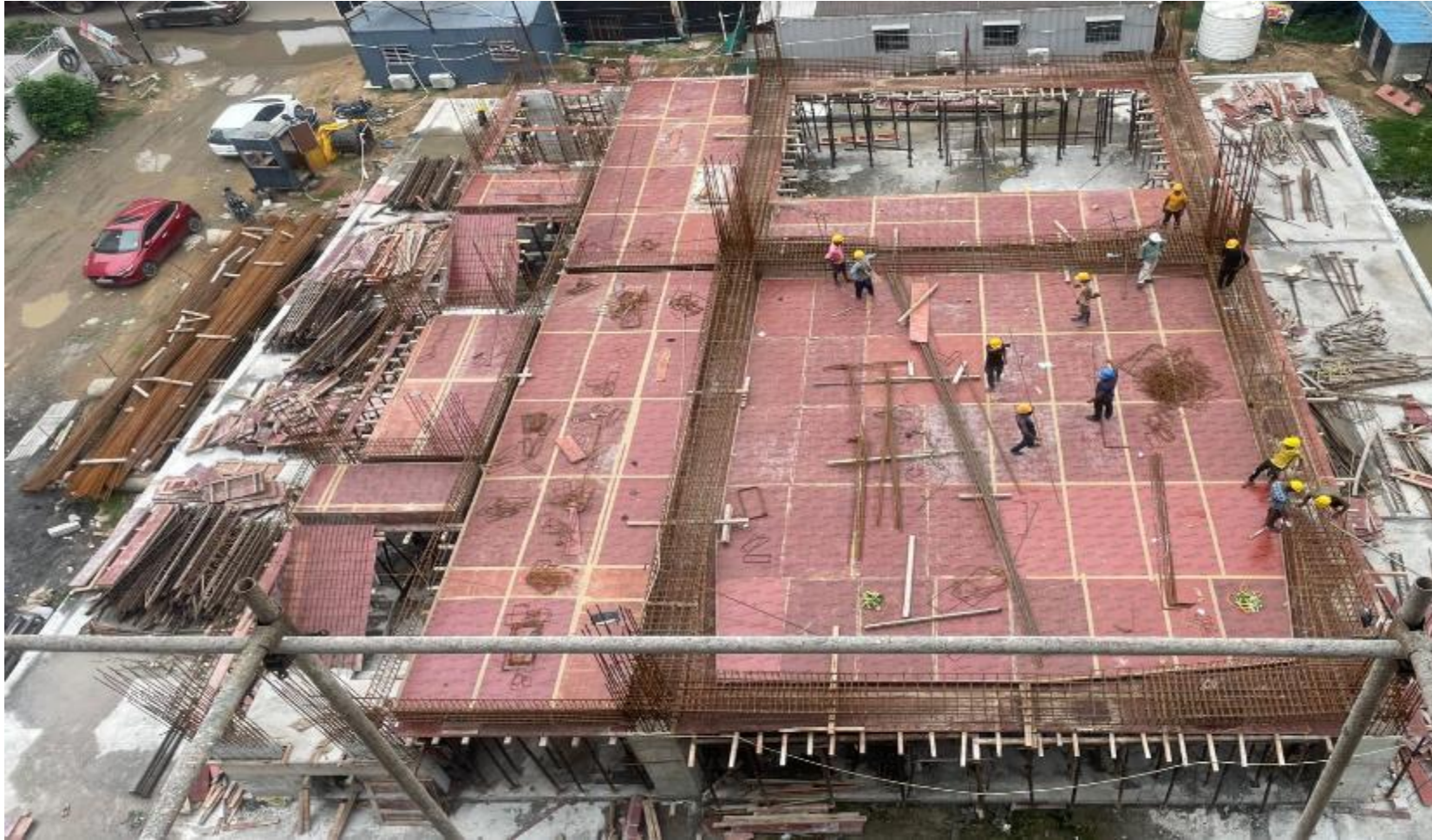
Tower -2 stilt floor roof shuttering work completed .