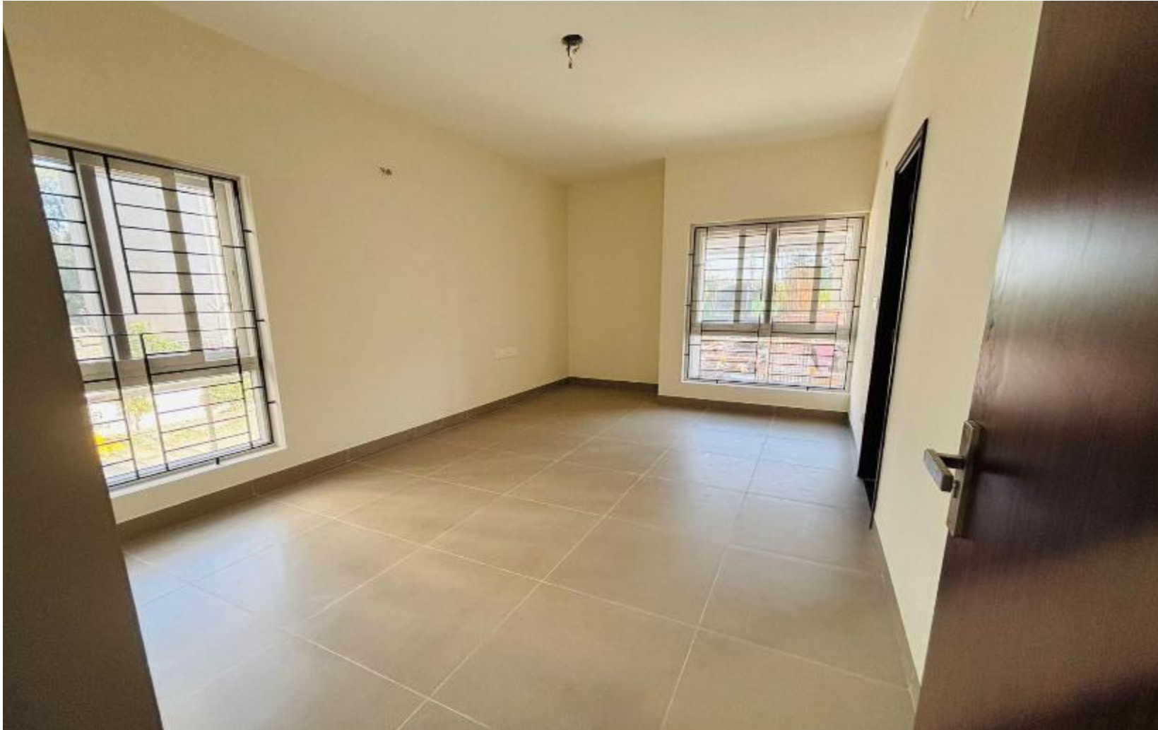
101 Mock up flat finishing work completed.