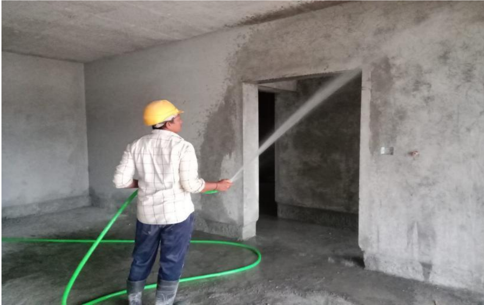
Third floor inner wall plastering curing work in progress.