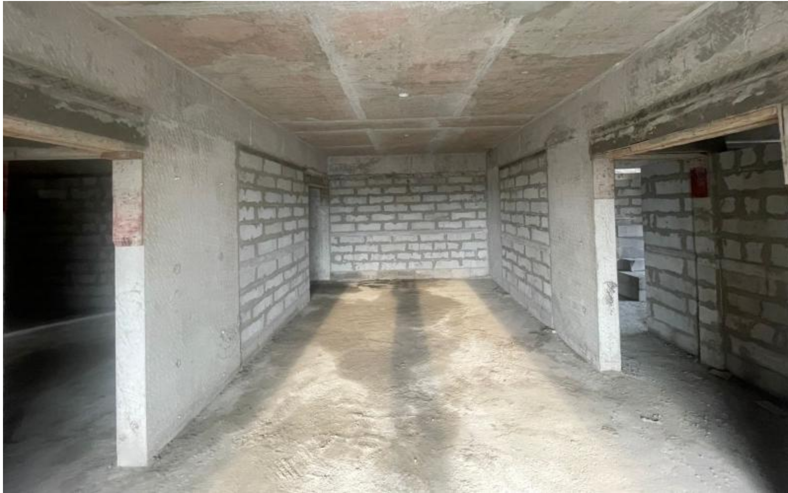
5th Floor block work completed.