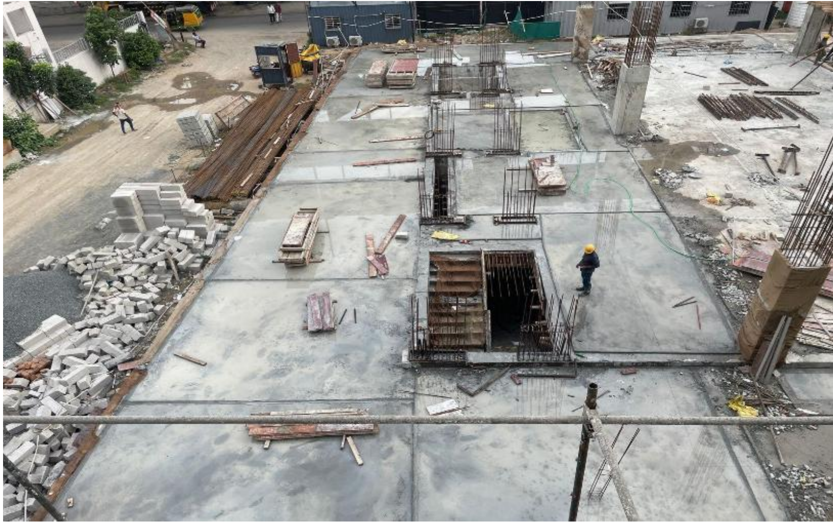
Tower -2 P2 Basement roof curing work completed .