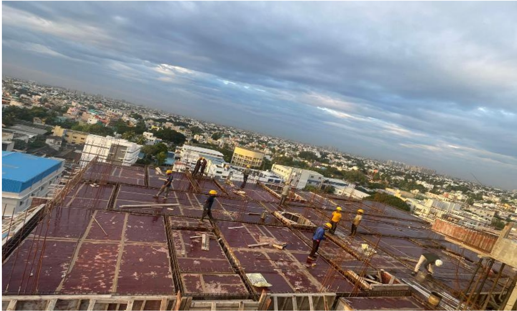
9 th Floor roof shuttering work completed.