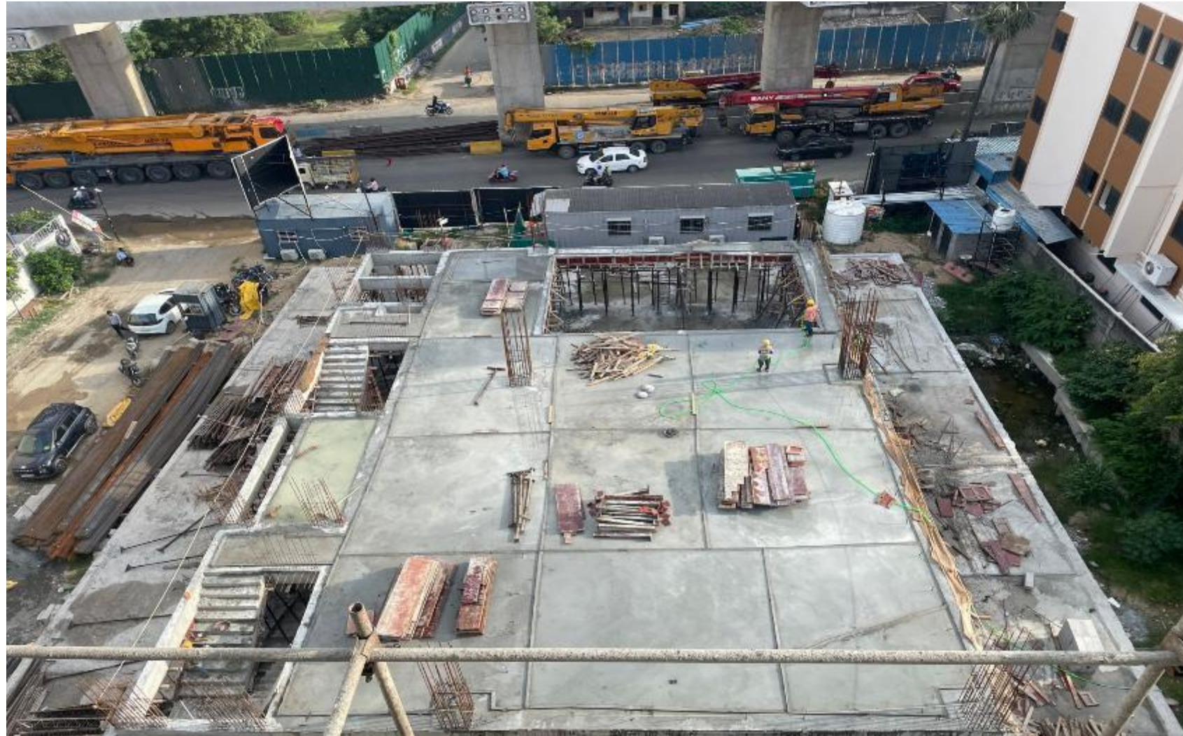
Tower -2 stilt floor roof slab curing work in progress.