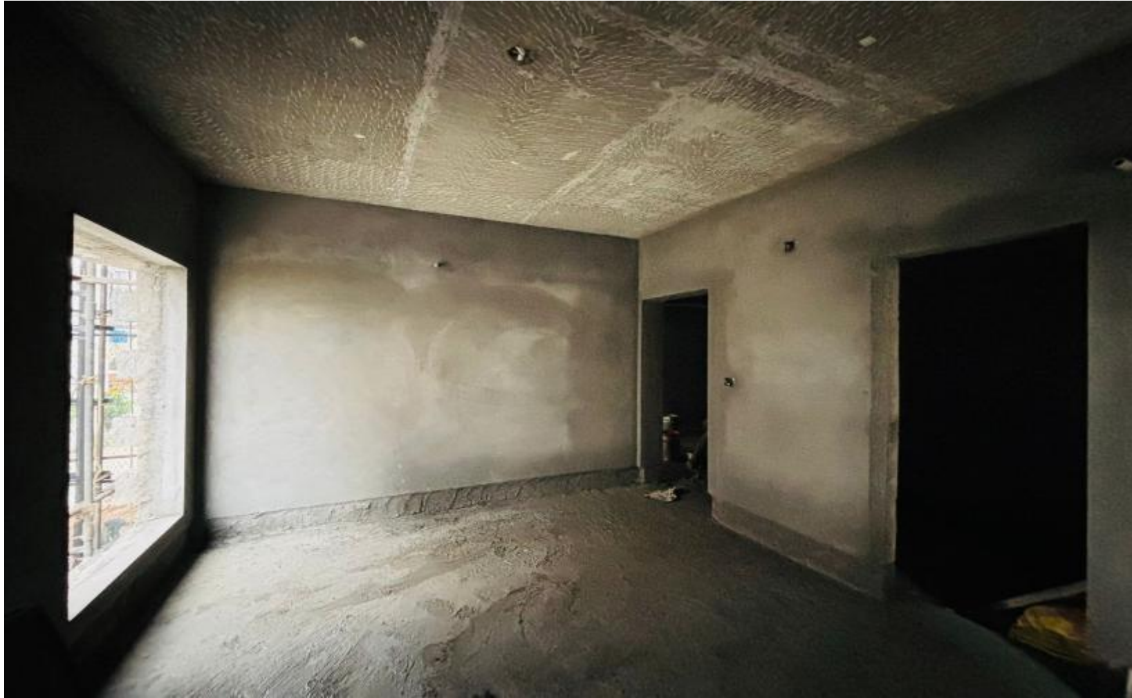
2 nd floor inner wall plastering work completed.