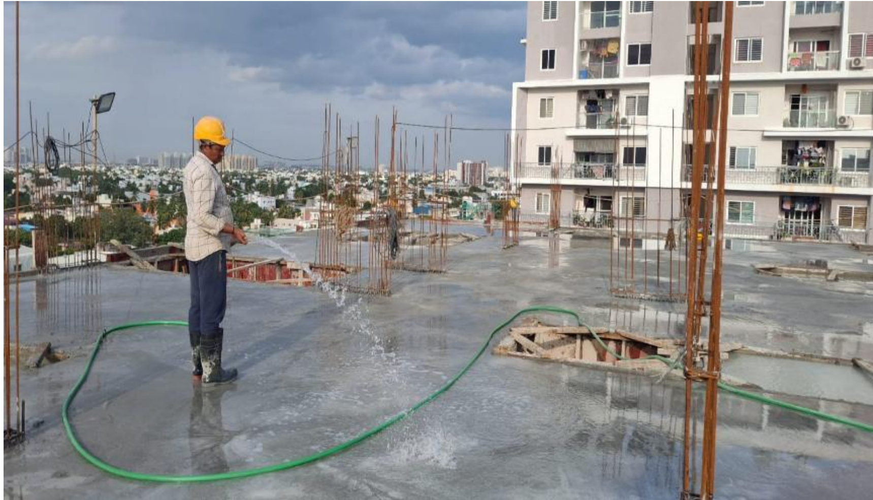
9 th Floor roof curing work in progress.