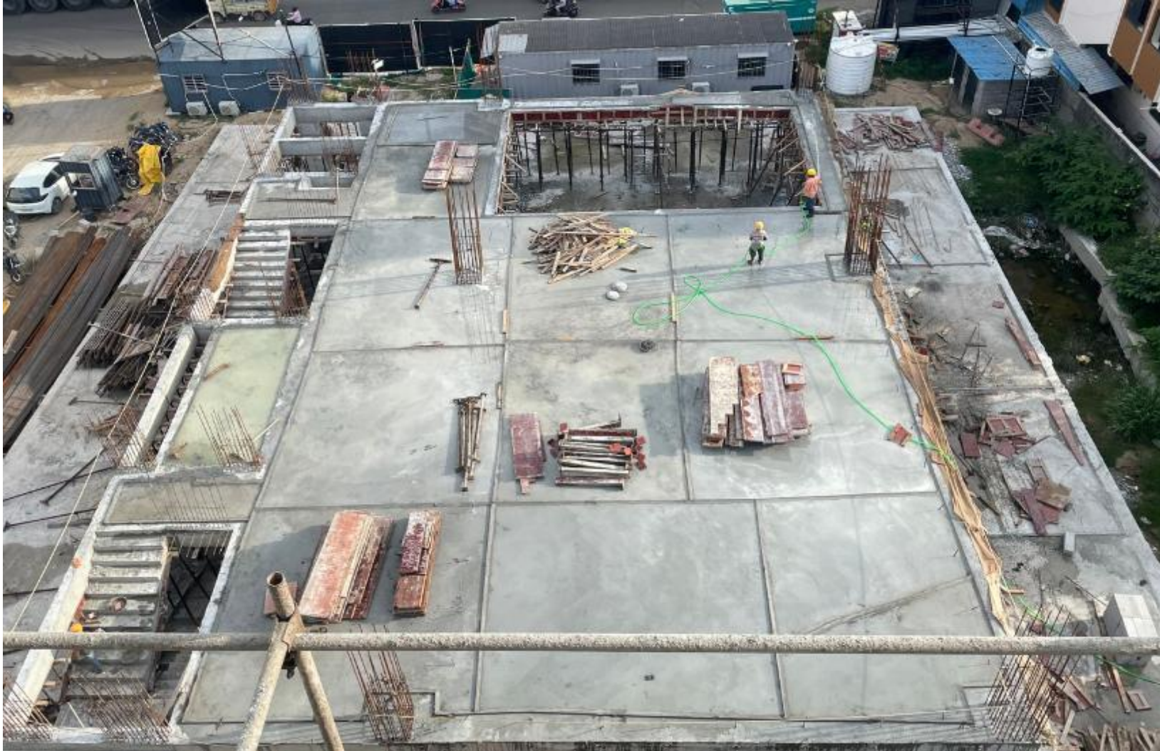
South Side View.