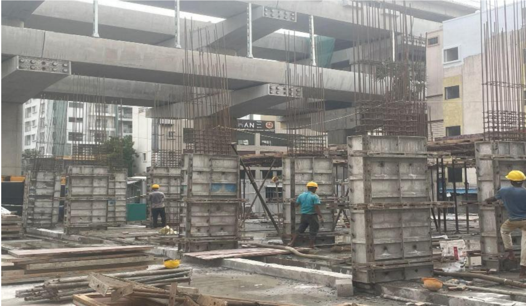
Tower -2 Stilt floor column concrete work completed.