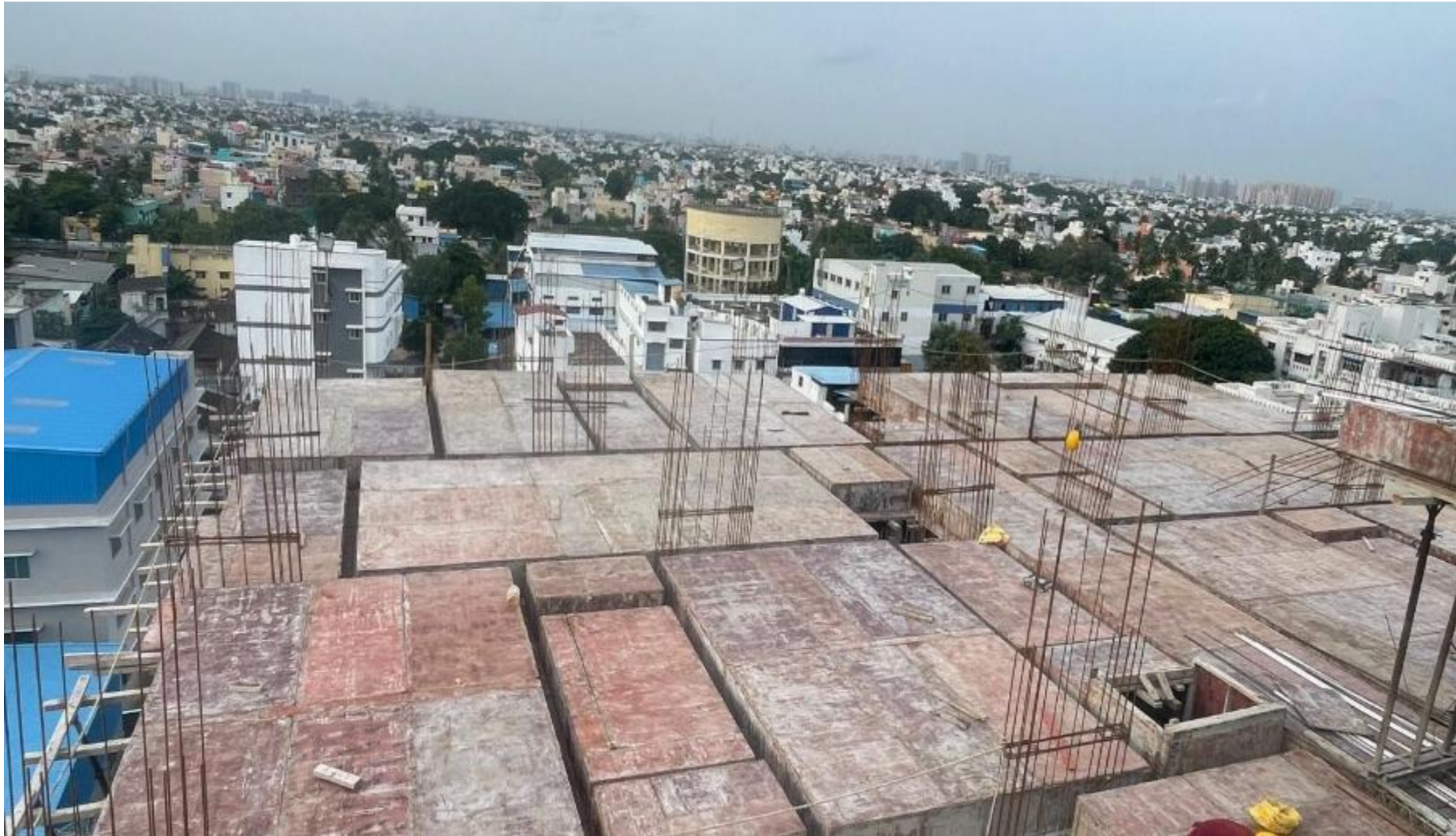
8 th Floor roof slab shuttering work completed.