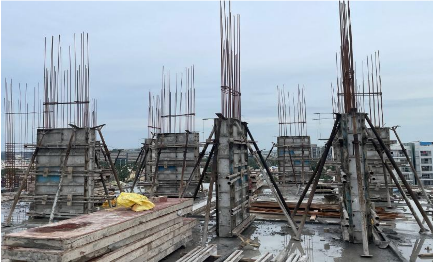
11 th floor column box fixing work in progress.