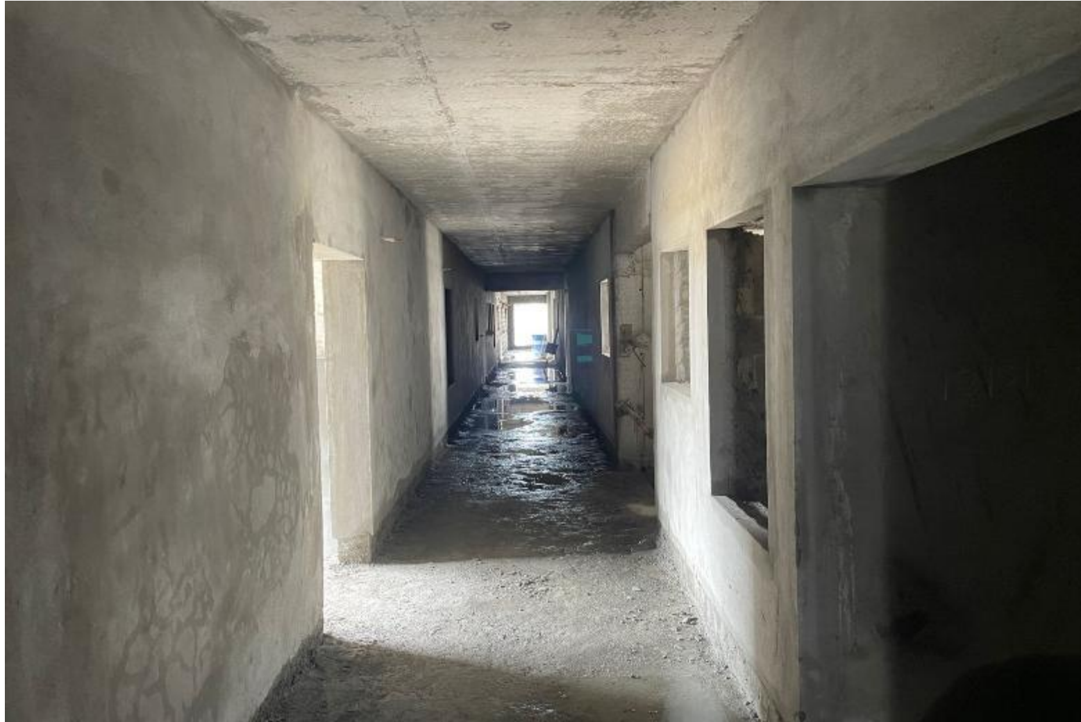
2 nd Floor corridor inner plastering work in progress.