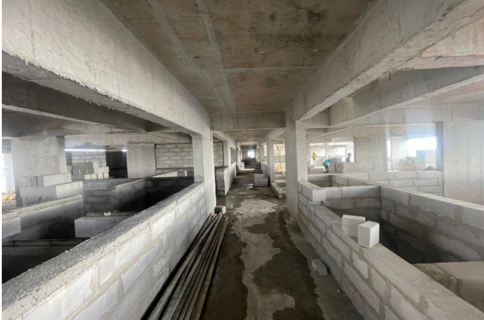
7th Floor block work in progress.