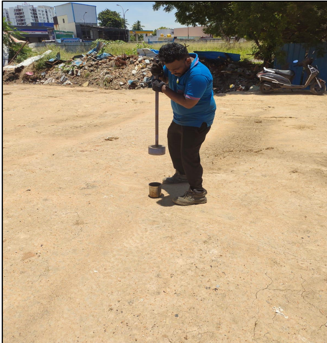
Soil core test has been done.