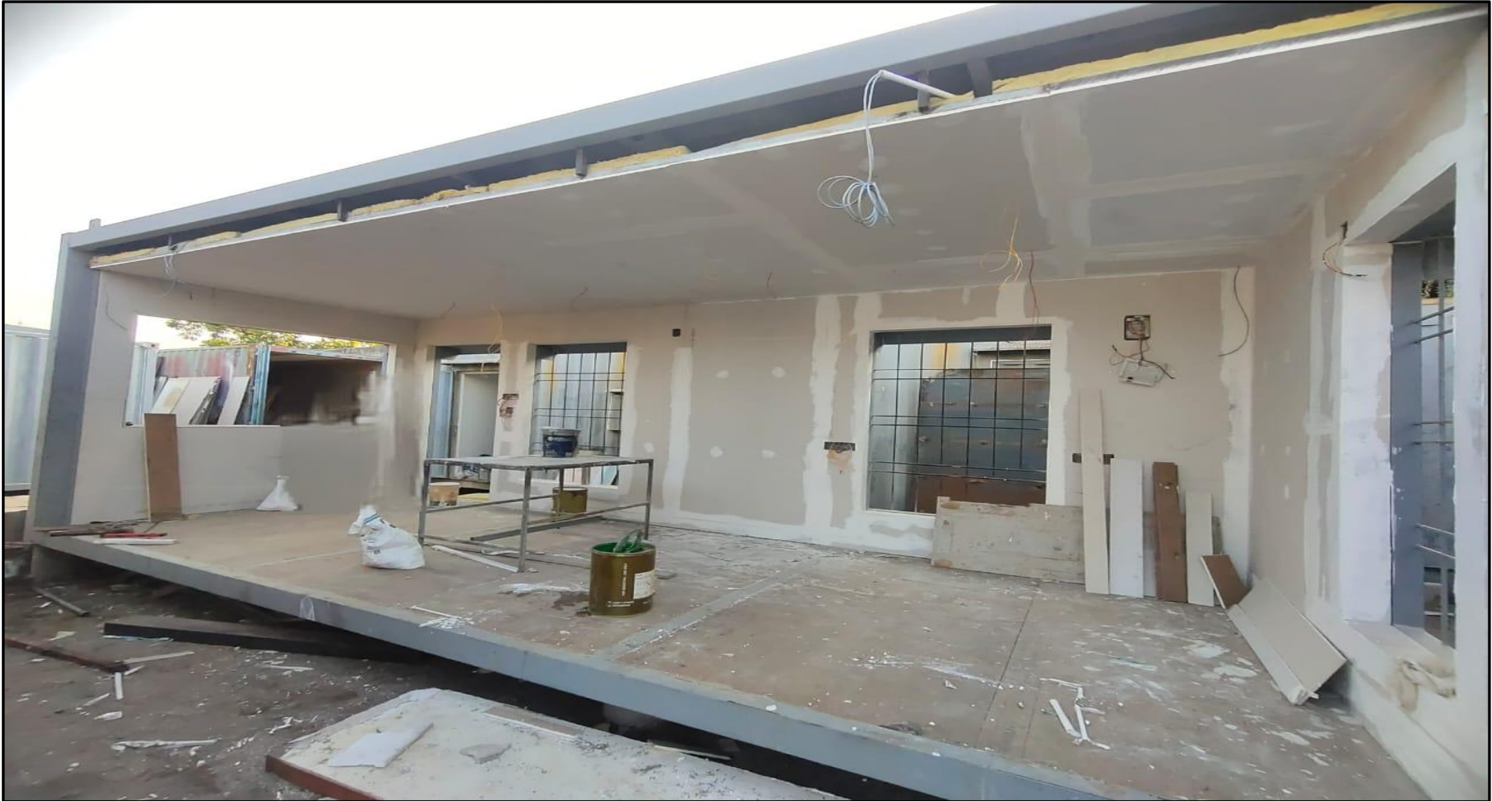
Sales office 1 st Half False ceiling work completed and painting work in progress.