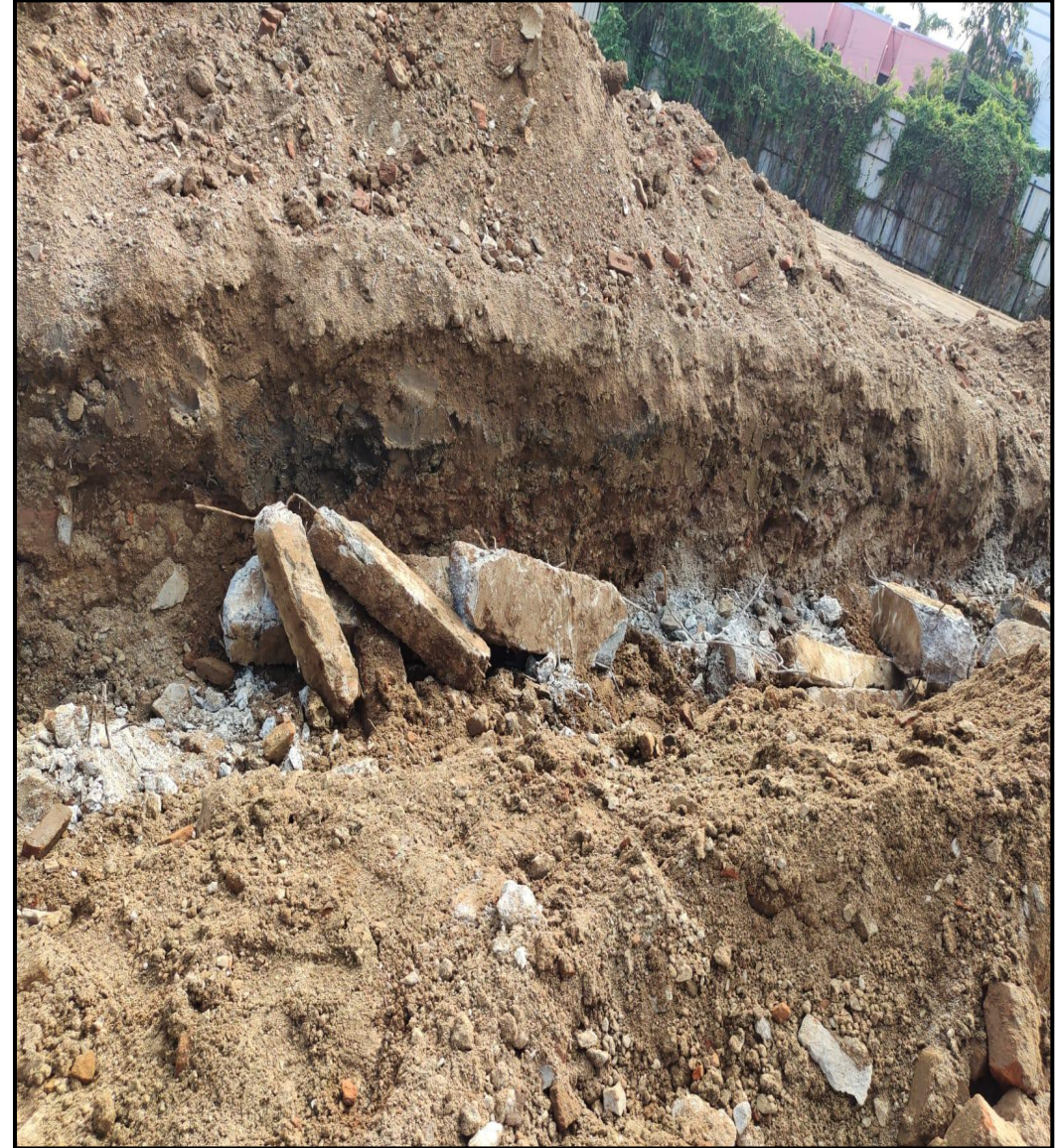
Existing Foundation demolition work in progress