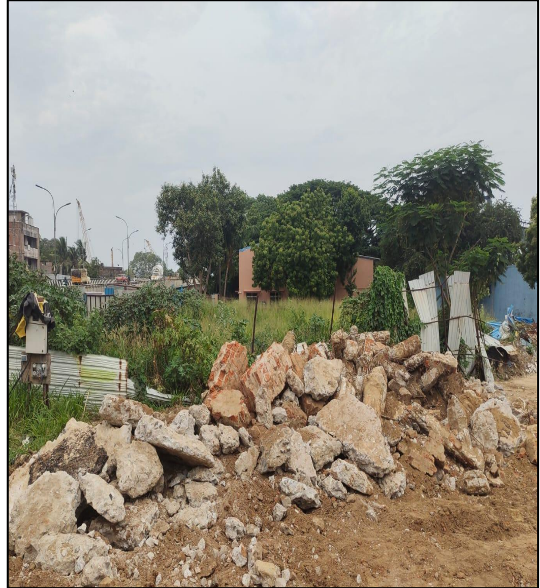
Existing Foundation demolition work in progress