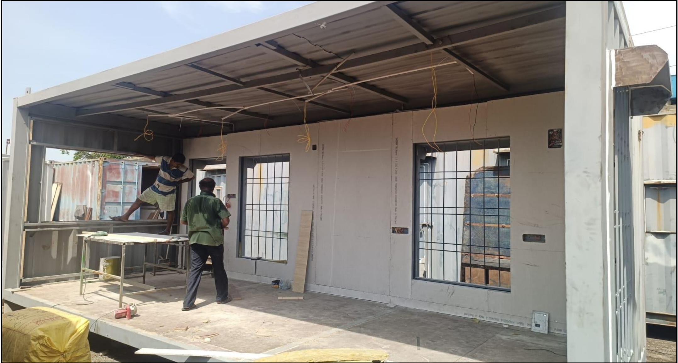
Sales office 1 st Half fabrication and Electrical work in progress