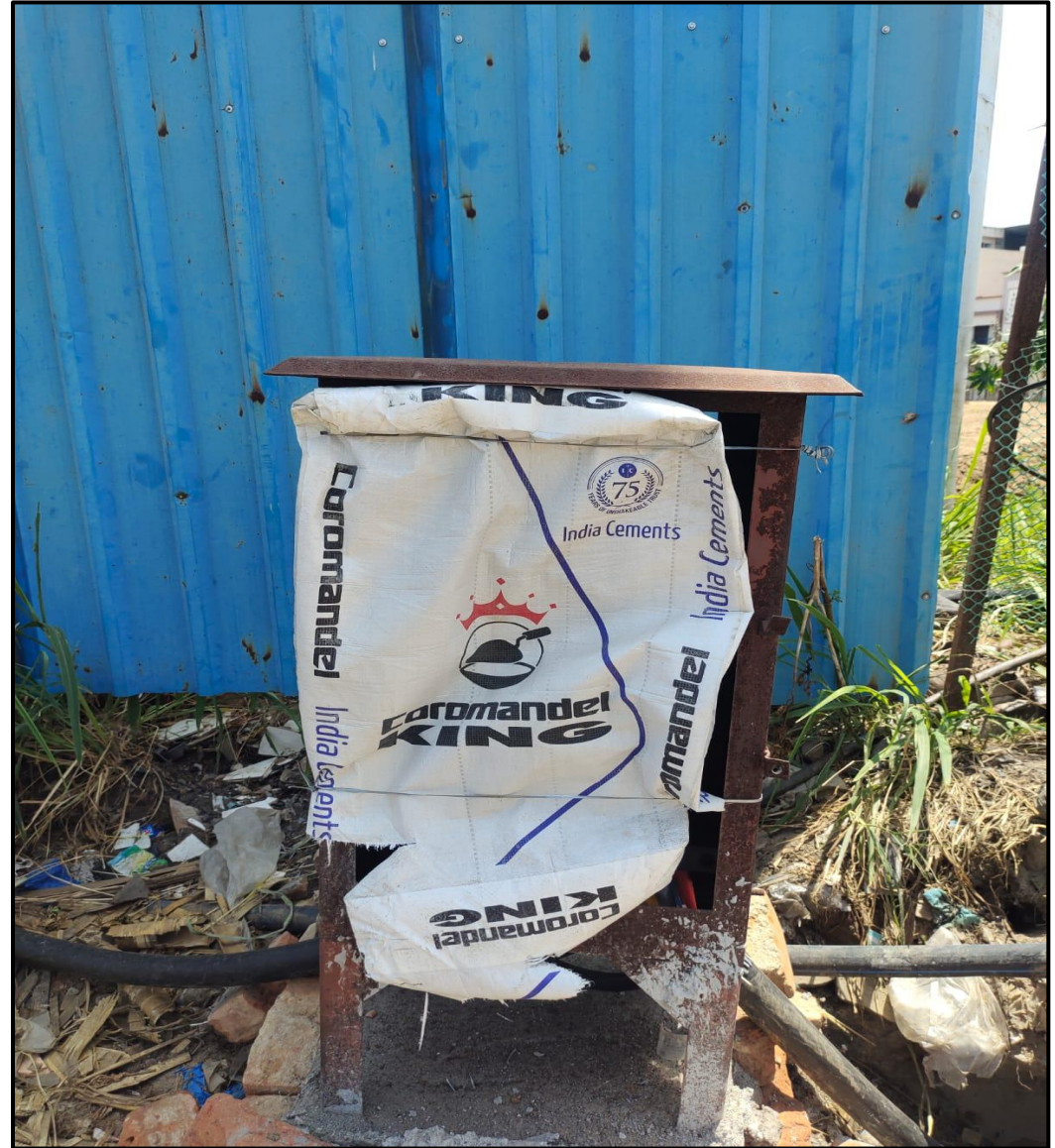
Pillar box has been shifted from Inside the site to Outside for Site Access.