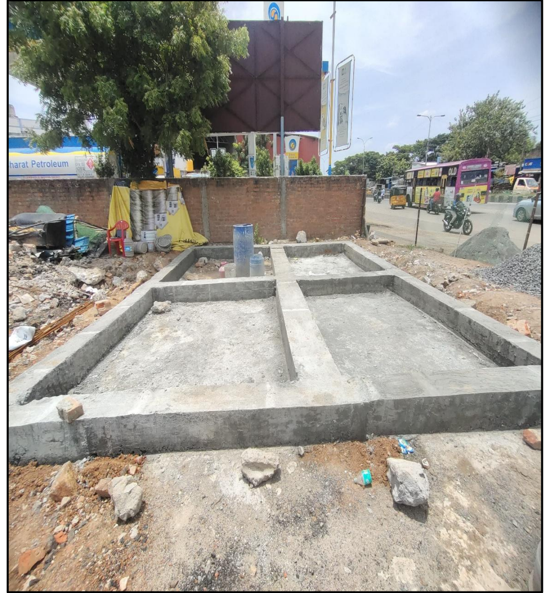
Sales Office Concrete & De-shuttering work completed.