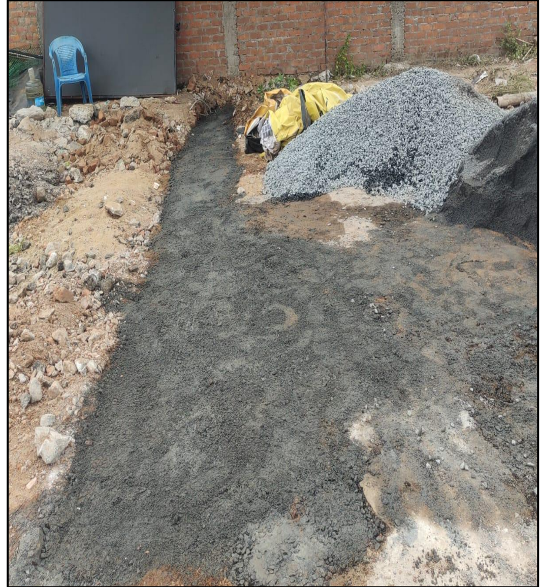
Sales Office Consolidation and PCC work completed.