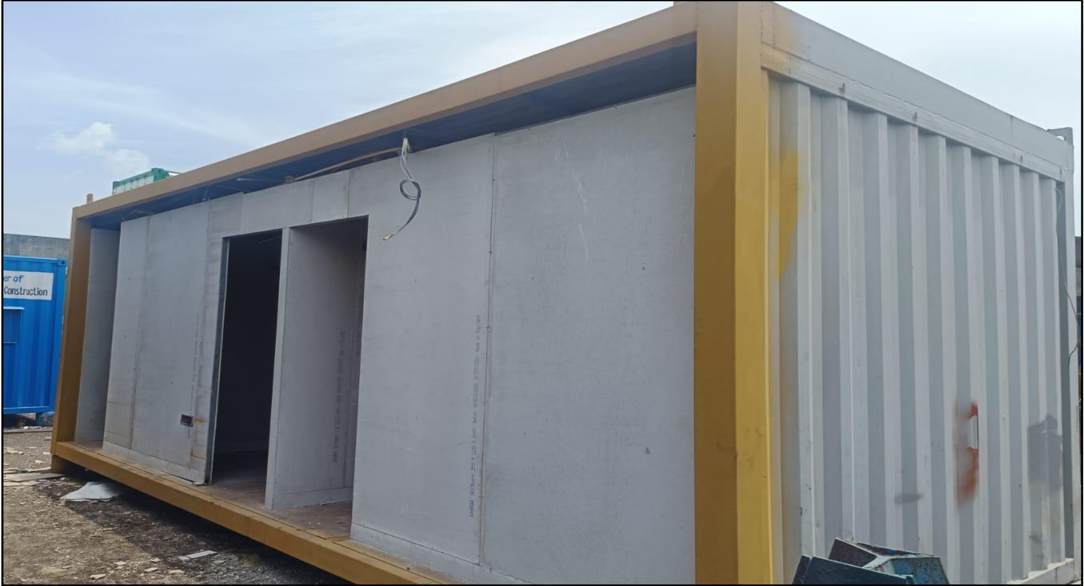
Sales office 2 nd Half Wall Panelling work completed.