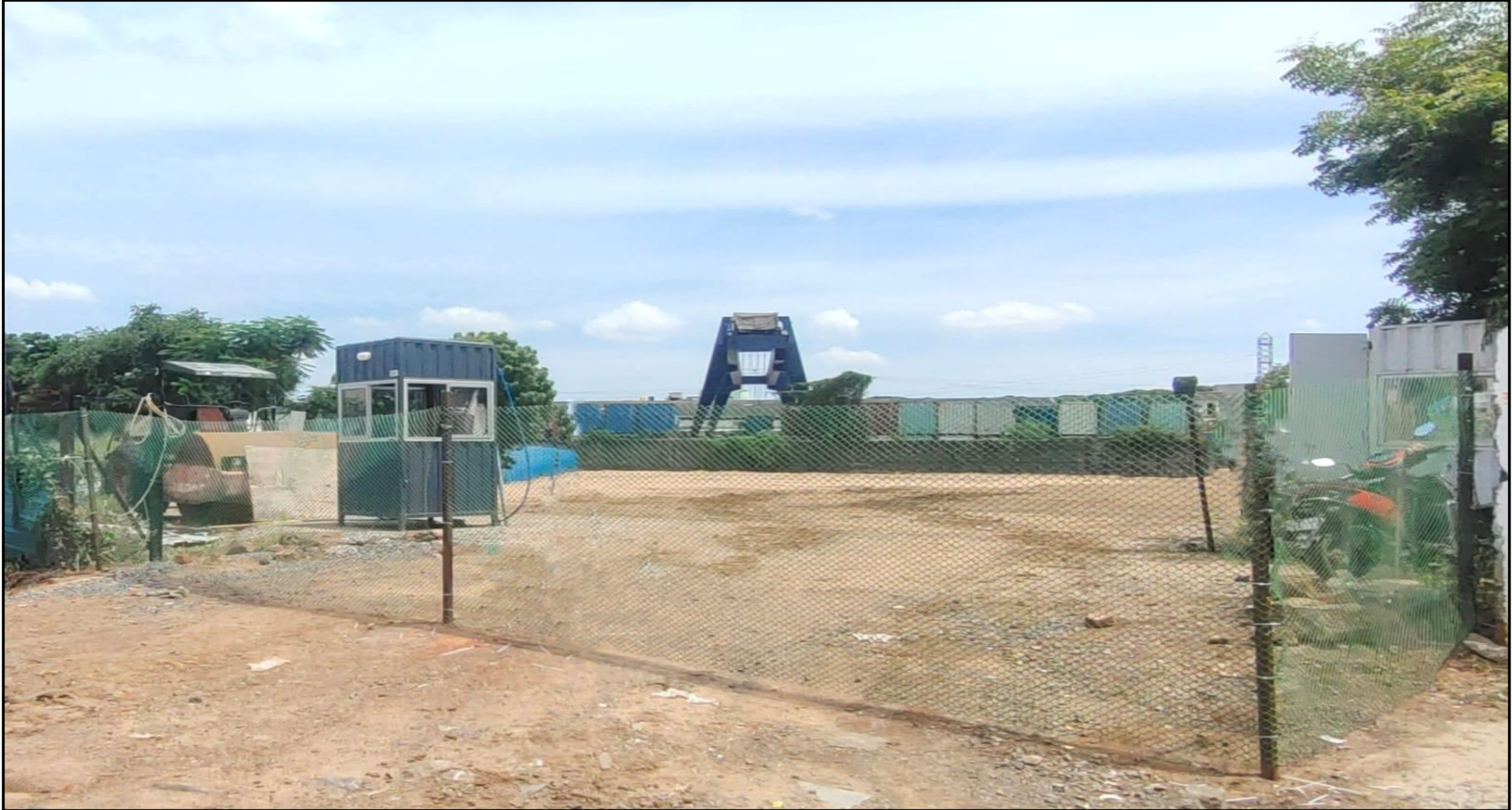
Fencing work for the street alignment has been completed.