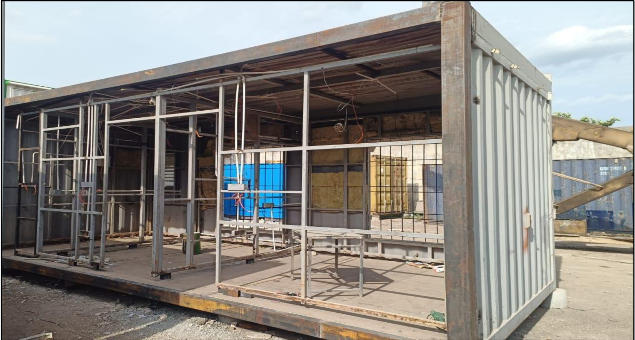
Sales office 2 nd Half Refabrication work & Wiring work completed.