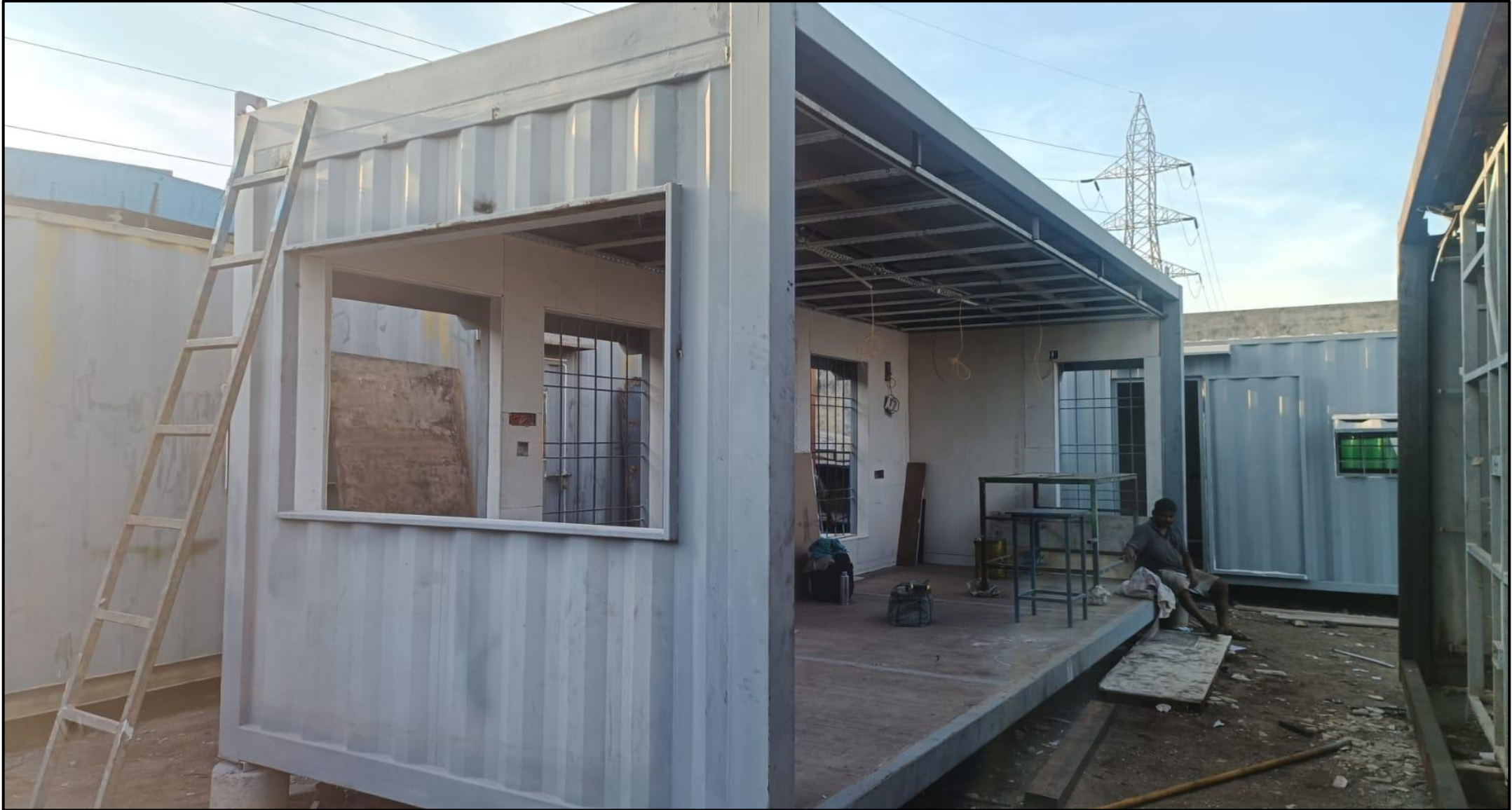
Sales office 1 st Half Panelling and False ceiling channel work in progress