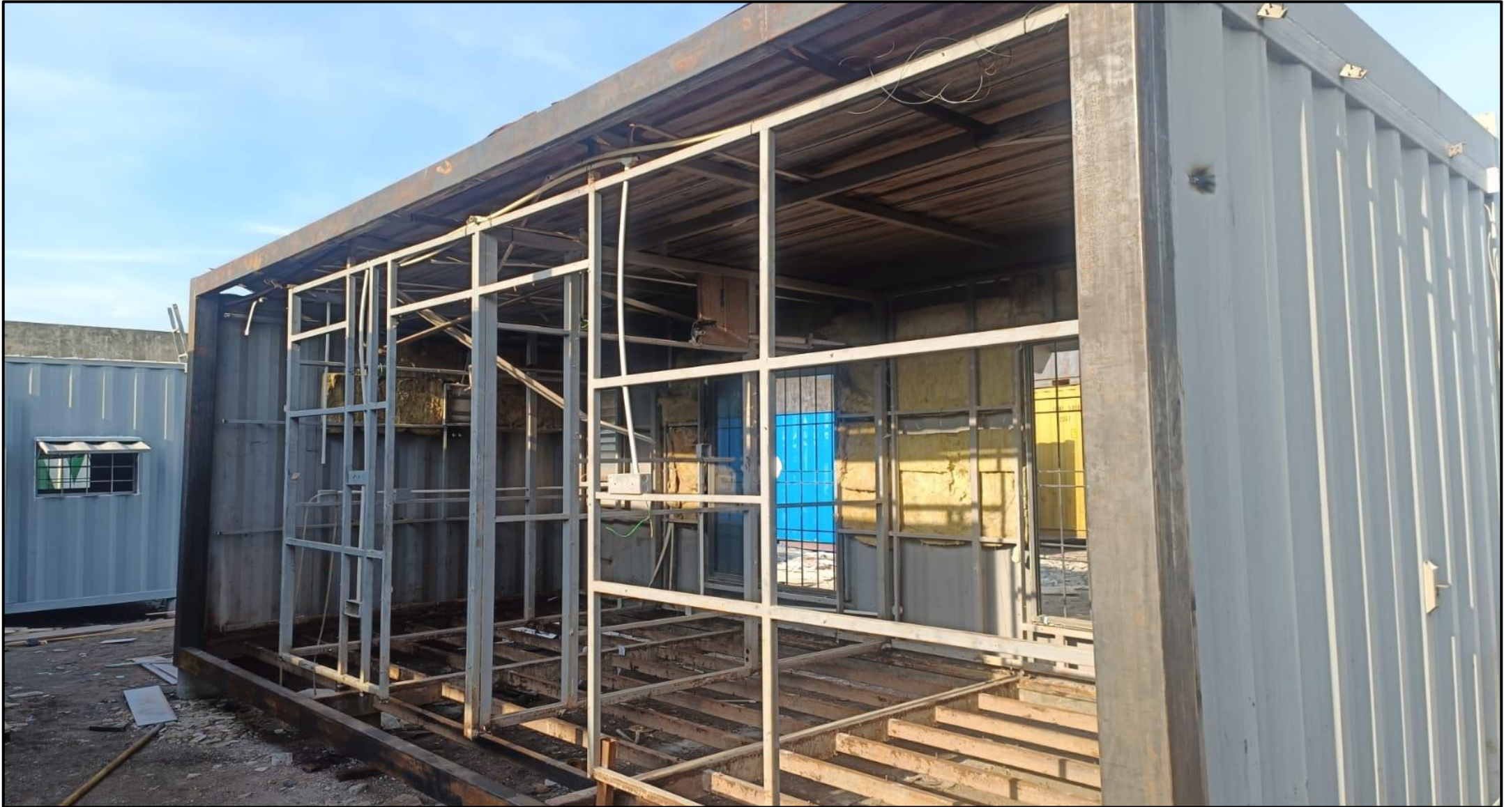
Sales office 2 nd Half Refabrication work in progress