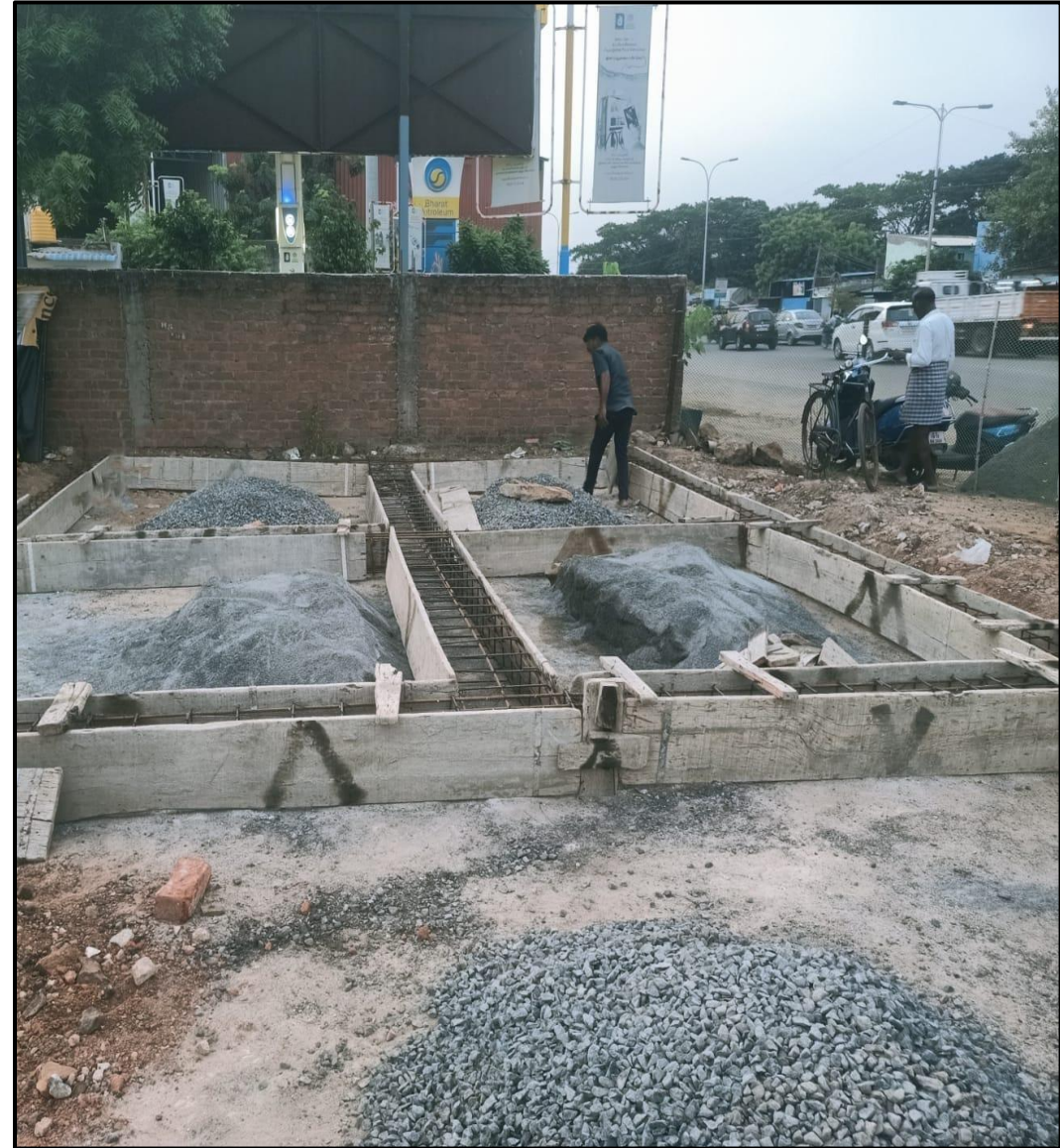
Sales Office Plinth beam Reinforcement & Shuttering work completed.