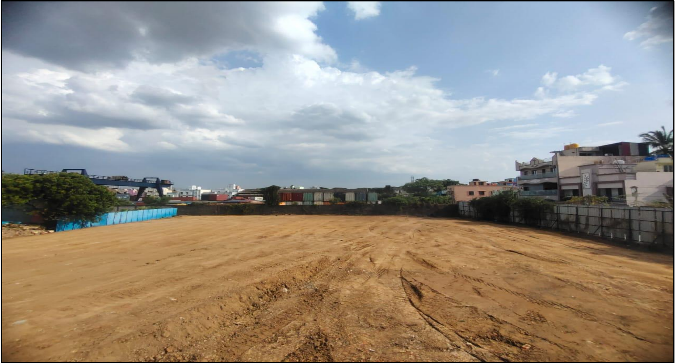
Filling work 1st level completed