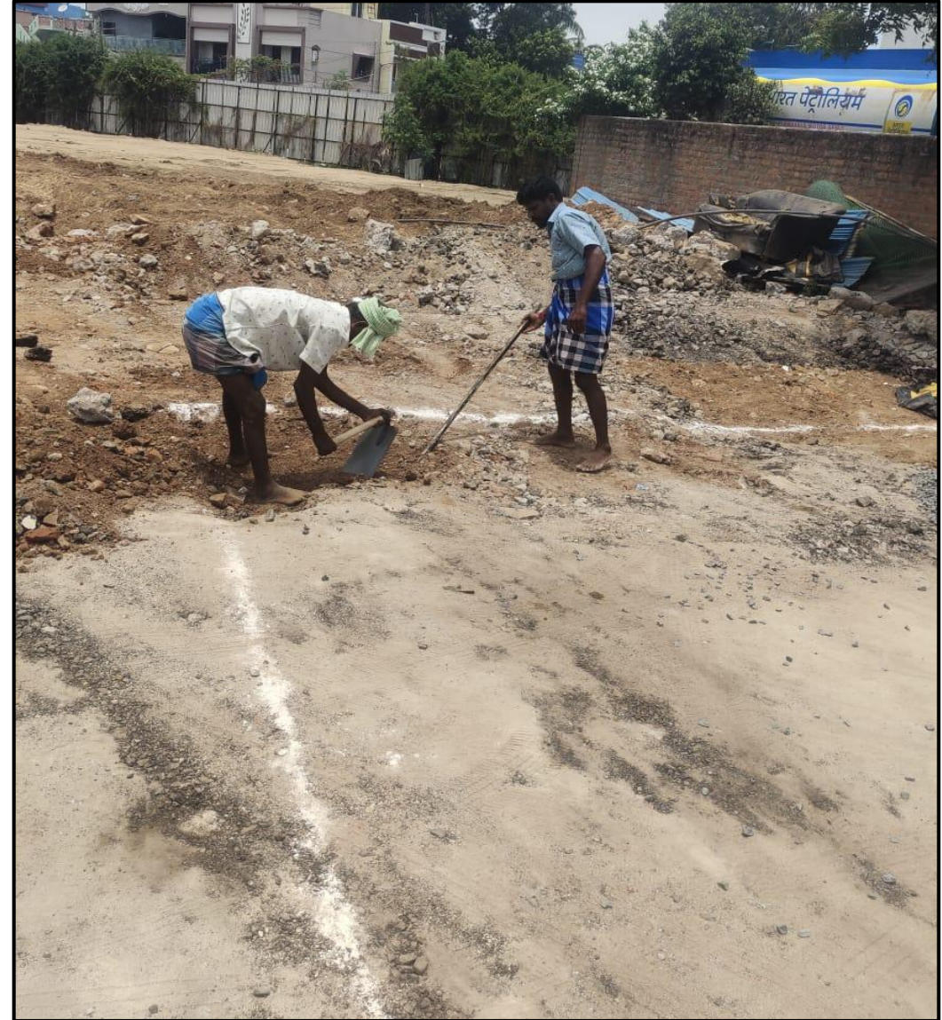
Sales Office Marking and Excavation work completed.