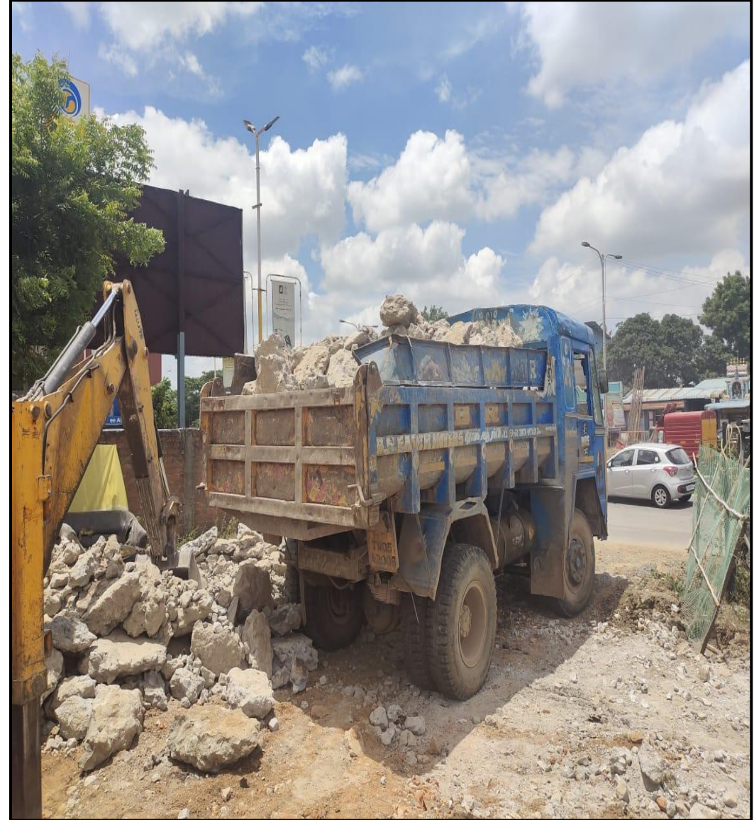
Existing Foundation demolished & debris removed from site.