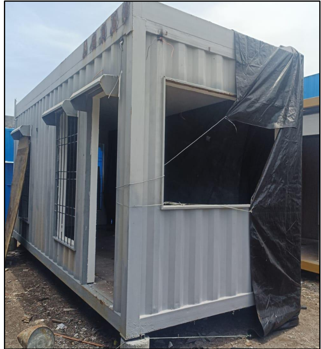
Sales office 1 st Half painting work in progress.