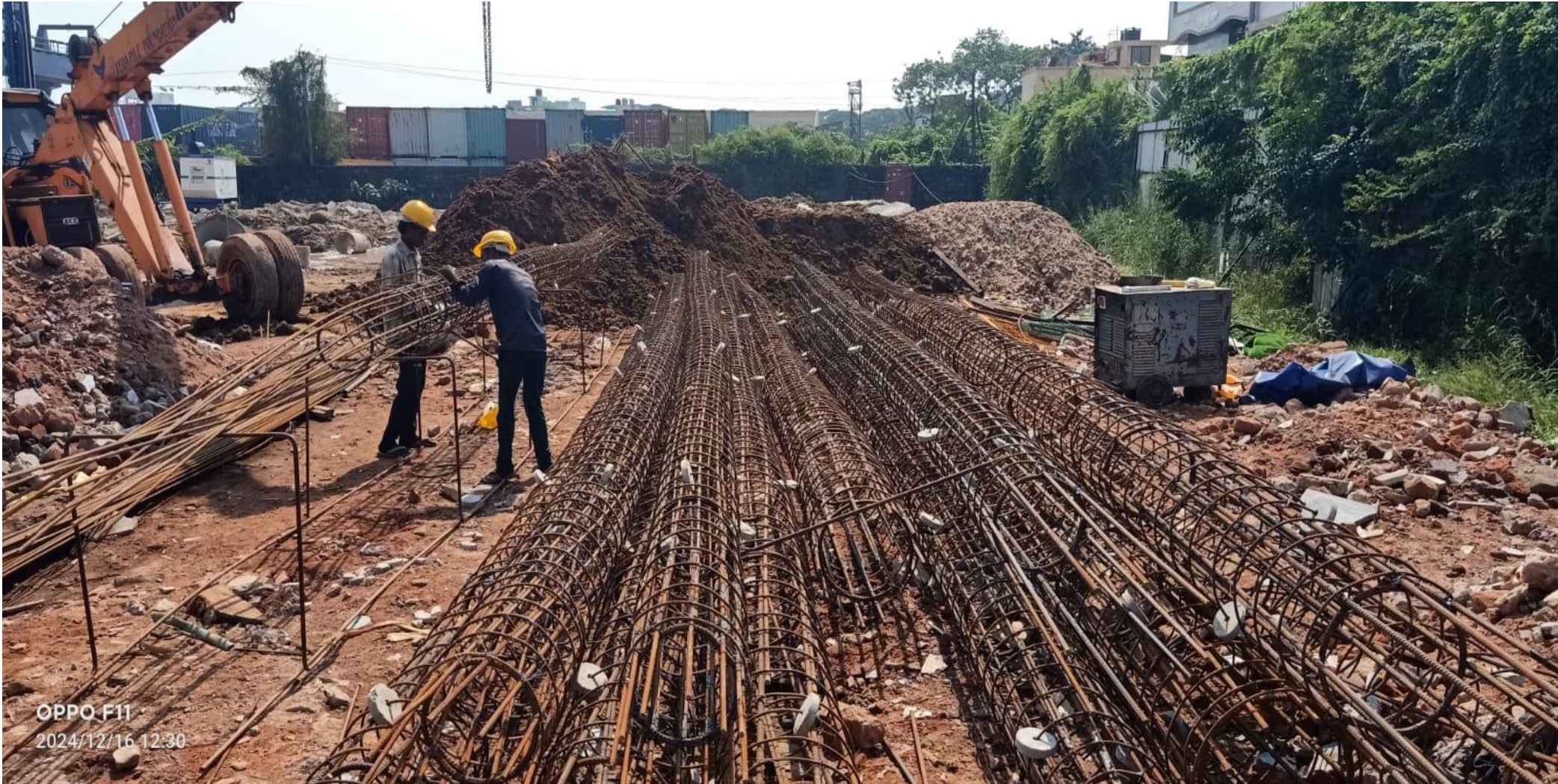
DRA Polaris - Piling Reinforcement work in progress - 169/182 Nos completed