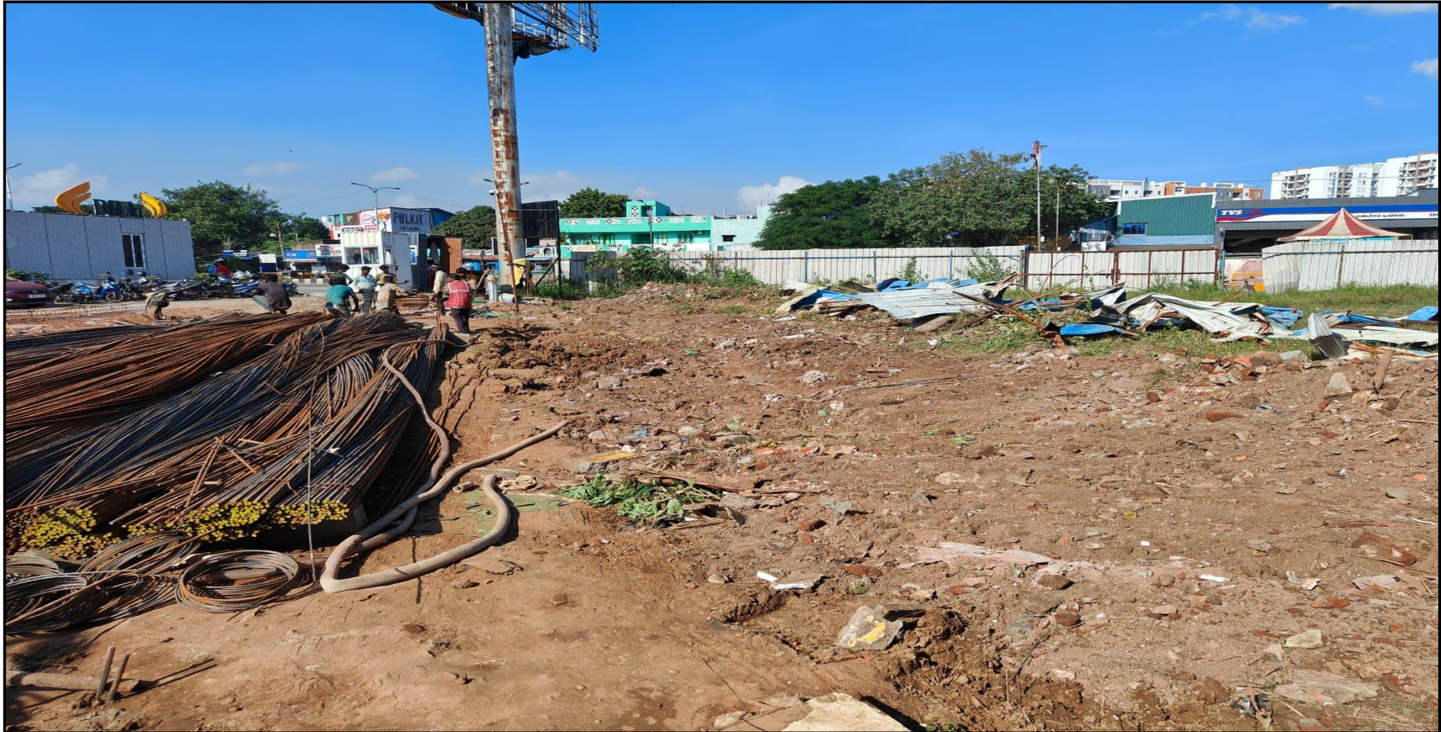
Soil and bushes cutting & levelling work in progress at east side boundary.