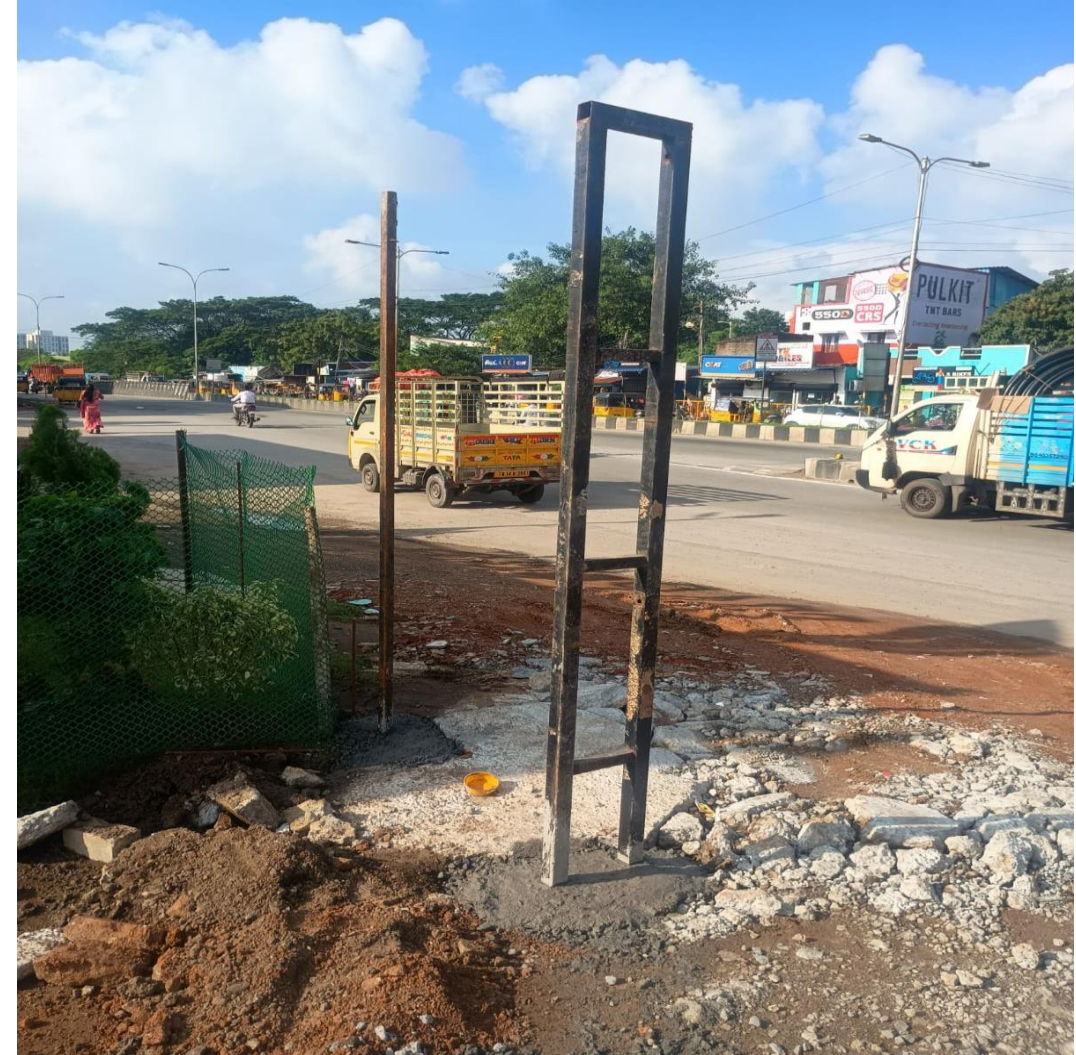
Temporary Gate vertical post concrete work completed