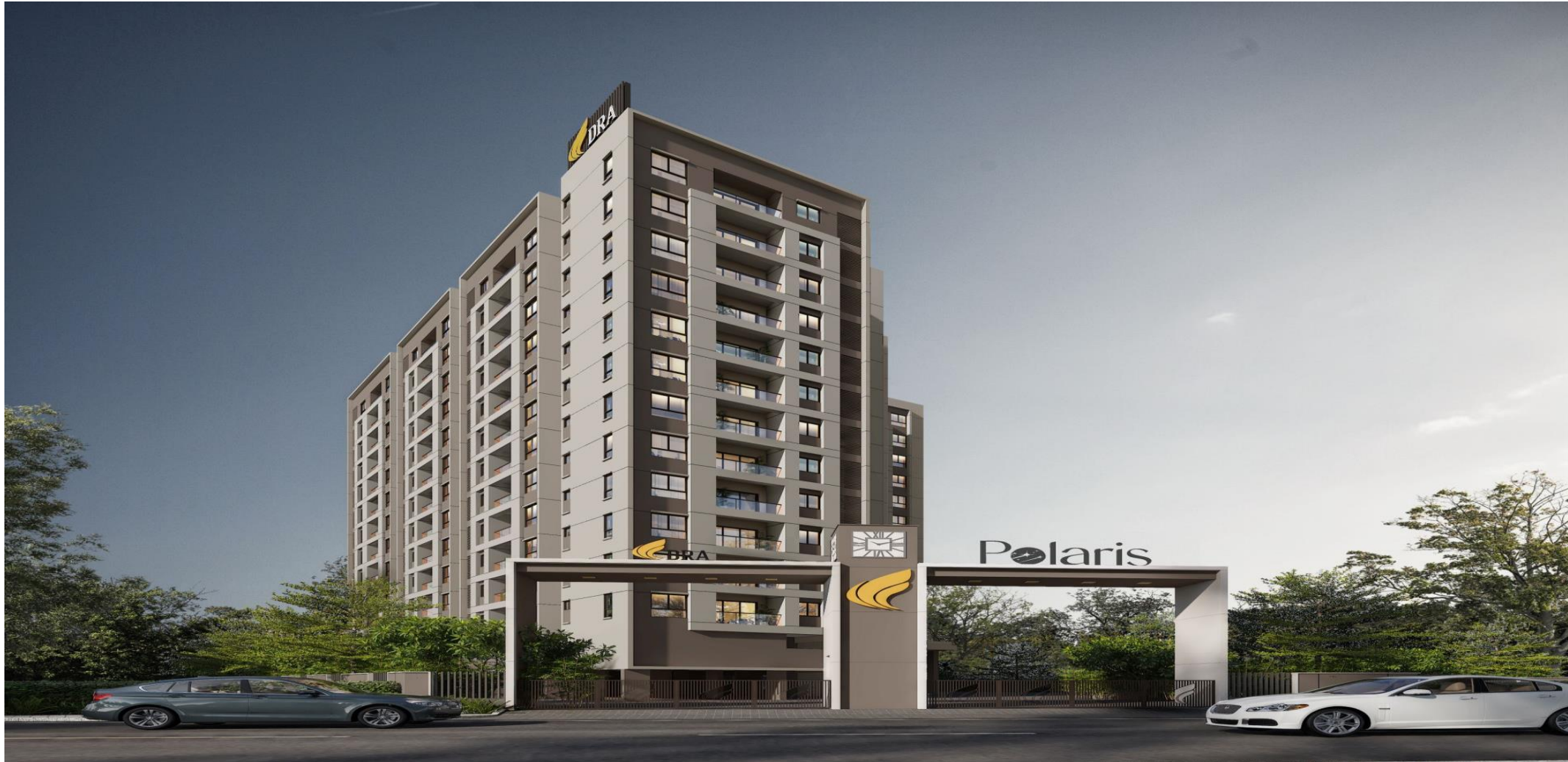
DRA POLARIS Construction updates photos – December 2024