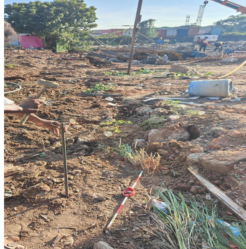
Compound wall pile boring commencement work in progress