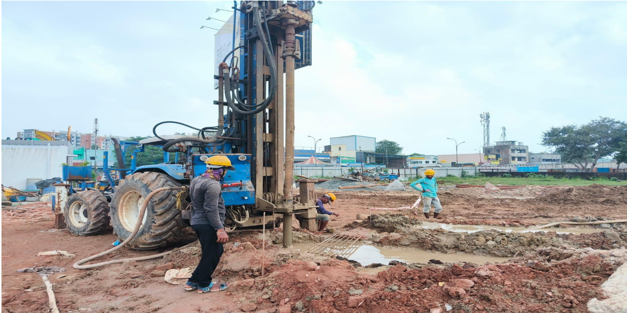
DRA Polaris - Piling Boring work in progress - 169/182 Nos completed