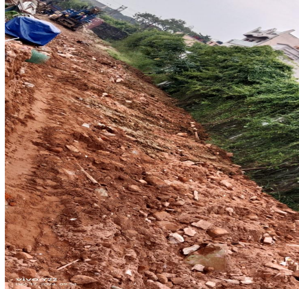
Rubbish and filling soil levelling work completed at amenities block area