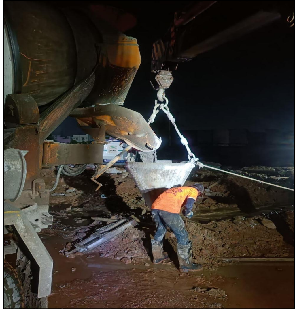
DRA Polaris - Piling concrete work in progress - 169/182 Nos completed