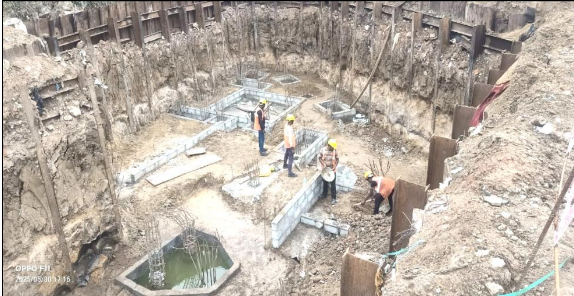
STP – Soil filling at raft level