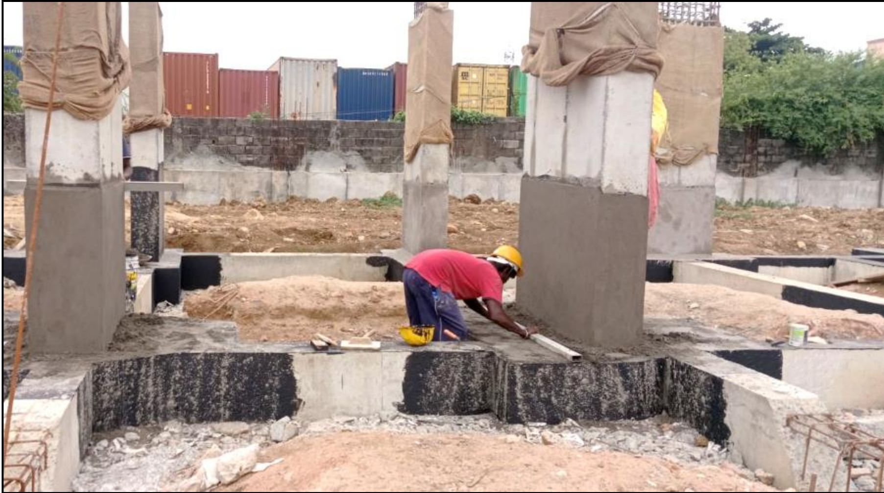
Main building – Pile cap, plinth beam & column DPC work in progress