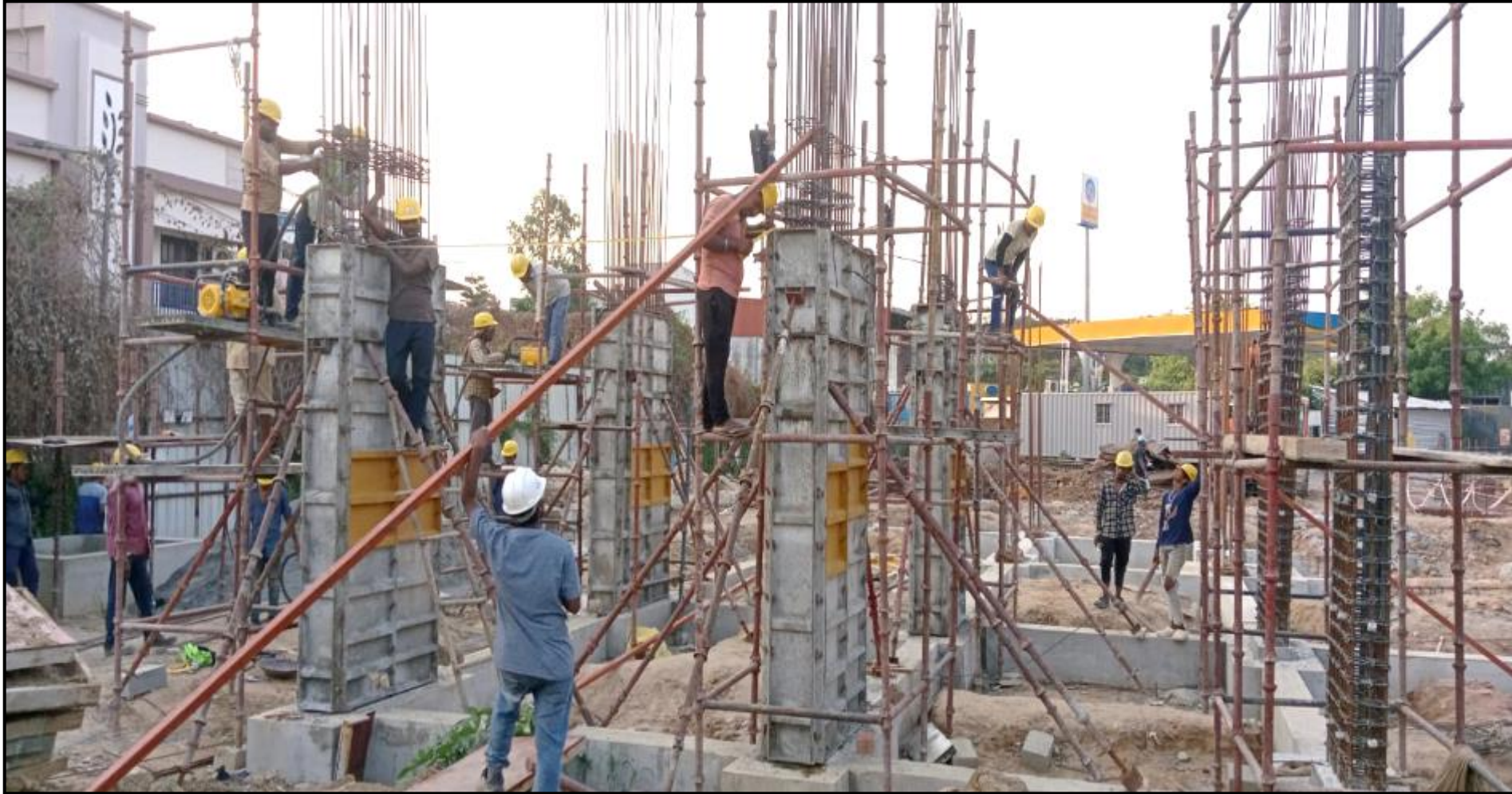
Main building – Column Shuttering work (20/47 no's) completed