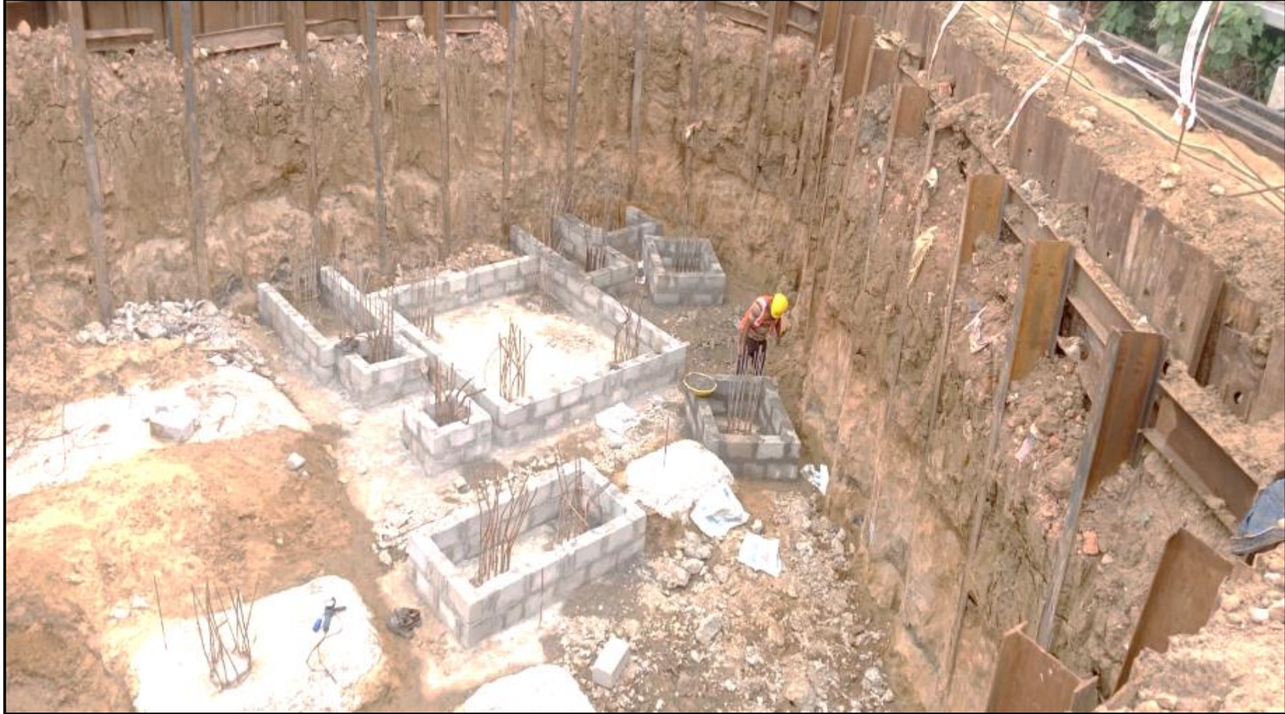
STP - Pile cap block work completed (7/12nos)