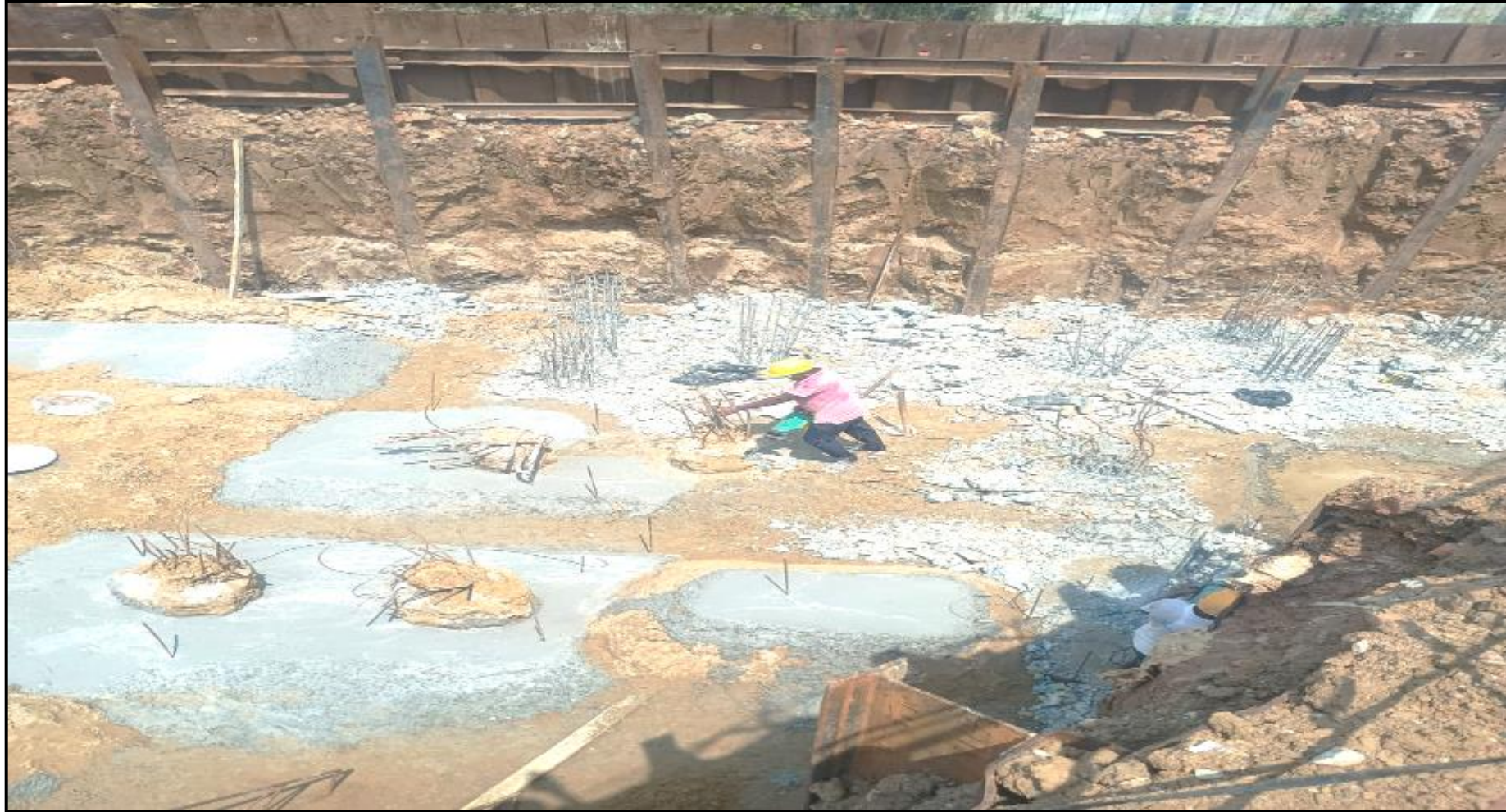
STP – Pile chipping work completed (26/38 nos)