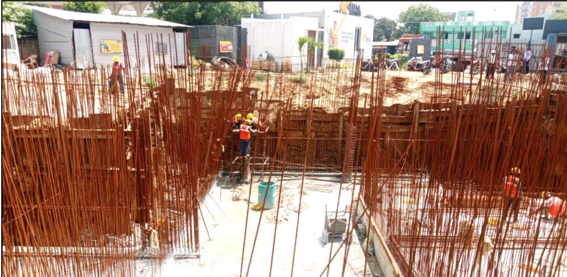
UG Sump – Wall & column reinforcement work in progress