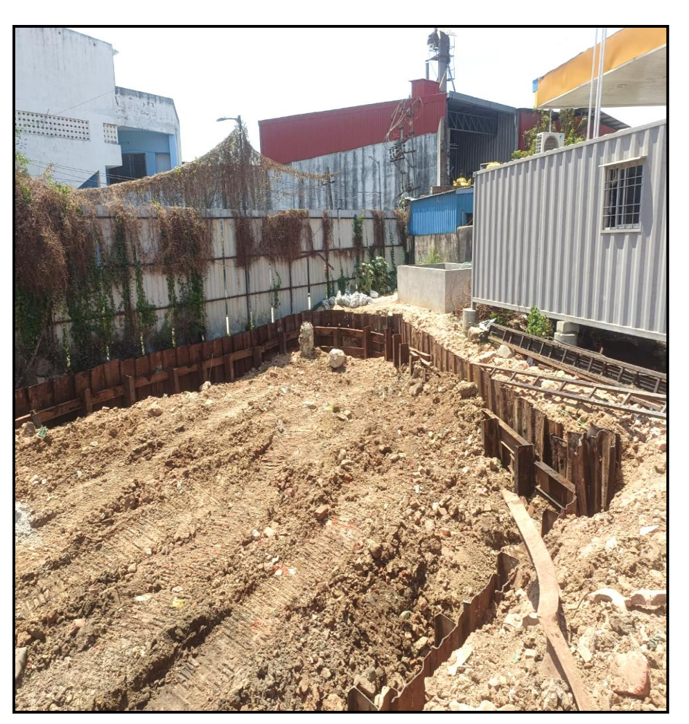
STP – Shoring work completed (74.5/74.5m)