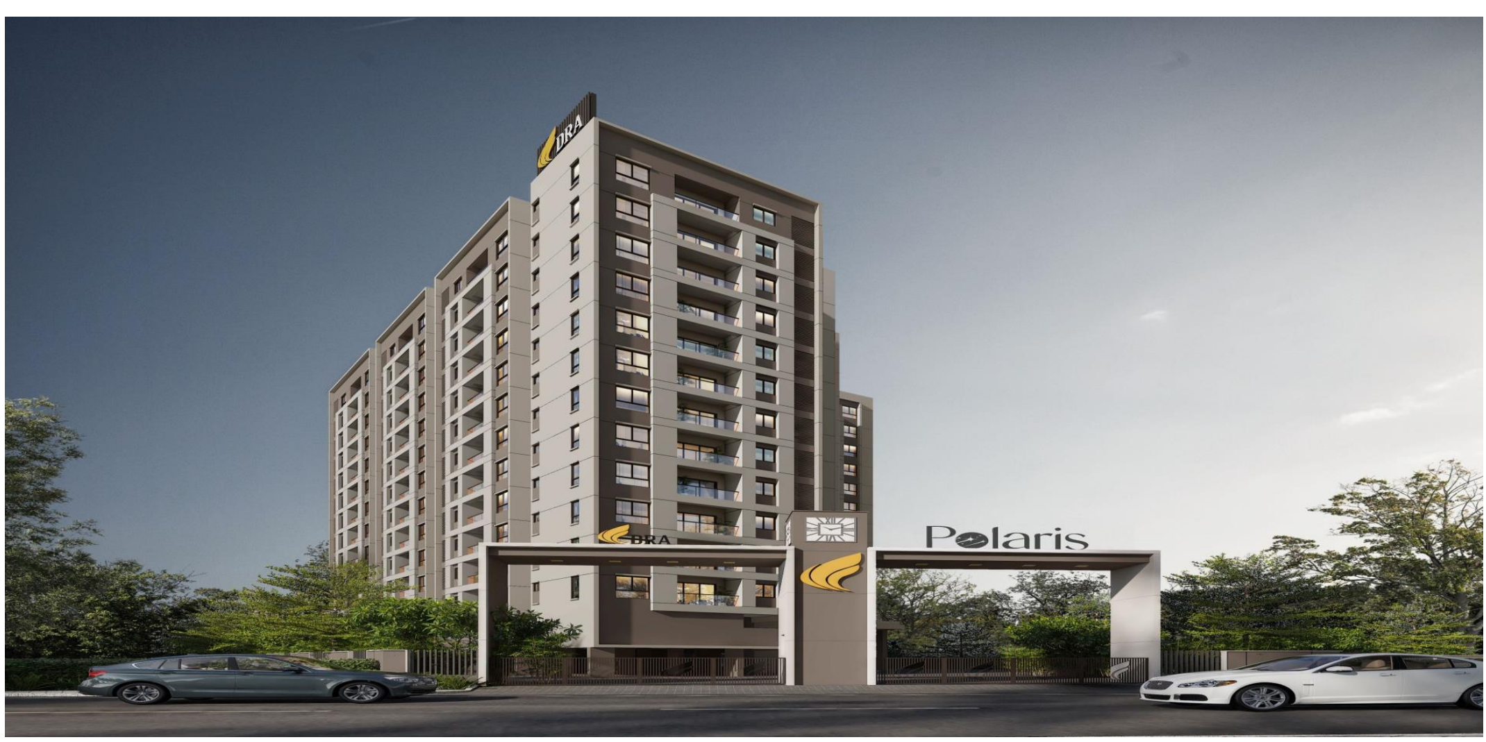
DRA POLARIS Construction updates photos – April 2025