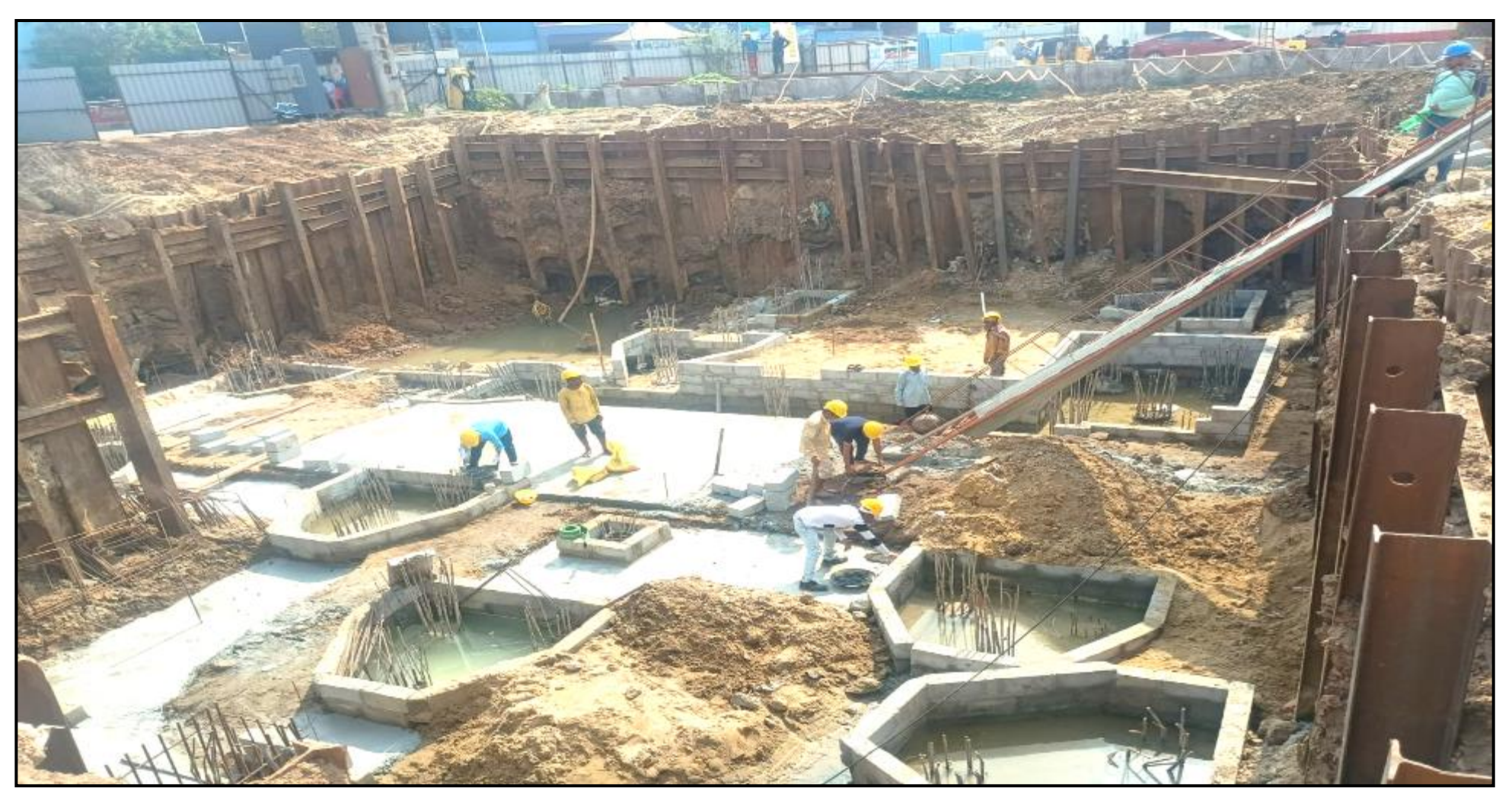
UG Sump & Main building – Pile cap block work (49/65 no's) completed