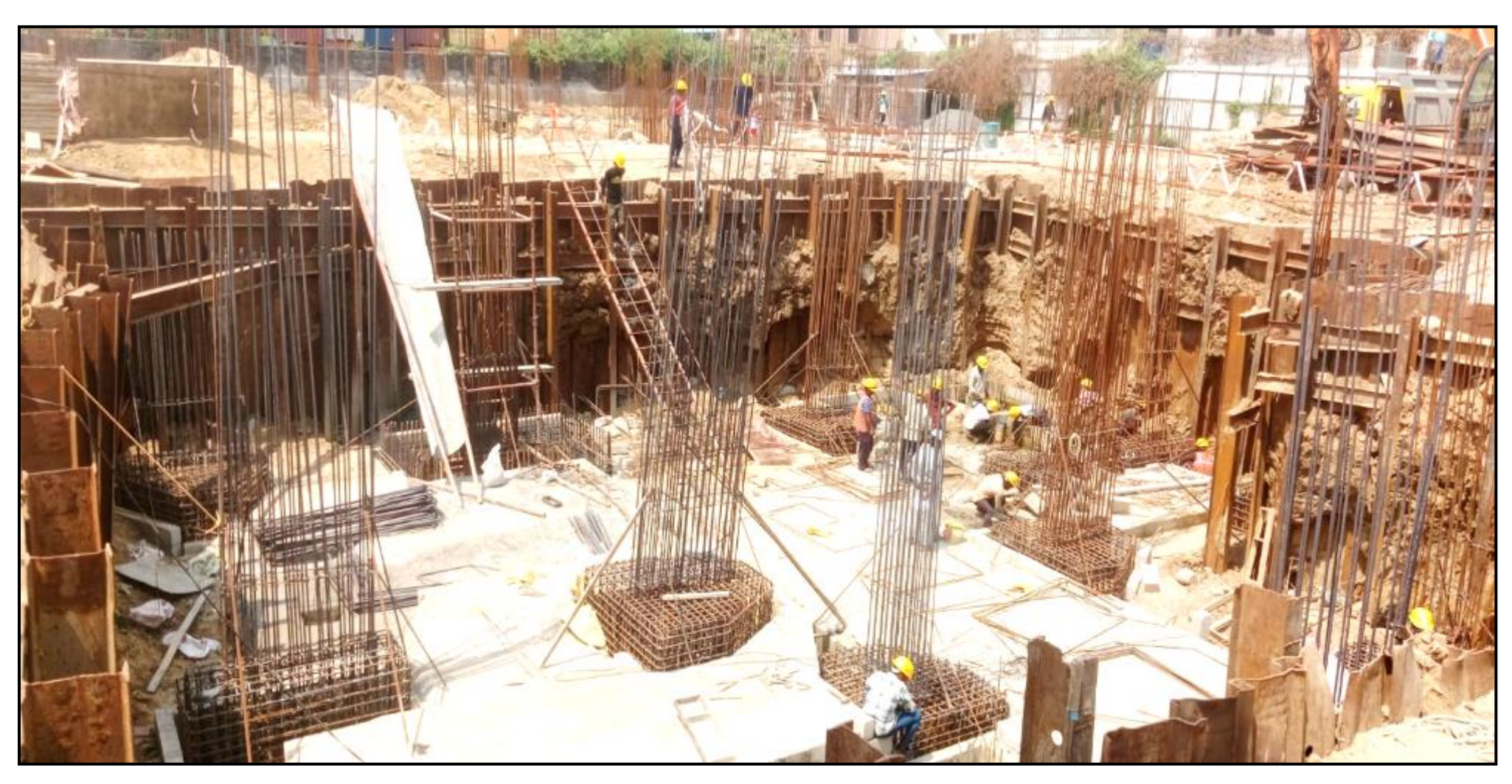
UG Sump – Pile cap reinforcement work (12/18 no's) completed