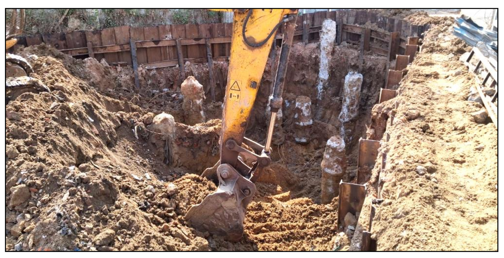
STP – Excavation completed (500/1150cum)