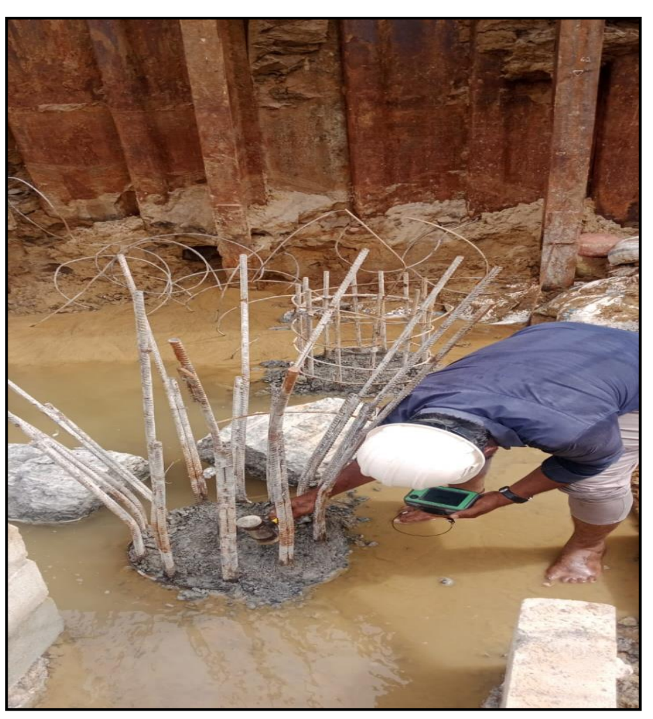
UG sump & Main building - Pile integrity test (140/282 no's) completed