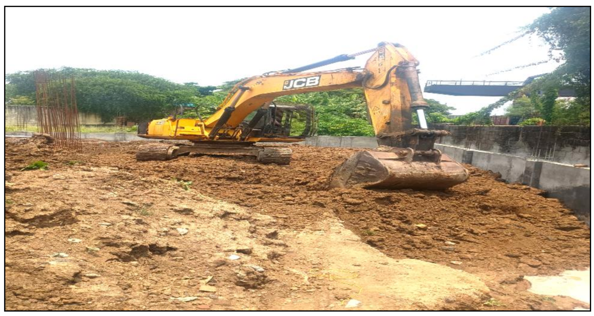
Compound wall – Soil back filling work at south side wall