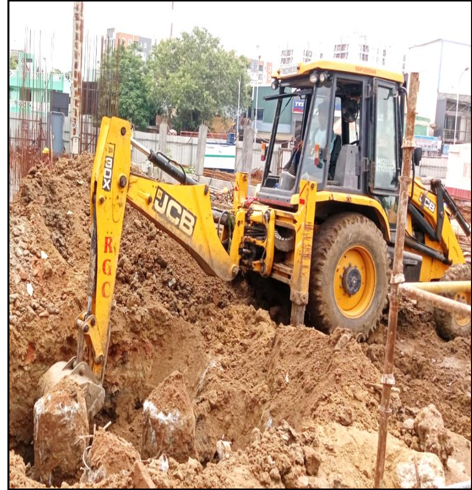
Main building – Pile cap excavation work 15 no's completed (65/65 no's)