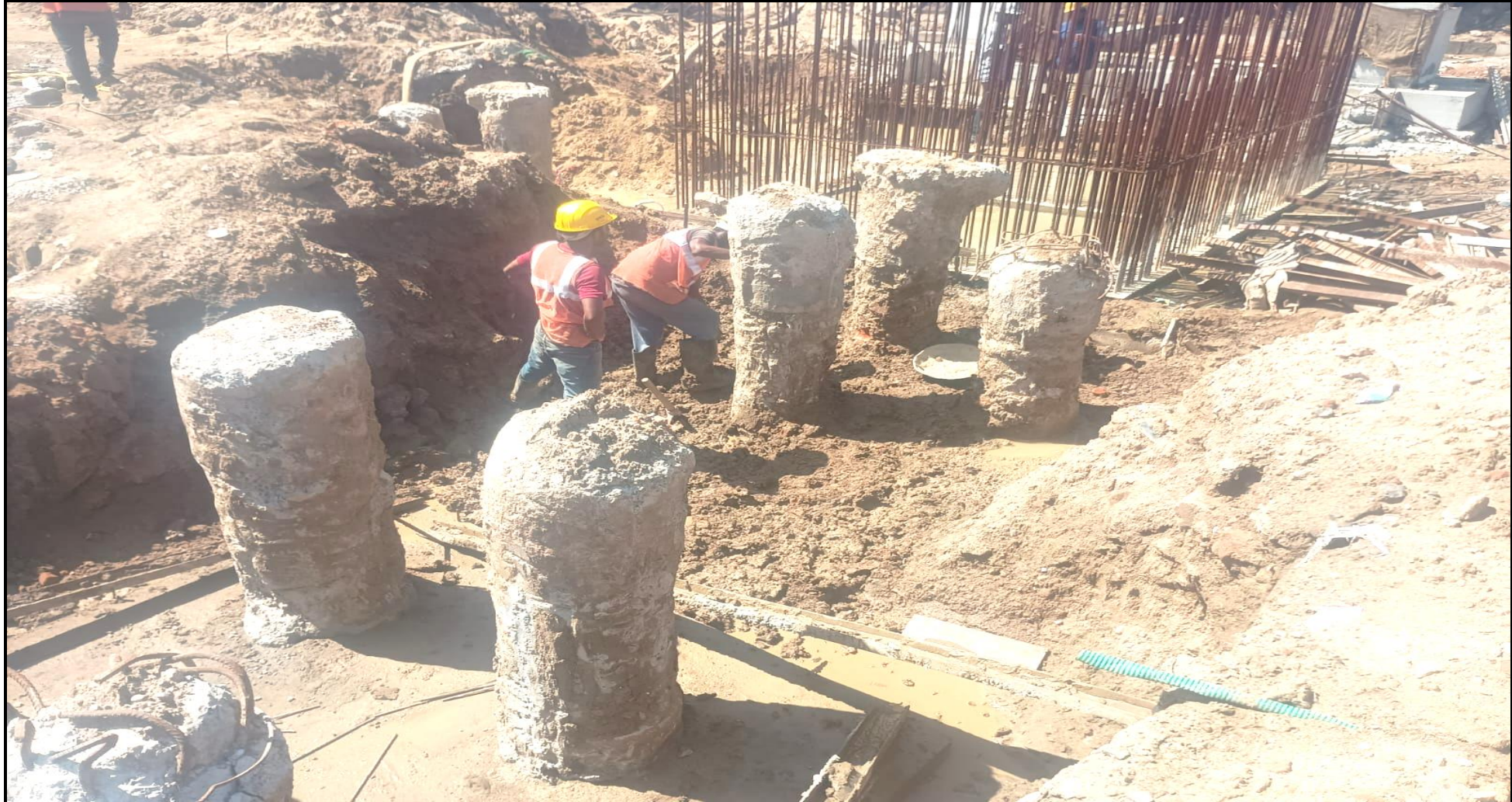
Main building – Pile cap dressing for PCC 15 no's completed ( 65/65 no's)