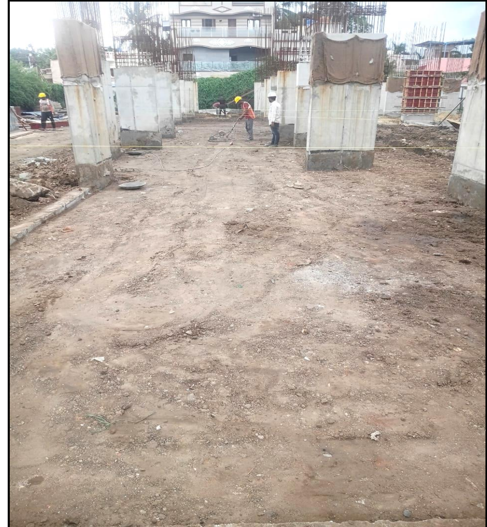
Main building – Surface dressing & compaction for grade slab PCC