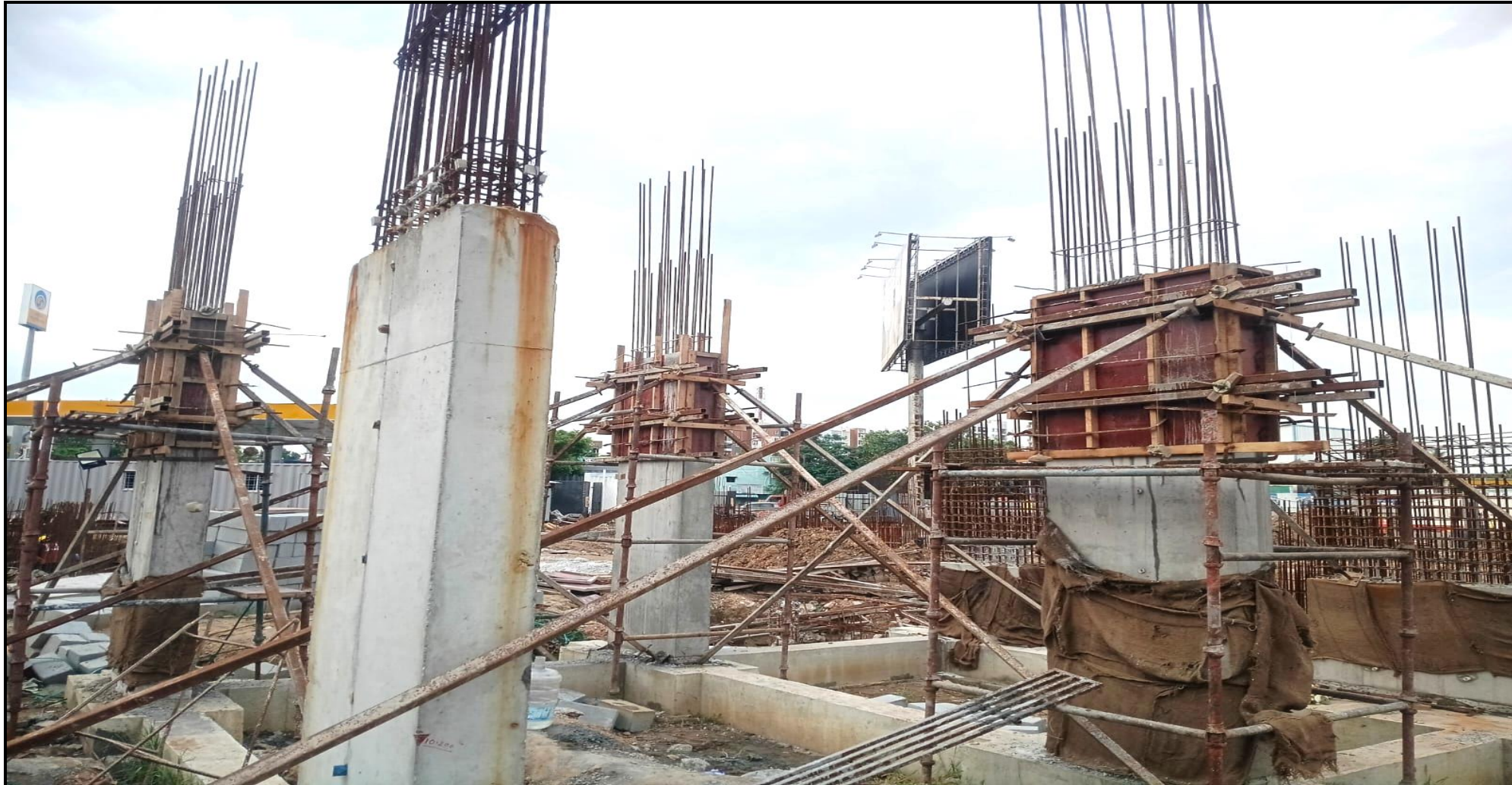
Main building – Stilt floor 2 nd lift column concrete 7no's completed (31/65 nos)