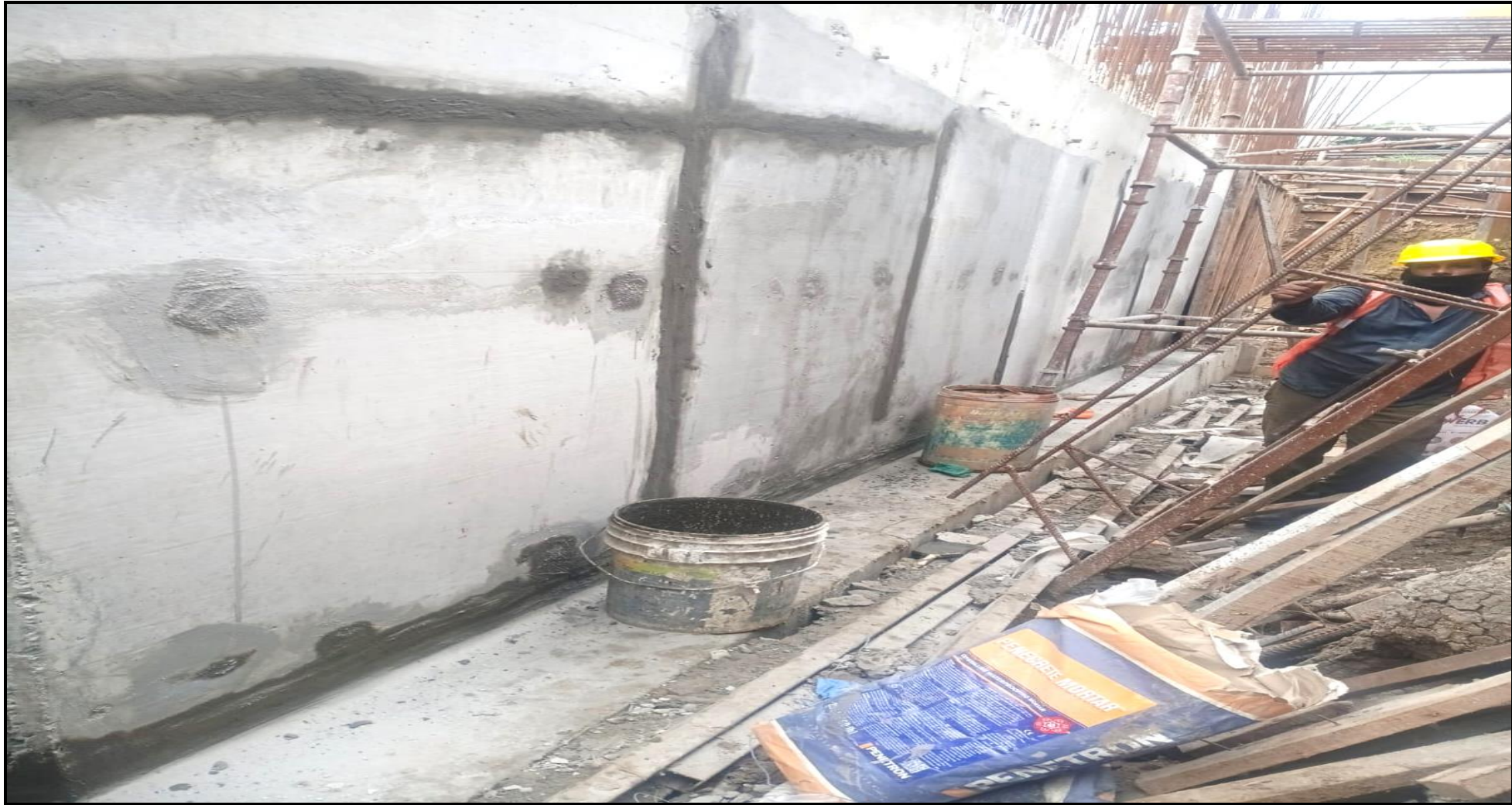
STP – External wall waterproofing 1 st lift completed