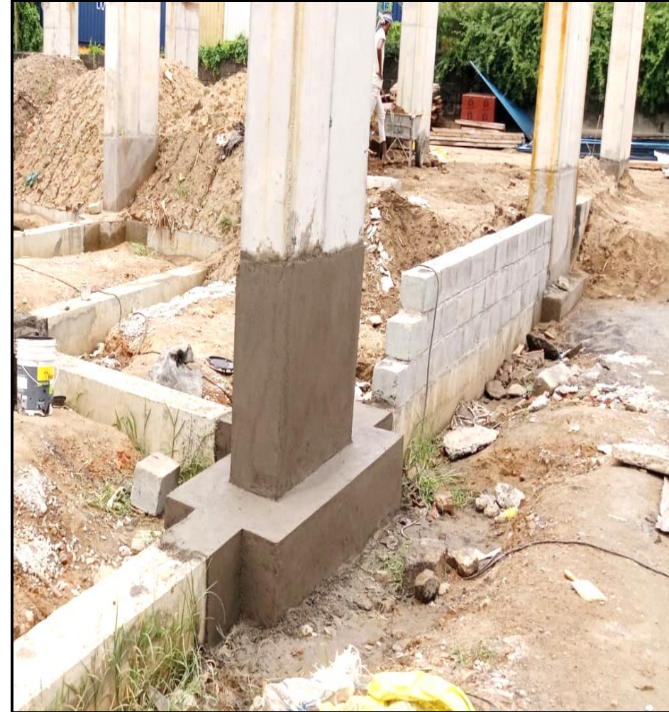
Main building – DPC coating & protective plastering on column completed (30/47 no's)