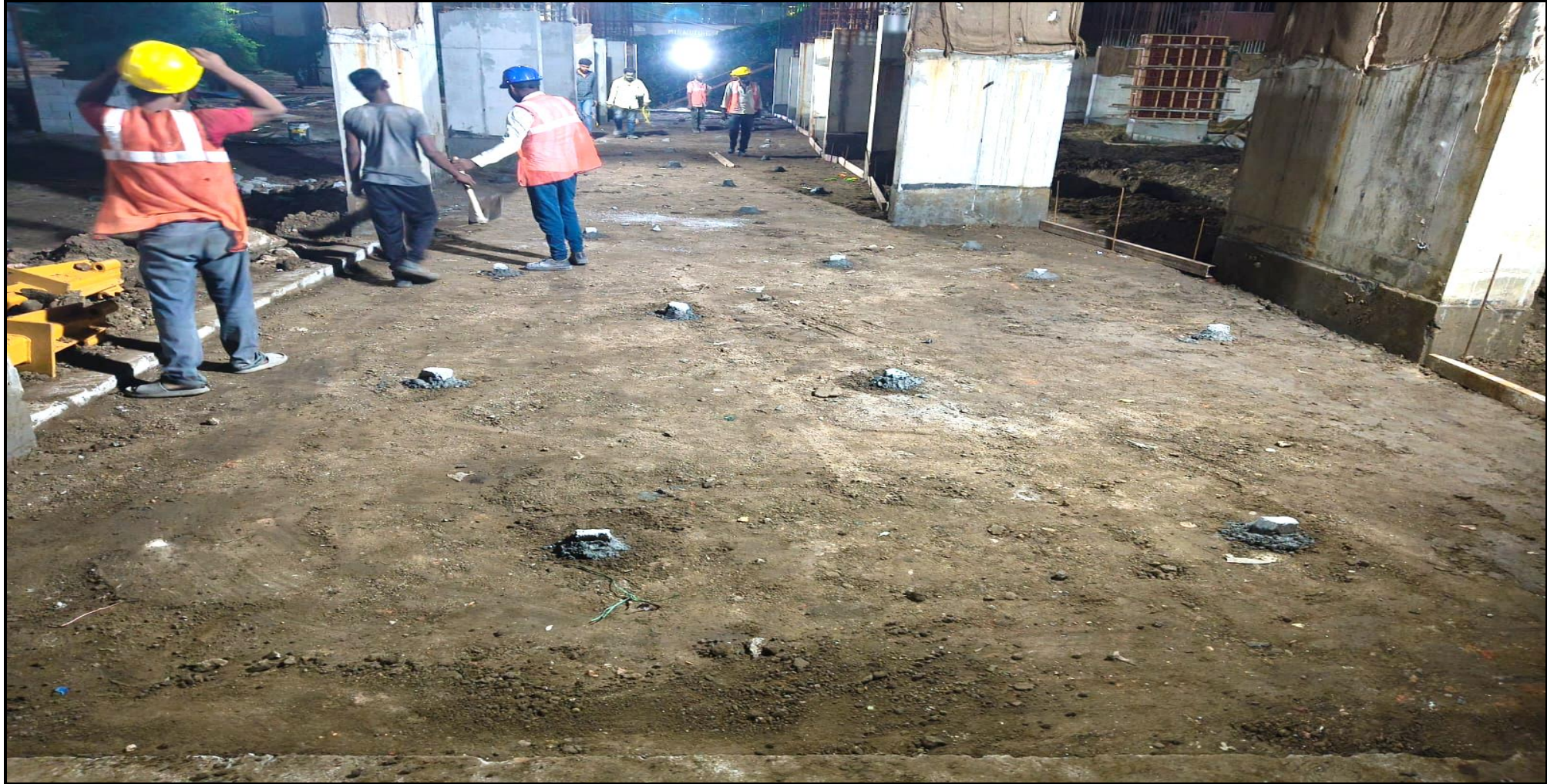
Main building – Bull mark for grade slab PCC