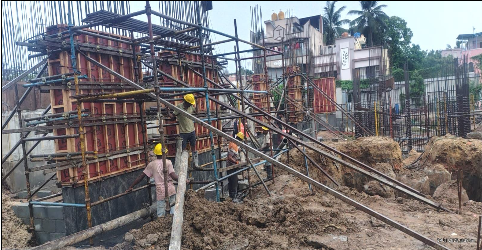
Main building – Stilt floor 1 st lift column concrete 7 no's completed (49/65 no's)