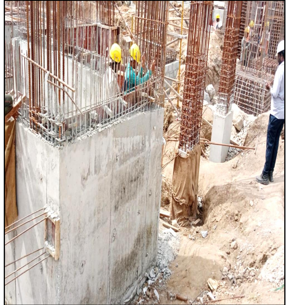
UG Sump – 2 nd lift wall concrete completed