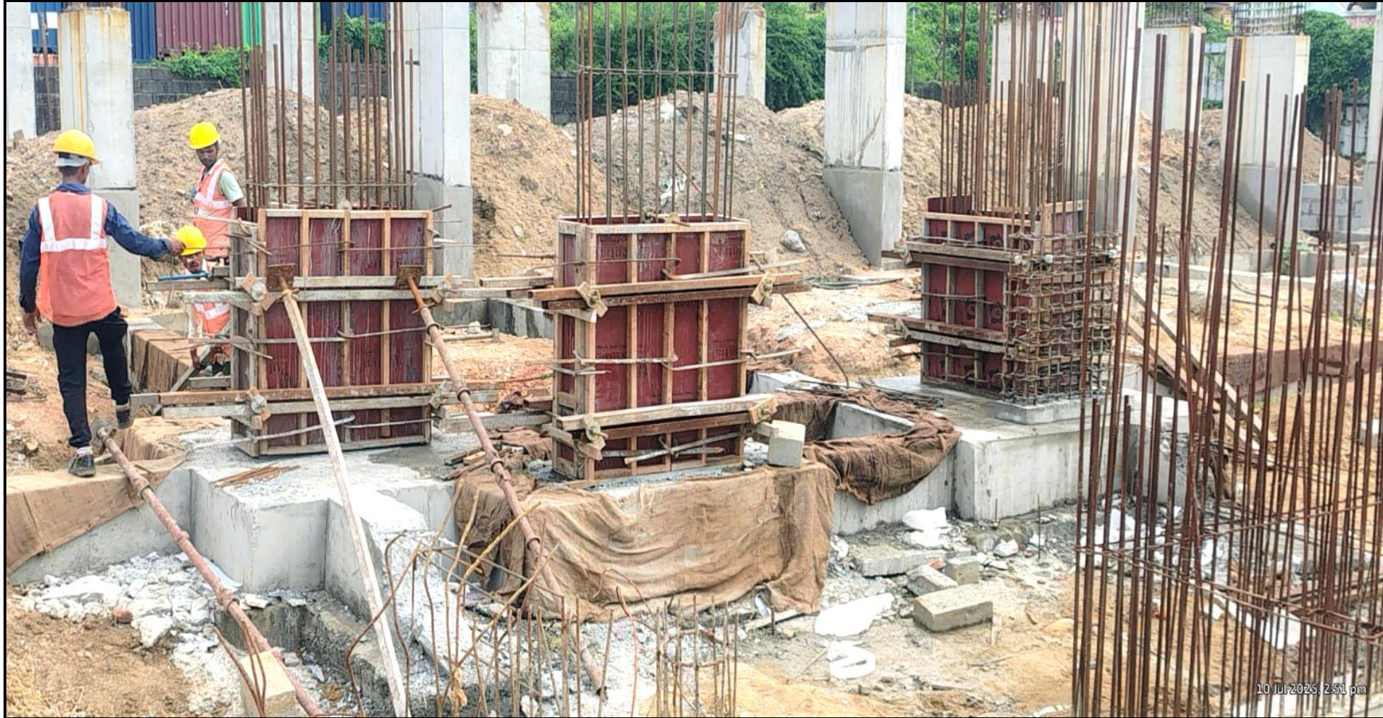
Main building – Column up to basement shuttering 8 no's completed (49/65 no's)