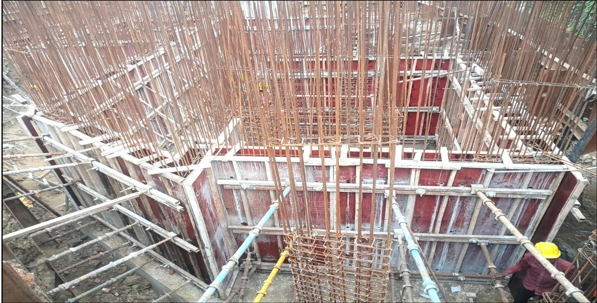
STP – 1 st lift Wall shuttering work completed (93/101m)