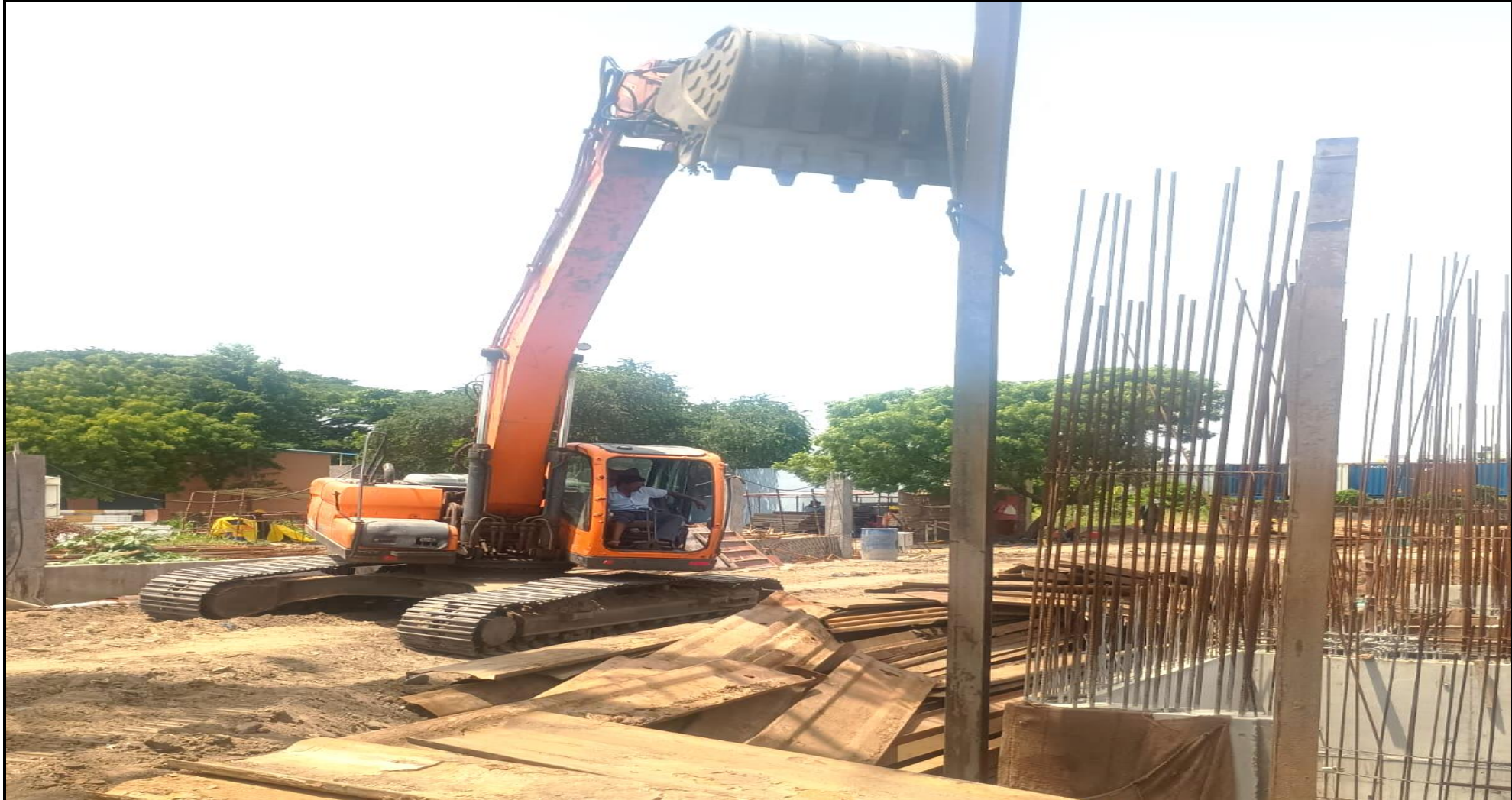
UG Sump – shoring removal work completed