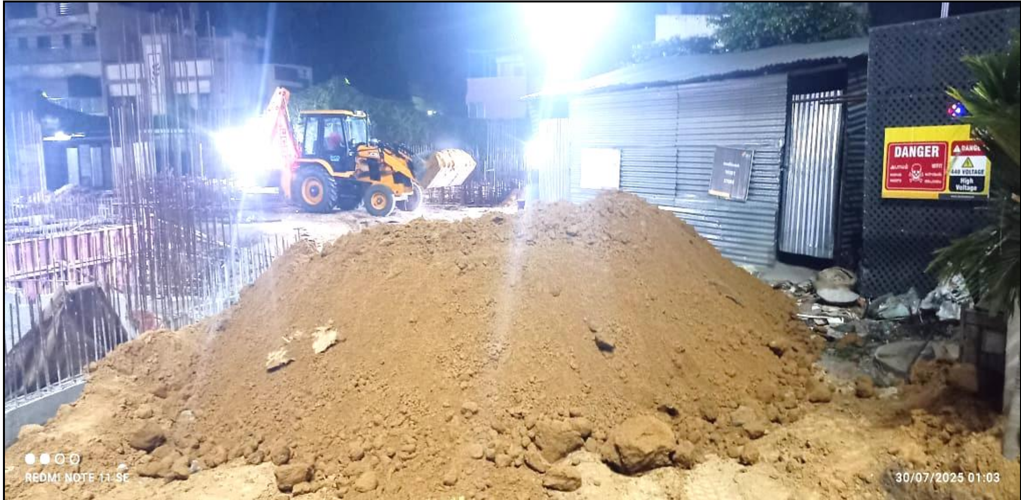
STP – Filling soil 15 loads received