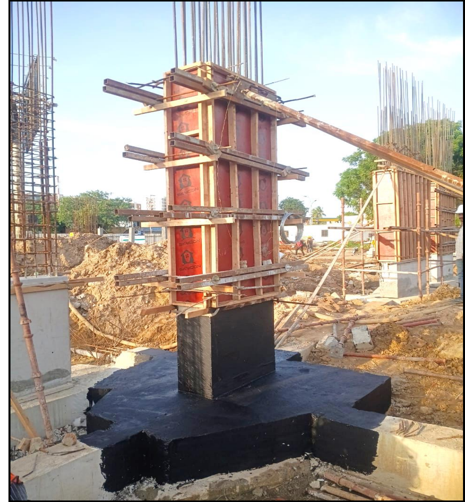
Main building – Stilt floor column 1 st lift shuttering 7 no's completed (49/65 no's)