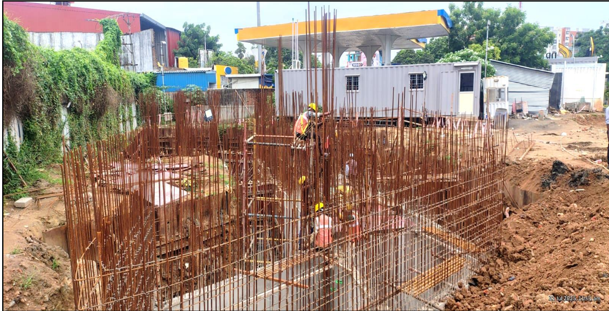
STP – Wall reinforcement 2 nd lift completed (93/101m)