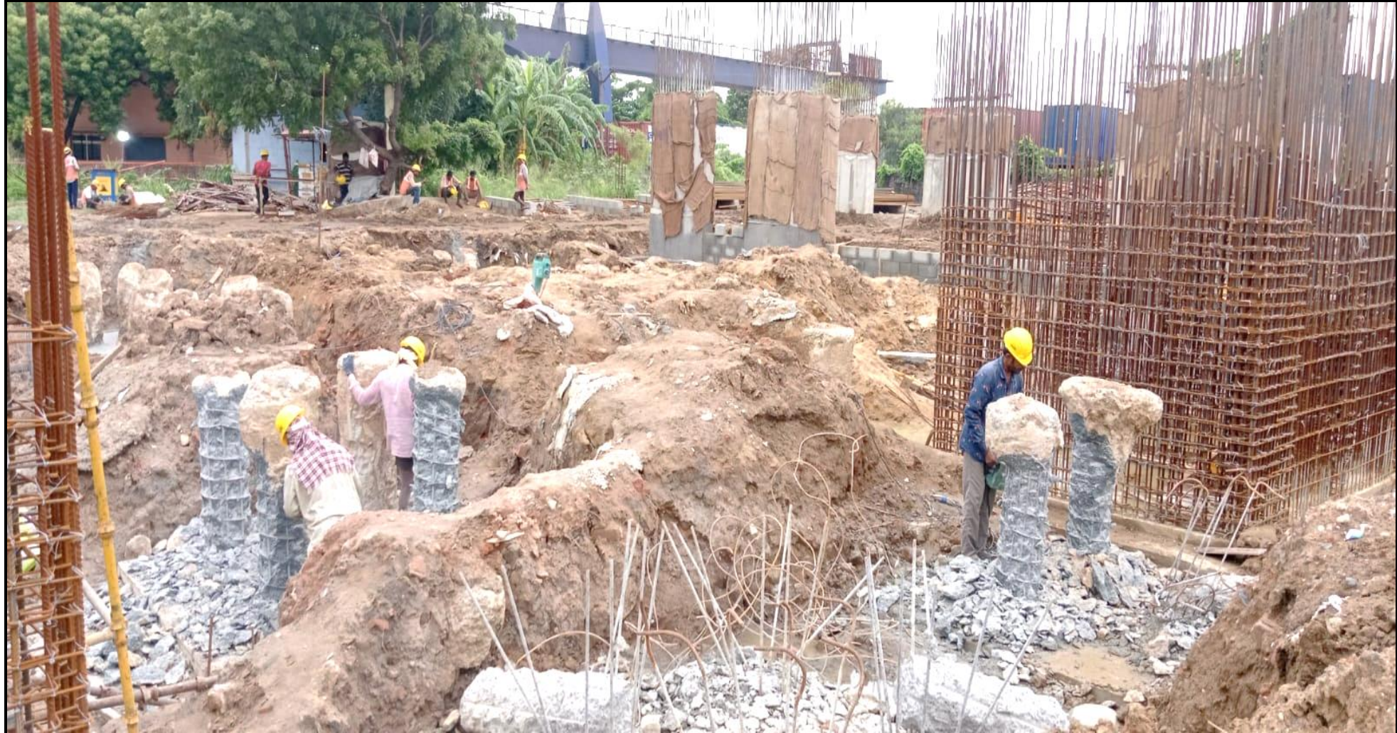
Main building – Pile chipping work 42 no's completed (182/182 no's)