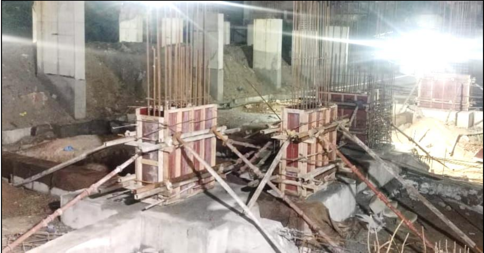
Main building – Column concrete up to basement 8nos completed (49/65 nos)