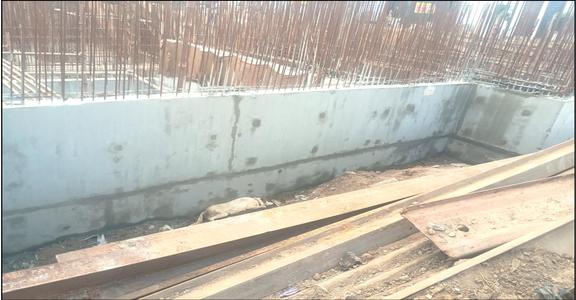
UG Sump – 2 nd lift external wall waterproofing work in progress