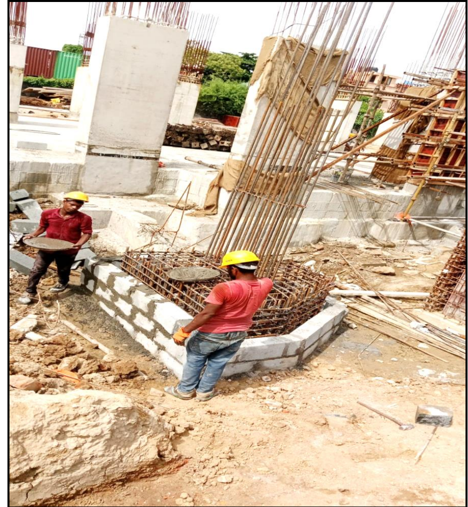
Main building – Pile cap block work in progress