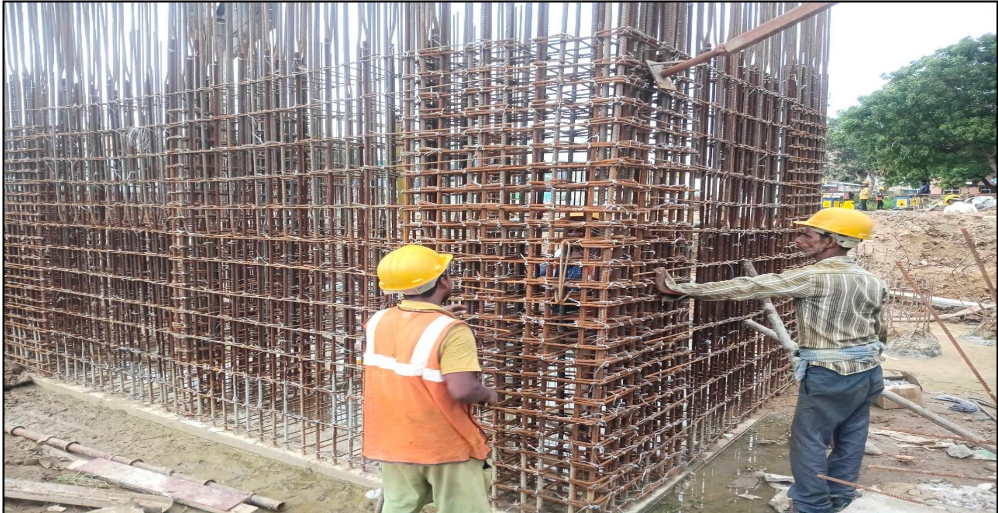
Main building – Lift reinforcement 80% completed