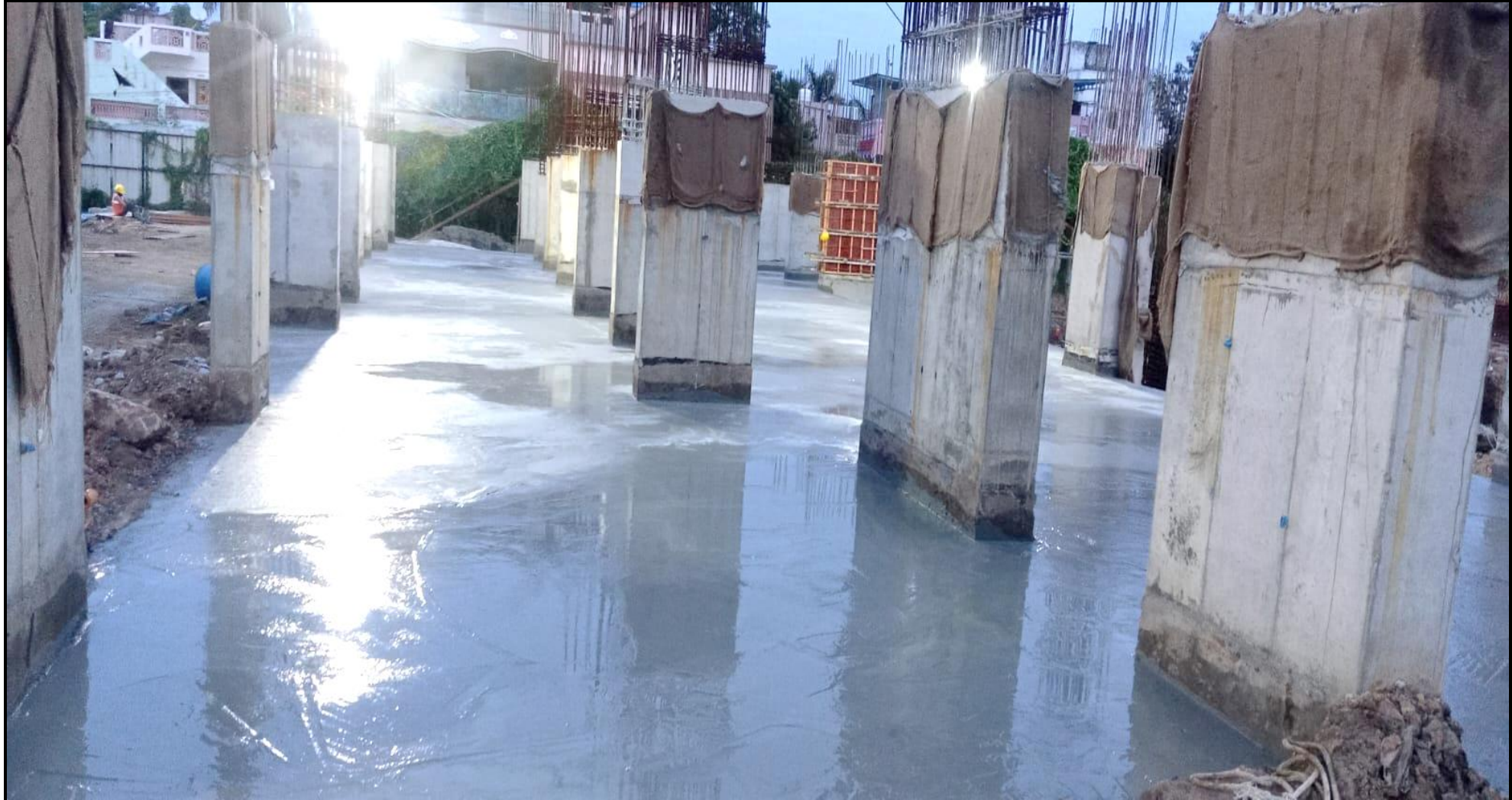
Main building – Grade slab PCC 45cum completed