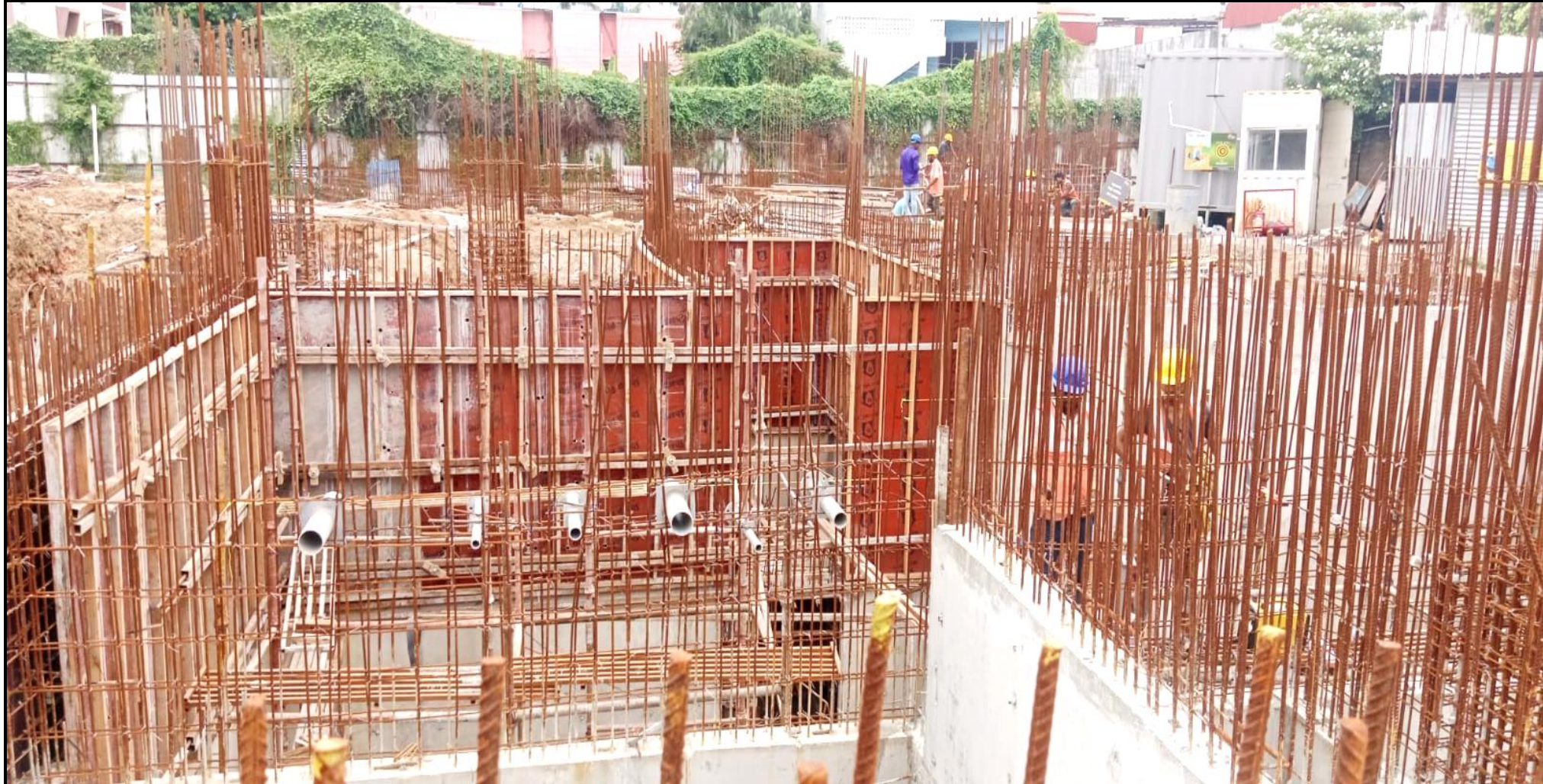
UG Sump – 2 nd lift wall shuttering completed (93m/93m)