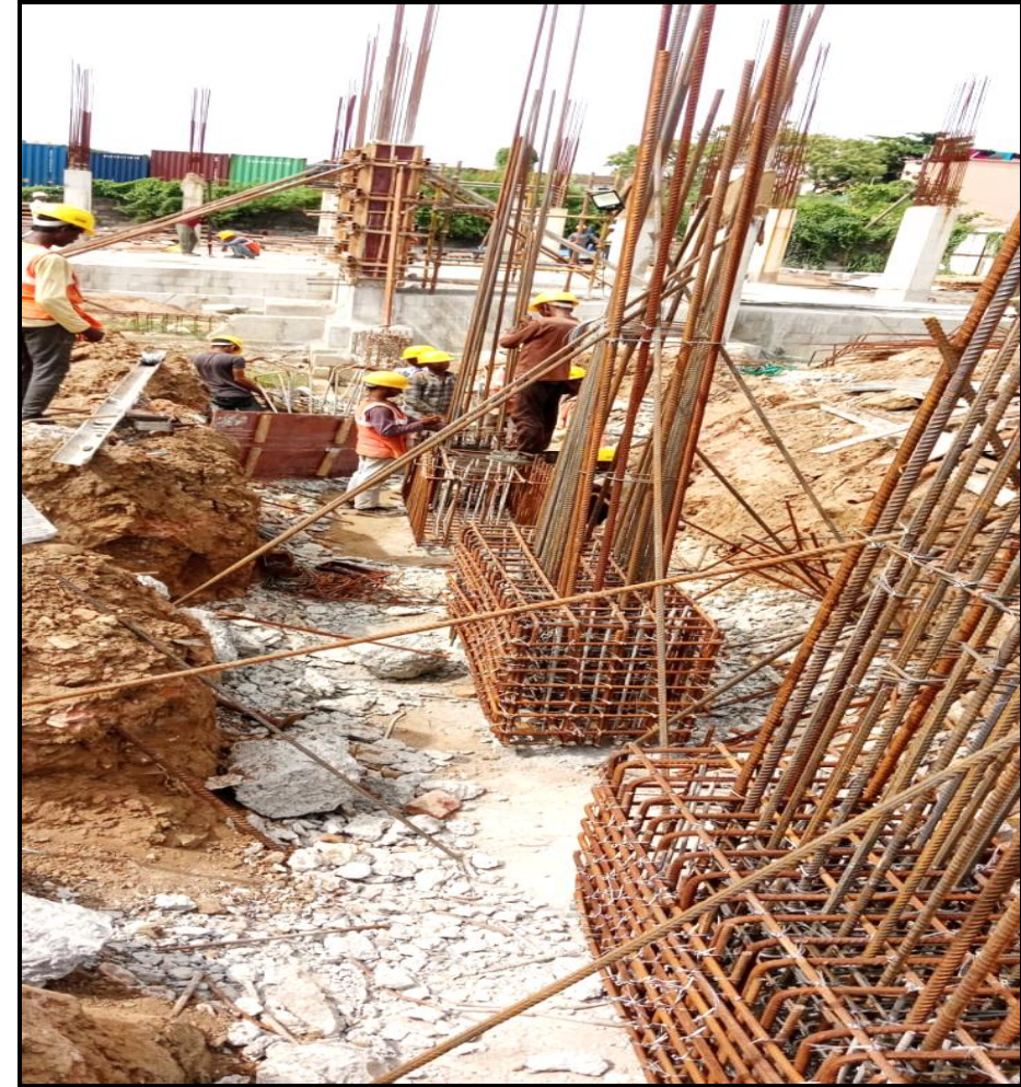
Main building – Pile cap reinforcement work 10 no's completed (40/47 nos)