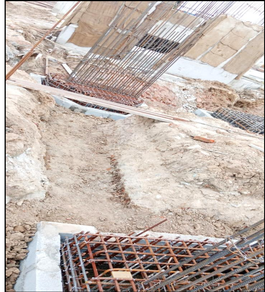
Main building – Plinth beam base dressing for pcc (197/285 m)