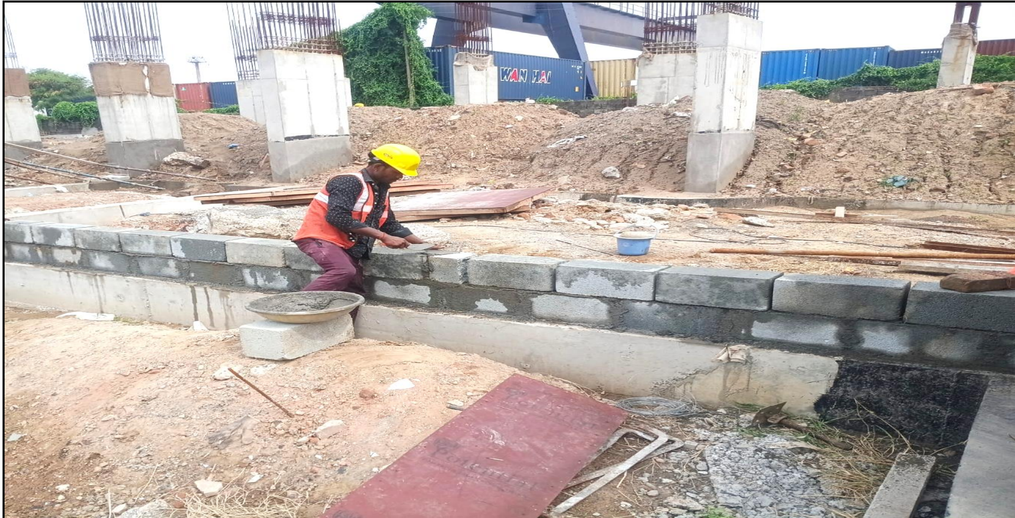
Main building – Basement block work 20m completed (56/200m)