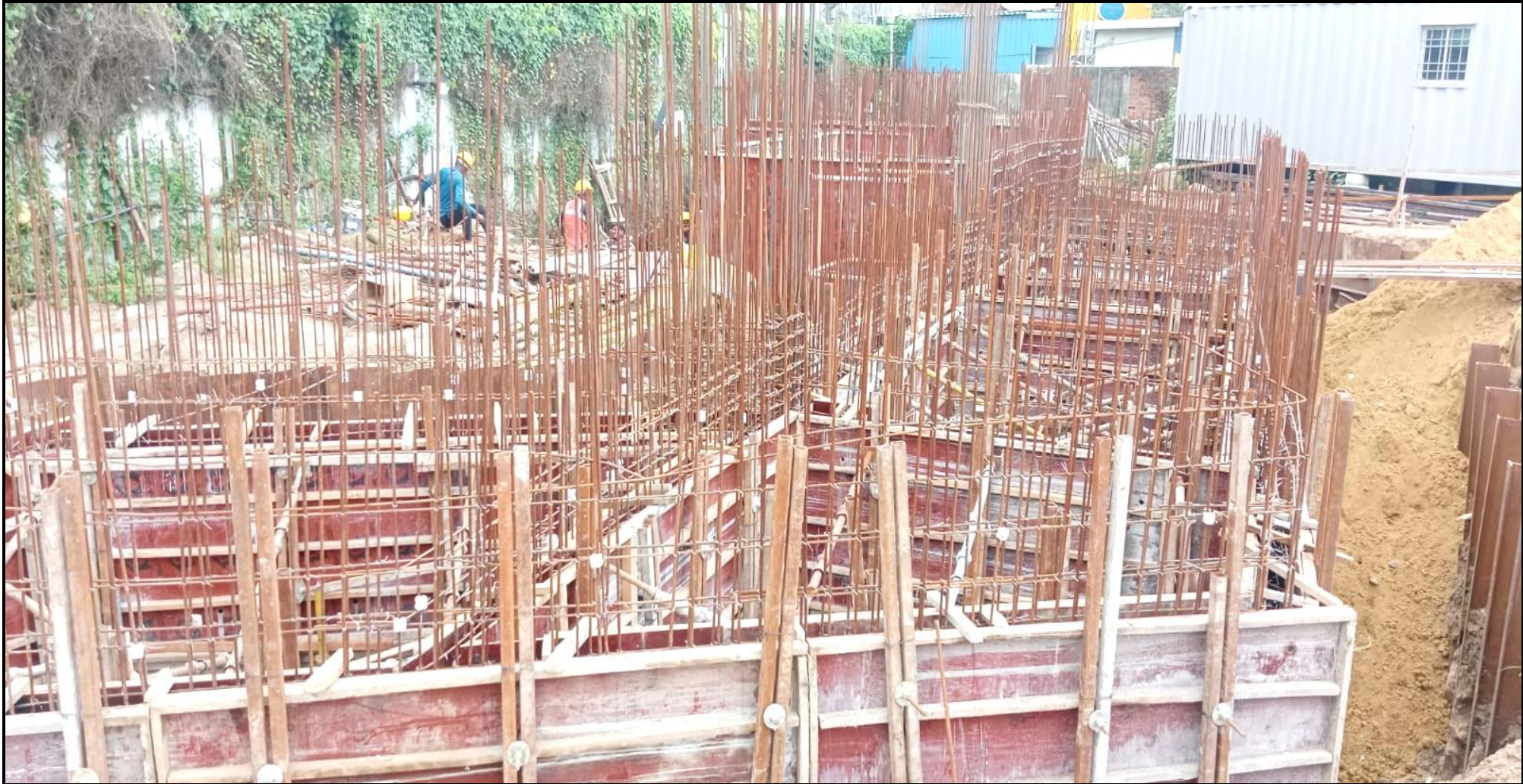
STP – 2 nd lift wall shuttering work in progress