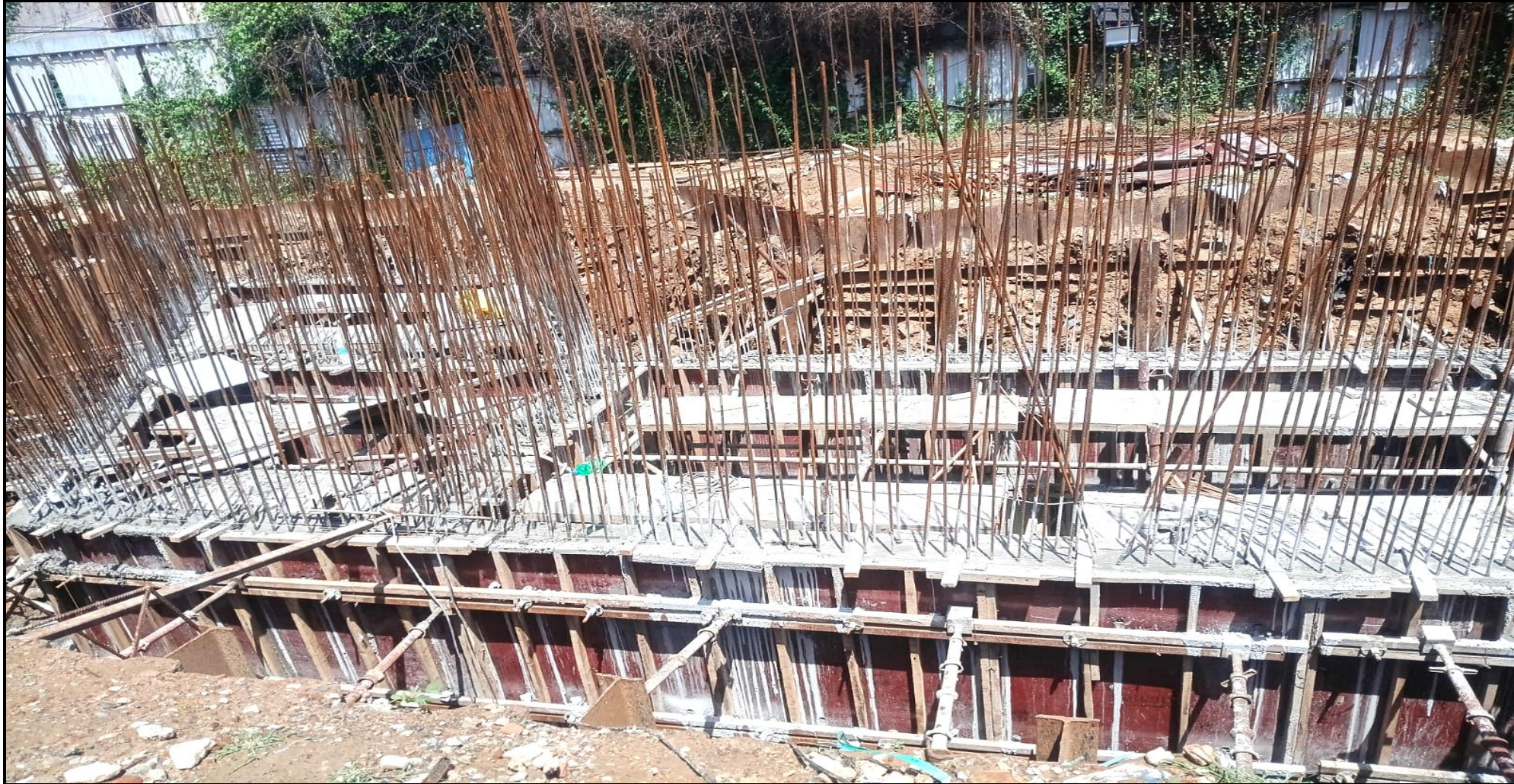
STP – 1 st lift Wall concrete work completed (93/101m)