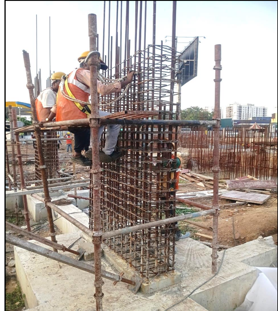
Main building – Column starter concrete and 1 st lift reinforcement work completed