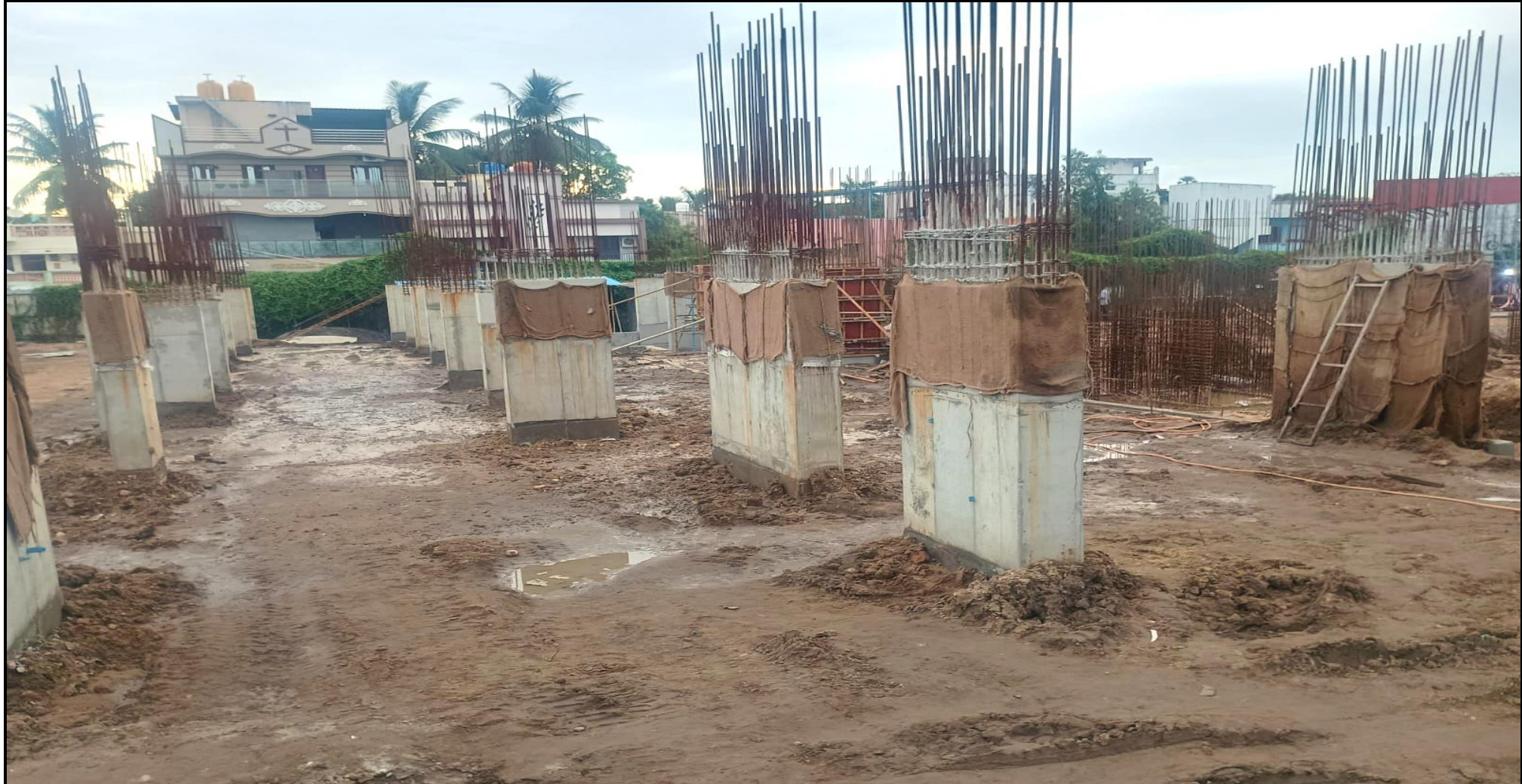
Main building – Pour 1 back filling work 90% completed