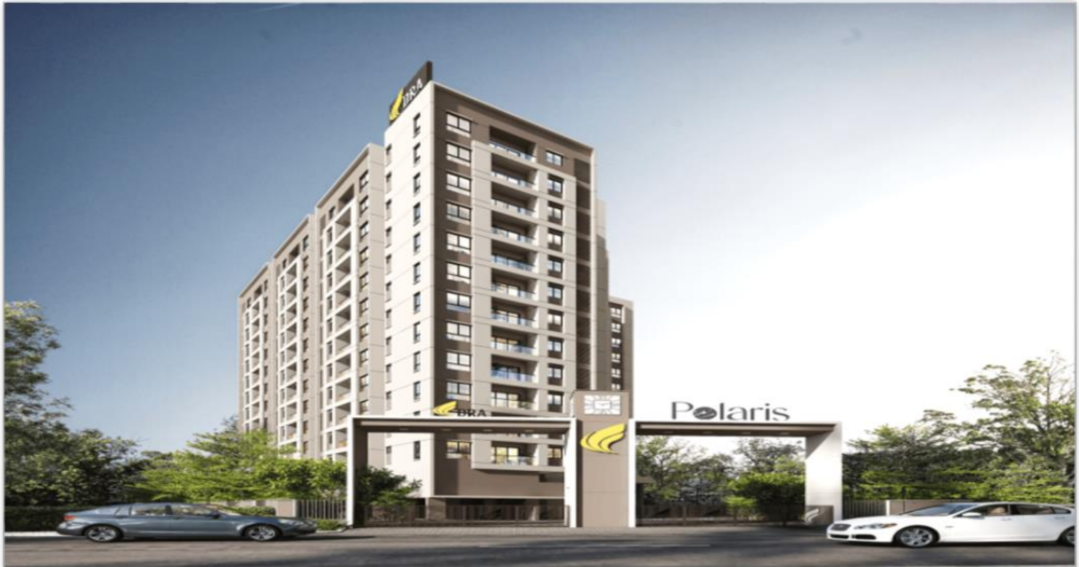
DRA POLARIS Construction update photos – January 2026