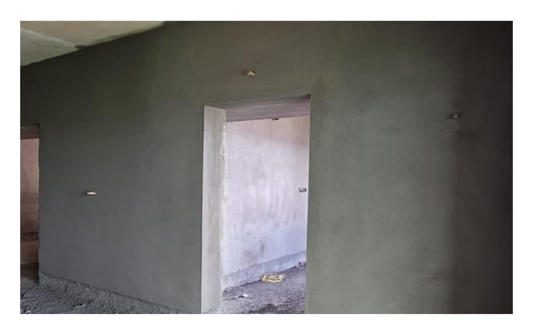
BLOCK 1 - TWELFTH FLOOR INTERNAL PLASTERING WORK IN PROGRESS