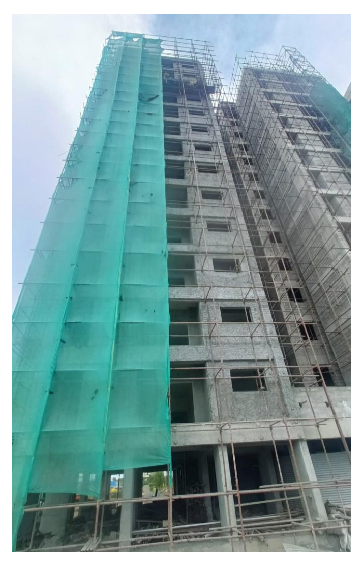
BLOCK 1 - EXTRENAL PLASTERING (SOUTH SIDE) WORK IN PROGRESS