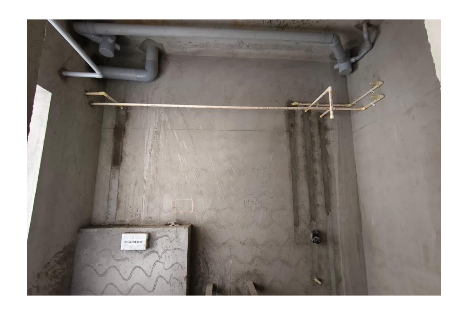
BLOCK 1 - SIXTH FLOOR PLUMBING SUSPENDED LINE WORK IN PROGRESS