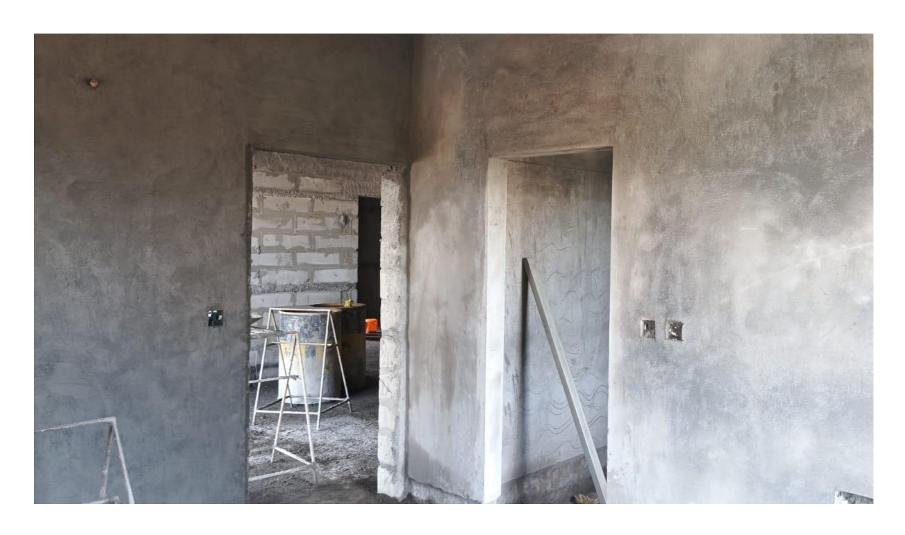
BLOCK 2 POUR 1 - TENTH FLOOR INTERNAL PLASTERING WORK IN PROGRESS