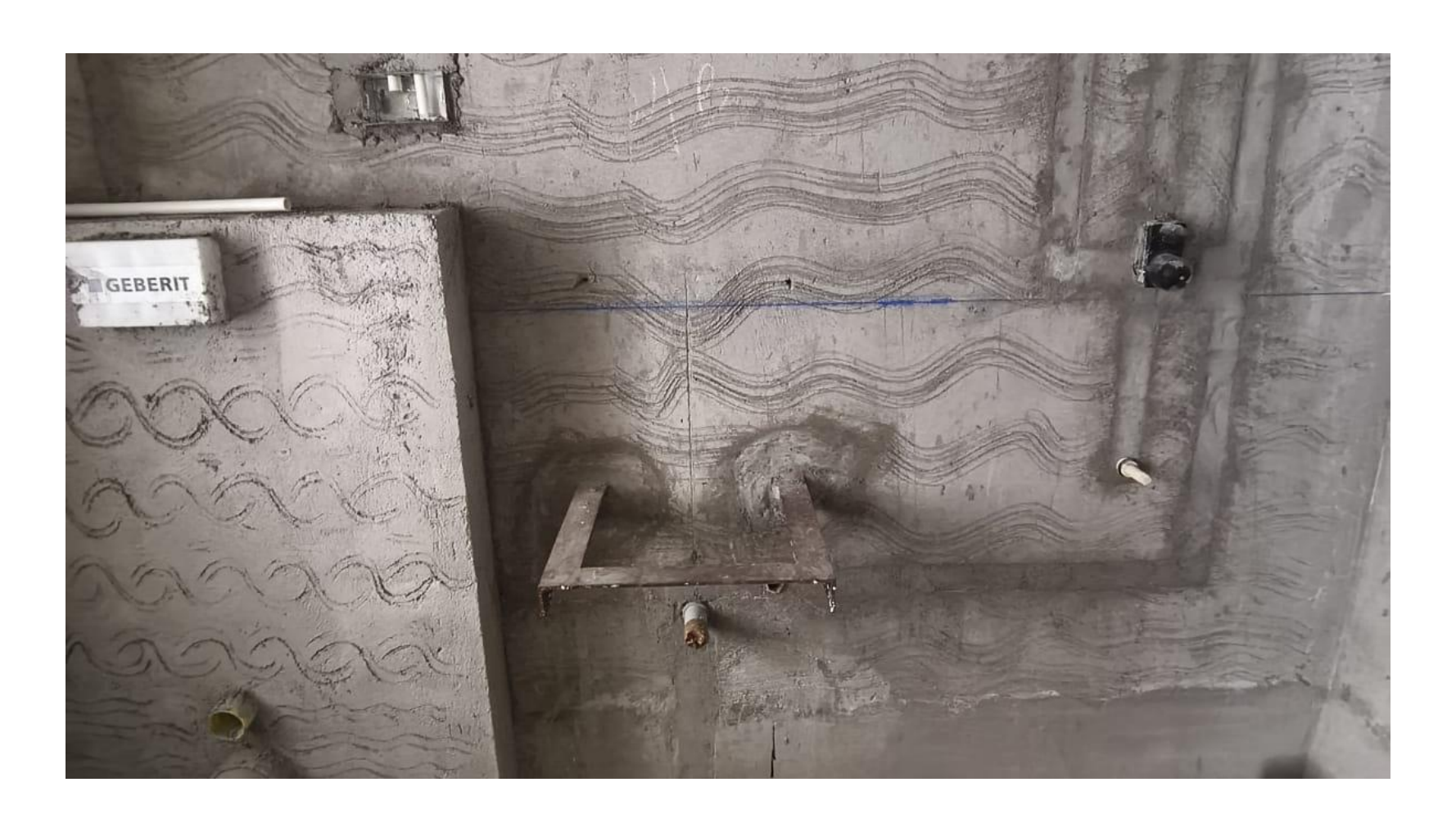
BLOCK 1 - UPTO SEVENTH FLOOR 'L'ANGLE FIXING WORK COMPLETED