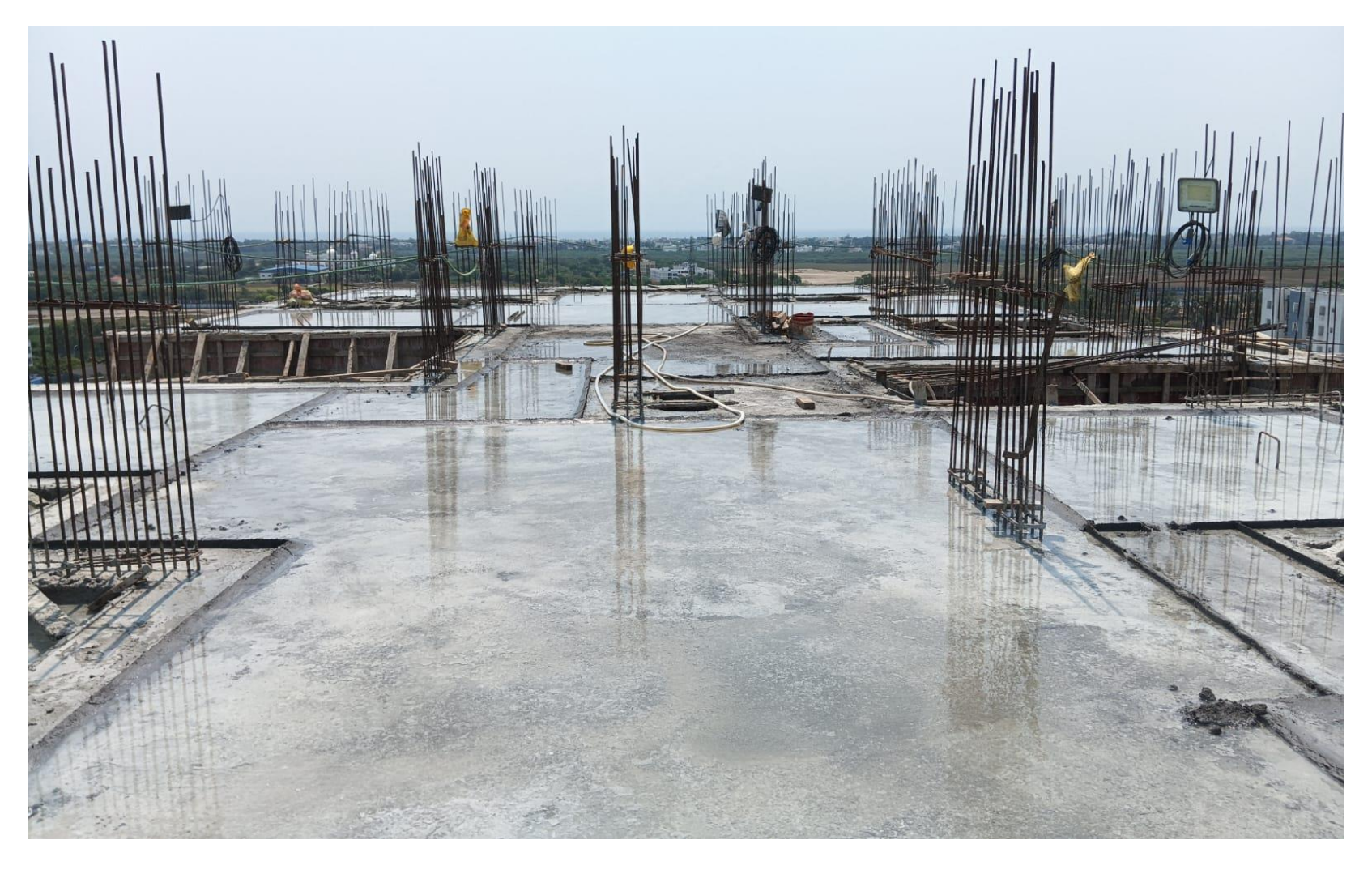
BLOCK 2 POUR 1 - TWELFTH FLOOR ROOF SLAB CONCRETE COMPLETED