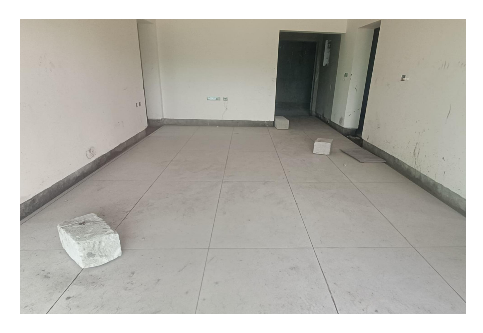
BLOCK 1 - SECOND FLOOR TILES LAYING WORK IN PROGRESS