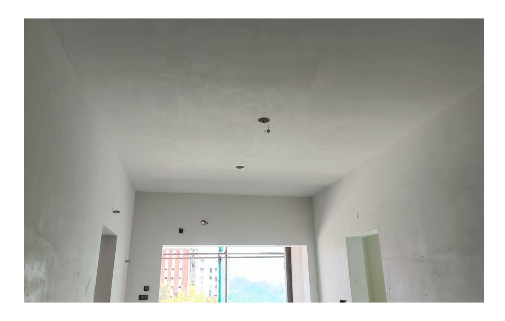
BLOCK 1 - FIRST & SECOND FLOOR WALL PUTTY FIRST COAT COMPLETED