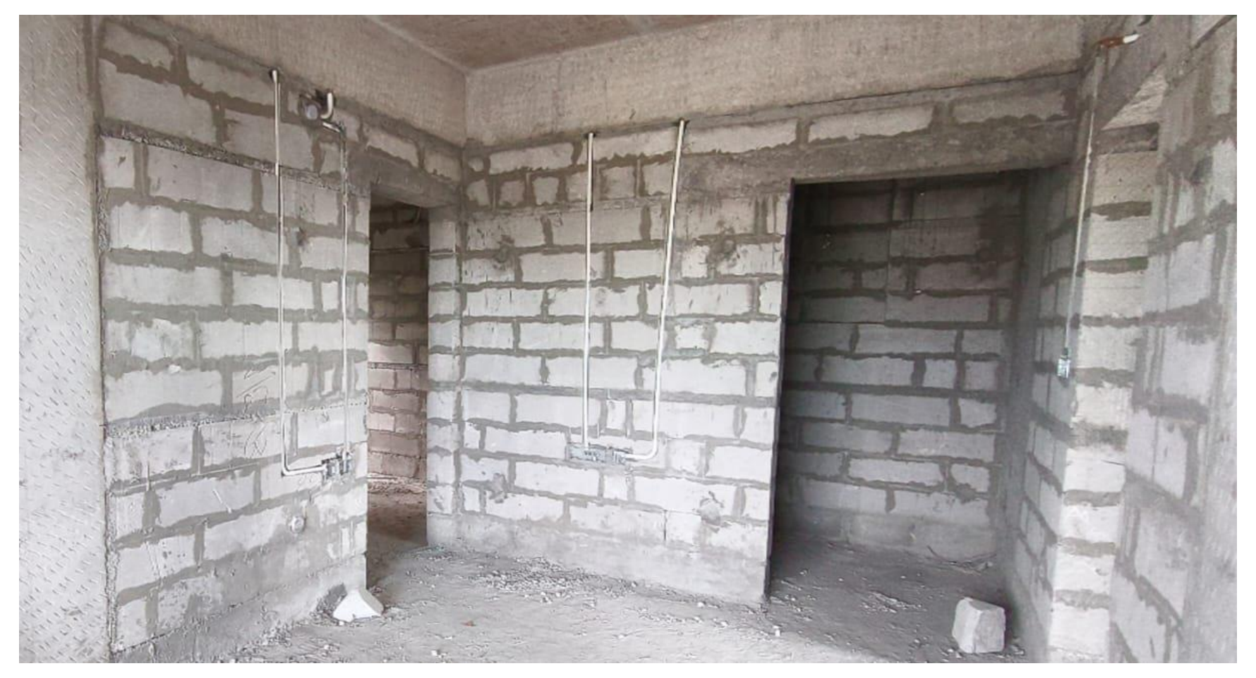
BLOCK 1 - THIRTEENTH FLOOR ELECTRICAL WALL CHASING WORK IN PROGRESS