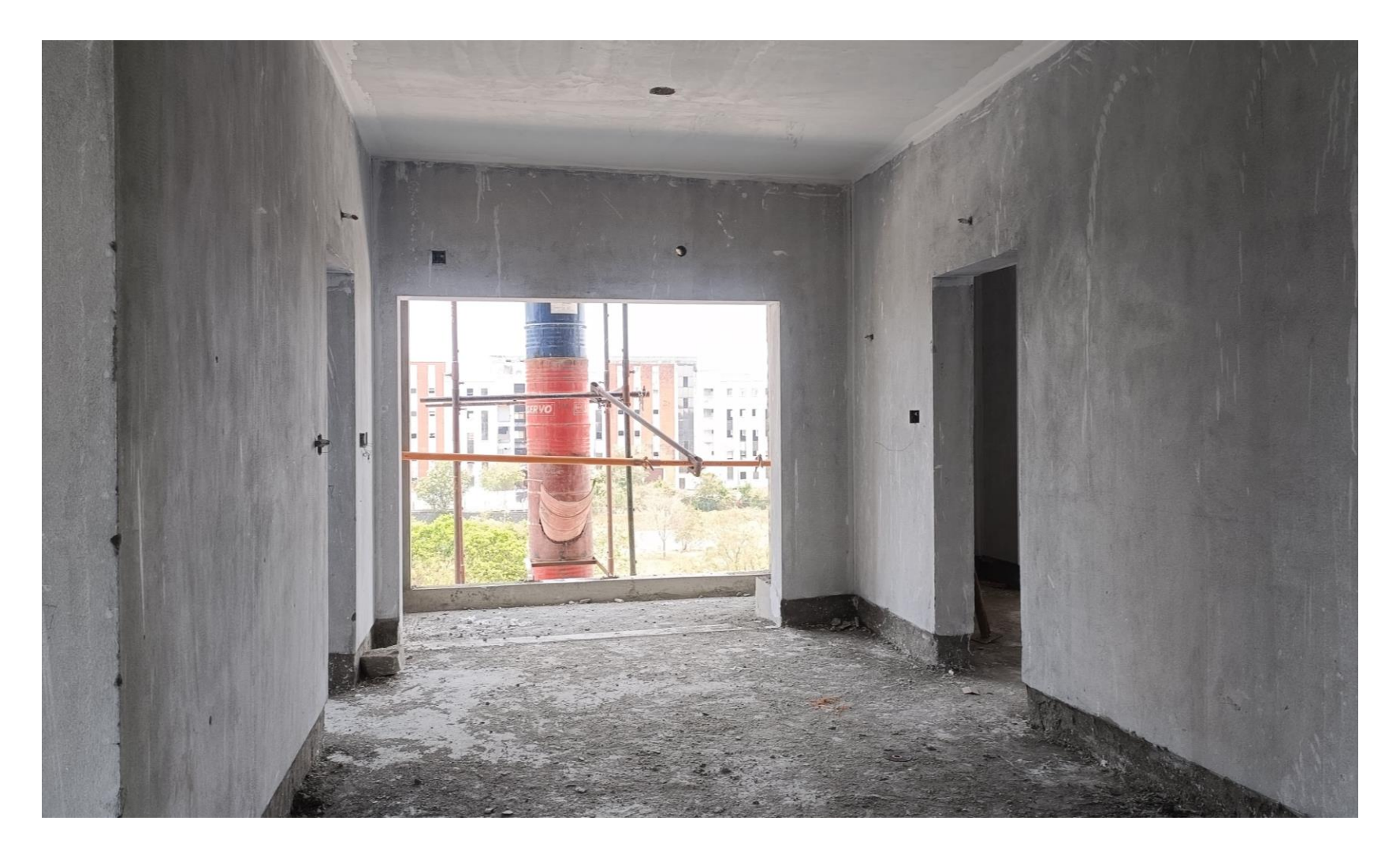
BLOCK 1 - FOURTH FLOOR CEILING & WALL PUTTY WORK IN PROGRESS