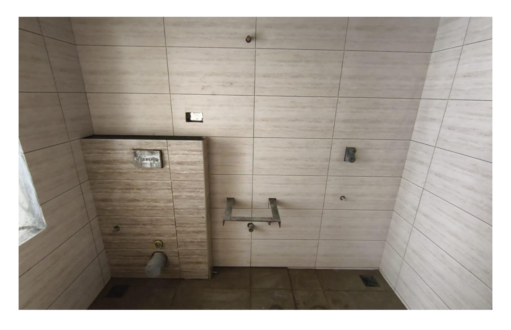
BLOCK 1 - THIRD FLOOR TOILET TILES LAYING WORK IN PROGRESS