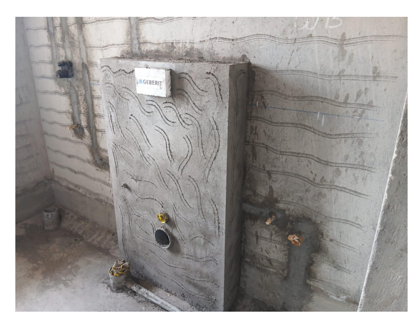
BLOCK 2 POUR 1 - THIRD FLOOR LEDGE WALL WORK COMPLETED