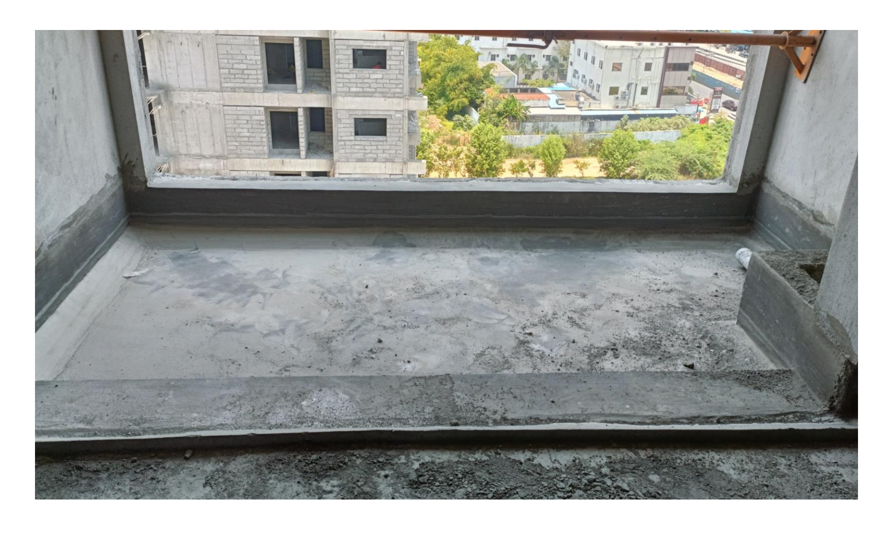
BLOCK 1 - EIGHTH FLOOR WATERPROOFING WORK COMPLETED