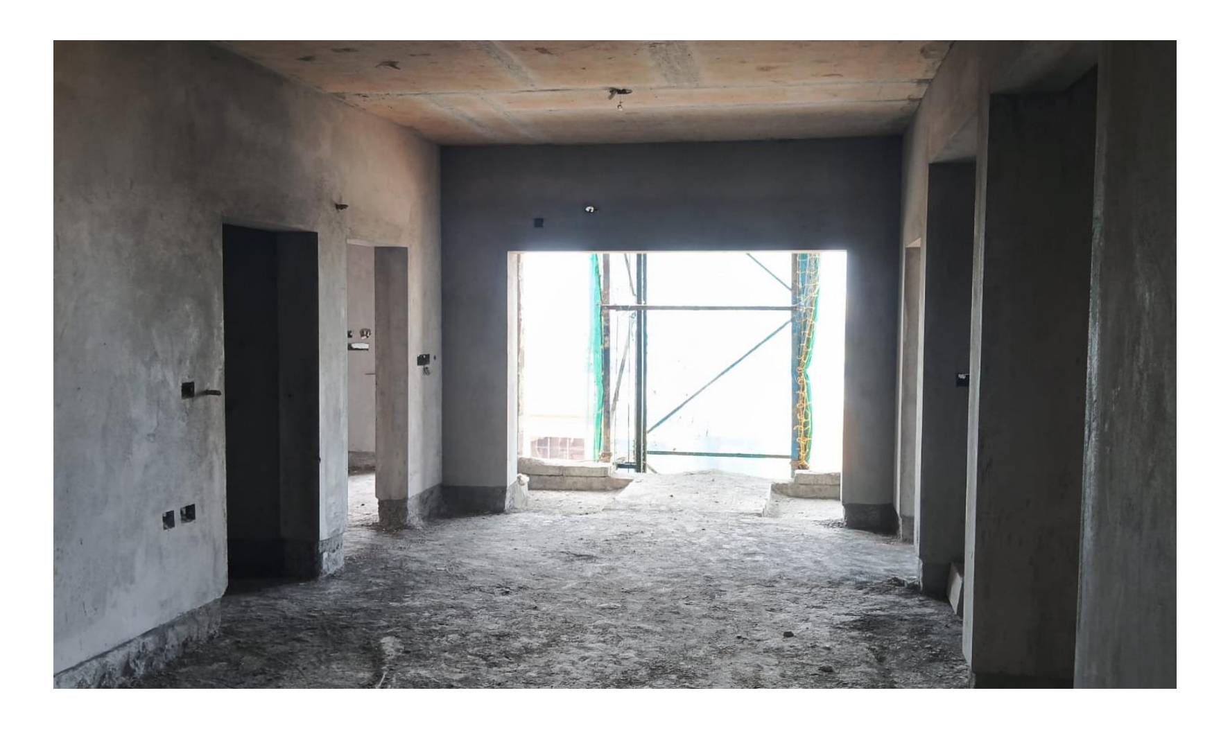
BLOCK 2 POUR 1 - NINTH FLOOR INTERNAL PLASTERING WORK COMPLETED