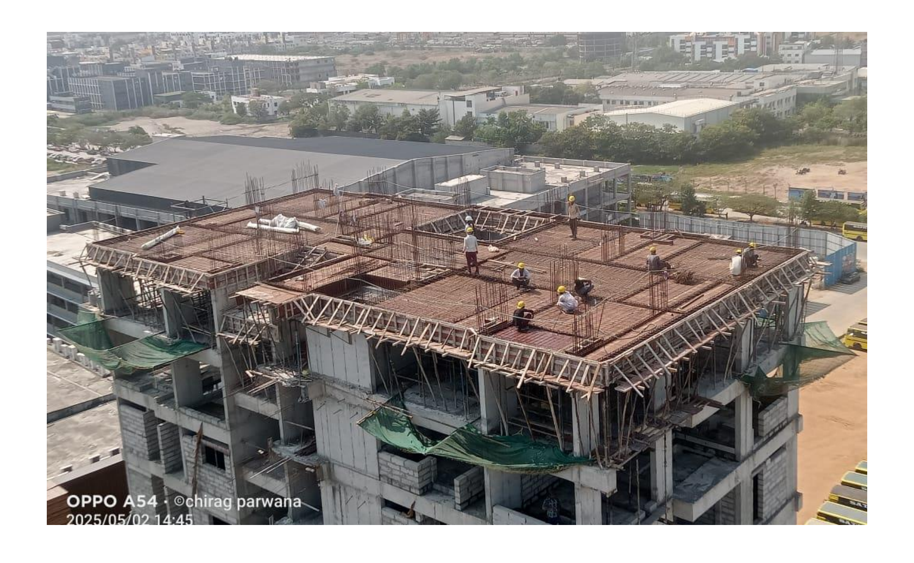
BLOCK 2 POUR 1 - TOP VIEW