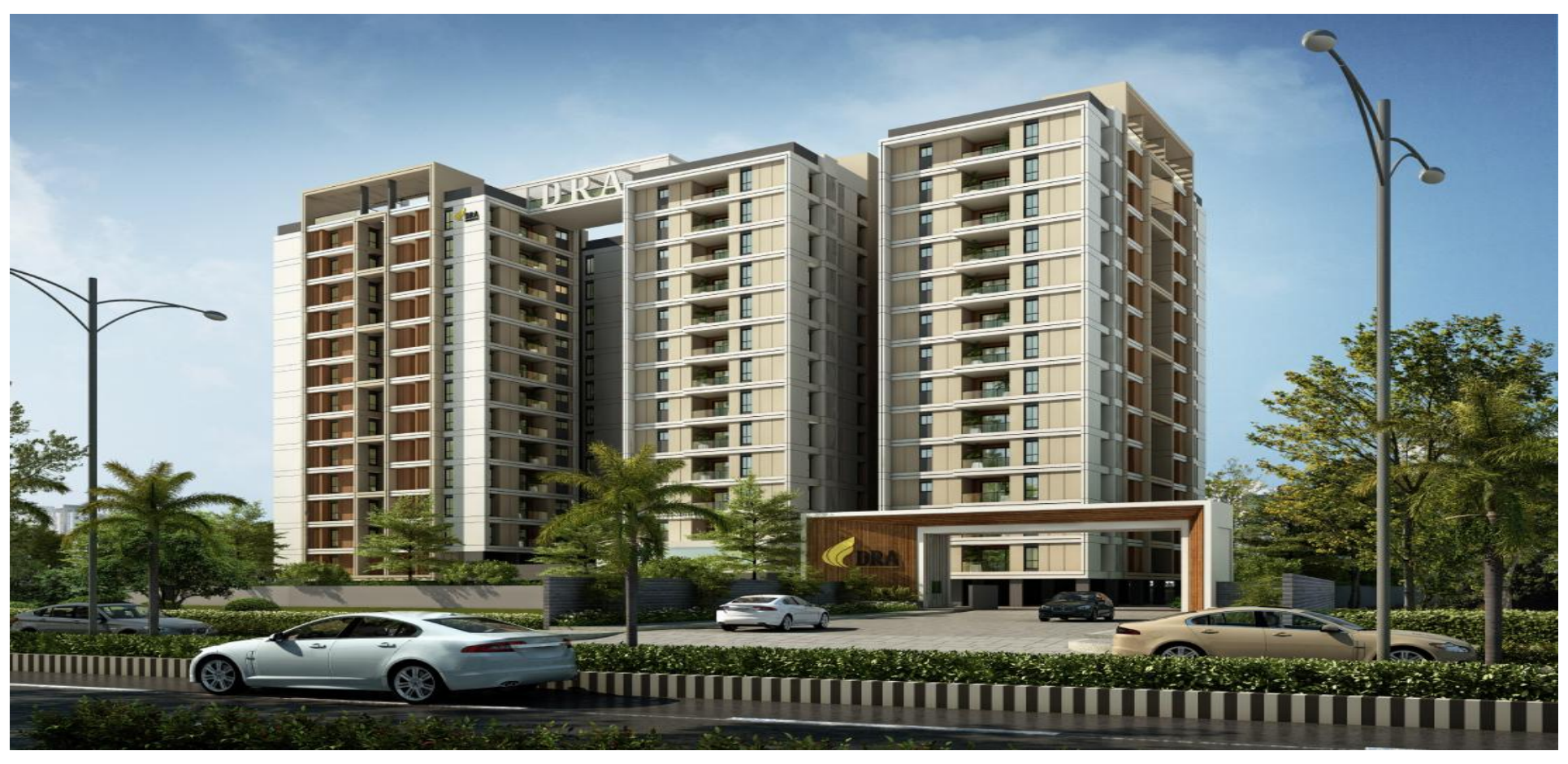
DRA SKYLANTIS CONSTRUCTION UPDATE PHOTOS JANUARY 2025