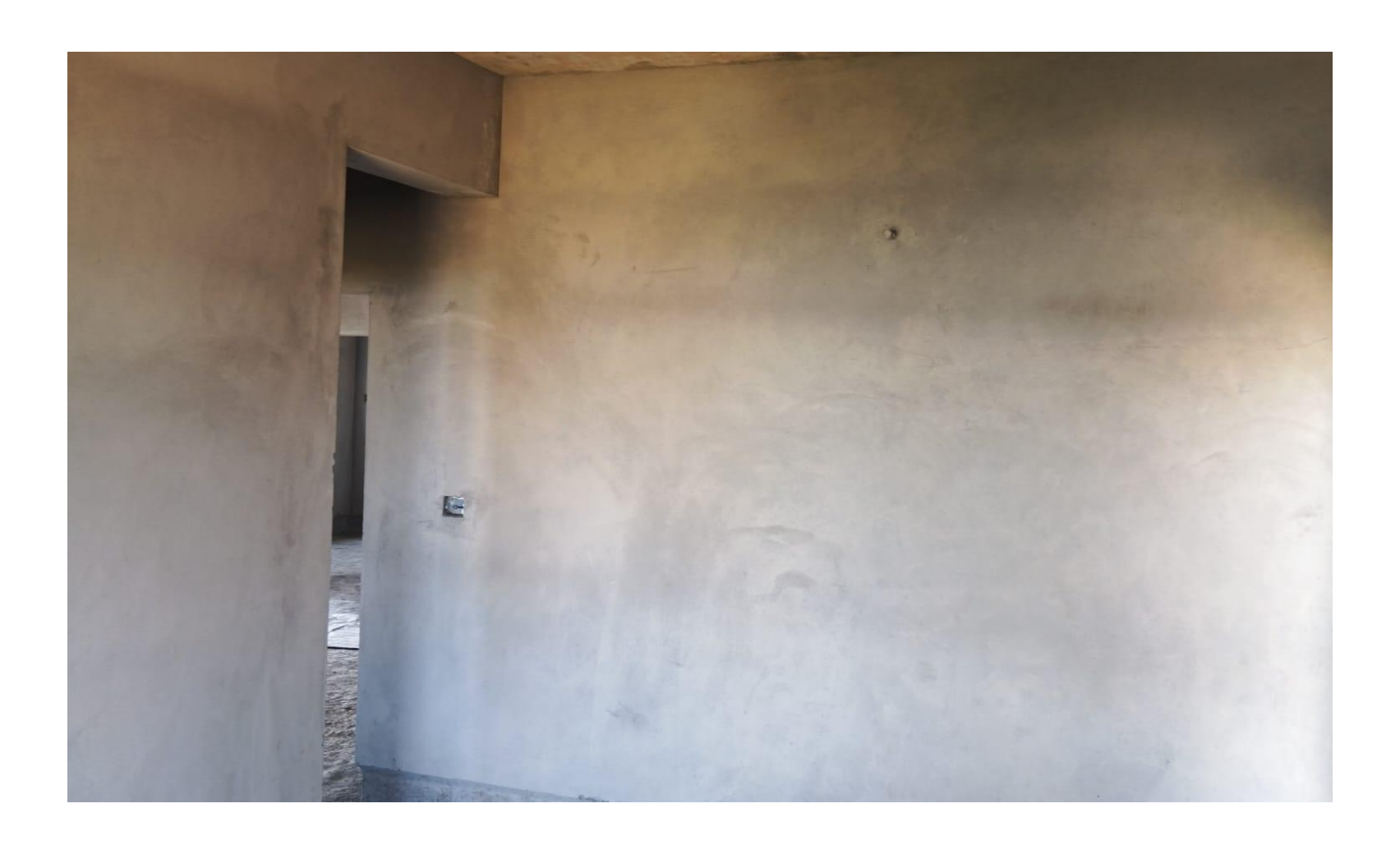
BLOCK 2 POUR 1 - FIFTH FLOOR INTERNAL PLASTERING WORK COMPLETED