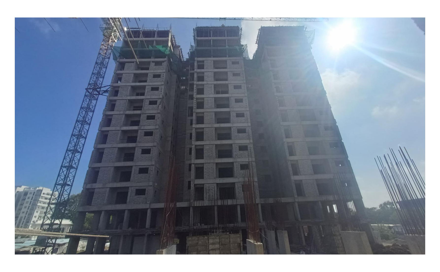
BLOCK 1 - NORTH SIDE ELEVATION