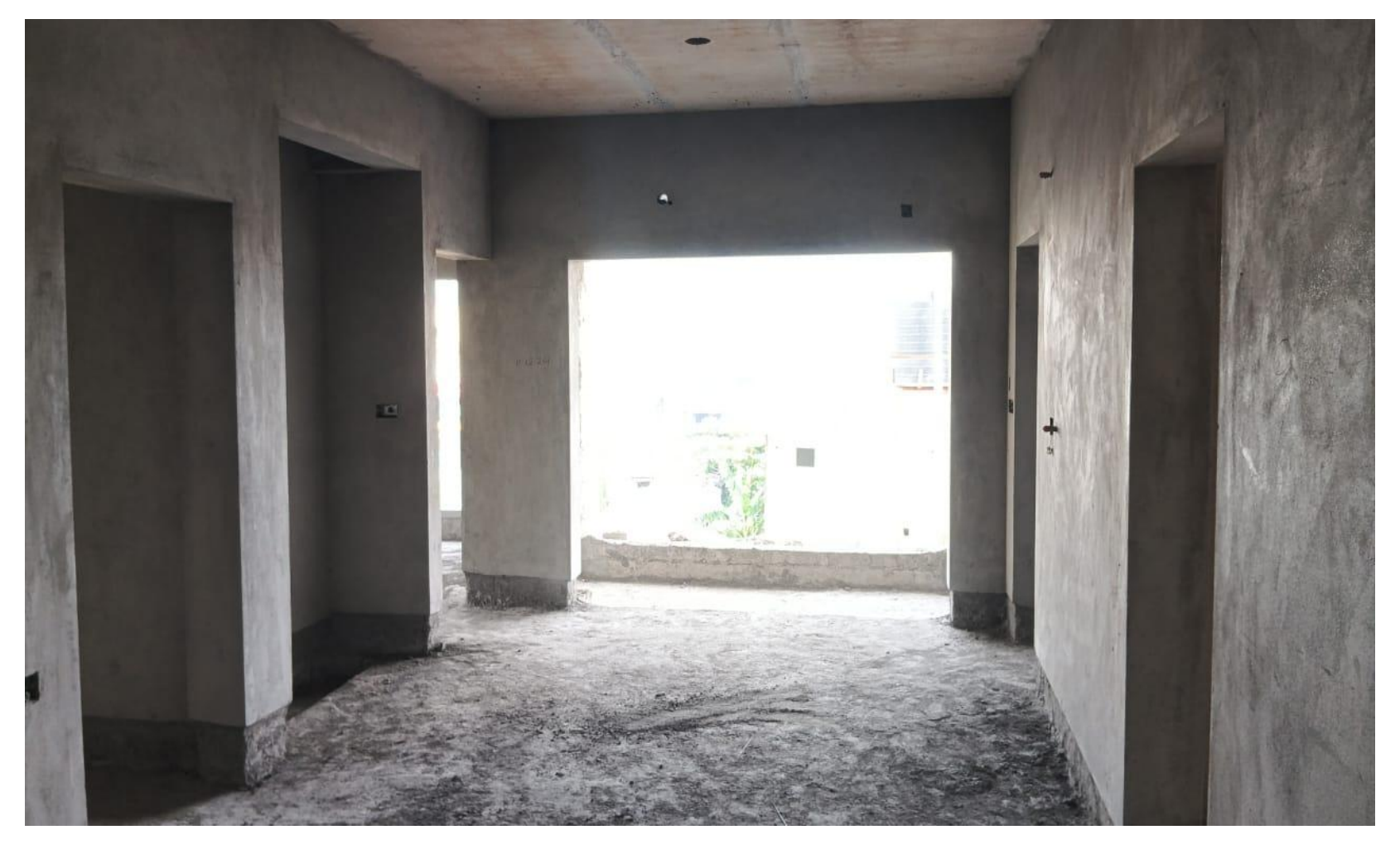
BLOCK 1 - EIGHTH FLOOR INTERNAL PLASTERING WORK COMPLETED