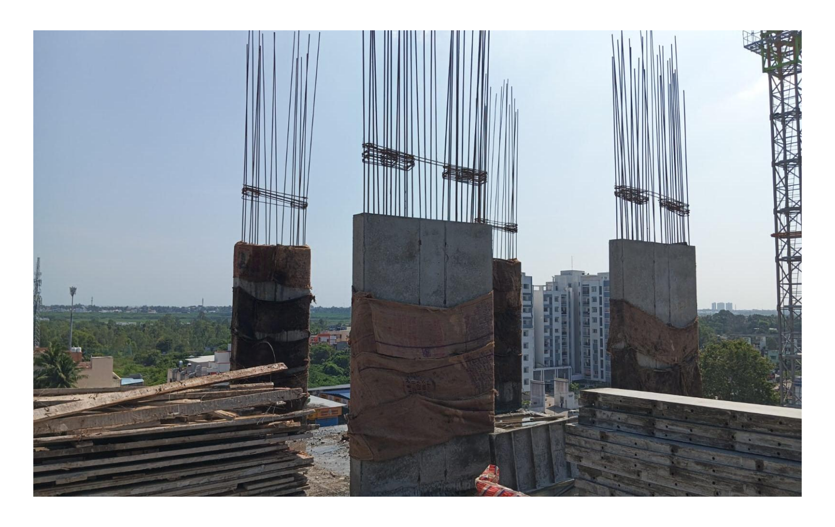
BLOCK 2 POUR 1 - EIGHTH FLOOR COLUMN COMPLETED