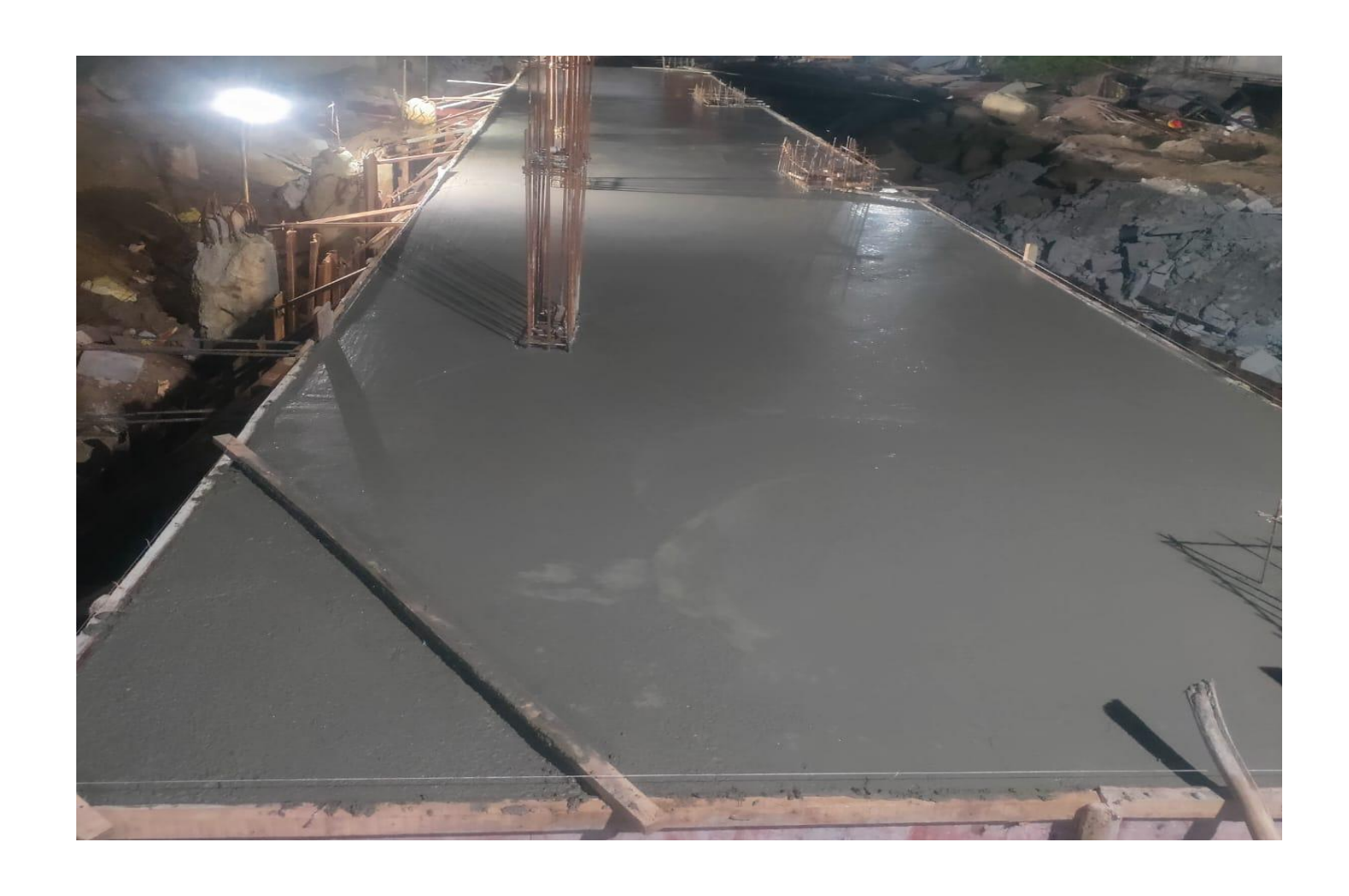
UG SUMP - COVER SLAB COMPLETED