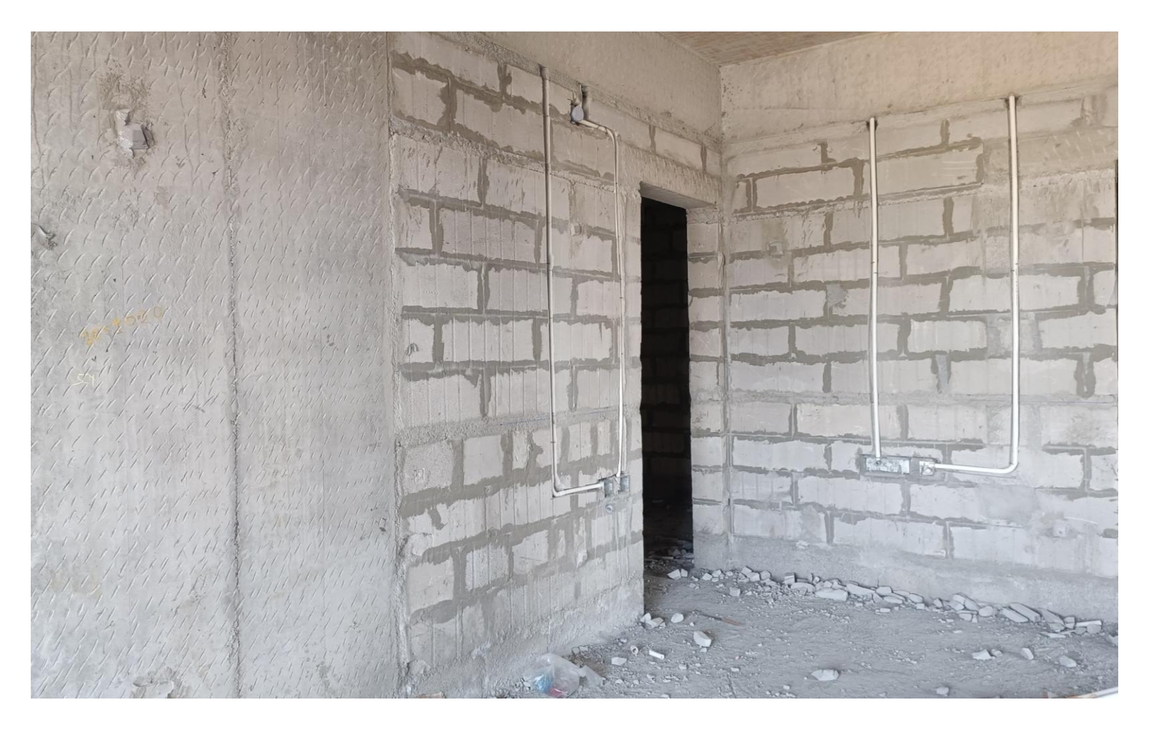
BLOCK 1 - NINTH FLOOR ELECTRICAL WALL CHASING WORK IN PROGRESS