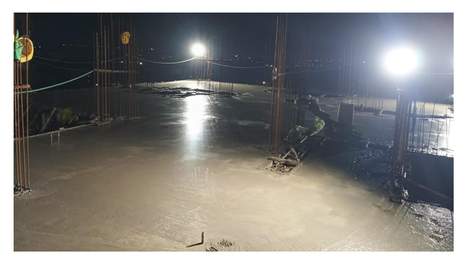
BLOCK 2 POUR 1 - EIGHTH FLOOR ROOF SLAB WORK COMPLETED