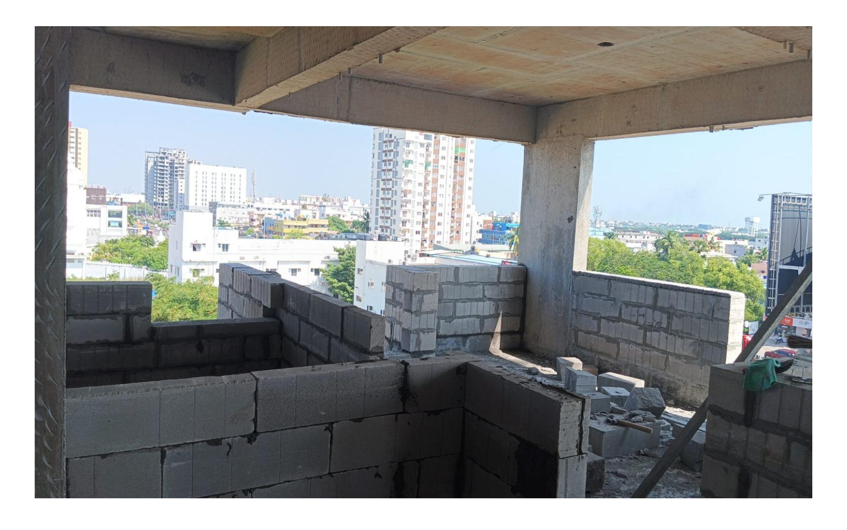
BLOCK 2 POUR 1 - SEVENTH FLOOR BLOCK WORK IN PROGRESS