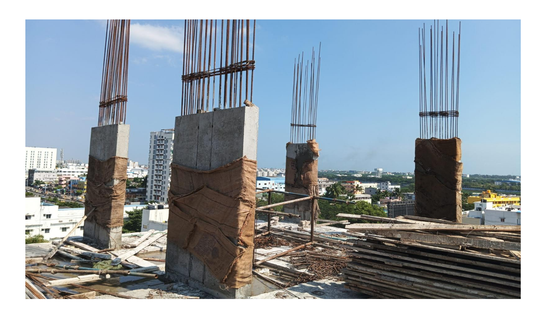
BLOCK 1 - THIRTEENTH FLOOR COLUMN COMPLETED