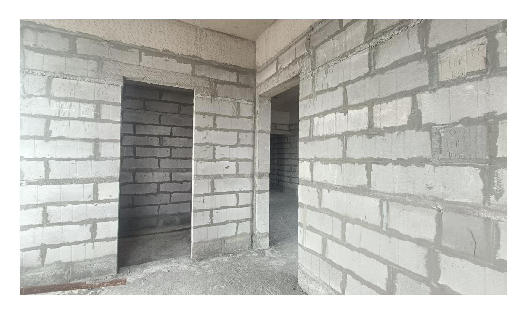
BLOCK 1 - TENTH FLOOR BLOCK WORK IN PROGRESS