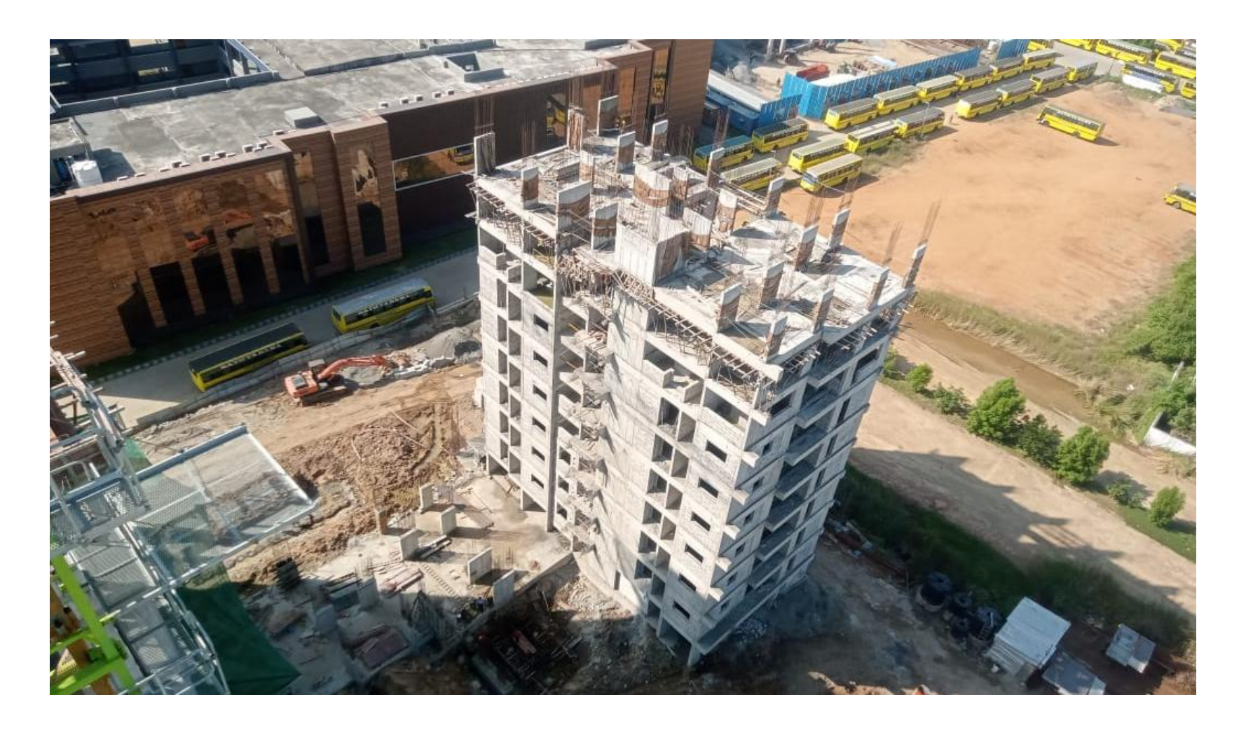
BLOCK 2 POUR 1 - TOP VIEW