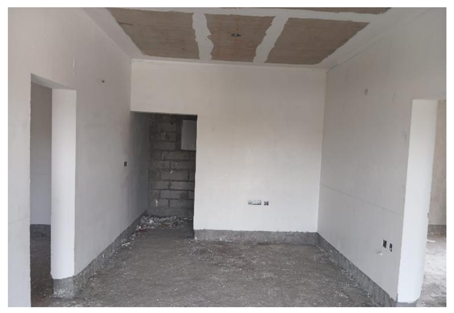
BLOCK 2 POUR 1 – SIXTH FLOOR WALL & CEILING PUTTY WORK IN PROGRESS