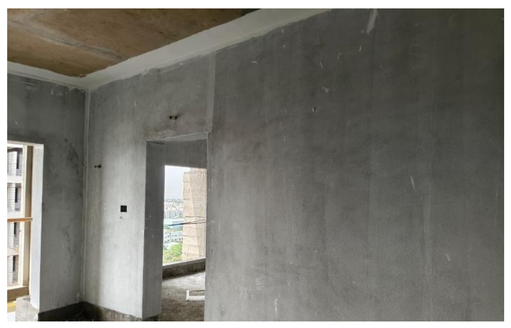
BLOCK 1 – TWELFTH FLOOR PRIMER APPLICATION WORK IN PROGRESS