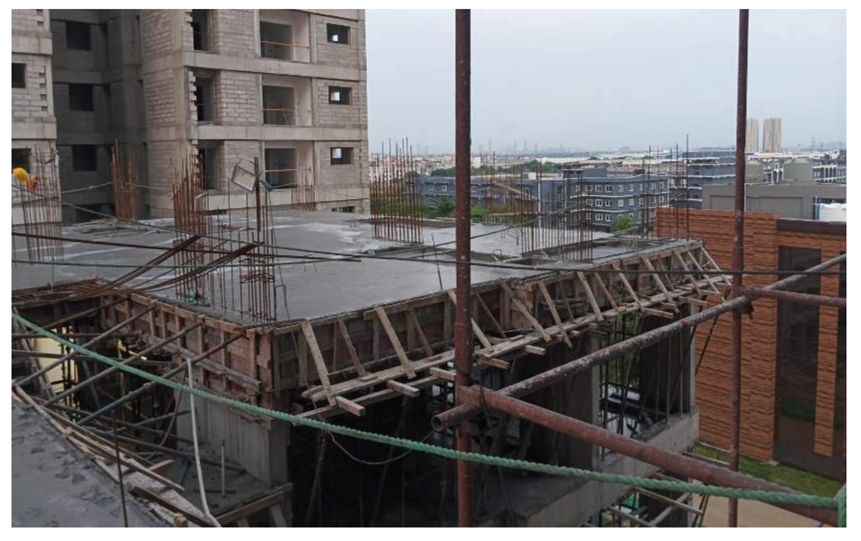
BLOCK 2 POUR 2 – FIFTH FLOOR ROOF SLAB CONCRETE COMPLETED