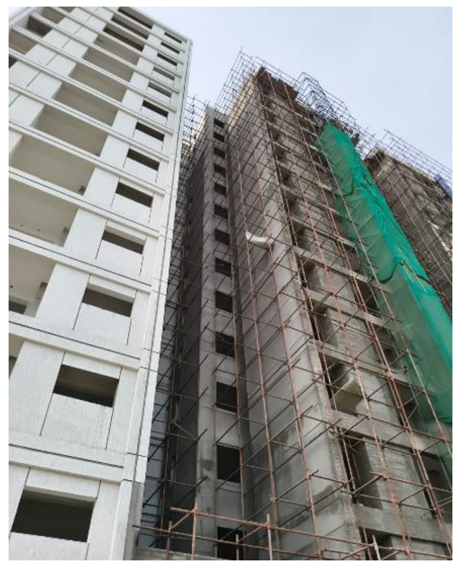
BLOCK 1 - EXTRENAL TEXTURE (SOUTH SIDE) WORK IN PROGRESS