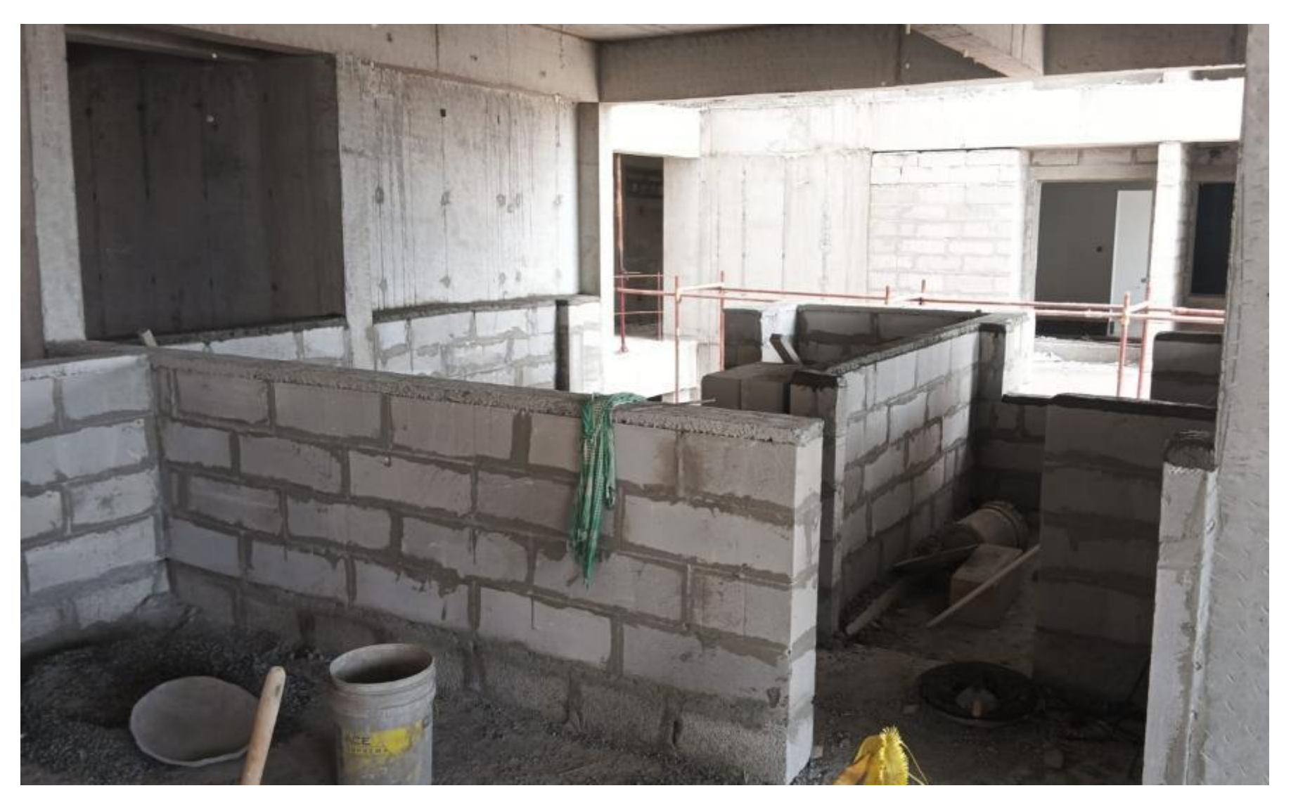
BLOCK 2 POUR 2 – SECOND FLOOR BLOCK WORK IN PROGRESS