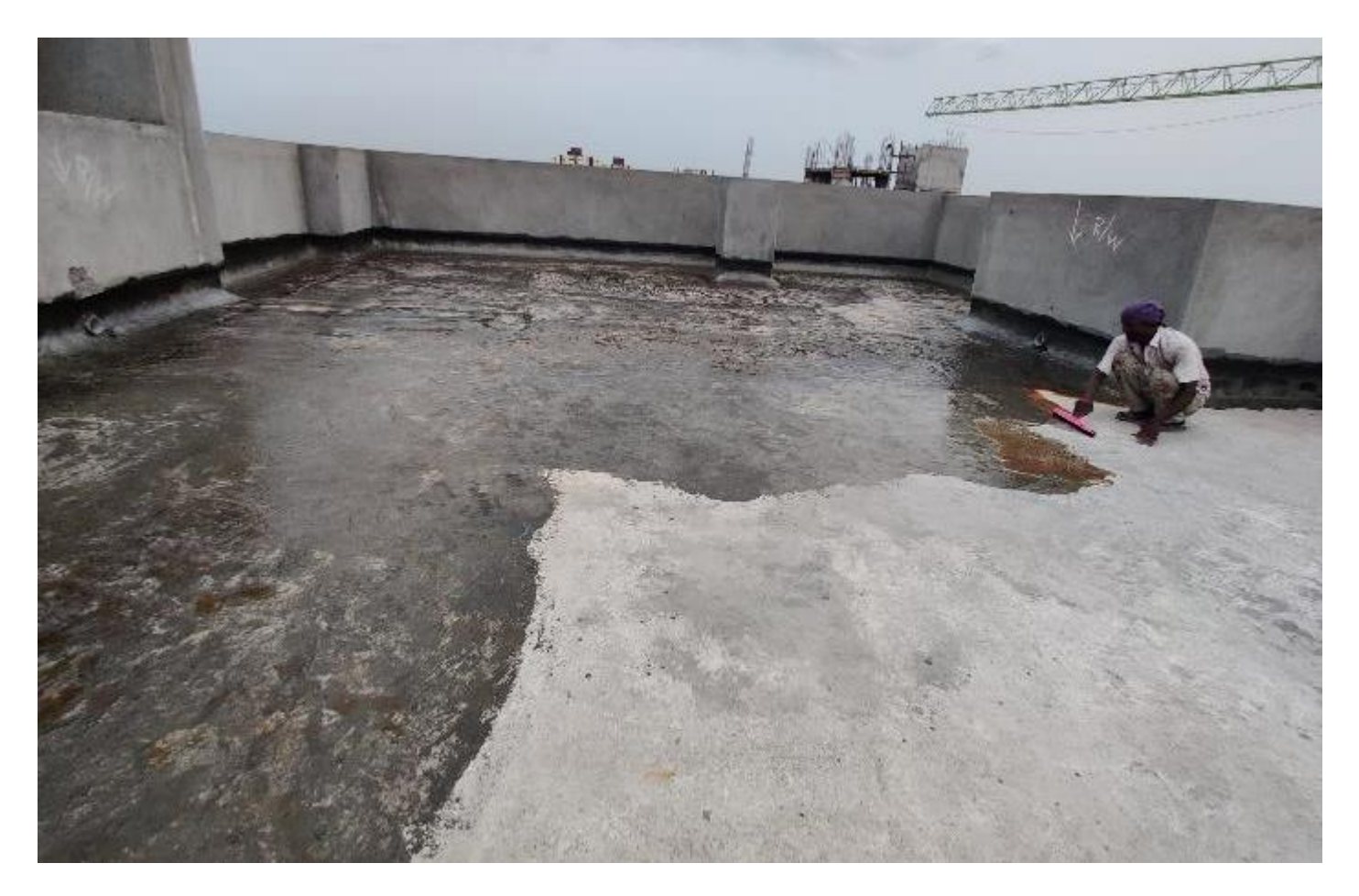
BLOCK 1 – TERRACE FLOOR WATERPROOFING WORK IN PROGRESS