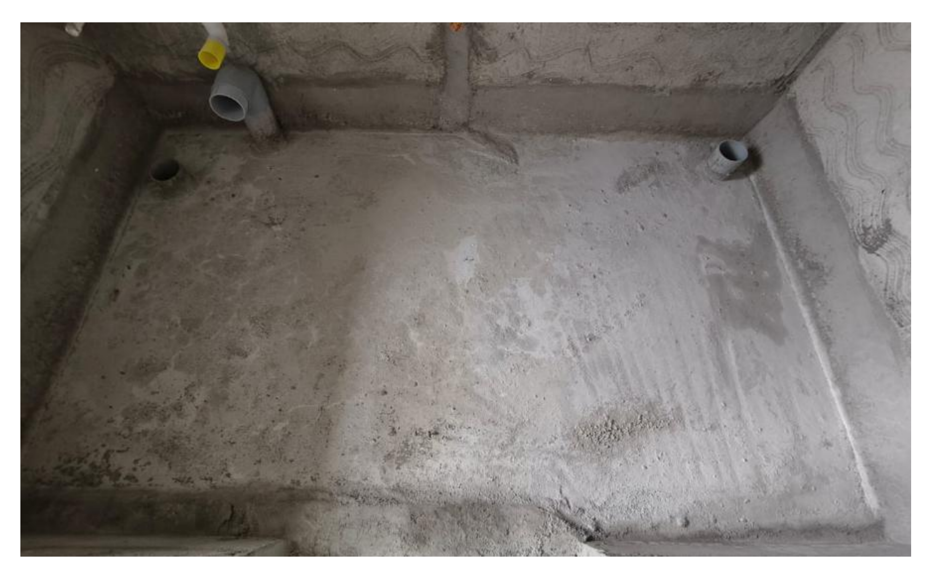
BLOCK 1 – TENTH FLOOR SUNKEN FILLING WORK COMPLETED