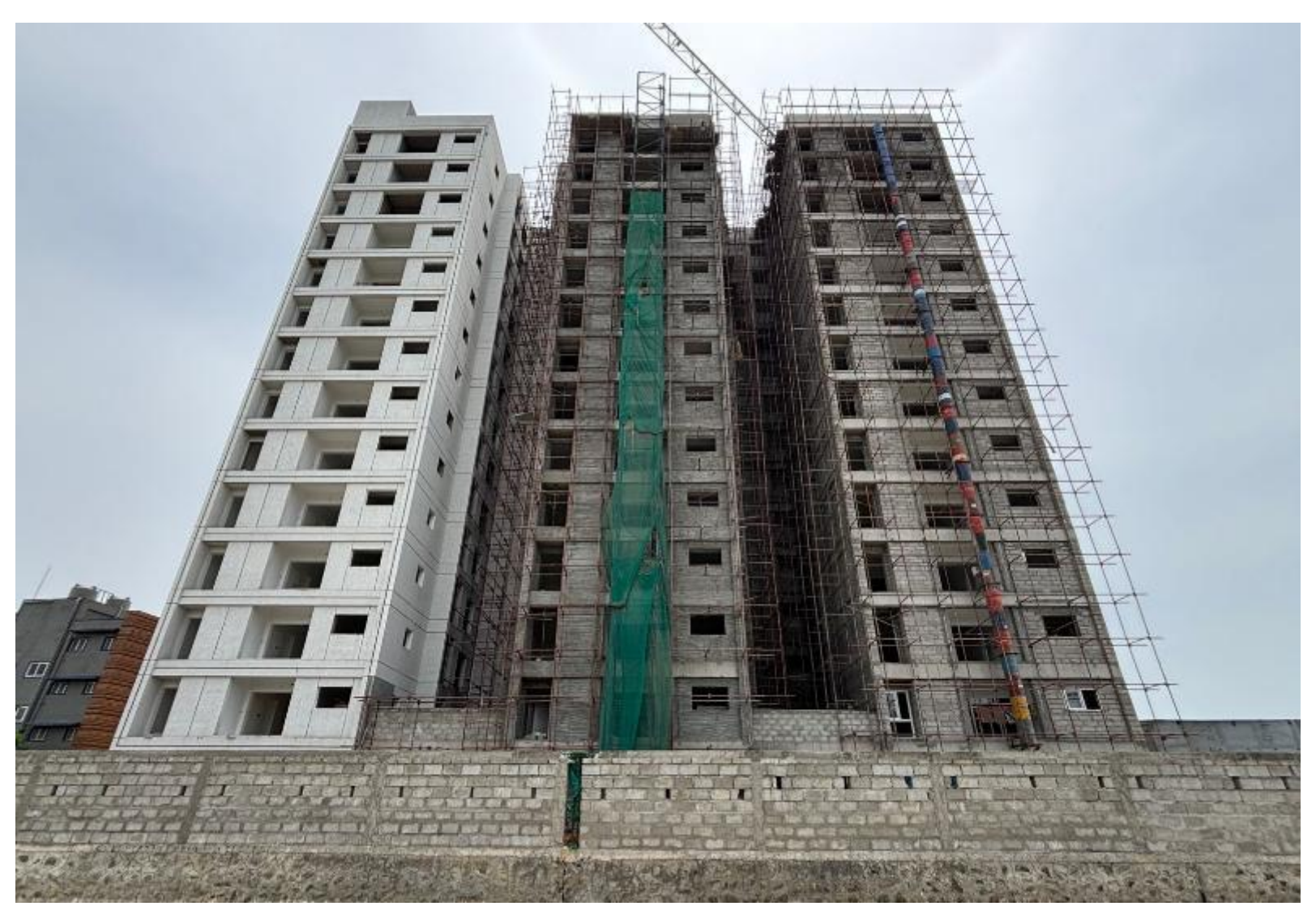
SOUTH SIDE ELEVATION