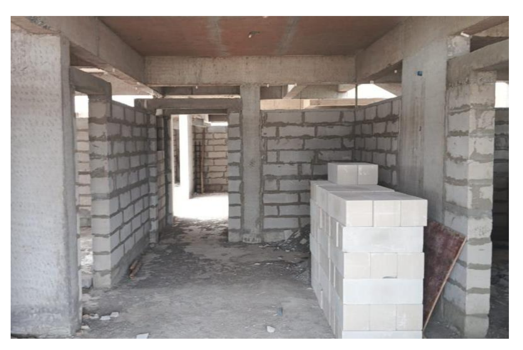
BLOCK 2 POUR 1 – THIRTEENTH BLOCK WORK IN PROGRESS