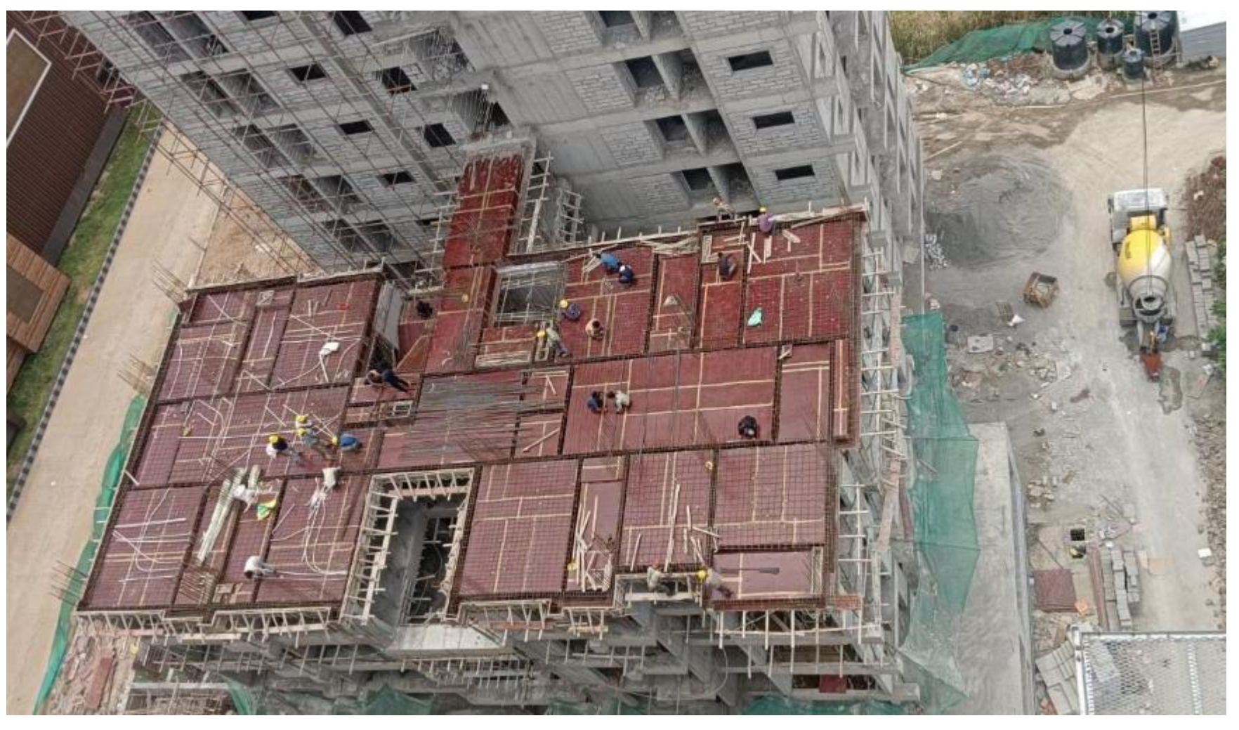
BLOCK 2 POUR 2 - TOP VIEW