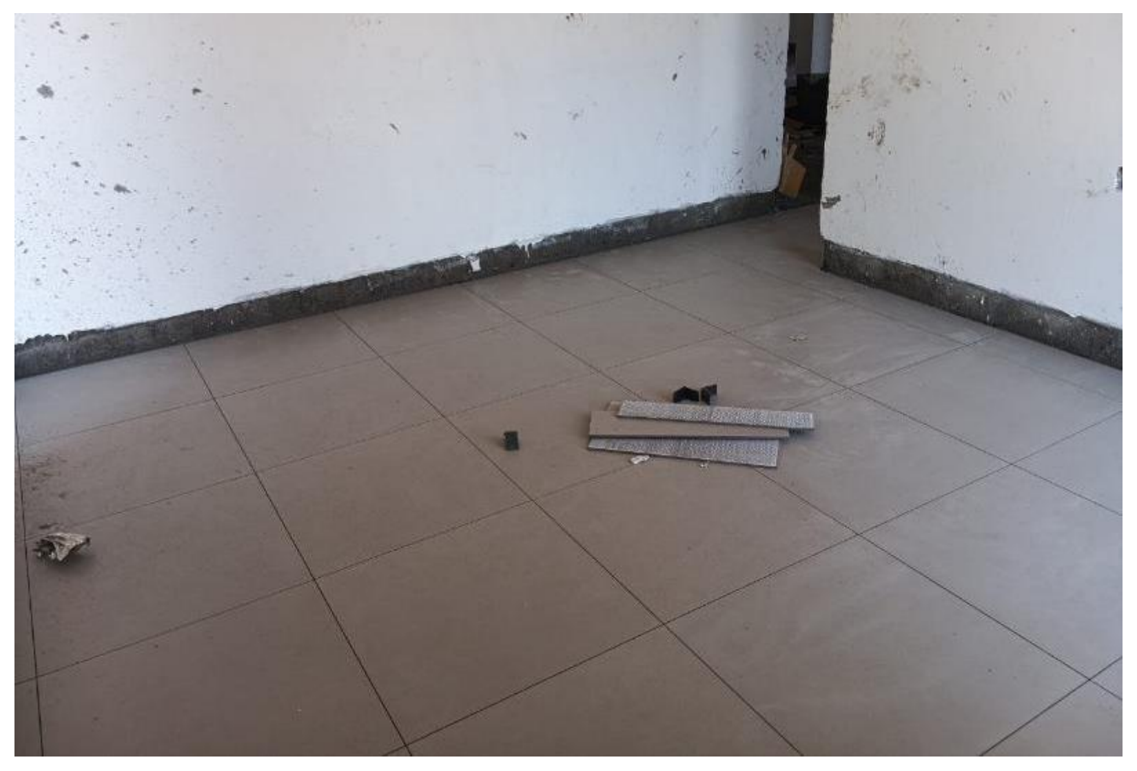
BLOCK 2 POUR 1 - FIRST FLOOR TILES LAYING WORK IN PROGRESS