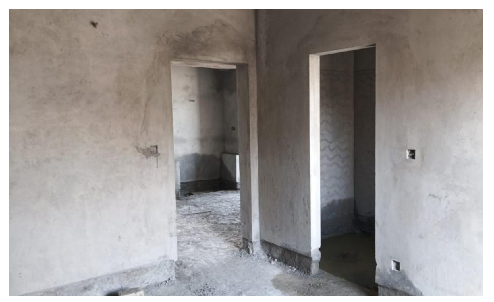
BLOCK 2 POUR 1 – TWELFTH FLOOR INNER PLASTERING COMPLETED