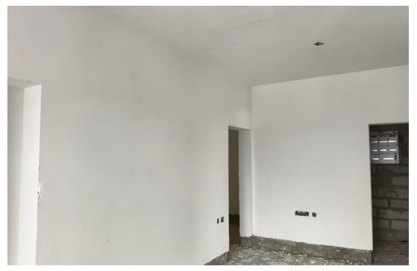
BLOCK 1 – ELEVANTH FLOOR CEILING & WALL FIRST COAT PUTTY WORK IN PROGRESS