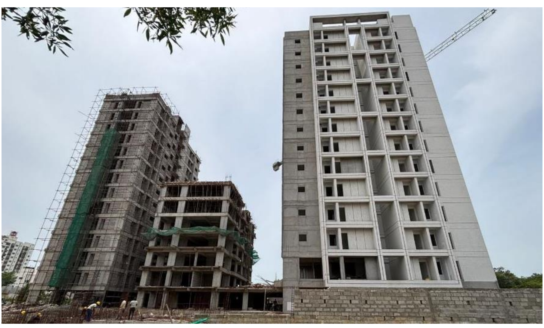
EAST SIDE ELEVATION