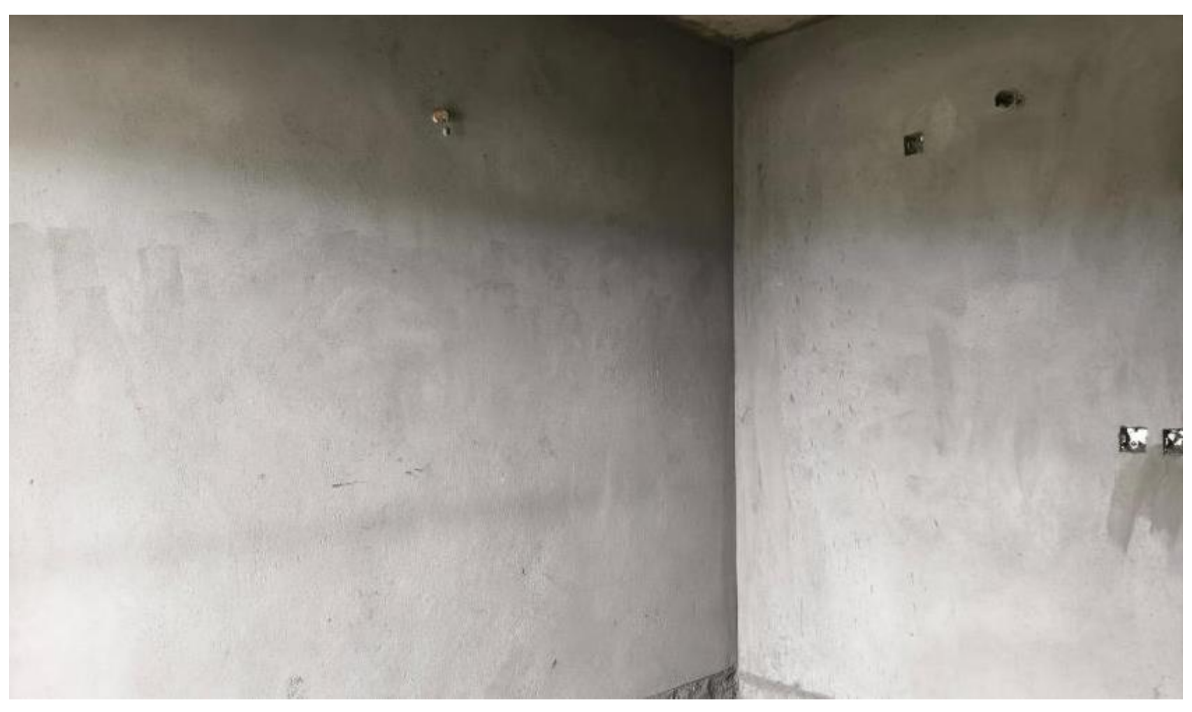
BLOCK 1 - THIRTEENTH FLOOR INTERNAL PLASTERING WORK COMPLETED