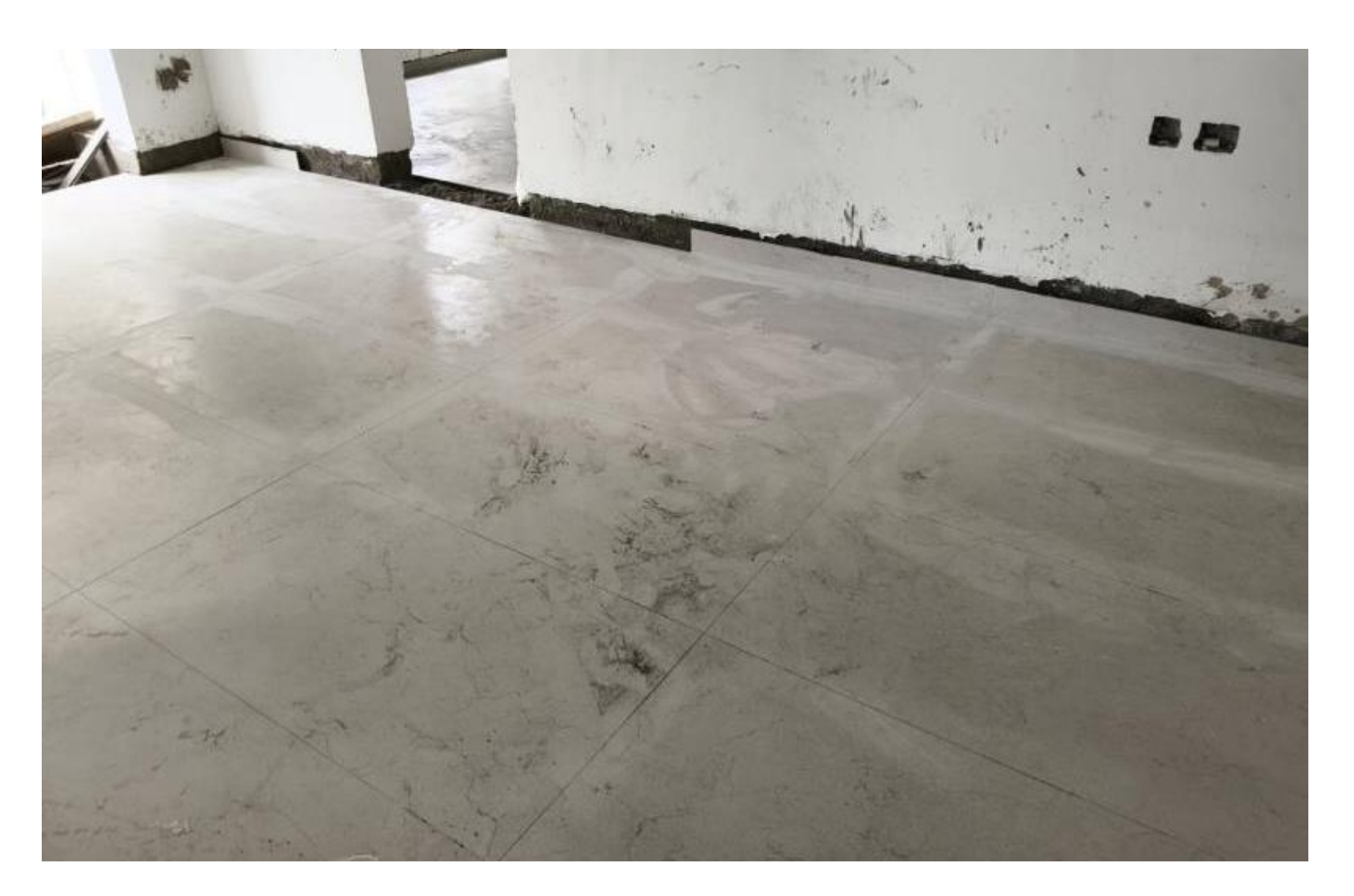
BLOCK 1 – SIXTH FLOOR TILES LAYING WORK IN PROGRESS