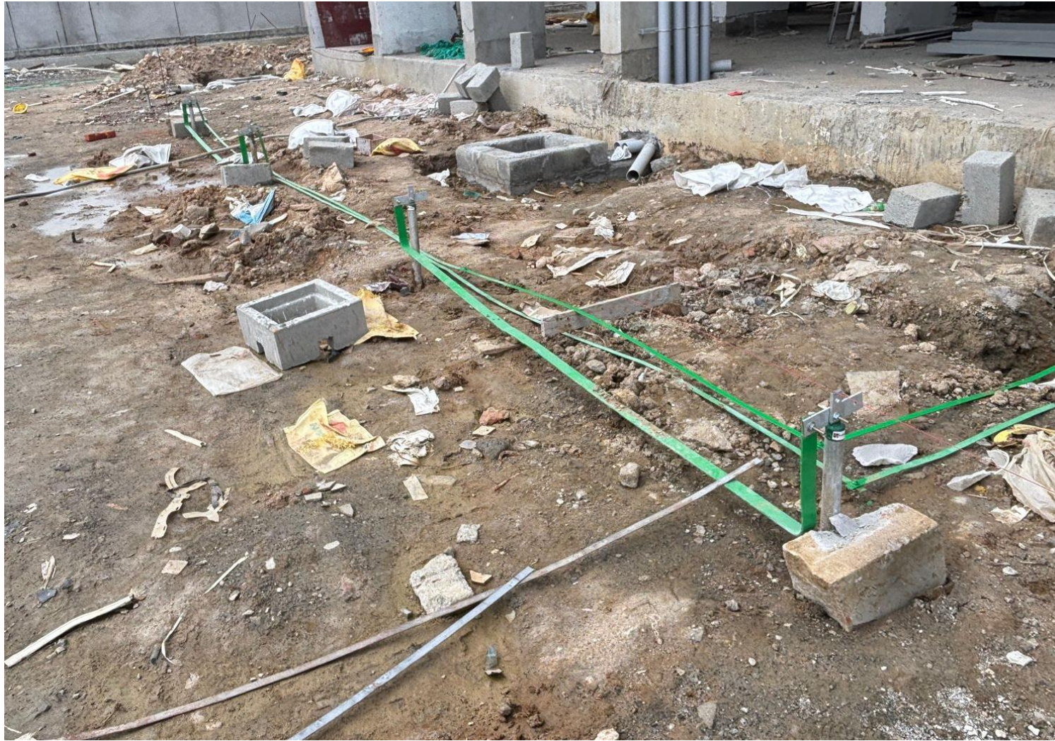
LIGHTENING ARESSTOR EARTHENING WORK IN PROGRESS