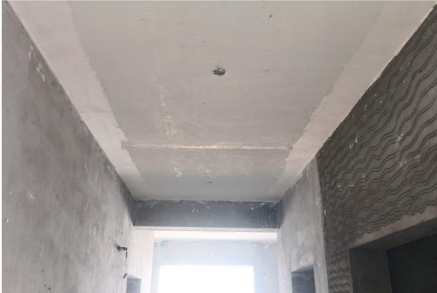
BLOCK 2 POUR 1 – CORRIDOR COURSE PUTTY WORK IN PROGRESS