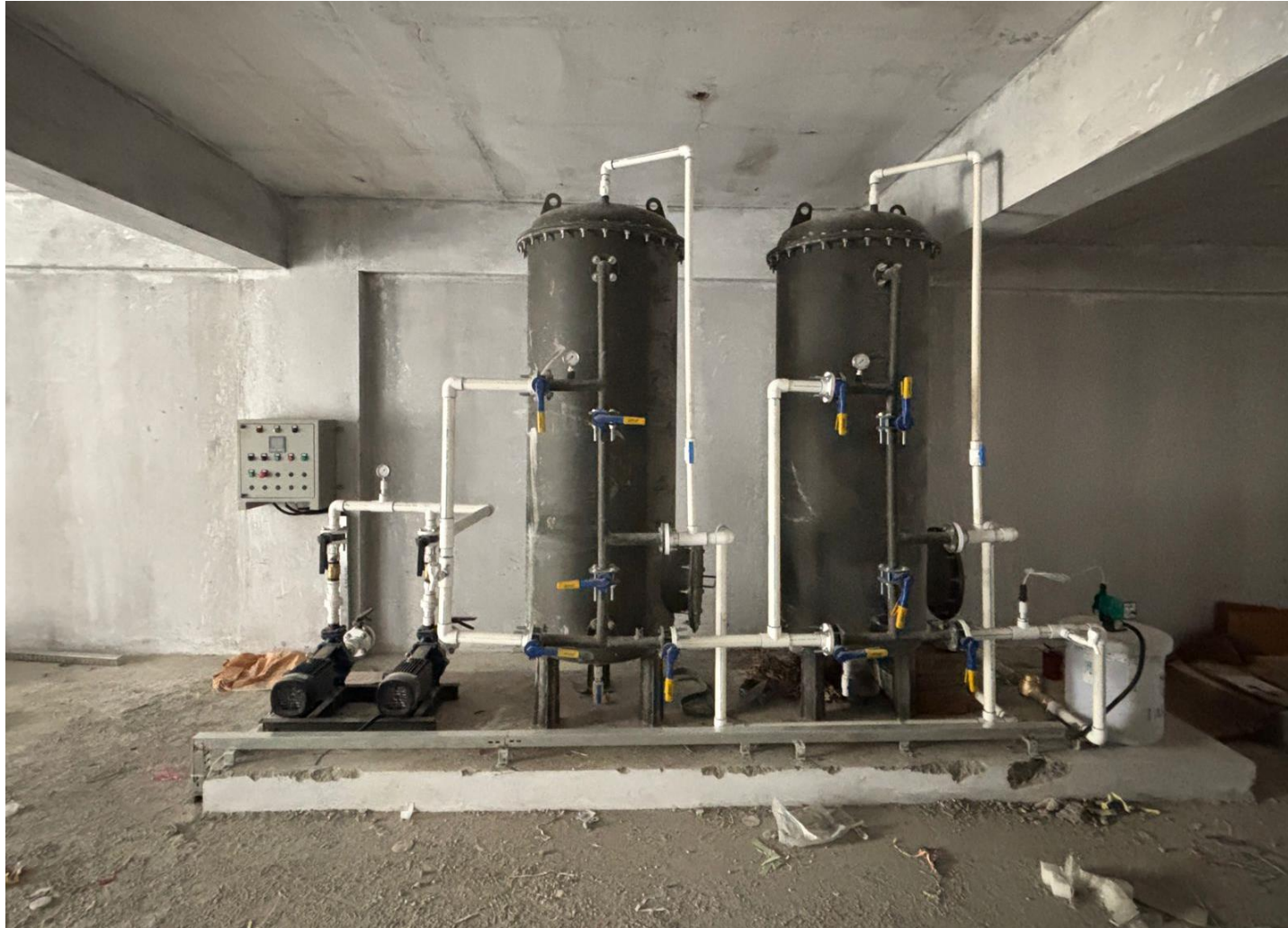
UG SUMP – FILTER FEEDPUMP INSTALLATION WORK IN PROGRESS