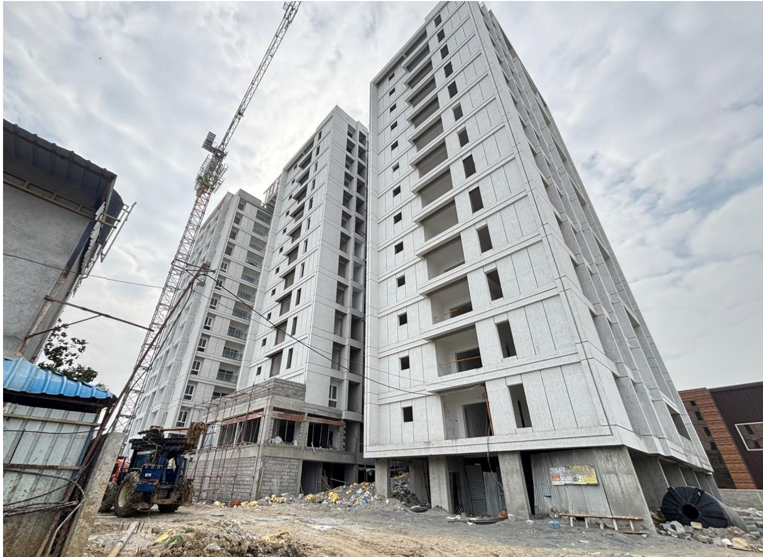
ELEVATION FROM ENTRANCE