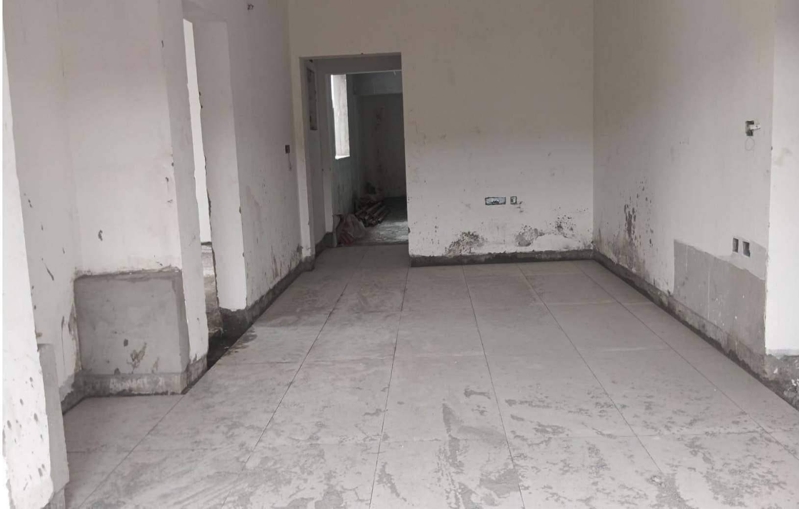
BLOCK 2 POUR 1 – SECOND SERIES LIVING ROOM TILES LAYING WORK IN PROGRESS