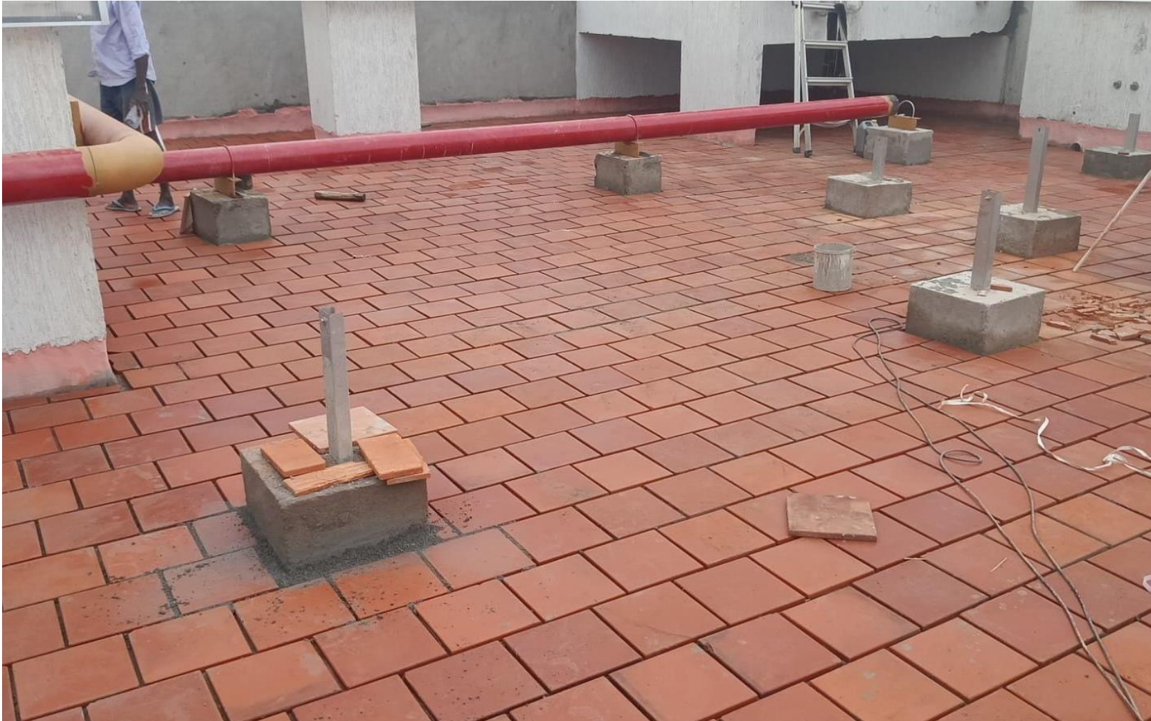
BLOCK 1- TERRACE FLOOR FIRE FIGHTING WORK IN PROGRESS