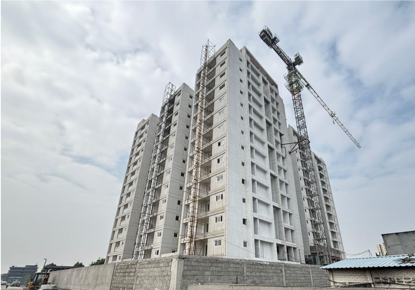
ELEVATION SOUTH EAST