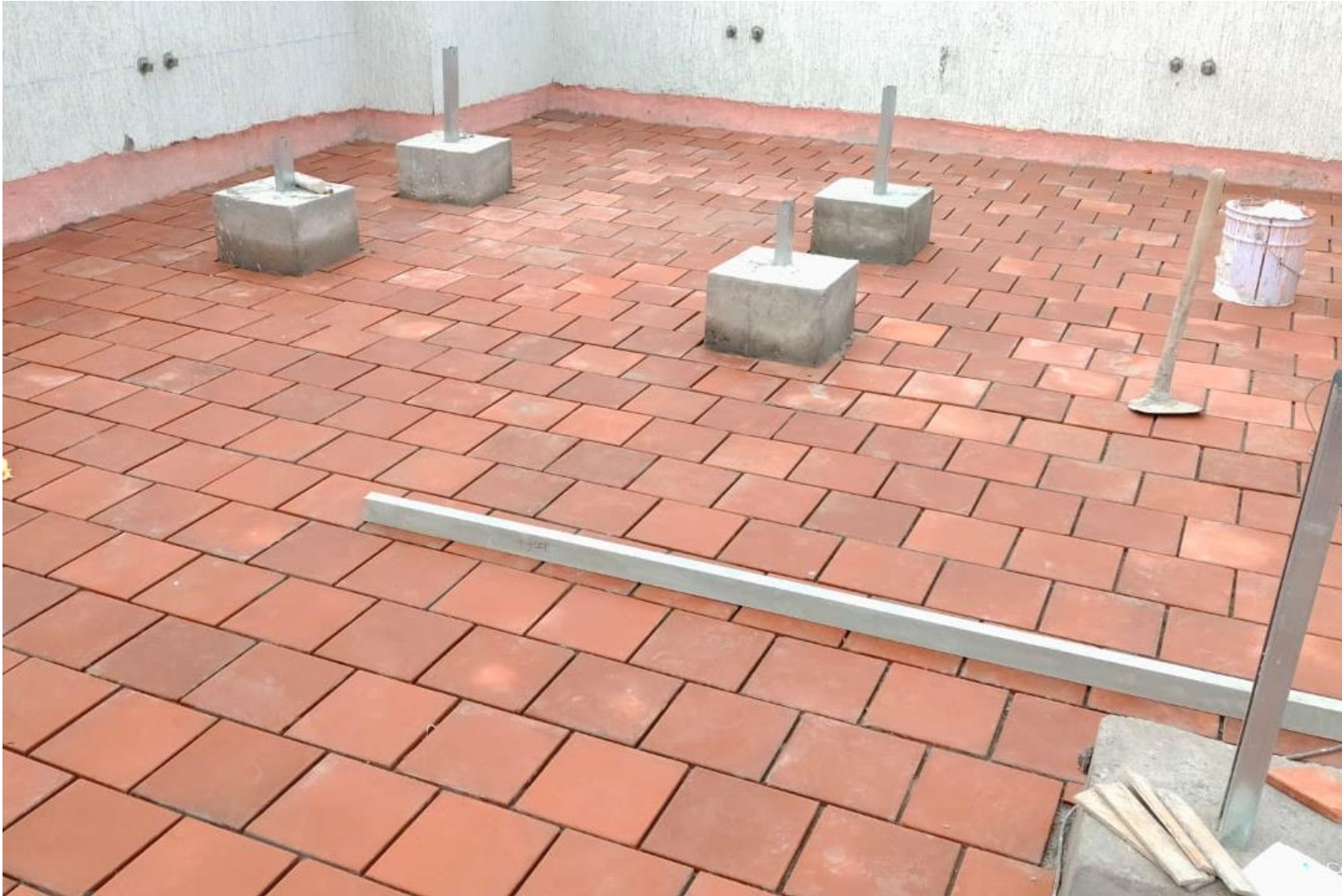
BLOCK 1 – TERRACE PRESSED CLAY TILE LAYING WORK IN PROGRESS