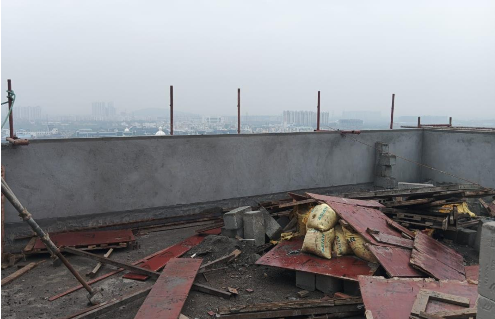
BLOCK 2 POUR 2 – TERRACE PARAPET WALL PLASTERING WORK IN PROGRESS