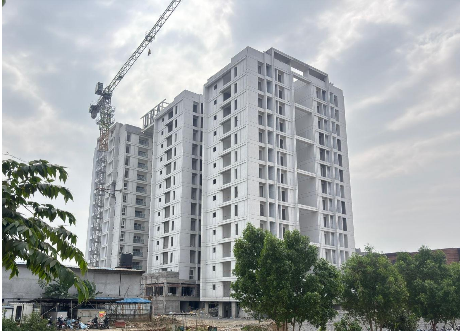
ELEVATION NORTH EAST