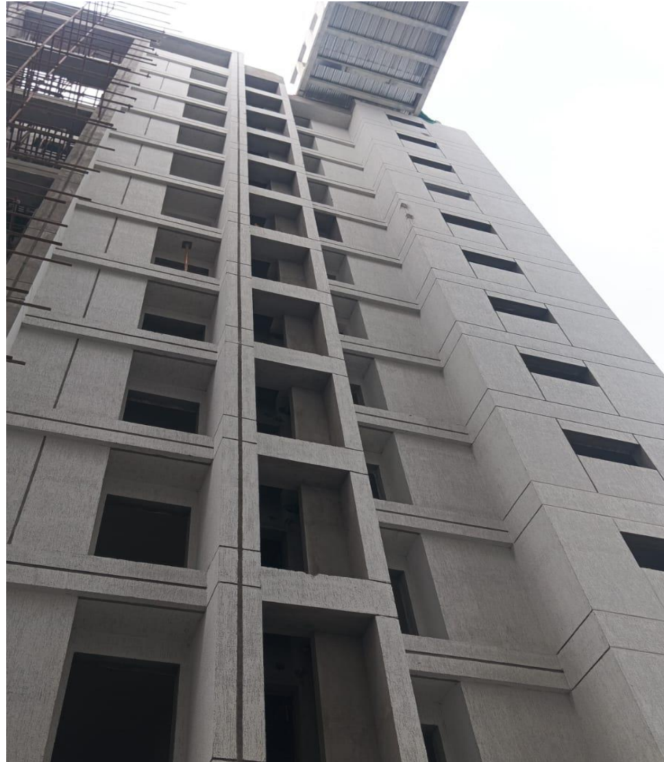
BLOCK 2 POUR 2 – SOUTH SIDE EXTERNAL TEXTURE WORK IN PROGRESS