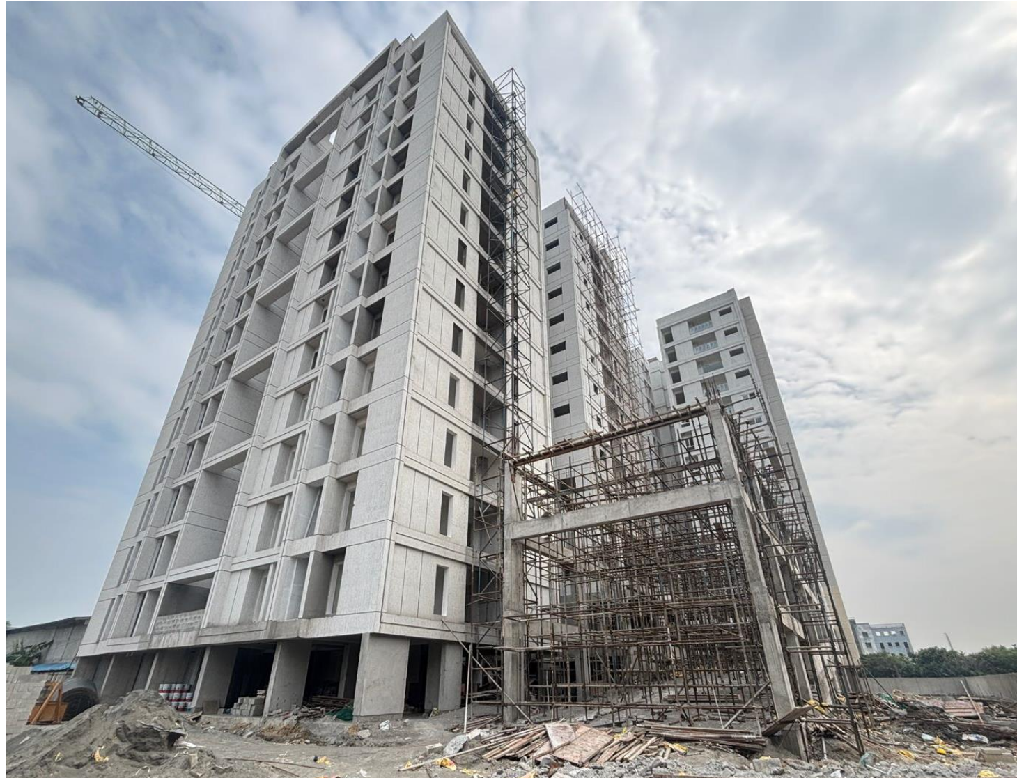
ELEVATION NORTH WEST