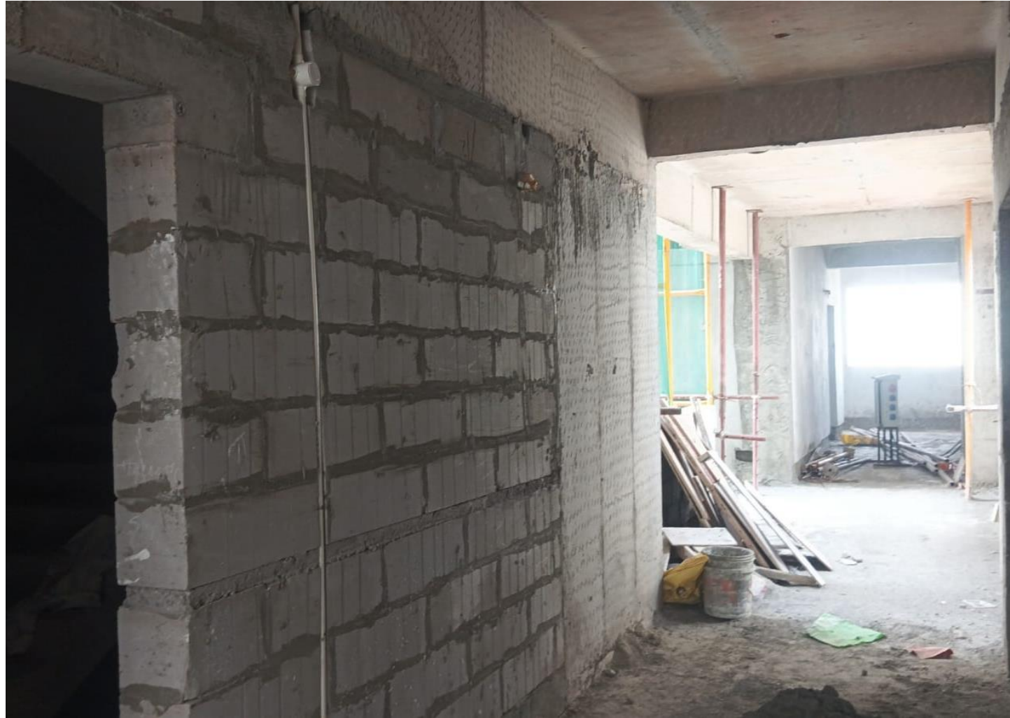
BLOCK 2 POUR 2 – CORRIDOR ELECTRICAL WALL CHASING WORK IN PROGRESS