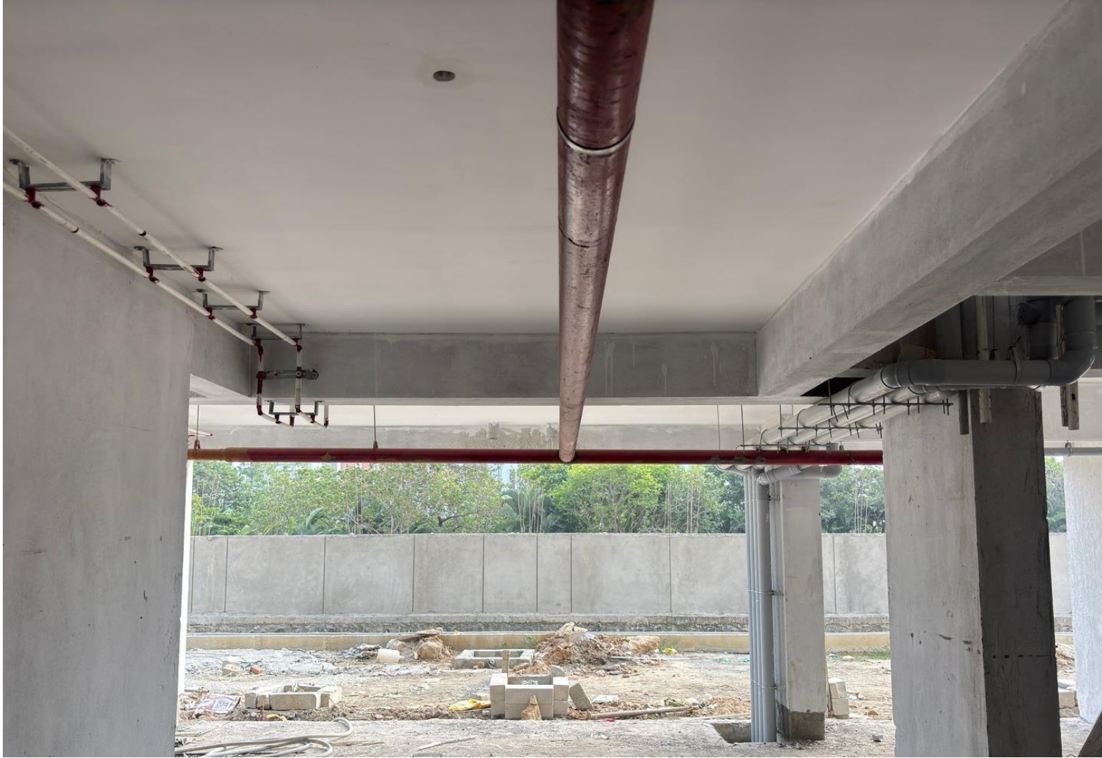
BLOCK 1 STILT FLOOR FIRE FIGHTING HYDRANT PIPE LAYING WORK IN PROGRESS