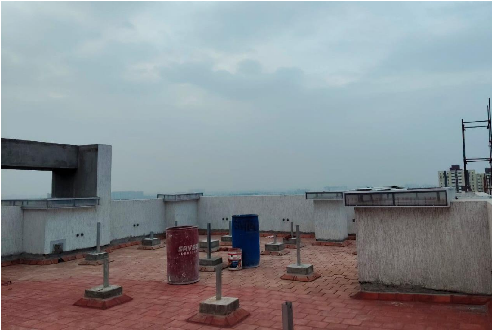
BLOCK 1 – TERRACE OTS COVERING WORK IN PROGRESS