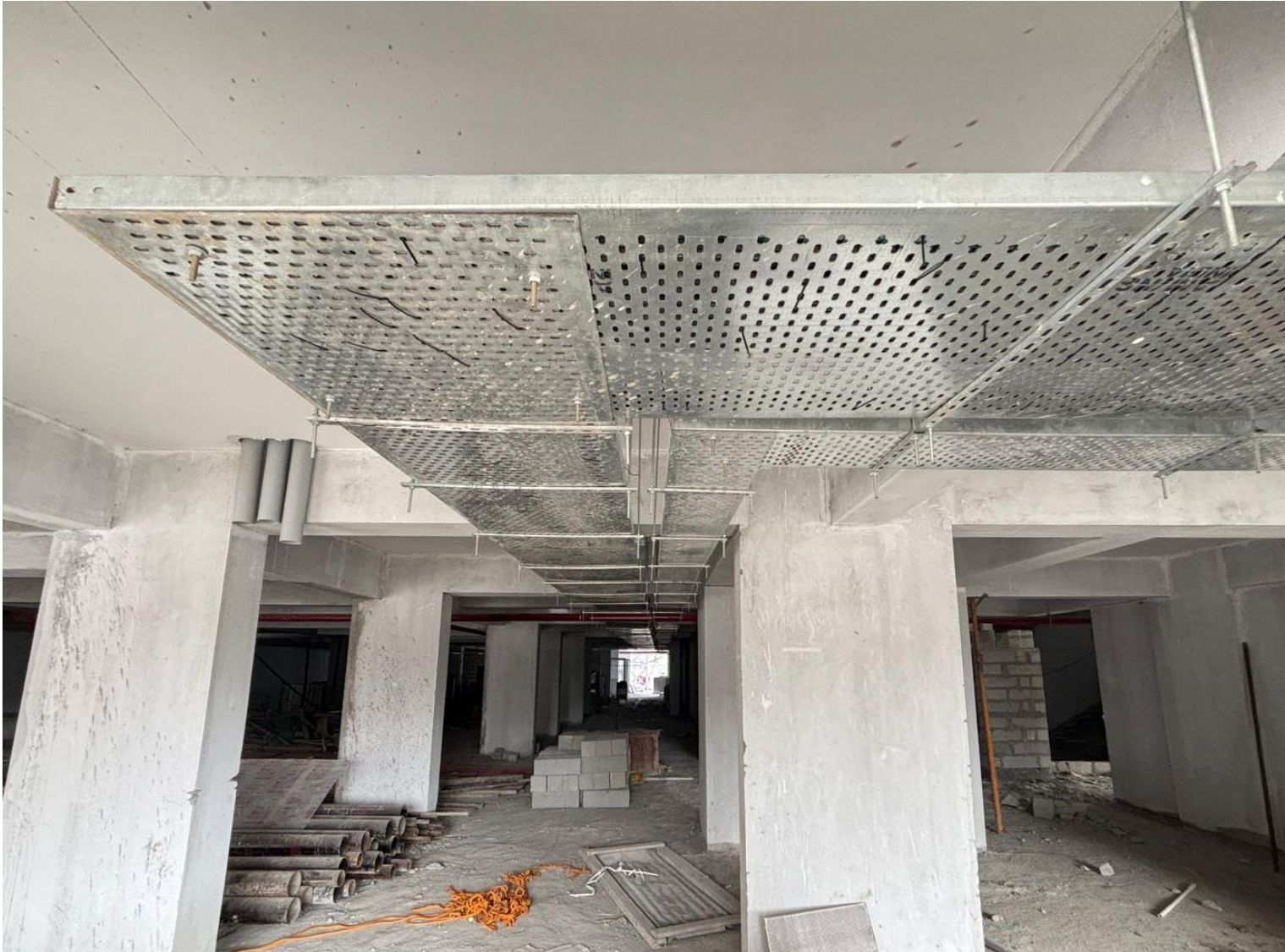
BLOCK 1 STILT FLOOR ELECTRICAL PERFORATED TRAY LAYING WORK IN PROGRESS