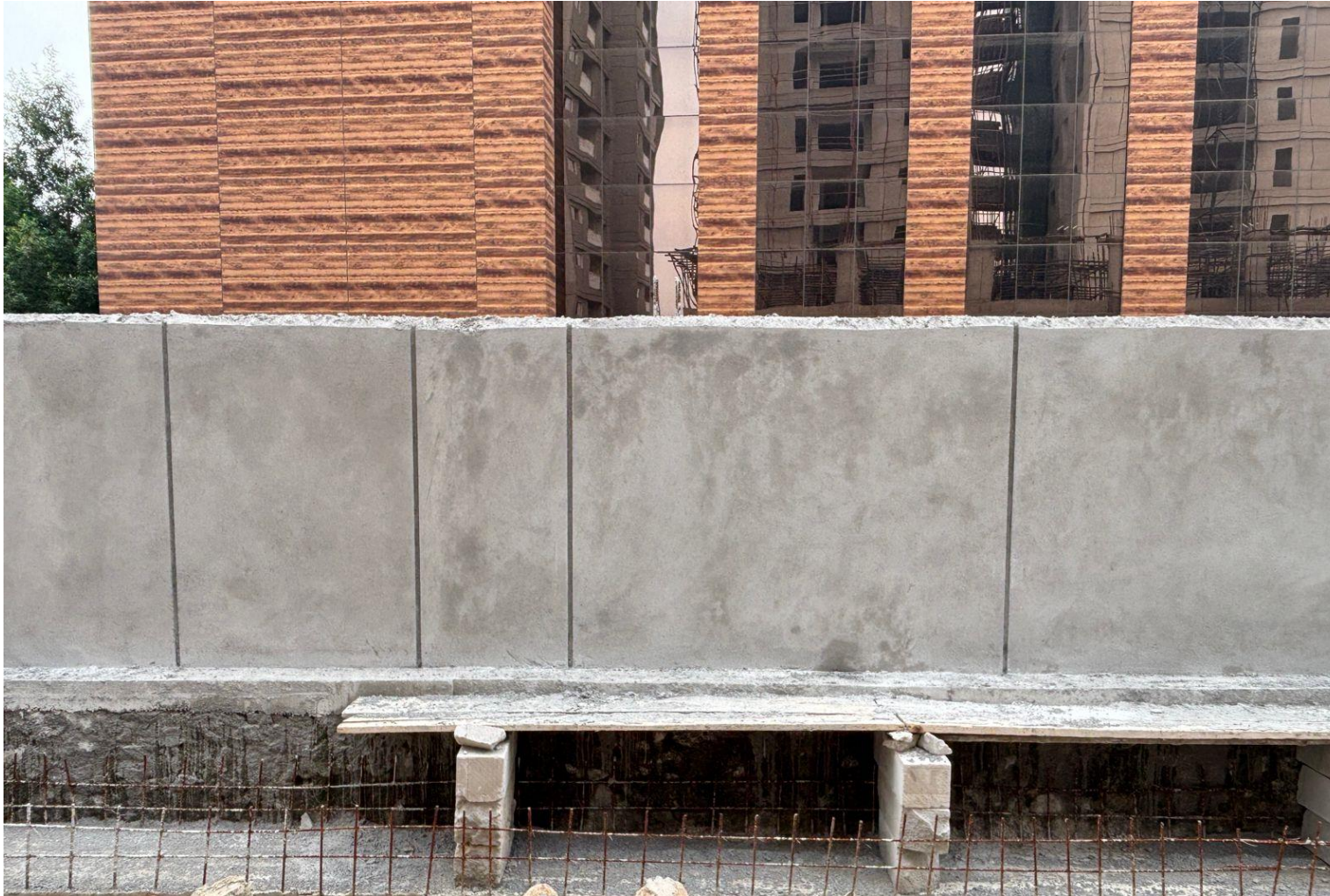
COMPOUND WALL INNER PLASTERING WORK IN PROGRESS