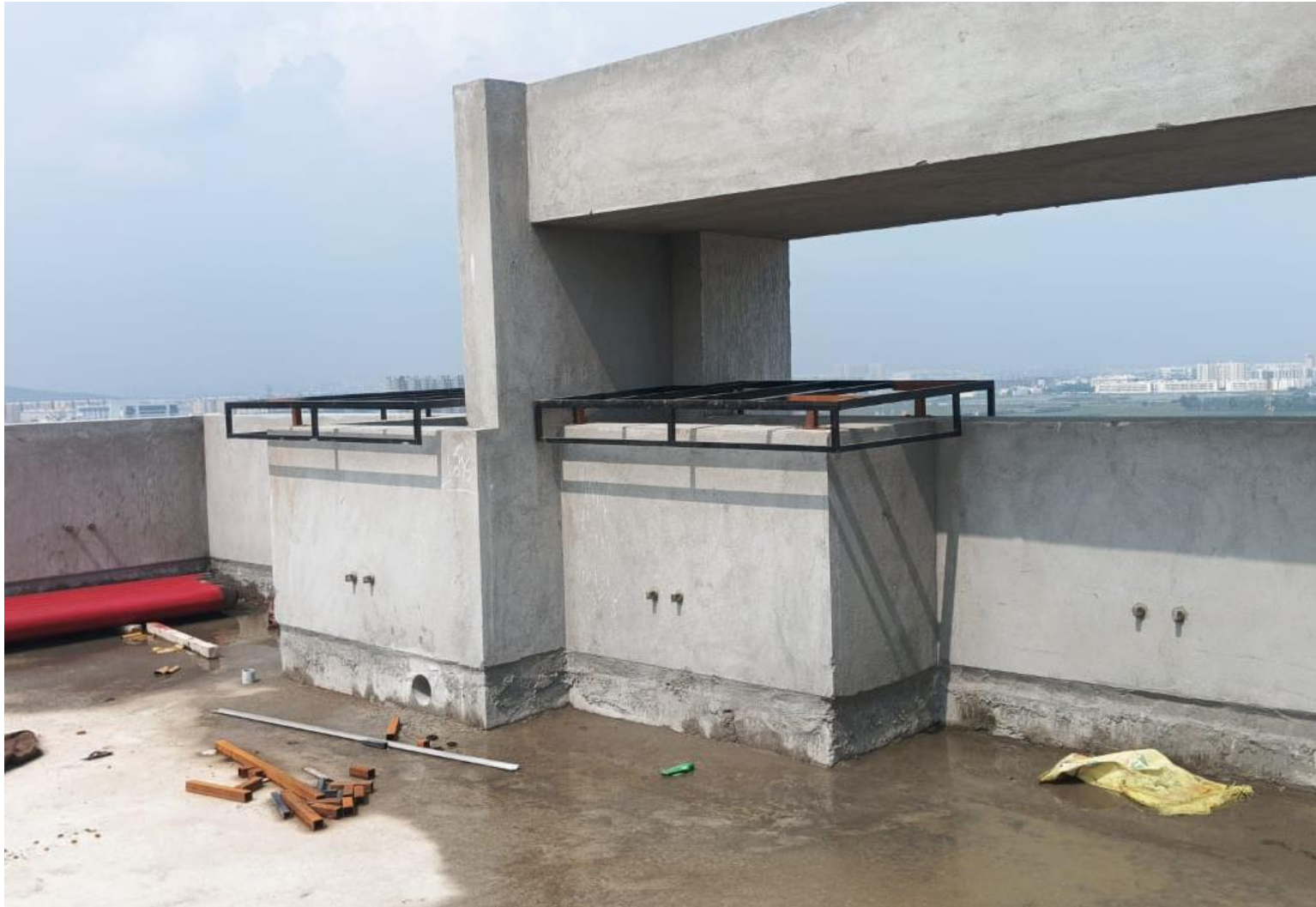
BLOCK 2 POUR 1 – TERRACE OTS COVERING WORK IN PROGRESS