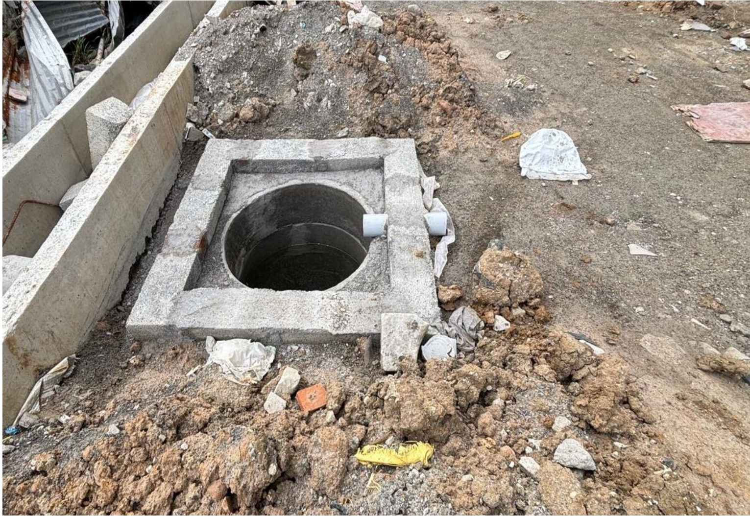
RAIN WATER HARVESTING PIT CHAMBER WORK IN PROGRESS