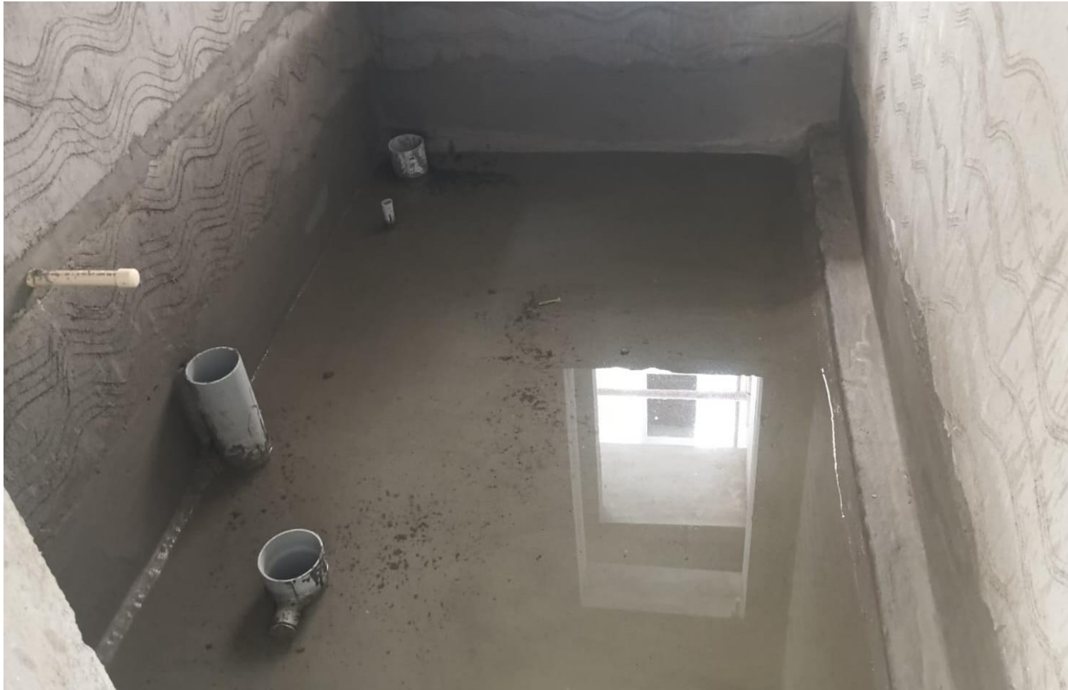
BLOCK 2 POUR 2 – 10 TH FLOOR SUNKEN WATERPROOFING WORK COMPLETED