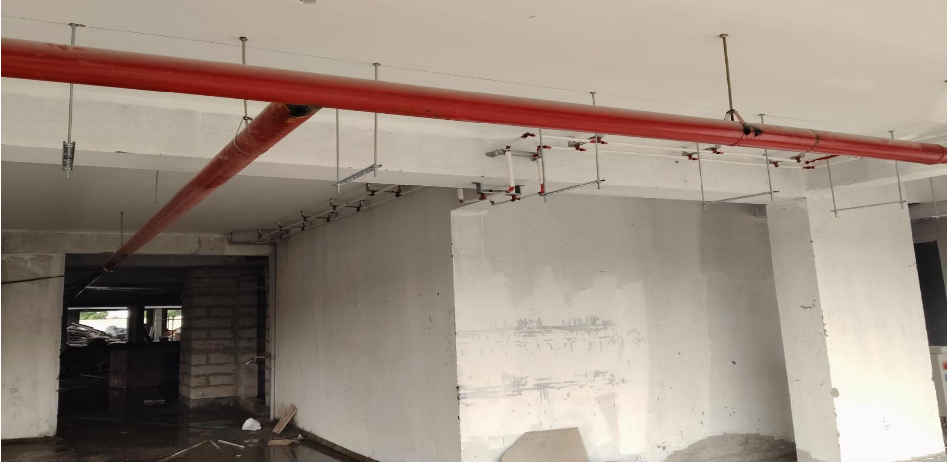
BLOCK 1 STILT FLOOR FIRE FIGHTING HYDRANT PIPE LAYING WORK IN PROGRESS