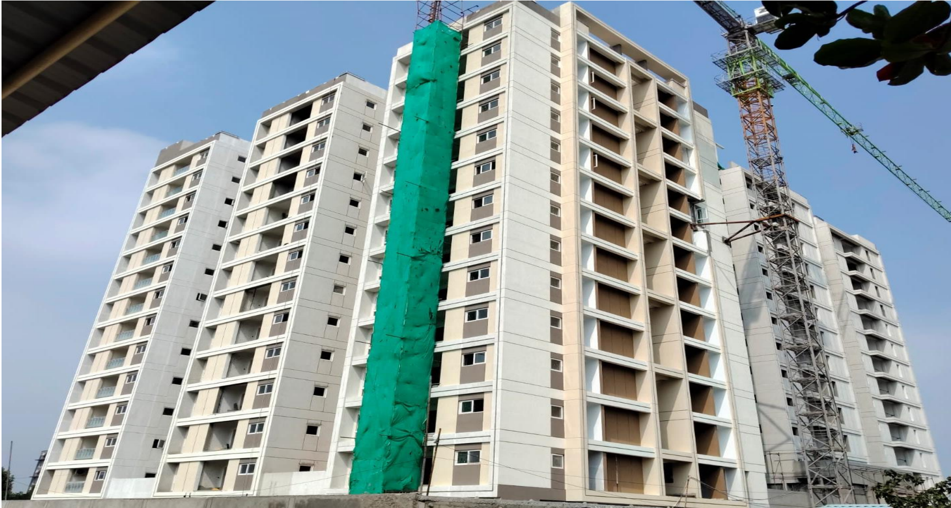
ELEVATION SOUTH EAST