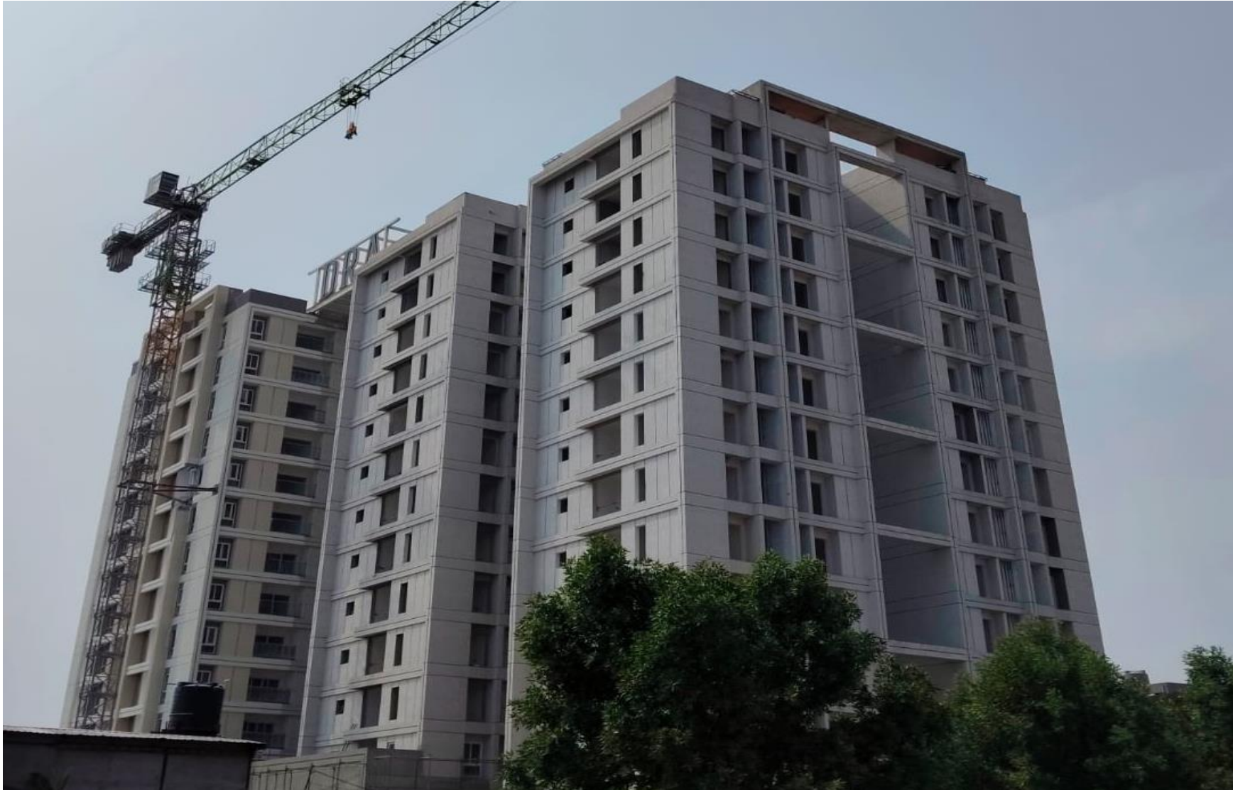
ELEVATION NORTH EAST