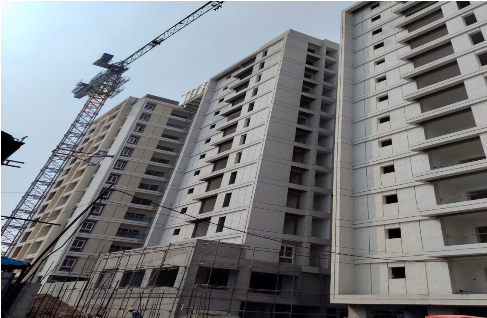
ELEVATION FROM ENTRANCE