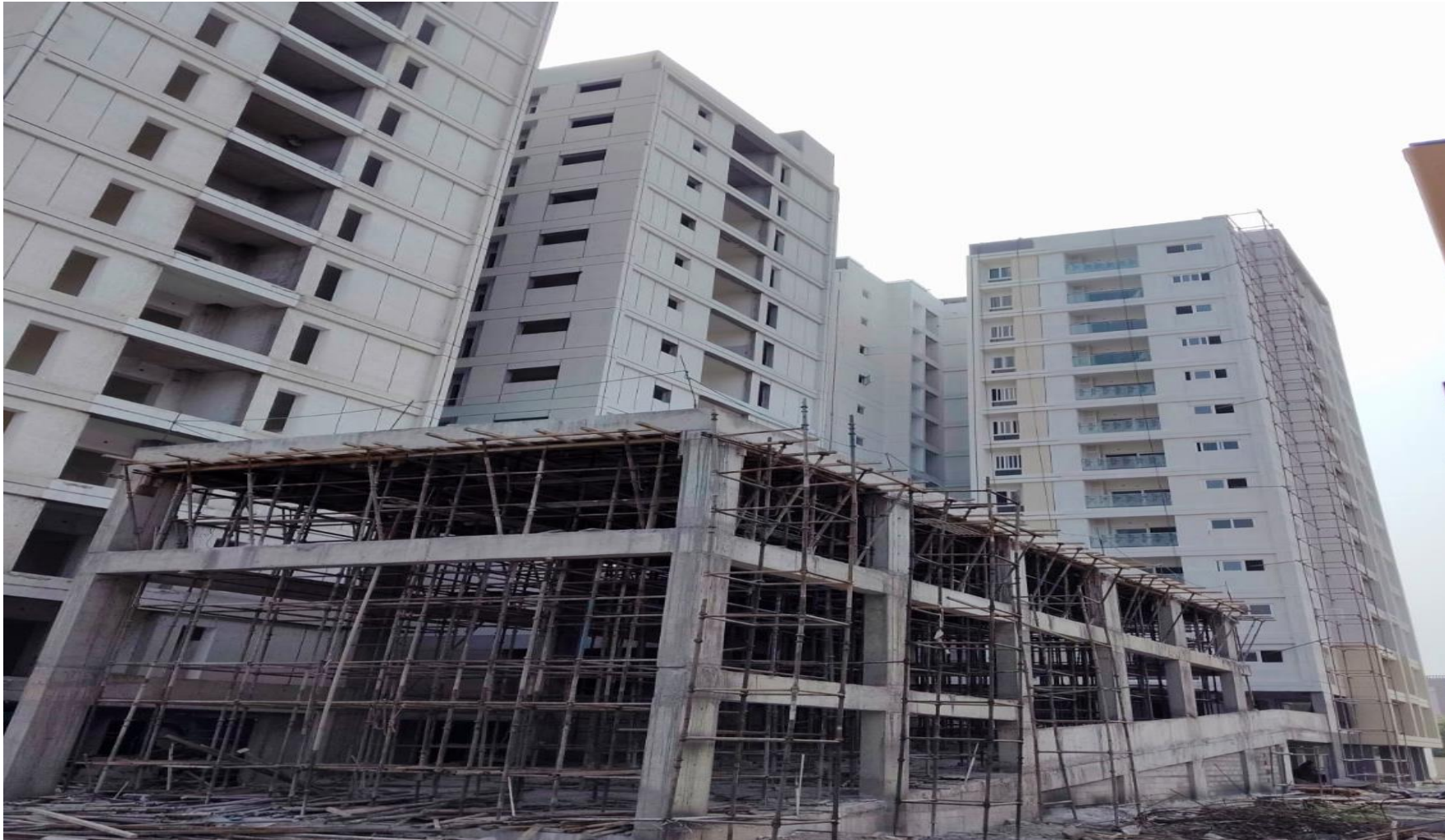
ELEVATION NORTH WEST