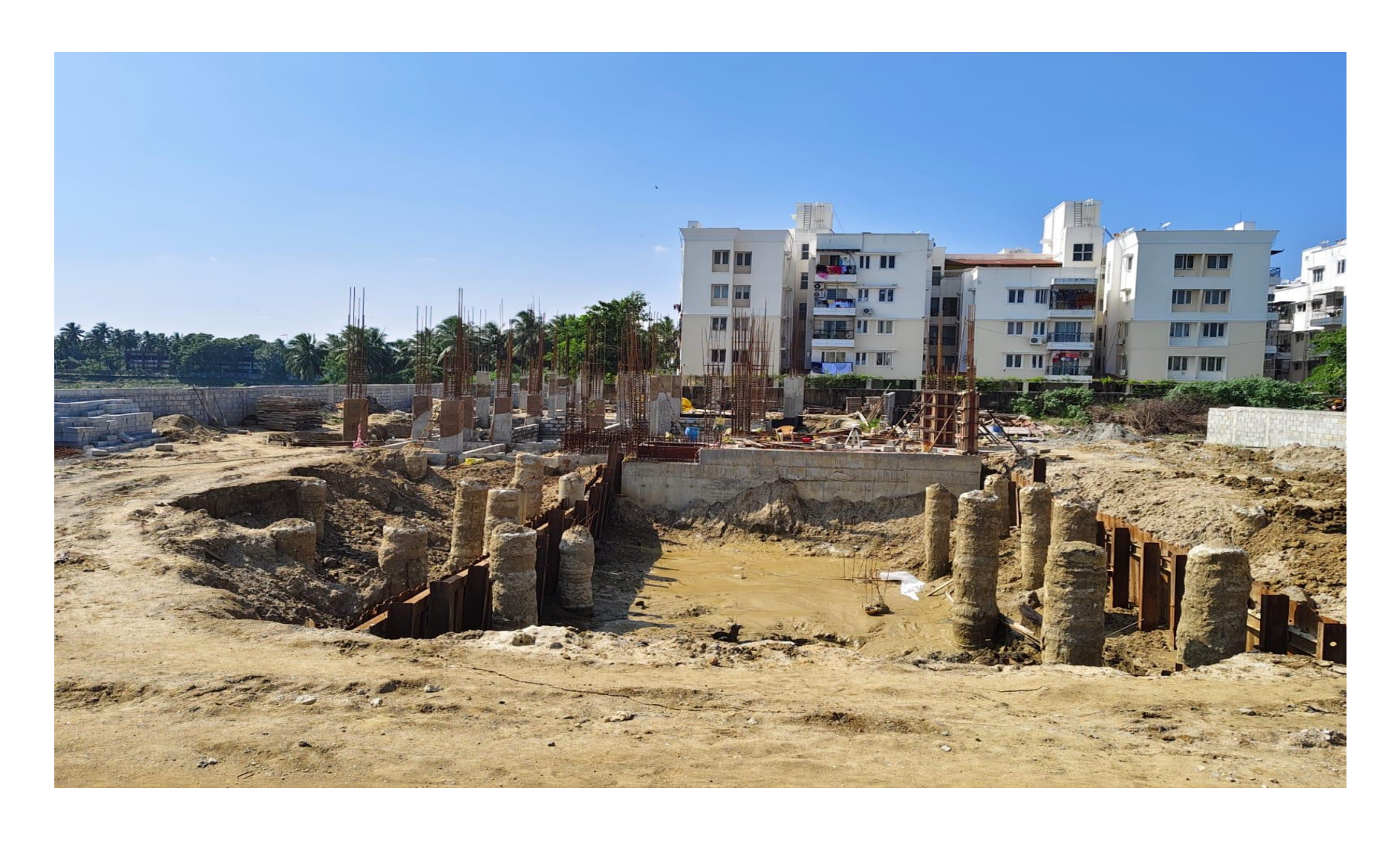
Over All Site View.