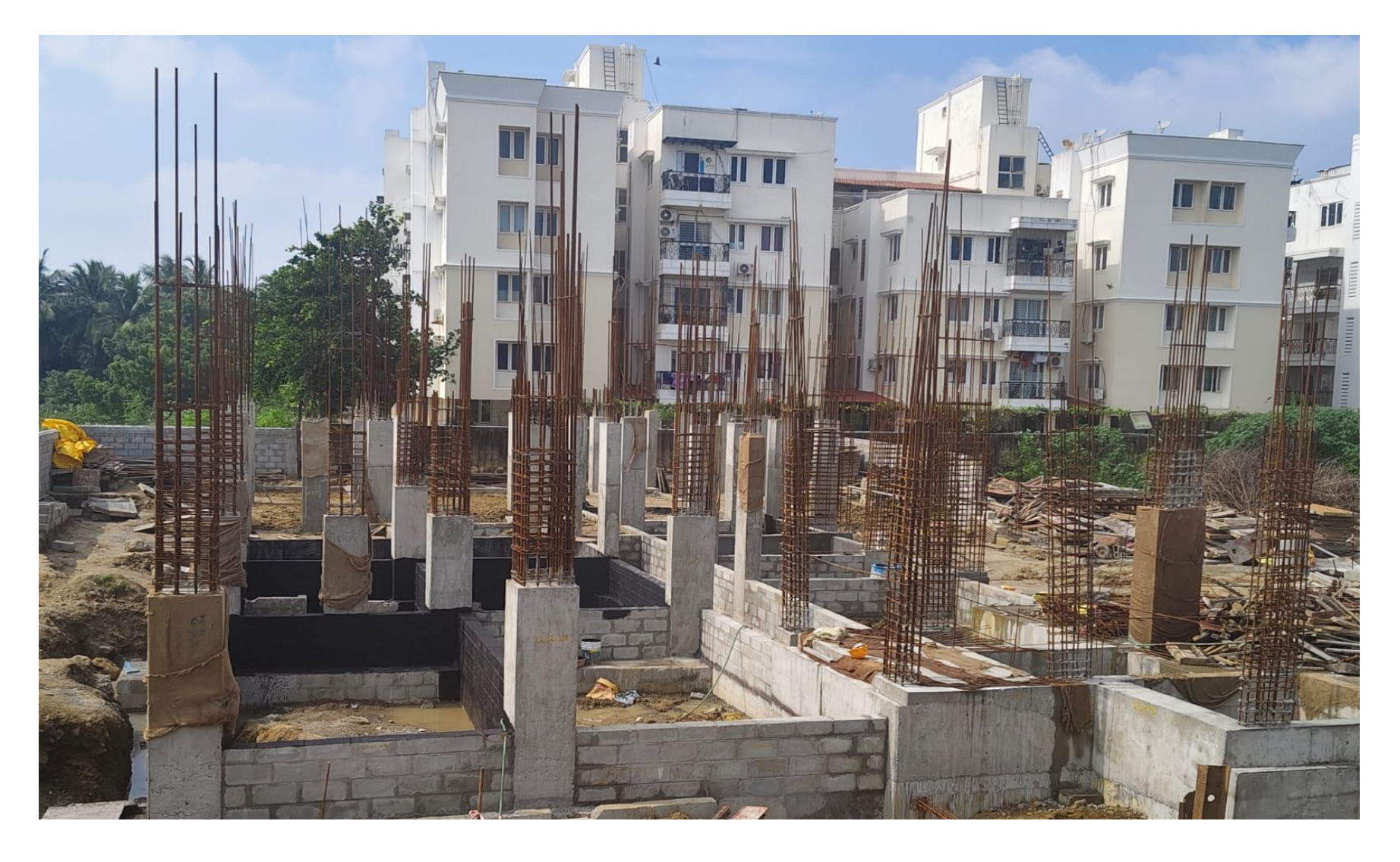
Main Building Pour 1 Basement Blockwork Work Completed.