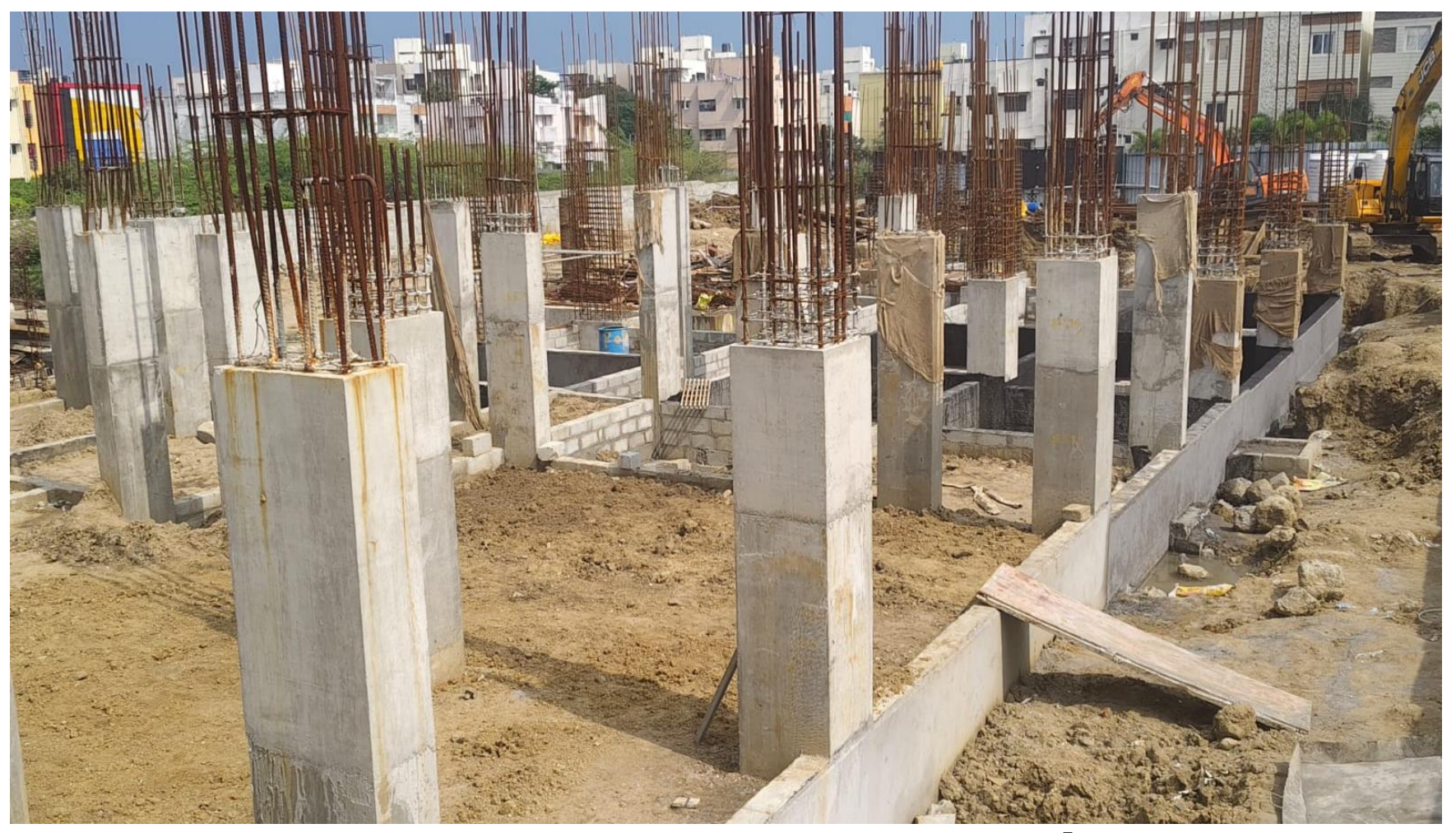
Main Building Stilt Floor Pour-1 Column 2<sup>nd</sup> Lift Concrete Work Nearing Completion.