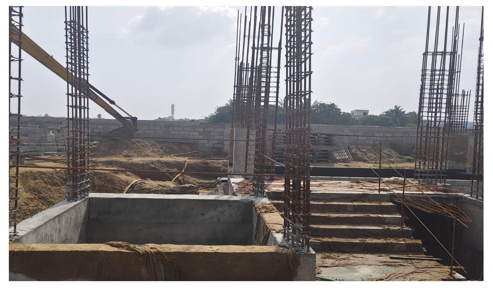
Main Building Stilt Floor Pour-1 Column 2<sup>nd</sup> Lift Reinforcement Work Completed.