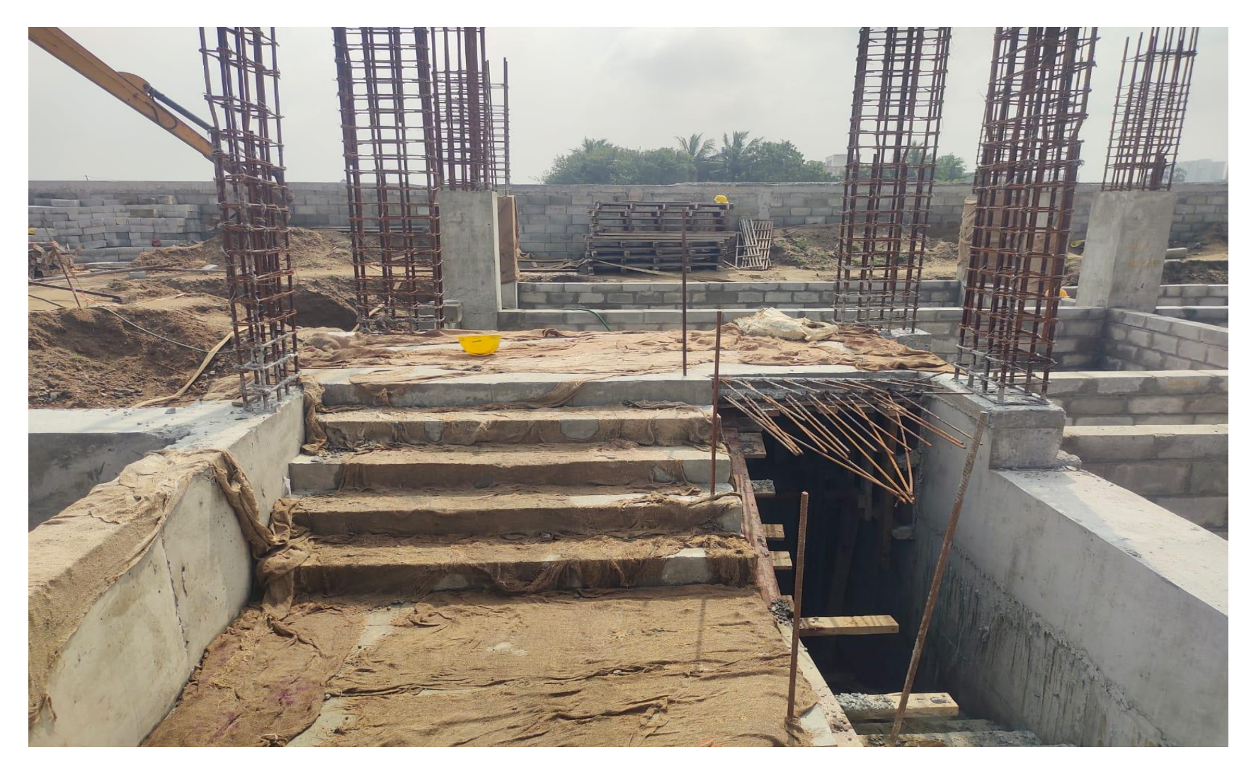
STP – Staircase Concrete Work Completed.