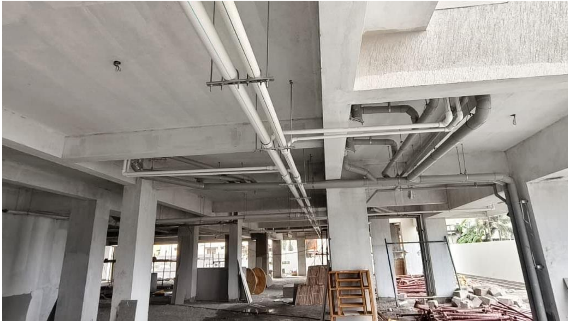
Main Building Pour-1 Stilt Floor Plumbing Work Completed.