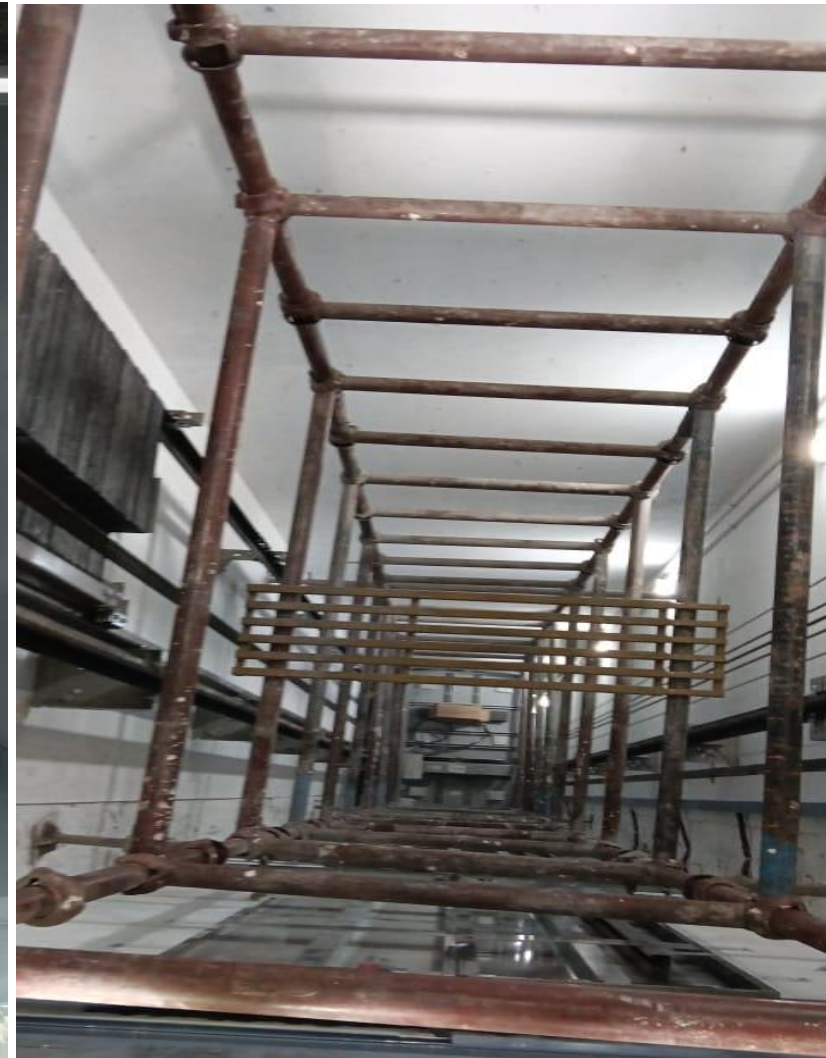
Main Building Pour-2 Lift Fixing Work Nearing Completion.