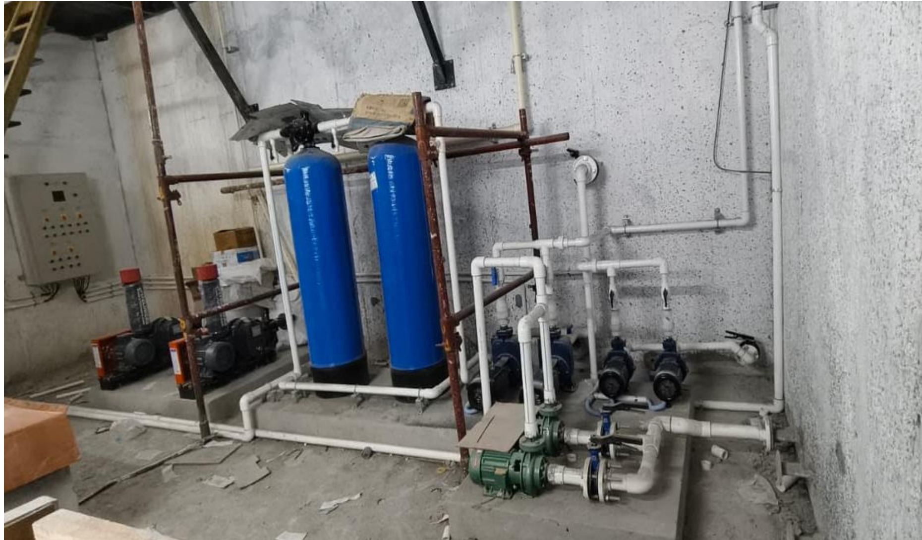
STP Pump and Filter Fixing Work Completed.