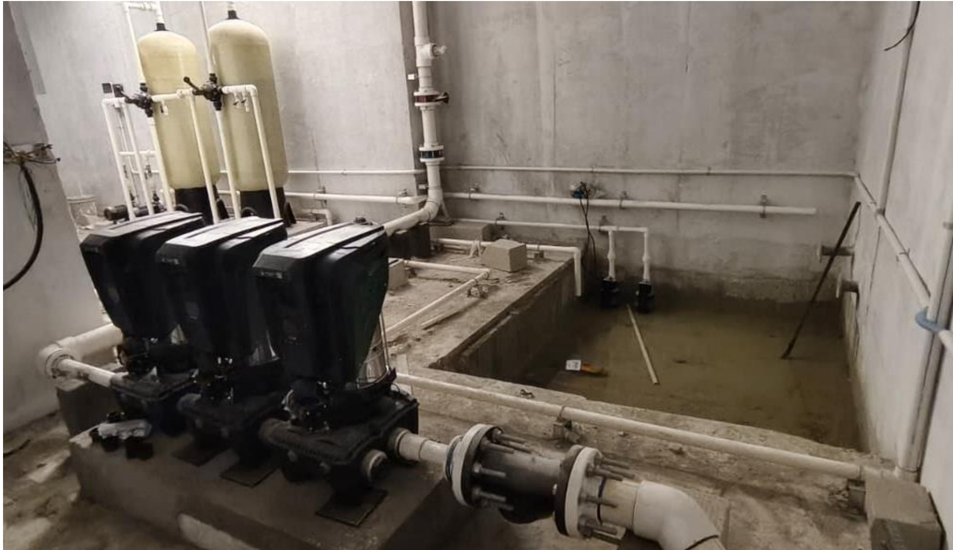
UG Sump Pump and Filter Fixing Work Completed.