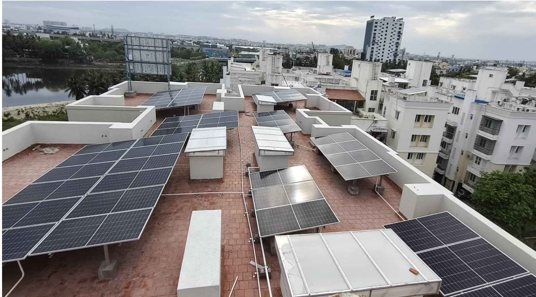
Main Building Terrace Solar Pannel Fixing Work Completed.