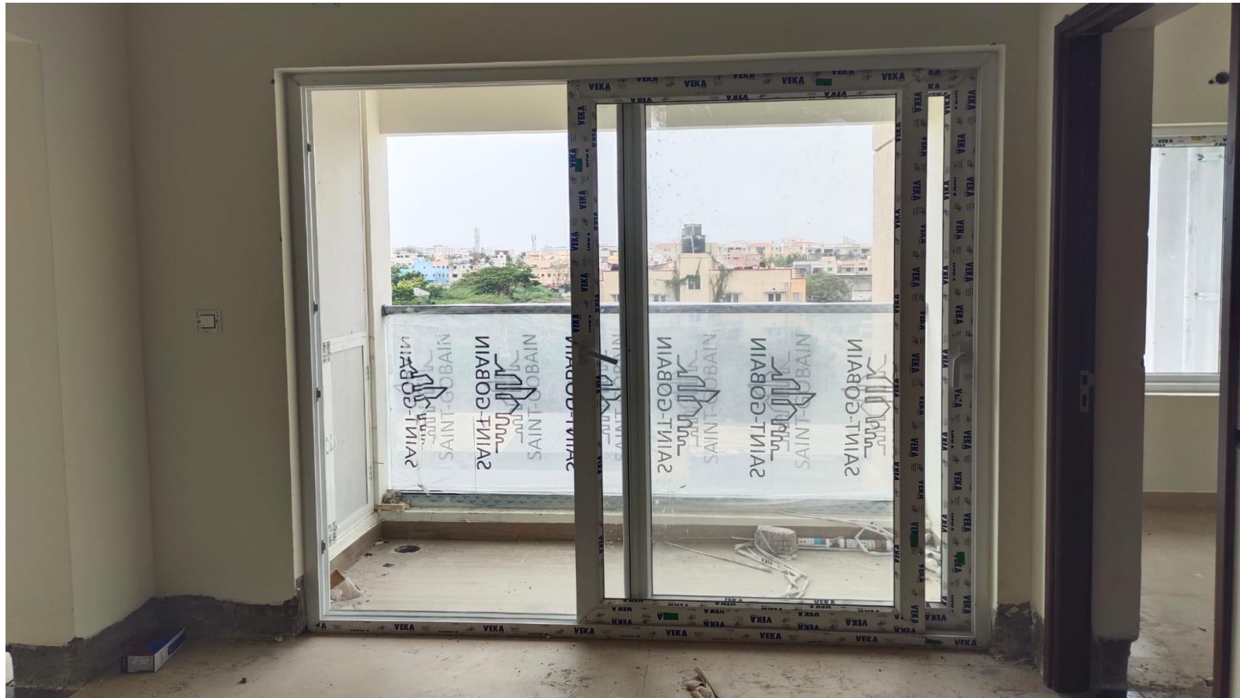
Main Building UP To 5 th Floor Balcony Sliding Door Fixing Fixing Work Completed.