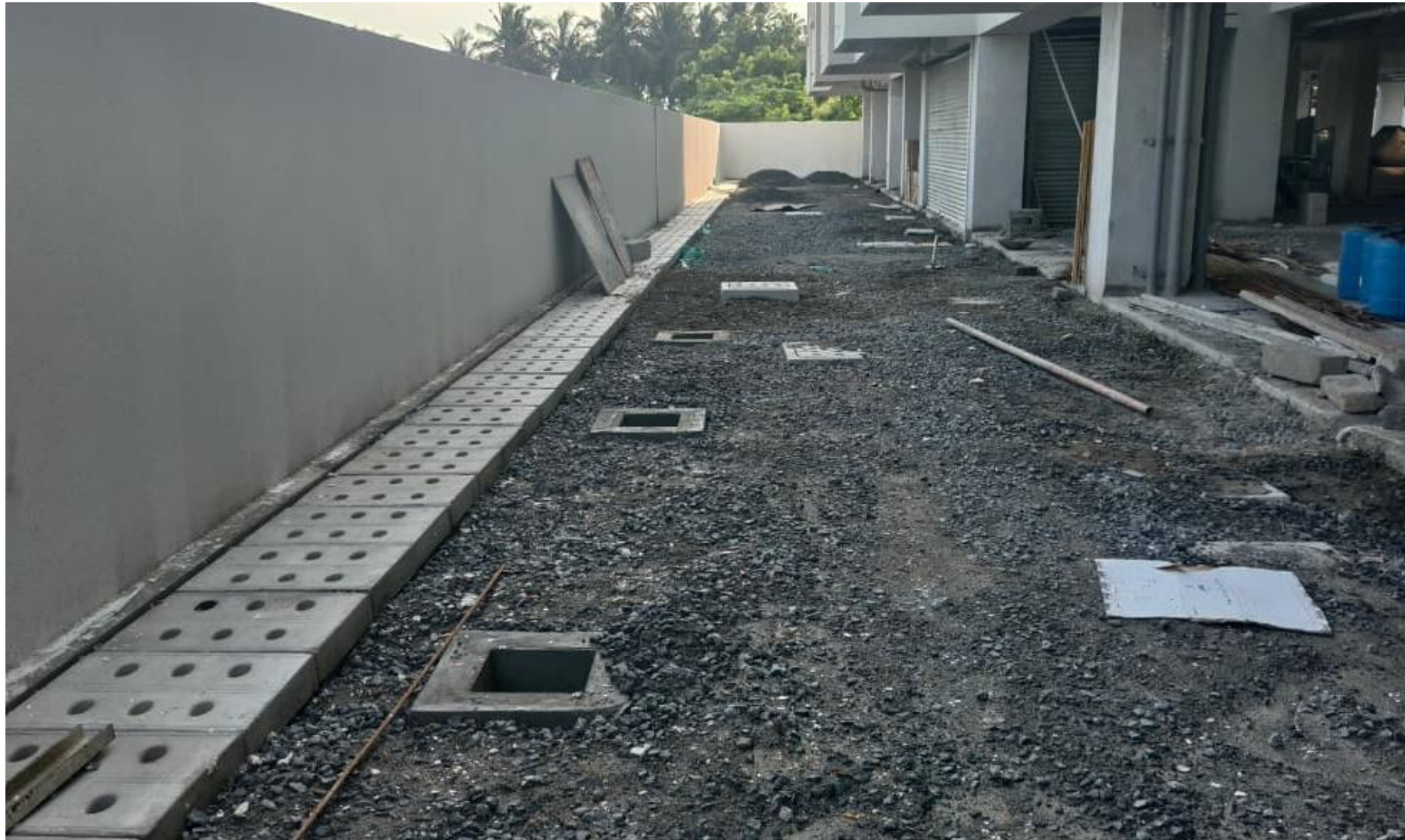
Compound Wall Internal Texture and Primer Work Completed.