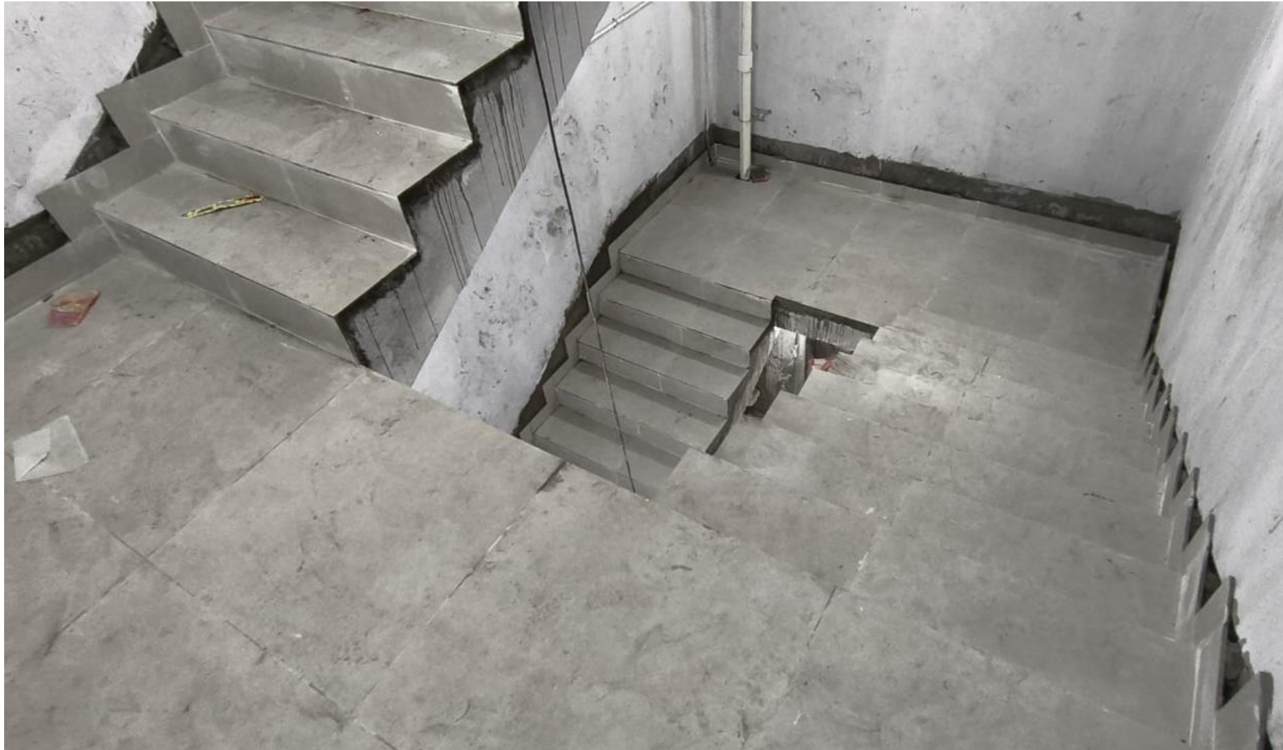
STP Pump Room Staircase Tiles Laying Work Completed.