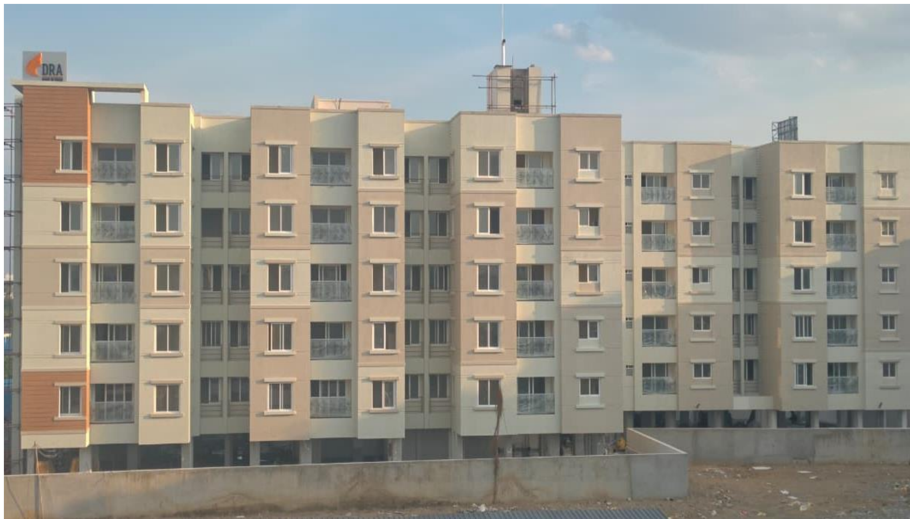
North Side View.