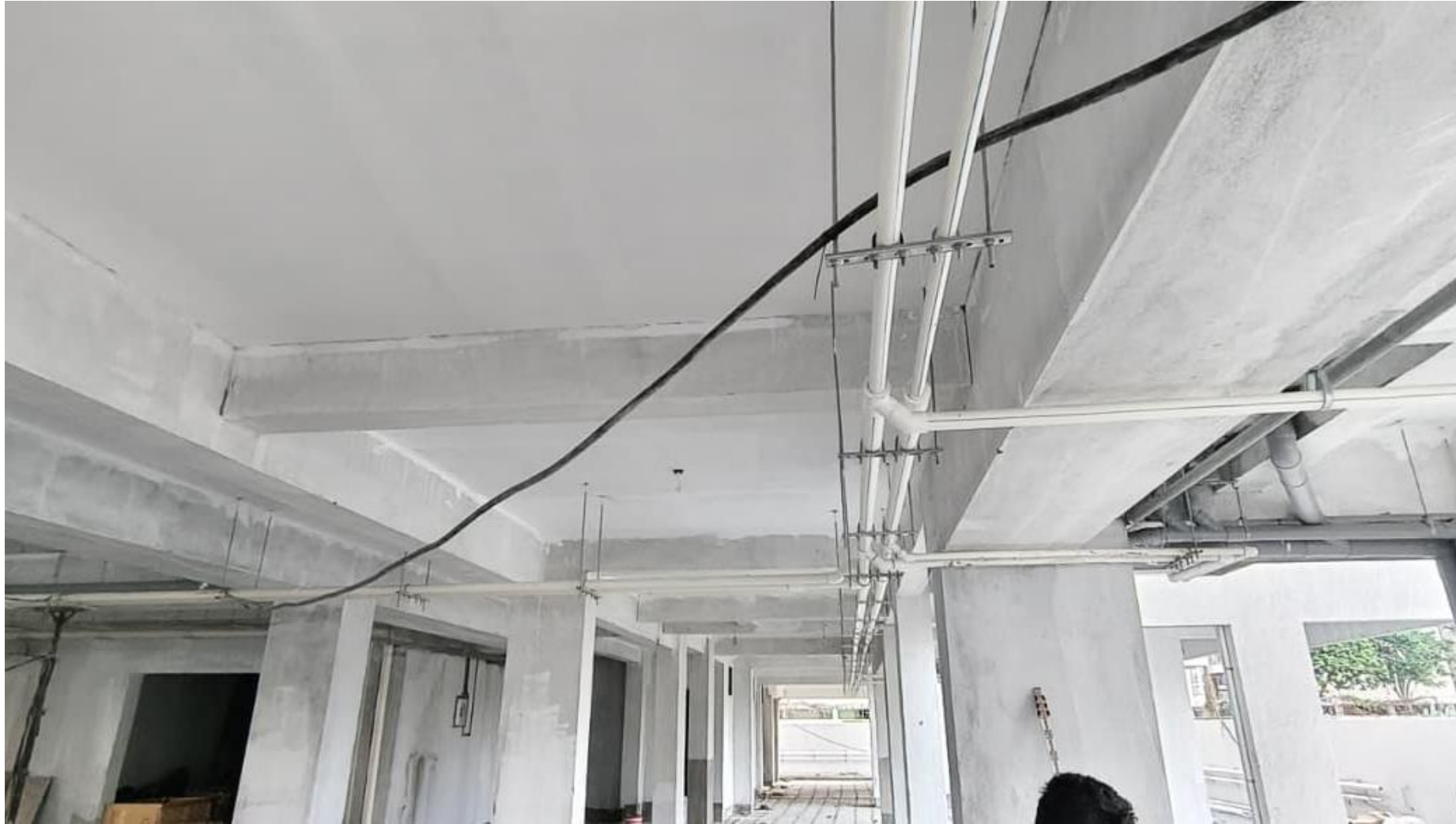
Main Building Pour-2 Stilt Floor Plumbing Work Nearing Completion.