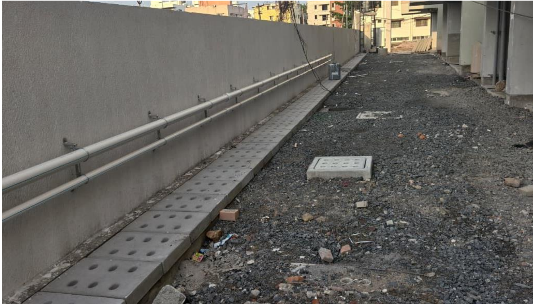
Storm Water Drain Cover Slab Fixing Work Completed.