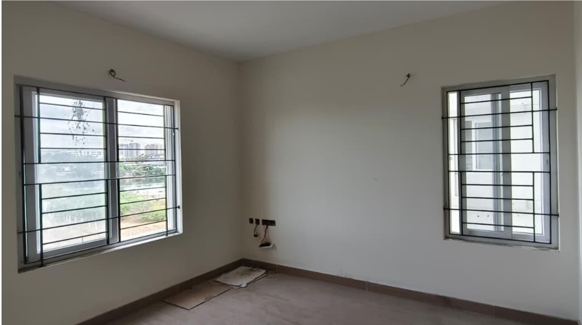
Main Building Pour-1 Window Grill Fixing Work Completed.