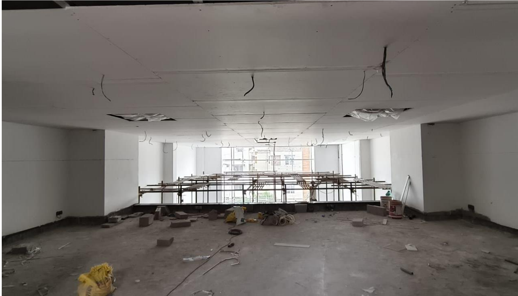
GYM AC False Ceiling Work Nearing Completion.