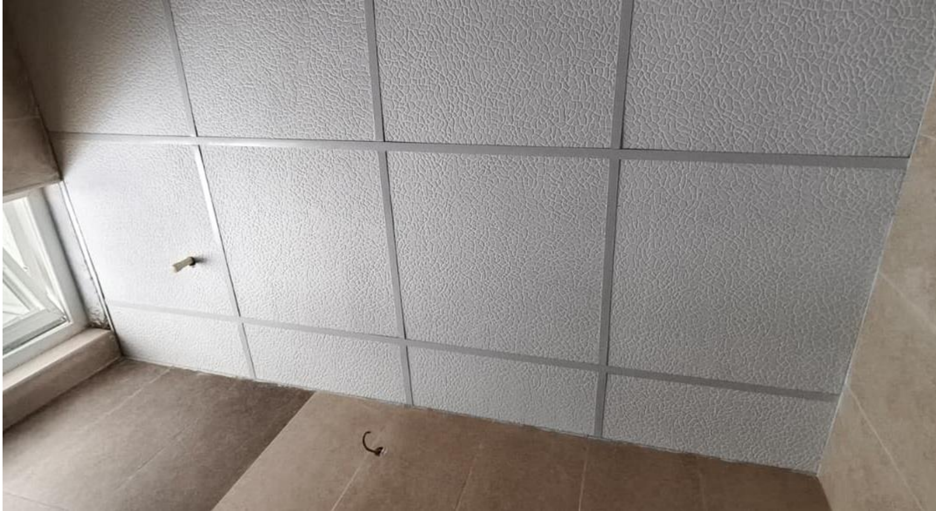
Main Building Up to 5 th Floor Toilet Grid False Ceiling Channel and Board Fixing Work Completed.