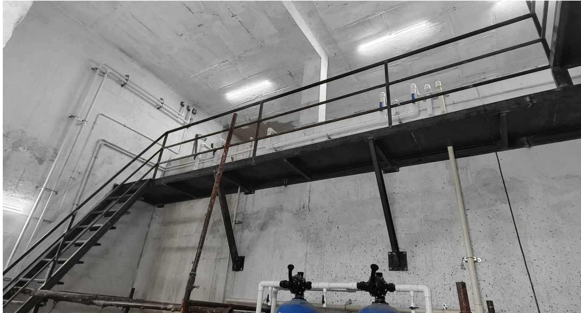
STP Pump Room Walkway Platform Channel Fixing Work Completed.