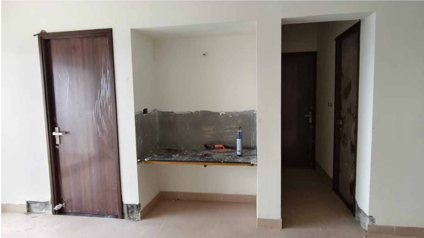
Main Building Pour-2 UP To 5 th Floor Flat Door Fixing Work Completed.