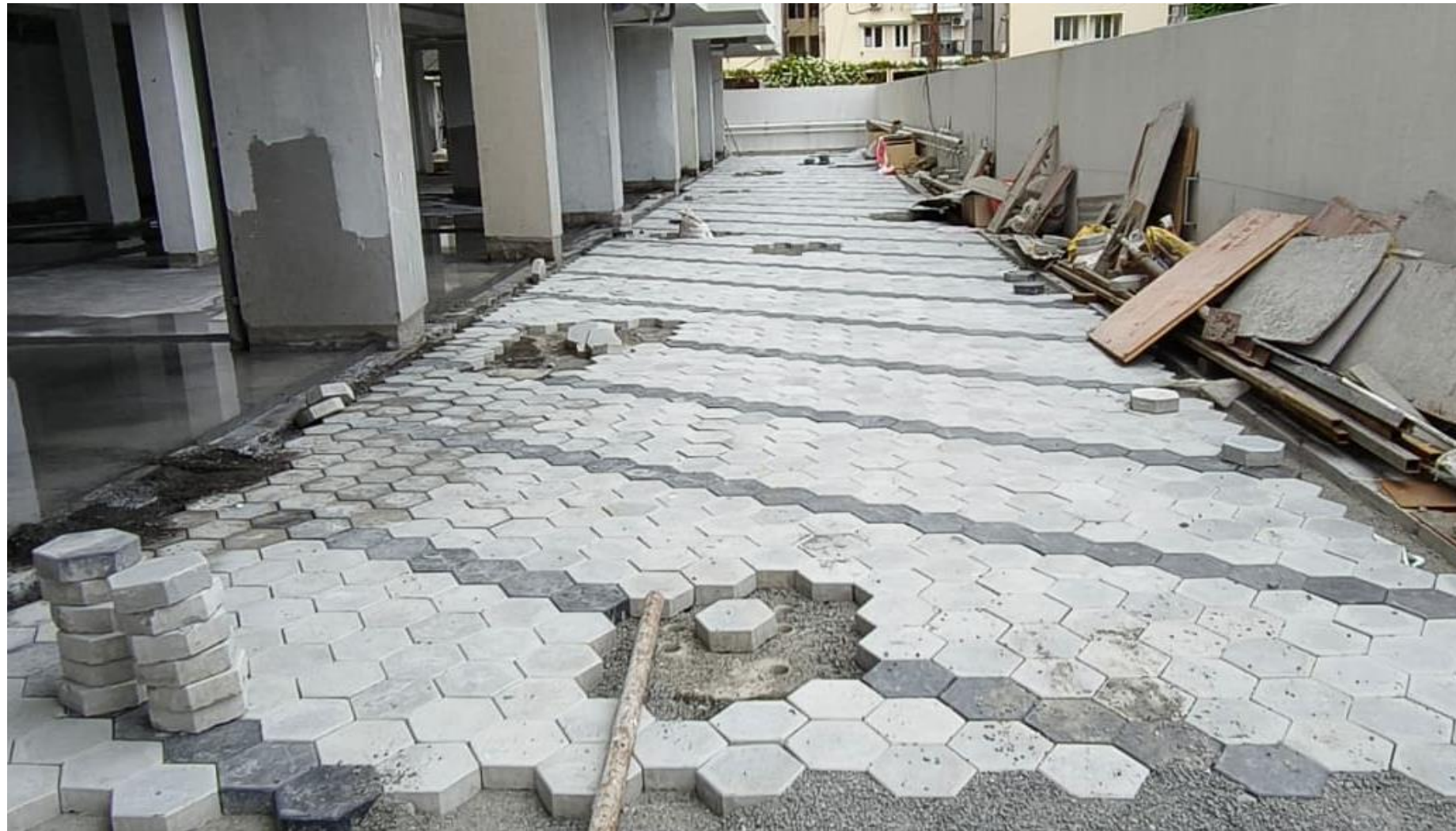
External Driveway Paver Block Laying Work In Progress.