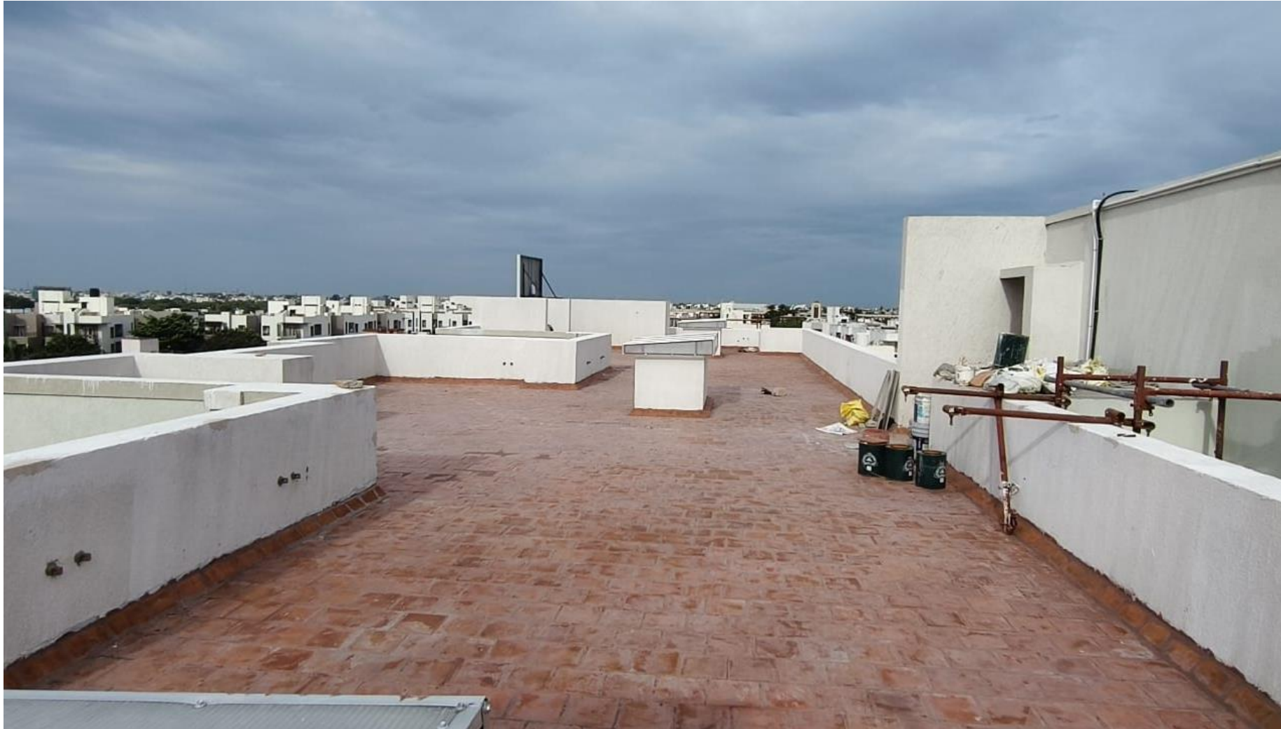
Main Building Terrace Press Tiles Work Completed.