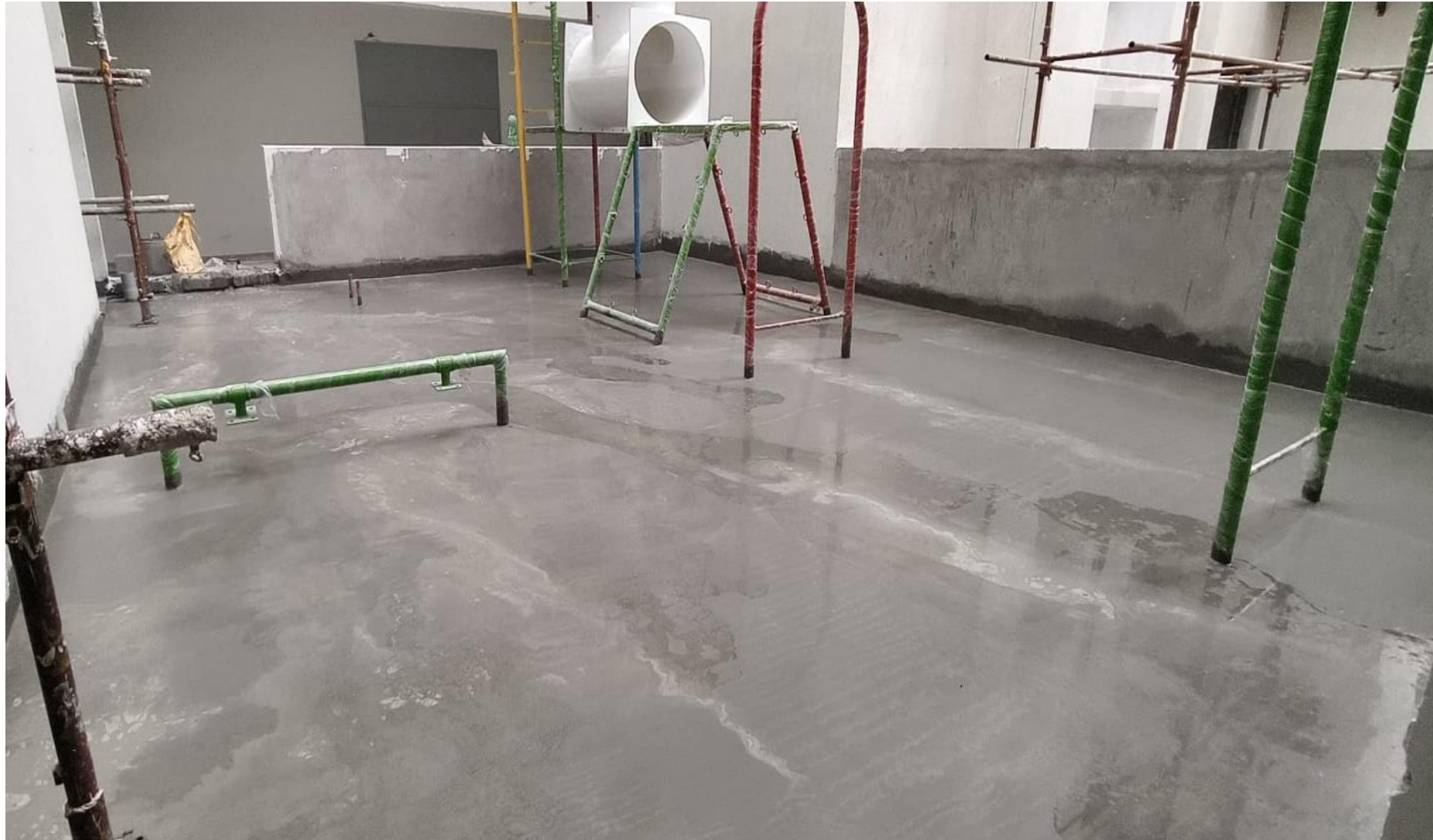
Kids Play Area Flooring Work Completed.