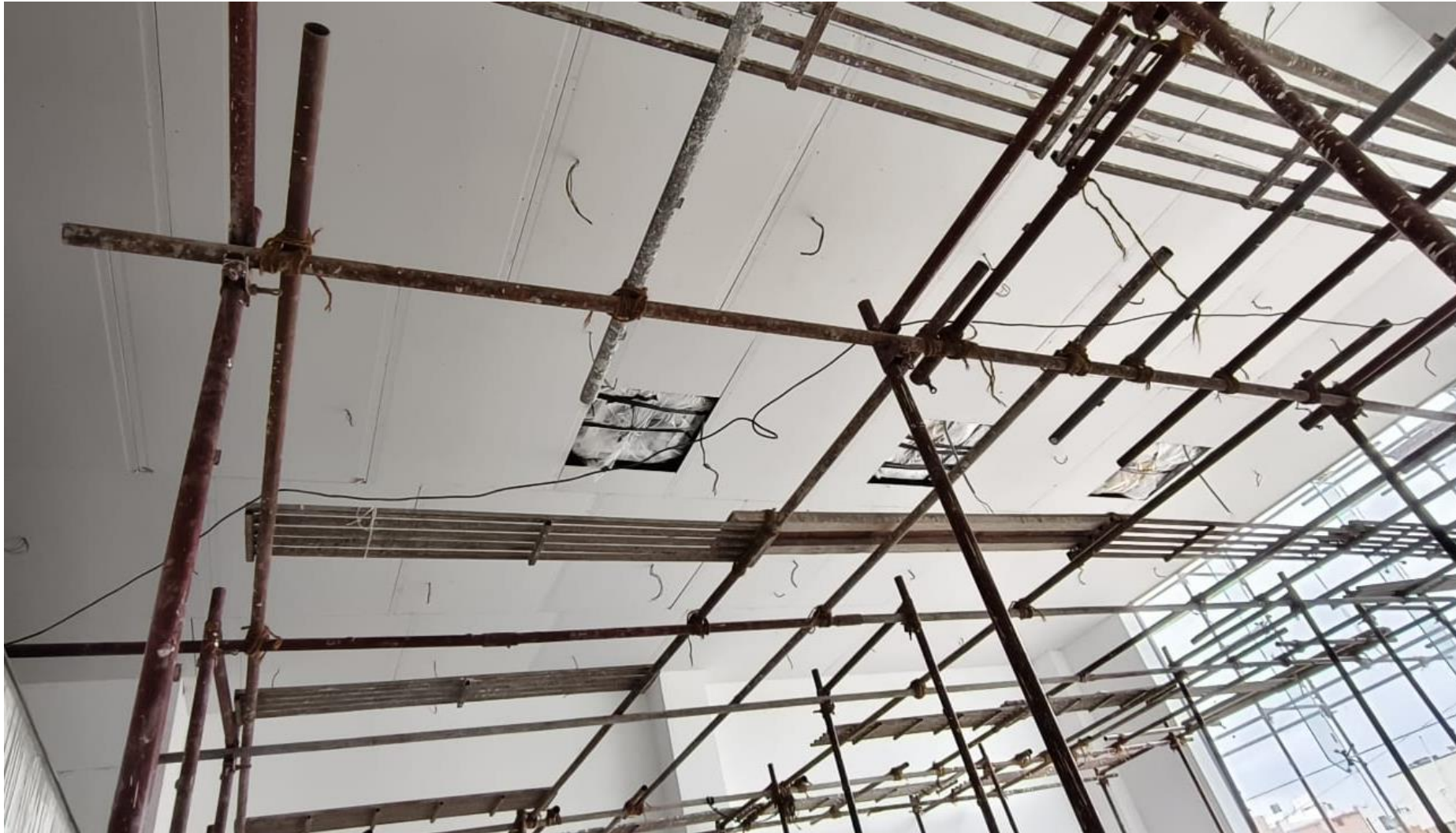
Multipurpose Hall False Ceiling Work Nearing Completion.