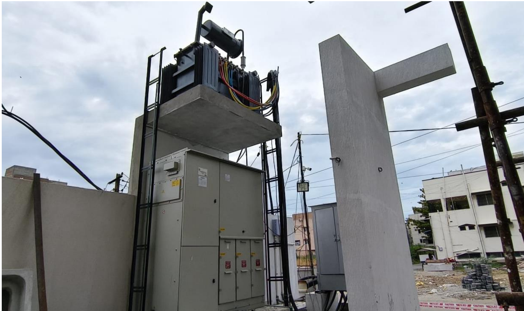
Transformer, RMU and Pannel Box Fixing Work Completed.