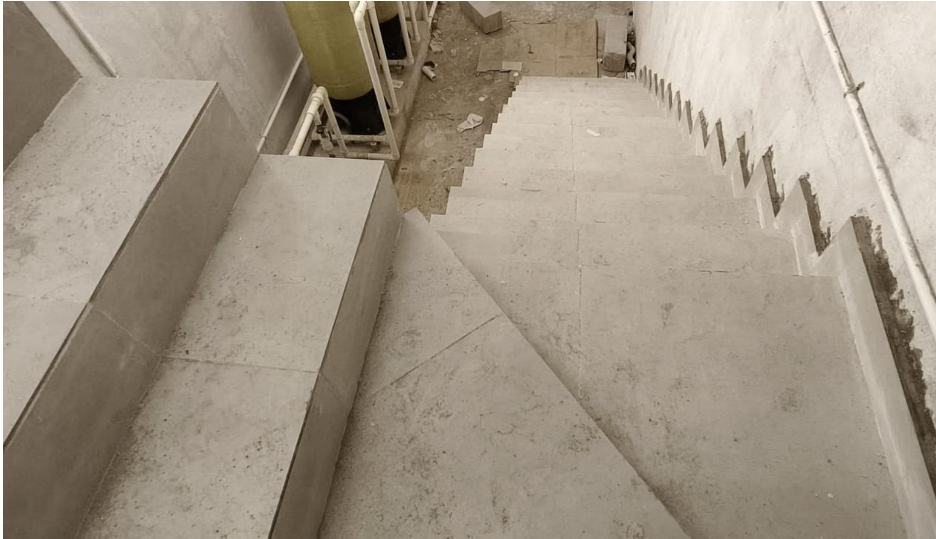
UG Sump Pump Room Staircase Tiles Laying Work Completed.