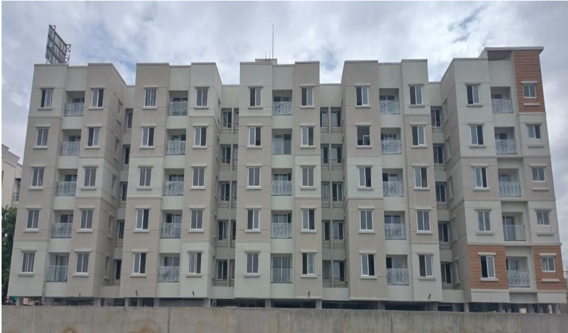
South Side View.