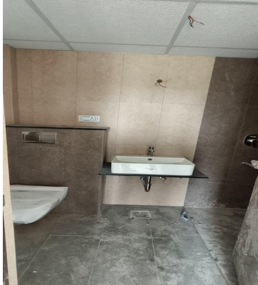
Main Building Pour-1 Up to 5 th Floor Cp and Sanitary Fixing Work Nearing Completion.