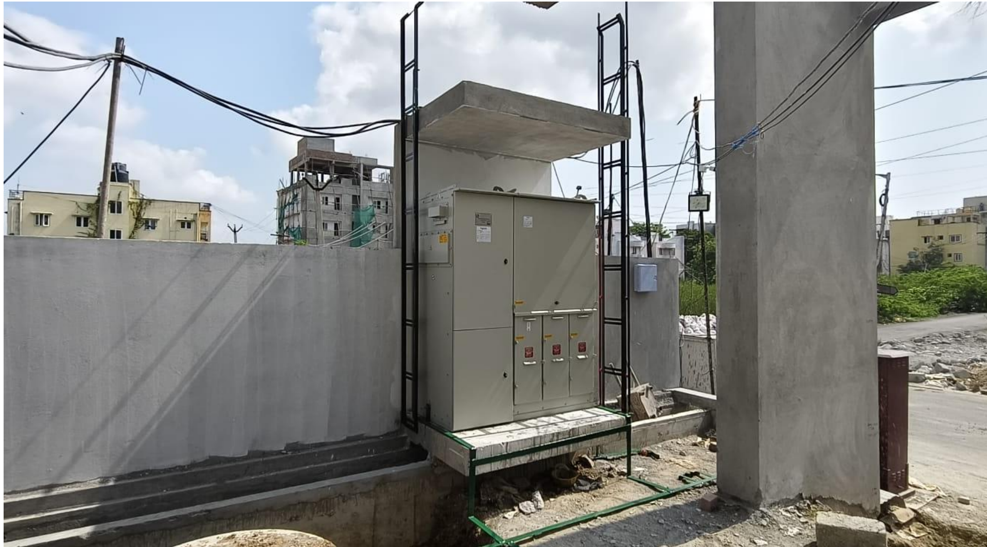
RMU Fixing Work Completed.