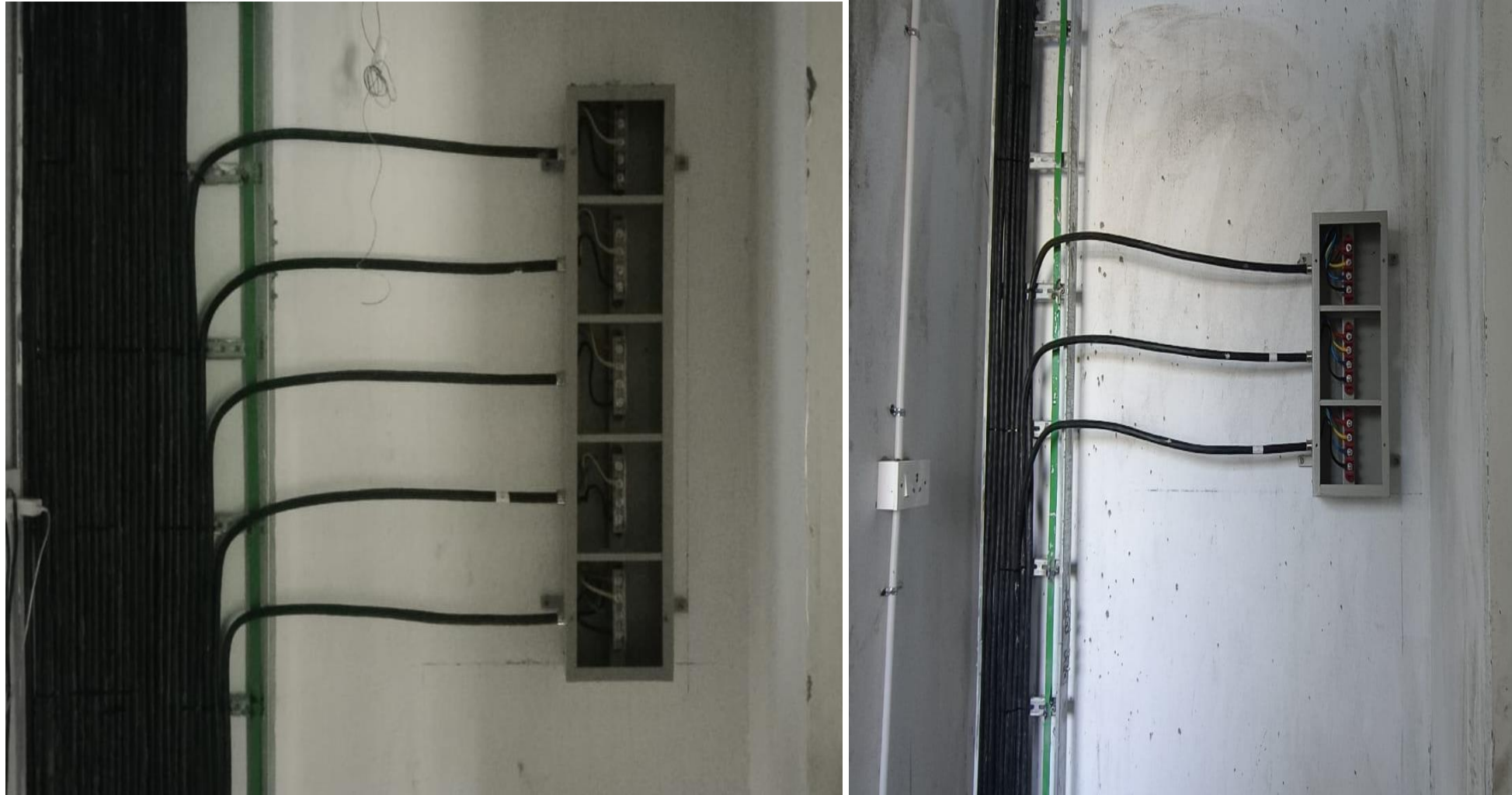
Main Building Electrical Shaft Main Cable Laying Work Completed.