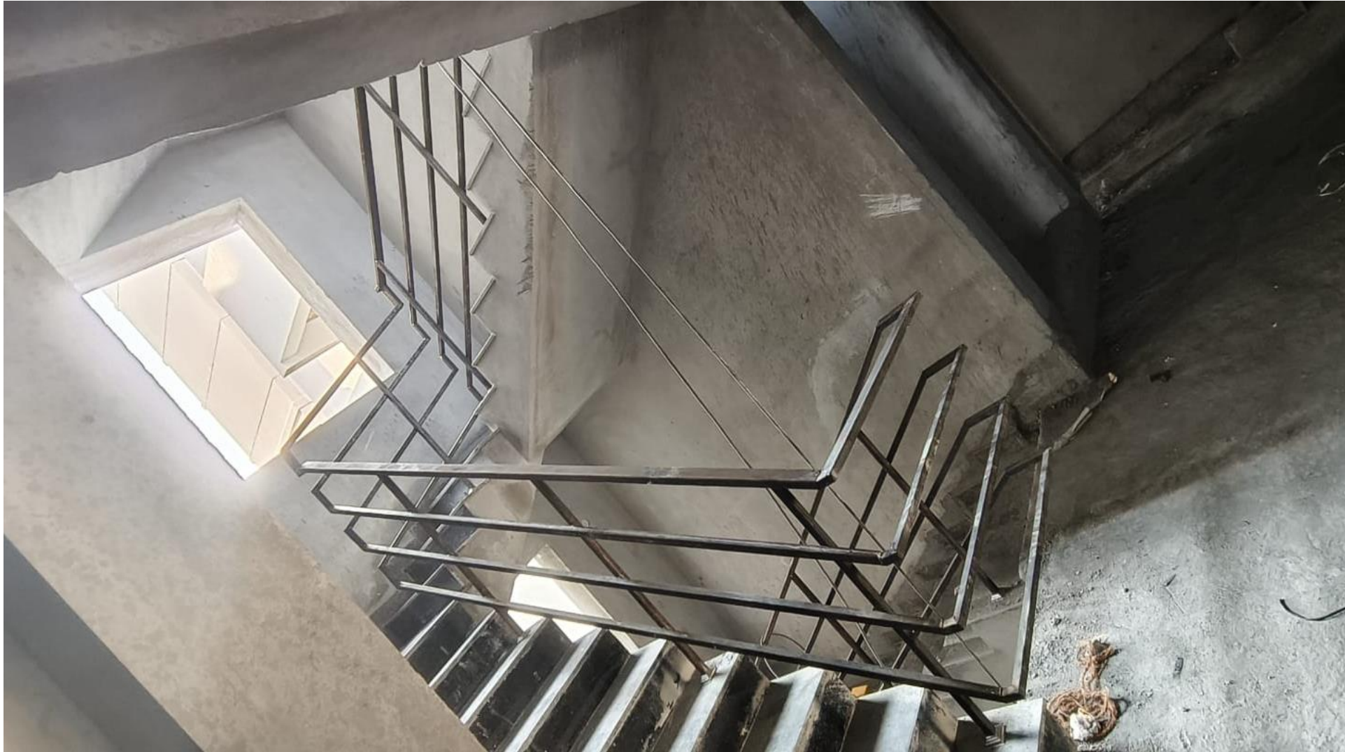
Main Building Pour-2 Staircase Handrail Fixing Work In Progress.