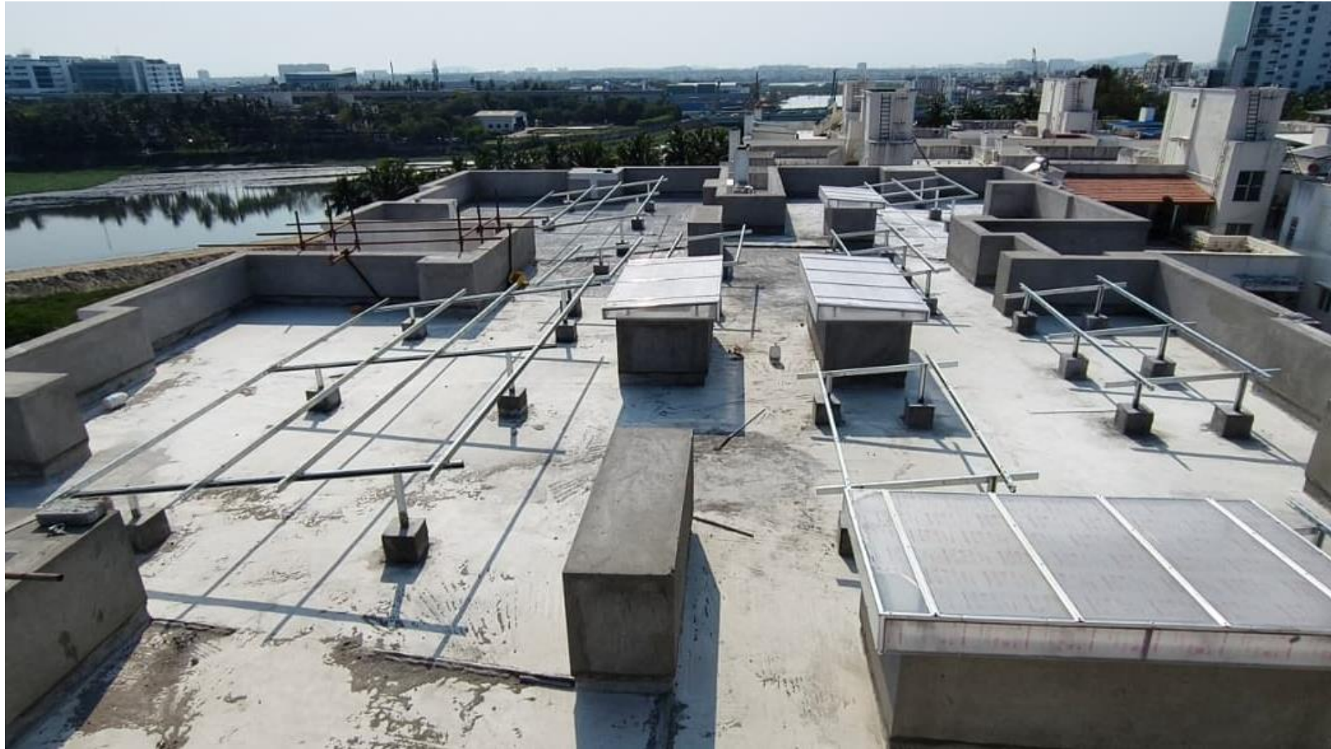
Main Building Terrace Solar Pannel Frame Work Completed.