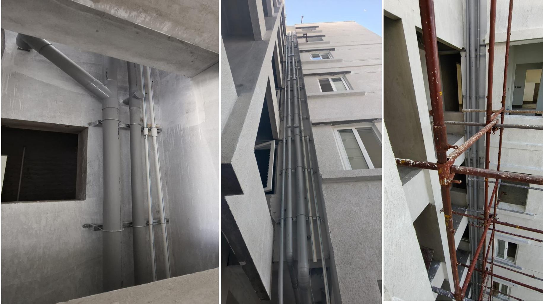
Main Building Pour-2 Plumbing Shaft Pipe Line Work In Progress.