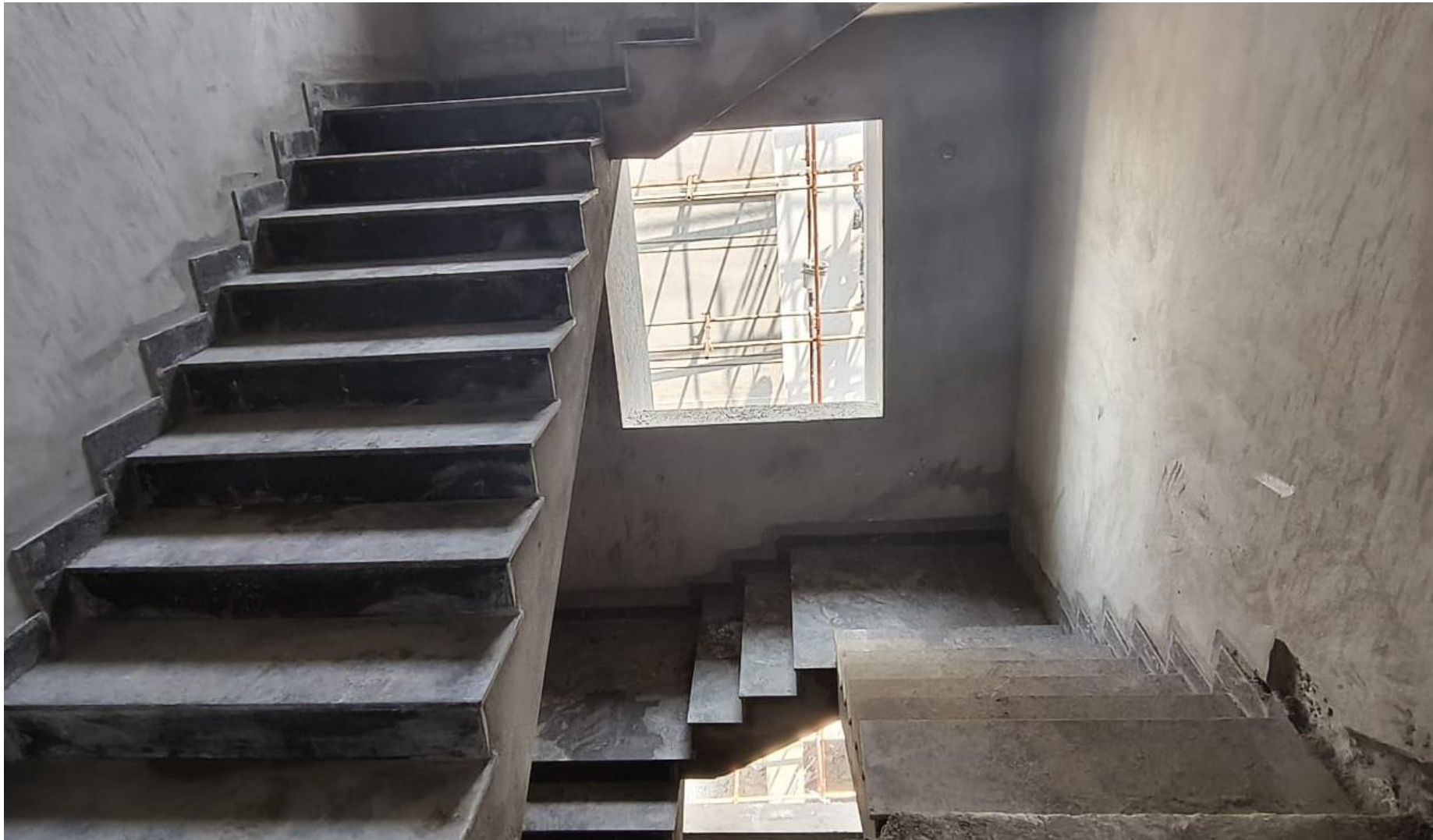
Main Building Pour-1 Staircase Granite Work Completed.