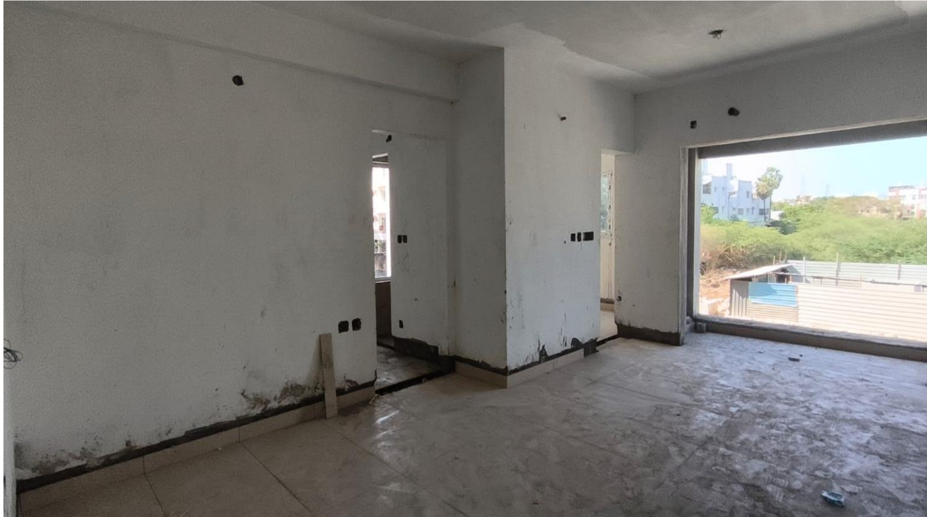
Main Building Pour-2 1 st floor Tiles Work Completed.