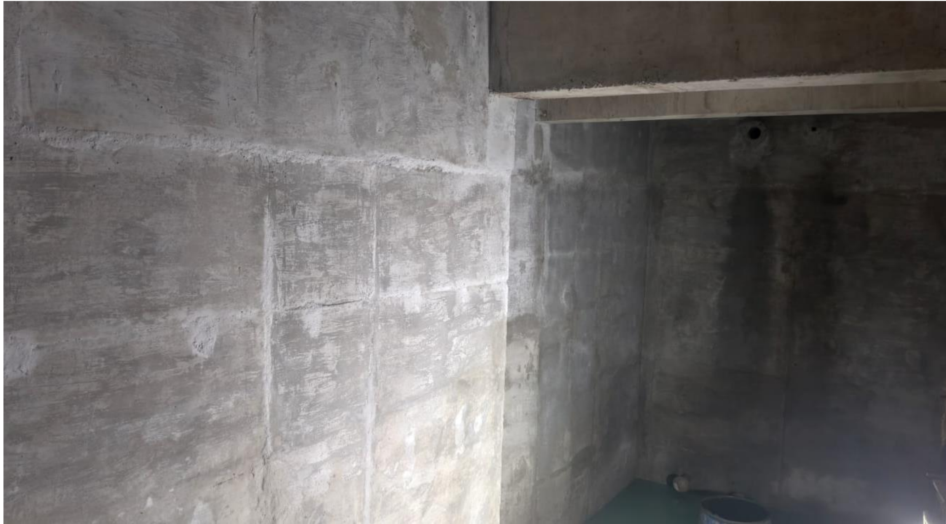
UG Sump Waterproofing Work In Progress.