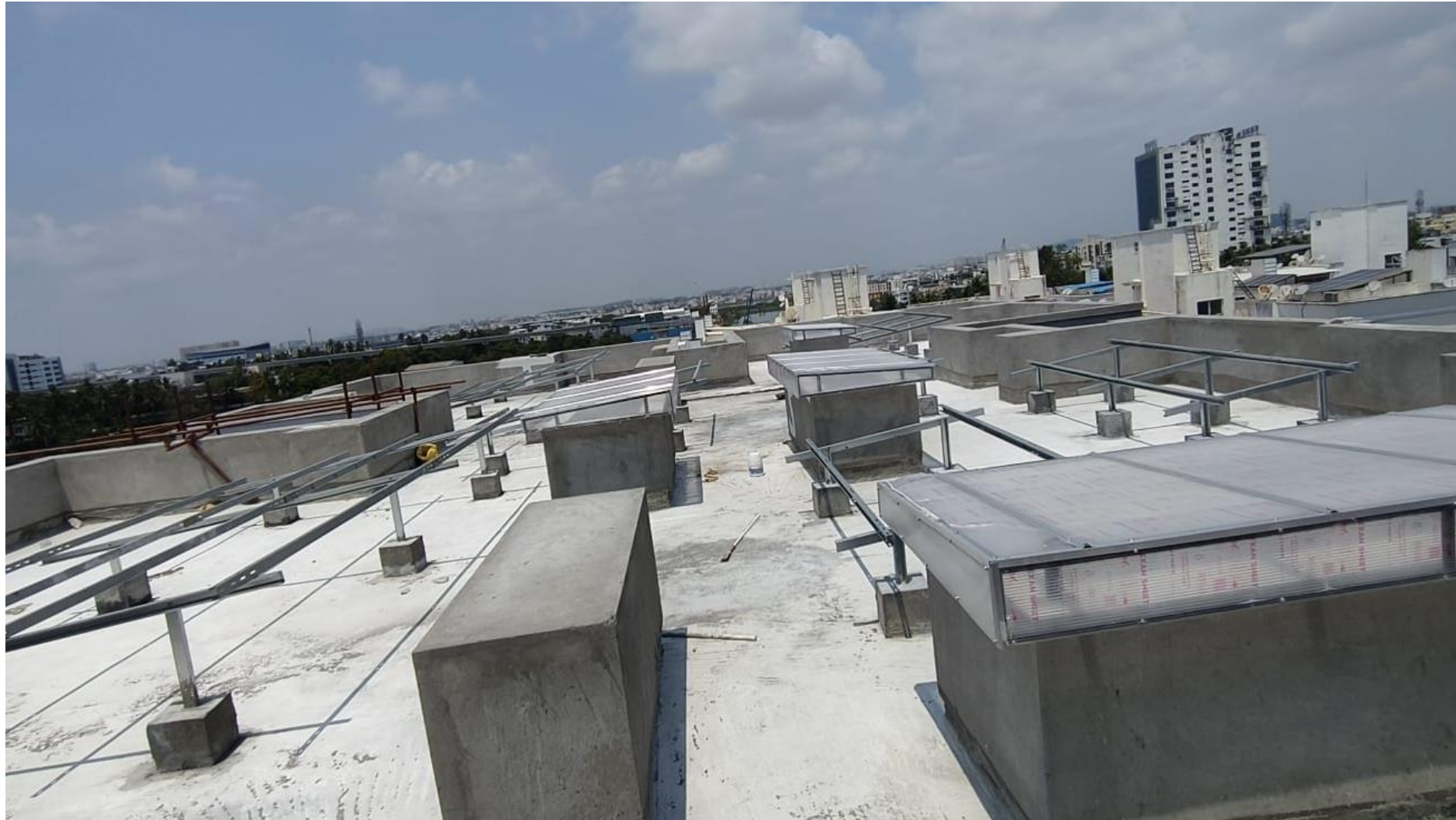
Main Building Terrace Duct Covering Work Completed.