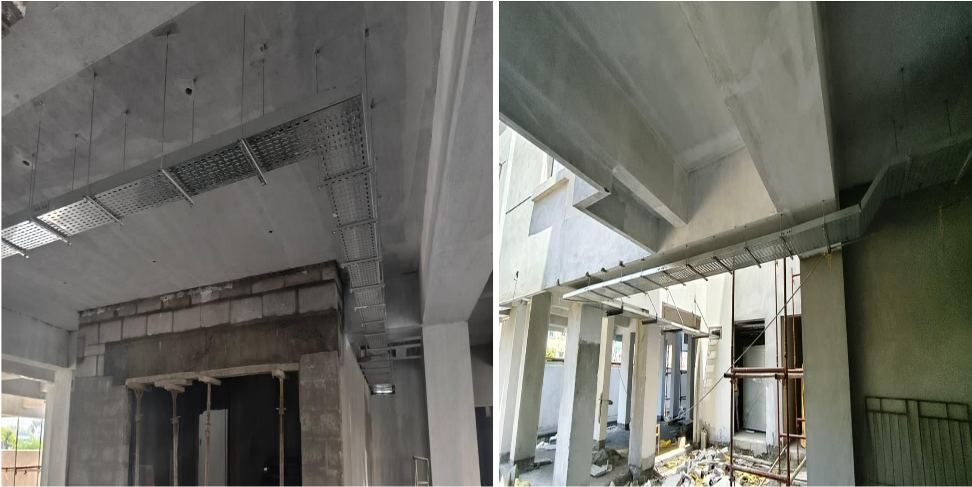
Main Building Stilt Floor Electrical Main Cable Tray Fixing Work Completed.