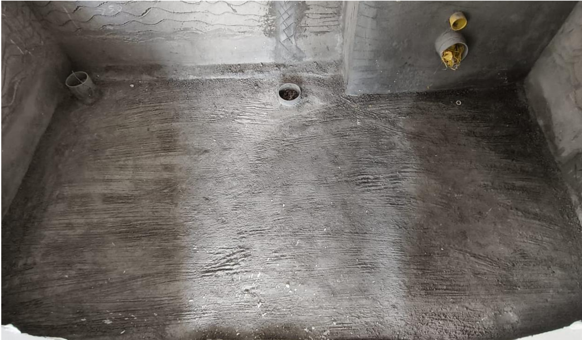
Main Building Pour-2 5 th Floor Sunken Filling Work Completed.