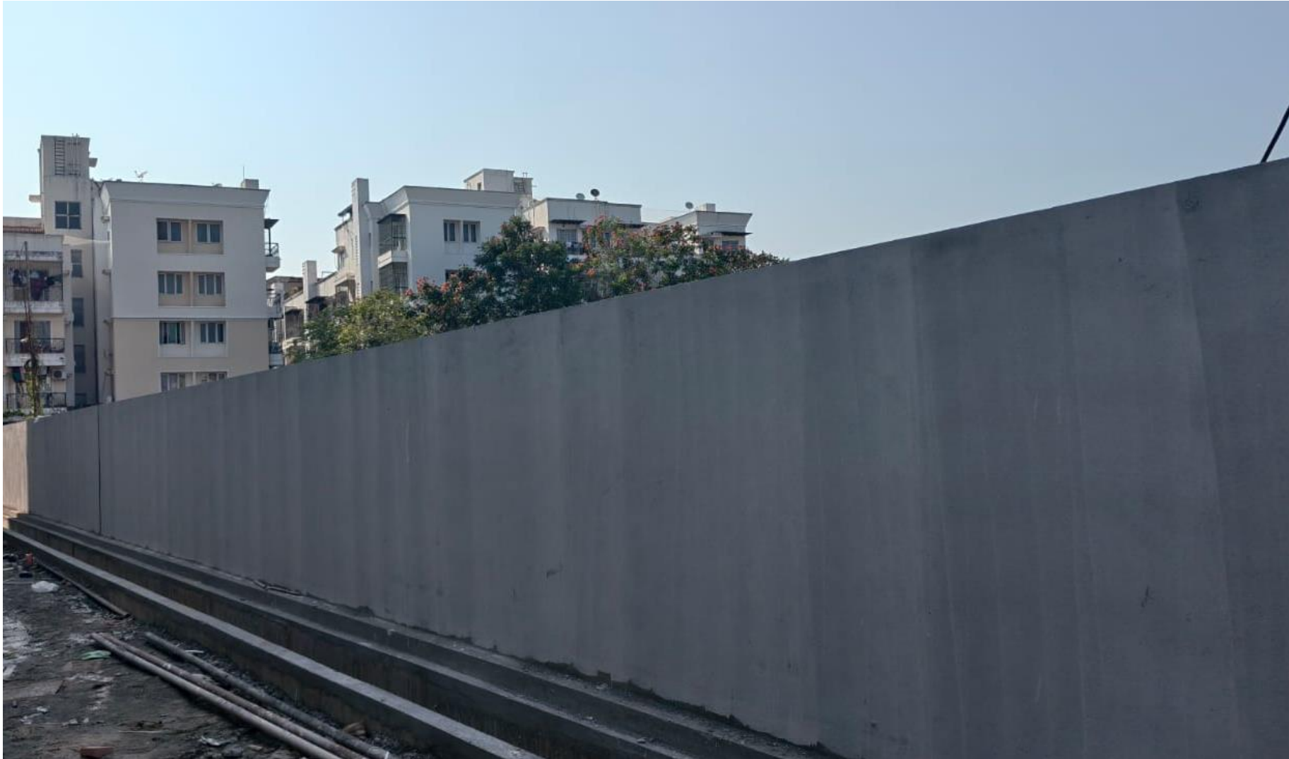
Compound Wall Primer Work In Progress.