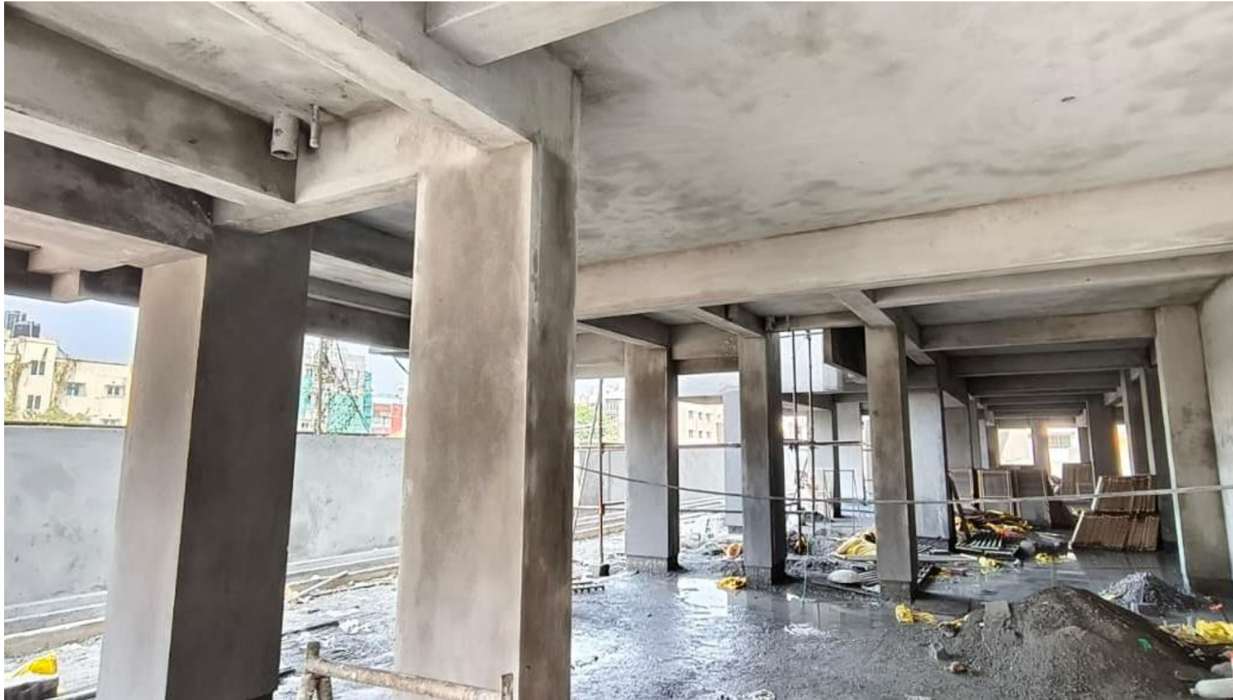
Main Building Pour-2 Stilt Floor Ceiling and Column Plastering Work Completed.