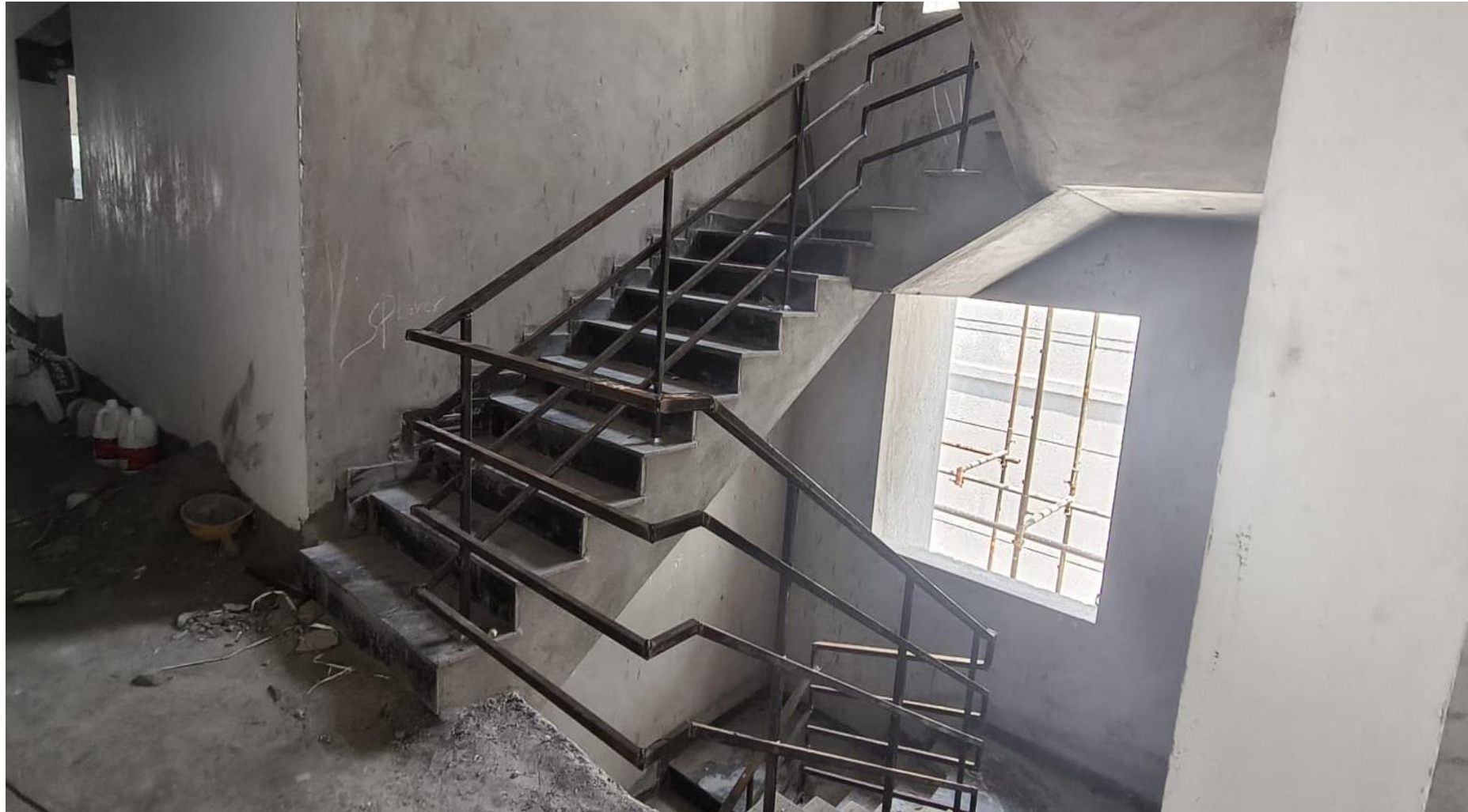
Main Building Pour-1 Staircase Handrail Fixing Work Nearing Completion.