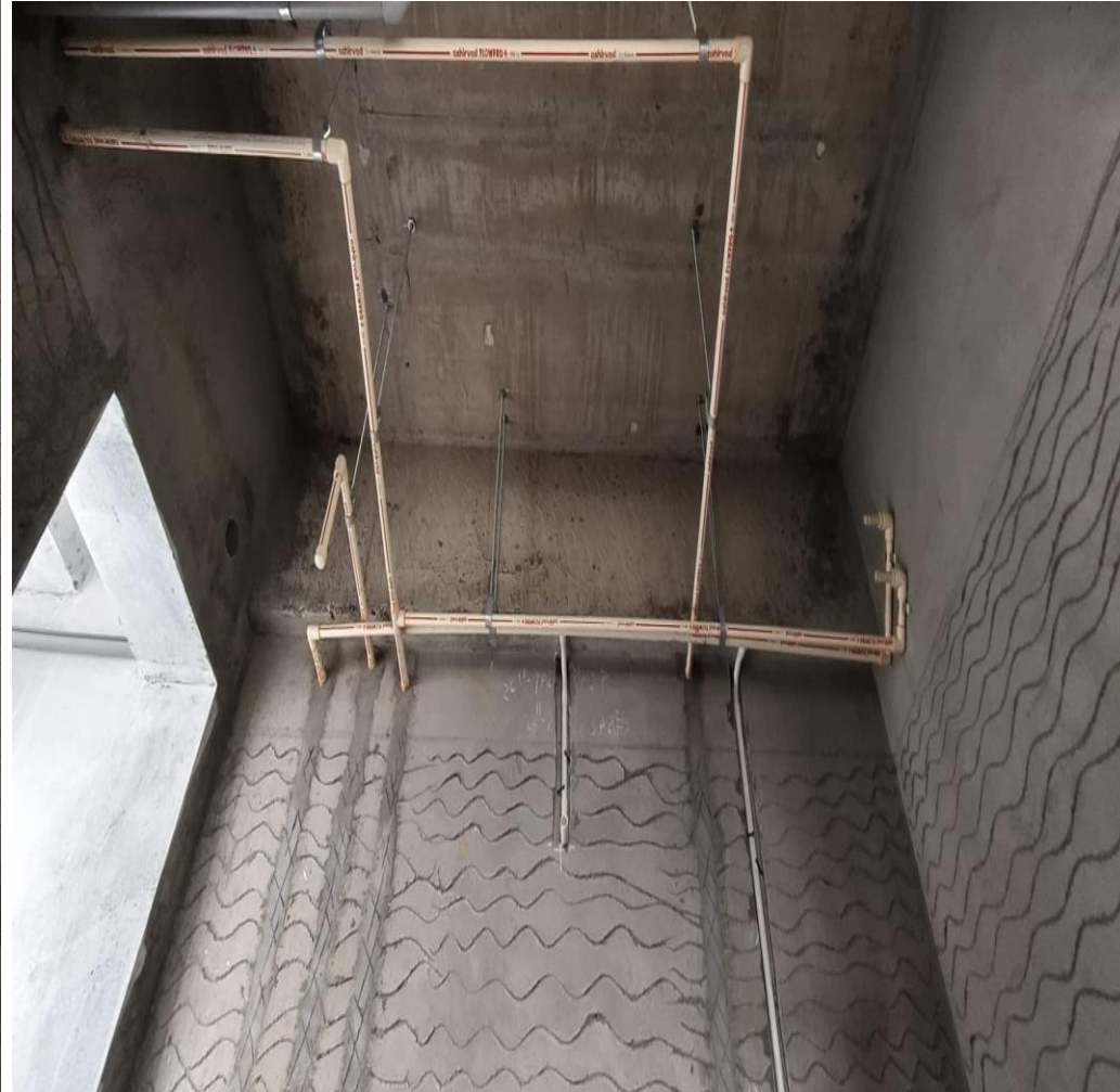
Main Building Pour-2 5 th Floor Plumbing Work Completed.