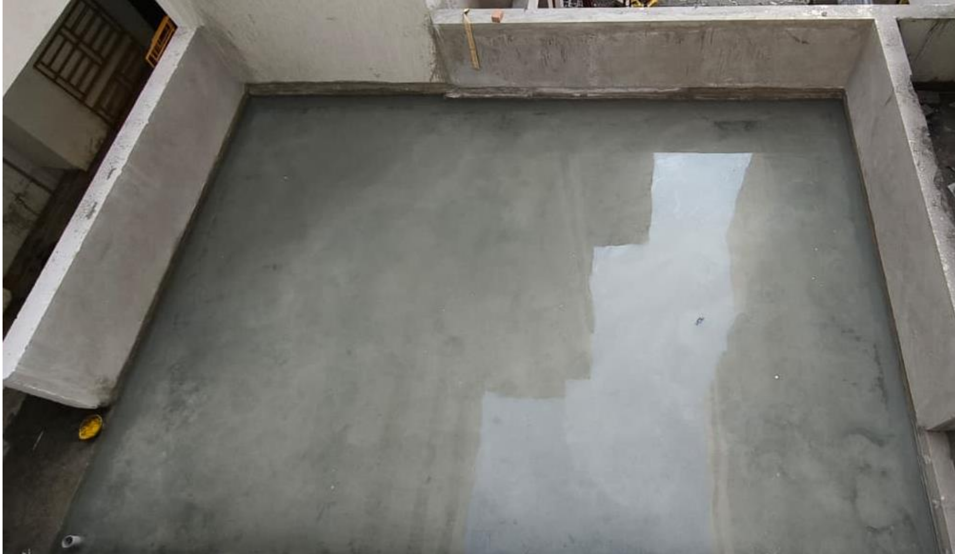
Kids Play Area Waterproofing Work In Progress.