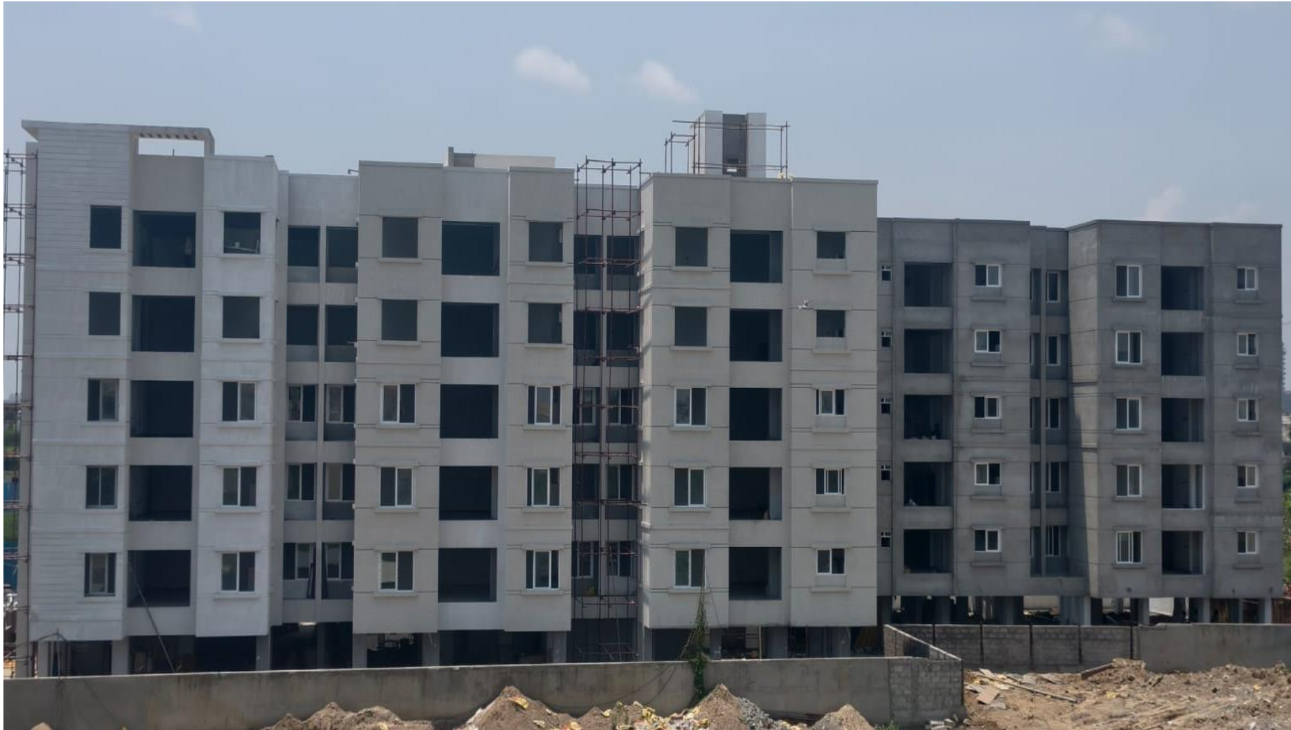
North Side View.