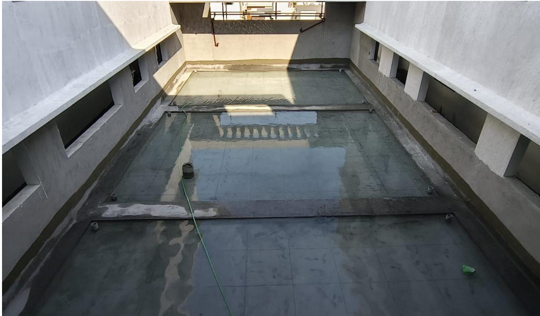
Badminton Court Waterproofing Work Completed.