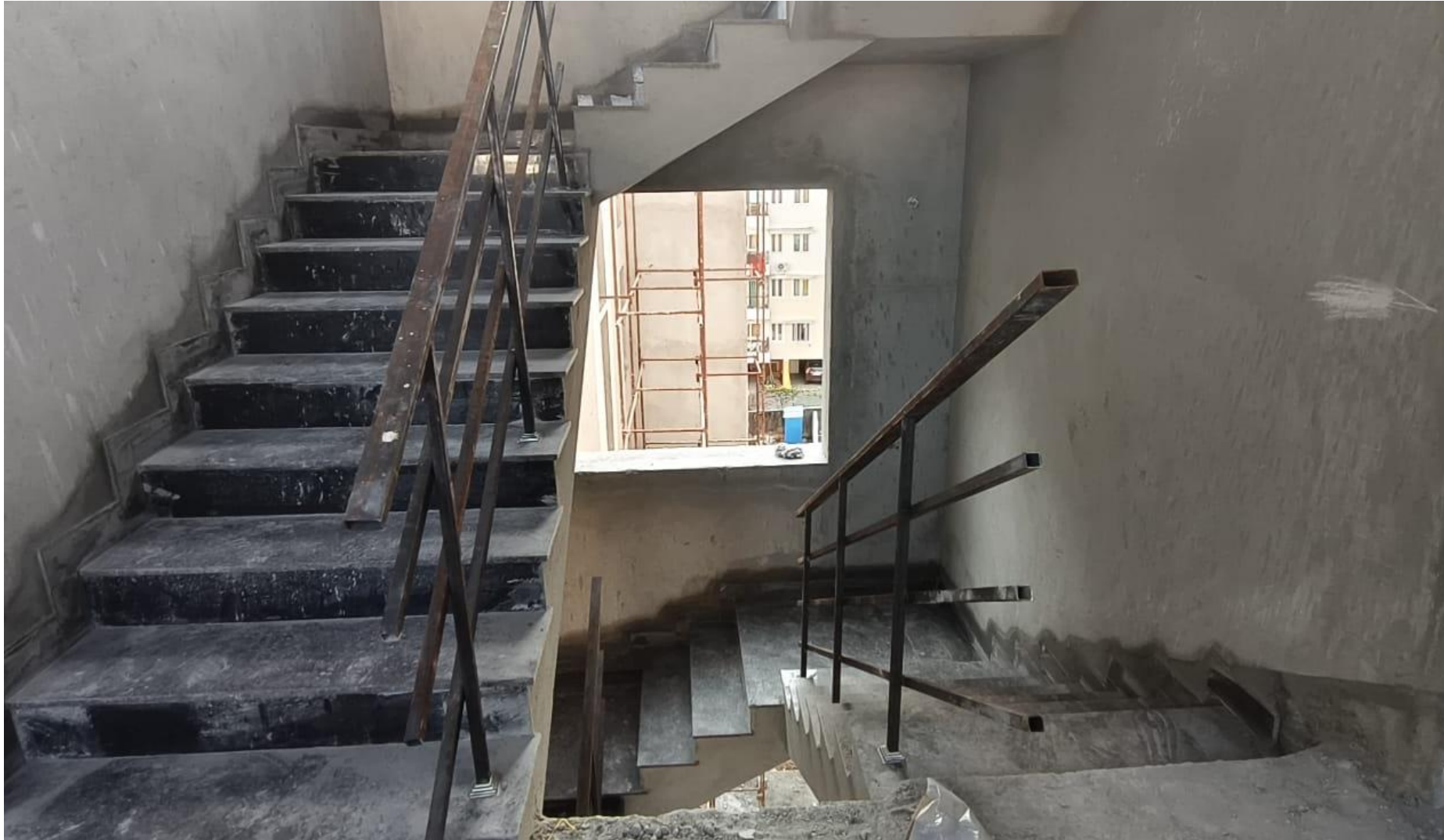
Main Building Pour-2 Staircase Granite Work Completed.