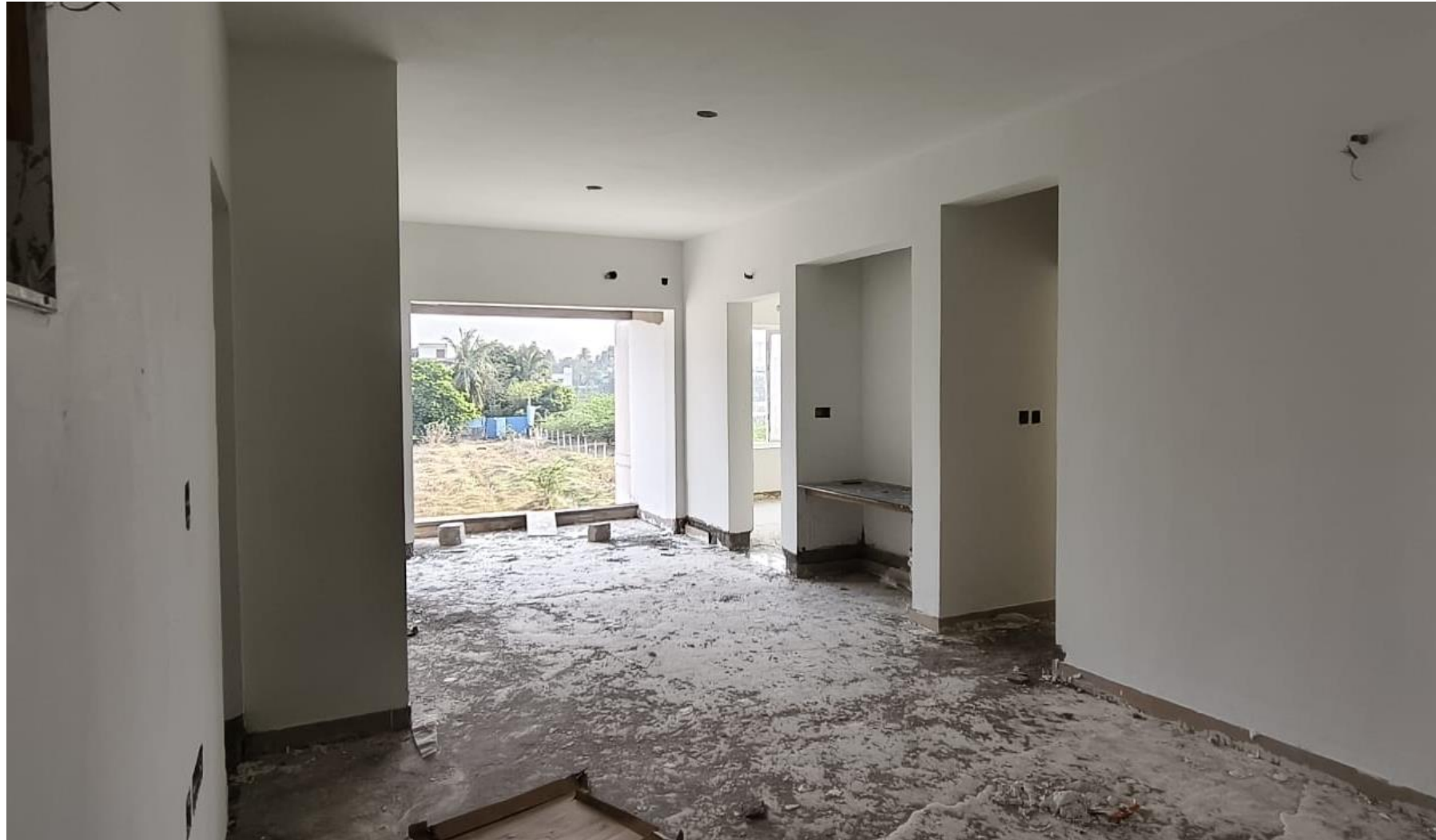
Main Building Pour-1 1 st Floor Putty Work Nearing Completion.