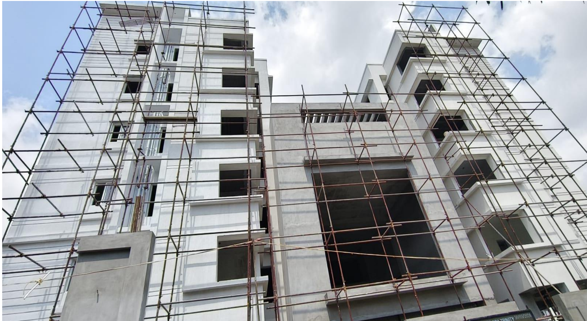
Main Building East Side External Texture Painting Work Nearing Completion.