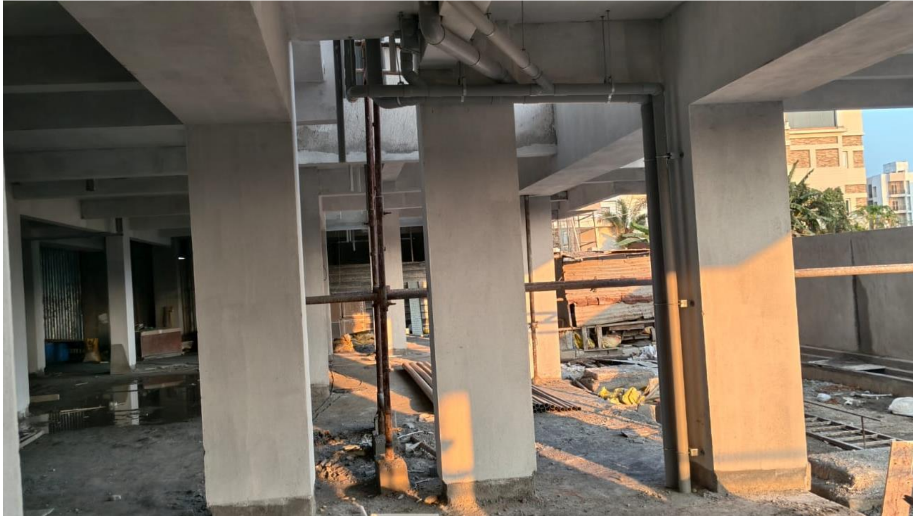
Main Building Pour-1 Stilt Floor Plumbing Work In Progress.