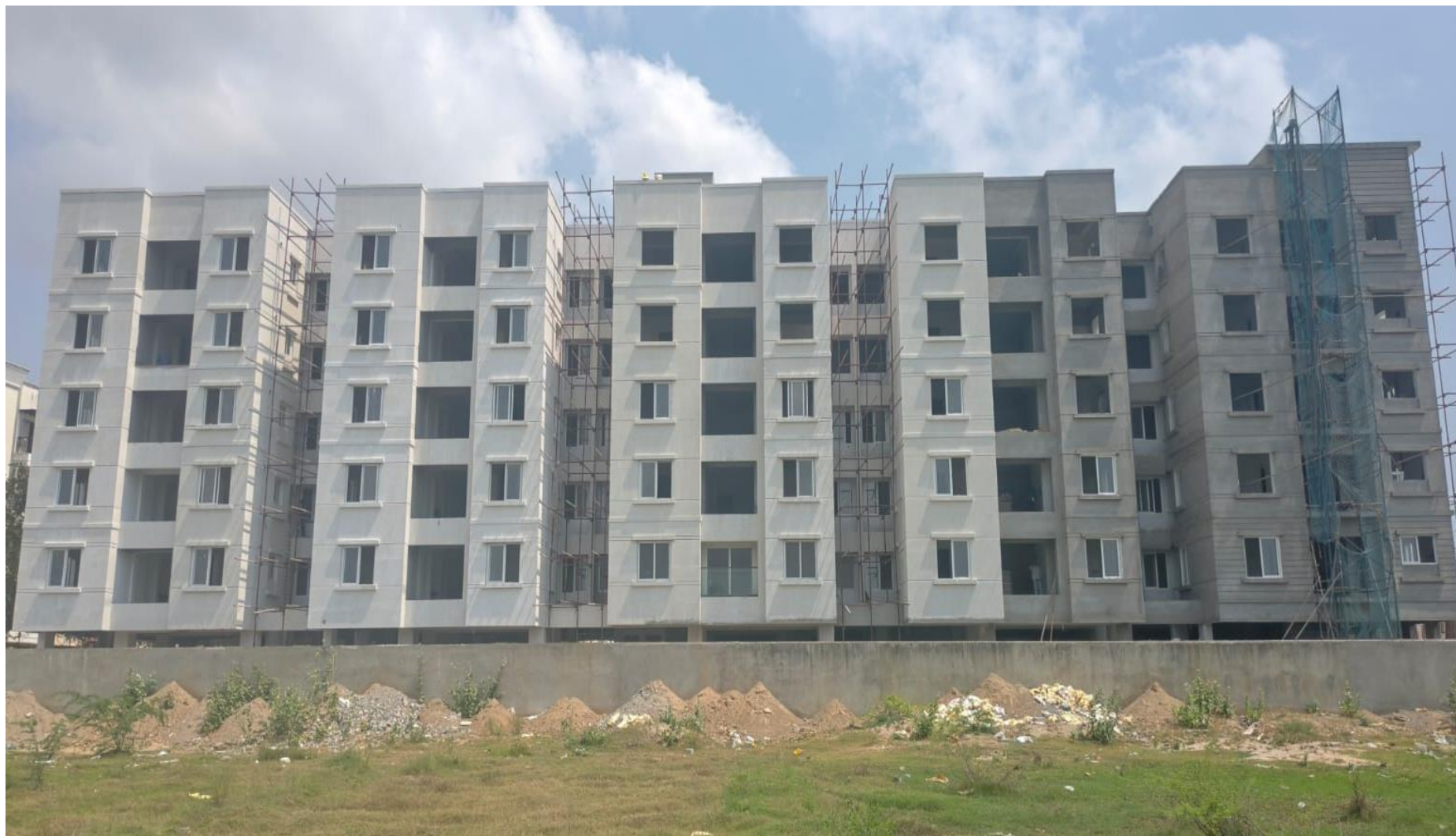
South Side View.