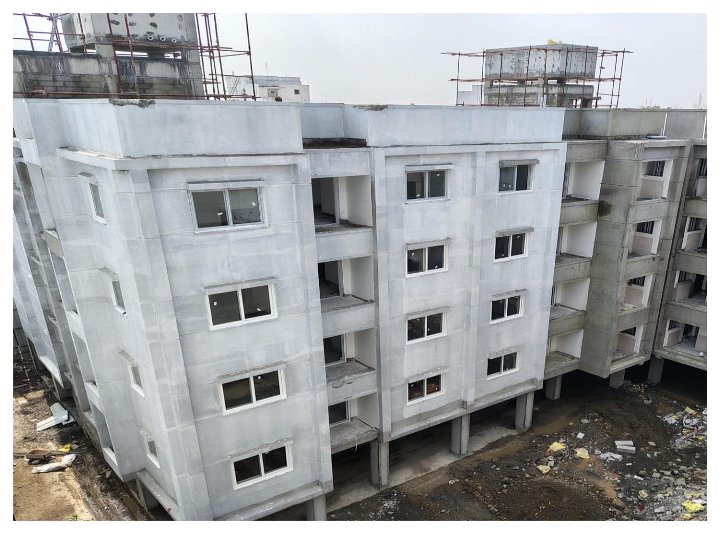
Wing 3D – North Elevation View