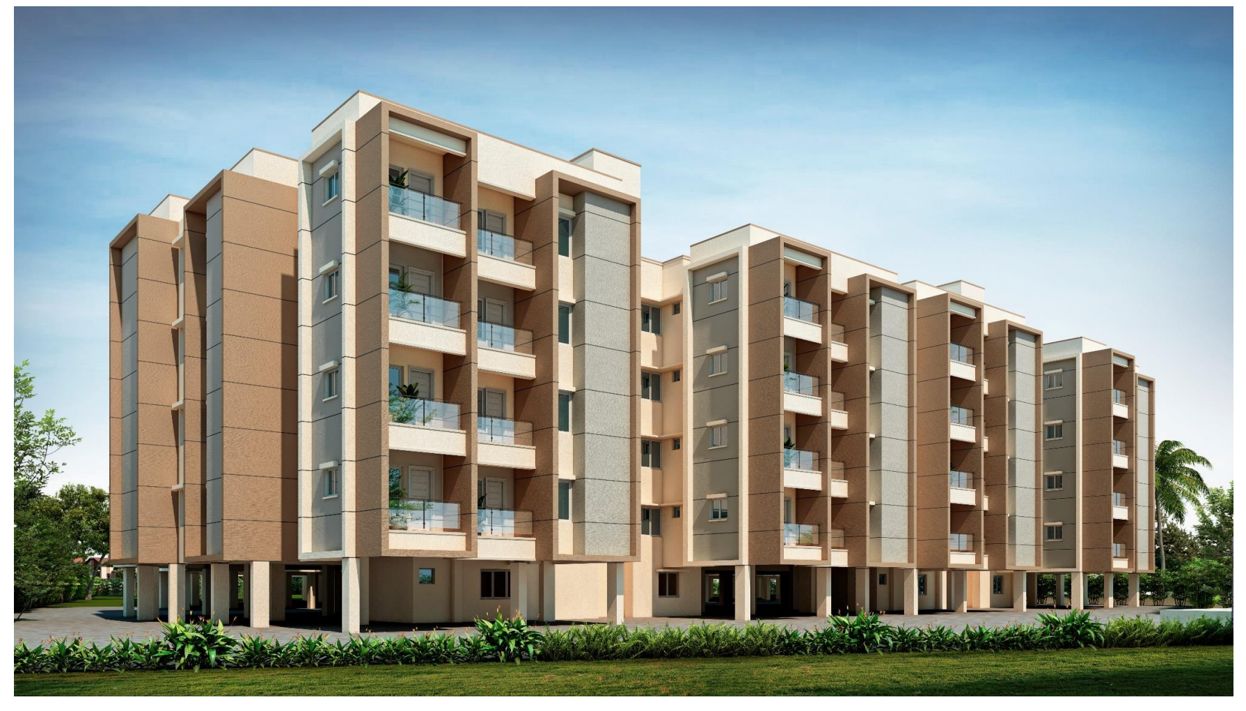
DRA URBANIA CONSTRUCTION UPDATES DECEMBER 2024