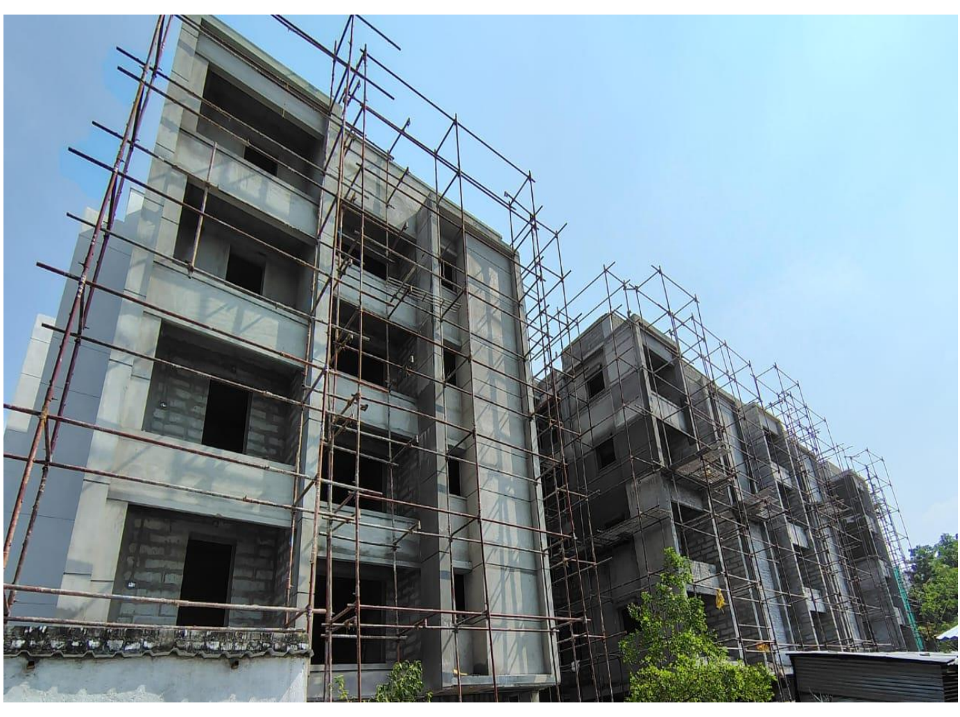
Wing 4A & 4B – West Elevation View