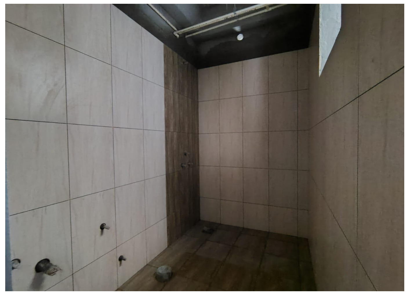
Wing 3A, 4th Floor – Master Toilet Tile Works in Progress