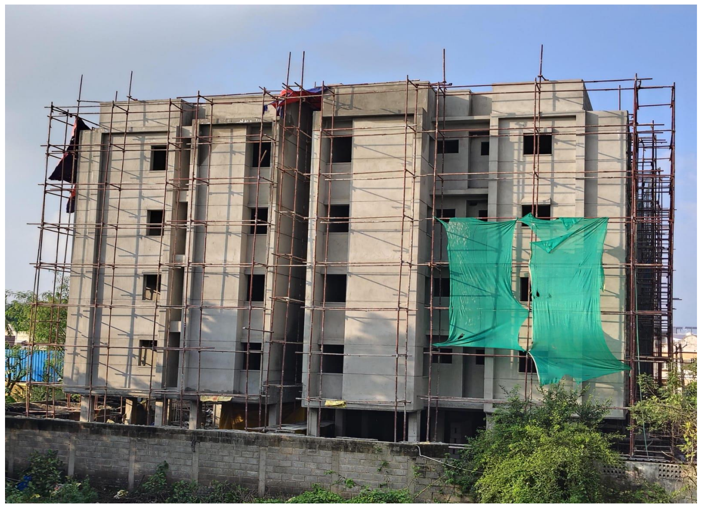
Wing 4B – South Elevation View