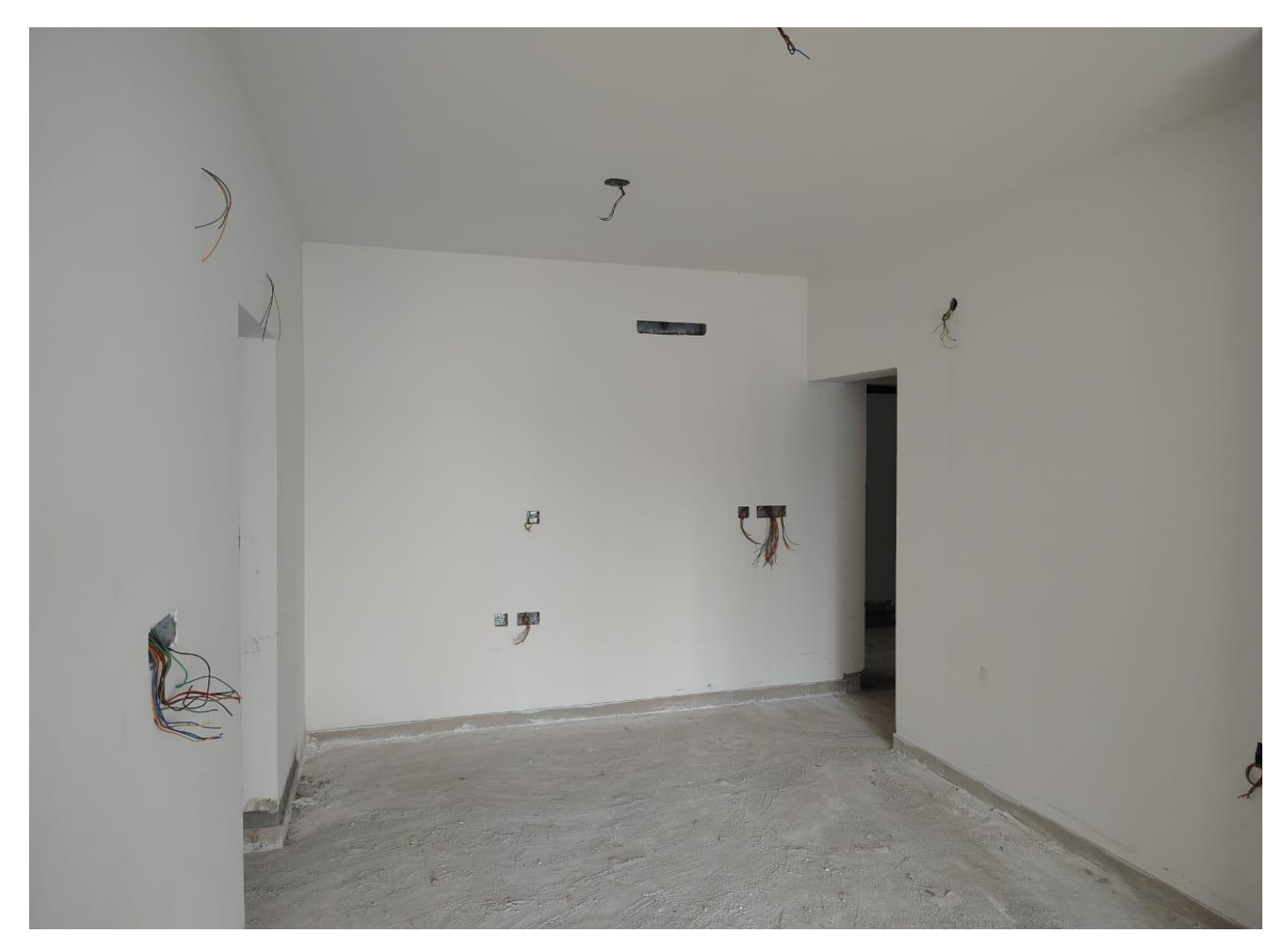
Wing 3D, 3<sup>rd</sup> Floor– Flat Wiring Works in Progress