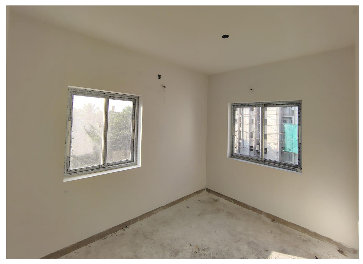
Wing 3E, 2<sup>nd</sup> Floor – Primer Works in Progress