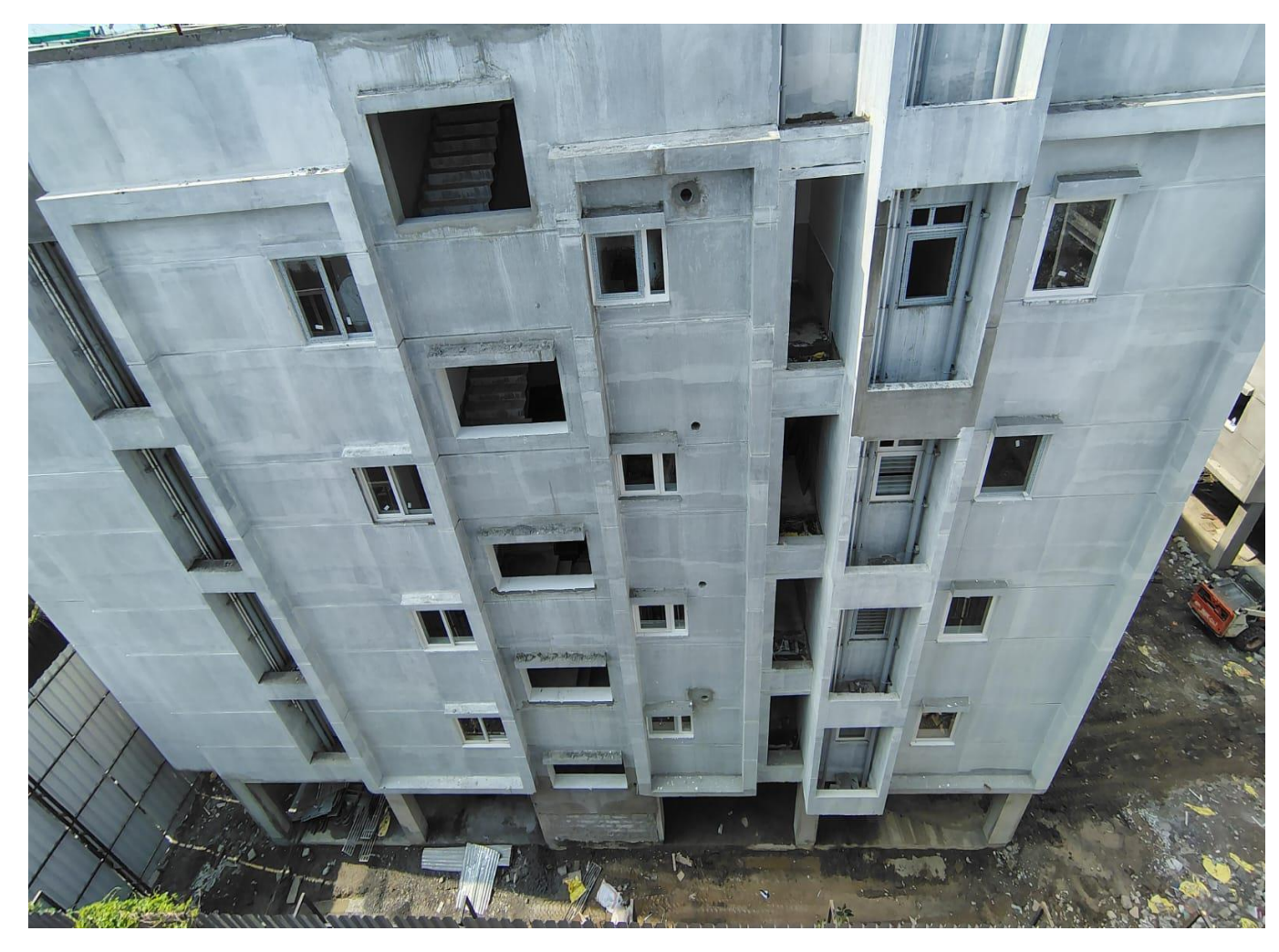
Wing 3D – East Elevation View