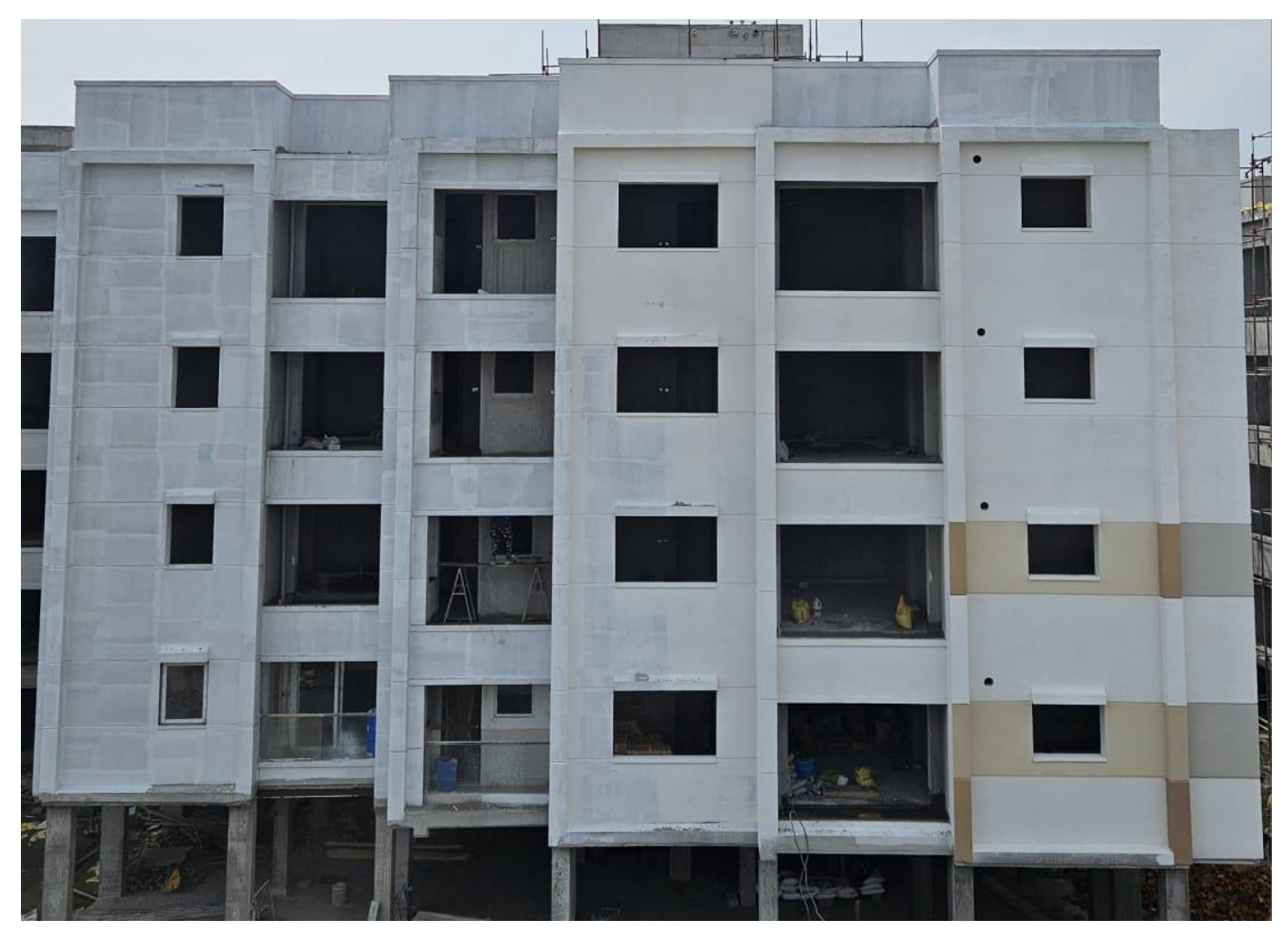
Wing 3A – North Elevation View