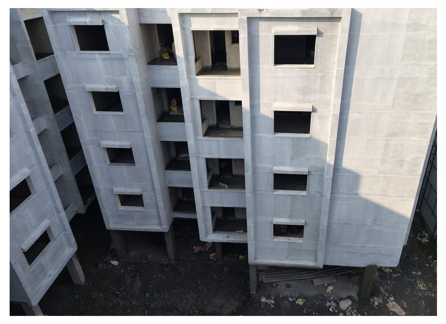
Wing 3A & 3B – Exterior Damp proof works in Progress