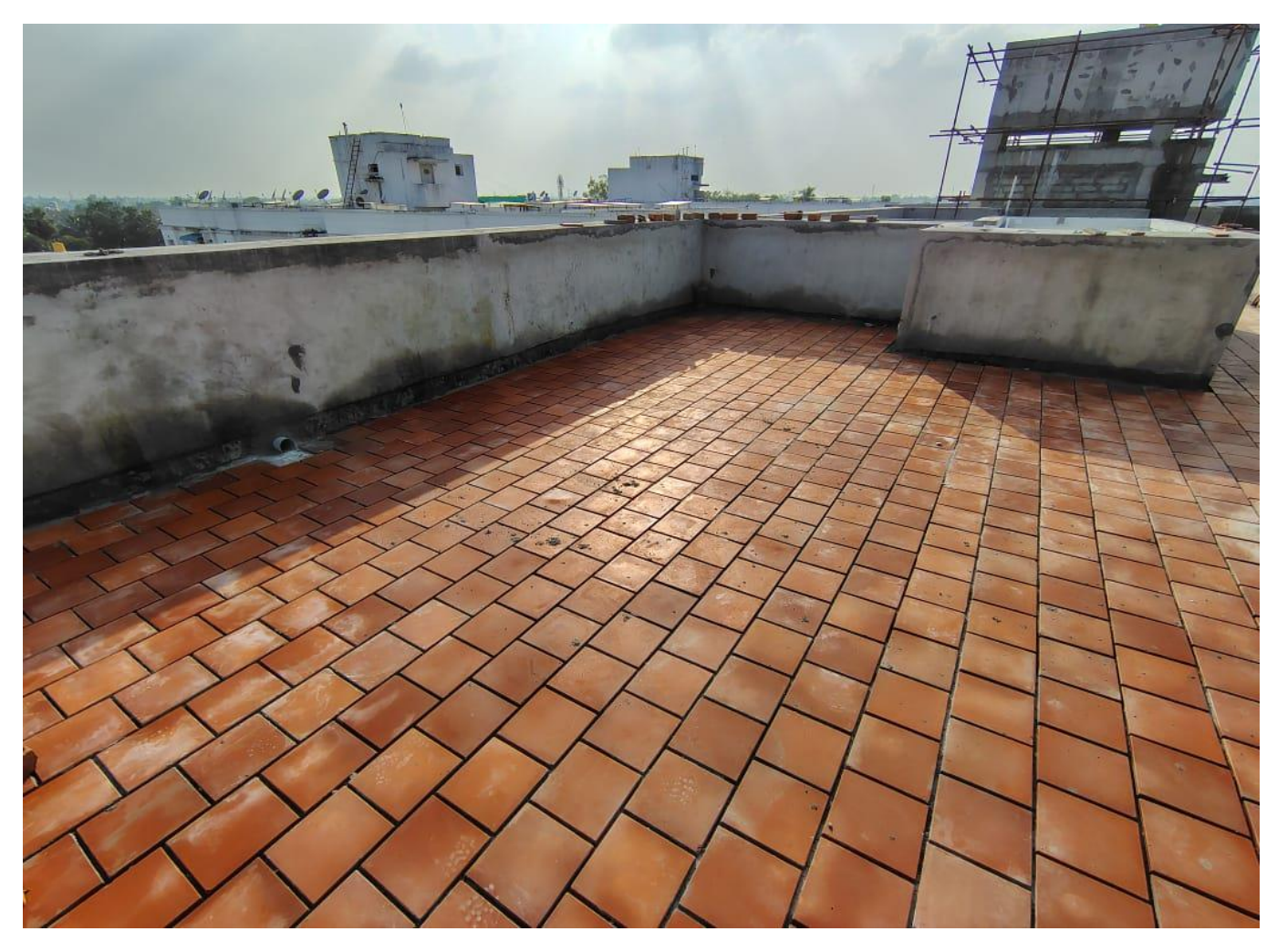
Wing 3D – Terrace Pressed Tile Works in Progress