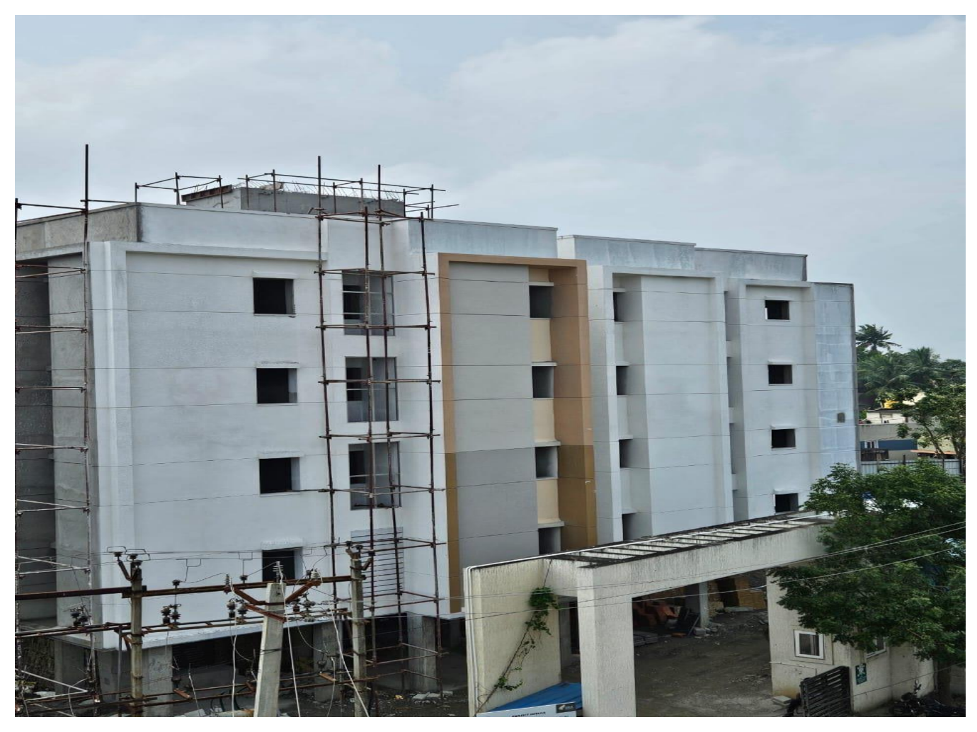
Wing 4A – North Elevation View