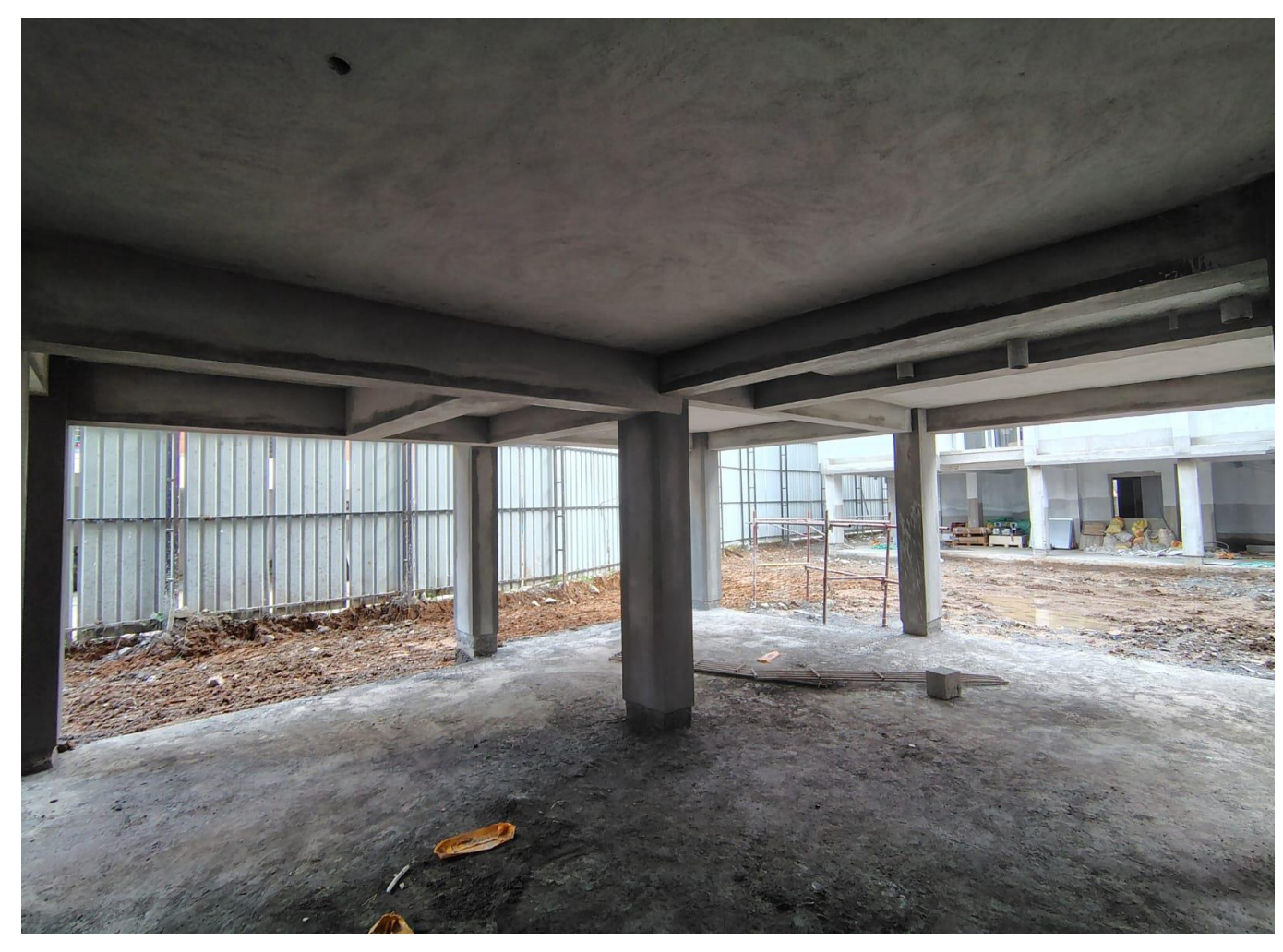
Wing 3A, 3B & 3C – Stilt Floor Plastering Works in Progress