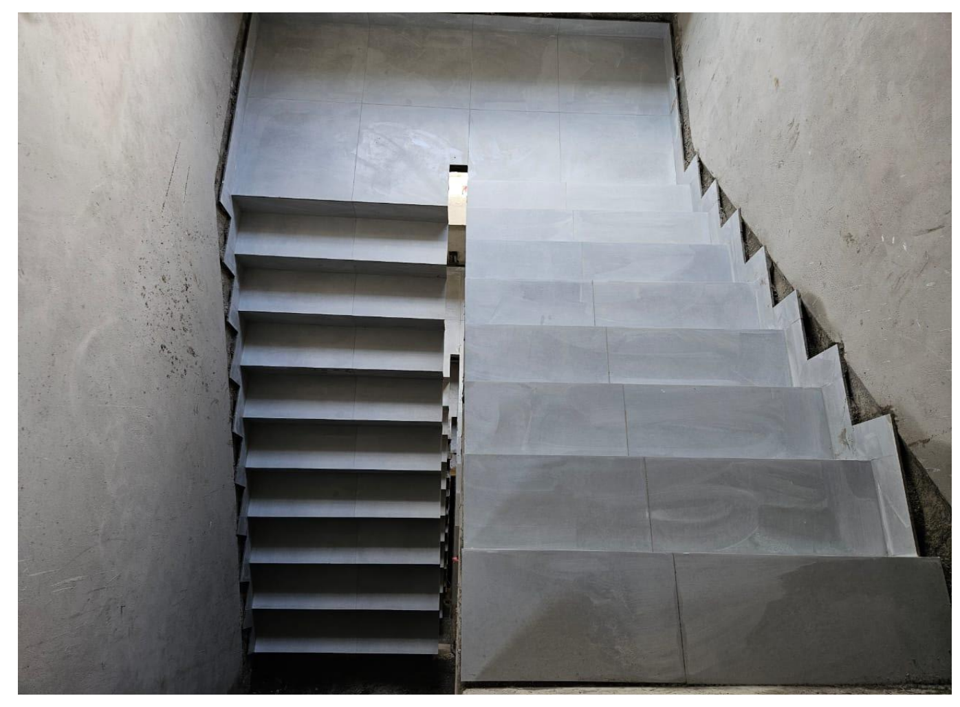
Wing 3A, 4<sup>th</sup> Floor – Staircase Tile Works in Progress