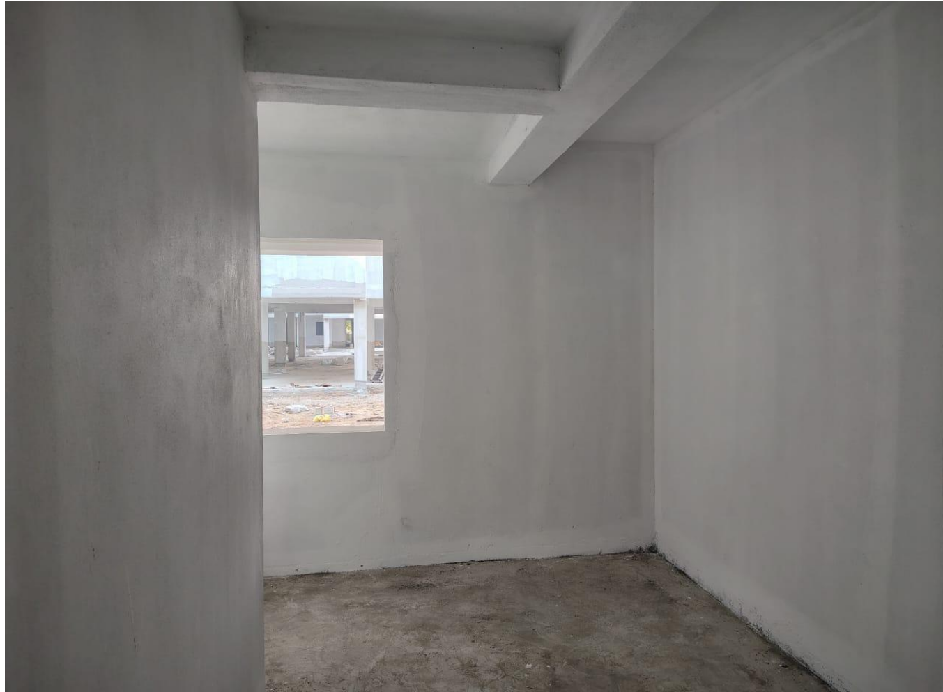
Wing 3D & 3E – Electrical Meter Panel room's ACE work got completed