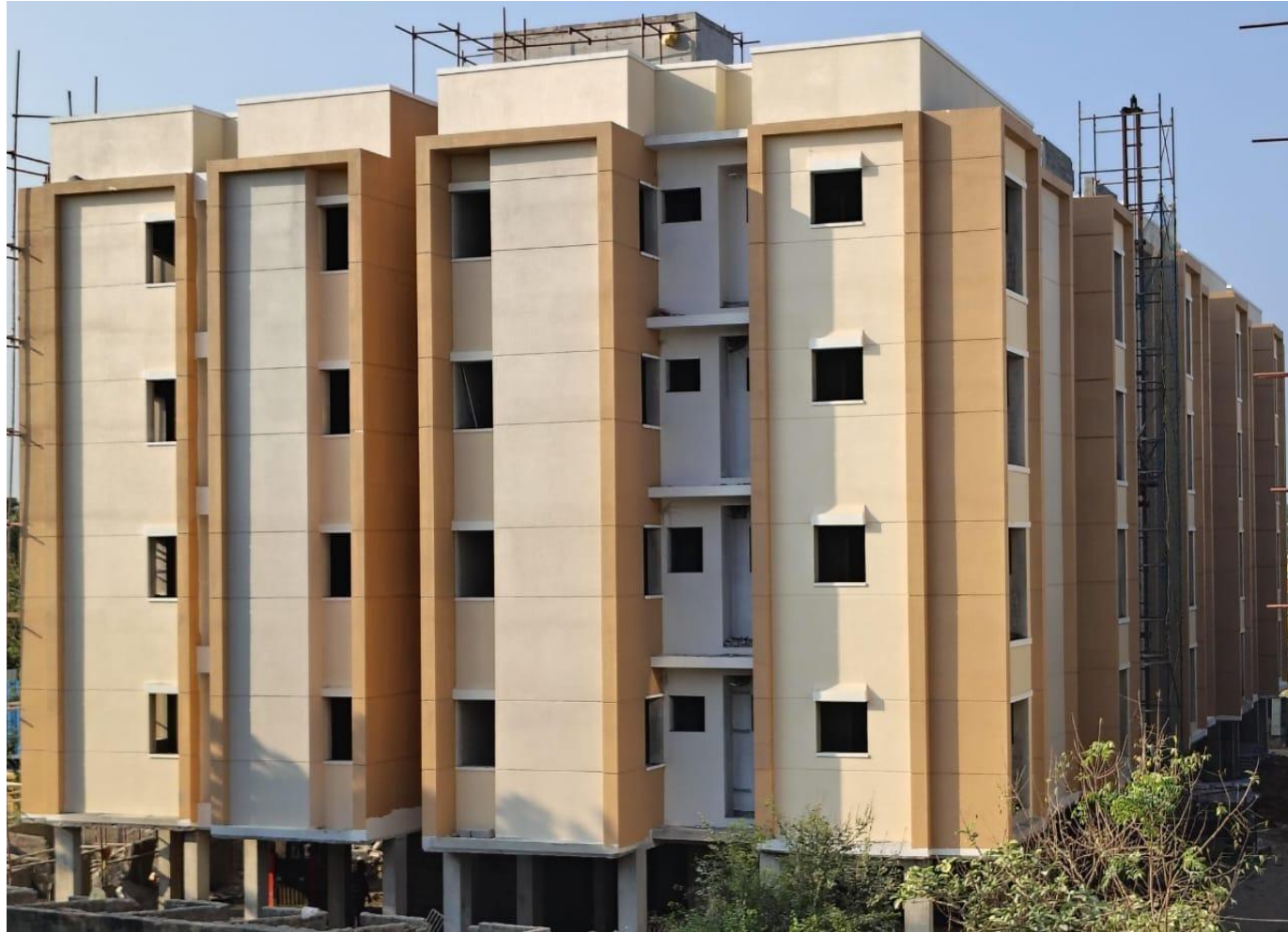
Wing 4B – South Elevation View