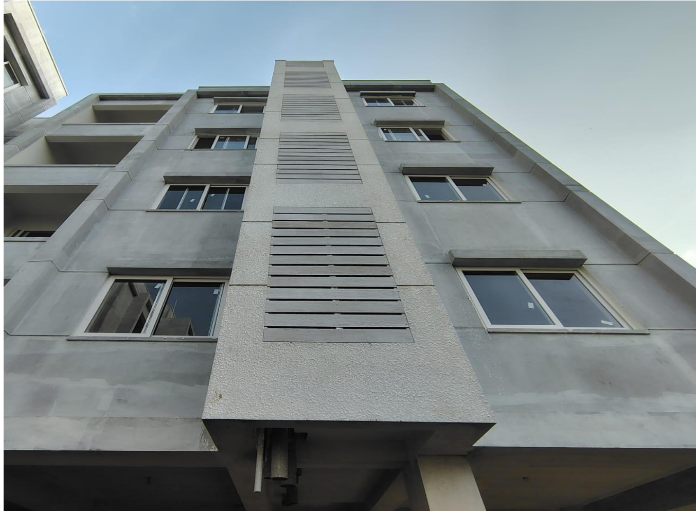
Wing 3E – Plumbing Duct's External Shera Board works in Progress