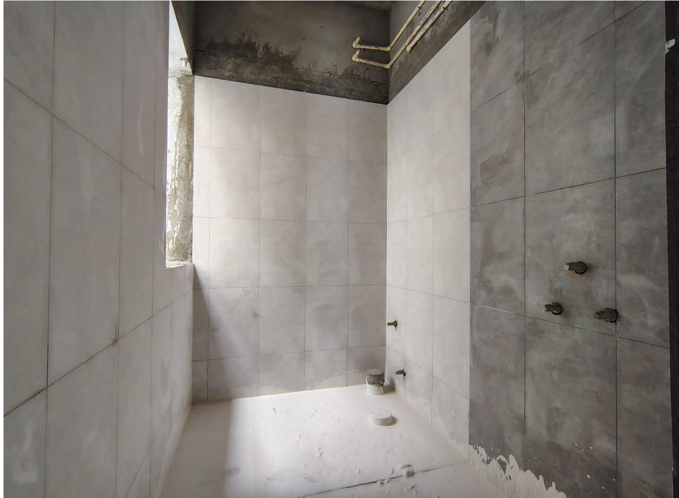
Wing 3A, 4 th Floor– Toilet Tile Work has been completed.