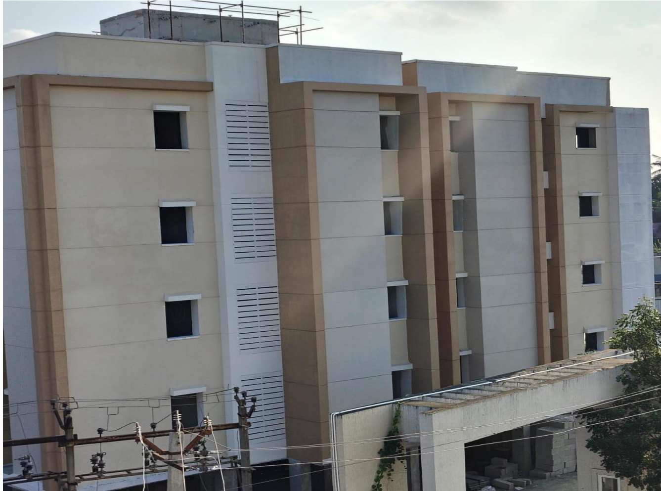
Wing 4A – North Elevation View