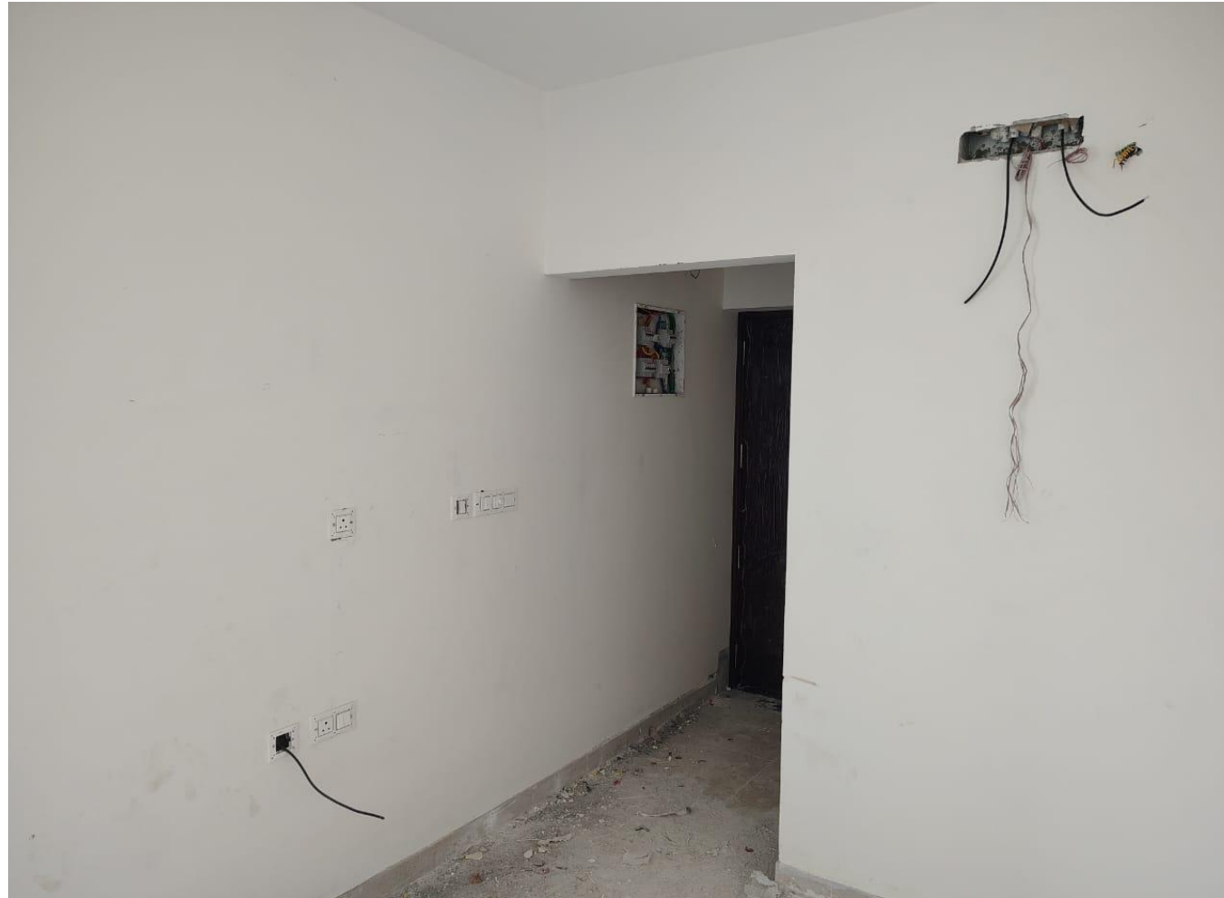
Wing 3E, 4 th Floor – Wiring Works in Progress