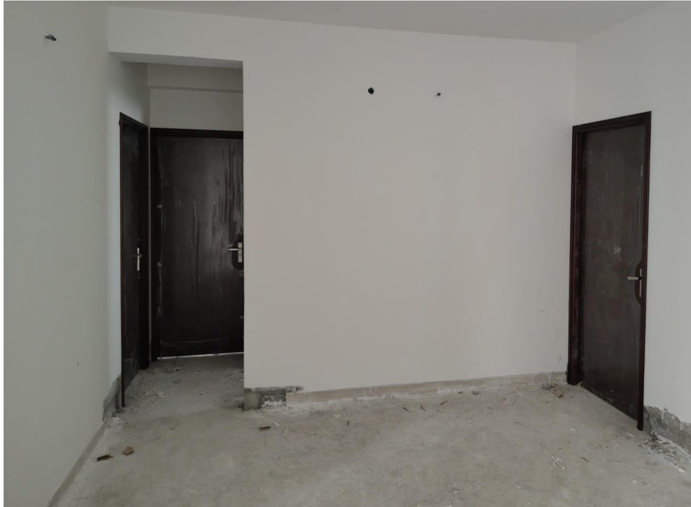
Wing 3C, 4 th Floor – Door Fixing Works in Progress