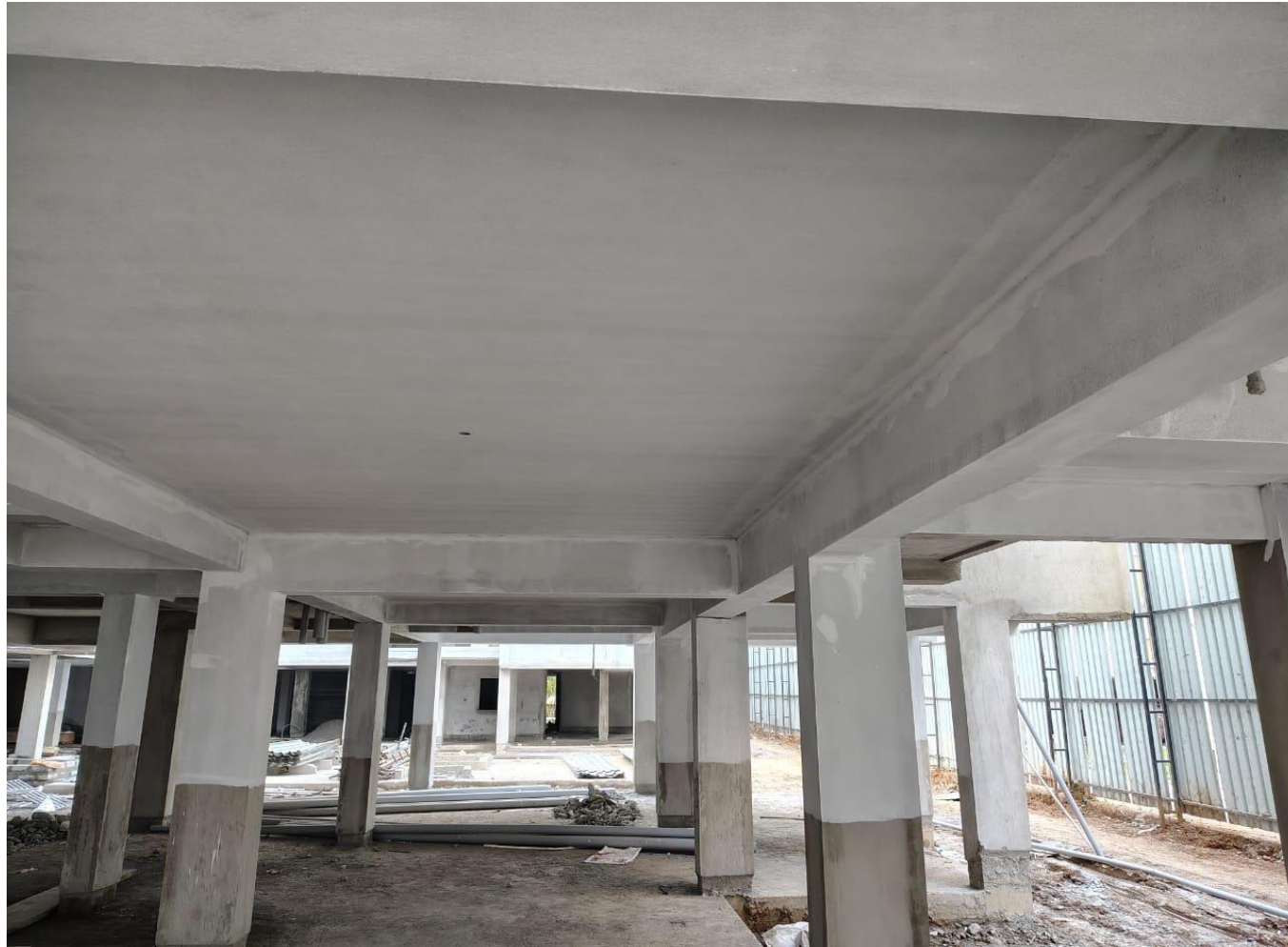
Wing 3A & 3C, Stilt Floor– Primer Work in Progress