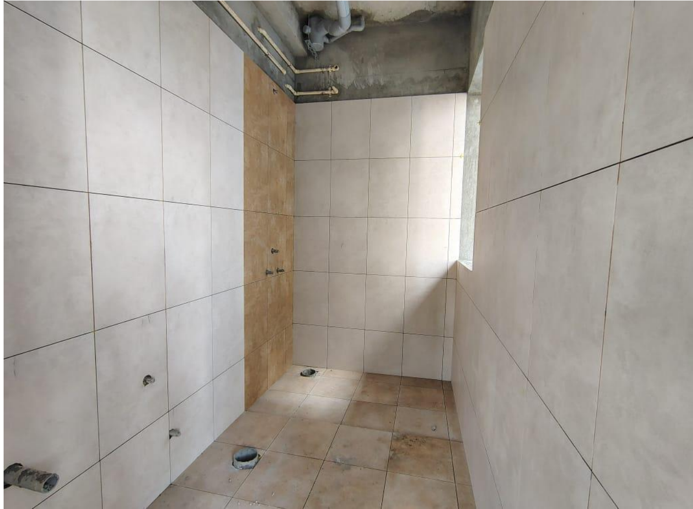
Wing 3B, 4 th Floor– Toilet – 3 –Tile Work in Progress