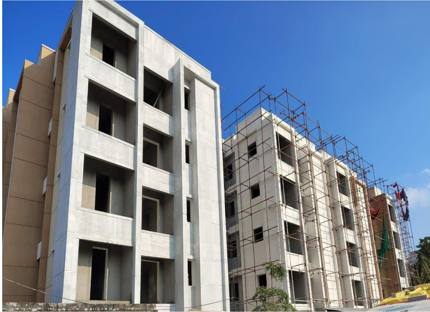
Wing 4A & 4B – West Elevation View