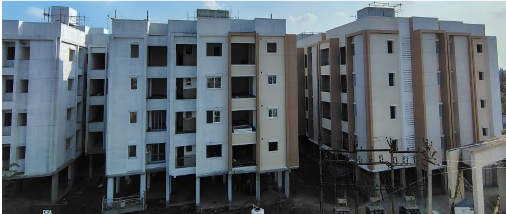
PROJECT – OVERALL VIEW