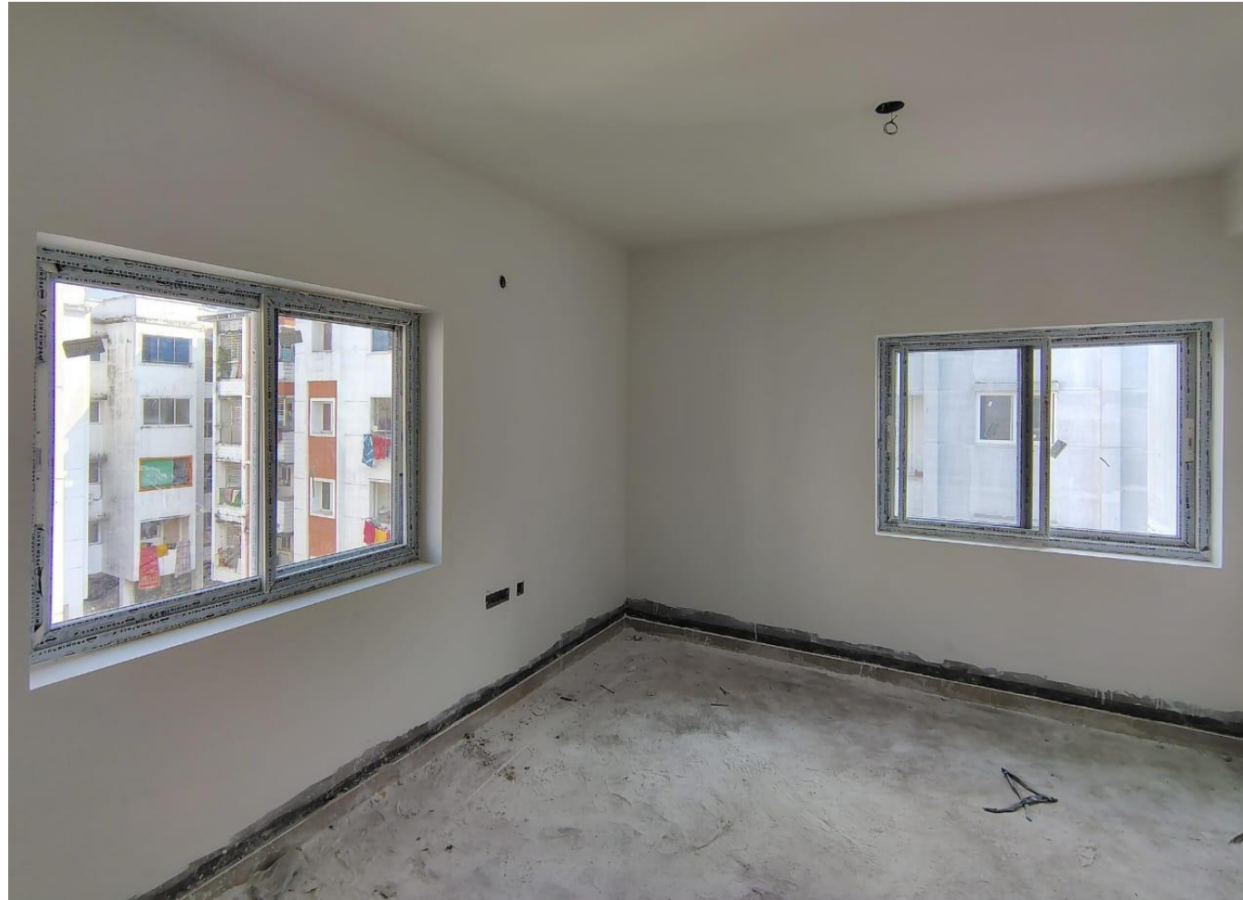
Wing 3A – upvc windows work in Progress