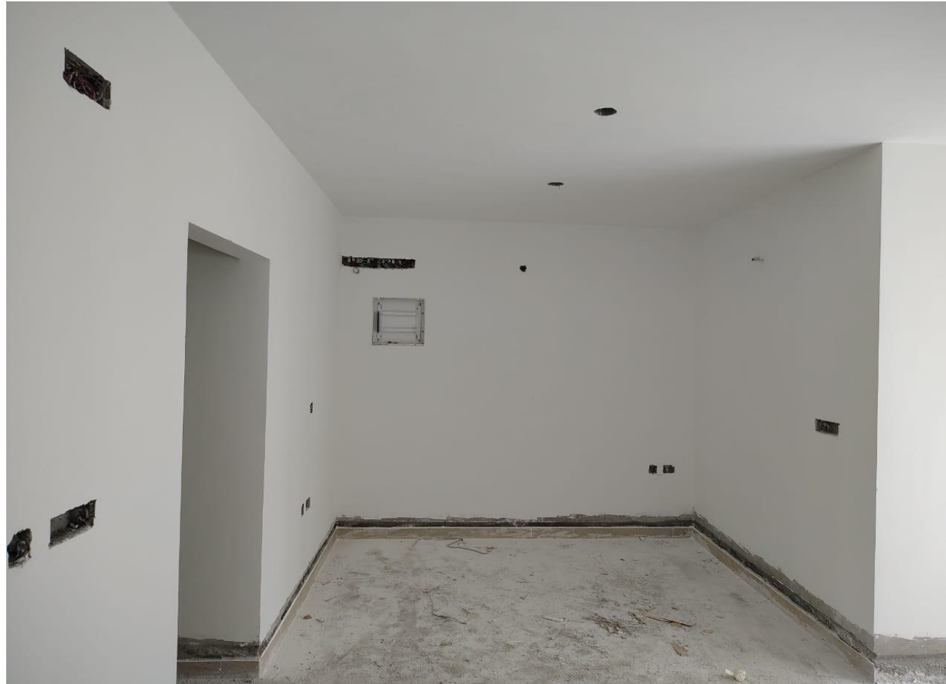
Wing 3A & 3B – Putty work in Progress