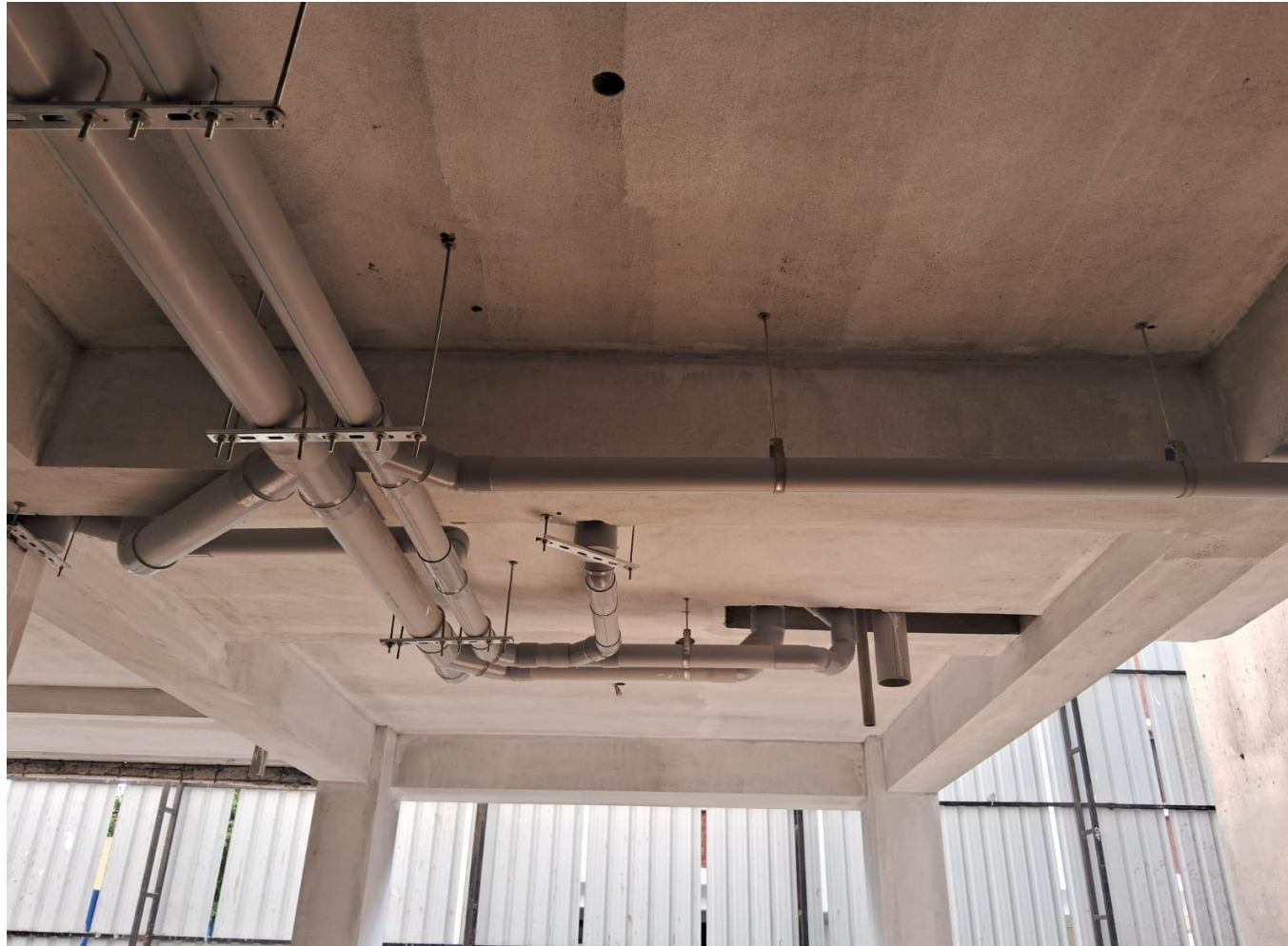
Wing 3D, Stilt Floor – Plumbing Ceiling Suspended Works got commenced