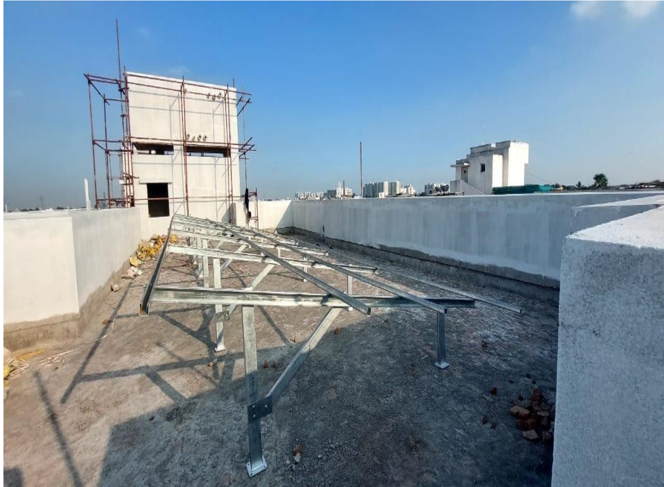
Wing 3D & 3E – Solar Panel's Frame Fabrication Works in Progress