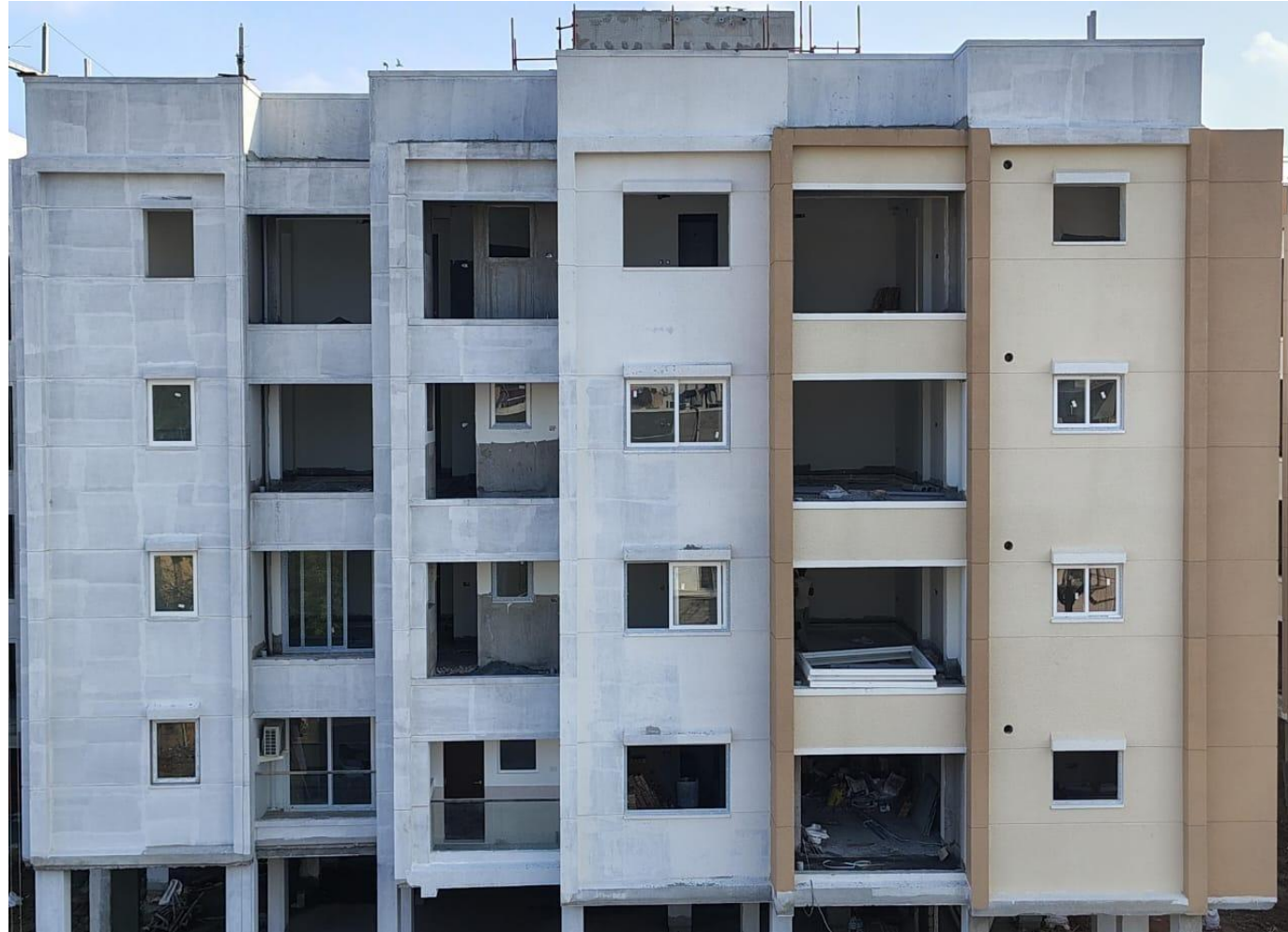
Wing 3A – North Elevation View