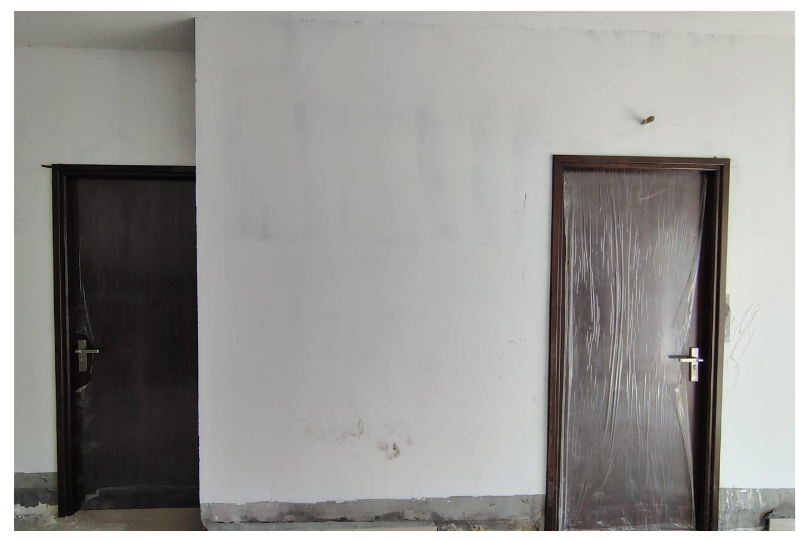
Wing 4B, 3<sup>rd</sup> & 4<sup>th</sup> Floor – Door Installation Works in Progress