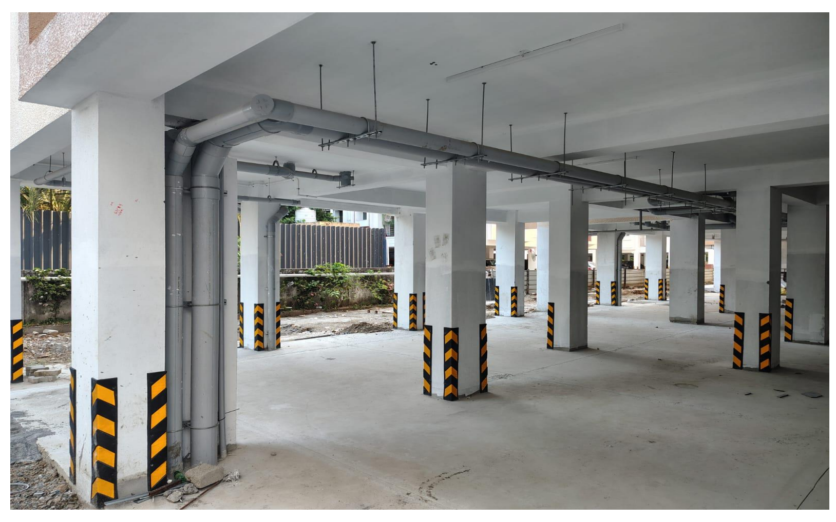
Block -3D & 3E Stilt Floor Column Guard Fixing Work In Progress