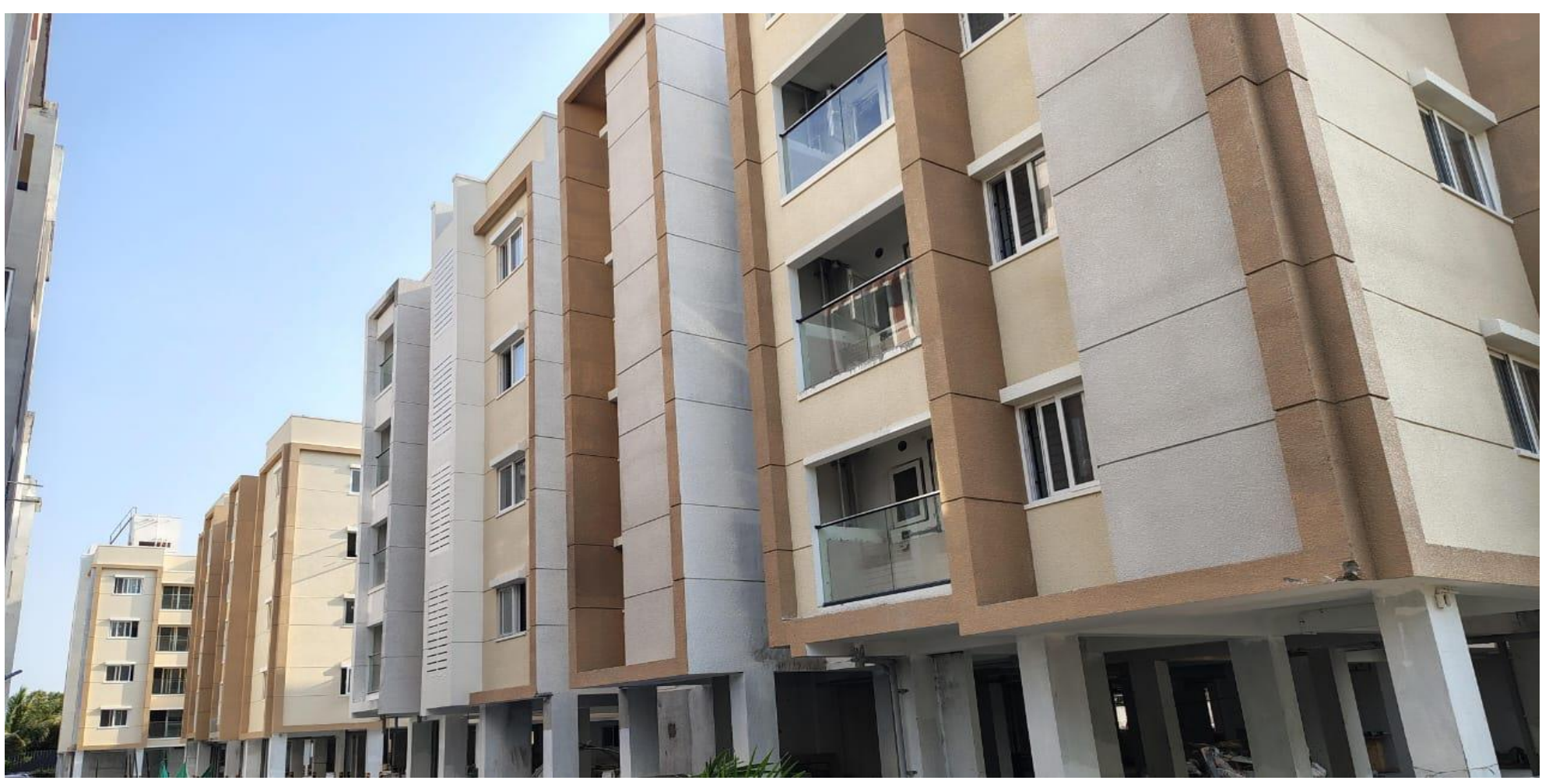
Wing 3B,3C & 3D – East Elevation View