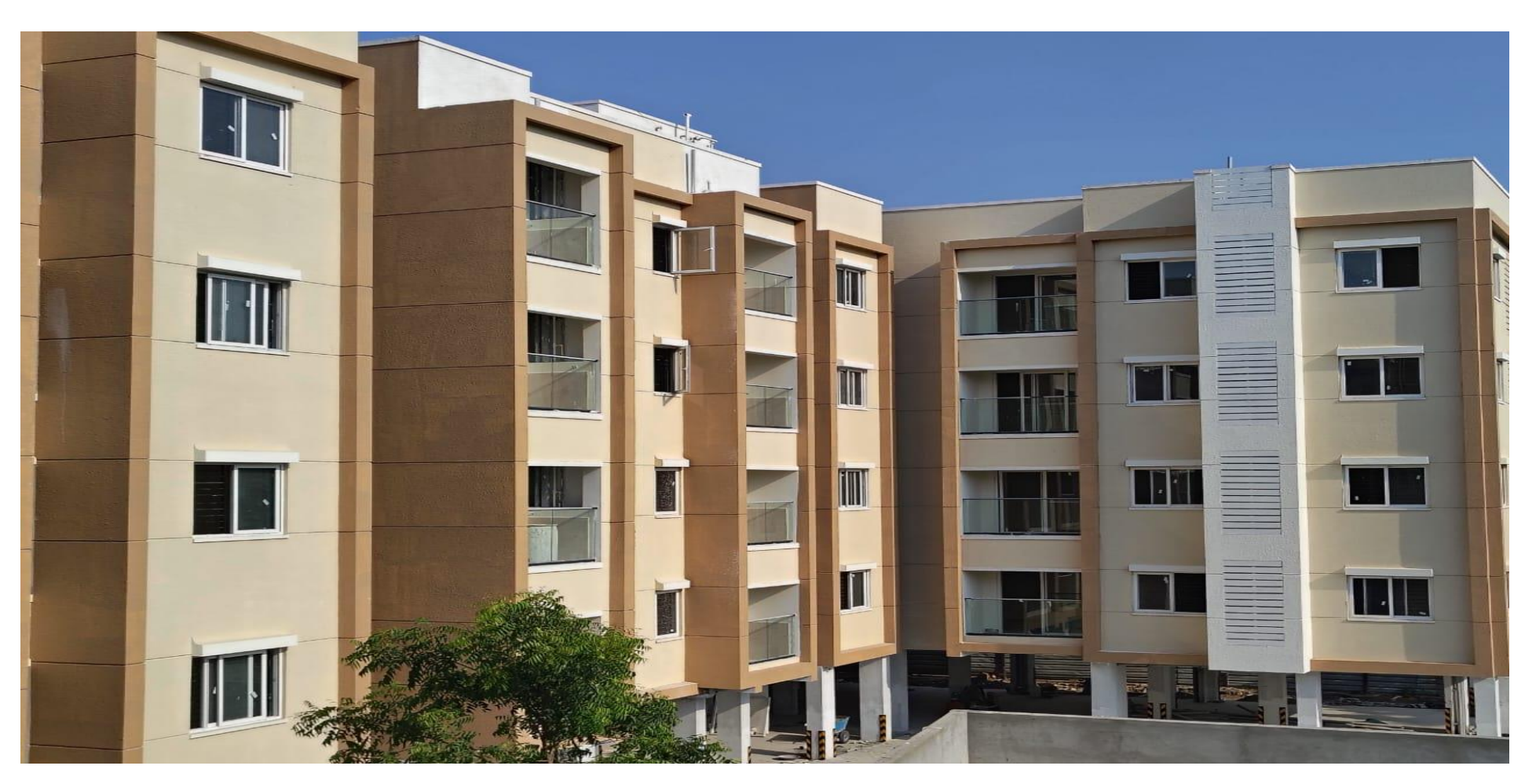
Wing 3C & 3E – West & North Elevation View