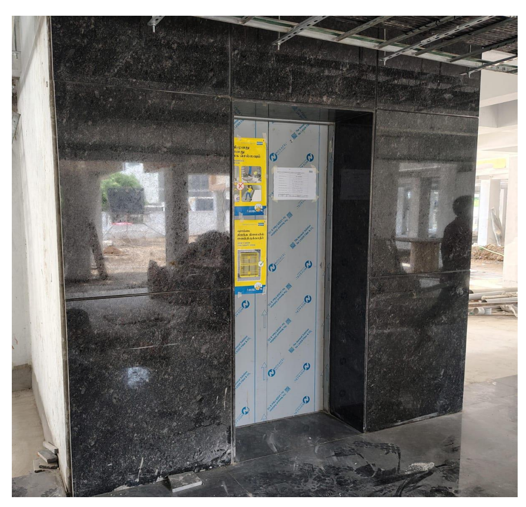
Wing 3B, 3C & 3D Stilt Floor – Lobby Granite Works in Progress