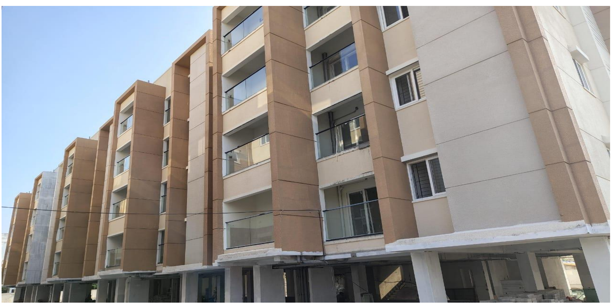
Wing 4A & 4B – West Elevation View