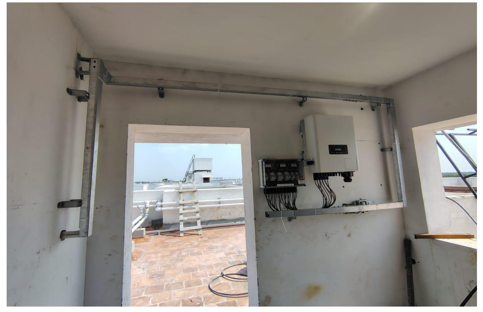
Block 3 & 4 Solar Inverter & Wiring Work In progress