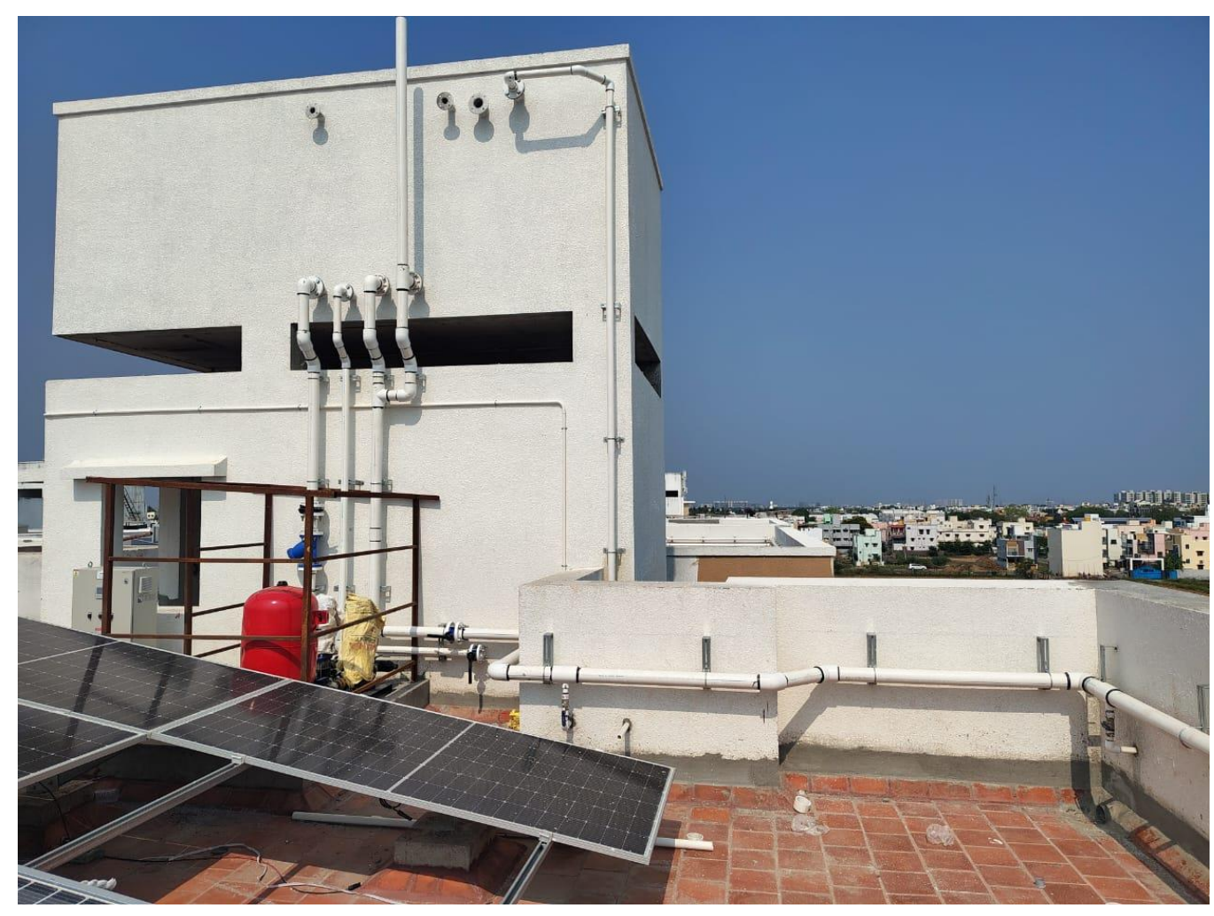
Block -3, Terrace Ring Main line Work In Progress