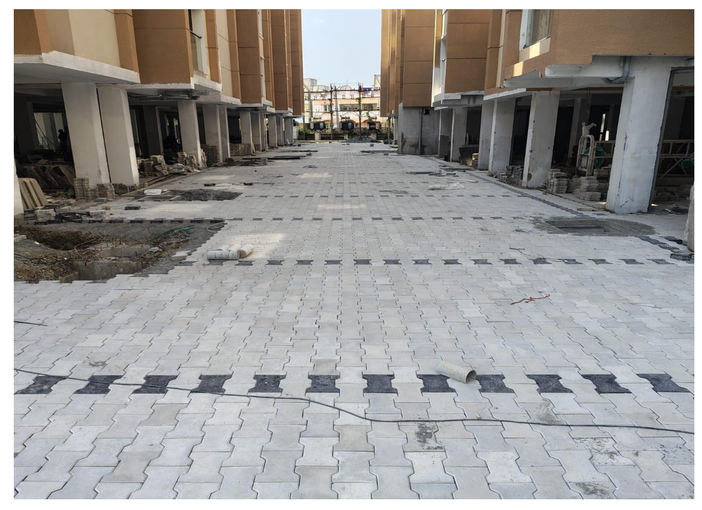
Block -3 & Block -4, External – Paver works in progress