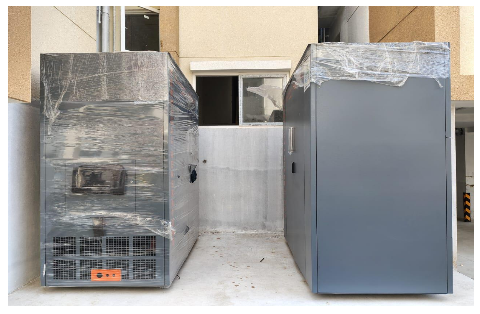
Genset Delivered at site