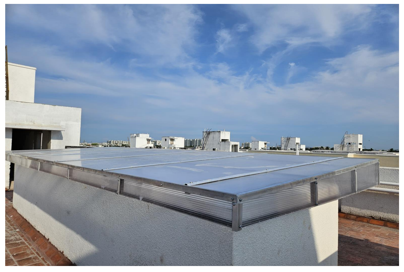
Block -3, Terrace Duct Covering Work In Progress