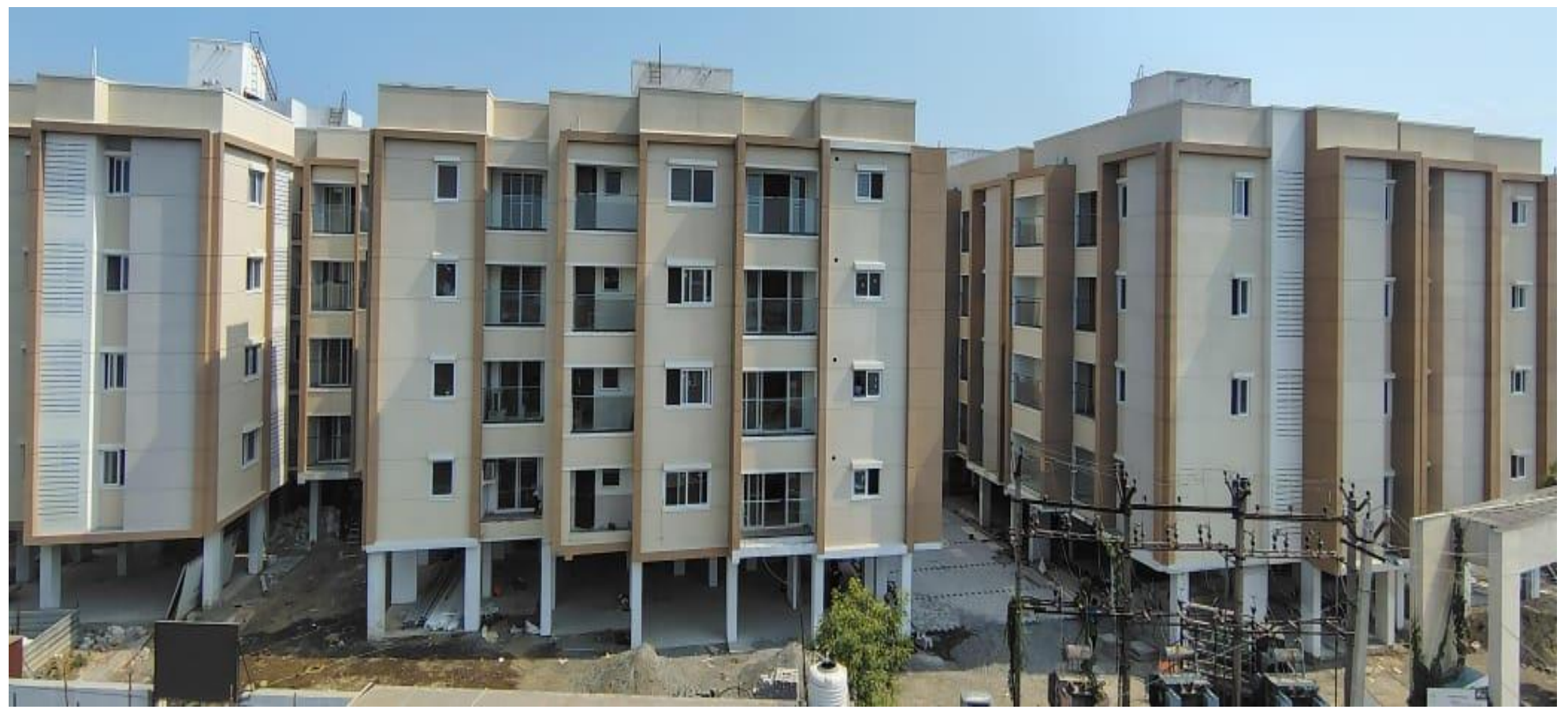
PROJECT – OVERALL VIEW