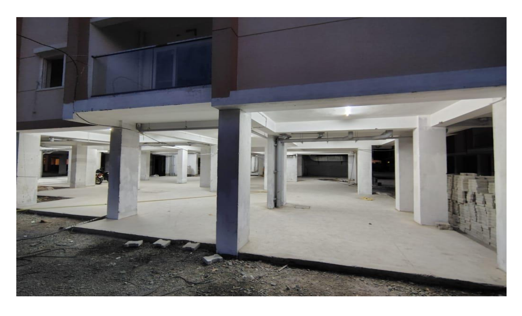
Block 3 Stilt Floor Car Parking Light Fixing Work progress