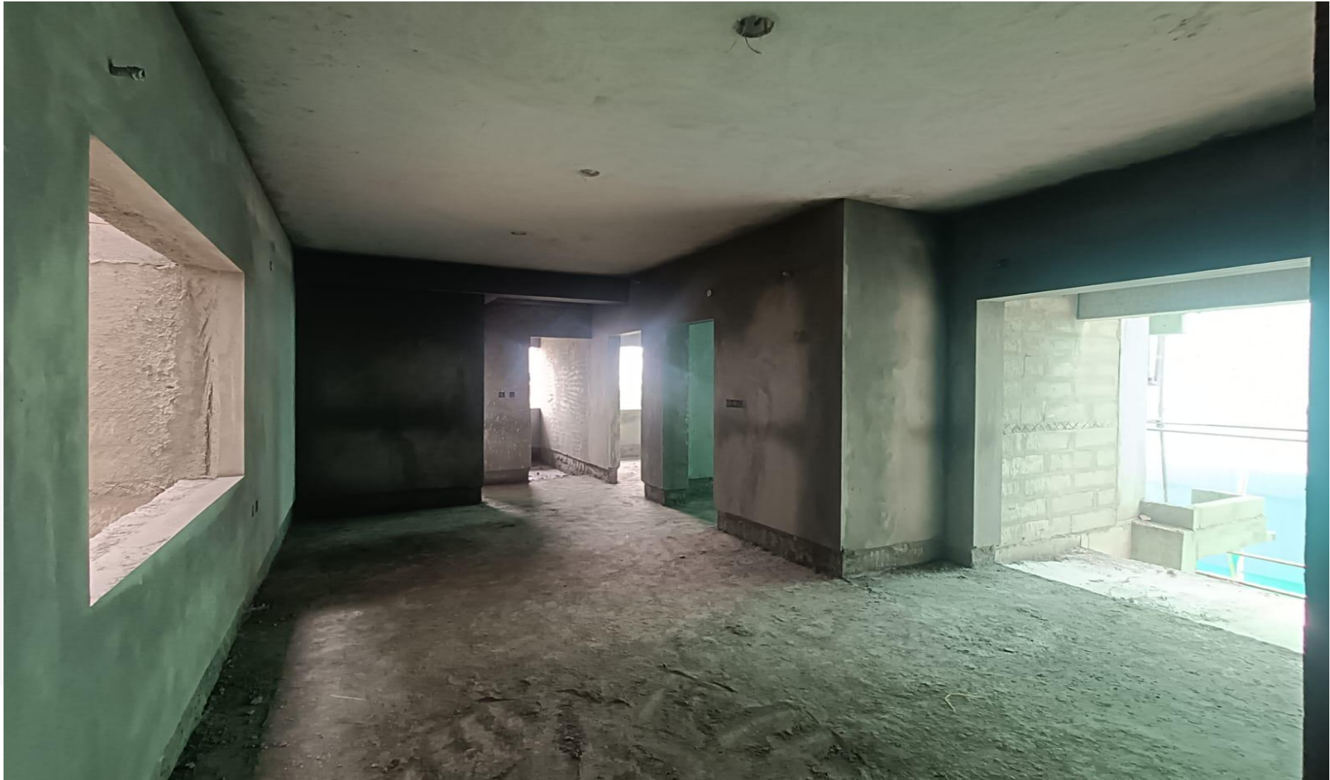
Wing 3B – 2 nd Floor Plastering Work Completed