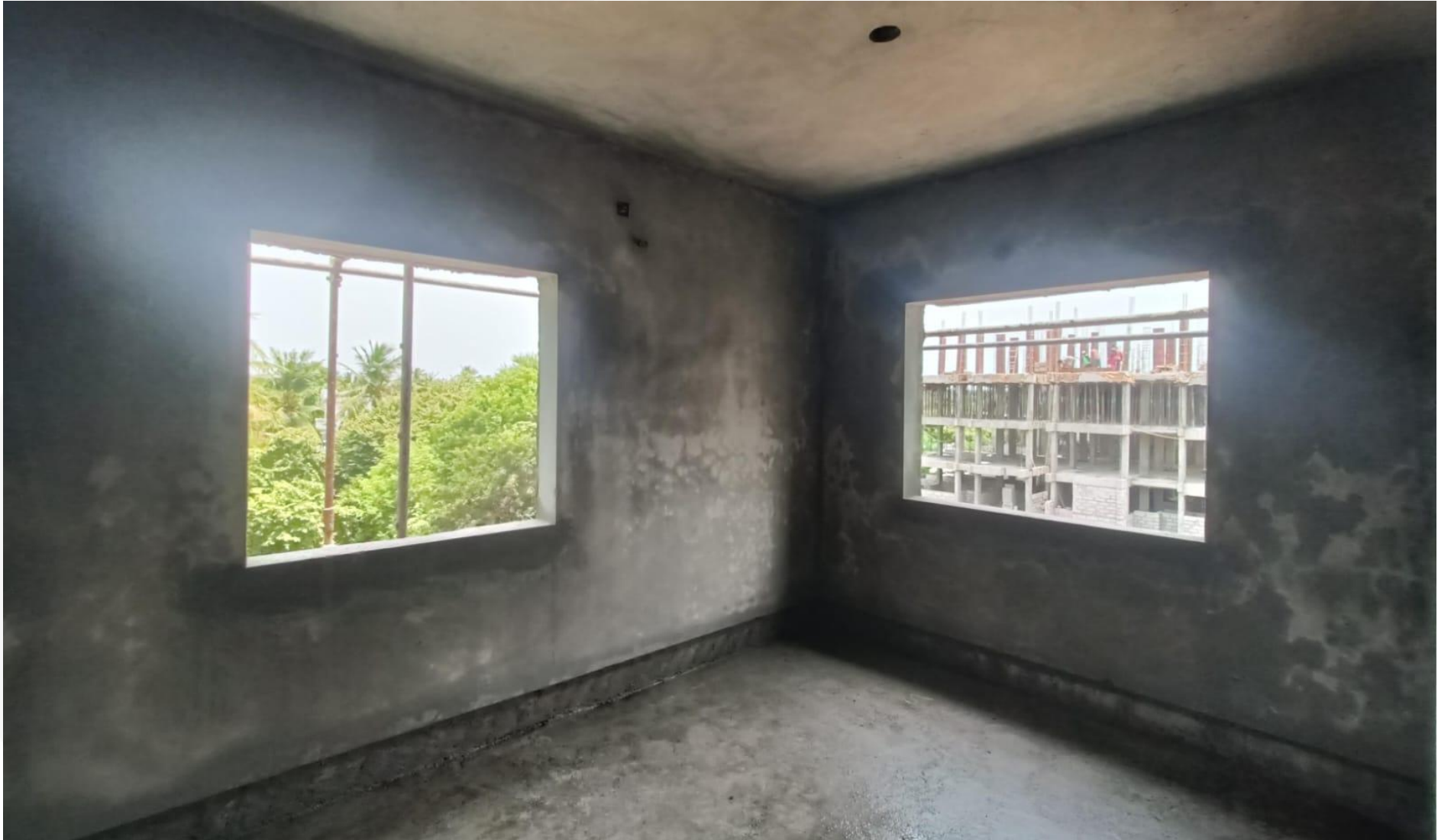
Wing 3E – 3 rd Floor Plastering work in Progress