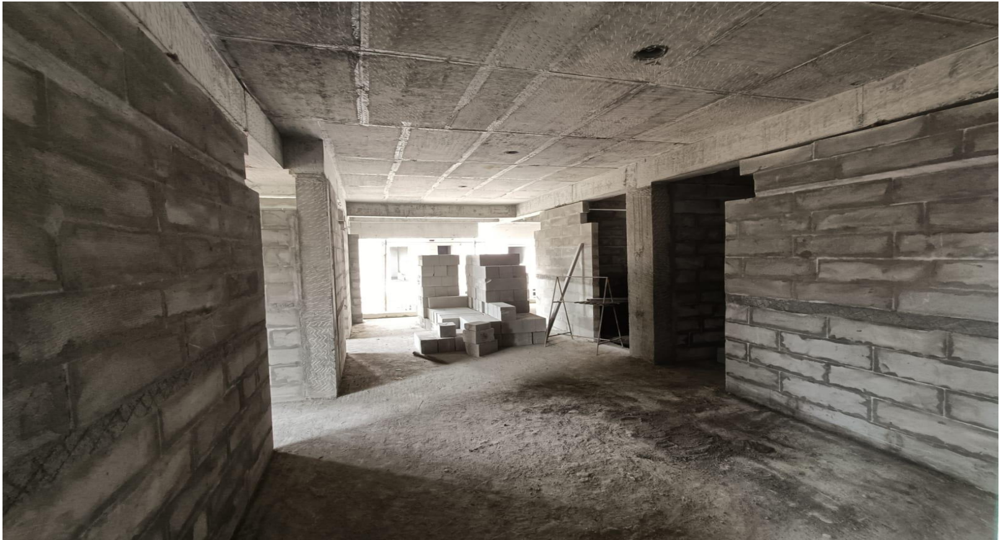
Wing 4A & 4B – 1 st Floor AAC Block Work in Progress