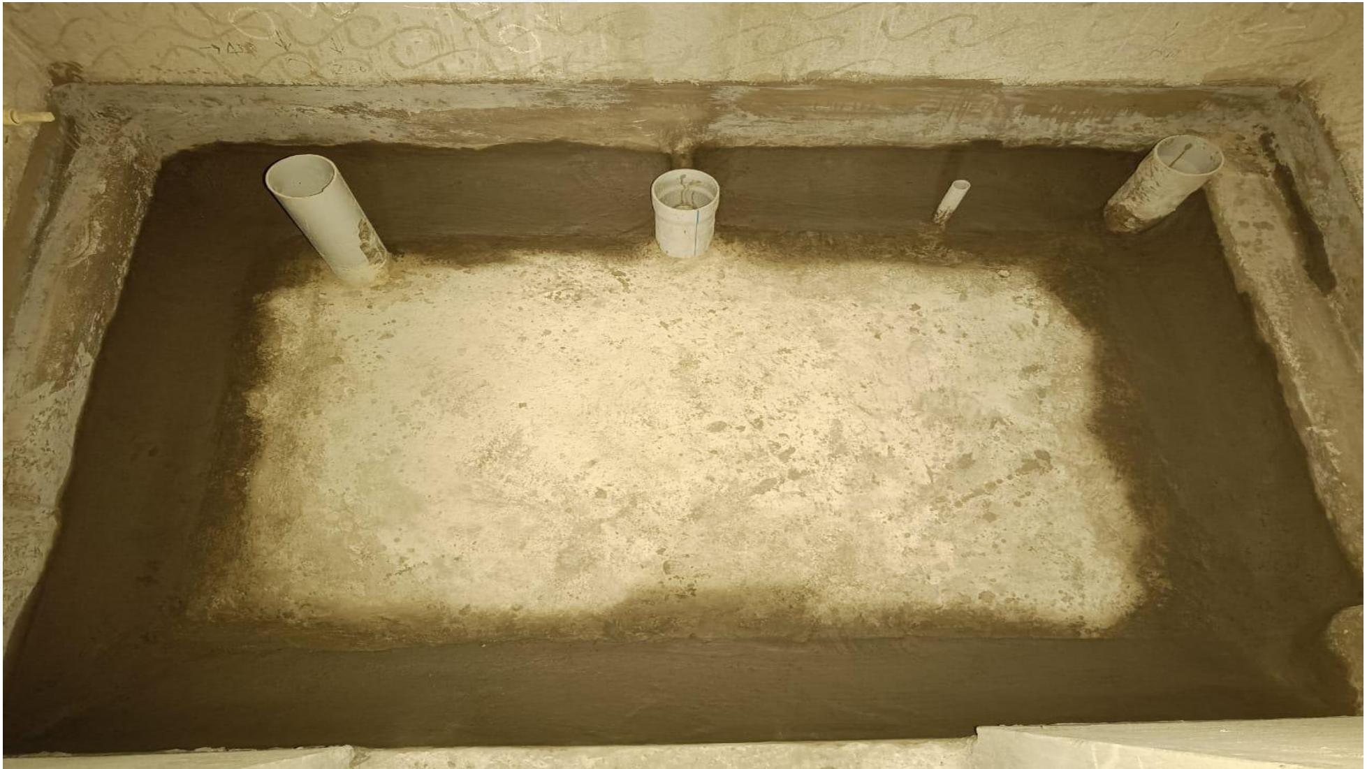
Wing 3D & 3E - 2 nd Floor Sunken Area Waterproofing Works in Progress