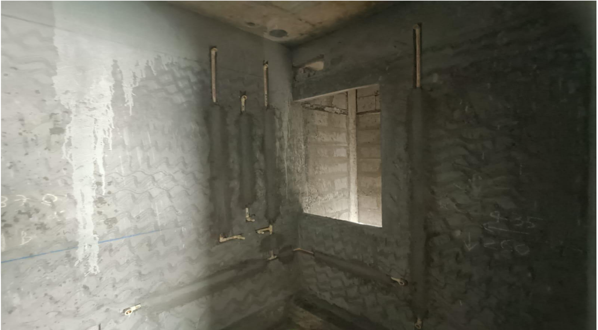
Wing 3C – 1 st Floor Toilet Plumbing Works in Progress