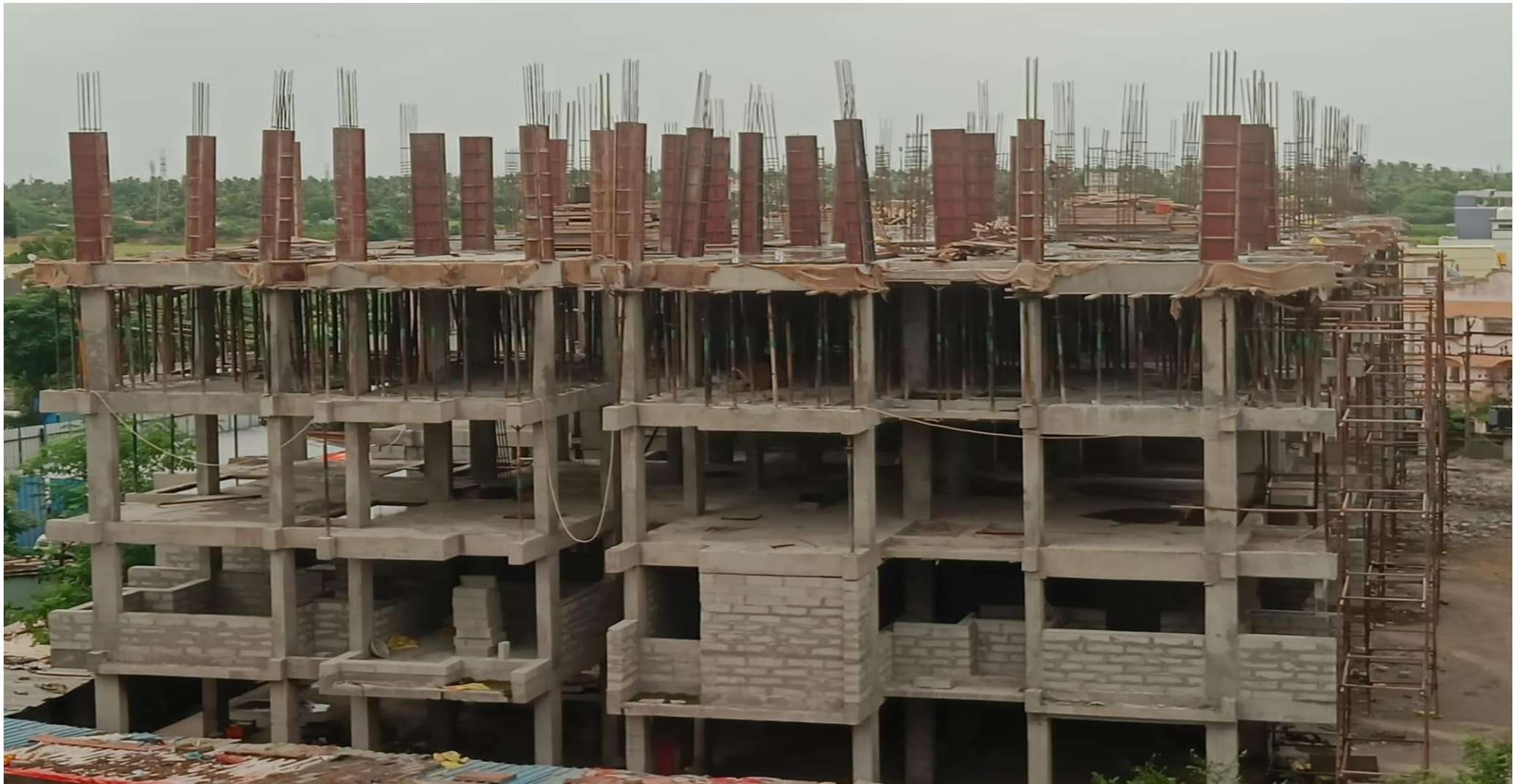
Wing 4A & 4B – 4 th Floor Column works in Progress