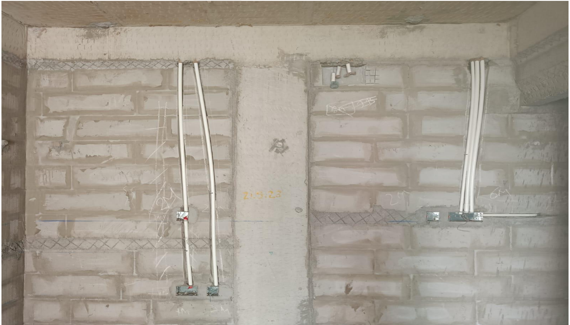
Wing 3A – 3 rd Floor Electrical Wall Chasing & Conduit Works in Progress