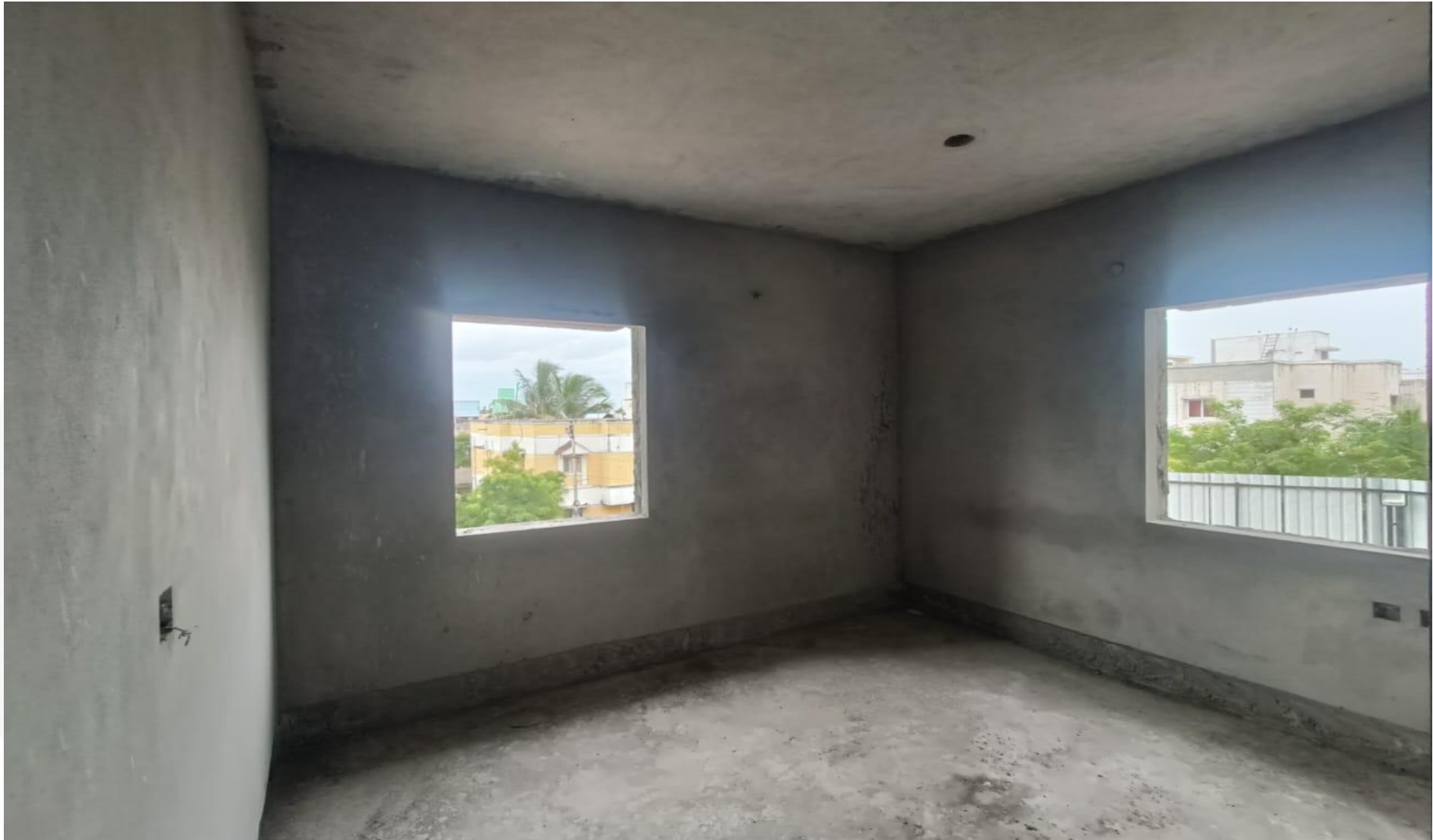
Wing 3A – 2 nd Floor Plastering Work Completed