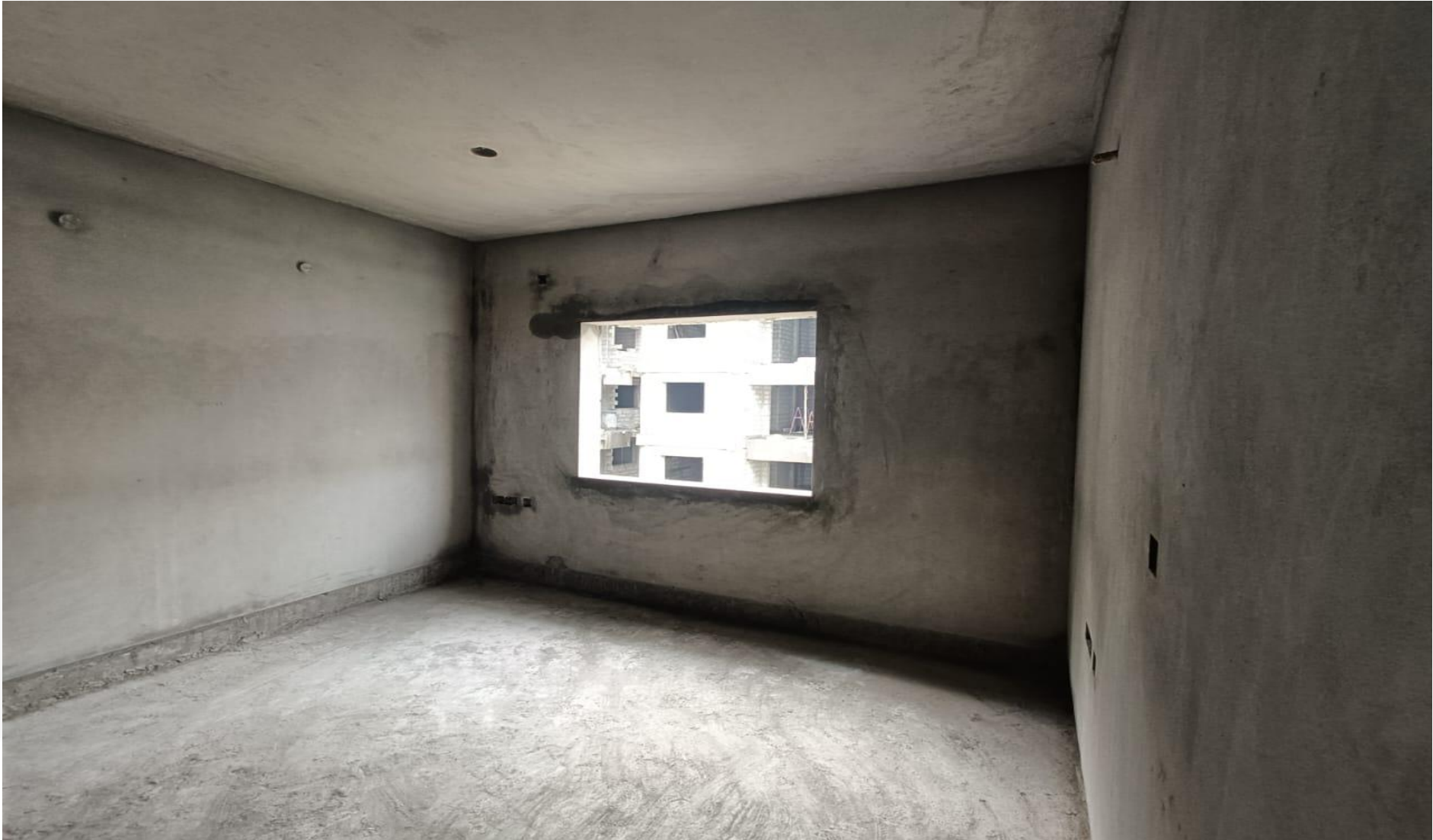
Wing 3C – 2 nd Floor Plastering Work Completed