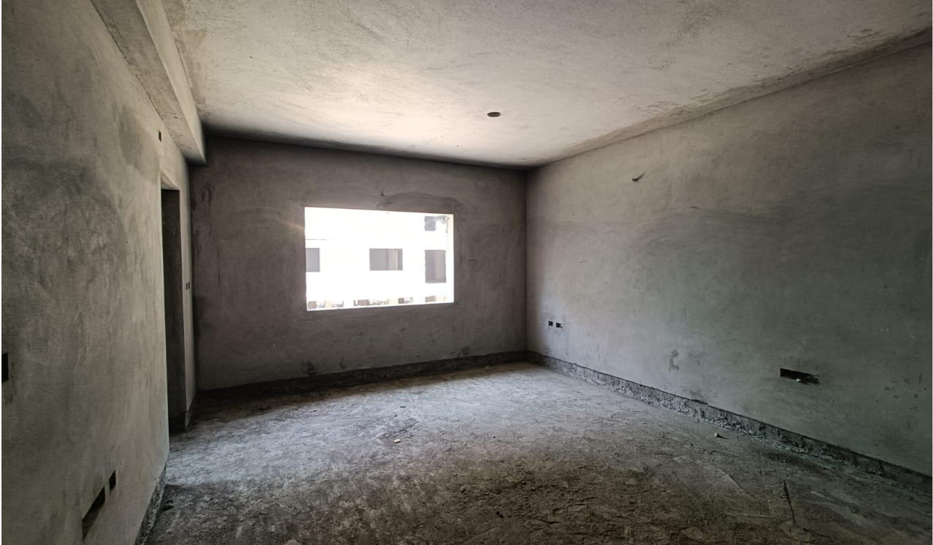
Wing 3B – 1 st Floor Plastering Work Completed