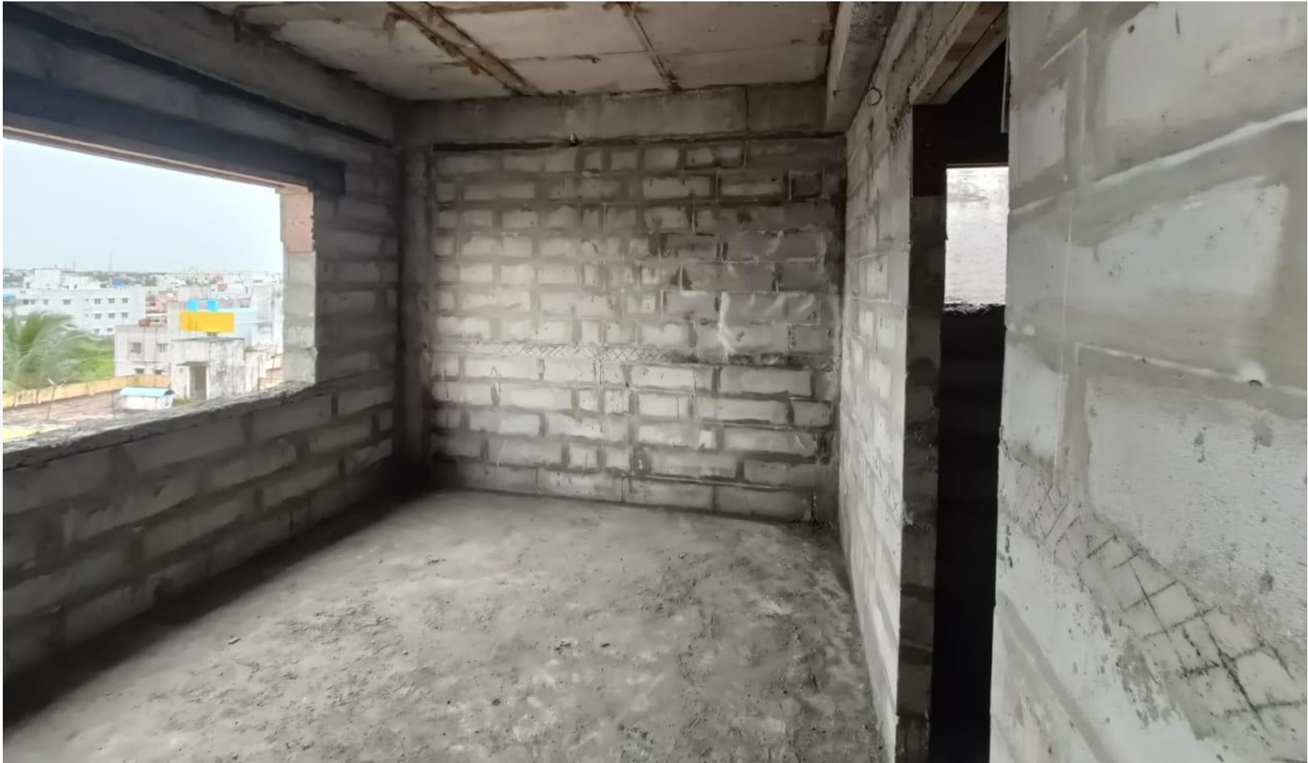
Wing 3A – 4 th Floor Block Work Completed