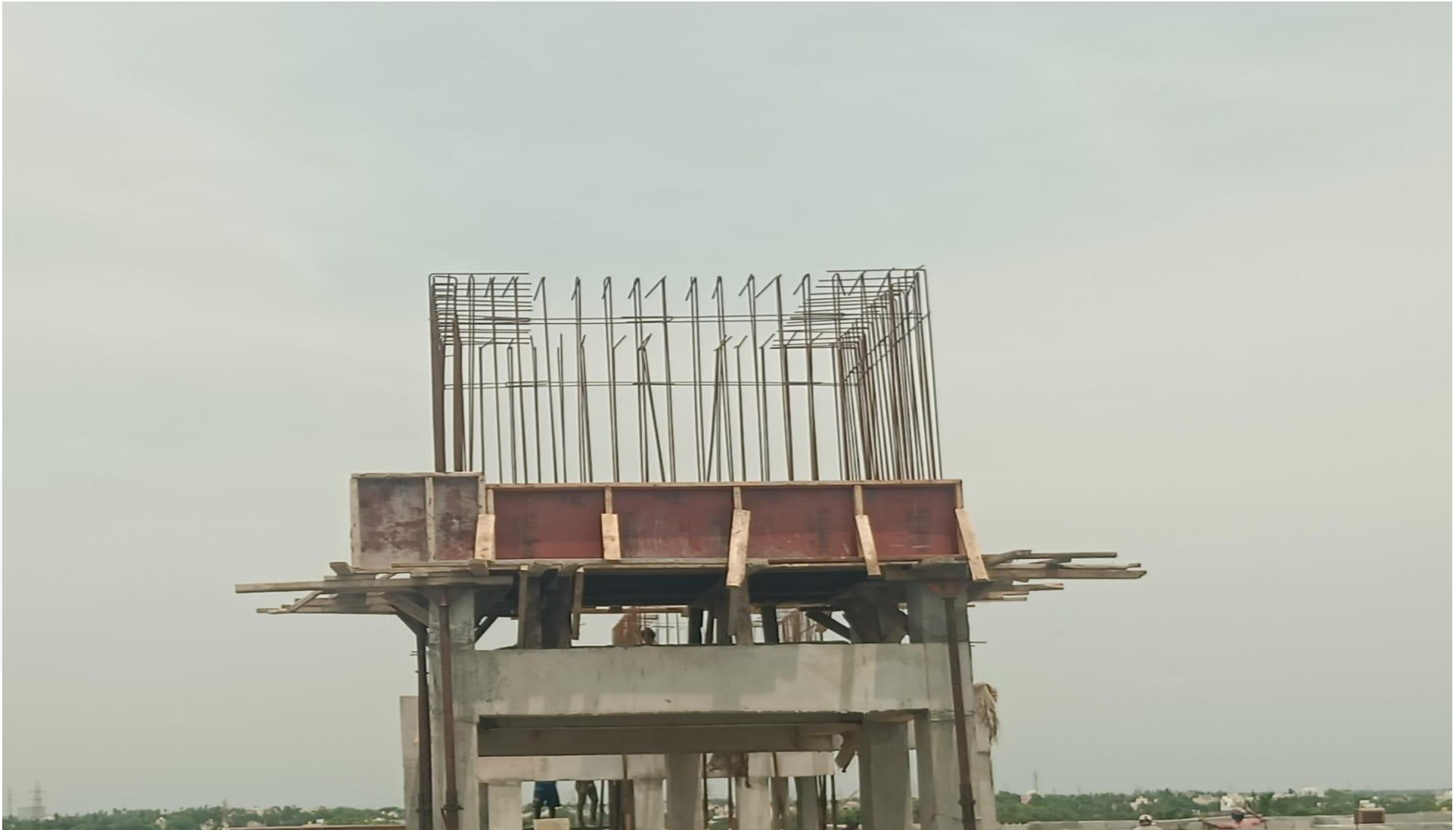
Wing 3A & 3B – OHT Base Slab casting has been completed