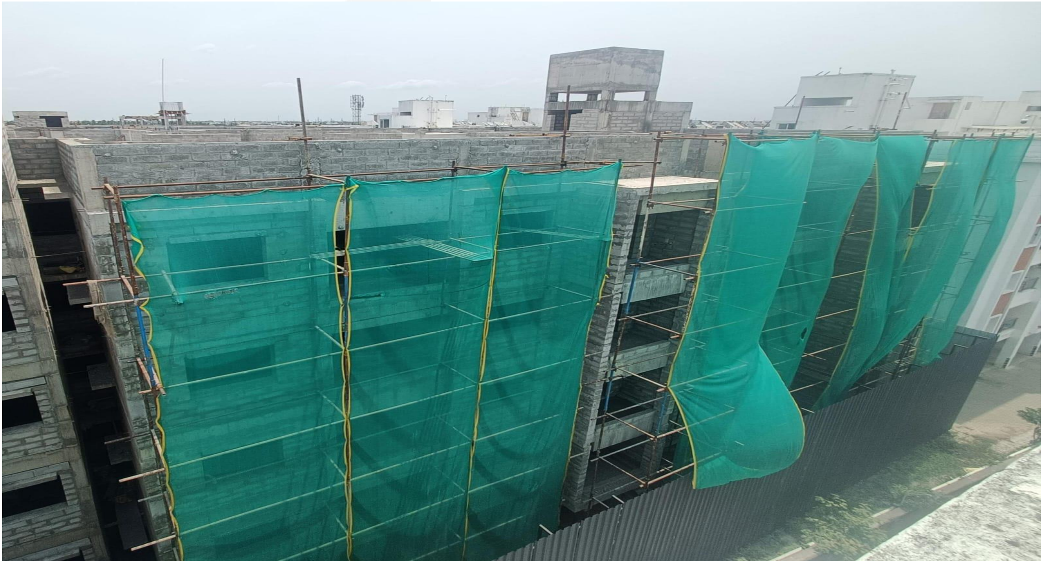
Wing 3D – South Elevation View