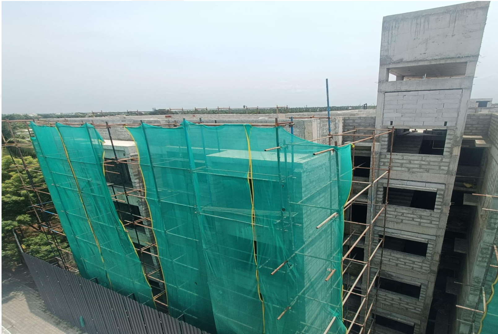
Wing 3E – South Elevation View