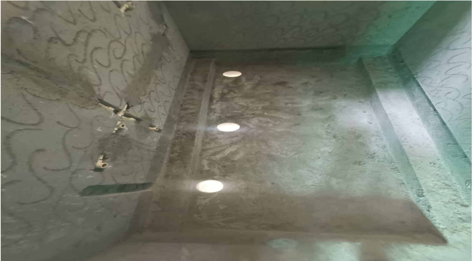
Wing 3C – 2 nd Floor Toilet Core Cutting Works in Progress