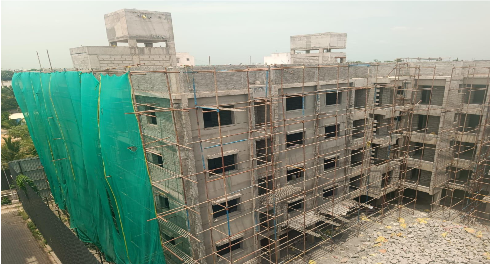
Wing 3D – North Side External Plastering Work in Progress