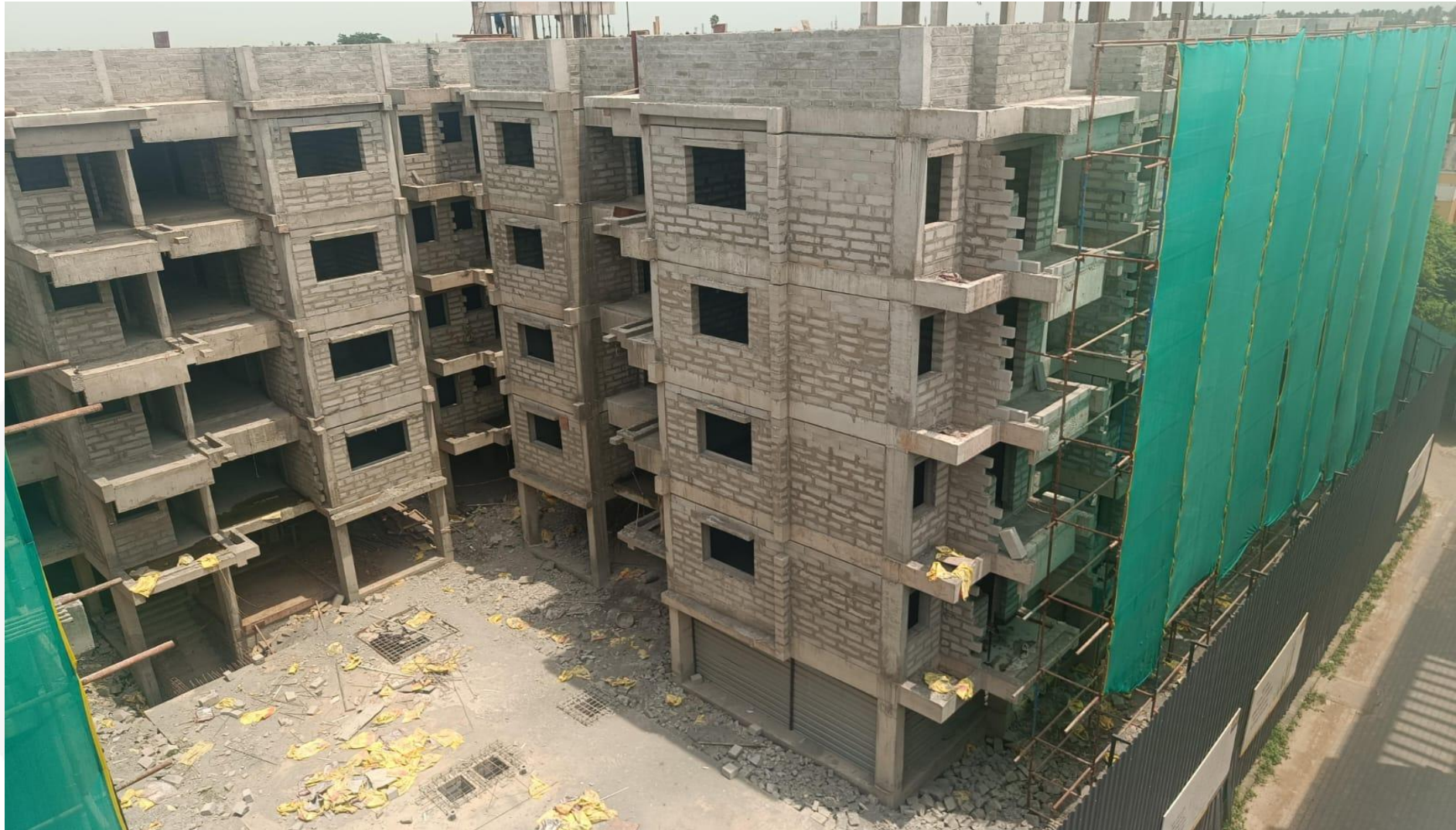
Wing 3A & 3B – South & East Elevation View