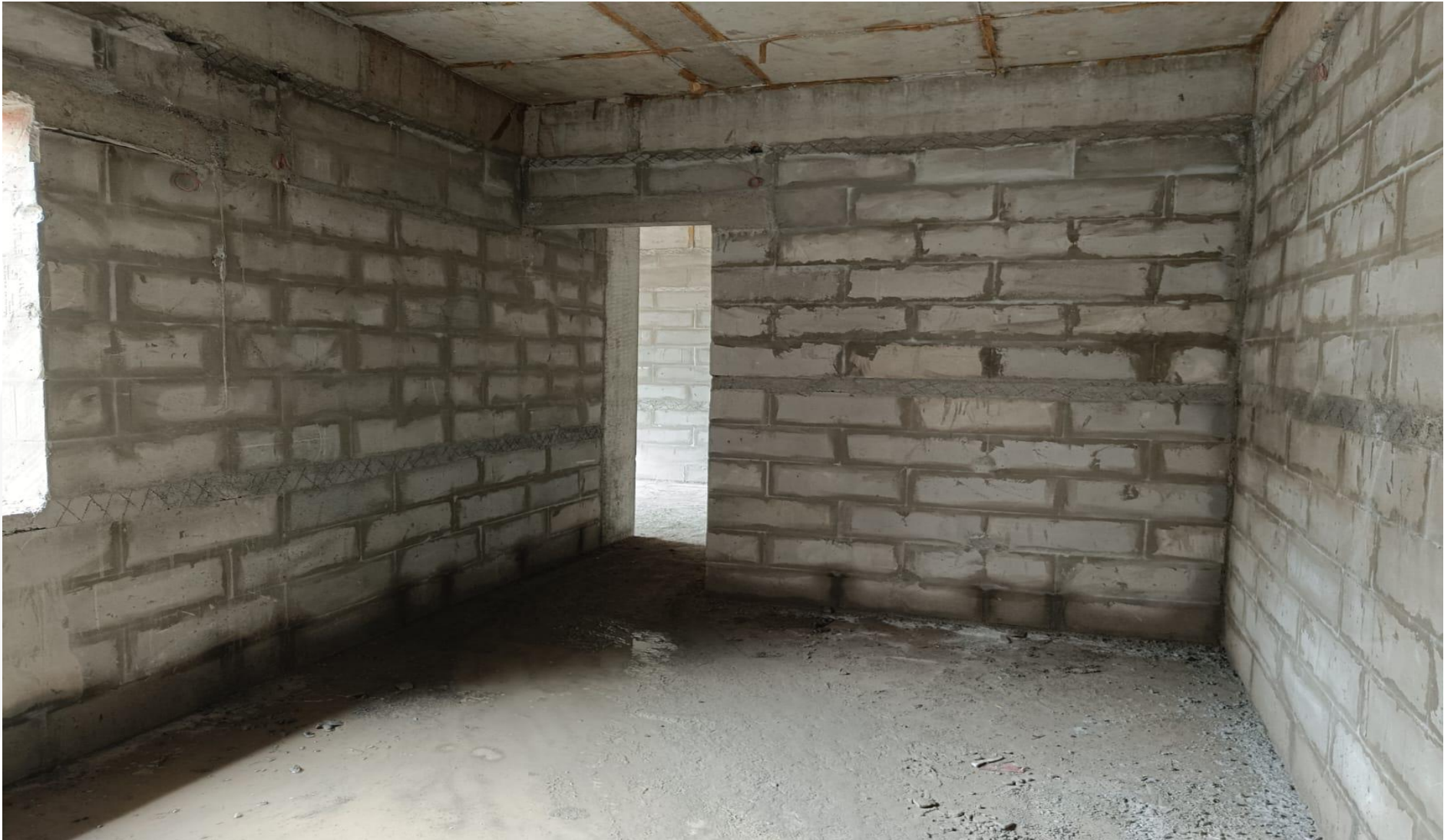
Wing 3B – 4 th Floor Block Work Completed