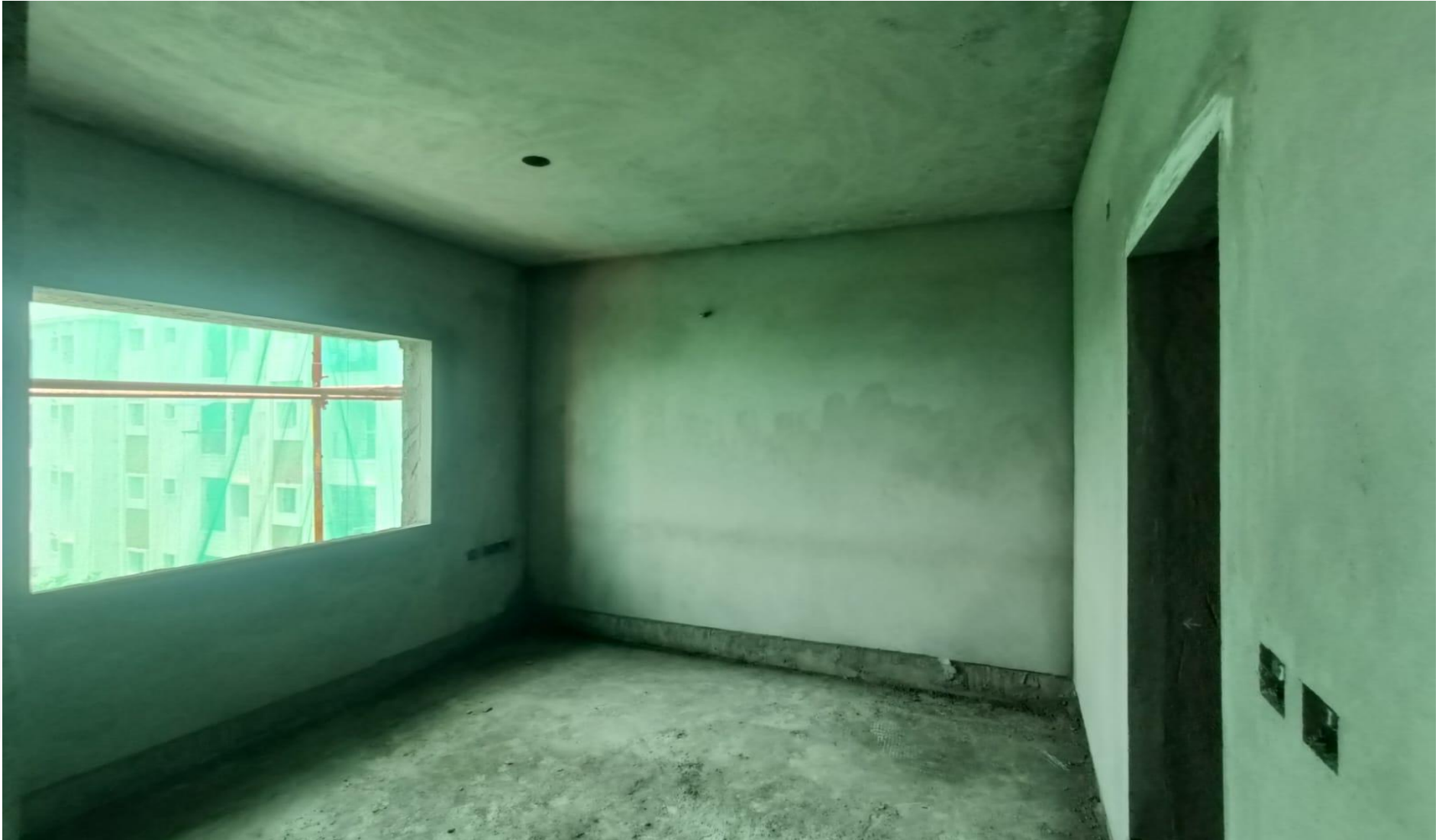
Wing 3D – 3 rd Floor Plastering work in Progress