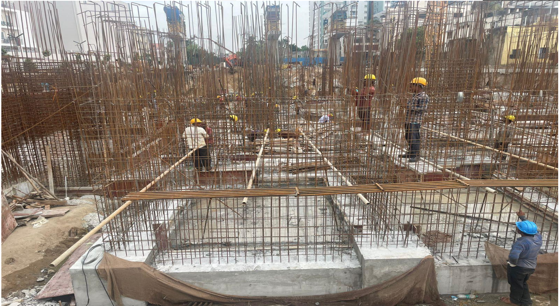
Basement P-01 UG Sump around area wall reinforcement work in progress.