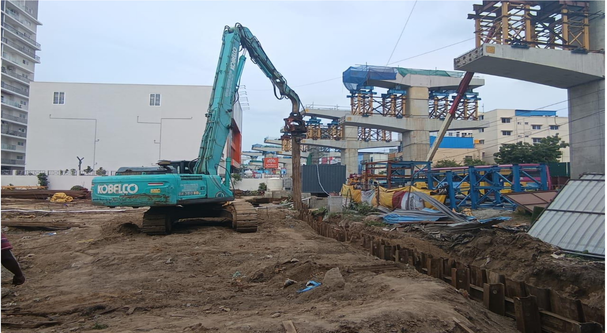
Sheet pile shoring work completed.