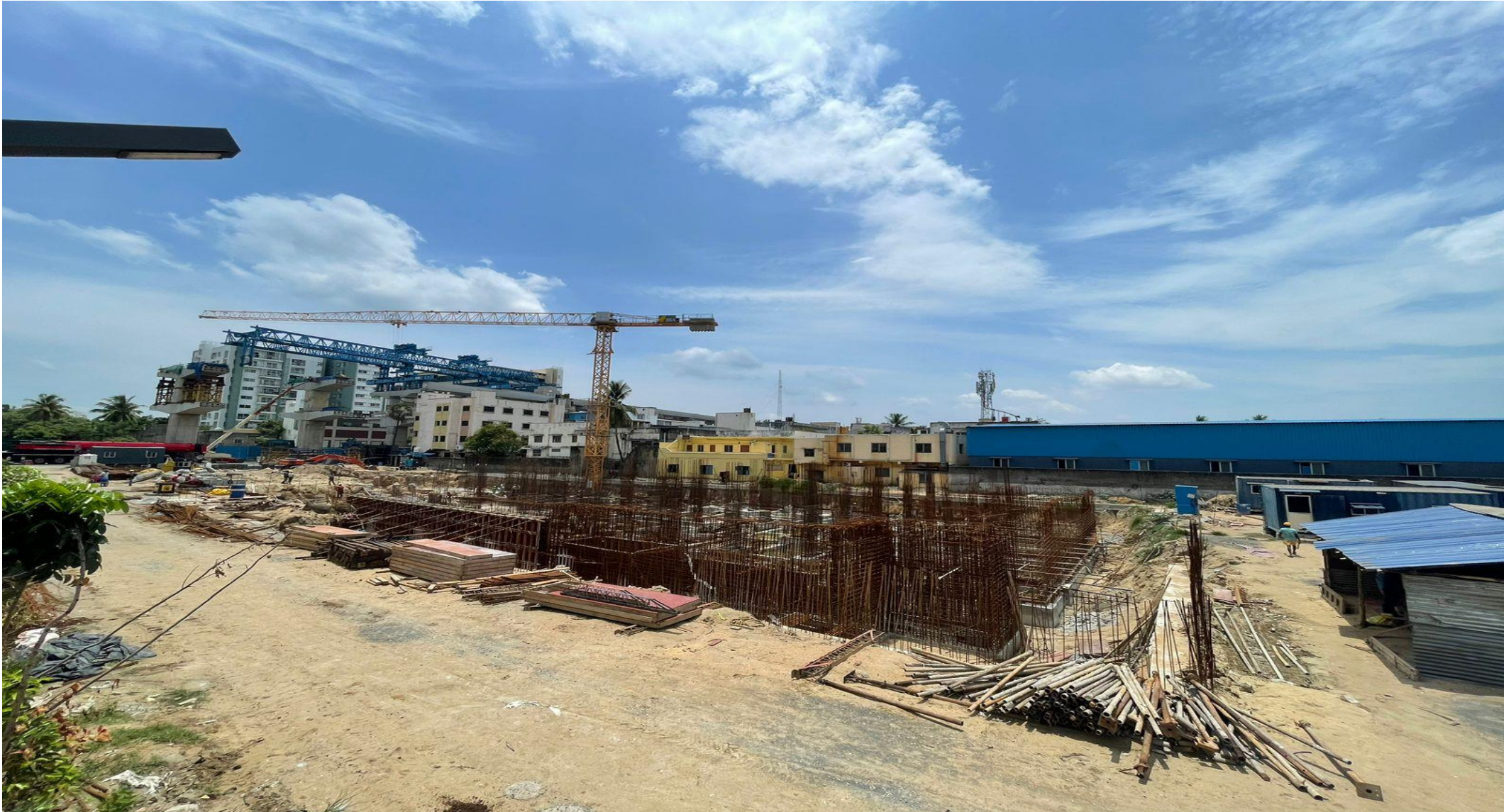
North East corner view.