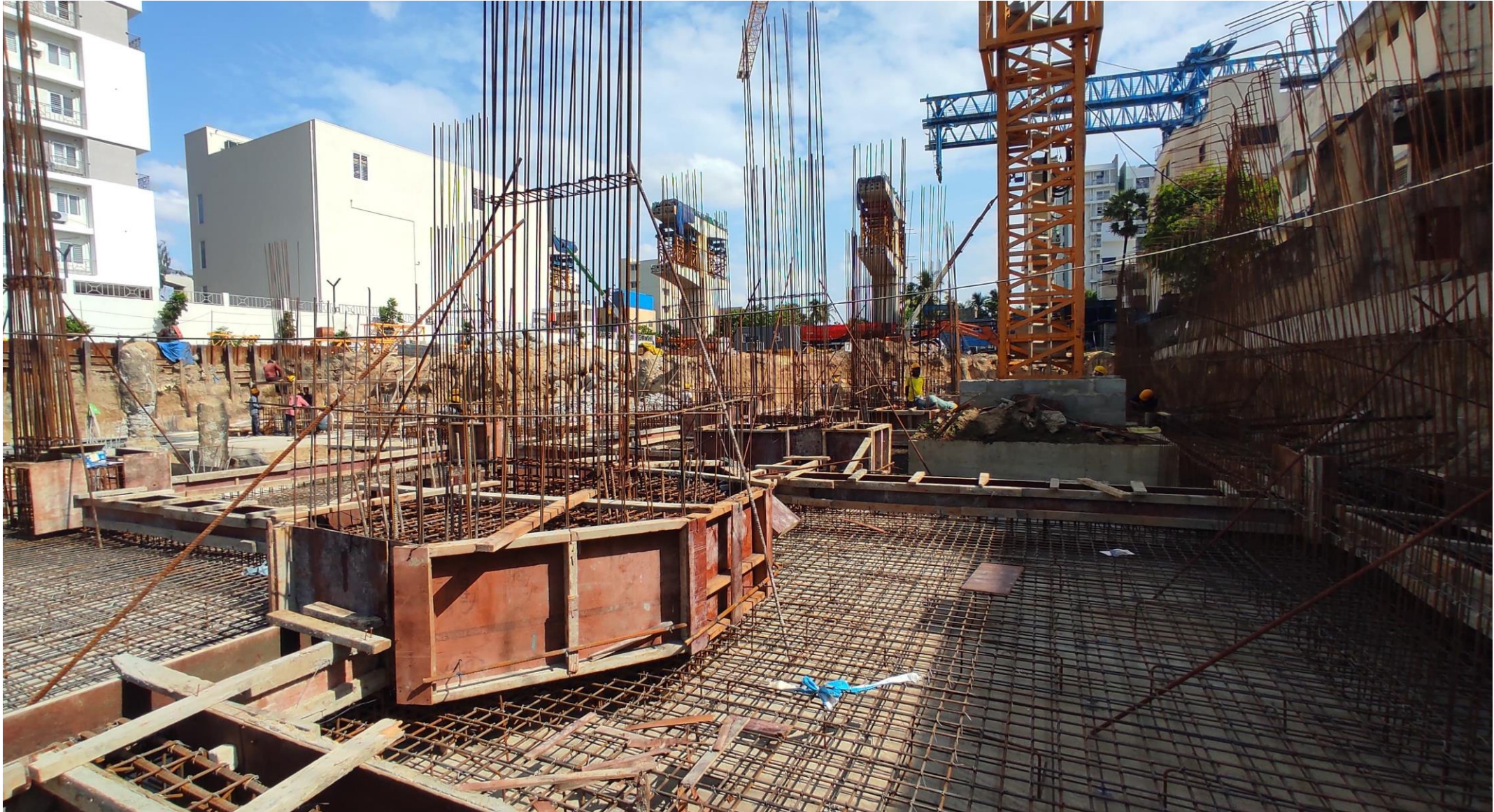
Pour-02 area shuttering work in progress.