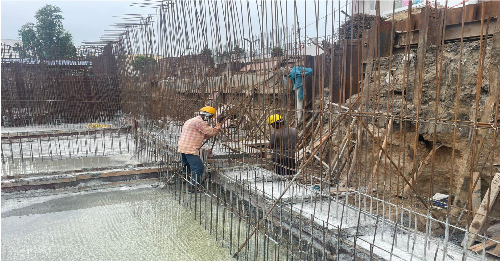
Basement P-01 Raft de-shuttering work completed.