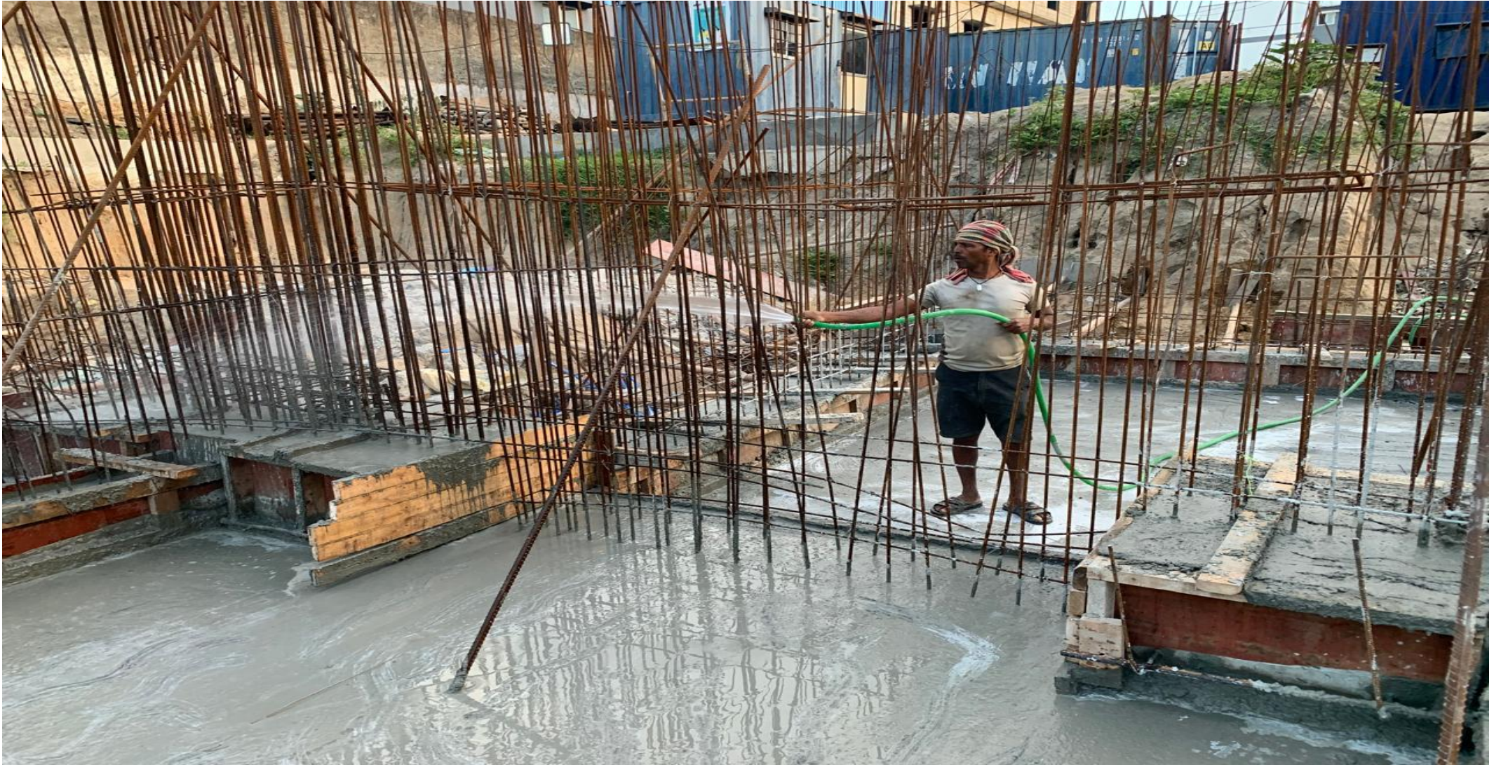
Basement P-01 UG Sump raft slab curing work in progress.