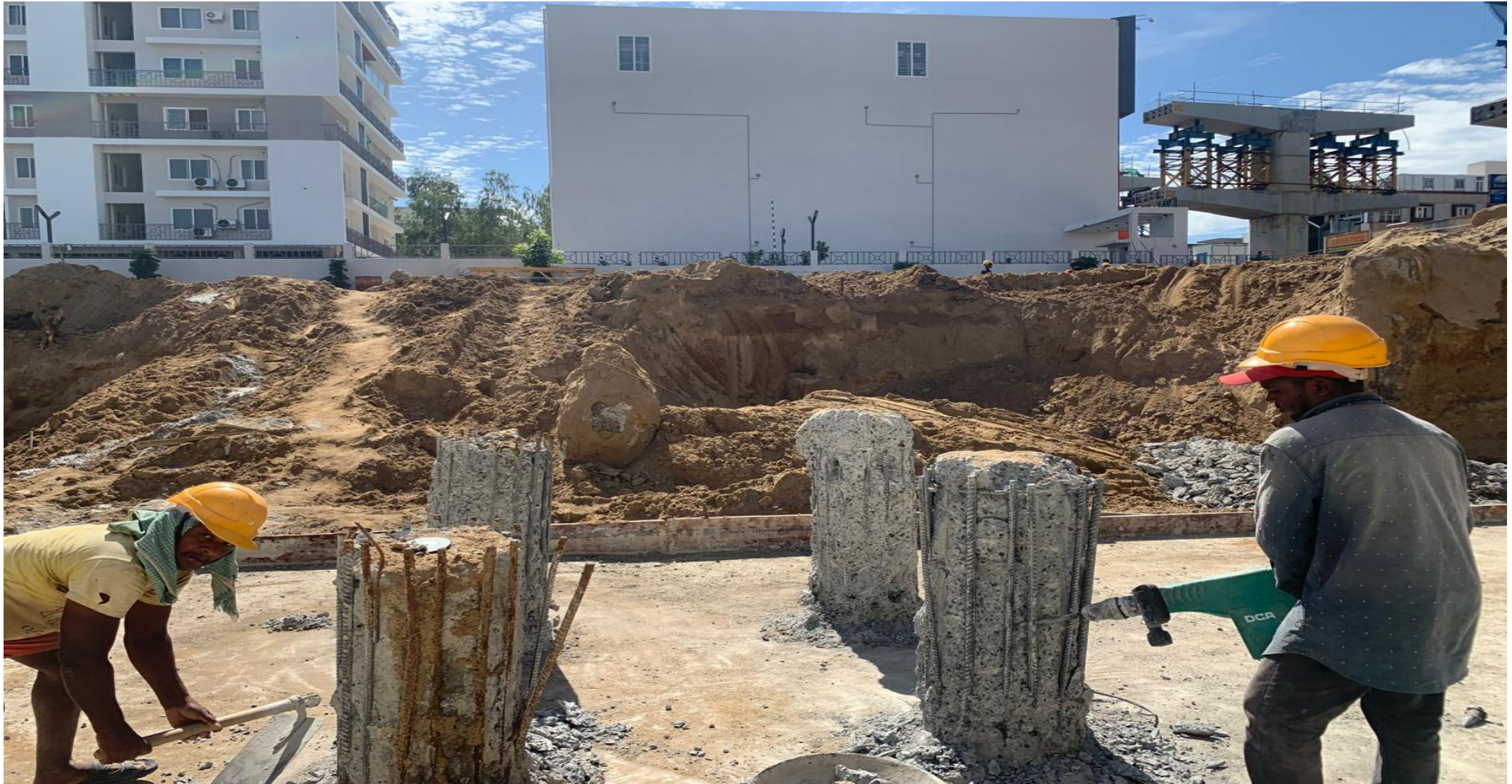
Pour -02 & 03 area PCC completed, pile chipping work in progress.