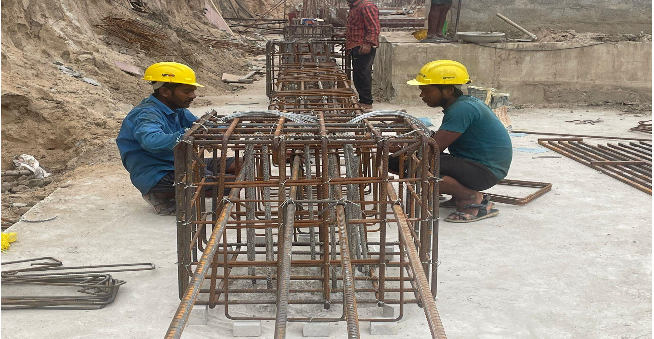
Basement P-02 Pile cap & beam reinforcement work in progress.