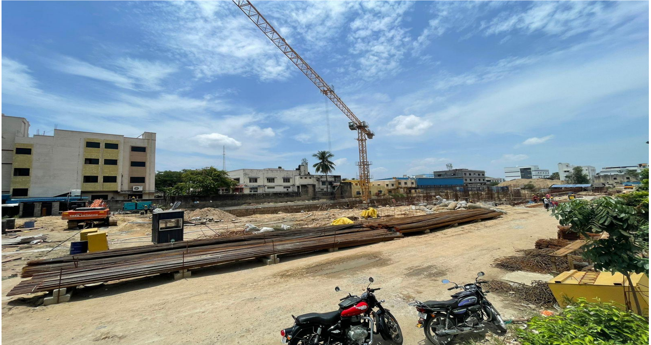
South East corner view.