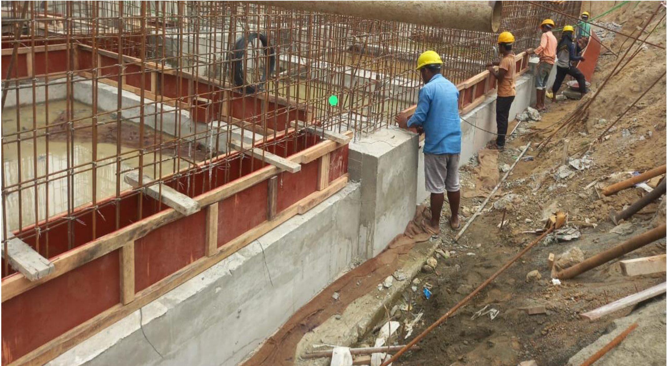
East side retaining wall starter shuttering work completed.