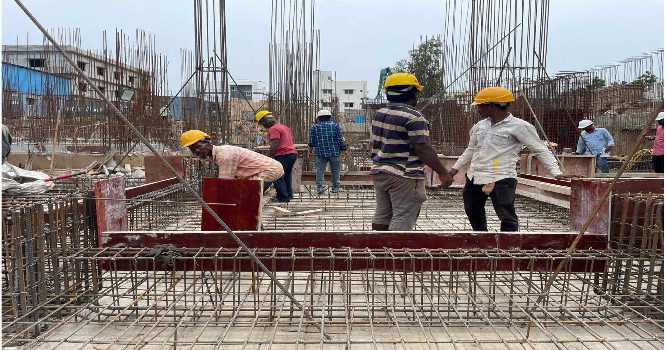
Basement P-01 Raft Pile cap & beam shuttering work in progress.