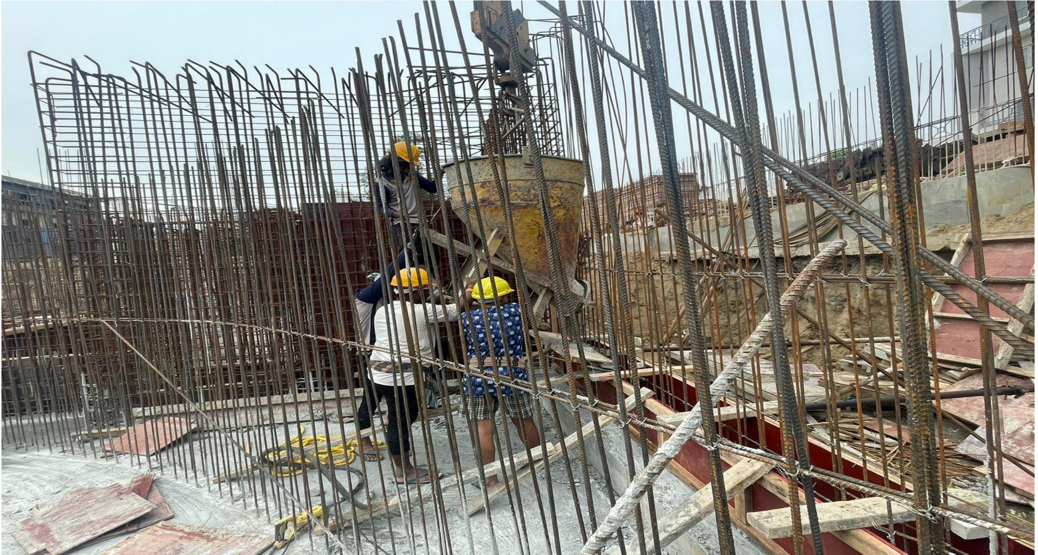
East side retaining wall starter Concrete work completed.