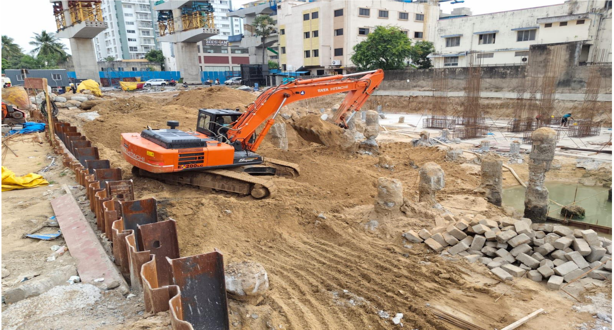
Pour - 02 area excavation works.