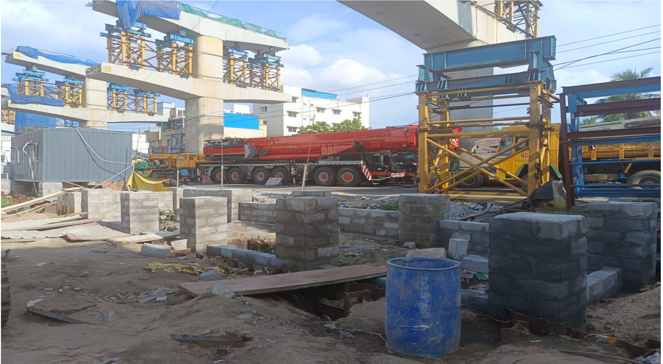
Sales office, foundation work completed.