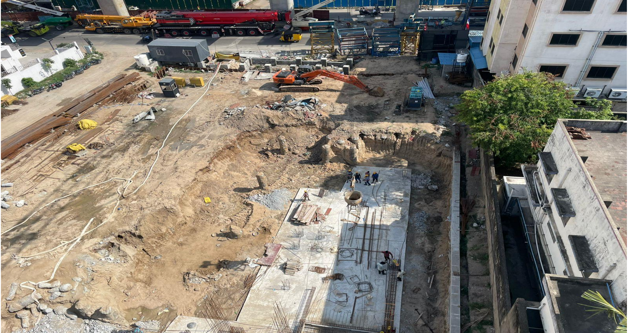
South Side View.