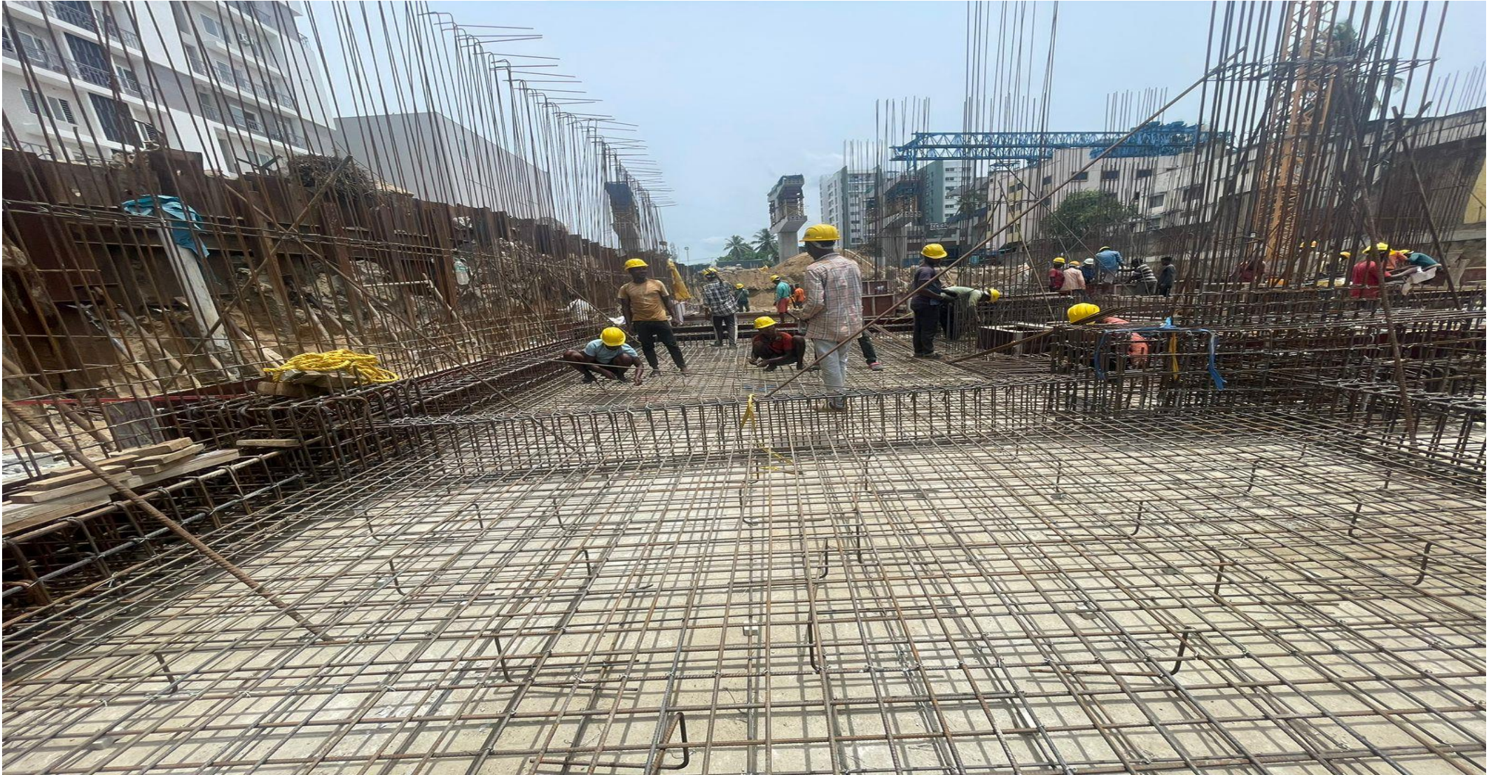
Basement Pour 1 raft slab reinforcement work in progress.