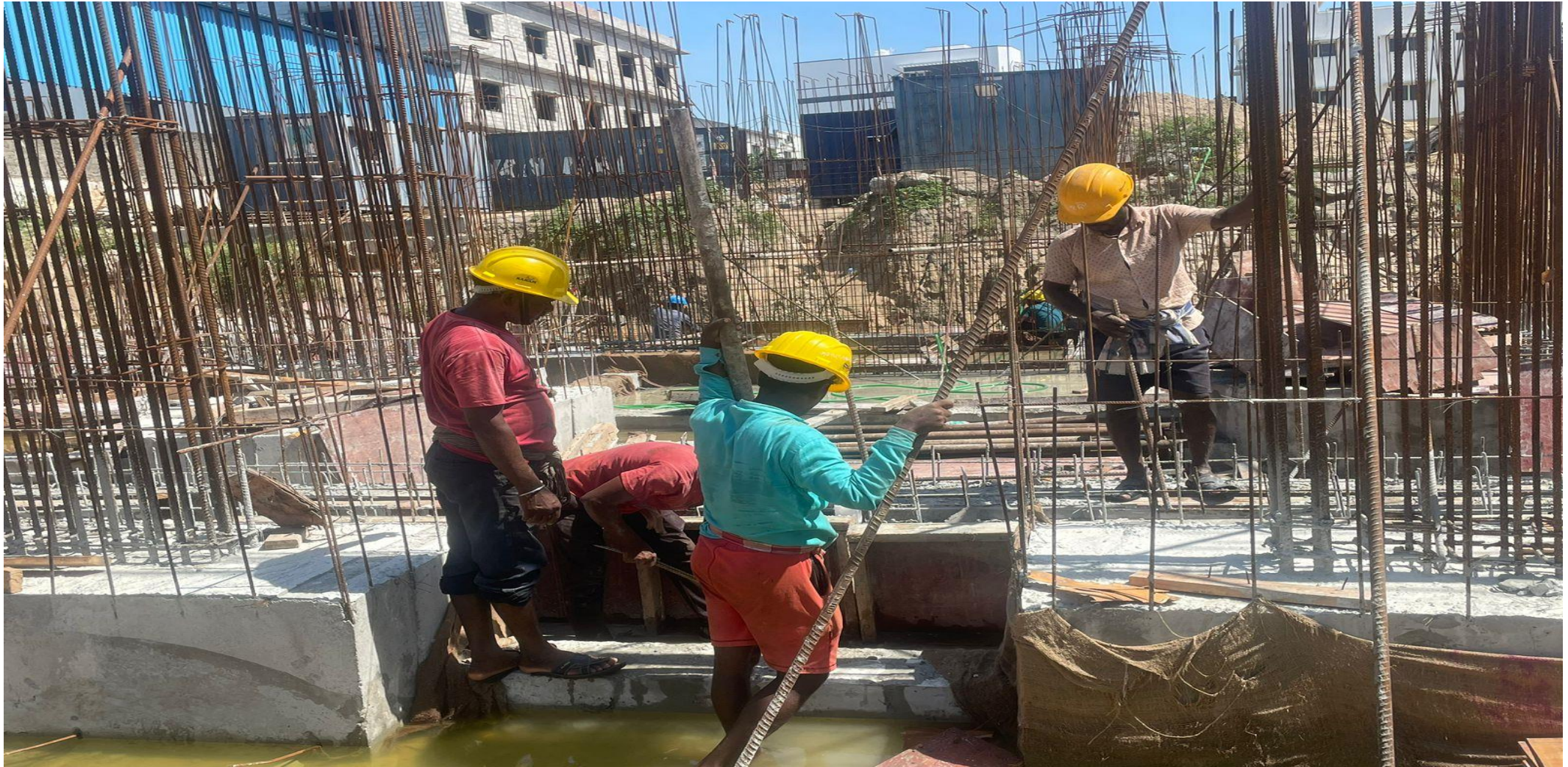
Basement P-01 UG Sump raft slab de-shuttering work completed.