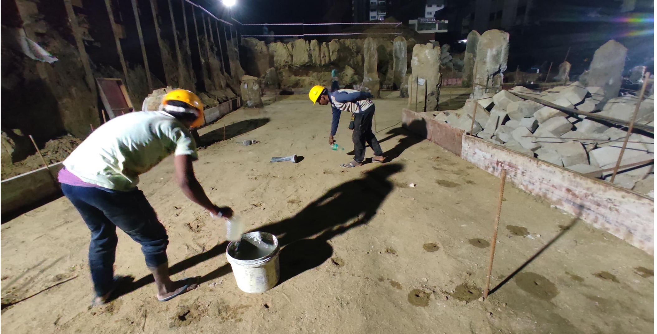
Pour 02 area Anti Termite works completed.