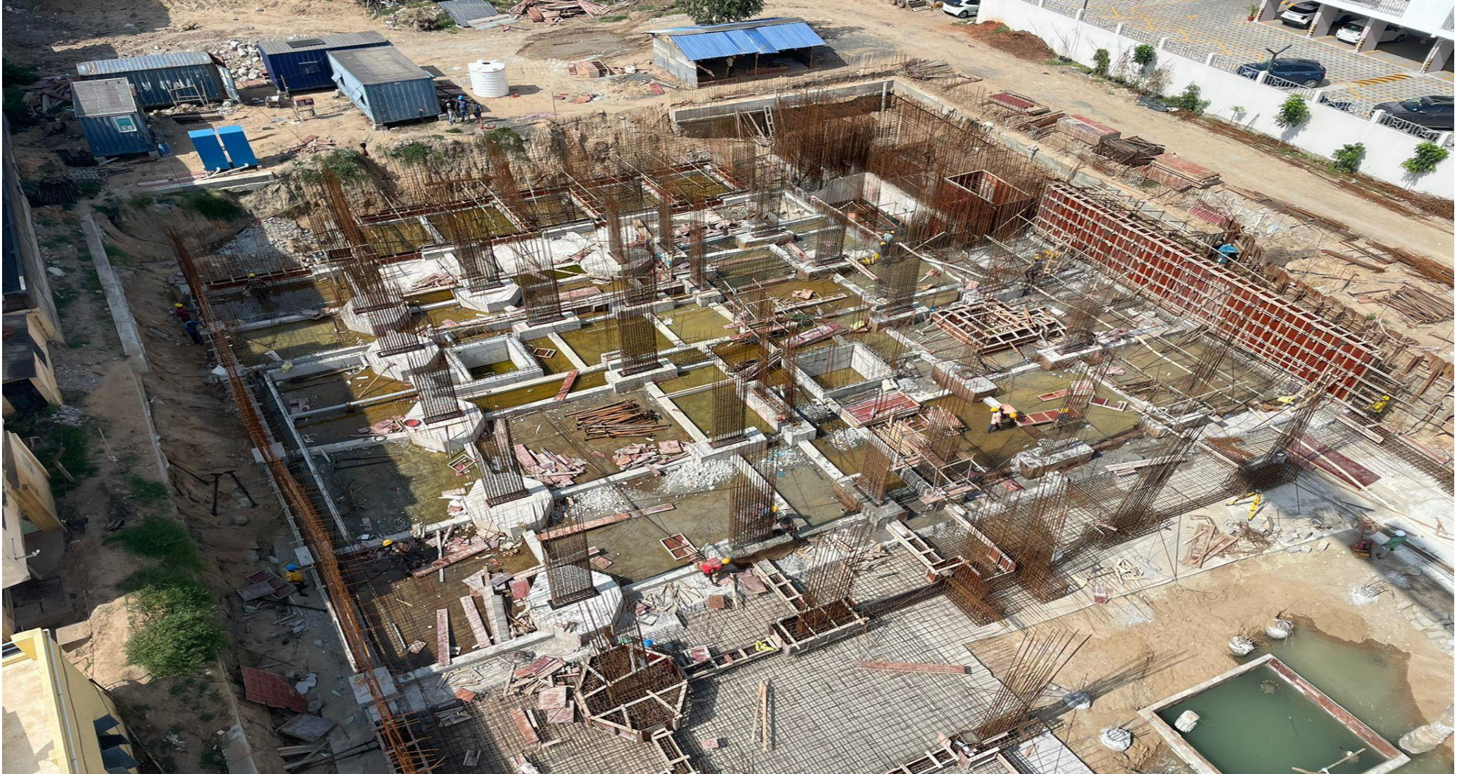
North Side View