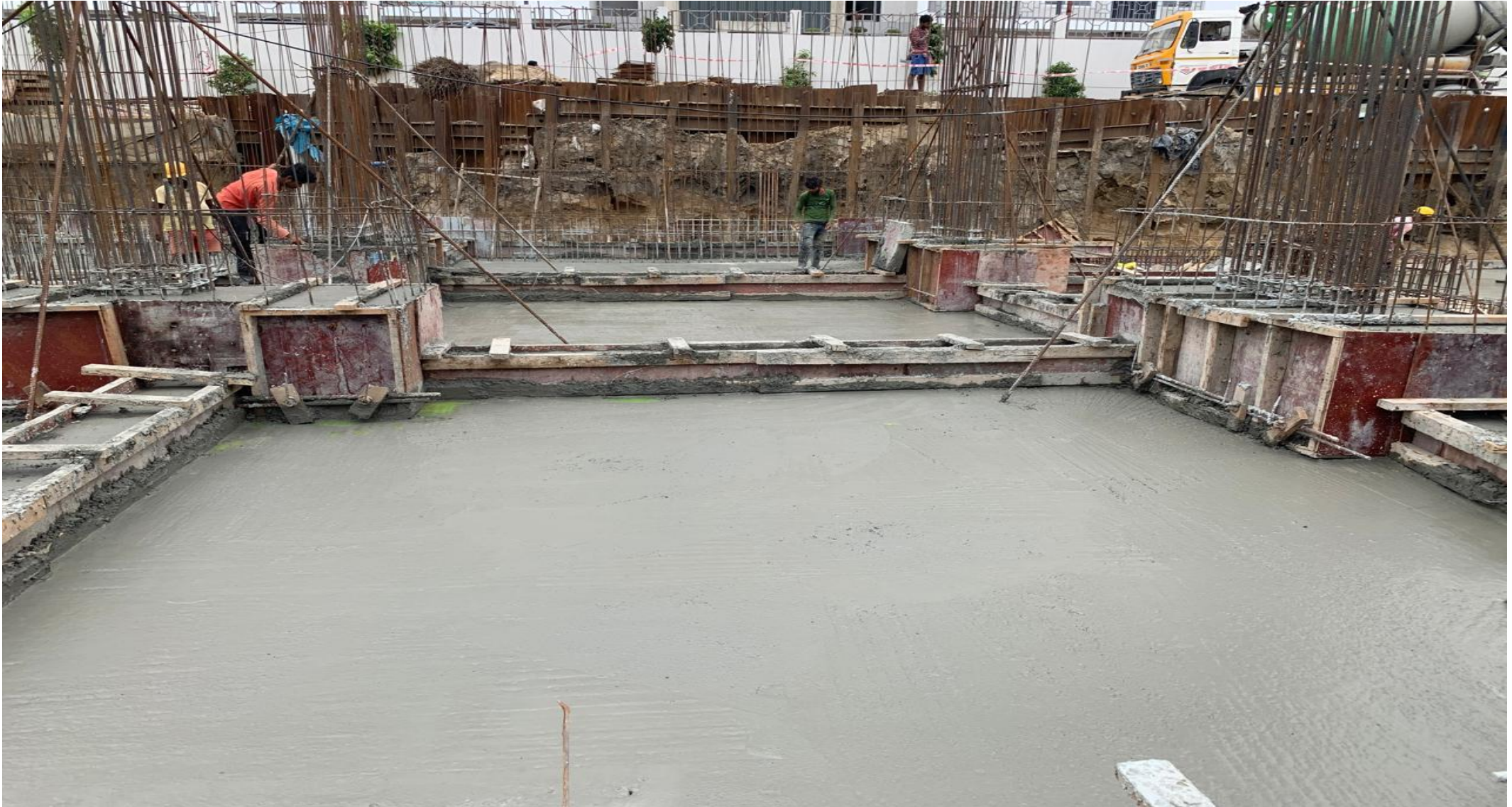
Basement P-01 Raft Concrete work completed.