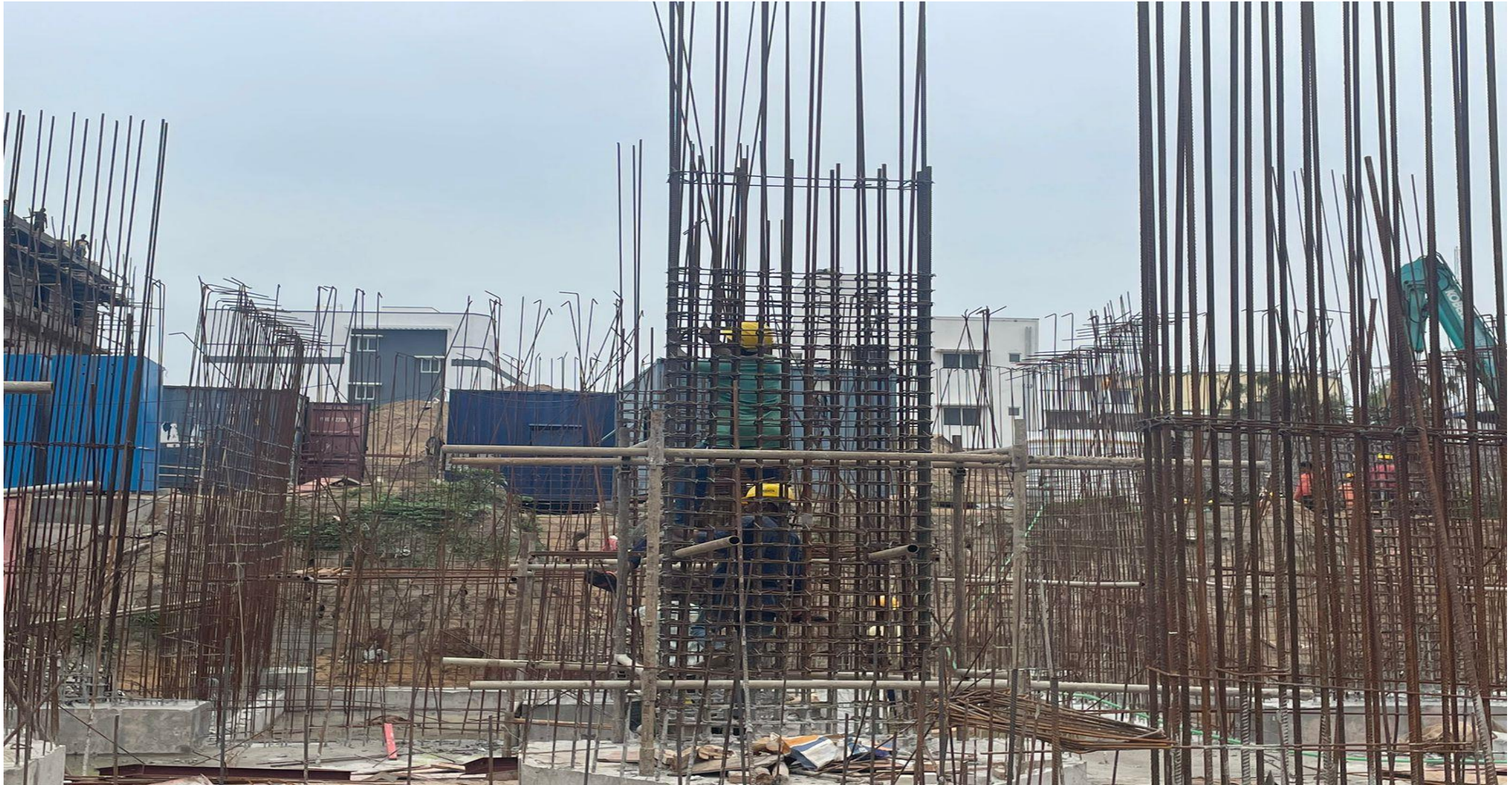
Pour-01 area column reinforcement work in progress.