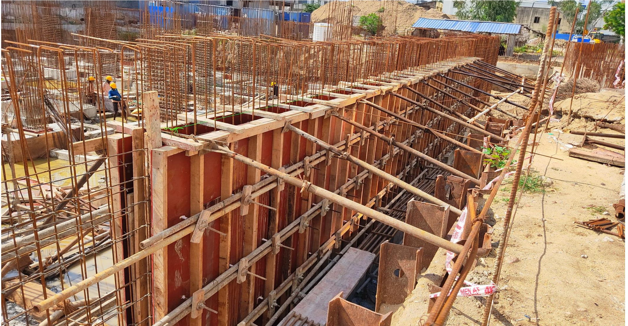
East side retaining wall shuttering work in progress.