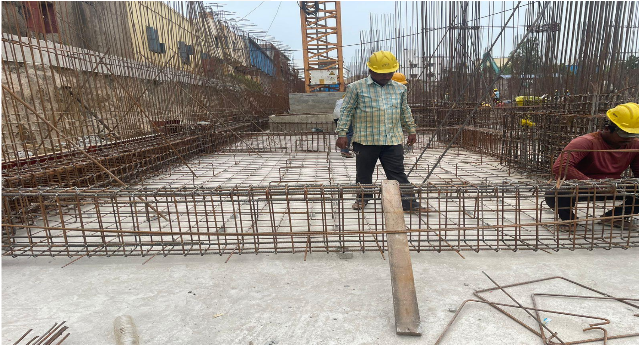
Pour-02 Raft, pile cap & beam reinforcement work in progress.